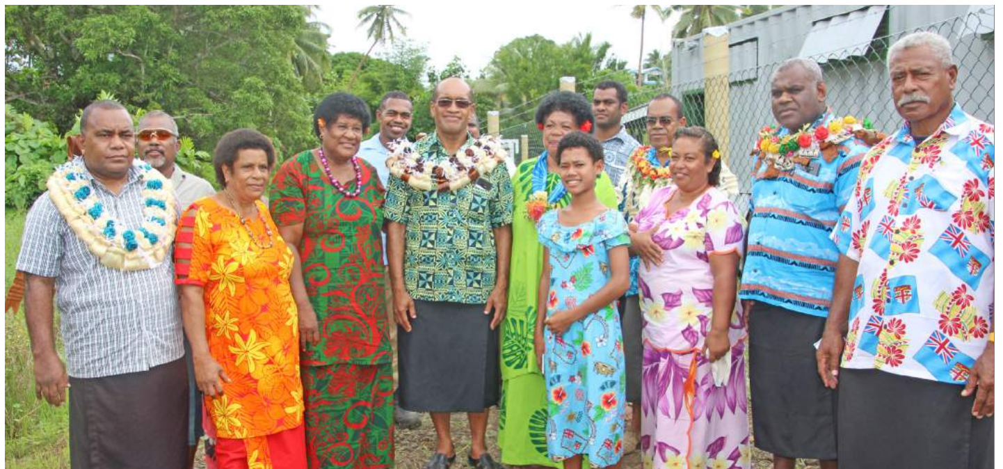
Minister for Infrastructure, Transport, Disaster Management and Meteorological Services Jone Usamate with Government officials and villagers at the commissioning of their Solar Hybrid System at Tukavesi Village last week.

Kushyila Devi Director of Fiji National Council for Disabled Persons, (FNCDP).