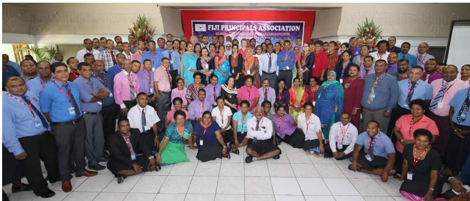
Minister for Education Rosy Akbar with more than 140 principals from various schools around the country during the 123rd Fiji Principals Association Conference.

With discussions and ideas expected to develop through the summit Minister Kumar is adamant to develop forward-looking policies to expand our development frontier and support the vision of Transforming Fiji.