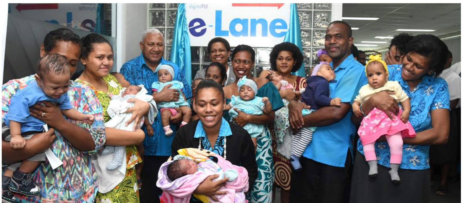
Prime Minister Voreqe Bainimarama with new-born babies and their parents at Suvavou House last week.