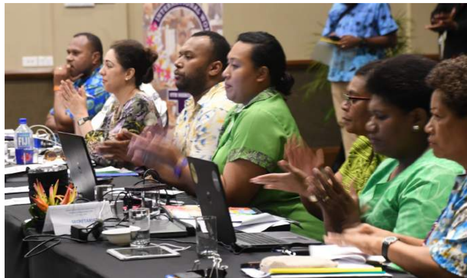
Participants at the Beijing Platform for Action +25 Review Forum at Grand Pacific Hotel.