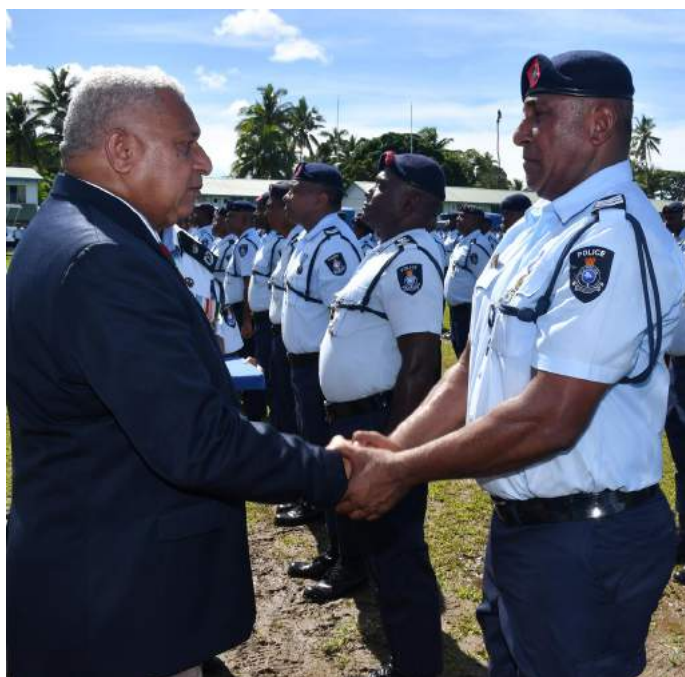
Prime Minister Voreqe Bainimarama at the medal presentation to Police Officers at Nasova, Suva.