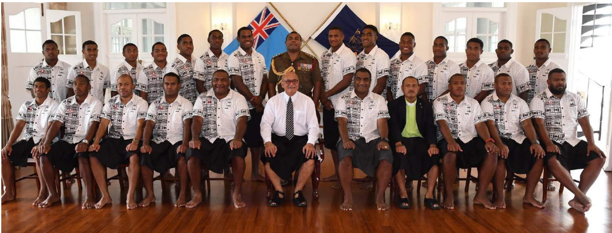
President Major General (Ret'd) Jioji Konrote with players and officials of the Fiji Under-20 Men's rugby team after presenting their itatau at the State House in Suva.