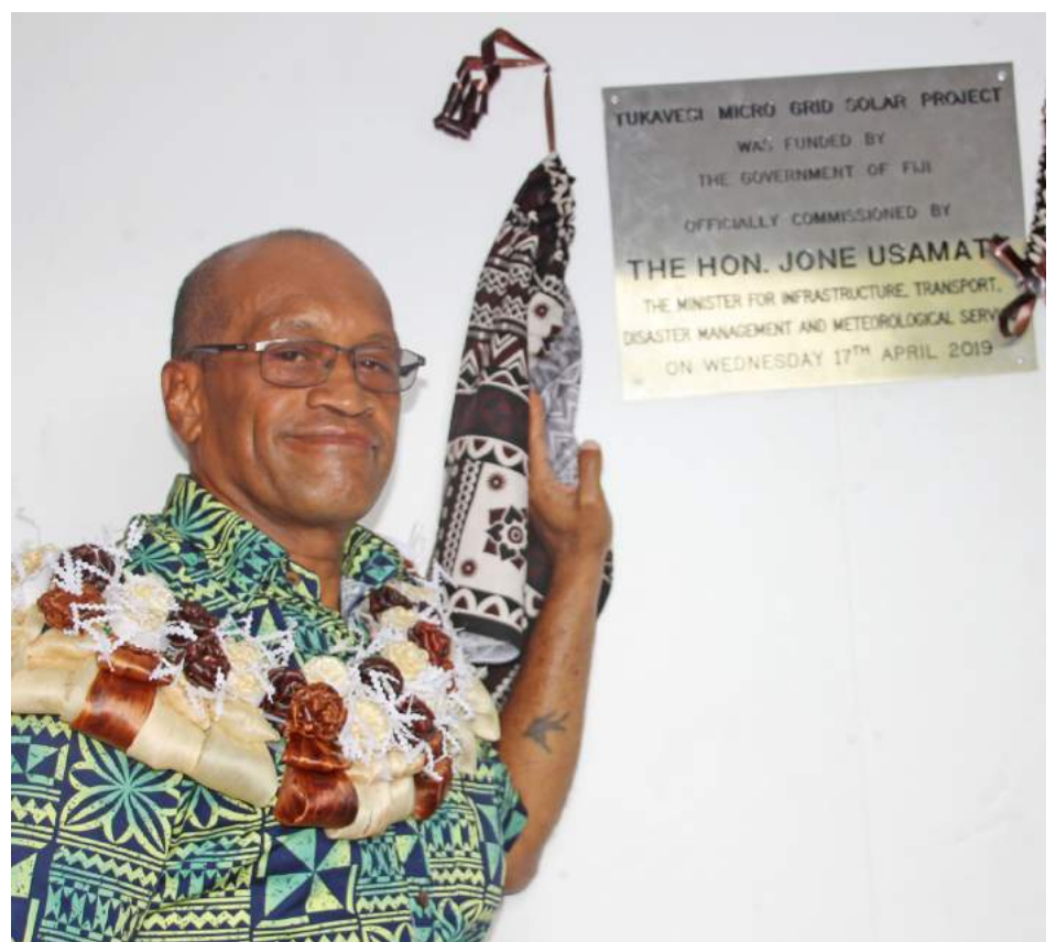
Minister for Infrastructure, Transport, Disaster Management and Meteorological Services Jone Usamate unveils the plaque at the commissioning of their Solar Hybrid System at Tukavesi Village last week.