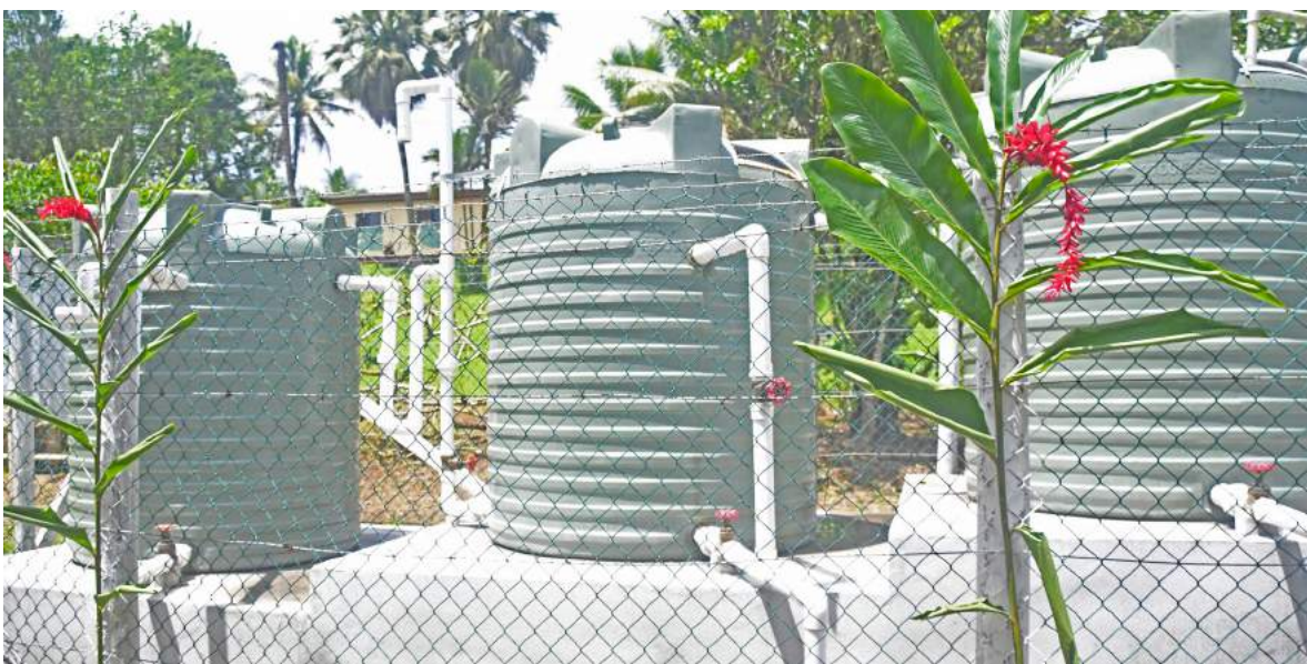
Sustainable Development Goal 6 (SDG 6), as part of the 17 SDGs established by the United Nations in 2015, calls for clean water and sanitation for all people.

This is after the Government had initiated the project requesting for technical support to the