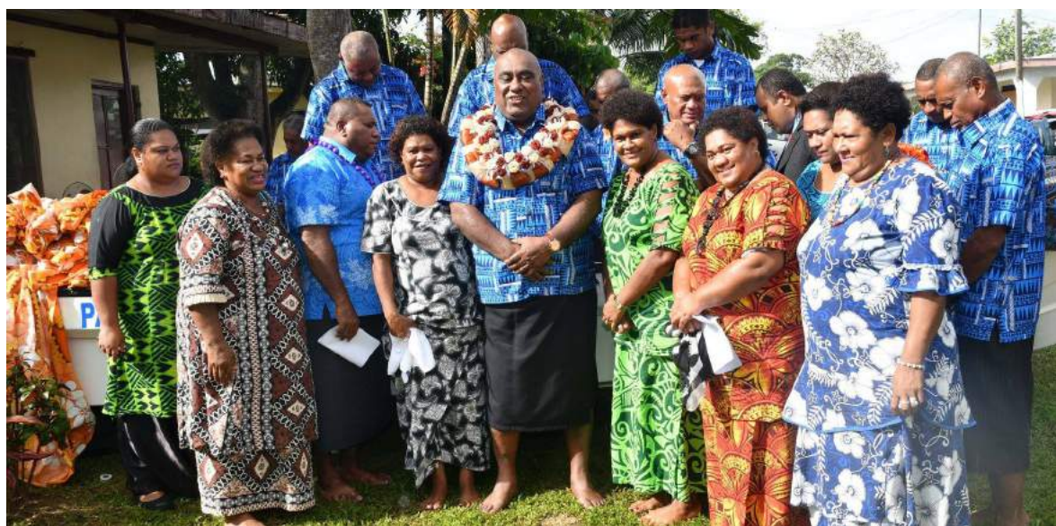
Minister for Fisheries Semi Koroilavesau and members of the vanua ko Nakovacake with their new boat at Navoci Village, Nadi.

underwent training and are now licensed and certified fish wardens.