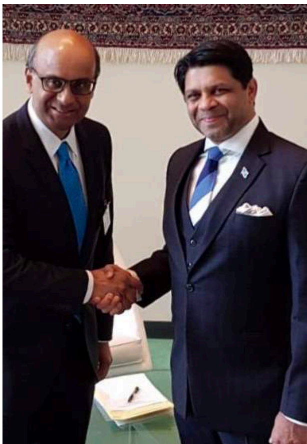
Attorney-General and Minister for Economy Aiyaz Sayed-Khaiyum with Singapore's Deputy Prime Minister and Co-ordinating Minister for Economic and Social Policies, Tharman Shanmugaratnam.