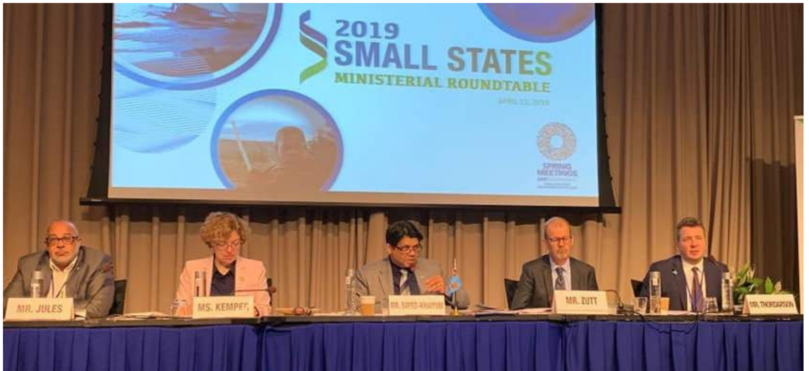
Attorney-General and Minister for Economy Aiyaz Sayed-Khaiyum (middle), chairs the Small States Ministerial Roundtable in the margins of World Bank Group (WB) and International Monetary Fund (IMF) Spring Meetings at Washington DC, United States of America.