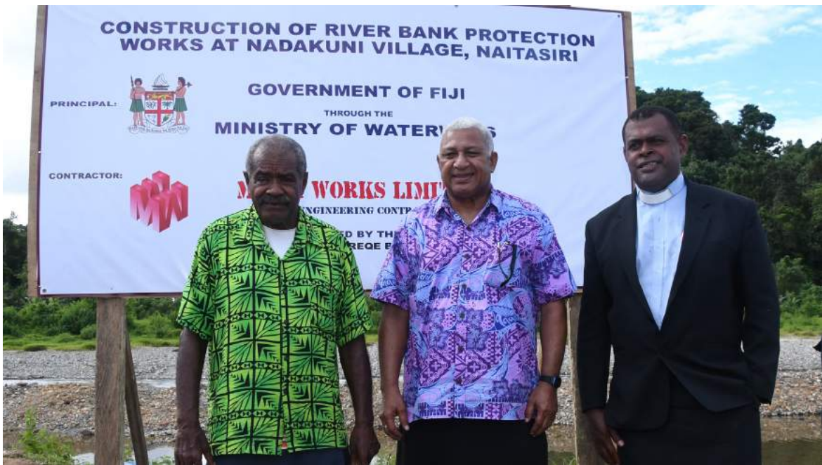
Prime Minister Voreqe Bainimarama during the ground breaking ceremony on the construction of river bank protection works at Nadakuni Village in Naitasiri.

He said there are major works carried out this year by sectors which are rural electrification, roads works, agriculture and animal health & production.