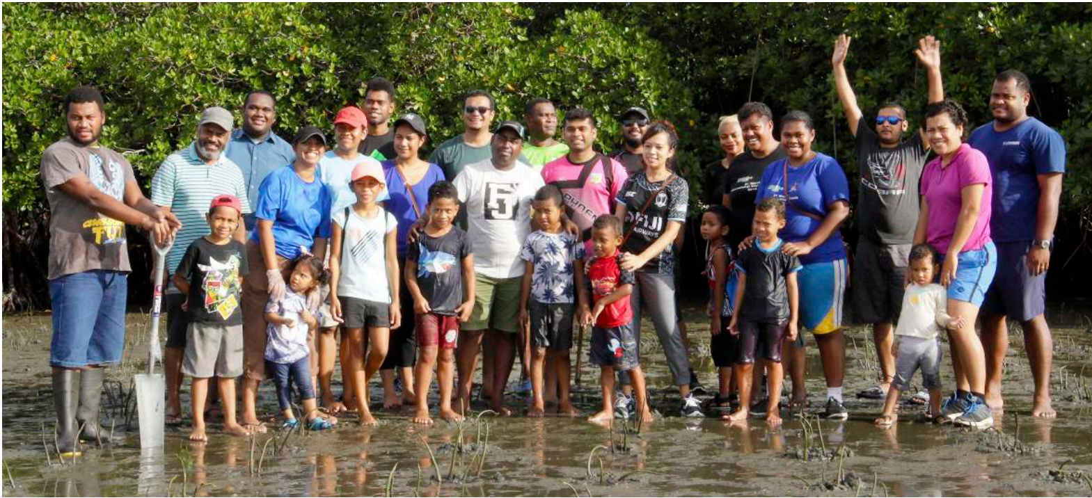
Staff members of Department of Information and Ministry of Forestry with their family after planting about 2000 mangrove seedlings along Nasese foreshore in Suva last week.