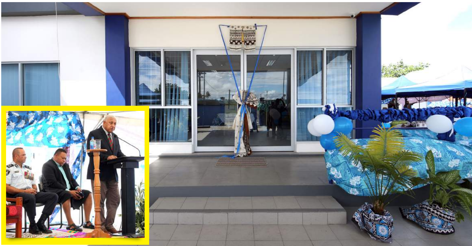
The new Valelevu Police Station that was opened by Prime Minister Voreqe Bainimarama (inset) last week.