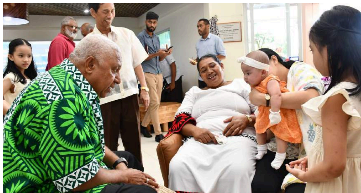
Prime Minister Voreqe Bainimarama shares a light moment with members of the public as Dr Virgilio De Asa looks on during the official opening of the Nasese Private Hospital.

a demand in Fiji for specialised and private care, and is currently the only hospital in Fiji or among our neighbours that is performing hip-and- knee replacements, surgeries that have become commonplace in many developed countries and offer an improved quality of life for people as they get older.”