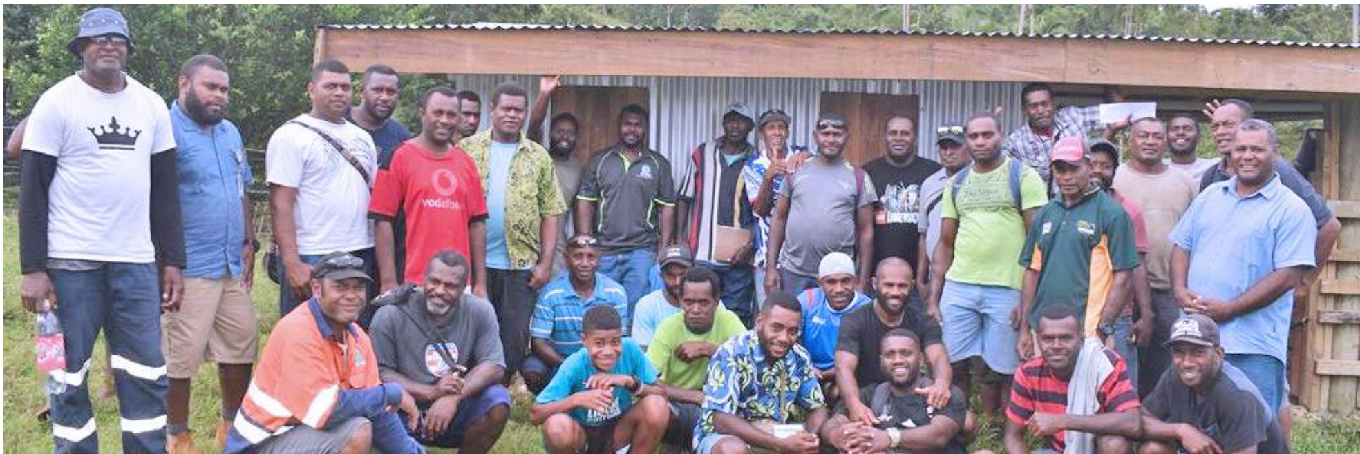
Sa ira oqo na lewe vitu na dau susu bulumakau loba ena vanua ko Waidina e Naitasiri kara sa duavata me vakalevutaki na levu ni sucu era rawata.