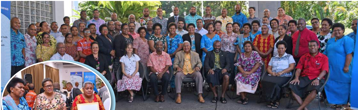
Prime Minister Voreqe Bainimarama with participants during the two-day conference for the development of National Surgical Obstetrics and Anaesthesia Plan for Fiji.