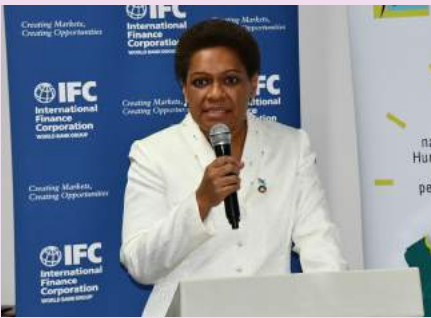
Minister for Women, Children and Poverty Alleviation Mereseini Vuniwaqa during the commemoration of International Women's Day (IWD) 2021 with the launch of the first case study under the Tabu Soro series.