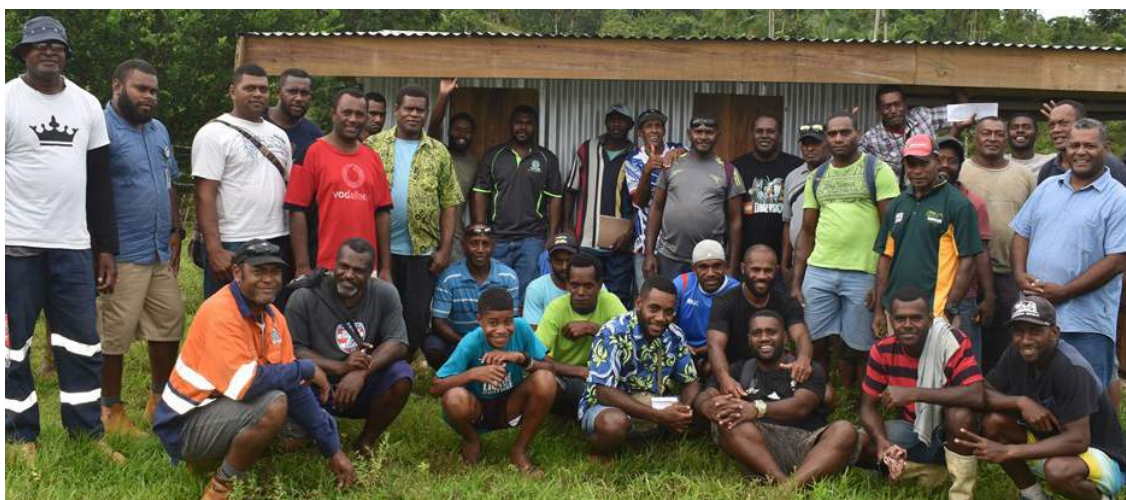
Seven new cluster dairy farmers in Waidina, Naitasiri were established in the last few weeks as part of the Ministry of Agriculture's efforts to not only boost milk production to meet market demand but also to improve the livelihoods of dairy farmers.