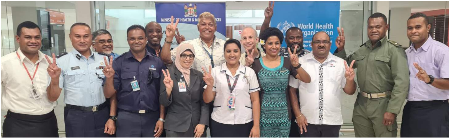
नान्दी अंतराष्ट्रीय हवाई अड्डे के सीमा पर काम कर रहे पहले दस लोग जिन्हें कोविड-घरा से बचने की सुई लगाई गई।