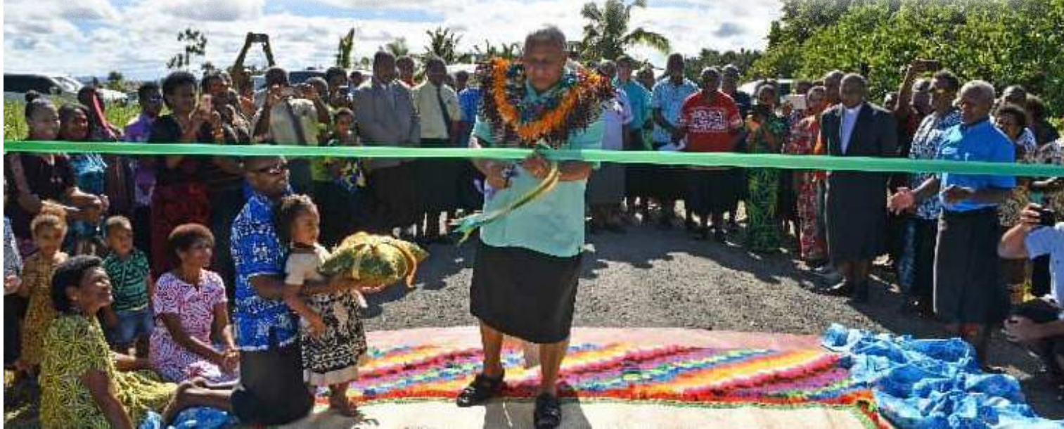
E gauna lagilagi ki na koro ko Anitioki e Daku, Tailevu, ni sa kotiva o Paraiminisita Voreqe Bainimarama na reveni drokadroka ena dola ni nodra gaunisala ka toka ena $3.5 na milioni na kena isau vakailavo.