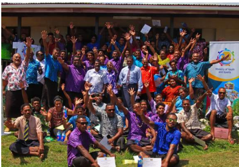
Youth members with Minister of Youth and Sports Parveen Kumar during the Empowerment training on Climate Change Adaptation and Mitigation at Togovere Village, Ra.

The growth of MSME is not only essential to job creation, but also to income generation, rural development, poverty alleviation and empowerment of youth and women.