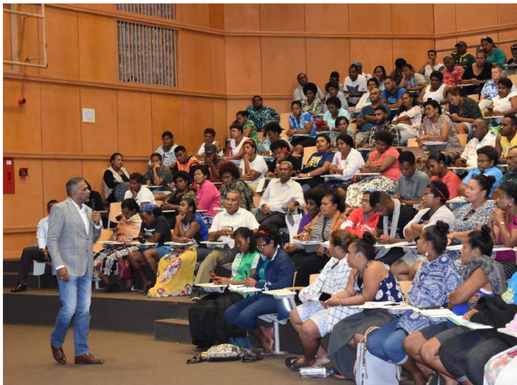
Minister for Commerce, Trade and Tourism, Faiyaz Koya speaks to entrepreneurs during the University of the South Pacific's Entrepreneurial Fair.

“The community fire wardens have been trained and taught the basic skills in life saving evacuation. This includes fire evacuation and tsunami evacuations and others.”