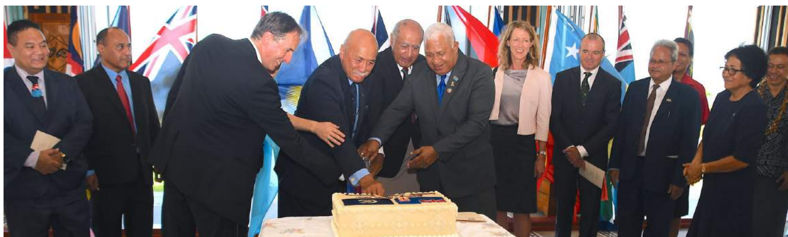
President Major-General (Ret’d) Jioji Konrote, Speaker of Parliament, Ratu Epeli Nailatikau, Prime Minister Voreqe Bainimarama, cabinet ministers, members of Parliament, members of the diplomatic corps and representatives of the non-governmental organisations during the Commonwealth Day 2021 at State House in Suva.