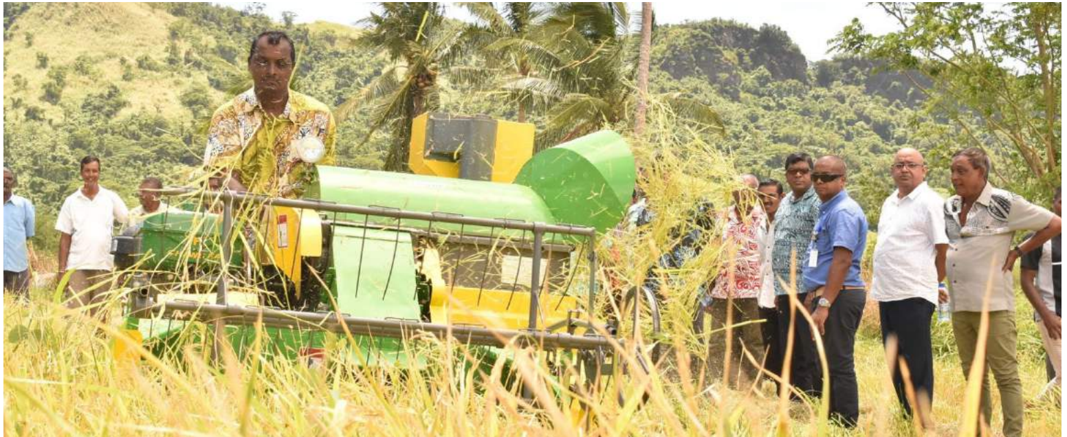
एक किसान नया राईस हावेस्टर से धान काटते हुए। कृषि मंत्रालय के अधिकारी तथा अन्य किसान यह कार्यवाई देख रहे हैं।