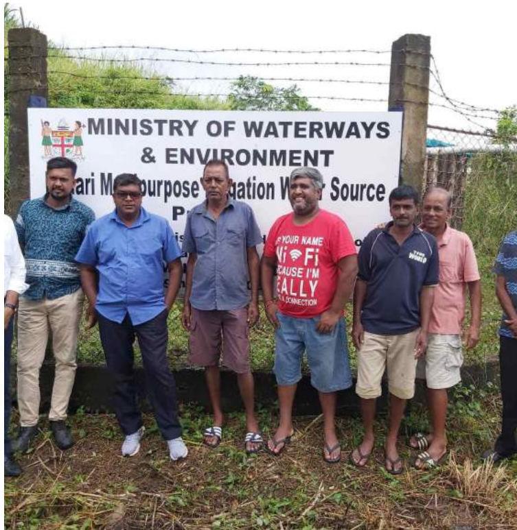
कृषि तथा वोटरवैस मंत्री डाक्टर महेन्द्र रेड्डी नन्दारी बा के निवासियों के साथ।

“इस सरल योजना में जीवनभर की पुँजी खर्च तो नहीं हुई लेकिन इससे इस समाज को सालों तक फायदा होगा। यह योजना गवाही देती है कि हम इस समाज के लिए क्या पीछे छोड़कर जा रहे हैं,” मंत्री ने कहा।