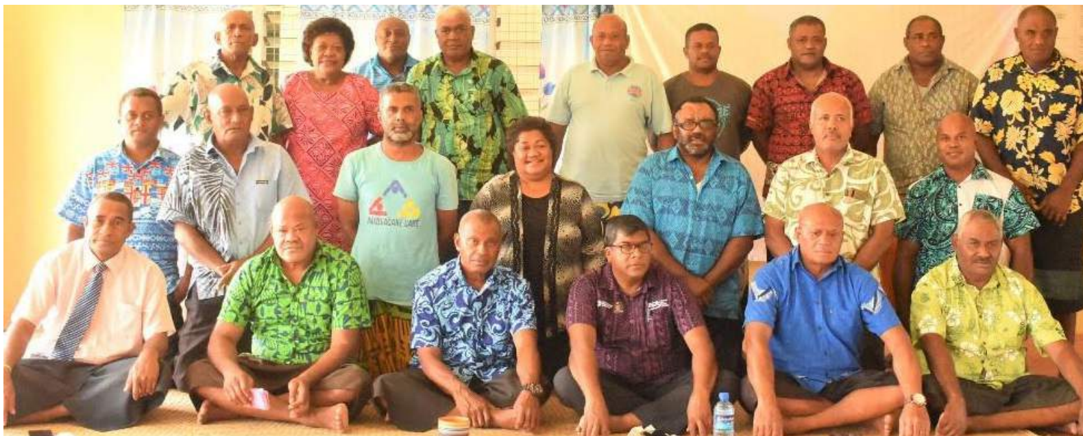
Oqo ko ira na lewe ni vanua ko Nakovacake e Nadi ka vakacautaki ira na Minisita ni Teitei ko Dr Mahendra Reddy ena daumaka ni ituvatuva ni nodra vakayagataki qele ena gauna bolebole ni mate levu na COVID-19.