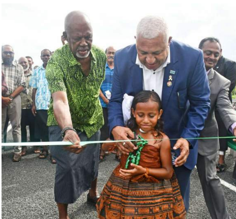
Prime Minister Voreqe Bainimarama during the official commissioning of Waidamu Bridge outside Nausori earlier this week.

“We are rebuilding it to be stronger, to withstand the violent storms we have been experiencing, and the raging waters they of-