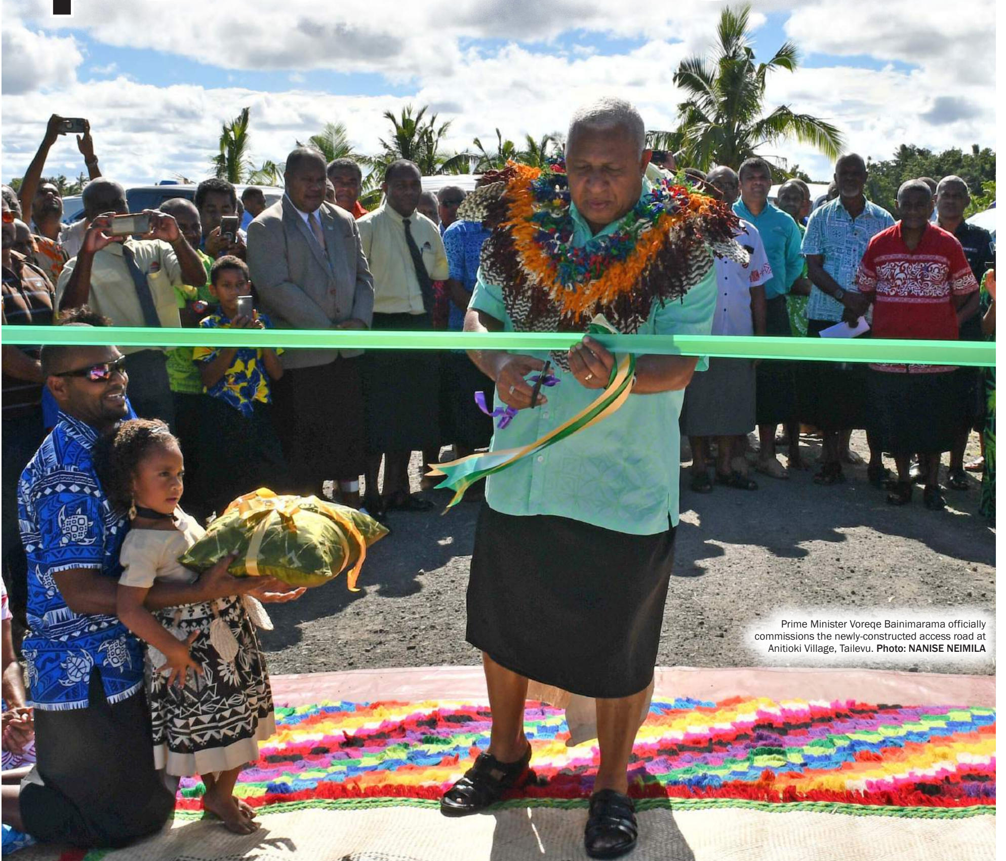
Prime Minister Voreqe Bainimarama officially commissions the newly-constructed access road at Anitioki Village, Tailevu.