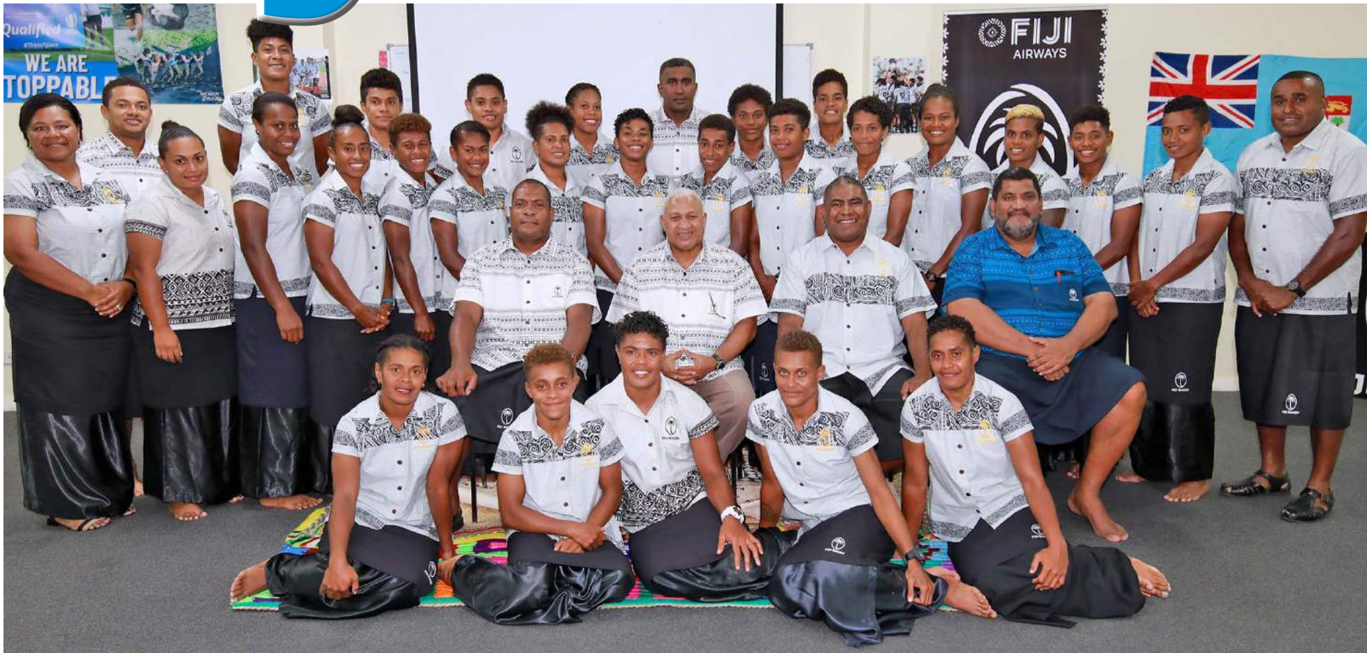
Prime Minister Voreqe Bainimarama with Fiji Rugby Union officials and members of the Fijiana 7s team.