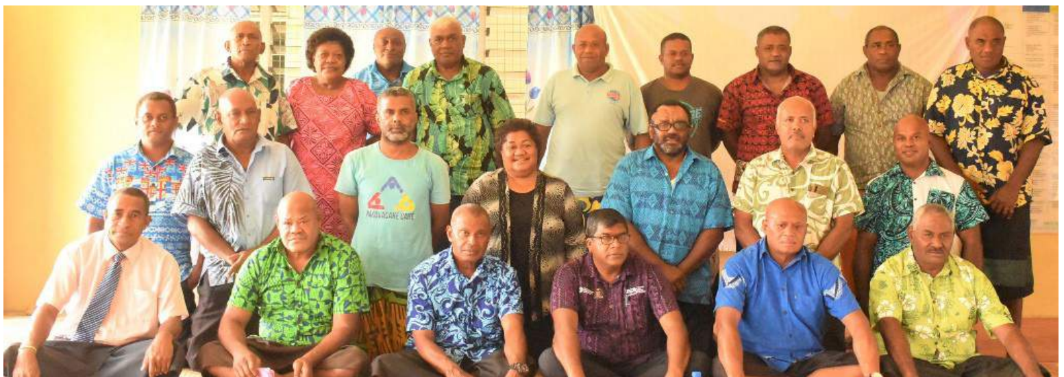
कृषि, वोटरवैस, तथा वातावरण मंत्री डाक्टर महेन्द्र रेड्डी नकोवदाके किसानों के दल के साथ।