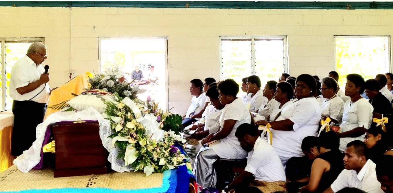
Era tauca tiko oqori na nona vosa ni veivakacaucautaki vua na turaga na Minisita ni Veitaqomaki vakacegu ko Joketani Cokanasiga na turaga na Paraiminisita e Viti o Voreqe Bainimarama ena loma ni valenilotu ni koro ko Sauniveuto e Deuba, Serua..

“E sega ni rawa nida tu vakadua ena gauna oqo ka waraka me vakanadakui keda na mate levu oqo. Na wavu saka oqo edua vei ira na wavu vinaka ena taudaku ni korolelevu ena vukea na nomuni bula ka vaqacotaka na veiqaravi ena noda vanua.”