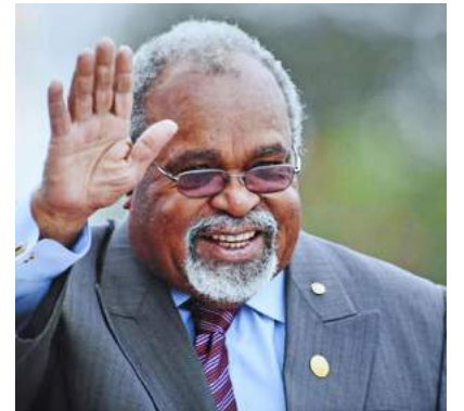
The late Grand Chief Sir Michael Somare.

"THE Grand Chief was a true friend of Fiji. He stood by Fiji as we faced our own set of challenges, urging the international and regional communities to trust judgment and respect our decisions."