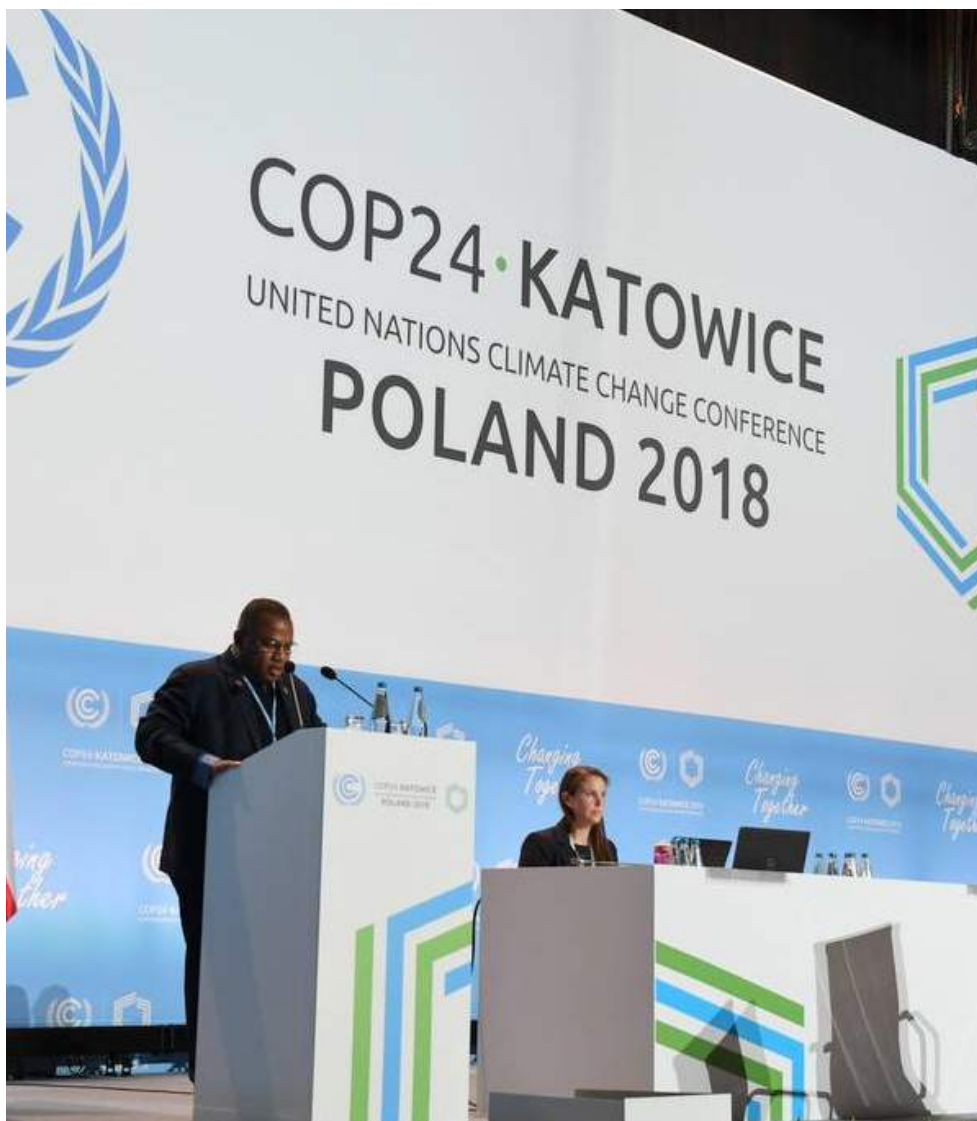
Fiji Climate Champion for its presidency of COP23, Minister for Defence and National Security Inia Seruiratu at the opening of the High Level Stocktake on Pre-2020 ambition and implementation opening in Katowice, Poland.

COP24 President Michel Kurtyka said that at last year's COP23, all parties shared the view that the Pre 2020 implementation and