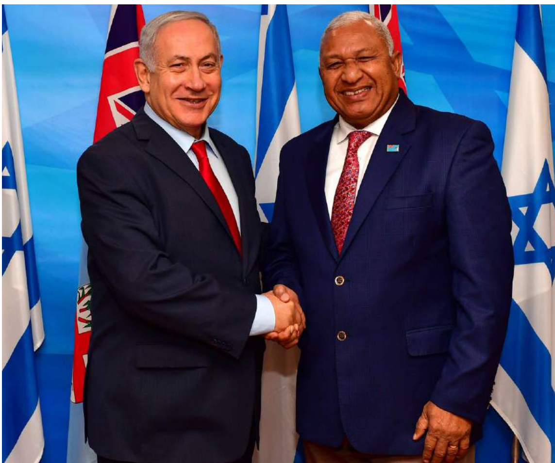
फीजी के प्रधानमंत्री वॉरेनो बर्डिनिरामा जेरूसलम में इज़रैल के प्रधानमंत्री श्री बेन्जामिन नेतनयाहू से मुलाकात करते हुए।

भरोसा है कि आपकी नेतागिरी में यह संबंध और भी गहरा होगा,” प्रधानमंत्री मोदी ने कहा। भारतीय प्रधानमंत्री ने आगे कहा कि भारत और फीजी महत्वपूर्ण मूल्य बाँटते हैं जो दोनों देशों के मज़बूत द्विपक्षीय संबंधों का समर्थन करते हैं।