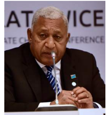
Outgoing COP23 president and Fijian Prime Minister Frank Bainimarama.

“We must also ensure that public finance leverages private finance for adaptation and that the conditions exist for private sector investment to flow in a way that allows rapid transformation of our countries in line with our NDCs. Because all around us is evidence that the threat to the peoples and economies of vulnerable nations is increasing year by year.”