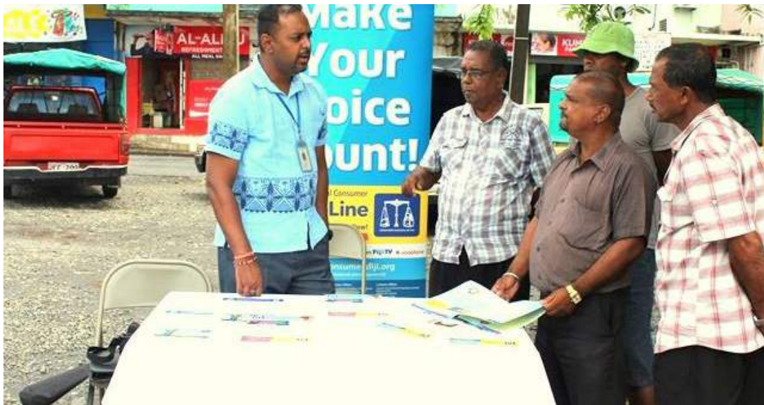
Ko ira na lewe ni vanua era taro vakasala tiko vei iratou na ivakalesilesi ni matabose ni volivoli.

E dodonu na pasidia kece me tokara tiko ena gauna kece ni soko na nona iqaloqalo. Na vakacalaka ena waqa lalai erawa ni yaco ena ena vica walega na sekodi ka sega kina na gauna mera qai sasaga mera tokara kina nodra qaloqalo. E vinaka cake na qaqarauni main a qara na kena iwali ni sa yaco na vakacalaka.