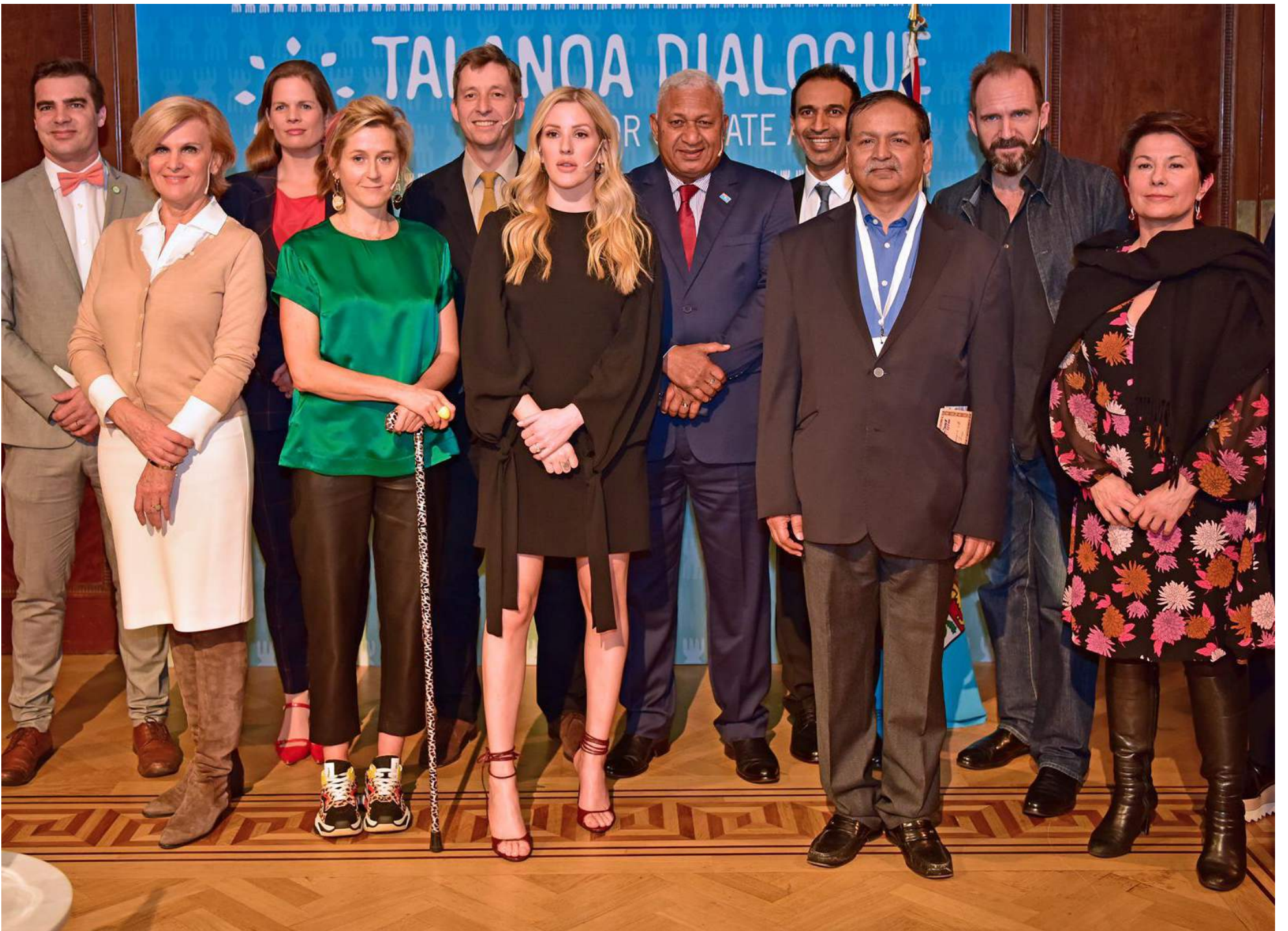
प्रधानमंत्री तथा कोप 23 के भुतपूर्व प्रधान, वॉरेनो बईनिमरामा ने हालही पोलैन्ड में कोप 24 के नए प्रधान को यह पद सौंपने के बाद सम्मेलन के सदस्यों के साथ। इस दौरान उन्होंने कई बड़ी सभाओं में हिस्सा लिया।