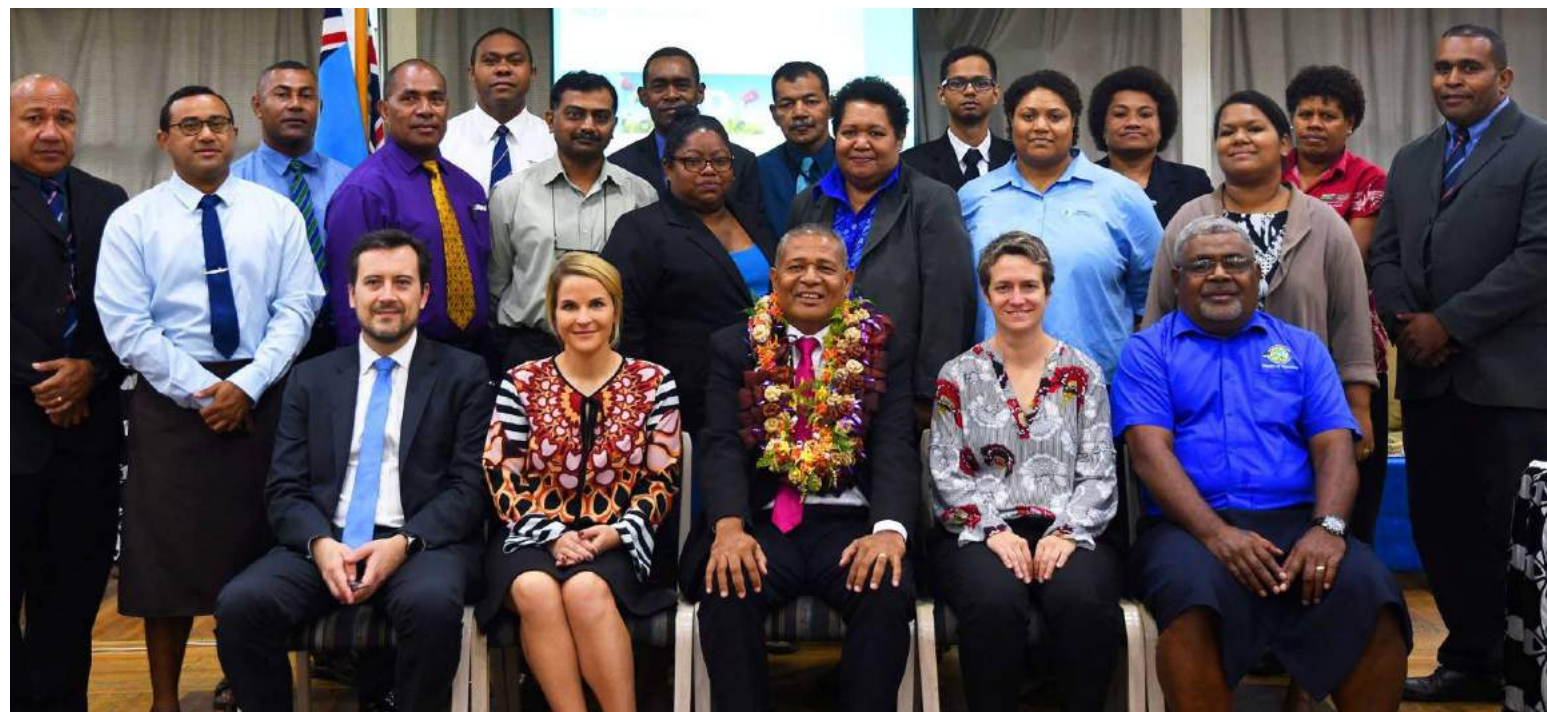
Assistant Commissioner of Police Internal Affairs Tevita Waqabaca (with garland), United Nations Office on Drugs and Crime (UNODC) representative Regina Rohrbach (second from right), with participants at the Narcotics workshop.

The congress will focus on topics such as new technology, new customers, new revenue streams, Exchange evolution, regional collaboration and cybersecurity.