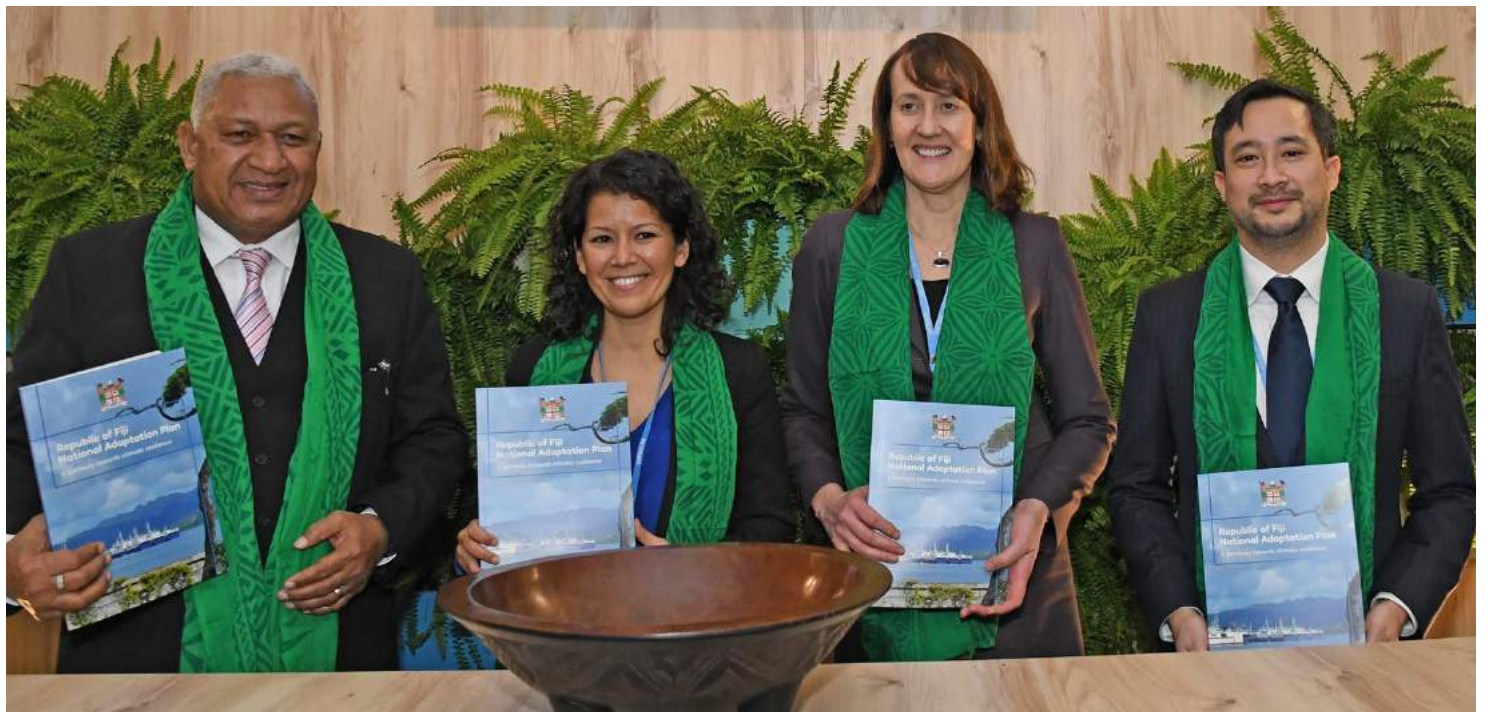
Fiji's National Adaptation Plan was launched by the COP23 President and Fijian Prime Minister Frank Bainimarama in Katowice, Poland.

"The NAP is not only focussing on trying to improve our capacity to access international climate finance. It's about looking more broadly at the financial system and see how that might be incentivised in investments in climate risky areas."