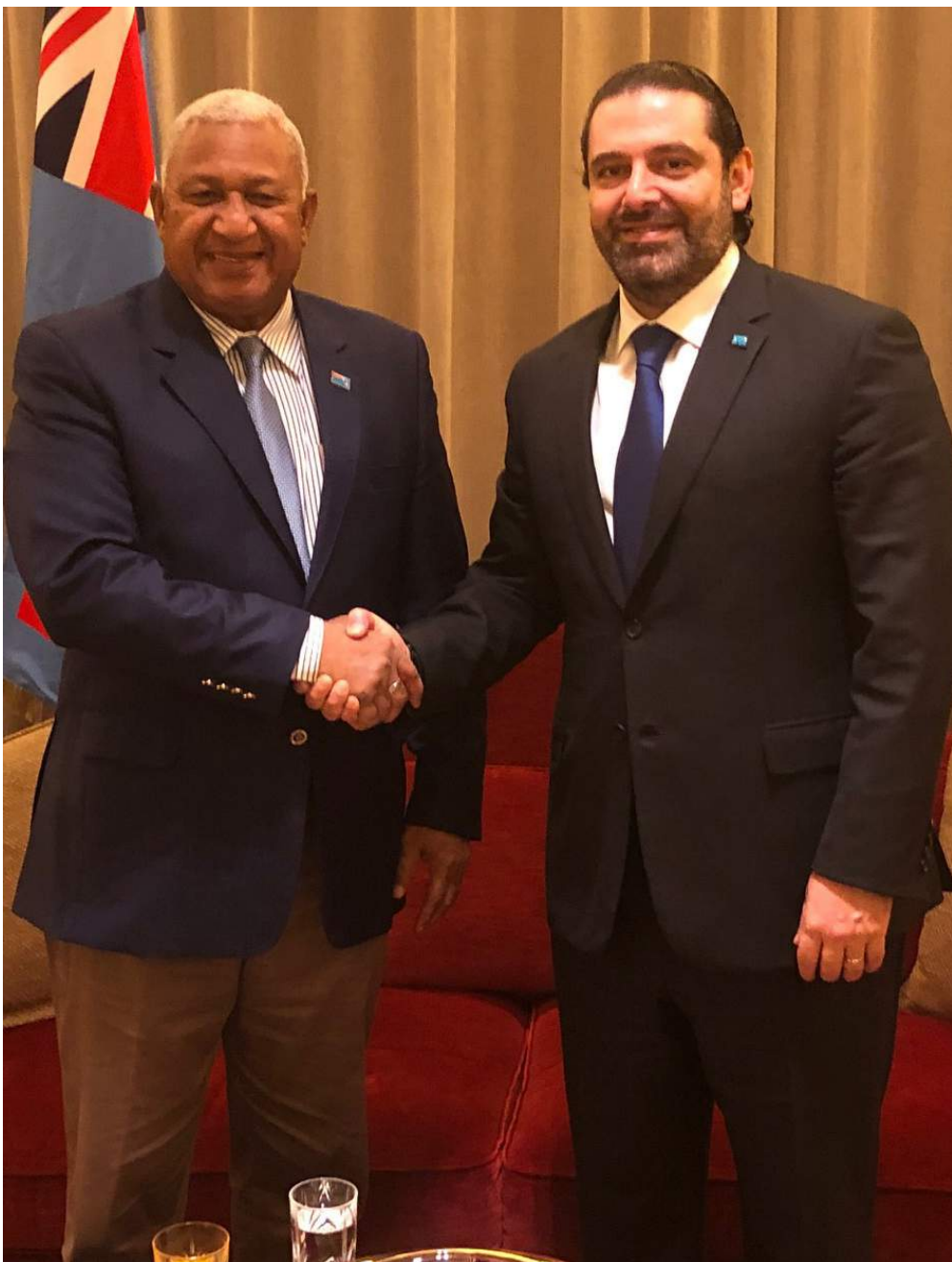
Ko Paraiminisita Bainimarama kei Saad AlHariri na Paraiminisita ni matanitu ko Lapanoni ena nodrau sota donuya na veisiko lekaleka ki na tokalau e loma ka wili kina na matanitu ko Syria, Golan Heights, Isireli kei Lapanoni.

E vakaraitaka talega ko PM AlHariri vei PM Bainimarama na nona veitokoni vei Viti ena veiliutaki baleta na draki kei na wasawasa ka sa gadreva me na sikovi Viti mai ena dua na gauna sa tu e matada.