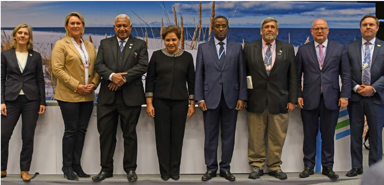
Outgoing COP23 president and Fijian Prime Minister Frank Bainimarama with panel members during the COP24 Adaptation Fund Contributor Dialogue and Reflections from Developing Countries Katowice, Poland.

“We will need greater ambition, greater investment and greater action from all countries if we are to, as we must, limit average global warming to 1.5 degrees above the pre-industrial age. Fiji will do its part, others must too” concluded the outgoing COP23 President.”