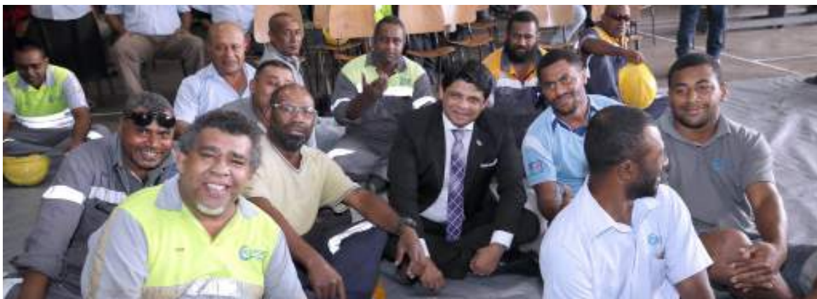
Attorney-General Aiyaz Sayed-Khaiyum with Fiji Ports Terminal Limited workers after the announcement of their bonus payout.

phisticated and has been great for the past nine years but we want to continue to grow the economy for the years to come and in order for us to do that we need to be able to ensure that we do the right things in the right places within the economy."