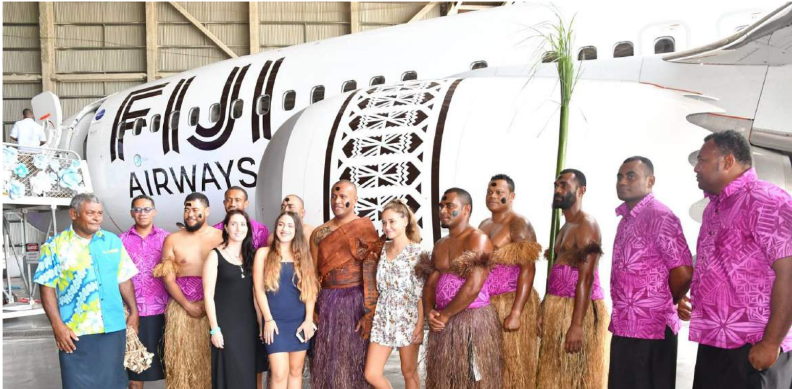
फीजी एर्यावैस के नए विमान, “आएलेन्ड ऑफ कन्दावू” के आने से फीजी एर्यावैस, दुनिया के बेहतर एर्यालाईन कम्पनियों के स्तर तक पहुँच गया है।