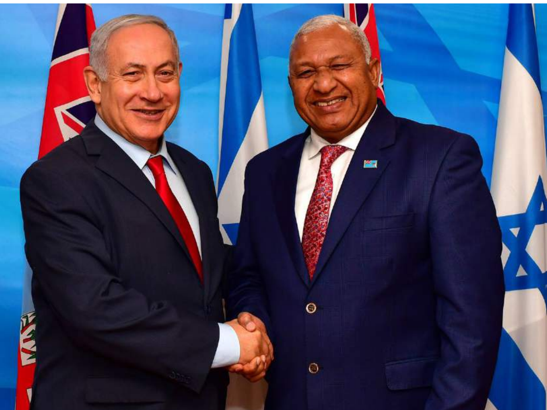
Prime Minister Frank Bainimarama with his Israeli counterpart, Benjamin Netanyahu, in Jerusalem.

With a tripartite package deal with Boeing, the leasing company GE Capital Aviation Services (GECAS) and engine manufacturer CFM International, the partnership includes a 12-year Sale and Leaseback financing arrangement.