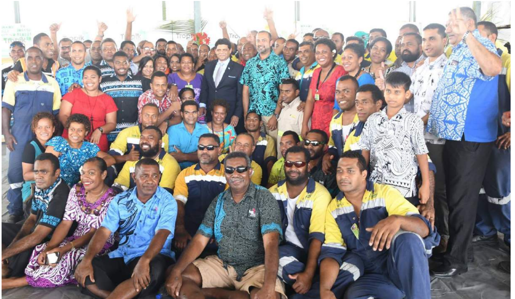
फीजी पाईन के कर्मचारियों के लिए इस साल का कीसमस खास रहेगा जिन्हें हालही में स्थानापन प्रधानमंत्री तथा अटोनी जेनरल माननीय अईयाज़ सैयद खैयुम ने तीन-तीन हज़ार डोलर का बोनस प्रदान किया।