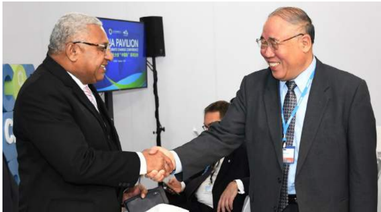
Outgoing COP23 President and Prime Minister Frank Bainimarama with People's Republic of China's special representative on Climate Change Xie Zhenhua during the High-Level Forum on South-South Co-operation.

In acknowledging the two countries, Prime Minister Bainimarama said, "It was a south-south transfer