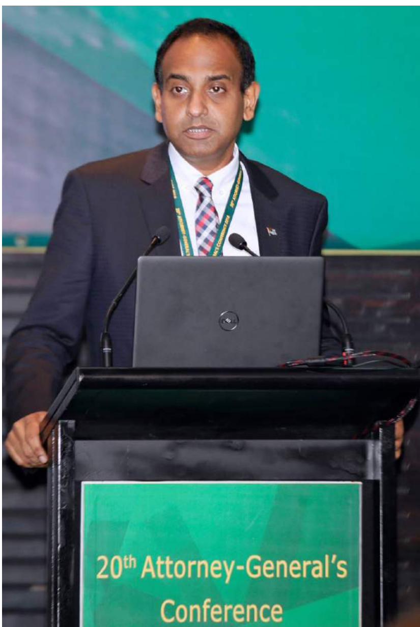
Permanent Secretary for Local Government, Housing and Community Development, Waterways and Environment, Joshua Wycliffe at the 20th Attorney-General’s Conference, under the session, Building the cities of tomorrow: town planning, affordable housing, rights of squatters, decentralization of services, green cities and reducing our carbon footprint.

He noted that the project not only aimed to support the most vulnerable communities through infrastructure projects, but to integrate them into the informal settlements upgrading work of the Government by regularizing the tenure system.