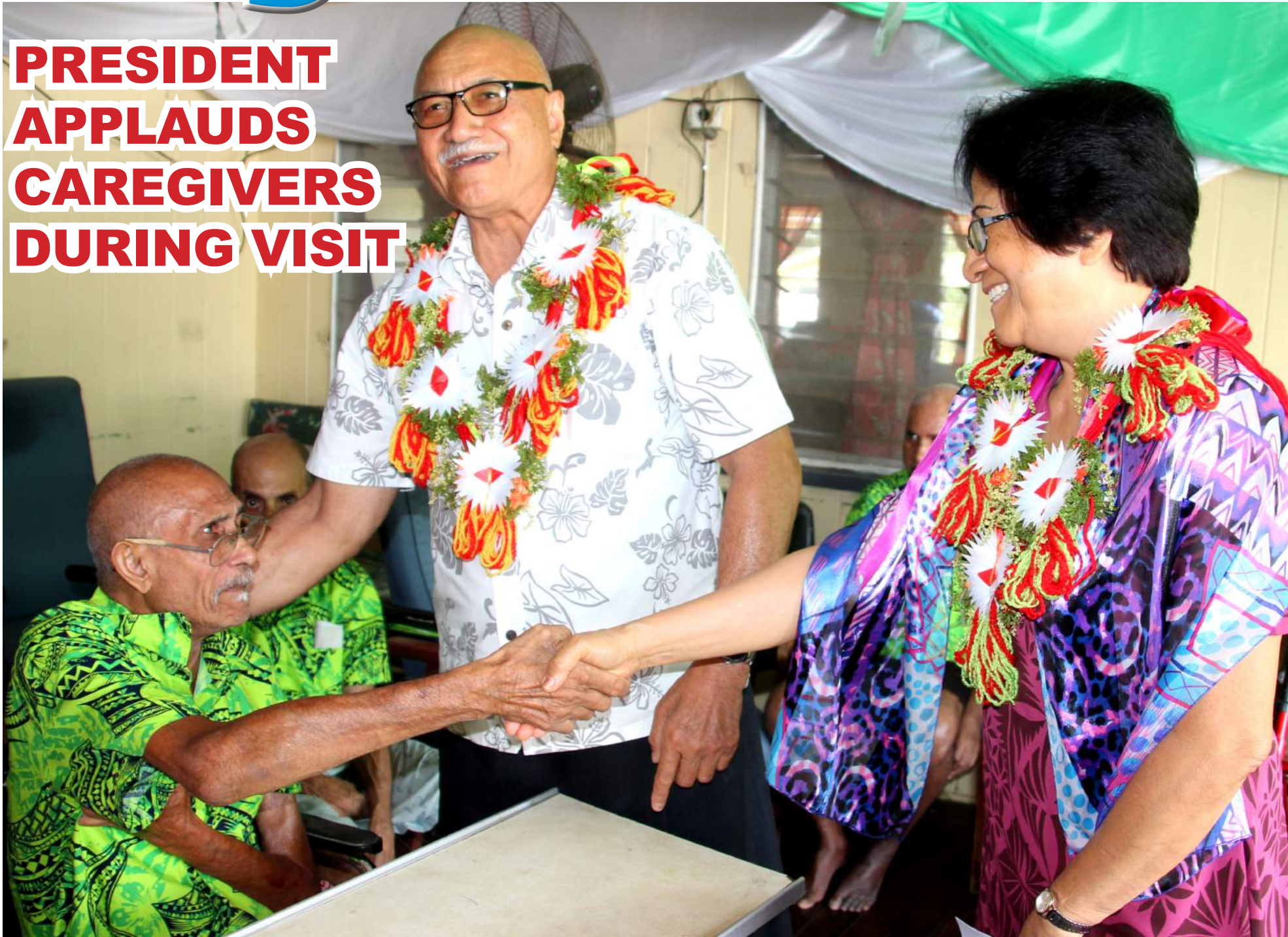
President Major-General (ret'd) Jioji Konrote and his wife the First Lady Sarote Konrote bring Christmas cheer and smile to an elderly during their visit at Golden Age Home in Labasa last week.