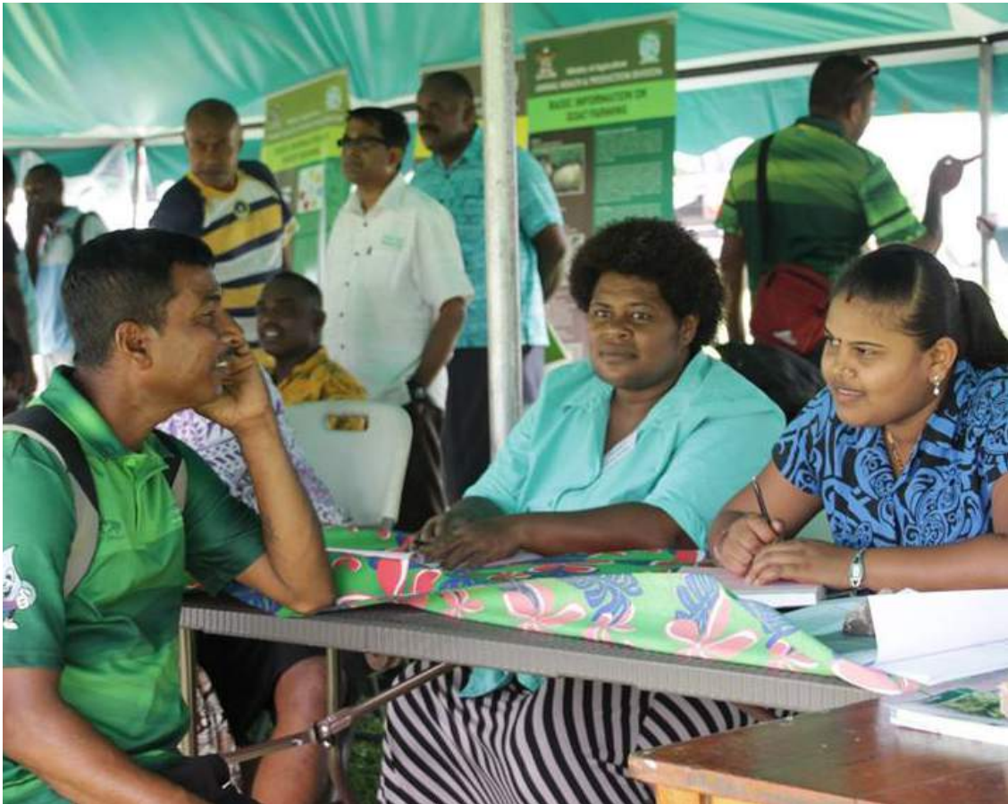
Ko ira na ivakalesilesi ni baqe ni veivakatorocaketaki ni matanitu na Fiji Development Bank era veiqaravi kei ira na lewenivanua ena siga tavoci kina na Ioni vou ni veivuke vei ira na dauteitei.

Tukuna na minisita ni Teitei ni e vuravura e daidai na sala ni rawaka esa dusimaki tu ena Veivakatorocaketaki lewai matau me yacova yani na yabaki 2030.