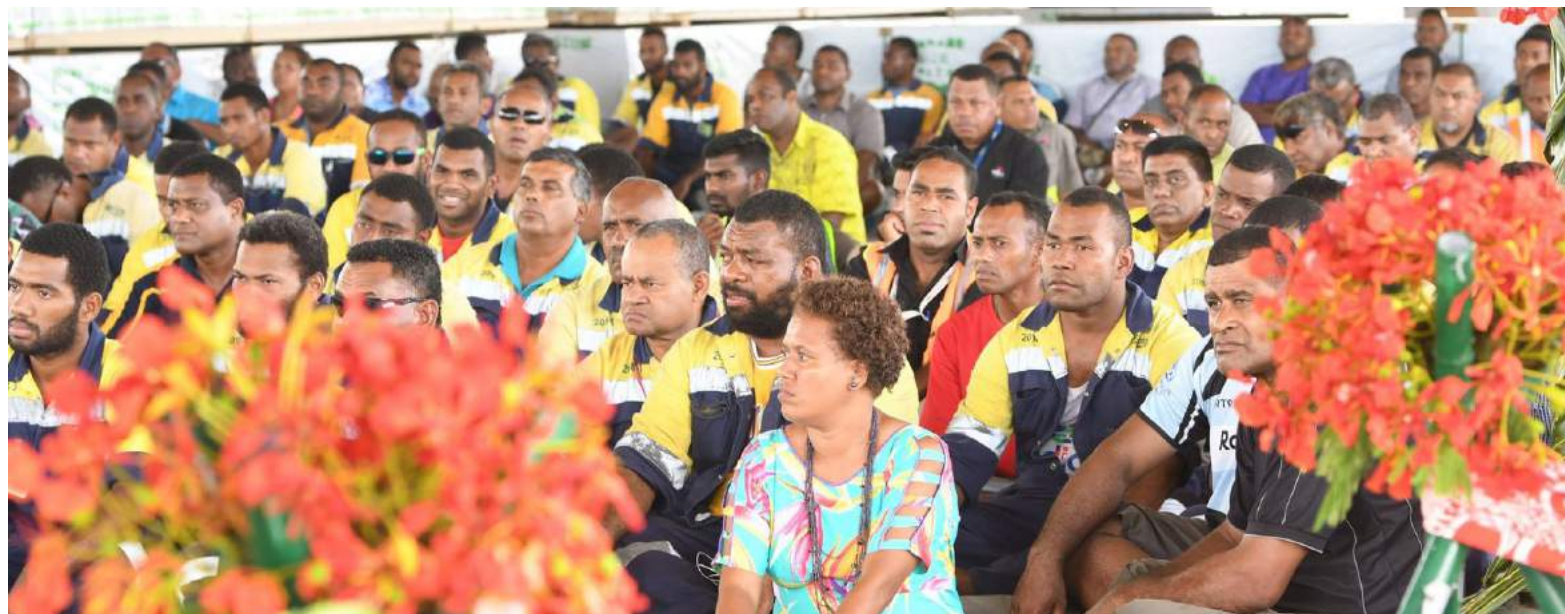
Fiji Pine Limited and Tropik Wood staff at the announcement of the company's $1.3 million bonus by the Attorney-General Aiyaz Sayed-Khaiyum in Drasa, Lautoka.

Contacts: Suva: 3301806 / West: 6700086 / 9905965 North: 8811276 / 9905971 Fax: 3305139/3304663 news@govnet.gov.fj @FijiRepublic Fijian Government visit us at www.fiji.gov.fj