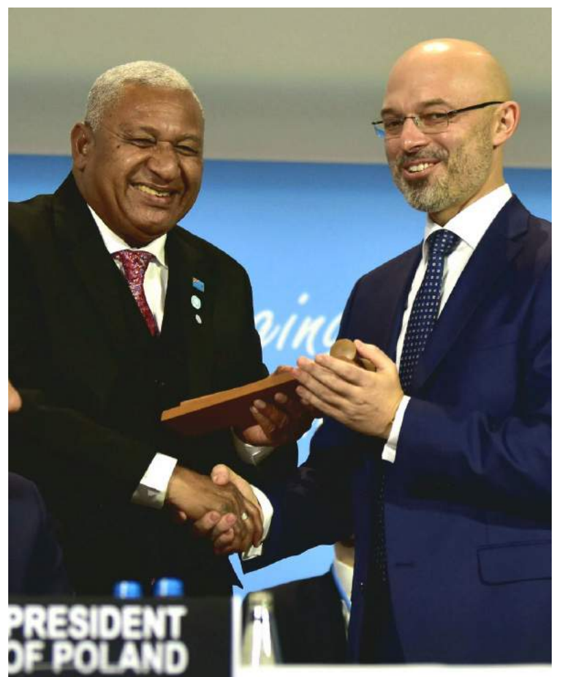
Outgoing COP23 President Frank Bainimarama with COP24 President Michał Kurtyka at Katowice in Poland.

The Secretary General added that the IPCC Special Report is a stark acknowledgement of what the consequences of global warming beyond 1.5 degrees will mean for billions of people around the world, especially those who call small island states home.