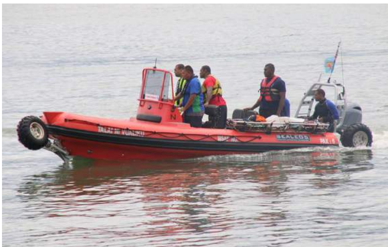
Sa ni kerei na lewe ni vanua mo ni raica matua na bibi ni muri ni lawa ni soko kei na vakamuri ni itukutuku ni draki eratou dau vakarautaka na kena dau ena siteseni ni draki mai Nadi.

NA Matabose ni Tataqomaki e wasawasa e Viti esa kerei kemuni tiko yani na lewei Viti moni vakamuria vakavinaka na lawa ni tataqomaki ena gauna ni soko ni donuya tiko na gauna ni marau ni siga ni sucu kei na tawase ni yabaki.