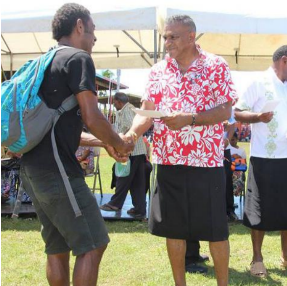
इंडस्ट्री, ट्रेड मंत्री फईयाज़ सिदिक कोया ने लम्बासा में छोटे और सुक्ष्म व्यापारियों को दो चरण में एक-एक हजार डॉलर ग्रांट दिया।

इस रिपोर्ट में इस बात पर गौर किया गया है कि पोवेटी बनेफिट स्कीम, सौशल पेन्शन स्कीम तथा व्यापारिक ग्रांट ने इस कमी में मुख्य भूमिका निभाई है। इस छोटे और सुक्ष्म व्यापारिक ग्रांट कार्यक्रम के नीचे पैतीस हजार नौ (35,009) छोटे और सुक्ष्म व्यापारियों की मदद की गई है। सरकार की पैतीस मिलियन डॉलर ($35million) की सहायता से एक लाख पचहत्तर हजार तीस फीजीवासियों की ज़िन्दगियों पर सकारात्मक असर पड़ा है।