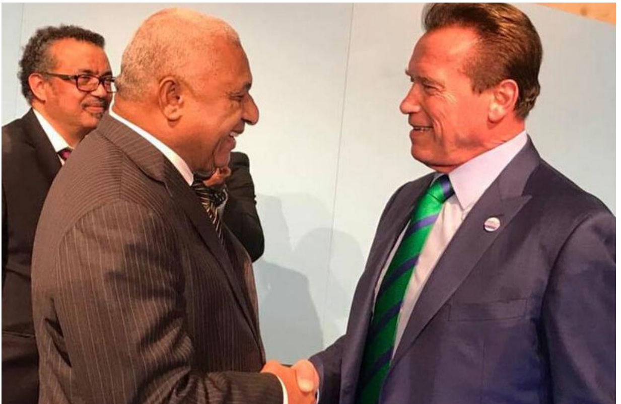
फीजी के प्रधानमंत्री वोरेंगे बईनिमरामा, कैलिफोर्निया अमरिका के भुतपुर्व गवर्नर तथा विश्व प्रसिद्ध अभिनेता अनल्ड स्वाज़नेगर से मुलाकात करते हुए।

श्री स्वाज़नेगर और श्री बईनिमरामा के साझेदारी से यह बातचित आयोजित की गई थी जिसका लक्ष्य था सभी बड़े नेताओं को एक साथ लाना ताकि ज़्यादा ध्यान जल वायु परिवर्तन के आर्थिक साधन पर रखा जाए।