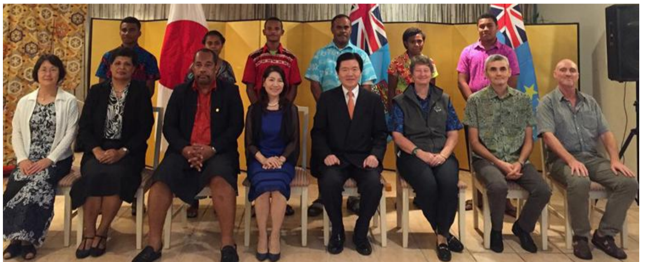
जापान में इस सप्ताह पूर्व हुए हाई स्कूल विद्यार्थियों का सम्मेलन विश्व सुनामी जागरूकता दिवस के दिन हुआ तथा इस साल कोरो हाई स्कूल ने इस सम्मेलन में फीजी का प्रतिनिधित्व किया था। उन्हें यह अवसर मिला था कि वे समुद्री आँधी विंस्टन से हुई तबाही का अनुभव अन्य विद्यार्थियों के साथ बाँटें।

करने के लिए पौधे उगाए जाएंगे। इस उपकरण और ग्रीनहाउस से किसानों को मिल रही सेवा में भारी सुधार होगा। वे बोवाई वाले सामान इन दोनों ग्रीनहाउस के द्वारा किसानों के लिए तैयार रखेंगे जो सिंगातोका और सेंगाँगाँ रिसेच स्टेशन में बन रहे हैं।