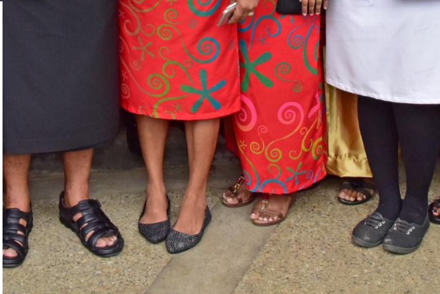
Prime Minister Voreqe Bainimarama, Minister for Health and Medical Services Rosy Akbar with medical practitioners outside the new Nakasi Health Centre last week. INSET: PM Bainimarama officially opens Nakasi Health Centre.