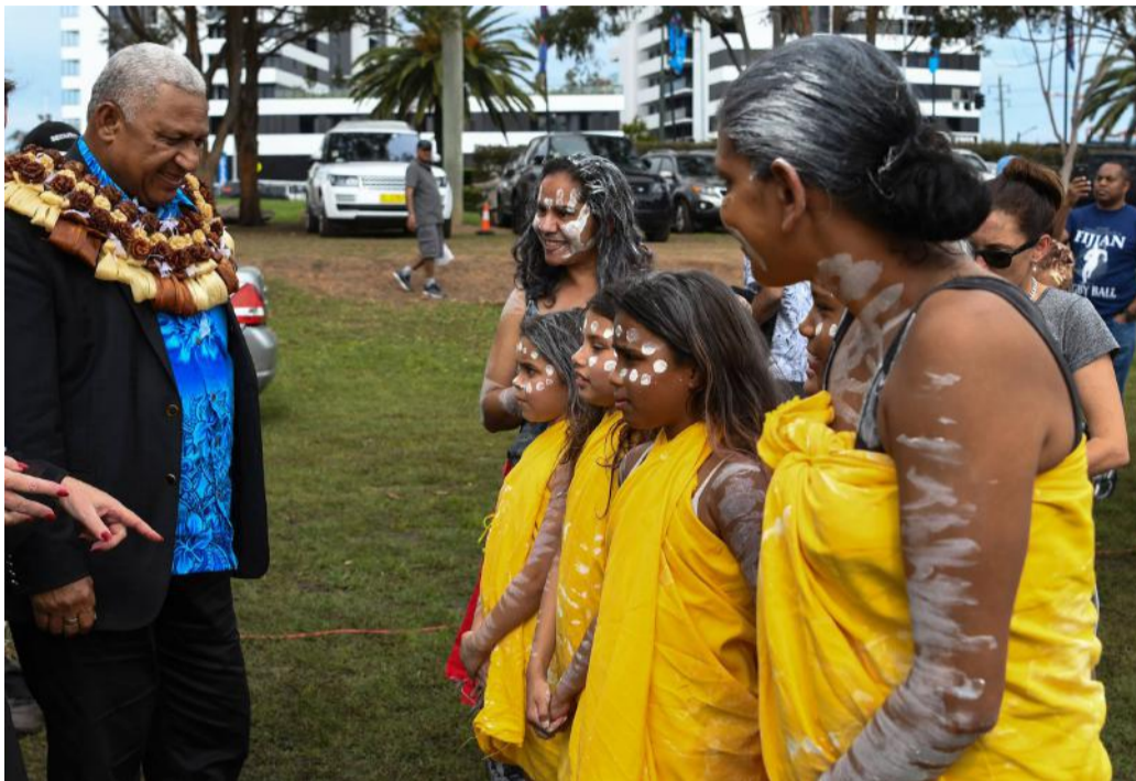
Prime Minister shares a light moment with the members of the Aboriginal community during the Fiji Day celebrations in Sydney, Australia.

last year, the celebrations were taken to the West for the very first time and this year, history was made again when national celebrations were held in Labasa- the first ever in the Northern Division.