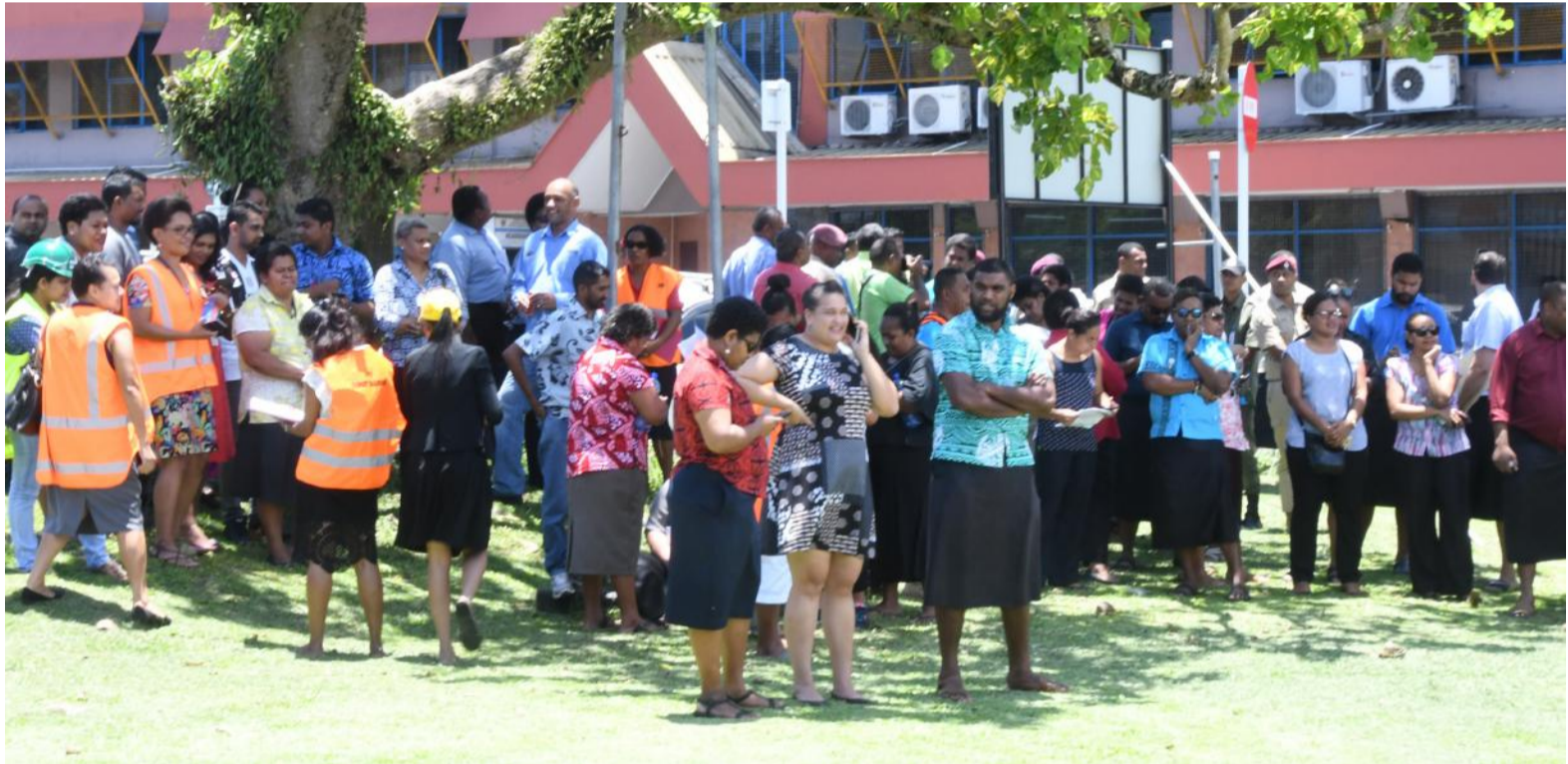
Members of the public including government officials around Albert Park end all moved up to Knolly Street during the tsunami drill in Suva last week.

our preparedness for the 2018/2019 Cyclone Season. As our key Partner in this national effort; your role is very critical; to disseminate both disaster preparedness and response information as we strive to adequately inform and educate the public to effectively manage hazards and disasters,” Mr Bainimarama said. He also confirms that the NDMO has trained civil servants and volunteers to assist and be part of Emergency Operation Centres around the country in times of natural disasters. For the rural communities, training was also conducted for 14 villages and one settlement this year. To date a total of 310 villages have undergone this Community Based Disaster Risk Reduction Training (CBDRR). The National Disaster Awareness will continue for three months.