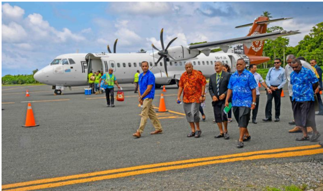
Prime Minister Voreqe Bainimarama, Fiji Airports executive chairman Faiz Khan and Commissioner Eastern Luke Moroivalu with Government officials and stakeholders at the opening of Rotuma Airport's runway.

The $12.5 million project is expected to