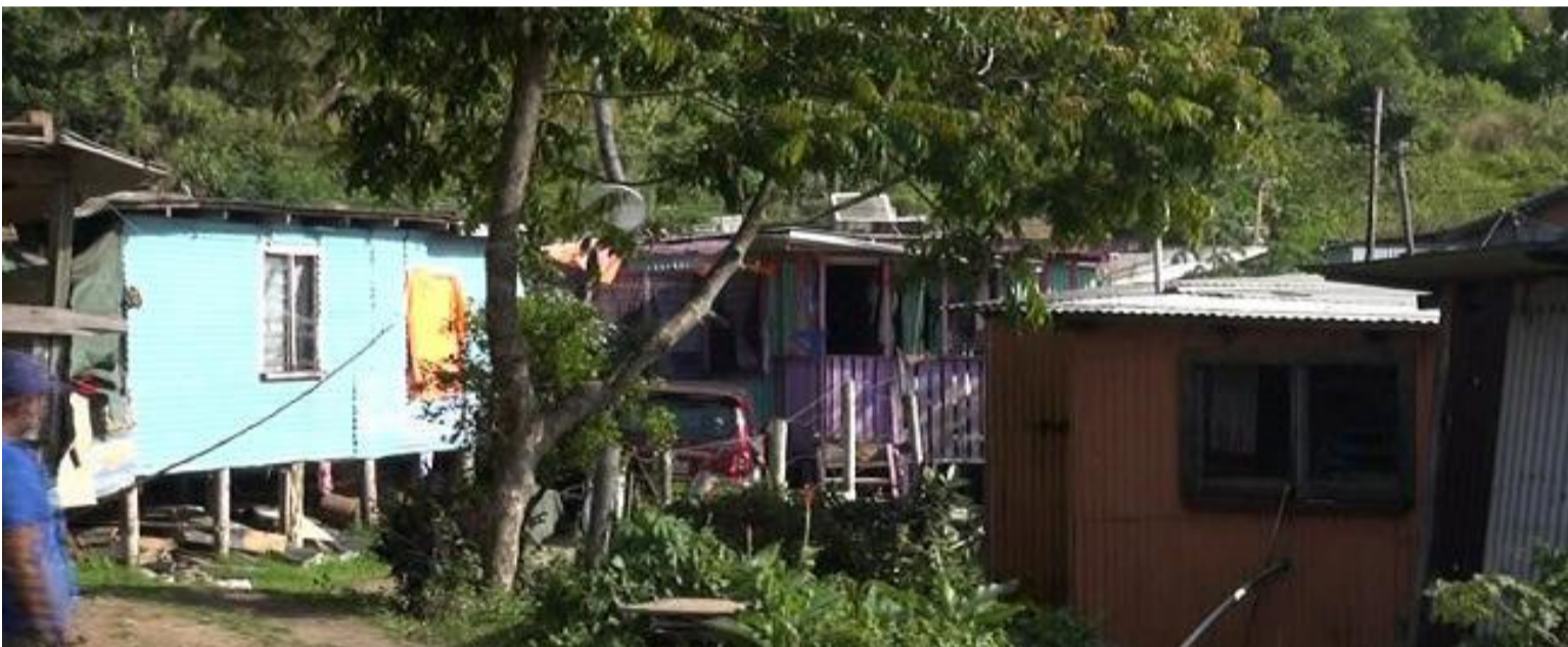
वतुवांगा सूवा स्थित ननुकु और वेईदोन्गो सेटलमन्ट के निवासियों की ज़िन्दगी सवारने के लिए वहाँ के ज़मीन मालिक उन्हें मकोई में जाकर बसने के लिए ज़मीन दे रहा है तथा खिसकने के खर्च के रूप में एक-एक हजार डोलर भी देने को तैयार है।