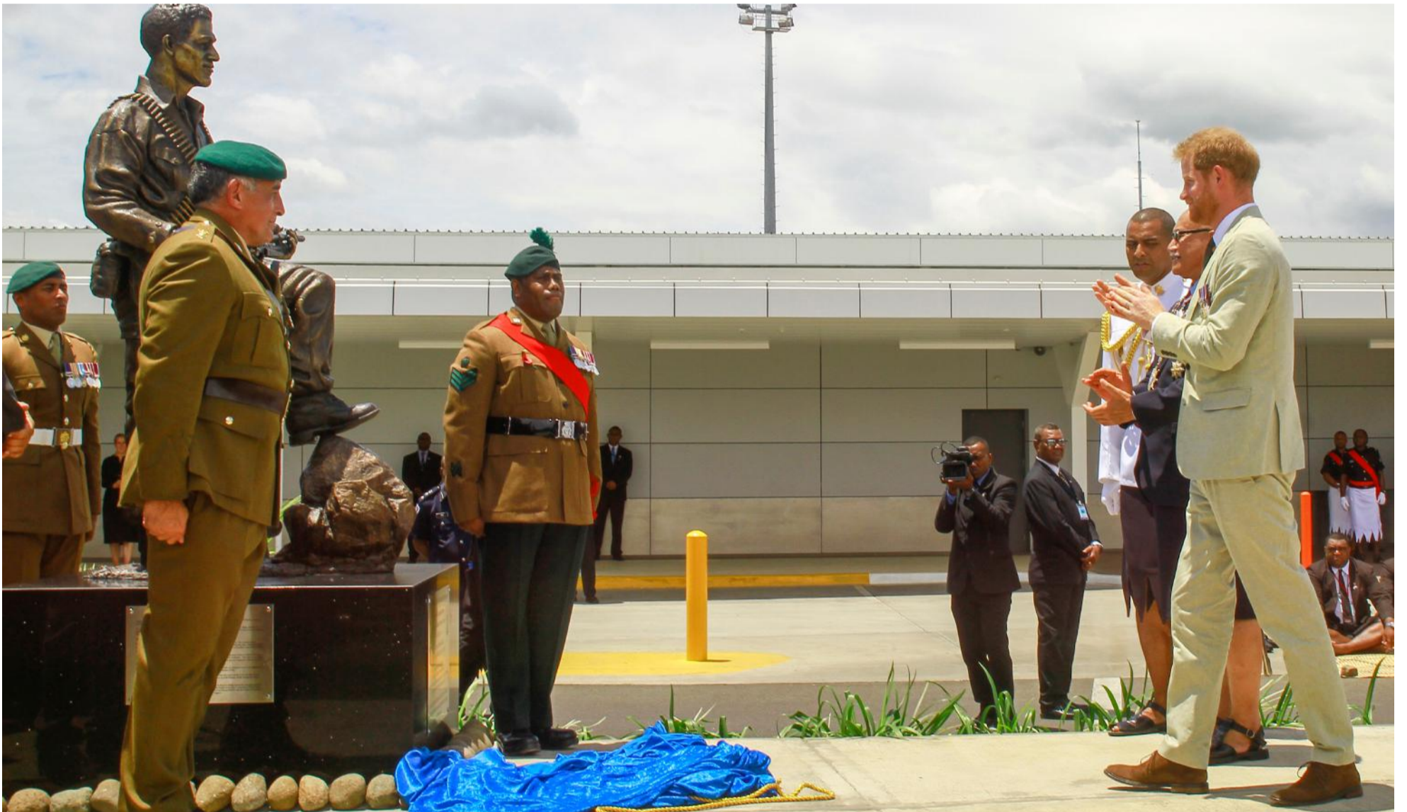
The Duke of Sussex, Prince Harry unveils the statue of the late Sergeant Talaiasi Labalaba at Nadi International Airport. Sergeant Labalaba was an exceptional 30-year-old Fijian member of the Special Air Service (SAS) who died in the most heroic circumstances during the Battle of Mirbat in the Gulf State of Oman.