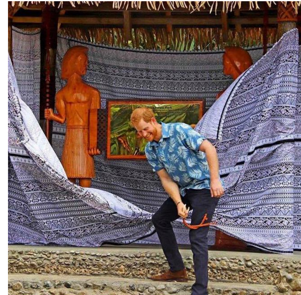
The Duke of Sussex Prince Harry officially unveils the plaque dedicating Colo-i-Suva Forest Park to be part of Queen's Commonwealth Canopy (QCC).

"In the next 18 months, I have been told 10 more will be relocated, and within the next