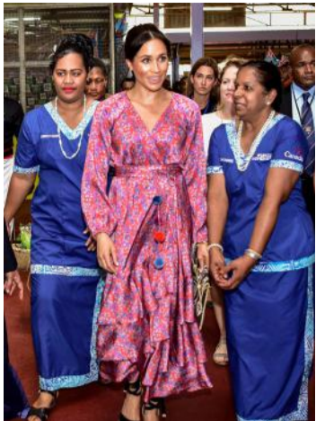
The Duchess of Sussex Meghan Markle at the Suva Municipal Market.