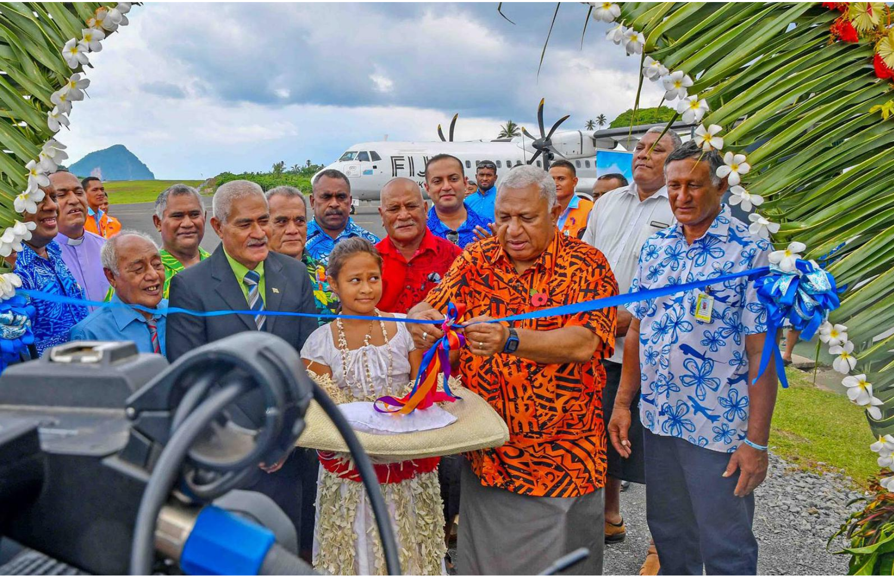
Era kotiva tiko oqori na liuliu ni matanitu ko Paraiminisita Voreqe Bainimarama na reveni ni kena dolavi na irara ni waqavuka vou mai Rotuma ena Okotova 29 ena tikina ko Malahaha.