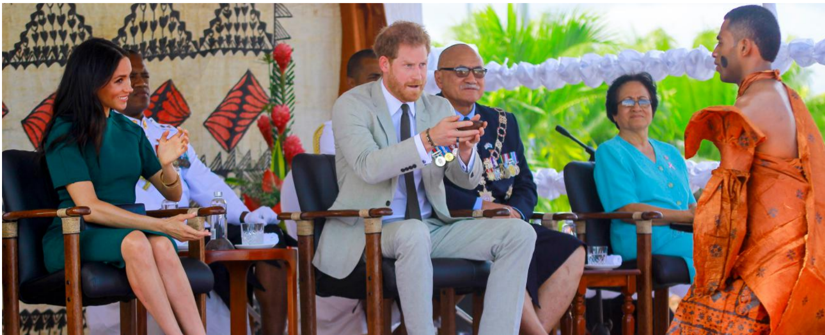
The Duke of Sussex Prince Harry receives a bowl of yagona as the Duchess Meghan Markle looks on during the farewell ceremony at Nadi International Airport.