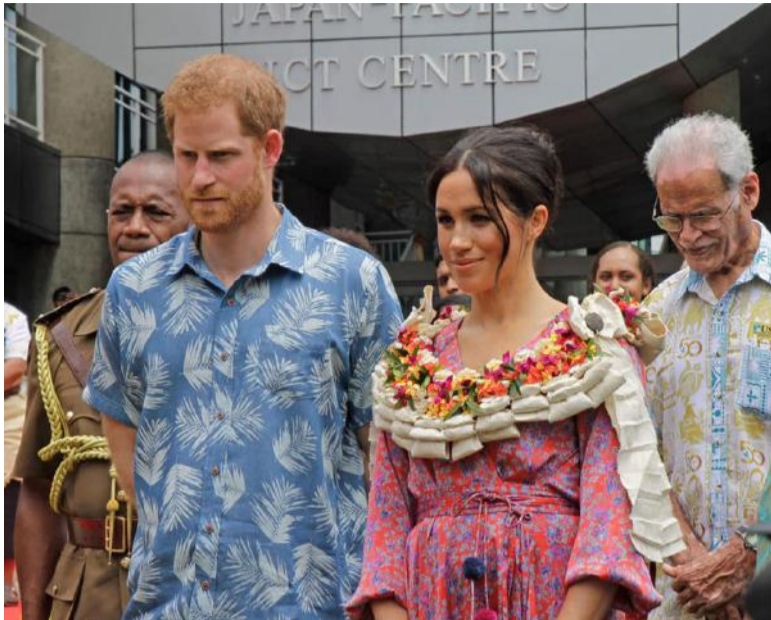
इंग्लैन्ड स्थित ससेक्स के नवाब या डियुक, राजकुमार हेरी और उनकी पत्नी मेगन मार्कल युनिवर्सिटी ऑफ़ दी साउथ पॅसिफिक का दौरा करके निकलते हुए।

राजकुमार हेरी ने फीजी की प्रशंसा की और कहा कि यहाँ के लोगों को अपनी संस्कृति पर गर्व है तथा वे आदर्शवादी हैं।