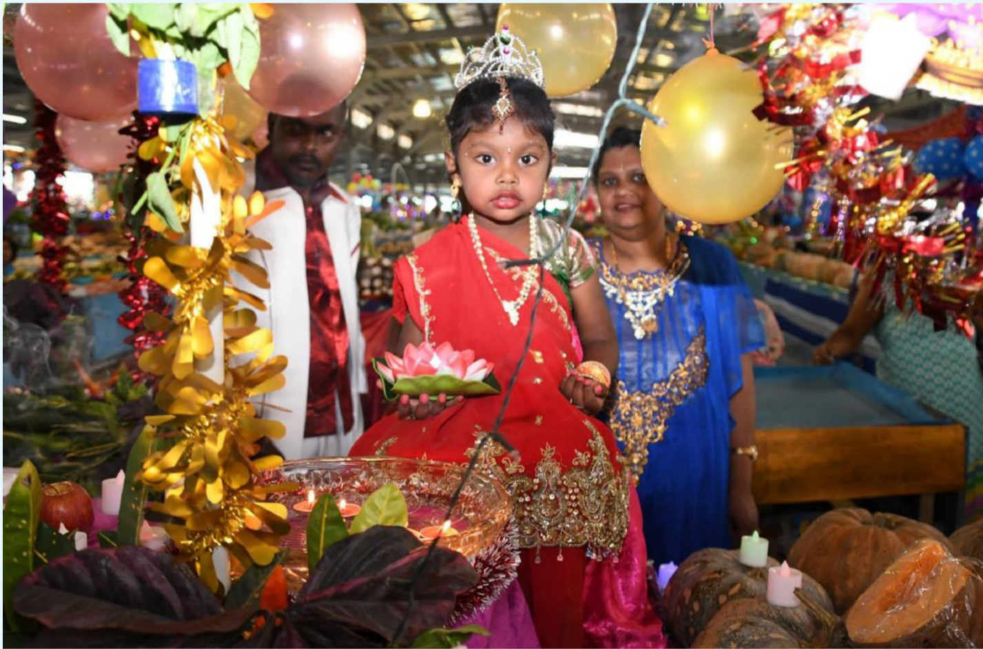
Diwali is a celebration of victory, the victory of good over evil.

This will bring women’s health in Fiji up to international standards, expanding the number of beds to 200.