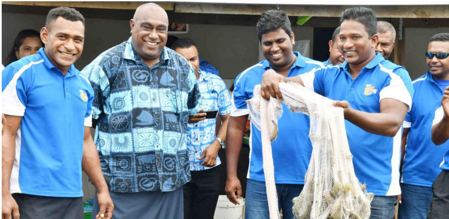
Minister for Fisheries, Semi Koroilavesau with King Prawns Limited staff.

Industry partners recently gathered for the second Fiji Shrimp Summit at Lomawai in Nadroga, where King Prawns Limited currently operates as one of only two fully fledged companies in this sector.