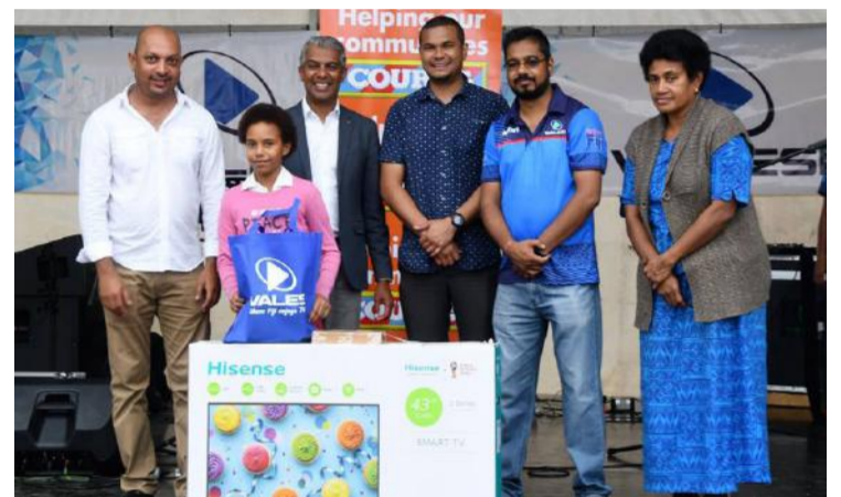
वालेसी लिमिटेड के बोर्ड डायरेक्टस नावुआ में मुफ्त वाए फाए होट स्पॉट लॉन्च करने के दौरान, रखे गए प्रतियोगिता के विजेता को पुरस्कार से सम्मान करते हुए।