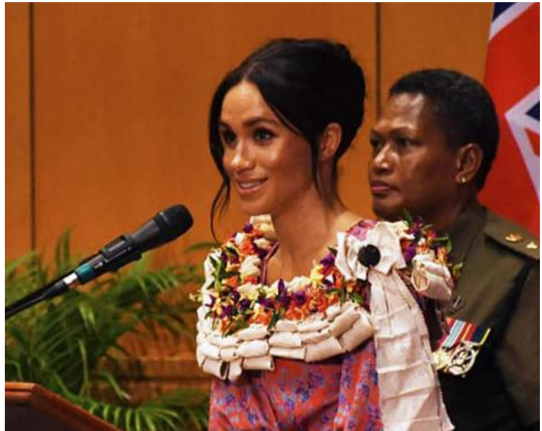
राजकुमार हेरी की पत्नी मेगन मार्कल यू.एस.पी में अपना पहला औपचारिक भाषण देते हुए।