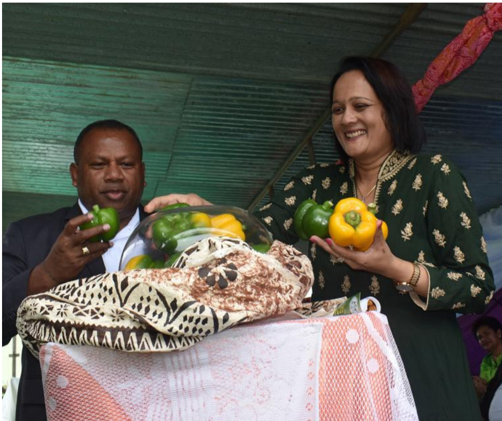
Minister for Agriculture Inia Seruiratu and Minister for Health and Medical Services Rosy Akbar during the launch of the "Open Pollinated Capsicum variety" last month.