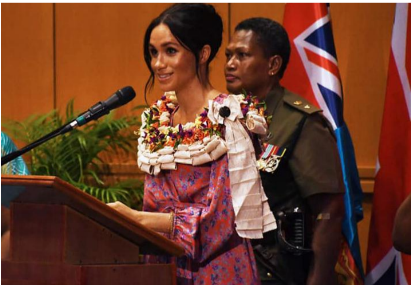
The Duchess of Sussex Meghan Markle while speaking to the students at the University of the South Pacific (USP), during their recent three-day visit to Fiji.

specifically to young women." Ms Markle said the Association of Commonwealth Universities, which Her Majesty the Queen is Patron of, supports universities to promote equality in their own institutions. "I am pleased to announce today that two new grants will be awarded to Fiji National University and the University of the South Pacific, allowing each of them to run workshops which empower their female staff." "This means that female faculty members are able to encourage others to follow in their footsteps and enter higher-education, and that more women become part of the decision-making process in academic institutions." She adds that grants like this ensure that women are provided with the training and skills to operate effectively in their roles and those with leadership potential are given the opportunity to be heard and recognized at the most senior level.