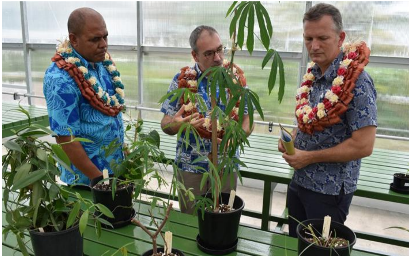
यूरोपियन युनियन ने हाल ही में सिंगातोका और सेंगाँगाँ के किसानों के लिए एक नया ग्रीनहाउस प्रदान किया जिससे वे और भी उच्चदर्रे के फल और शाख-भाजी उगा सकेंगे।