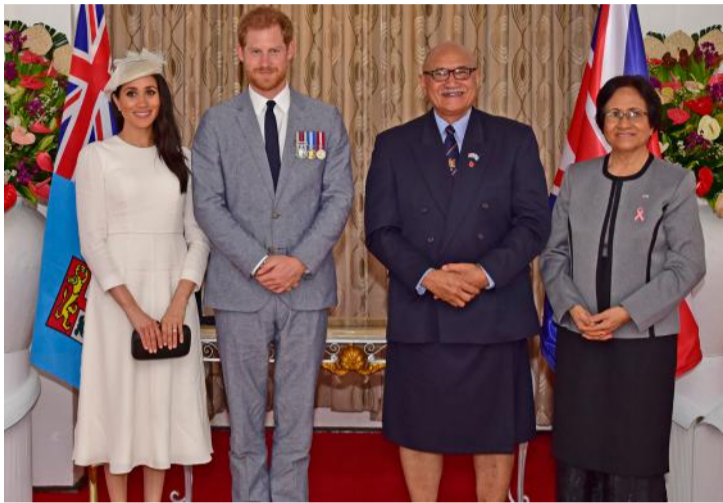
Ko rau na vei-watini na Duke kei na Duchess e Sussex ko Prince Harry kei Meghan Markle vata kei Turaga Peresitedi Major General (Ret'd) Jioji Konrote kei Sarote Konrote e Borron House e Suva.

Vakaraitaka ko Peresitedi Konrote ni veiwekani nei Viti ena Matabose ni veimatanitu qali ki Peritania e vakadinati ena vei-yasai vuravura ena yalo ni veimaroroi, veitokoni, veiraici, na veikauwaitaki kei veidokai ena lawa. “Io, me vaka ena dua na matavu-vale edau tiko na gauna ni veilecavi. “Ia na balavu ni noda veiwekani eda marautaka ni kua me tekivu mai na gauna nei Queen Victoria me yacova mai ni kua vua na Marama Ranadi ni kua ki vua na turaga na tamamu ko Prince Charles ka vakarau me na Tui ena dua na gauna ki vei iko Prince Harry kei Prince William na tuakamu.”