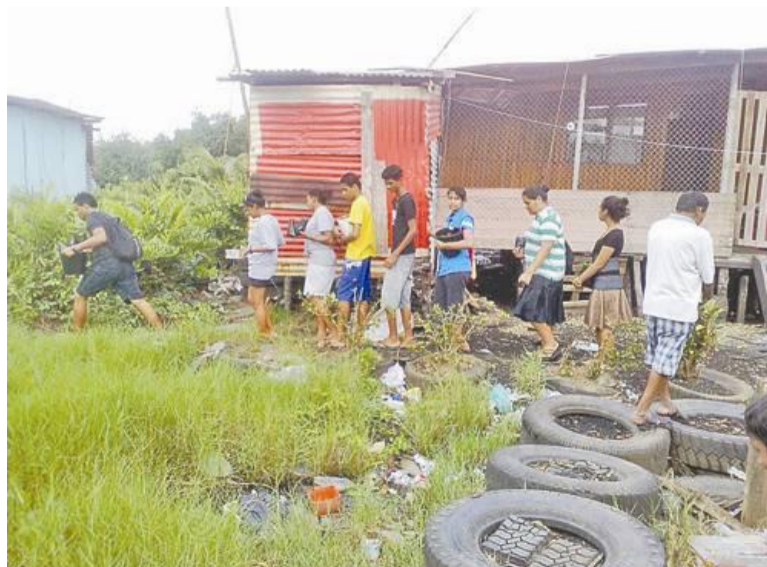
कई निवासी इस सेटलमन्ट में पिछले कई सालों से अपना जीवन बिता रहे हैं जो अपने बच्चों के लिए अच्छे भविष्य की तलाश में आकर वहाँ बसे और कई तकलीफों से गुज़र रहे हैं।

बुरी स्थिति में जीवन बिताना कई निवासियों के लिए दैनिक ज़िन्दगी का हिस्सा बन गई है।