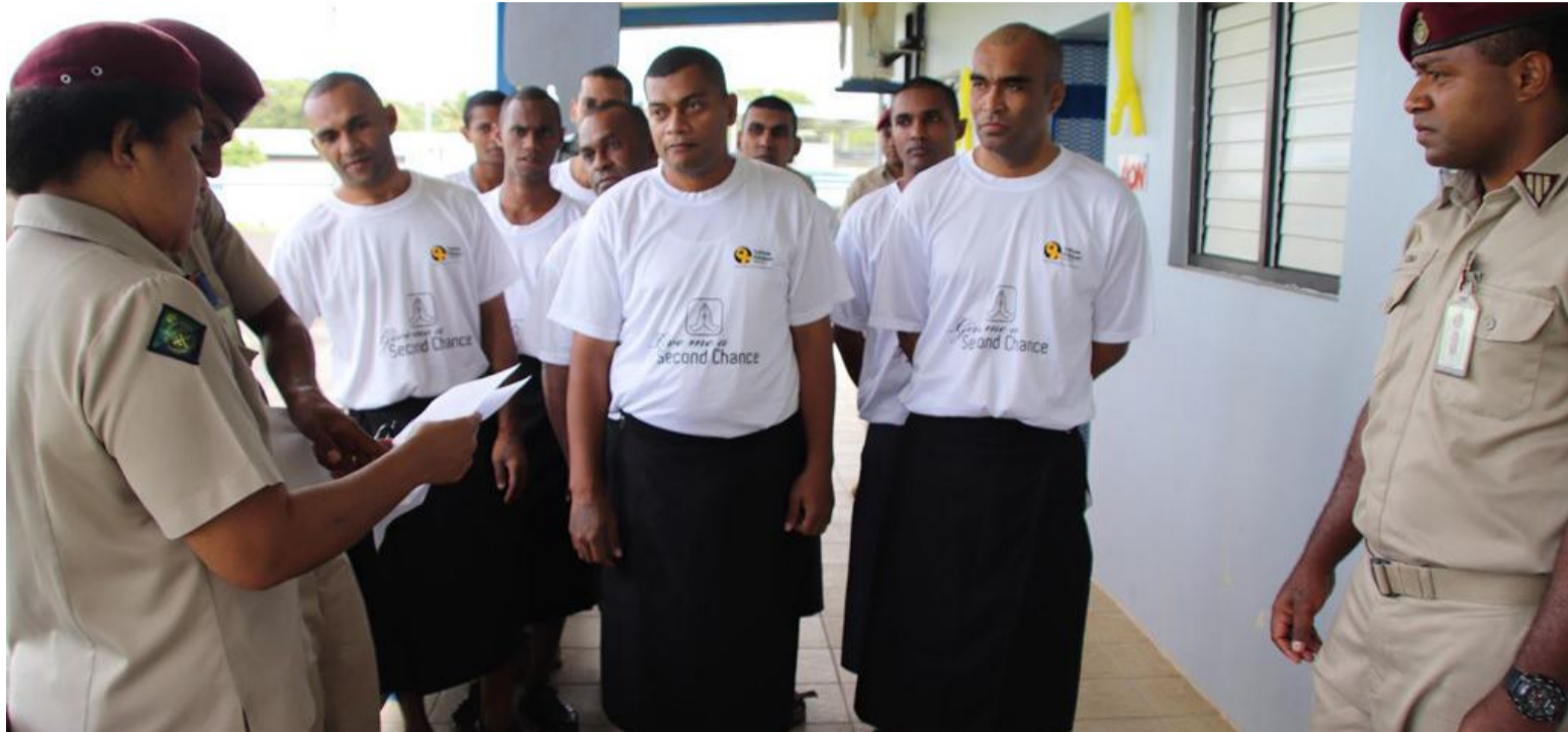
Eso vei ira na qaravi tiko ena porokaramu ni reveni dromodromo ena vanua ni veivakadodonutaki. iTaba: VAKARAUTAKI

E rauta ni 1843 na levu ni mita ni wai e qaravi tiko ena WAF mai Savusavu.