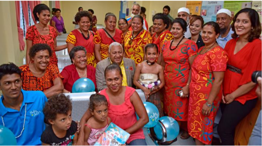
Ko Paraiminisita Voreqe Bainimarama ena nona laki dolava na valenibula vou e Nakasi se na Nakasi Health Centre. E na veiqaravi ena valenibula ogo e lewe rua na vuniwai kei na walu na nasi.