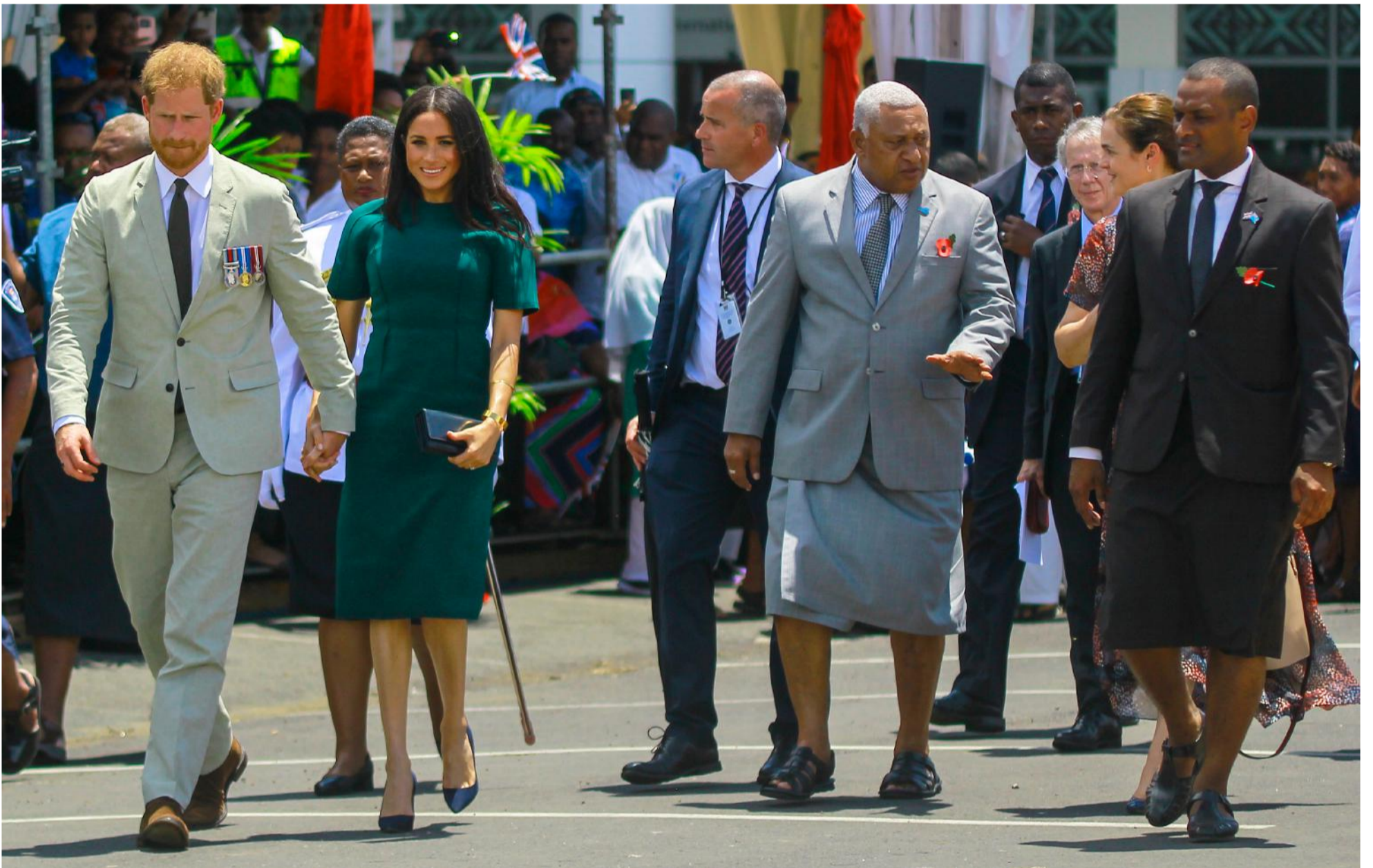
इंग्लेन्ड स्थित ससेक्स के नवाब या डियुक, राजकुमार हेरी और उनकी पत्नी मेगन माकल का फीजी में भव्य स्वागत किया गया जिन्होंने यहाँ तीन दिन बिताए तथा कई फीजीवासियों से मुलाकात की।