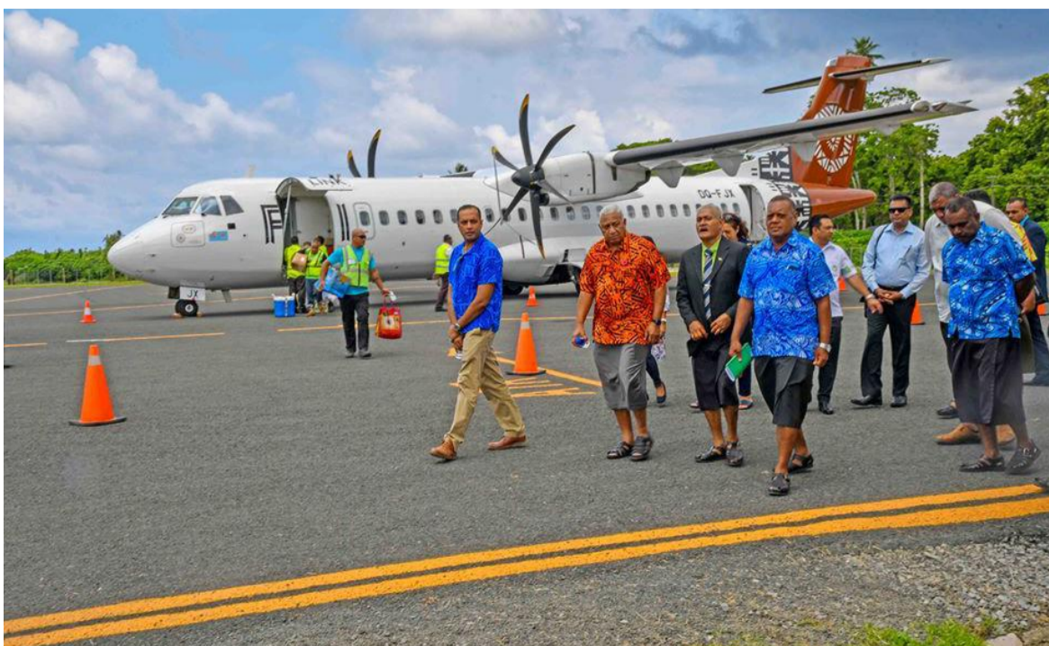
प्रधानमंत्री वॉरेन्गो बईनिमरामा रोटुमा के नए रनवेय का उद्घाटन के समय अन्य सरकारी अधिकारियों के साथ रनवेय का दौरा करते हुए।

इस बारह दशमलौ आठ मिलियन डॉलर वाली योजना पूरी होने में एक साल से कुछ ज़्यादा समय लगा।