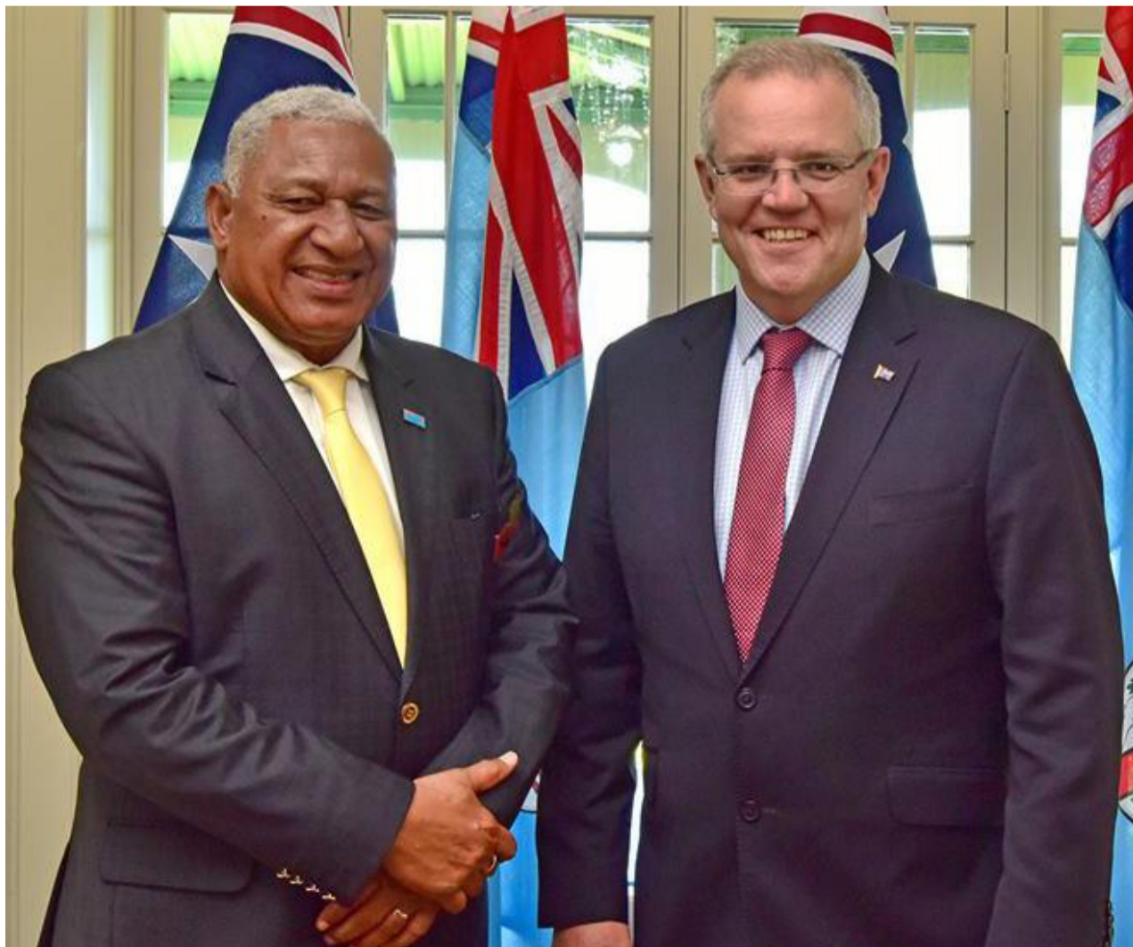
फीजी के प्रधानमंत्री वोरनो बर्डनिमरामा ने हाल ही में सिडनी के दौरे पर पहली बार ऑस्ट्रेलिया के प्रधानमंत्री श्री स्कॉट मोरिसन से मुलाकात की।