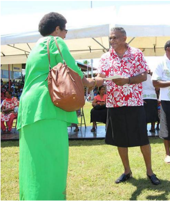
इंडस्ट्री, ट्रेड मंत्री फईयाज़ सिदिक कोया लम्बासा में छोटे और सुक्ष्म व्यापारी को एक हजार डॉलर का ग्रांट देते हुए।