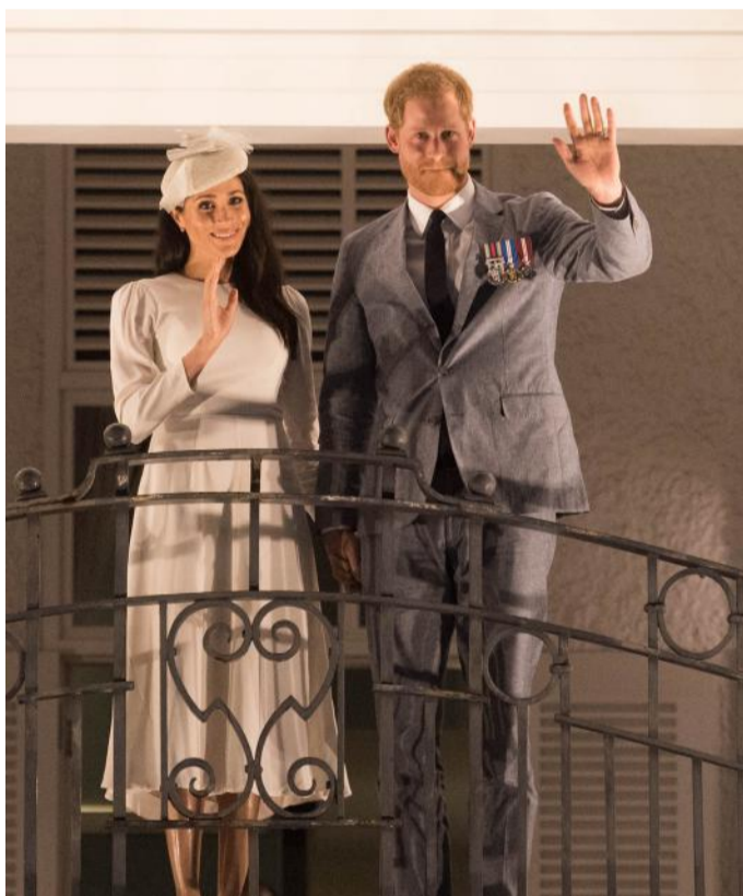
The Duke and Duchess of Sussex, Prince Harry and Meghan Markle wave to the crowd from the balcony at Grand Pacific Hotel in Suva.

The two royals tour continued for two more days after which they departed for Tonga.