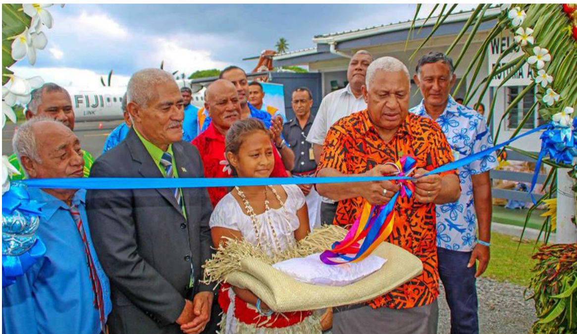
प्रधानमंत्री वॉरेन्गो बईनिमरामा रोटुमा के नए रनवेय का उद्घाटन करते हुए जिस योजना में बारह मिलियन डॉलर से ज़्यादा खर्च हुआ।