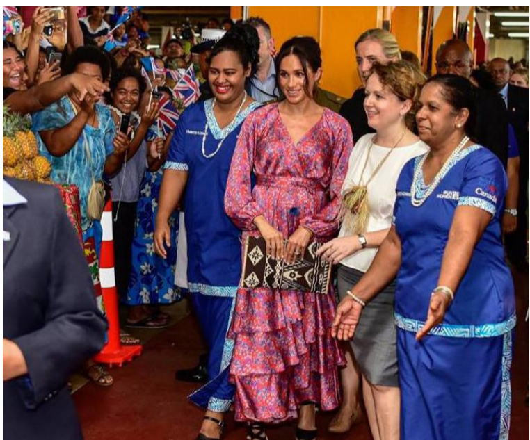
Na Duchess e Sussex ko Meghan Markle ena nona siko wavoki ena makete levu e Suva.