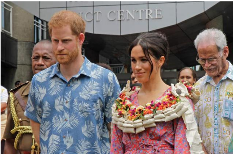
The Duke and Duchess of Sussex, Prince Harry and Meghan Markle at USP in Suva.