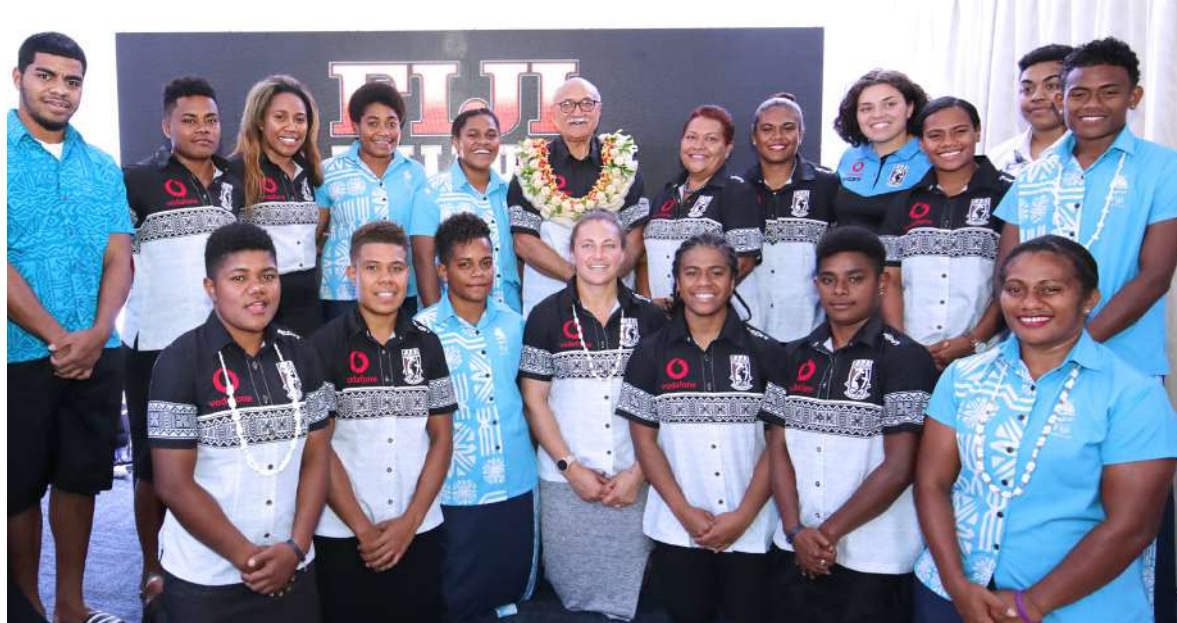
President Major-General (Ret'd) Jioji Konrote with female members of the Fiji Bulikula rugby league.

ning spree to win Gold Medal at the Pacific Games 2019 in Samoa and will partake in the prestigious Prime Ministers' XIII against Australia on the 11th October 2019.