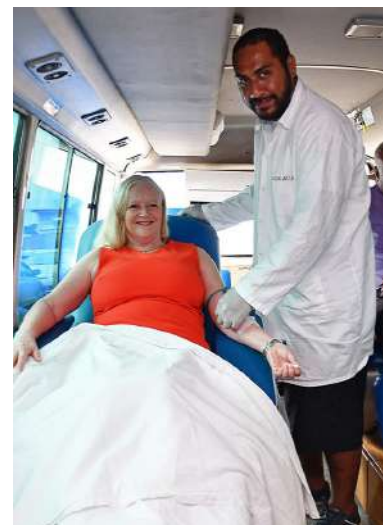
Sa ra vakauqeti na lewe ni vanua ena noda vanua me ra dau taura na nodra gauna mera laki soli nodra dra ki valenibula.