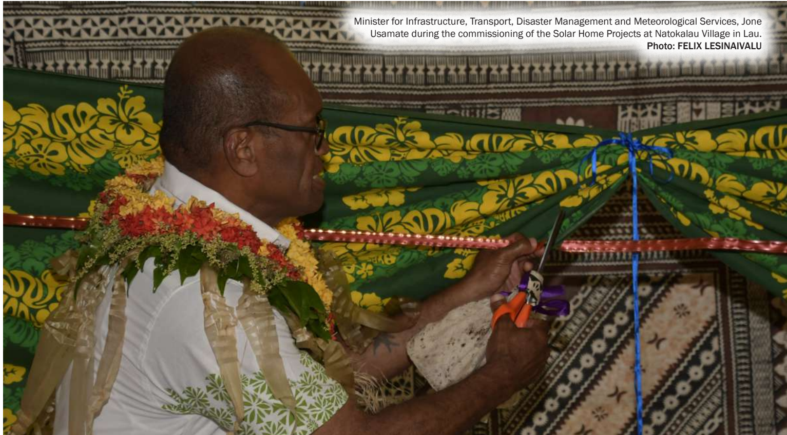
Minister for Infrastructure, Transport, Disaster Management and Meteorological Services, Jone Usamate during the commissioning of the Solar Home Projects at Natokalau Village in Lau.