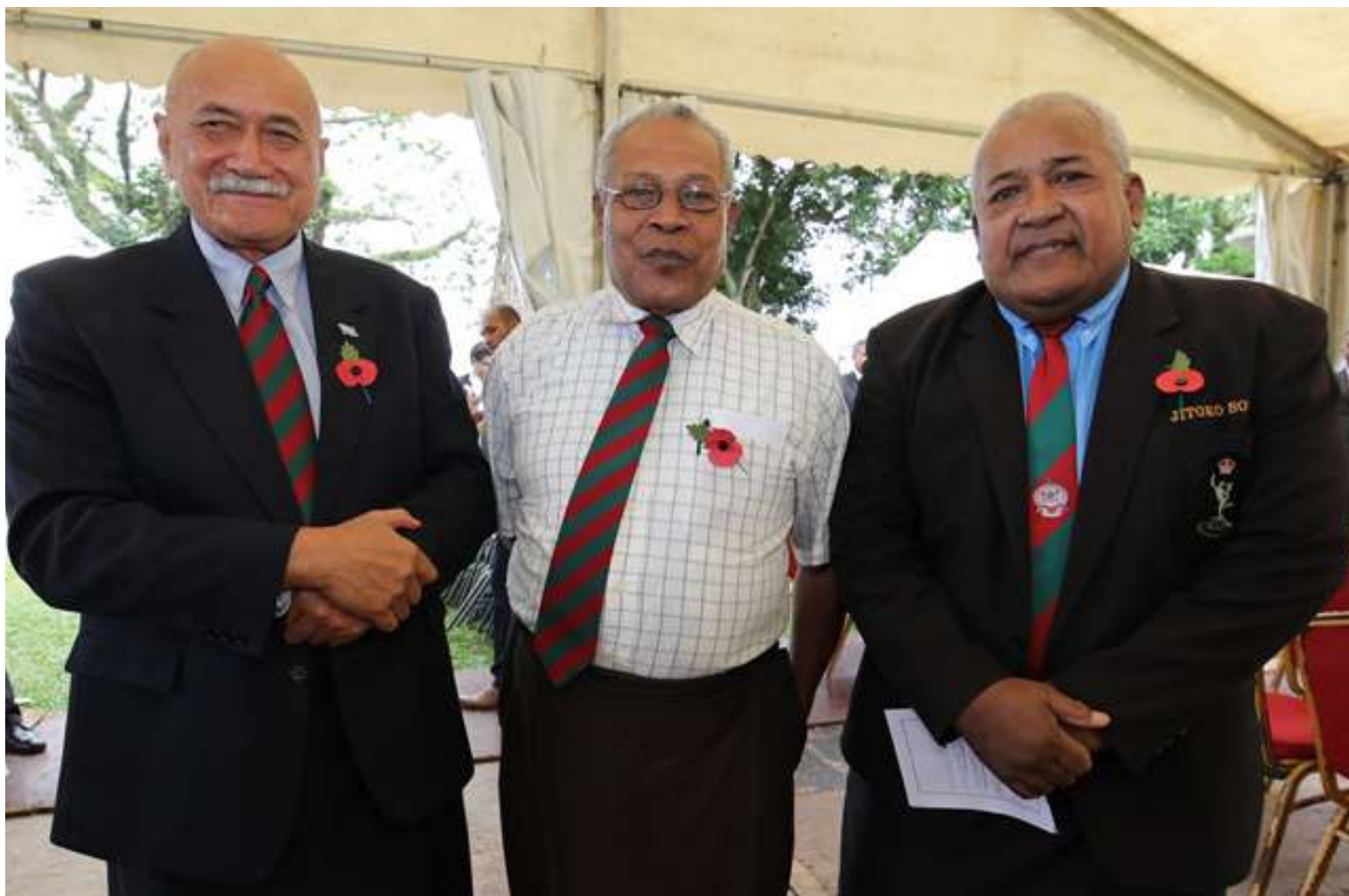
President Major-General (Ret'd) Jioji Konrote with retired servicemen during the Annual Poppy Appeal launch at Ratu Sukuna Park in Suva last week.