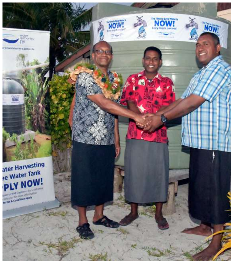
Nakeleyaga District School staff receives new tanks from Minister for Infrastructure, Transport, Disaster Management and Meteorological Services Jone Usamate.

“Another of Government’s aim is that by 2021 every household in Fiji should have access to electricity.”