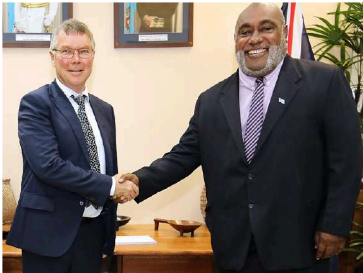
Na Paraiminisita Vakatawa e Viti o Semi Koroilavesau kei na Minisita ni Veivoli kei na Volitaki ivoli ni Niusiladi o David Parker.

O Niusiladi e ikarua ni vanua e vuravura me levu duadua kina na ilavo edau volivoli mai kina o Viti. Ena 2017 a vakayagataka kina o Viti e $403 na milioni na dola me voli mai kina na iyau e volitaka o Niusiladi.