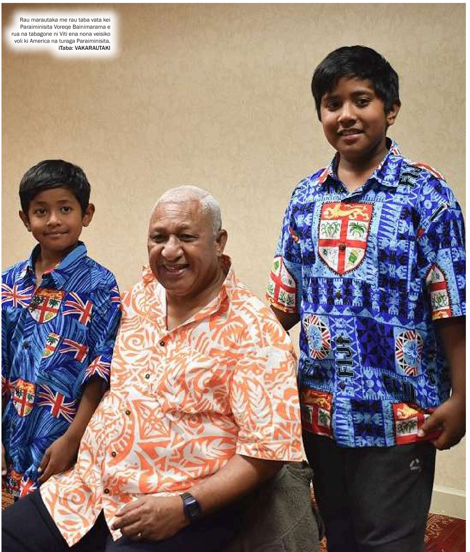
Rau marautaka me rau taba vata kei Paraiminisita Voreqe Bainimarama e rua na tabagone ni Viti ena nona veisiko voli ki America na turaga Paraiminisita.

“Era sa oca na itabagone na sarava tiko na nodra sega ni kauwaitaka na veivanua lelevu na vakacaca ni cagilaba ena nodra mata ni vale kara gadreva me vakayacori kina e dua na ka,”kaya o PM Bainimarama.