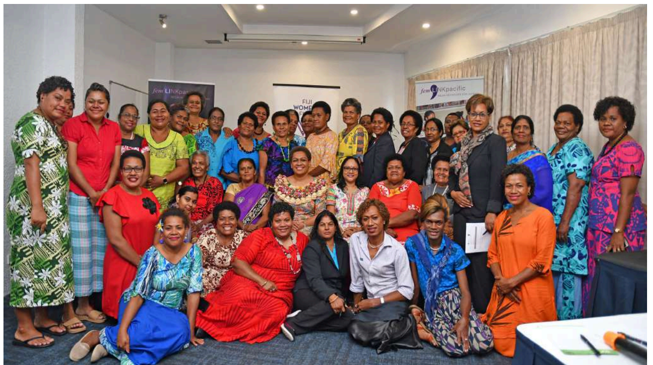
विमन मंत्री मेरेसईनी वुनिवांगा रूरल विमन लीडज़ कोमिउनिटी मिडिया नेटवोक के दौरान महिला नेताओं के साथ

“महिलाओं की आवाज़ खासकर ऐसी महिलाएं जिन्हें कम सुविधा प्राप्त है, को आगे तक पहुँचाना हमारी ज़िम्मेदारी है। हम चाहते हैं कि महिलाओं की आवाज़ सुनी जाए”। विमन मंत्री मेरेसईनी वुनिवांगा, रूरल विमन लीडज़ कोमिउनिटी मिडिया नेटवोक में बोल रही थी। मंत्री वुनिवांगा ने बताया कि पश्चिमी और उत्तरी विभागों में महिलाओं की अगुवाई में कोमिउनिटी मिडिया नेटवोक और मज़बूत करके अन्य जिलाओं तक पहुँचने की कोशिश सहरानिए है। “ग्रामीण इलाकों की महिलाओं की आवाज़ समाचार माध्यमों तक पहुँचनी चाहिए। इससे पता चलेगा कि दूर-दराज के इलाकों में महिलाएं किस तरह की समस्याओं का सामना कर रही हैं। सालों से फीजी में महिलाओं के खिलाफ हिंसा एक व्यक्तिगत मामला था - महिलाएं चार दिवारों के अन्दर सब कुछ चुप-चाप सहती थीं”। मंत्री ने बताया कि कानून और नीतियों में बदलाव करके और महिलाओं की आवाज़ बुलन्द करने से यह पता चला है कि किस तरह की मुसिबतें महिलाएं सहती थीं। “हमें आवाज़ और तेज़ करने की ज़रूरत है ताकि महिला पुरुष भेद-भाव उखाड़ फेंका जाए तथा महिलाओं और लड़कियों को सशक्त किया जाए। दुनिया भर में प्रशांत क्षेत्र में महिलाओं के खिलाफ हिंसा की दर सब से ज्यादा है। ऐसा अनुमान है कि