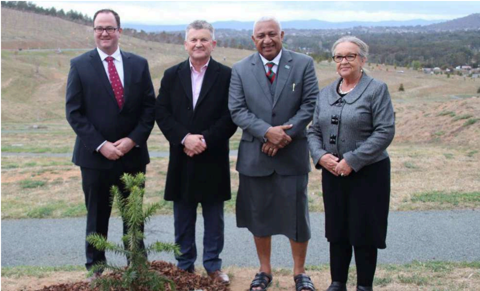
प्रधान मंत्री वॉरेनो बडिनिमरामा ने केंब्रा ओस्ट्रेलिया में फीजी और ओस्ट्रेलिया के दिवंगत सुरक्षा बलों की याद में एक वृक्ष बोया