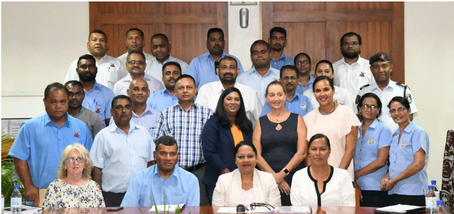
Minister for Local Government, Premila Kumar with management of Lautoka City Council and Ba Town Council, and their new special administrators board.

With a growing population, the council spends at least $310,000 annually on garbage collecting services, while an average of $400,000 is spent annually on the Vunatu Landfill.