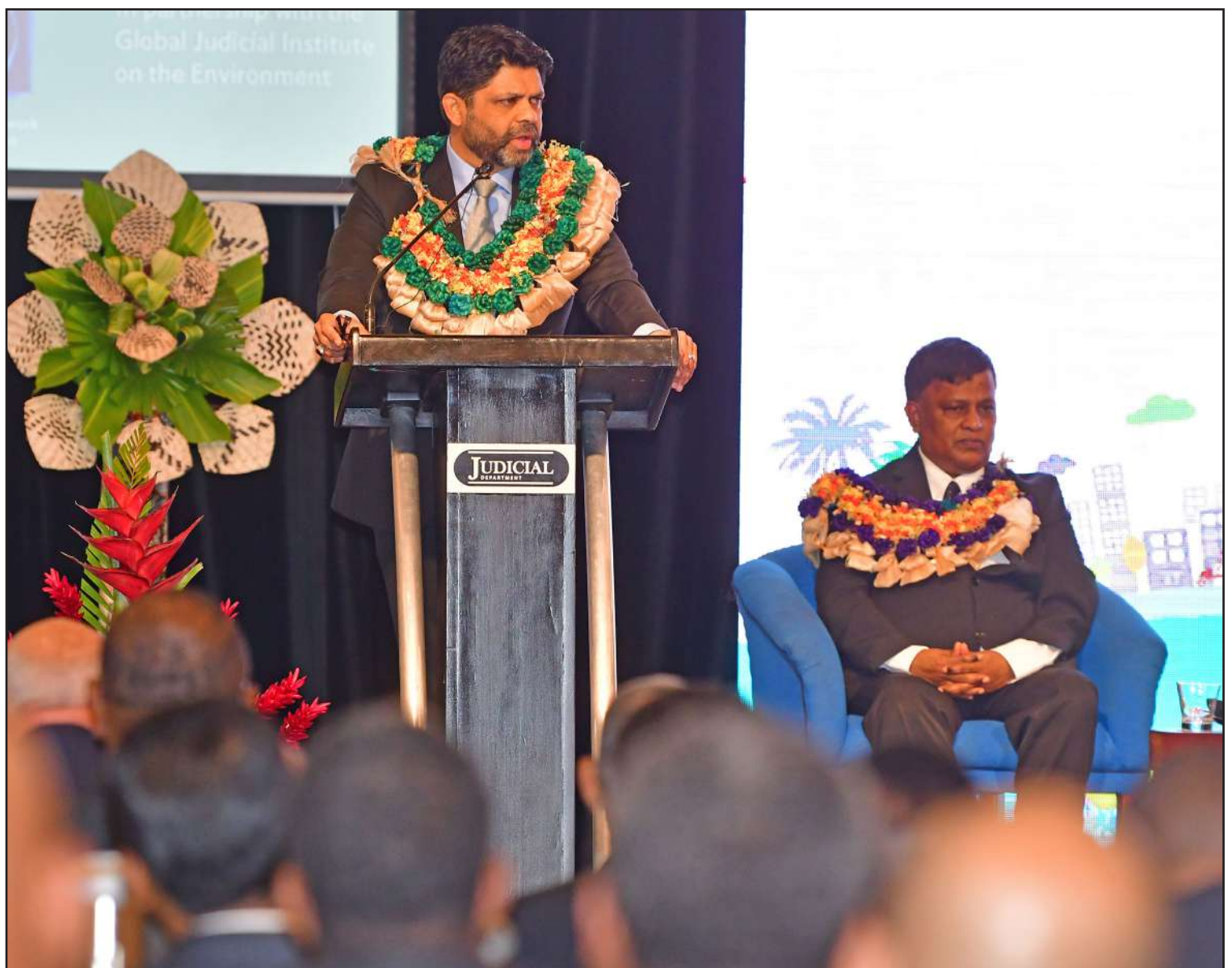
Minister responsible for Climate Change, Attorney-General Aiyaz Sayed-Khaiyum during the Asia-Pacific Judicial Conference on Environmental and Climate Change Adjudication in Nadi.

“As we reflect and celebrate our progress since independence in 1970 – around 49 years on, we will once again be dressed in our national colours, proudly waving the national flags and enjoy a fun filled day to remember.”