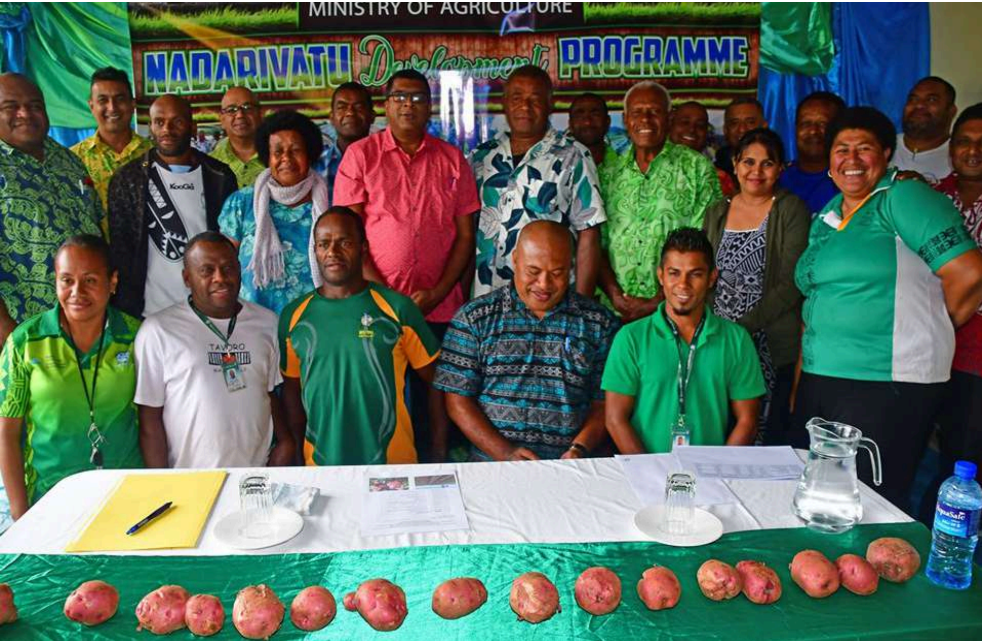
Era tuva tu oqori e matadra na i vakalesilesi ni tabana ni iteitei kei Minisita ni Teitei Dr Mahendra Reddy na pateta damudamu ka cavu mai e Nadarivatu.