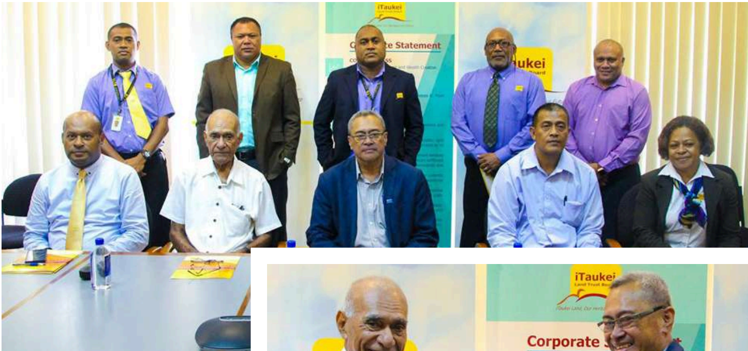
Ko ira na ivakalesilesi ecake ena Matabose ni Qele Maroroi ena nodra bousei na veika bibi baleta na qele.

NATA: Na levu taucoko ni lisi ni Matabose