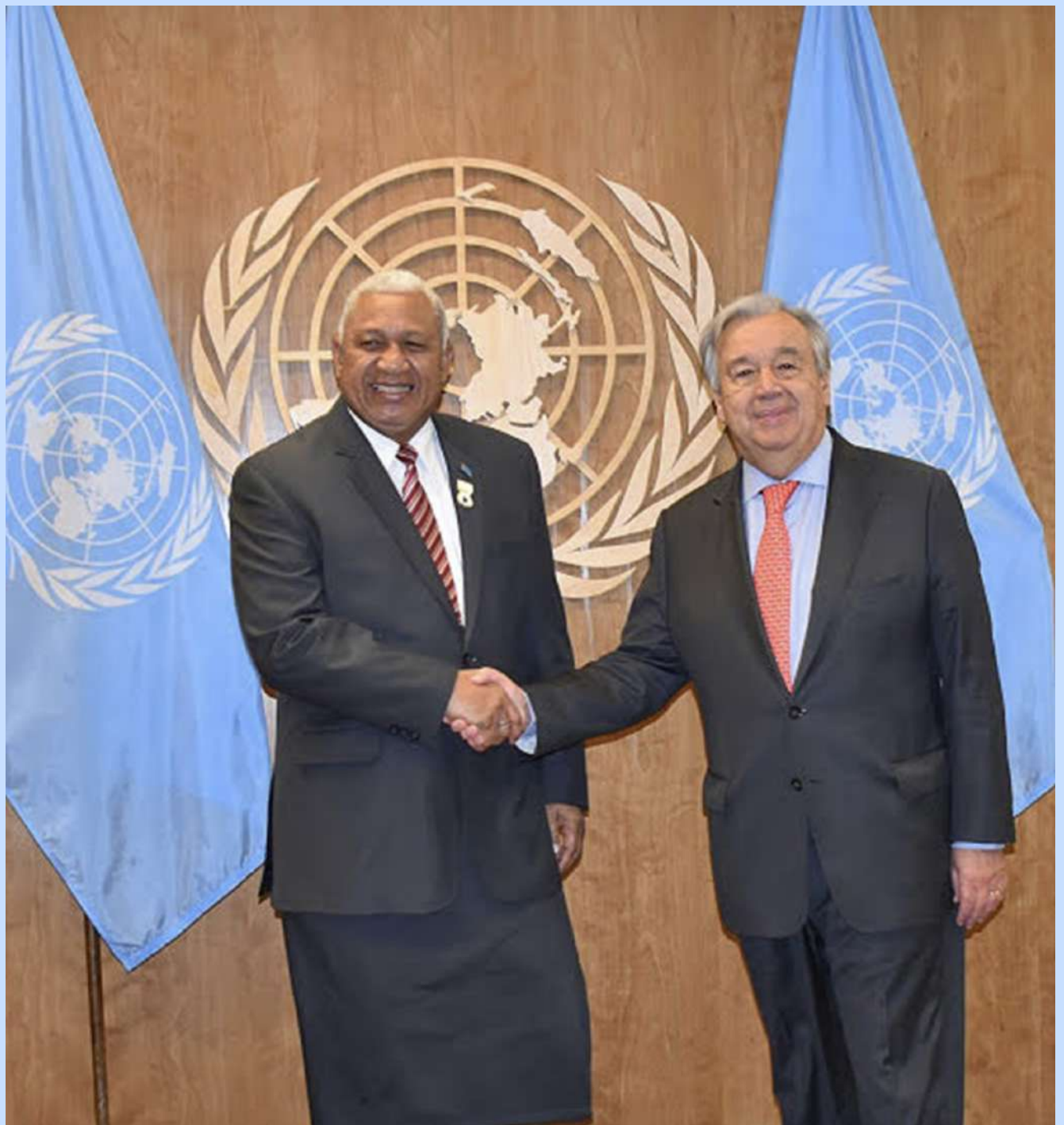
युनायटेड नईशन्स जेनरल असेम्बली के दौरान प्रधान मंत्री वीरेन्द्रो बड़निमारामा, युनायटेड नईशन्स के सेक्रेटरी जेनरल एनटोनियो गुटेरेज़ के साथ

लॉन्च के दौरान नॉर्वेय के राजकुमार महामहीम हाकुन मेगनस और प्रशांति देशों के कुछ नेता उपस्थित थे। ट्रस्ट फण्ड स्थापित करने में नॉर्वेय का बड़ा हाथ था।