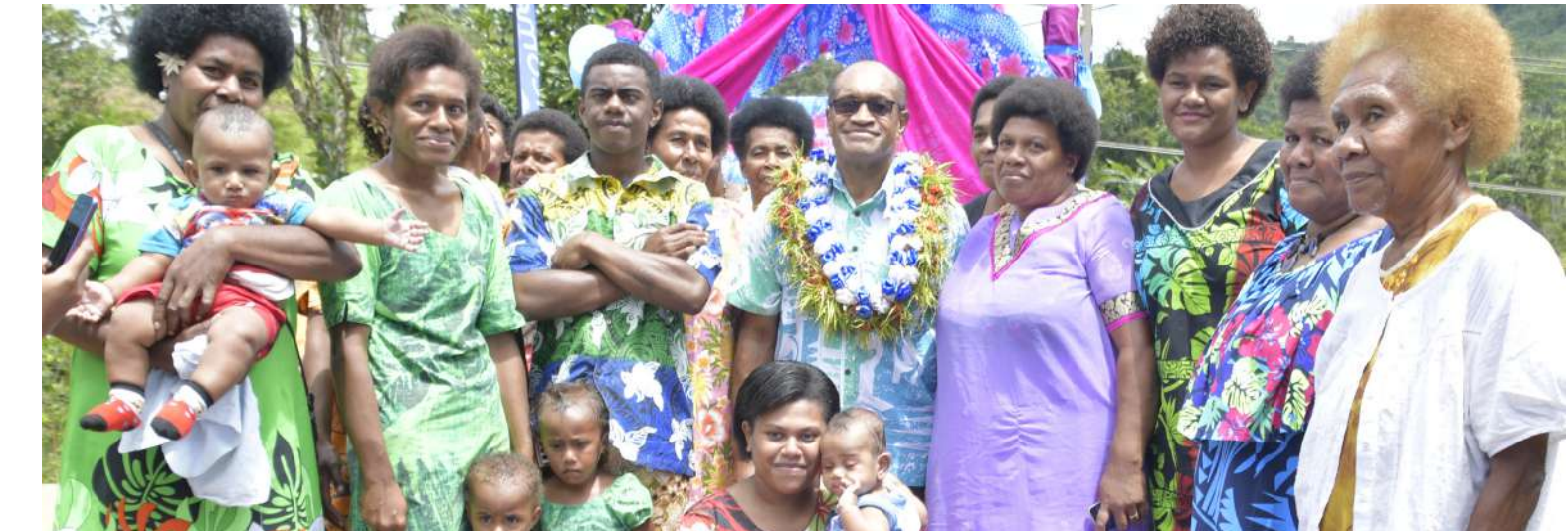
Ko Minisita Jone Usamate kei ira na marama ni itikotiko vakagalala e Dreuleba ena Yavusa ko Navunitivi e Naitasiri. Photo: ??

“E kaya vakaoqo na iVola Tabu ena Same raica na kena mata vinaka nira sa tiko vaka lomavata na veiwekani... na ilumuoya e