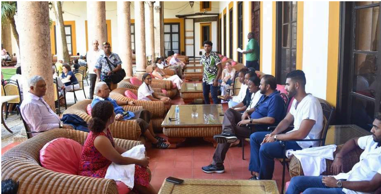
Era veitalanoa tiko oqori na gone ni Viti vuli vuniwai mai Cuba kei Paraiminisita Voreqe Bainimarama.

Na ivalu na Spanish American War ni 1898 sa mani tawani Cuba kina o USA ka qai mai tuvakataki koya ena 1902.