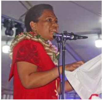
Minister for Women, Children and Poverty Alleviation Mereseini Vuniwaqa during the Vodafone Hidden Paradise Savusavu Carnival.