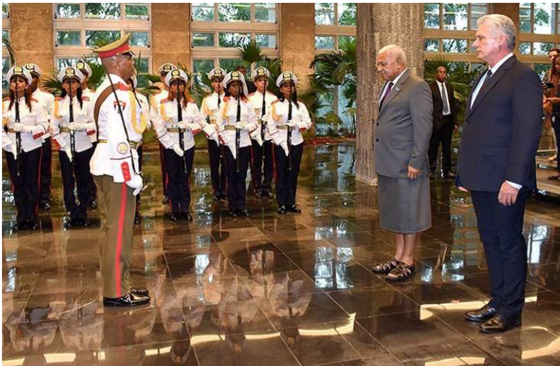
Prime Minister Voreqe Bainimarama with Cuban President Miguel Diaz-Canel during his visit to Cuba last week. Prime Minister Bainimarama is the first Fijian Head of Government to visit Cuba on an official state visit.