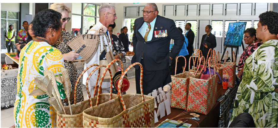
The President, Ratu Wiliame Katonivere visits the exhibition which was part of the Ratu Sukuna celebrations at Albert Park pavilion.

The celebrations at Albert Park concluded with entertainment from the various cultural groups.