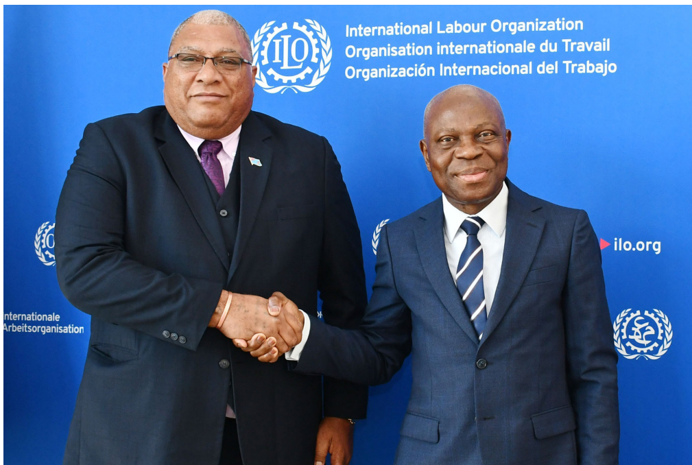
Fiji's President, Ratu Wiliame Katonivere met with the International Labour Organization's Director-General, Gilbert Houngbo in Geneva, Switzerland on the margins of the the 111th Session of the International Labour Conference.