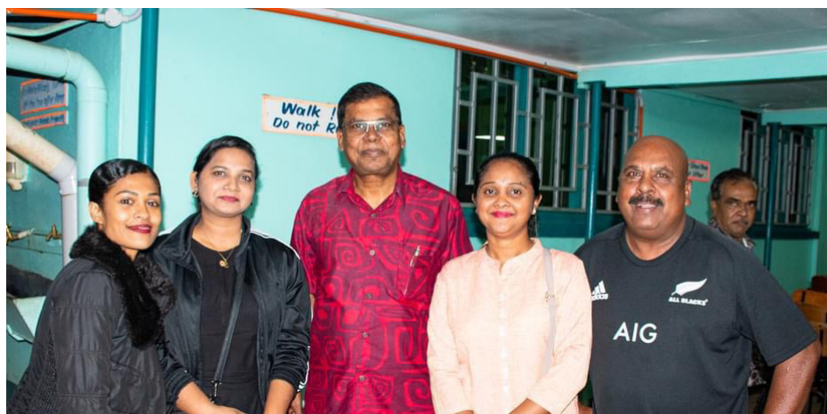
Deputy Prime Minister and Minister for Finance, Professor Biman Prasad with members of the public at the Vunimoli budget consultation held in Labasa recently.