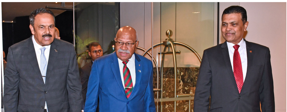
Prime Minister Sitiveni Rabuka attended a New Zealand-Fiji Business Council breakfast event during his recent State visit to New Zealand.

“I assure you that the Coalition Government is serious about making your investment in Fiji worthwhile by cutting through the bureaucracy and red tape.”