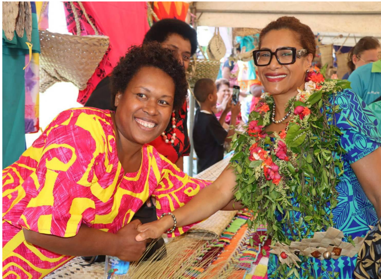
The Minister for Women, Children and Poverty Alleviation, Lynda Tabuya attends the Kadavu Women's Expo at Namalata Primary School earlier this month. The Ministry will undergo a name change with "Social Protection" to replace "Poverty Alleviation".

iii. de jure laws and regulations and de facto practical implementation; and