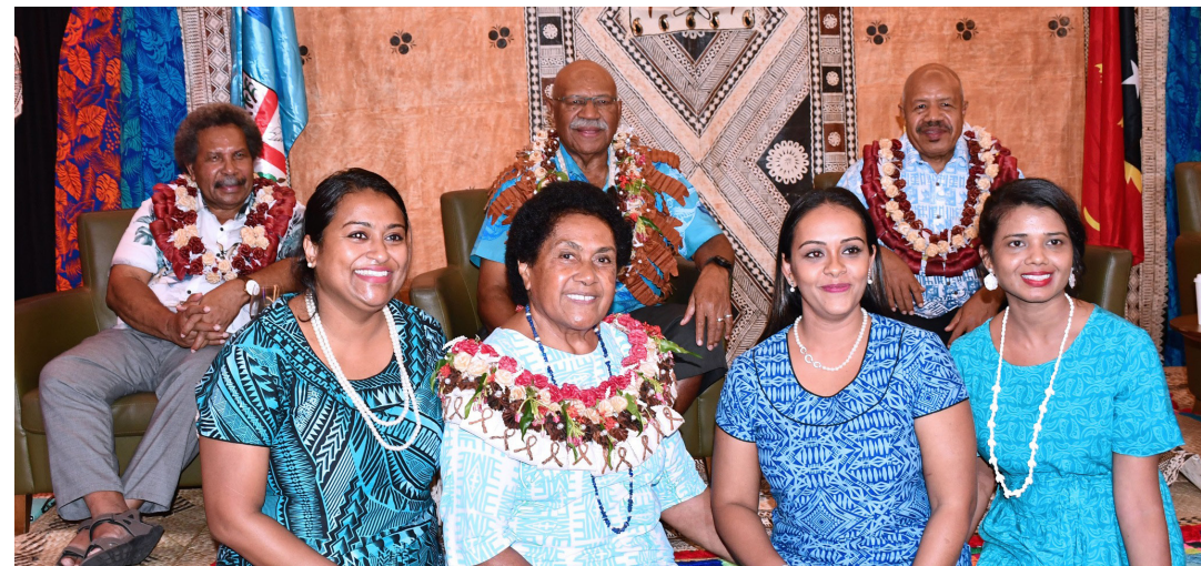
Prime Minister Sitiveni Rabuka held a talanoa session with the Fiji community during a visit to Port Moresby, Papua New Guinea last month.

Cabinet agreed that the re-opening of three Embassies in Kuala Lumpur, Port Moresby and Washington, and the establishment of a new Embassy in Israel, be considered in the 2023 – 2024 national budget.