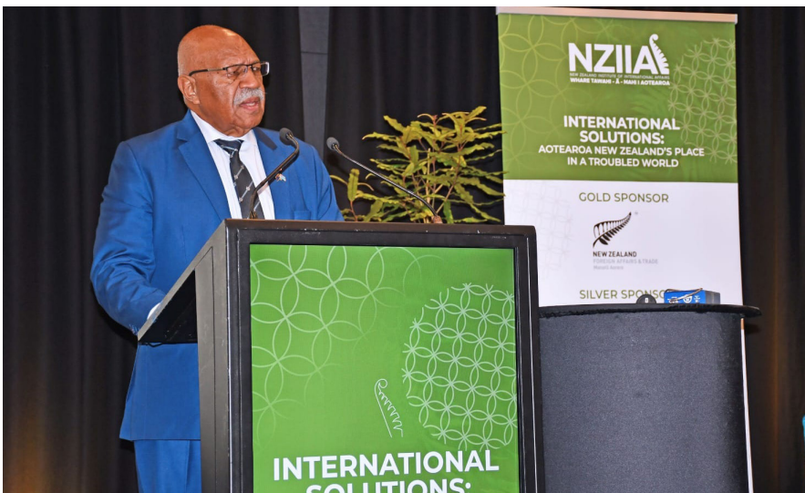
Prime Minister Sitiveni Rabuka spoke to members of the New Zealand Institute of International Affairs in Auckland during his recent State visit to New Zealand.

PRIME Minister Sitiveni Rabuka addressed members of the New Zealand Institute of International Affairs in Auckland recently where he emphasised the need to strengthen our international relations.