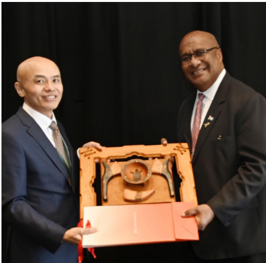
Deputy Prime Minister and Minister for Trade, Co-operatives, Small and Medium Enterprises, and Communications, Manoa Kamikamica, with Asia Pacific Telecommunity Secretary-General, Masanori Kondo, during the 23rd Asia-Pacific Telecommunity (APT) Policy and Regulatory Forum that Fiji hosted recently.

“We have identified Rotuma, a volcanic island of approximately 43 square kilometers with less than 2000 people and located 590km from Nadi – for this initiative. I am excited to see the innovative approach to deliver connectivity and new ICT-enabled services to one of our smaller maritime