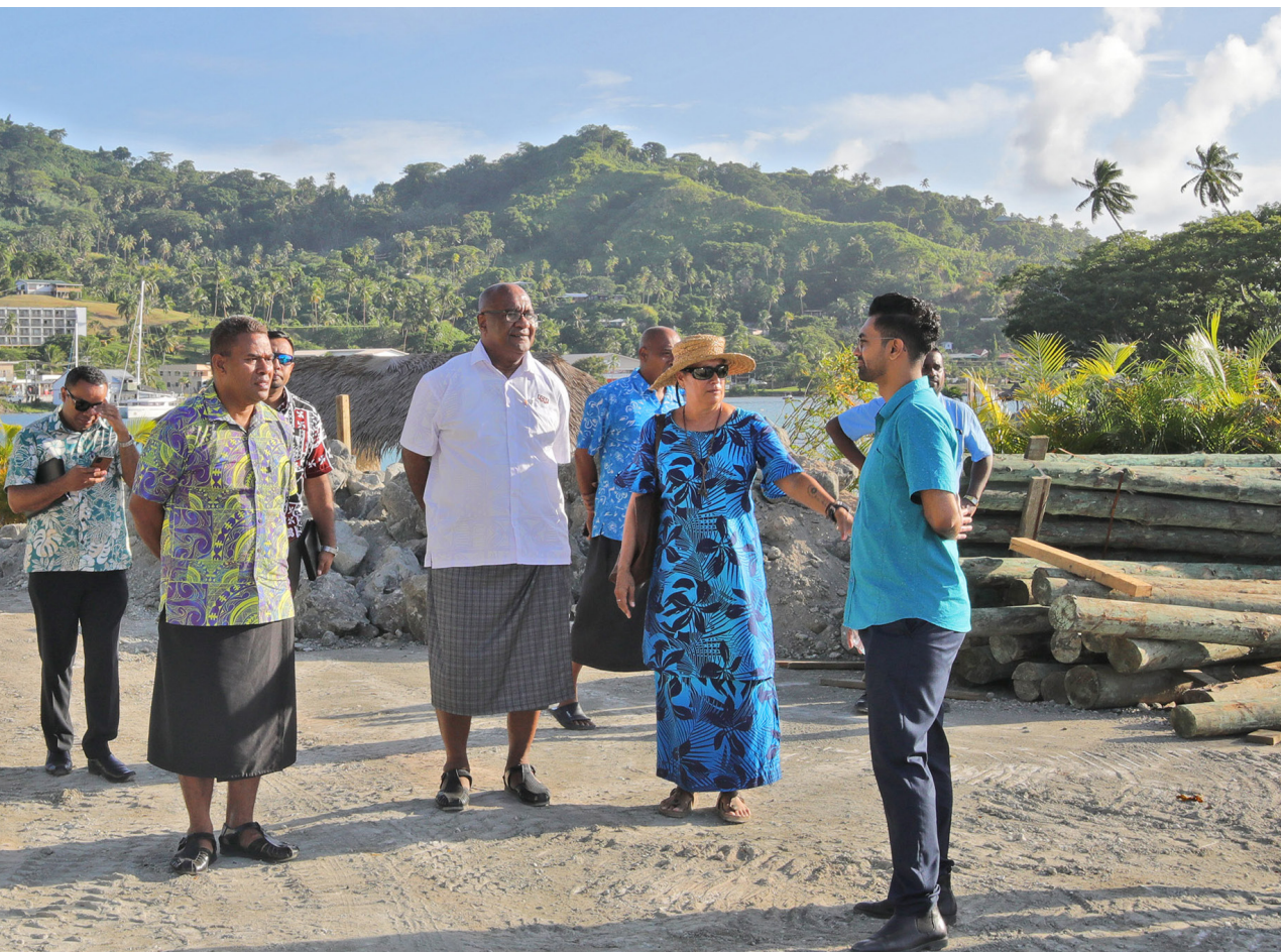
Deputy Prime Minister and Minister for Trade, Cooperatives, Small and Medium Enterprises and Communications, Manoa Kamikamica visited tourism projects during a tour to the Northern Division recently.