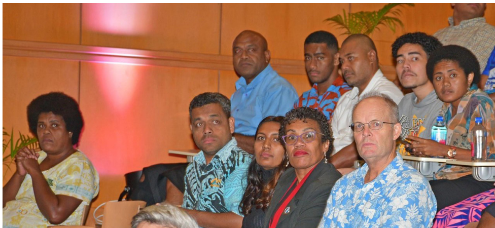
Audience at a public lecture on Ratu Sir Lala Sukuna at the University of the South Pacific held recently.