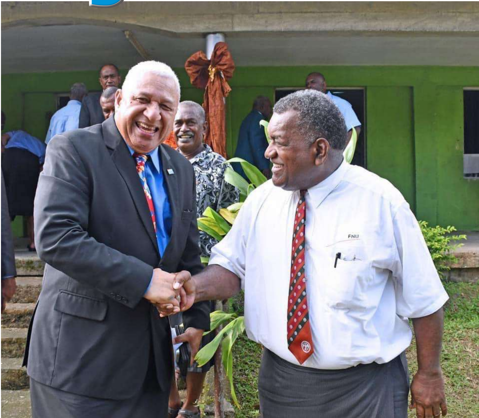
Prime Minister Voreqe Bainimarama with a council member at the Nadroga/Navosa Provincial Council Meeting held at the Nasigatoka Village Hall in Sigatoka.