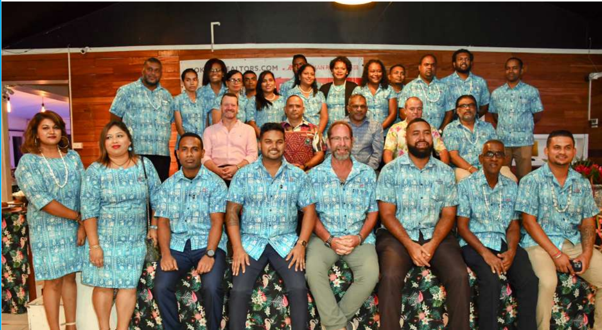
Minister Faiyaz Koya during the reception at Jokhan Realtors Pte reception

"We've endured a once in a lifetime pandemic. We've lived through natural disasters. And through it all – we've shown resilience."