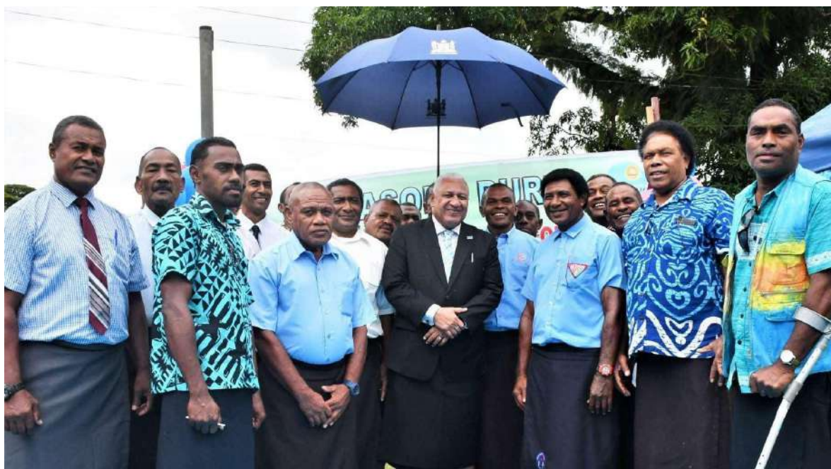
Prime Minister and Minister for iTaukei Affairs, Voreqe Bainimarama with the District representatives during the Cakaudrove Provincial Council meeting.

“The Government has also spent more than $7 million on water and sanitation and through Energy Fiji Limited we spent over $2 million on grid extensions and dedicated more than $3 million to provide more effective assistance to welfare recipients in