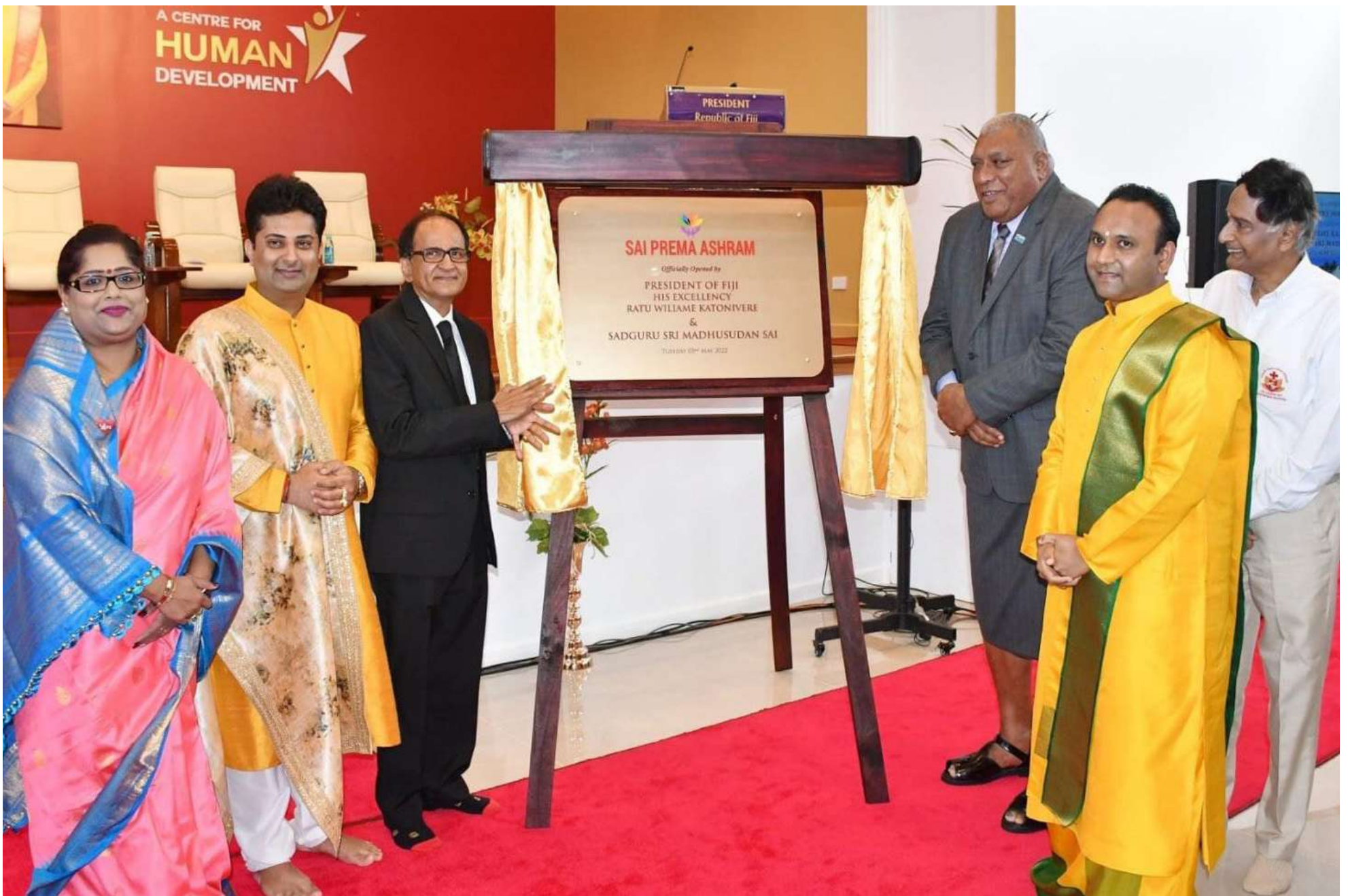
The President, Ratu Wiliame Katonivere, and members of the Sai Prema Foundation at the opening of the Sai Prema Ashram in Navua this week.