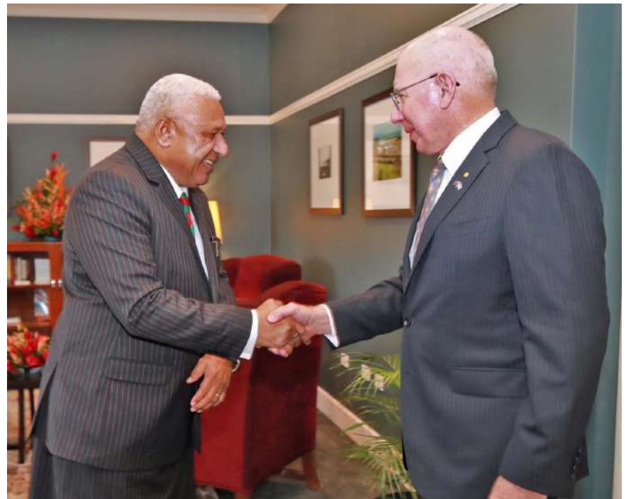
Prime Minister Voreqe Bainimarama meets the Governor General of Australia David Hurley in his office.

Prime Minister Bainimarama said that Fiji was grateful for Australia's assistance in the recently commissioned Black Rock camp in Nadi, which was a demonstration of Australia's commitment to the advancement of regional defence and security, with opportunities for deeper engagement in humanitarian services and capacity building in