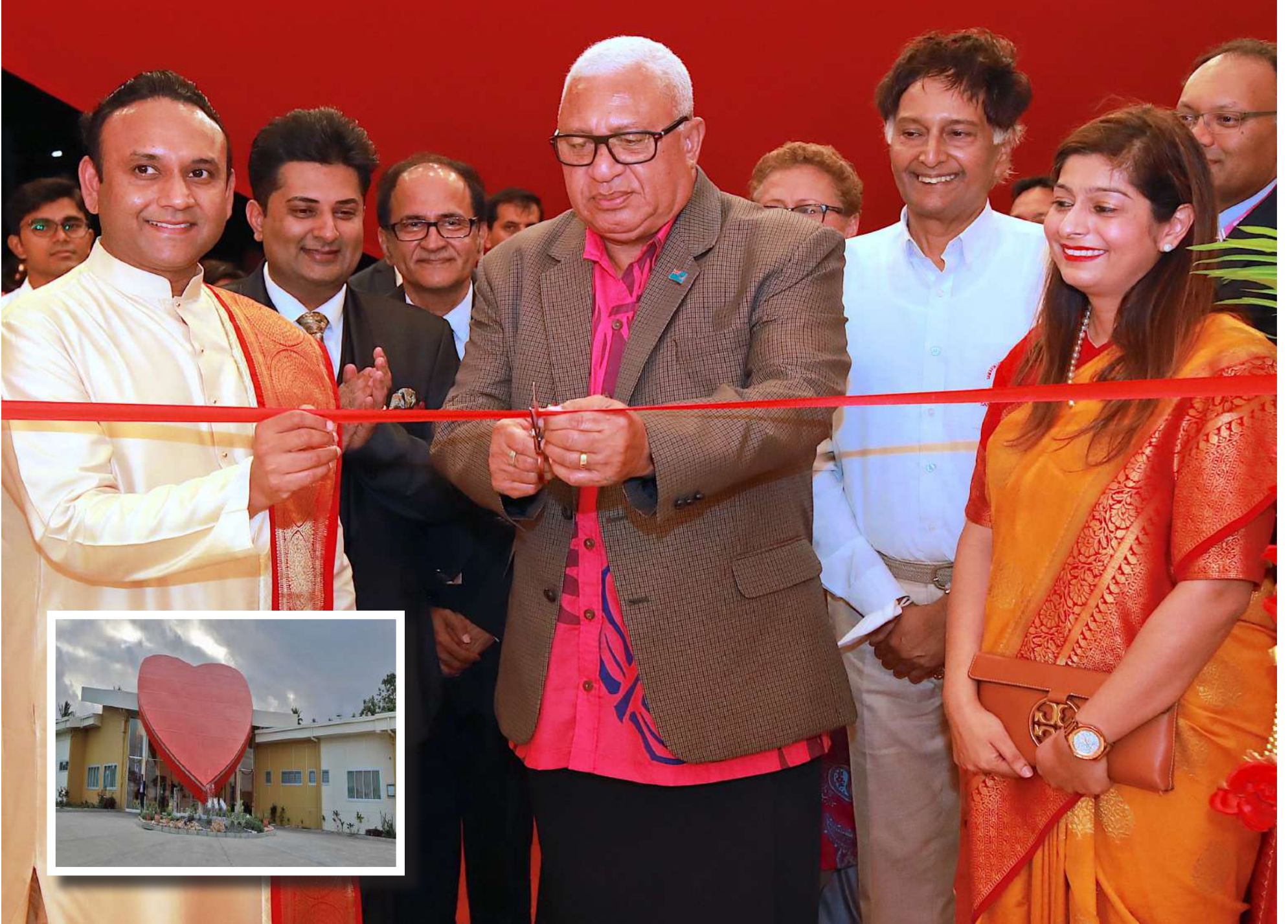
प्रधान मंत्री वॉरेन्गे बईनिमरामा हालही में मुआनिकाउ रोड सूवा स्थित श्री सत्य साई संजीविनी बच्चों के अस्पताल का उद्घाटन करते हुए