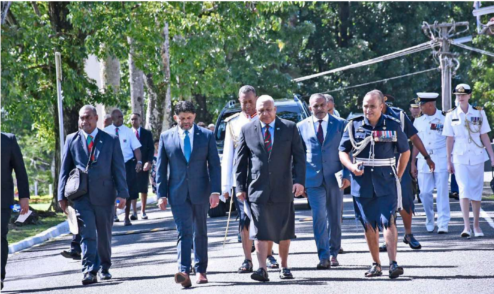
NA NODA PARAIMINISITA KEI NA NODA VUNI LAWa E NA SOQO KA VAKAYACORI E NA KEBa NI MATAIVALU E DELAINABUA.

E vakayacori na veisau-taki ni tutu ni veiliutaki vakamataivalu ni noda vanua ena dua na lotu mai na Queen Elizabeths Barrack ena siga tabu 1 ni siga ni vula ko Me 2022. Era mai talaci kina vakadua na liulu ni mataivalu vakacegu ko Komada Rear-Admiral Viliame Naupoto ka ra mai kidavaki talega kina na liuliu vou nu mataivalu ena noda vanua Major-General Jone Kalouniwai. Era tiko talega ena lotu oqori na Paraiminisita Voreqe Bainimarama, Vunilawa Aiyaz Sayed-Khaiyum, Minisita ni Veitaqomaki keina Leqa Tubu Koso Inia Seruiratu kei ira na minisita ni matanitu vakakina oira na ivakalesilesi ni mataivalu ena gauna oqo kei ira eliu. Oti na lotu e qai vakayacori edua na veiqaravi vakavanua vua na Komada vou Major-General Kalouniwai kei ira na nodra matavuvale. Era vakavinakataki Komada Naupoto ena nodra veiqaravi voli mai ena loma ni lima na yabaki vakabibi na kena maroroi na lawa ni noda vanua.