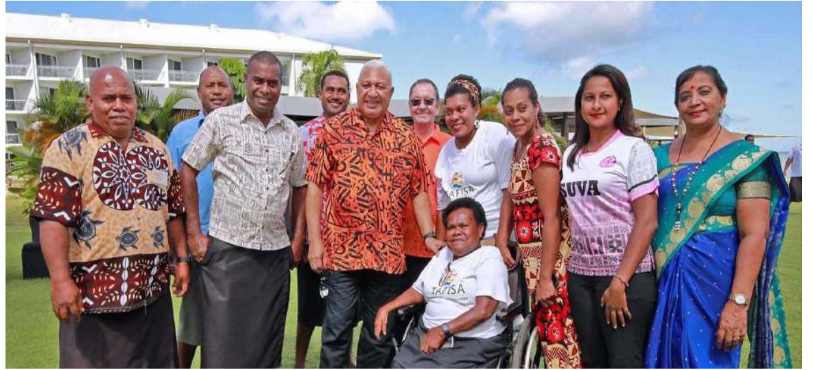
Prime Minister Voreqe Bainimarama with participants of the Community Sports Association conference.

"We've lifted, punched, swam, and ran our way to big wins in the South Pacific Games, Oceania Championships, And Commonwealth games. We've hosted tournaments in everything from chess, hockey and