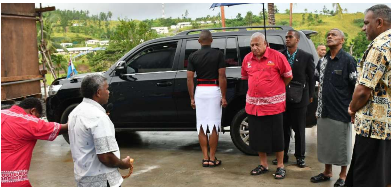
Prime Minister Voreqe Bainimarama arrives for the commissioning of the Nabouwalu Fire Station.