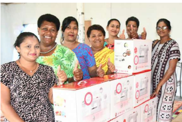
Members of the Sew True Women's Club in Nasinu after receiving the sewing machines from the Minister for Women, Children and Poverty Alleviation, Rosy Akbar.

"This sewing machines will help generate income to our women members and also their individual families. Our seventeen women members also thanked the support and commitment of the Fijian Government on Women Economic Empowerment Program to the rural and urban communities in Fiji".