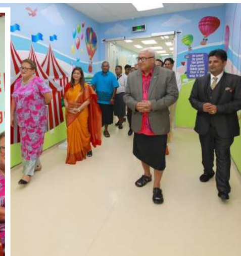
Prime Minister Voreqe Bainimarama with members of the Sai Prema Foundation during the opening of the Sri Sathya Sai Sanjeevani Children's Heart Hospital Fiji in Muanikau Road in Nasese.