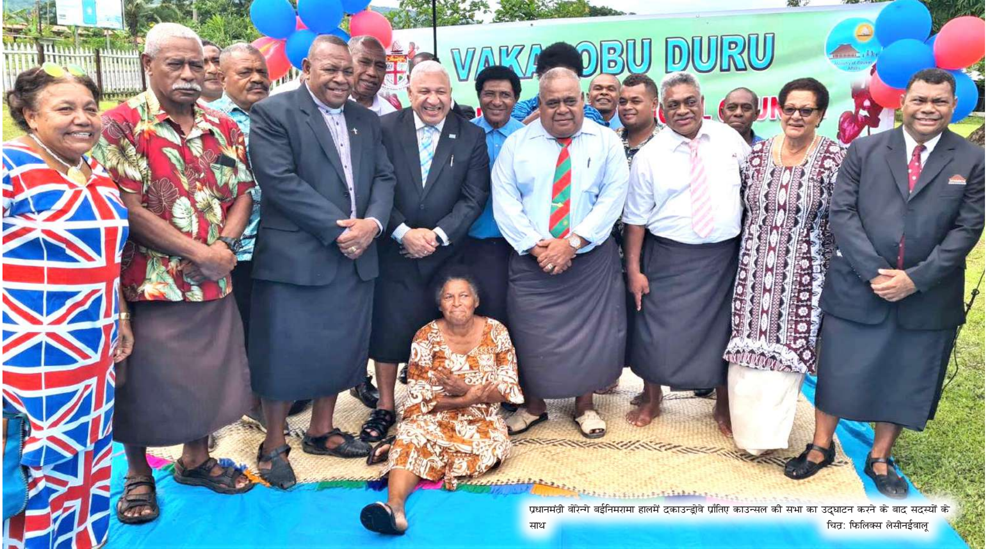
प्रधानमंत्री वॉरेन्गे बर्दिनमरामा हालमें दकाउन्ड्रोवे प्राँतिफे काउन्सल की सभा का उद्घाटन करने के बाद सदस्यों के साथ