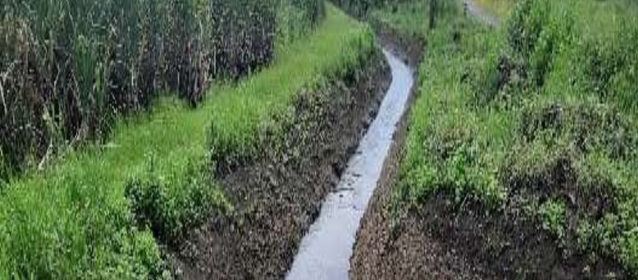
हालही में वोटवैस मंत्रालय ने इस नाले को साफ और चौड़ा किया