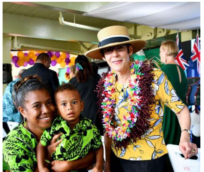
The wife of the Australian Governor General, Linda Hurley, with a market vendor at the Nausori Market during the opening of the women's accommodation centre.

The ground floor has been made an open area that will be used to host vendors who were otherwise selling outside or from under temporary tents.