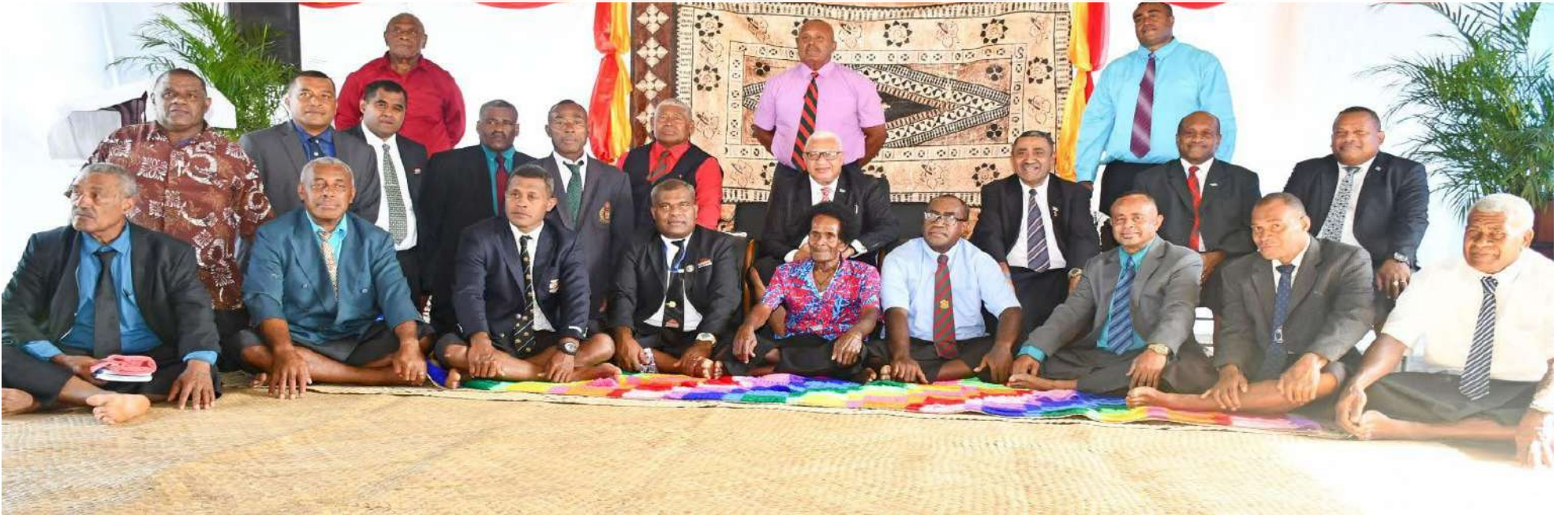
प्रधान मंत्री वॉरेन्गे बईनिमरामा हालमें नमोसी प्राँतिफ काउन्सल की सभा का उद्घाटन करने के बाद काउन्सल के सदस्यों के साथ