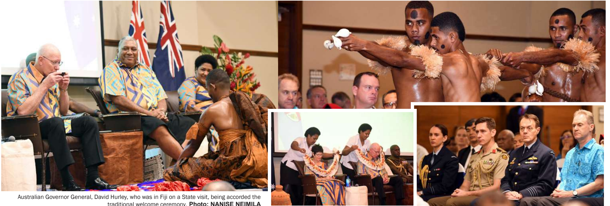
Australian Governor General, David Hurley, who was in Fiji on a State visit, being accorded the traditional welcome ceremony.