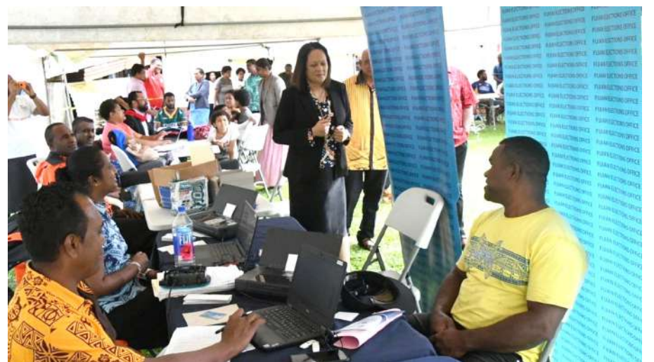
Minister for Women, Children and Poverty Alleviation Rosy Akbar during the Ministry visit to Tavua with other stakeholders.