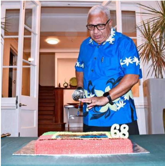
E musuka tiko qori na nona keke na noda Paraiminisita o Josaia Voreqe Bainimarama