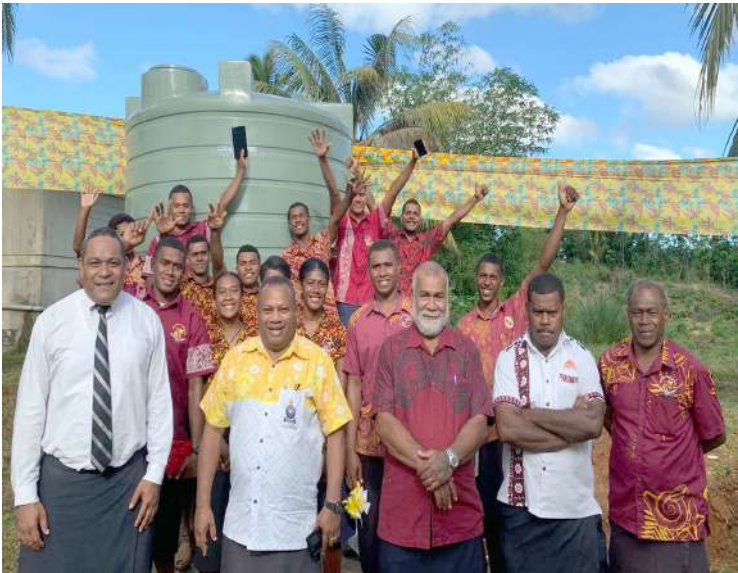
Minister for Rural and Maritime Development and Disaster Management Hon. Inia Seruiratu with officials and students of Navuso Technical College in Naitasiri.

THE provision of a 10,000 litres water tank for the Navuso Technical College in Naitasiri was expected to address some water woes that had been faced by the school for some time. The project was made possible through funding under the Ministry of Rural and Maritime Development and Disaster Management’s Self-Help