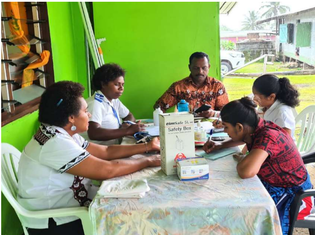
Era veiqaravi tale ga e na Bose ni Yasana ko Cakaudrove o ira na ivakalesilesi ni Tabana ni Bula.

Vakaraitaka tiko na tikina oqori ko Paraiminisita Bainimarama ena nodra laki dolava na boseka ni Cakaudrove Provincial Council se boseka ni yasana ko Cakaudrove.