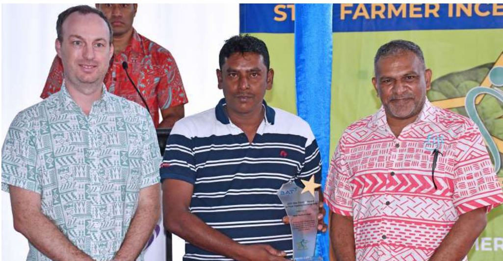
Minister for Commerce, Trade, Tourism and Transport, Faiyaz Koya at the British American Tobacco Awards Ceremony