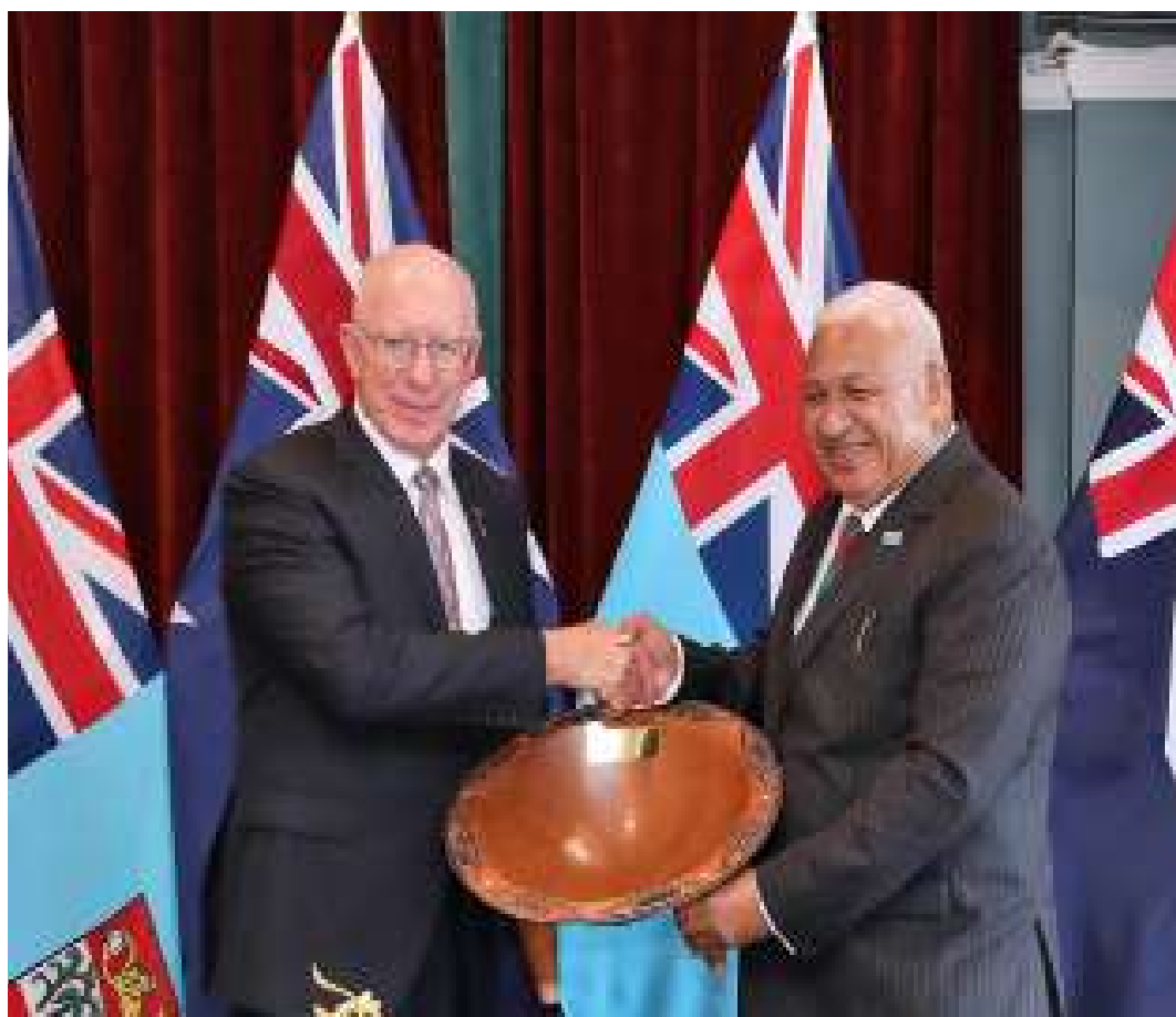
Na Kovana mai Ositerelia kei na noda Parainimisita.

ka vakaraitaka toka kina na kauwai ena tabana ni veitaqomaki. Vakaraitaka talega ko PM Bainimarama na nodra vakavinaka vei GG Hurley ena vukui Ositerelia kei na nodra veivuke ena loma ni Pacific Forum se Matabose ni veimatanitu ena Pasivika. Vakaraitaka ko GG Hurley na nodra vakavinaka vua na matanitu ko Viti ena veiciqomi vakaturaga vakavanua vakamatani e mai vakarautaki vua kei na nodra imatalawalawa. Vakacaucautaka na matanitu ko koya ena veiqaravi matau sa vakayacora tiko ka vakakina ena loma ni 2 na yabaki sa oti ena sotavi ni mate ni COVID-19 ka vakakina na Vuvale partnership se veiwekani vumai ena Vuvale vaka Pasivika.