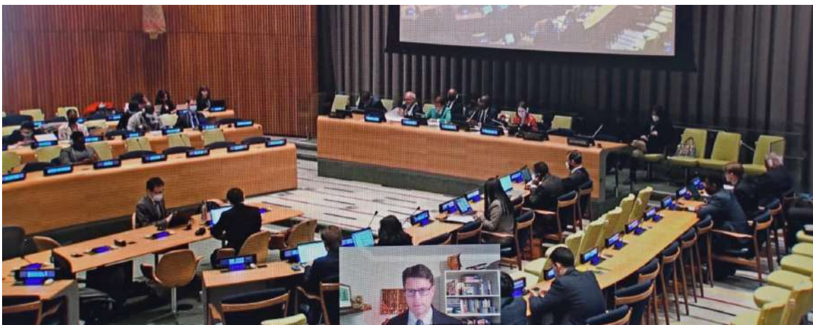
The 2022 Economic and Social (ECOSOC) Council Forum on Financing for Development that was attended by the Attorney - General and Minister for Economy Aiyaz Sayed Khaiyum virtually.

“In 2018, we became the first emerging economy to issue a sovereign green bond. We’re strengthening climate resilience across our entire infrastructure network; relocating communities, and harnessing nature to protect our people.”