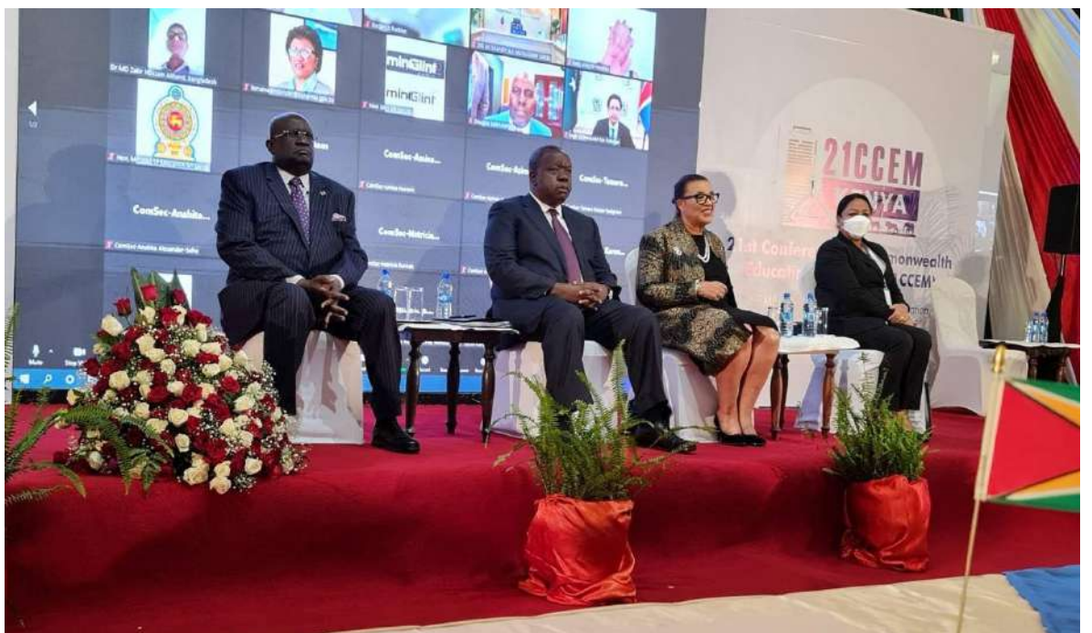
Fijian Minister for Education, Heritage and Arts, Premila Kumar with the Secretary-General of the Conference of Commonwealth Education Ministers (CCEM) Patricia Scotland QC.