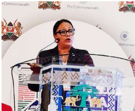
Fijian Minister for Education, Heritage and Arts, Premila Kumar speaks at the Conference of Commonwealth Education Ministers (CCEM) held in Nairobi, Kenya last week.

THE Fijian Minister for Education, Heritage and Arts, Premila Kumar has handed over the Chair of the Conference of Commonwealth Education Ministers (CCEM) to Kenya.