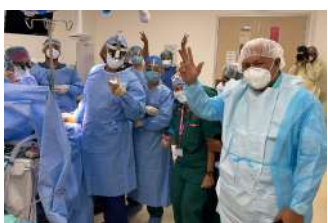
Frank Bainimarama @FijiPM

This morning I saw a miracle: The first two surgeries at the Sanjeevani Children's Heart Hospital saved the lives of two children, one aged three and the other aged 10. From now until 6 May there are 30 procedures planned. 30 surgeries. 30 children. 30 new leases on life.