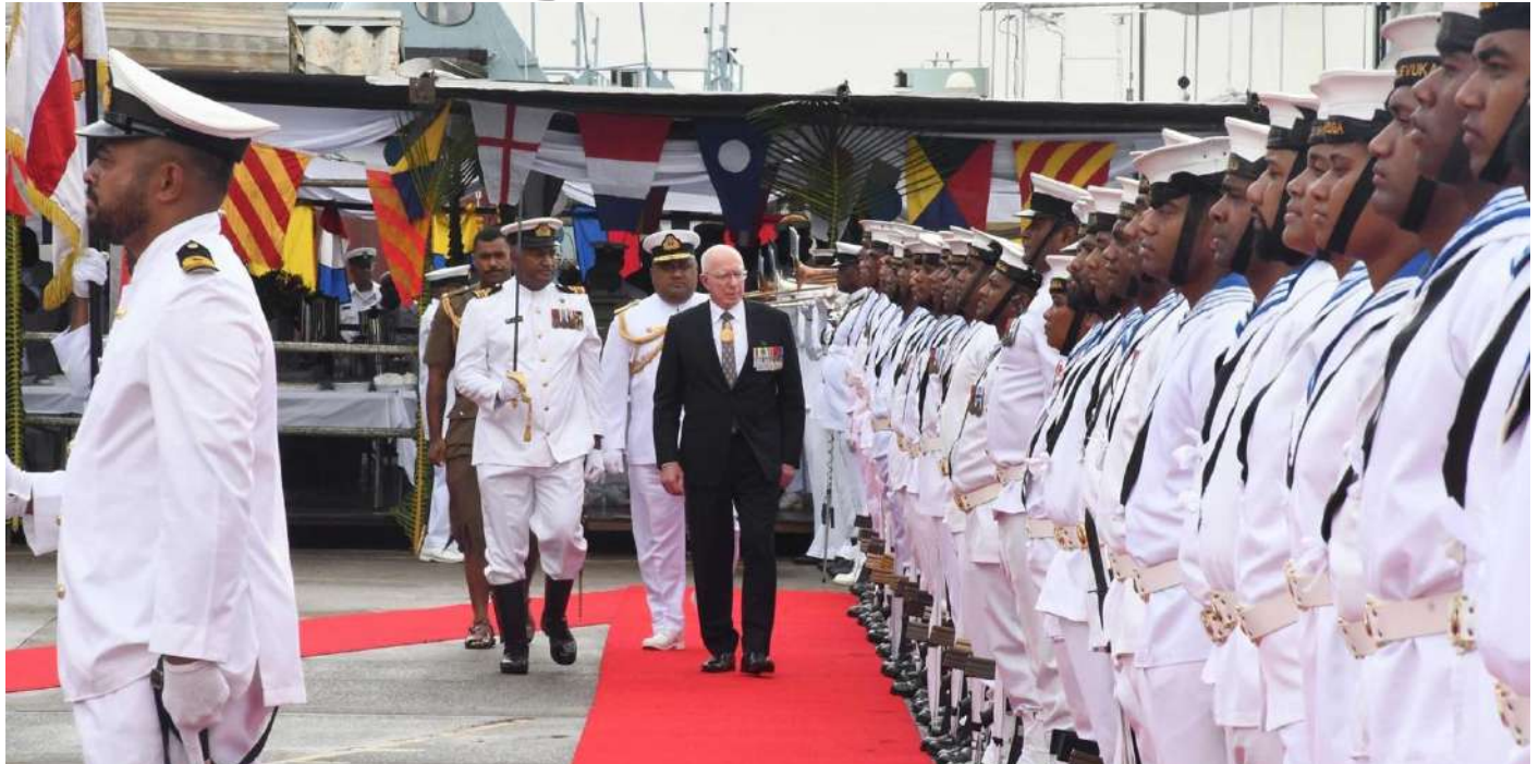
Governor-General of Australia, David Hurley, during his visit to the Stanley Brown Naval Base.

"The porous nature of our borders together with isolated islands expose our vulnerability to unprecedented maritime threats. The provision of the Guardian Patrol Boats and the upgrading of the Stanley Brown Wharf will significantly reaffirm our posture in the maritime domain," Minister Seruiratu said.