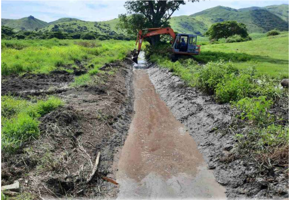
Drainage works being carried out by contractors hired by Ministry of Waterways