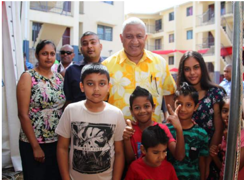
Prime Minister Voreqe Bainimarama with tenants of the new Public rental Board (PRB) flats in Savusavu.

Students of Vuanisaiki District School in Natewa, Vanua Levu, are now enjoying the same school facilities as students from urban areas. This was after the Prime Minister's Office invested $1.4 million in the construction of state of the art classroom blocks and teachers quarters built to withstand tropical cyclones. PM Bainimarama while opening the project said the Government was putting in the time and resources to construct schools that would last, to give students schools they could count on through times of crisis. There were over 200 schools that were severely damaged or entirely destroyed in the wake of Tropical Cyclone Winston two years ago.