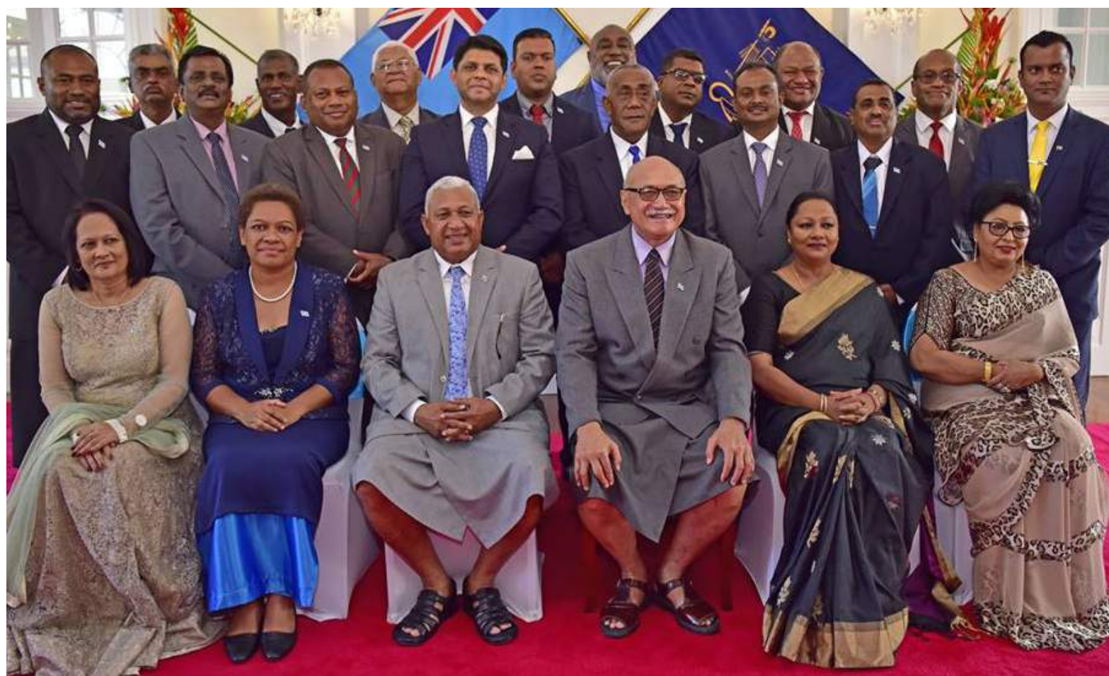
President Major-General (Ret'd) Jioji Konrote and Prime Minister Voreqe Bainimarama with Government Ministers after the swearing in ceremony at State House.

“I am heading into this with a very blank attitude, not thinking that ‘I am a surgeon, I know all these things’ because that is probably going to fall flat on my face. What I need to do is think like I know nothing at all and make it all over again because sometimes you take on a new role and you think you have been here before I have done it all before and you find yourself struggling in the first 100 days,” the new Health Minister emphasised.