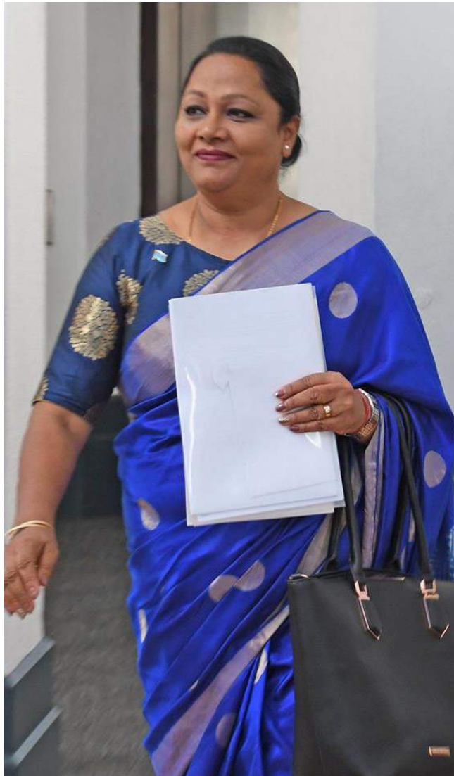
Minister for Industry, Trade, Tourism, Local Government, Housing and Community Development Premila Kumar outside Parliament last week.

“Advocacy is needed no matter where you are and it is important. People need to know what each Government ministry is doing and what is provided for them in terms of incentives. Advocacy will play a very strong role,” she added.