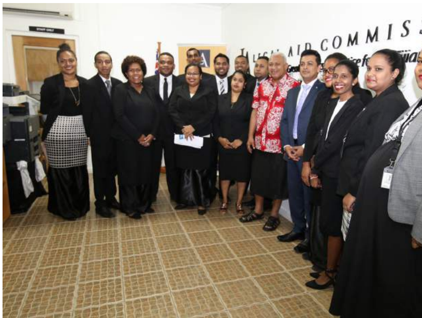
Prime Minister Voreqe Bainimarama with Legal Aid officers at their new Labasa Office.

Fijians within the Kubulau District and nearby areas are now able to access Government services closer to their homes after the opening of the new Kubulau Government Station by the Prime Minister Voreqe Bainimarama. This direct benefitted more than 34 villages and settlements throughout Kubulau, Wainunu and Wailevu districts, granting 5000 Fijians direct access to government services. Previously these residents had to travel to Nabouwalu, Savusavu or Labasa to access government services and had to spend a night in the centres before travelling home the next day.