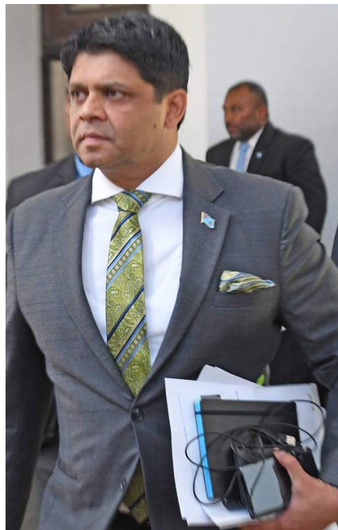
Attorney-General and Minister for Economy, Aiyaz Sayed-Khaiyum outside Parliament last week.

“The rights of the indigenous people in Fiji, who are mainstreamed, are not being infringed as the Constitution protects their land, their culture, customs and tradition, their access to the courts, the legal system, the political system therefore what we are saying is to use UNDRIP incorrectly and politically to trample the rights of others is incorrect,” the A-G said.