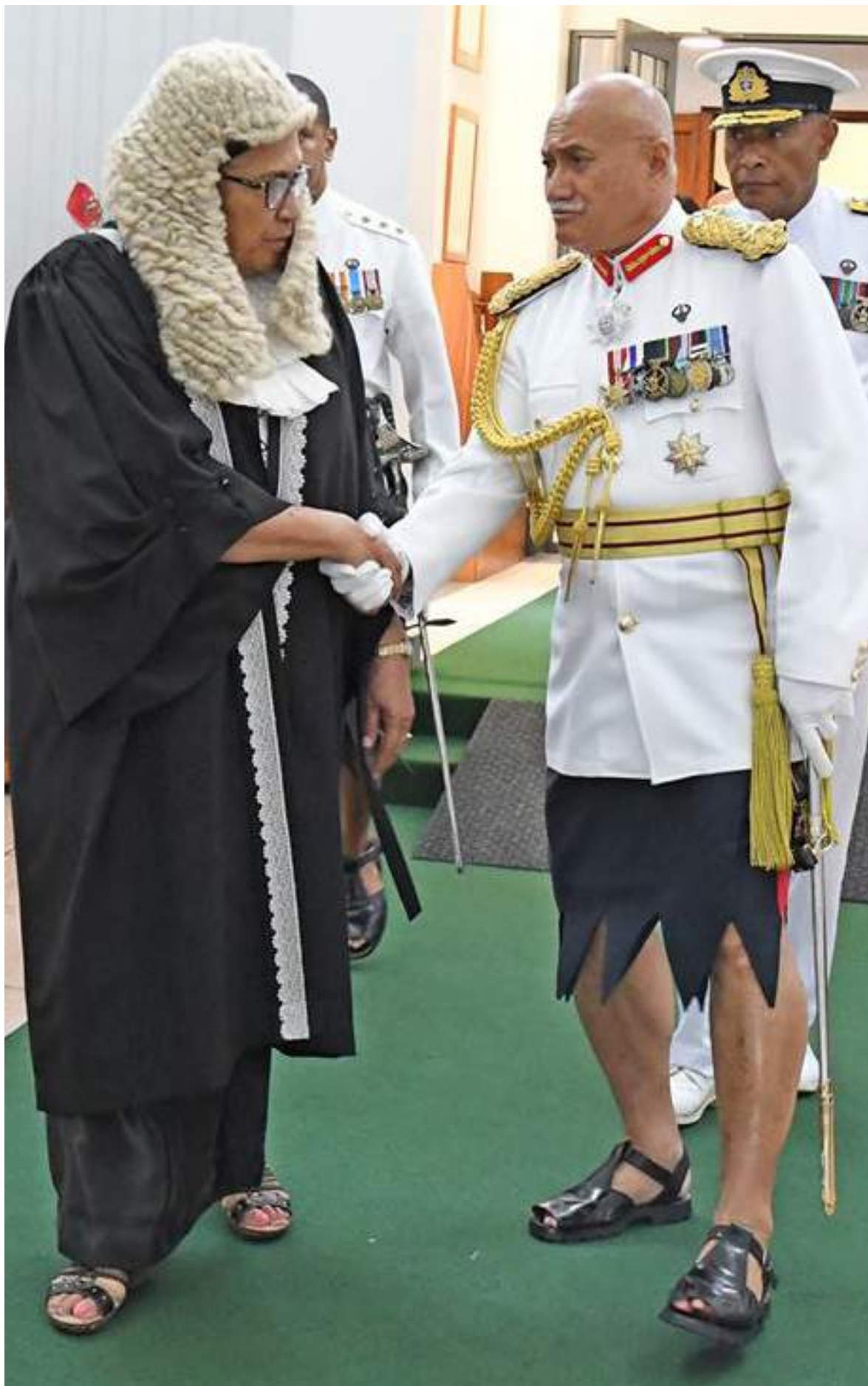
राष्ट्रपति, महामहीम चियोची कोनरोते, दूसरे कार्यकाल के लिए चुनी गई संसदीय स्पीकर चिको लूवेनी से मुलाकात करते हुए।

राष्ट्रपति ने संसद सदस्यों को याद दिलाया कि वे फीजीवासियों तथा उनकी दिलचस्पियों का प्रतिनिधित्व कर रहे हैं। उन्हें संसद में और भी महिला प्रतिनिधियों को देखकर गर्व महसूस हुआ।