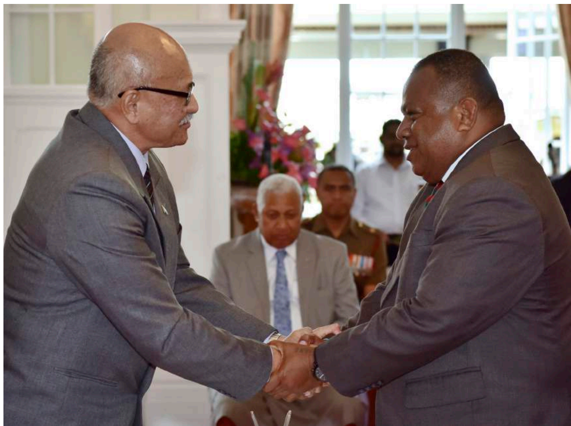
President Major-General (Ret'd) Jioji Konrote congratulates Minister for Defence and National Security Inia Seruiratu at State House.

“For the Fiji Police Force we have five year development plan and we