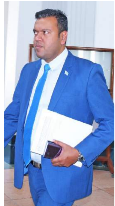
Minister for Lands and Mineral Resources Ashneel Sudhakar outside Parliament.