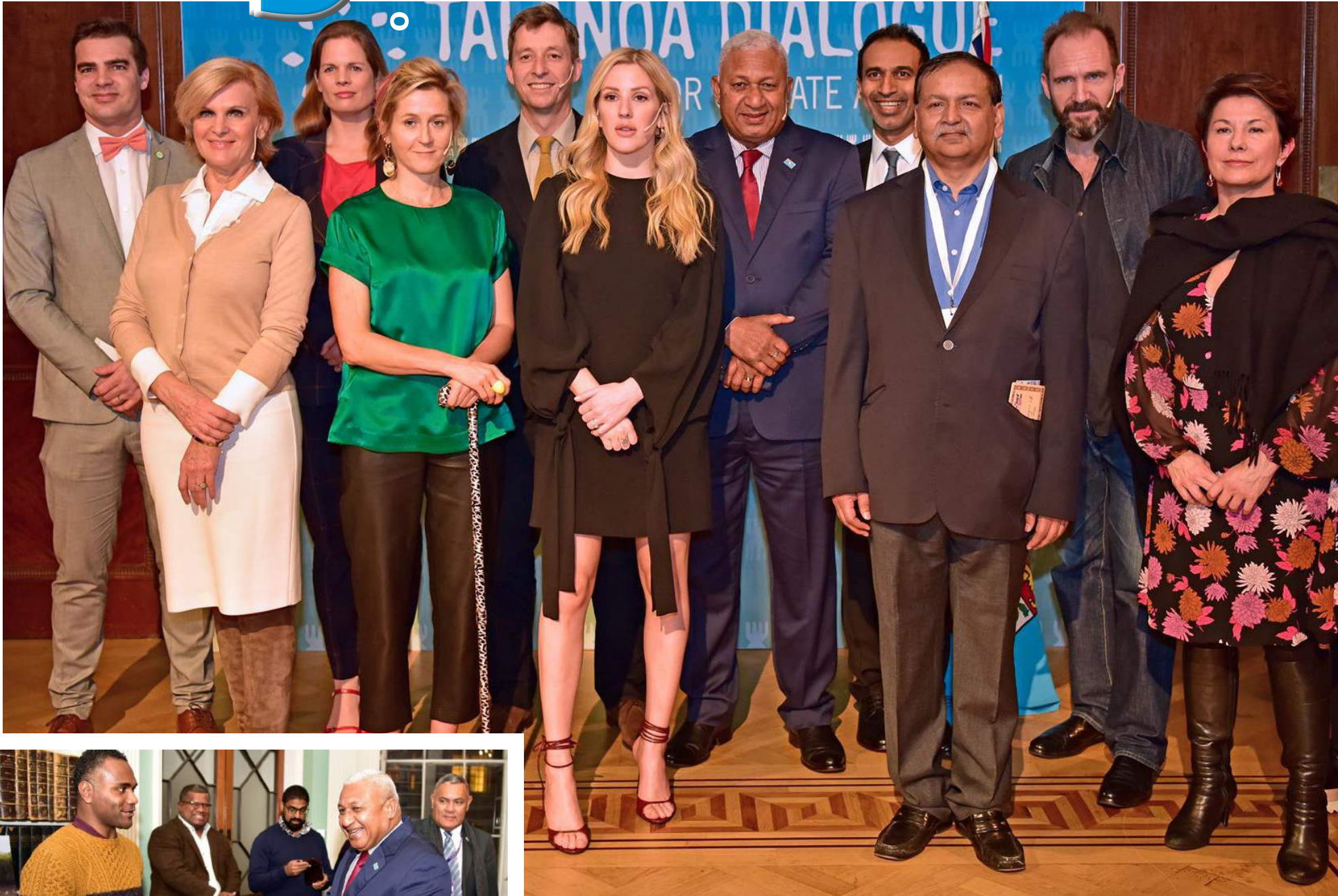
COP23 President and Fijian Prime Minister Frank Bainimarama with speakers at the Climate Change Talanoa Dialogue in London.