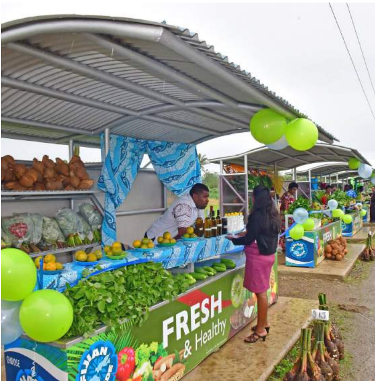
A total of 20 semi-permanent stalls and 10 portable vendor stalls were handed over to assist roadside vendors in Vakabalea.