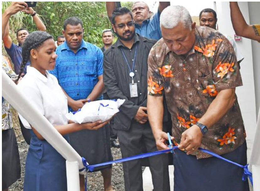
Prime Minister Voreqe Bainimarama at the official opening of the new Savusavu Cable Landing Station.

Twenty-three households in Naverea, Savusavu were connected to the electricity grid through Government's rural electrification initiative. The project, which cost around $73,000, benefited 105 Fijians living in the area. Prime Minister Voreqe Bainimarama said this project was a part of Government's efforts in rural electrification, which catered for the extension of EFL grid to rural localities, house wiring connections and installation of new solar systems.