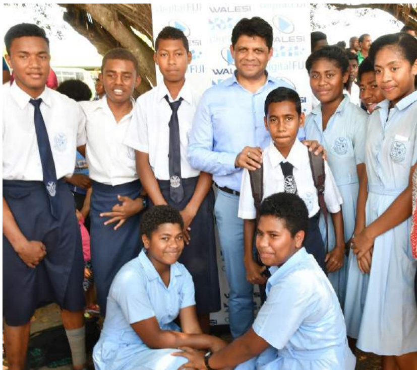
Attorney-General and Communications Minister, Aiyaz Sayed-Khaiyum with school students at the free WiFi hotspot launch in Nadi .