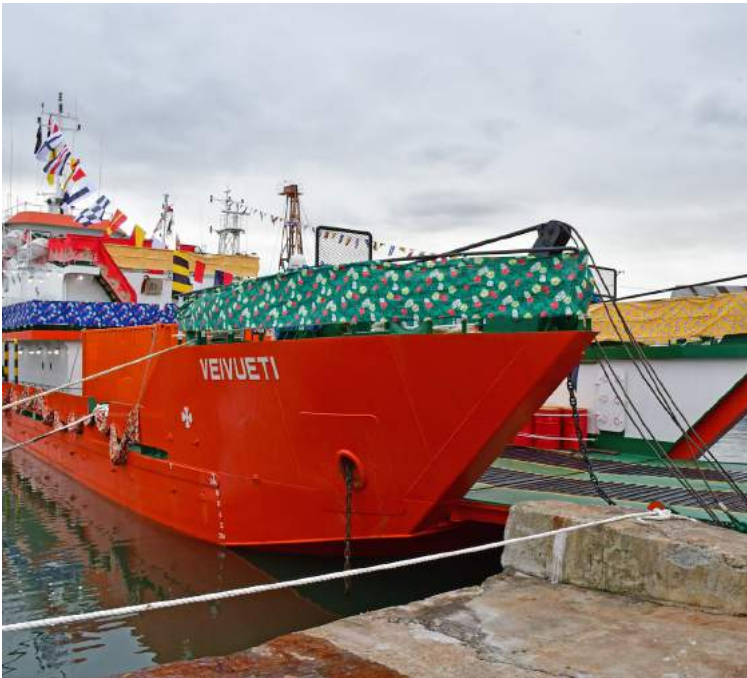
The MLC Veivueti , a floating mobile hospital and a first of its kind in Fiji, was commissioned to provide primary and secondary medical services.

FCCC 5 YEAR STRATEGIC PLAN AND REBRANDING (March 26) THE former Commerce Commission was rebranded into Fijian Competition and Consumer Commission (FCCC) while simultaneously releasing its five year strategic plan. Prime Minister Voreqe Bainimarama said, “The Commission has been tasked with a renewed focus on ensuring that as our economy continues to grow, markets are competitive, forward-thinking regulations are justified and consumers’ interests are protected.” The FCCC works with the Government to create a level playing field so that businesses can compete fairly. The FCCC actively prevents price gouging by enforcing price caps and protects the people from unfair and unethical business practices.