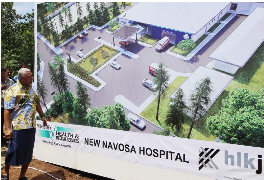
Prime Minister Voreqe Bainimarama at the groundbreaking of the new subdivisional hospital in Keiyasi, Navosa.