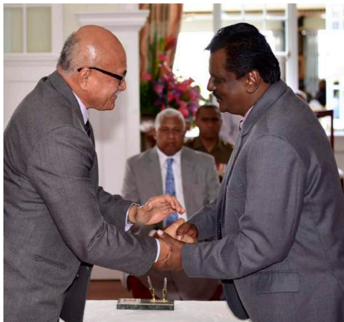
Newly sworn-in Minister for Employment, Productivity, Industrial Relations, Youth and Sports Parveen Kumar at State House.