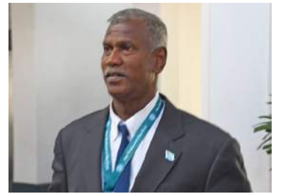
Assistant Minister for iTaukei Affairs, Sugar Industry and Foreign Affairs George Vegnathan.

“The Government will also continue with the infrastructure upgrading program and we are committed to implement in building a reliable and resilient infrastructure for a modern Fiji,” Asst. Minister Nath added.