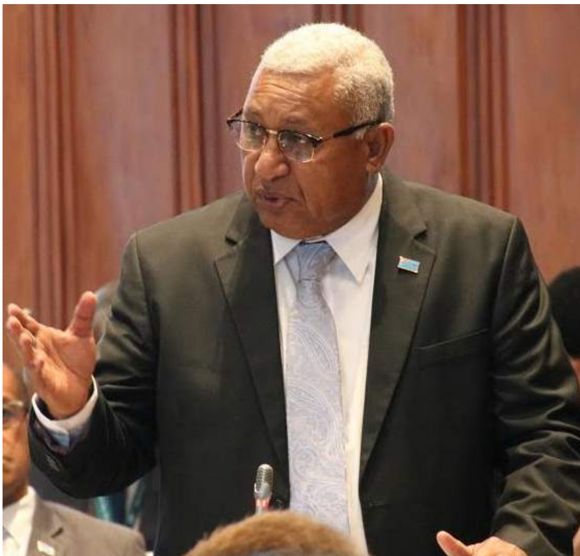
Ko Paraiminista Voreqe Bainimarama ena nona isevu ni vosa ena Palimedi ena ikarua ni wasewase ni nodra veiliutaki ena noda vanua.

E na tomani tale ga na kena vakarawarawataki na veiqaravi ni matanitu ki vei ira na lewe ni vanua e Viti.