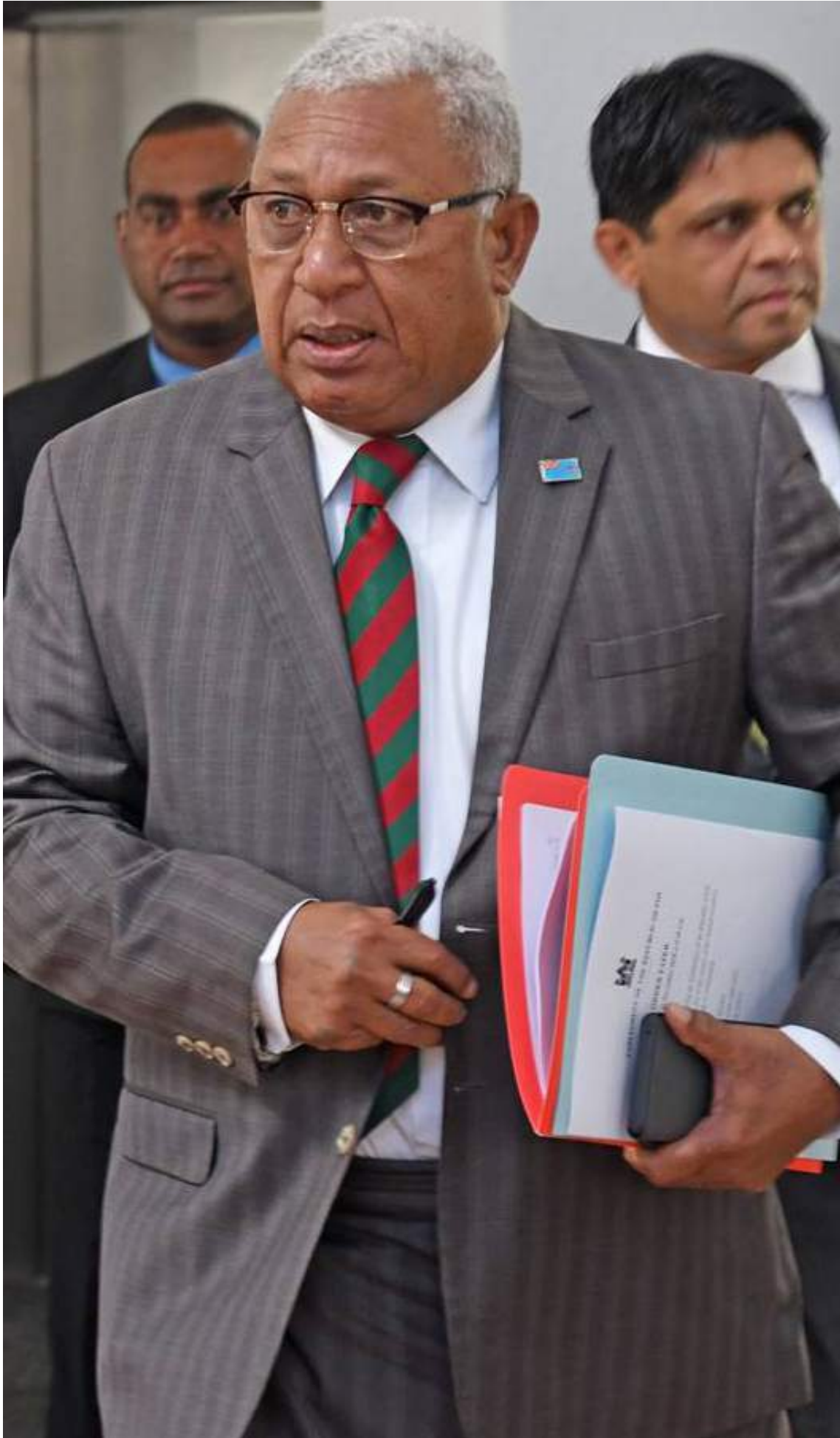
प्रधानमंत्री वॉरेनो बर्डनिमरामा दूसरे कार्यकाल में अपने पद पर शपथ लेने के बाद संसद के बाहर।

जारी रखेगी ताकि वो अपनी पूरी आर्थिक क्षमता तक पहुँच सकें। श्री बर्डनिमरामा ने महिला संसद सदस्यों की संख्या में वृद्धि का स्वागत किया और कहा कि देश में महिला नेताओं को सशक्त बनाने के लिए बहुत कुछ किया जा सकता है। प्रधानमंत्री ने कहा कि इस साल वाले आम चुनाव के बाद फीजी ने संविधान के तहत हमारे नए प्रजातंत्र की ऐतिहासिक उपलब्धि को मज़बूत किया है। उन्होंने सभी फीजीवासियों से साथ मिलकर काम करने की माँग की है फिर चाहे वे किसका समर्थन करते है। श्री बर्डनिमरामा ने सभी लोगों को धन्यवाद दिया जिन्होंने खराब मौसम का सामना करते हुए अपना मत दिया फिर चाहे उन्होंने किसी को भी अपना मत दिया होगा। उन्होंने कहा कि सरकार सभी की आवाज़ सुनेगी फिर चाहे लोगों ने इस सरकार को अपना मत नहीं दिया था। जिन लोगों ने सरकार को अपना समर्थन नहीं दिया से भी श्री बर्डनिमरामा ने माँग की कि वे भी सरकार के साथ मिलकर सभी फीजीवासियों के लिए फीजी को एक बेहतर, देश बनाने में सरकार की मदद करें।