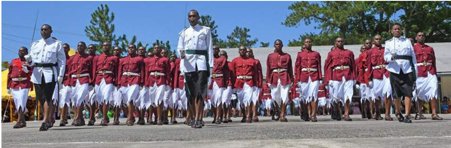
Fiji Corrections Service new graduating officers during the pass-out parade at Naboro Corrections Academy last week.