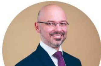
Michal Kurtyka (@KurtykaMichal)

This year's COP in #Katowice, Poland, is particularly crucial because 2018 is the deadline that the signatories of the #ParisAgreement agreed upon in order to adopt a work programme for the implementation of the Paris commitments.