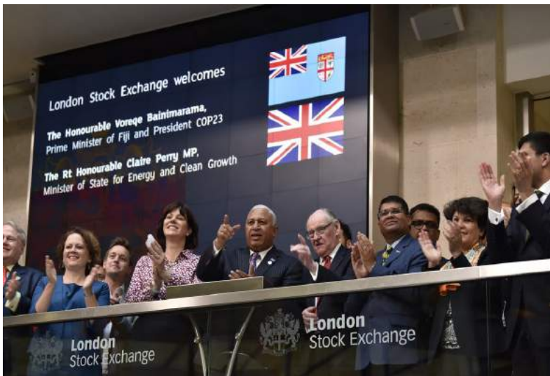
Prime Minister Voreqe Bainimarama launches the Sovereign Green Bond on the London Stock Exchange.

In the wake of damaging consecutive tropical cyclones in April, Prime Minister Voreqe Bainimarama launched the CARE Initiative in April as an unprecedented program that encompassed a host of assistance programs for affected Fijians. These were namely HOMES Care, FARMS Care, SUGARCANE Care, LEASEHOLDERS Care, WELFARE Care and eTRANSPORT Care, and they have been a critical platform to rebuilding the lives of around 150,000 people. Each program provided a measure of financial aid depending on the extent of damaged homes and livelihoods, with electronic cards at approved retail outlets providing items to replace lost items and rebuild damaged structures. With most vegetable farmers losing 90 per cent of their crops and many livelihoods affected, the CARE Initiative provided a pragmatic and timely solution.