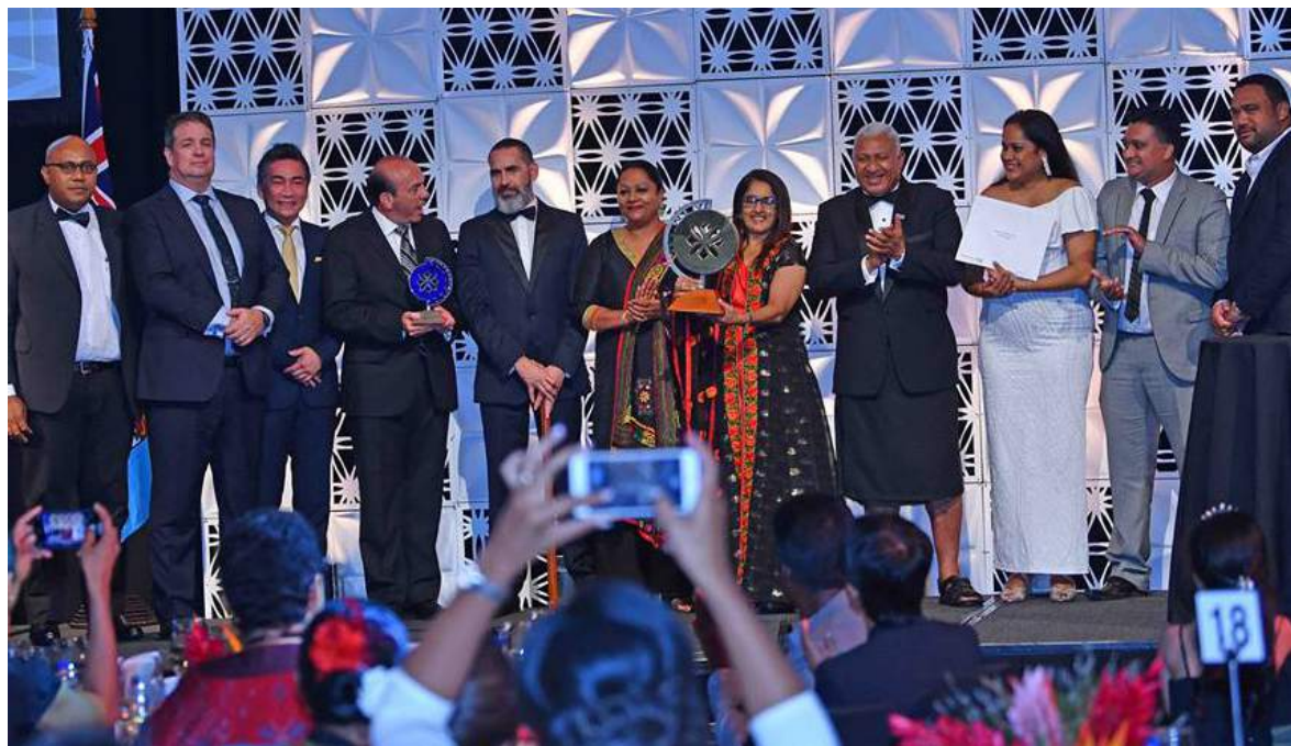
Prime Minister Voreqe Bainimarama with winners at the Prime Minister's International Business Awards in Nadi.

Now in its 26th year, the awards, which was held at the Sofitel Fiji Resort in Nadi last week, recognised outstanding companies in 12 categories, with national airline Fiji Airways scooping the main Prime Minister's Award and e-Commerce Business of the Year. Other winners included Ram Sami and Sons, Fiji Airports and Rosie Tours.