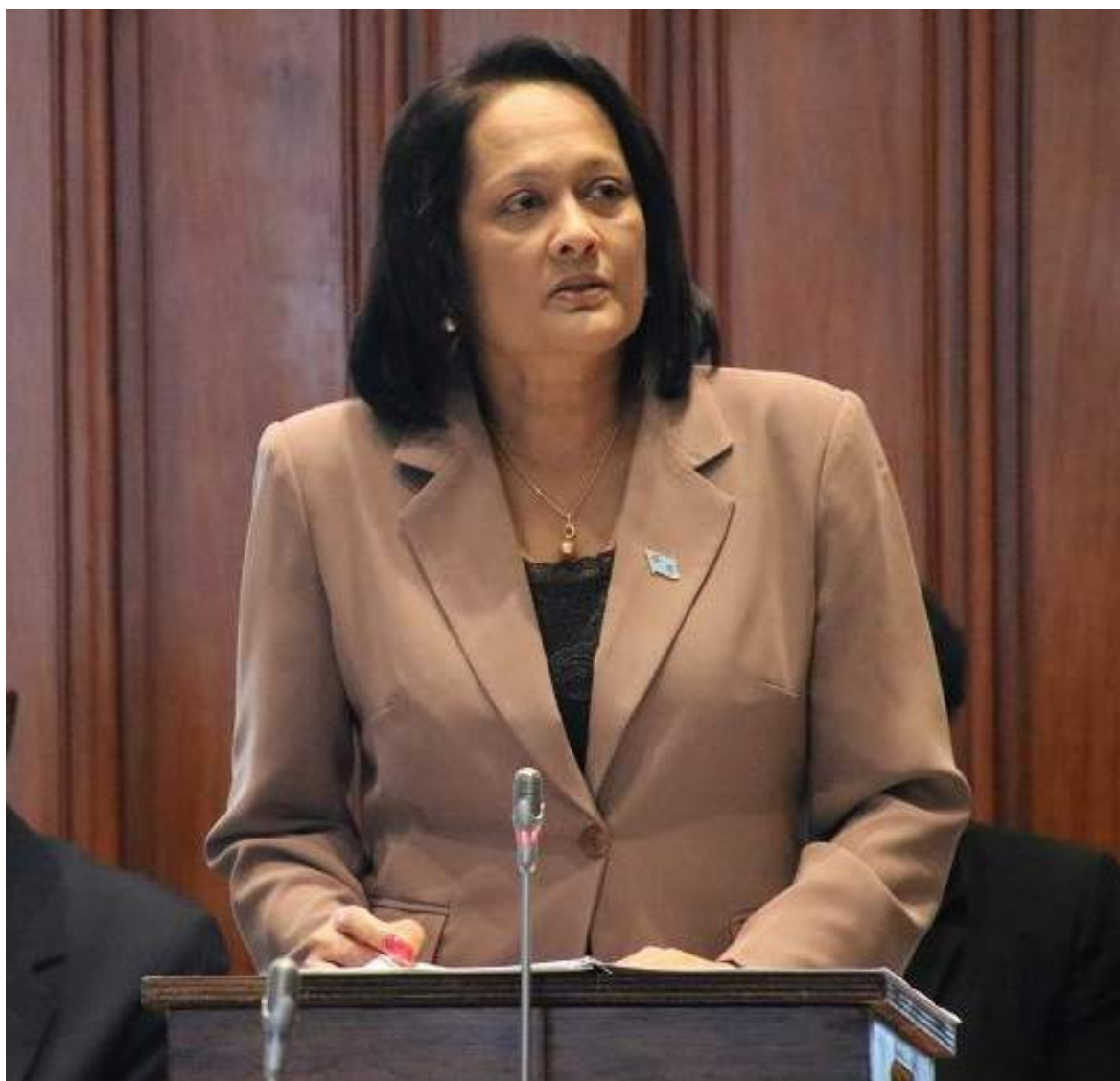
नई नियुक्त शिक्षा मंत्री रोजी अकबर ने जोर दिया है कि सरकार, लगातार शिक्षा मंत्रालय के पाठ्यक्रम की समीक्षा करेंगी।

उनके अनुसार सरकार उन स्कूलों पर खास ध्यान देगी जहाँ विकलांग बच्चें पढ़ते हैं जिनकी खास ज़रूरतें हैं तथा ऐली और केयर एडुकेशन स्कूलों की नींव पर खास जोर देंगी।