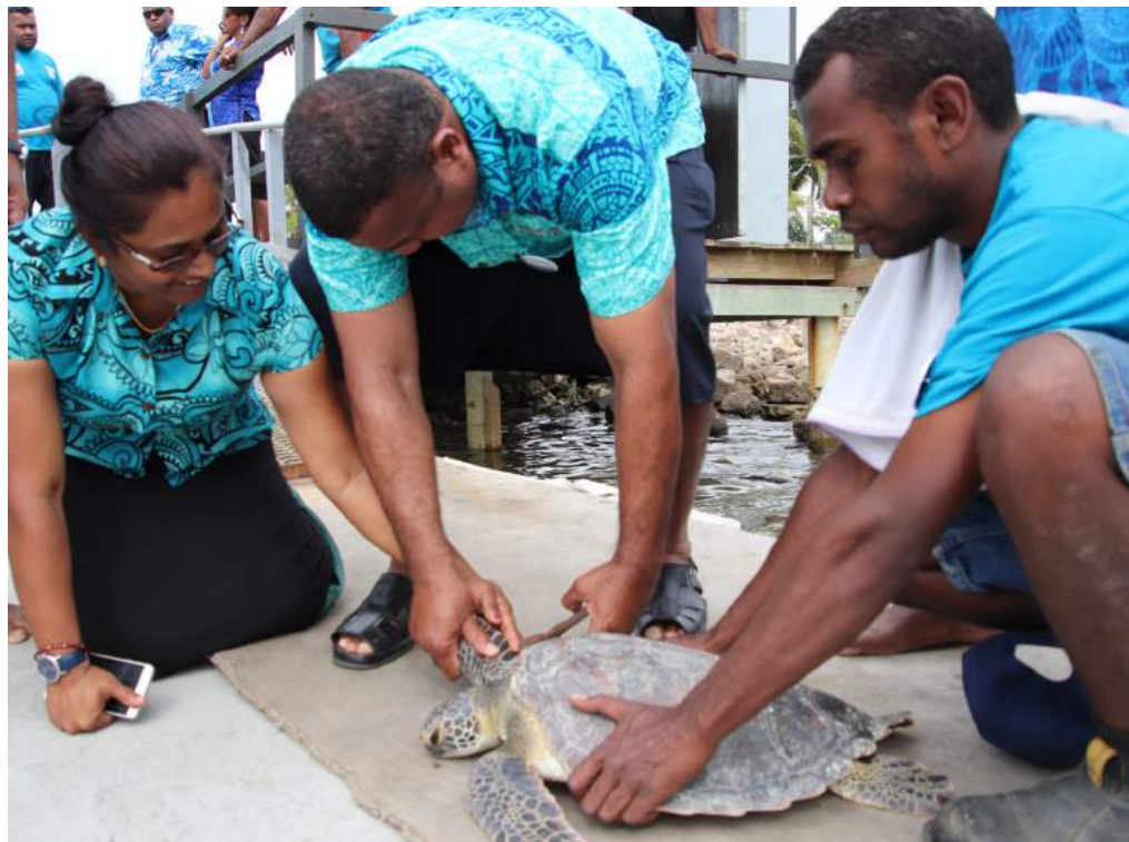
Ministry of Fisheries staff tag a turtle before releasing it into the sea.

As important cultural icons, sea turtles have