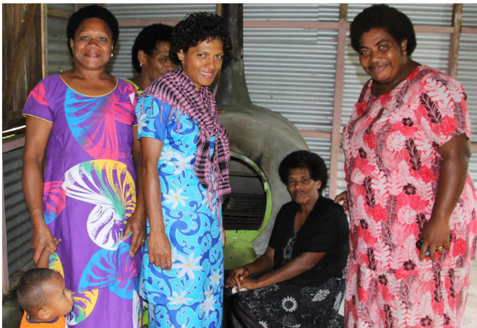
Some members of the Senibiau Women's Group at their bakery at Dreketi Village, Cakaudrove.

"I am grateful to the Government for the assistance and the opportunities that it has put in place to help Fijians out in the rural areas."