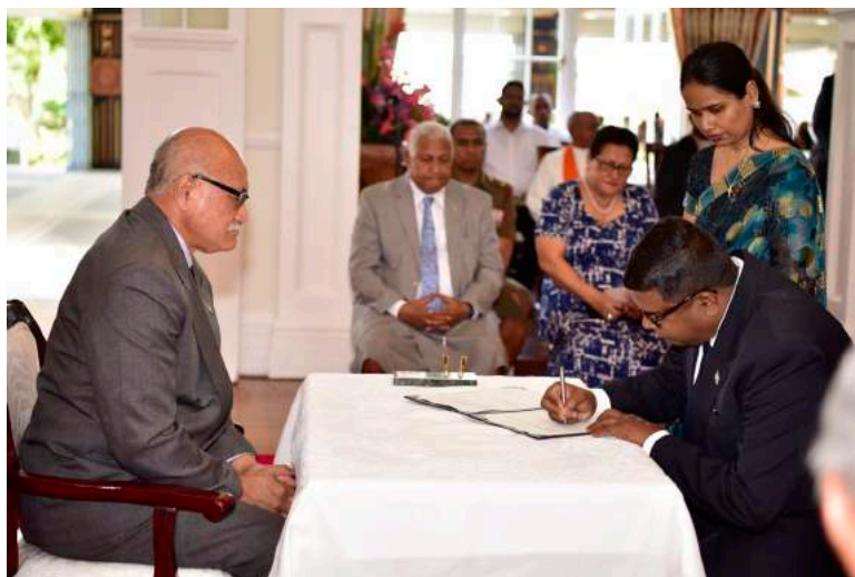
Newly sworn-in Minister for Agriculture, Rural and Maritime Development, Waterways and Environment, Dr Mahendra Reddy believes that there are linkages between these portfolios and it will work well together.