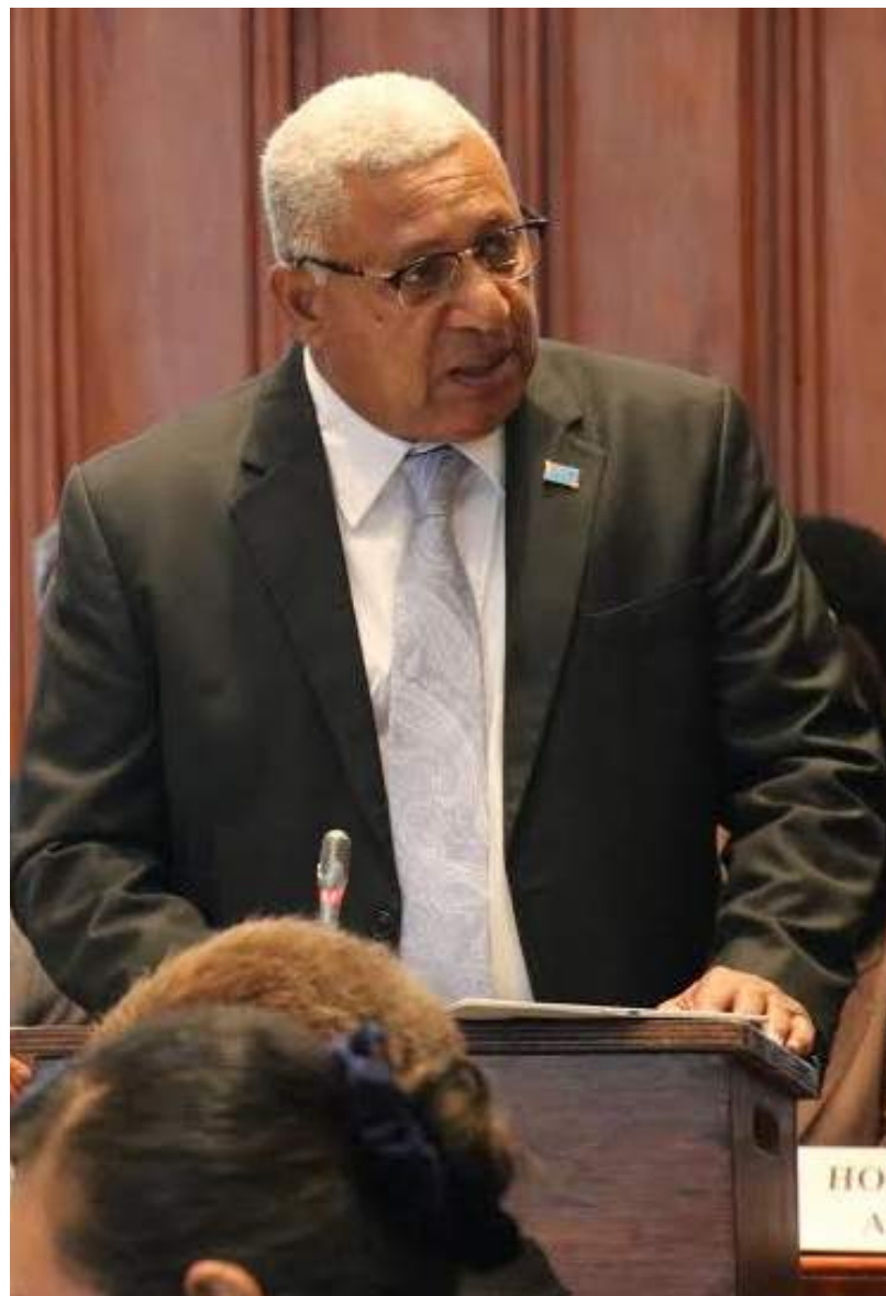
Prime Minister Voreqe Bainimarama delivers his maiden speech in Parliament last week.