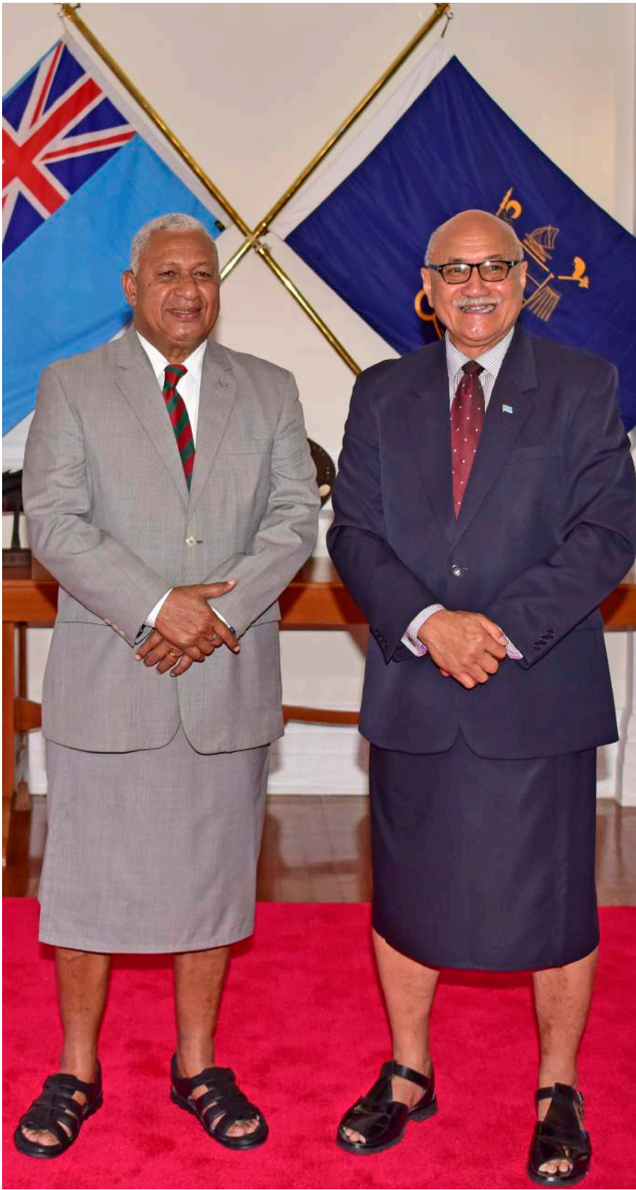
E rau taba toka ko Peresitedi Major General (Re't) Konrote kei Paraiminisita Voreqe Bainimarama. Mai bulubuluitaki ko PM Bainimarama ena matai Viti ena ikarua ni nodra wasewase ni veiqaravi na ililui digitaki ena noda vanua.

“Me kilai ni vakasama oya ena yaga kina noda vanua ena dua na gauna balavu,” tukuna ko Peresitedi Konrote. Tukuna ko Peresitedi Konrote ni sega ni dodonu meda vakacacana na noda bula vakailavo ena vuku ni politiki. Vakaraitaka ko Peresitedi Konrote ni vakasama ka sala muria mai na vuaviri ena 1987 kei na 2000 eya yavutaki mai ena lasu, ka veivakacacani ka sega ni sabai rawa. “Na lasu oqo e tukuni keda ni da kaukauwa cake ga ni da tatawasewase ka sega ni baleta ni da tuvata se duavata. “Na lasu oqo e suguraki mai ena noda bula vakalewe ni vanua ena cakacaka kaukauwa, veivakatotogani kei na vakabauta ni tiko rere, sega ni veivakabauti kei na veicati vakakawa tamata ka sa mai paisonitaka na nodra rai na lewe ni vanua ka sa vakacacana na nodra isema ni veiwekani vakalewe ni ni noda vanua.”