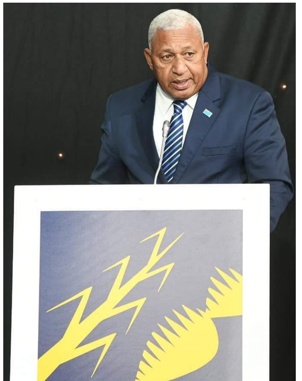
Prime Minister and Minister for Sugar Industry Voreqe Bainimarama in London last Friday.

This cover, at no cost to the growers, provides insurance pay-outs to them and their families in the event of personal injuries, fire or death.