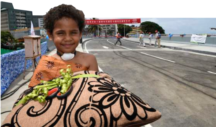
The new bridge at Stinson Parade in Suva.

FIJIANS TO BENEFIT FROM NEW LEGAL AID OFFICES (March 28) CLOSE to 40, 000 Fijians will enjoy the services offered the by the Legal Aid Commission after the opening of 11 Legal Aid Offices around the country. During the opening of the Legal Aid’s Korovou office, Prime Minister Voreqe Bainimarama said Fijians will access services such as witnessing documents like birth certificates, academic transcripts and so on, dealing with landlord and tenant related issues, drafting wills and helping with probate matters. Officers have the expertise to help guide clients more easily than ever before, wield the tremendous power of the rule of law for your benefit and the benefit of your families. Government has invested close to $8.4million for the setting up of this Legal Aid Commission around the country.