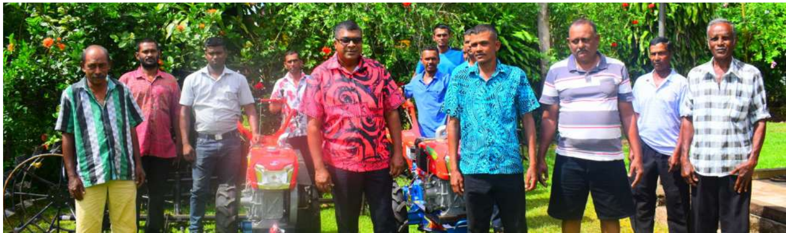
O ira na dau tei rai mai Qaraniqoli mai Dreketi e Macuata kei na nodra misini vou ni cukicuki ka lolomataka yani na Tabacakacaka ni Teitei..