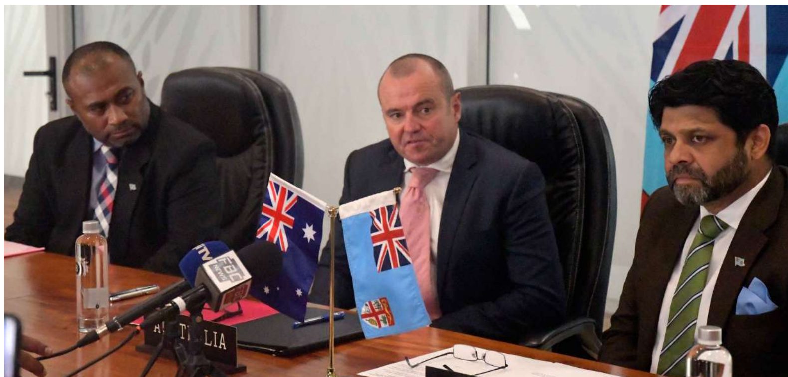
From left: Minister for Health and Medical Services Dr Ifereimi Waqainabete, Australian High Commissioner to Fiji John Feakes and Attorney-General Aiyaz Sayed-Khaiyum at Ro Lalabalavu House in Suva.