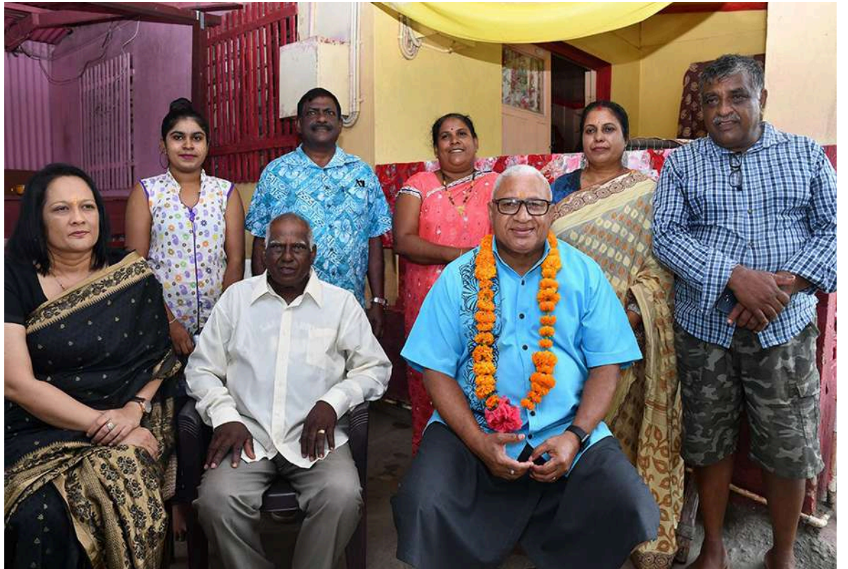
Prime Minister Voreqe Bainimarama and Minister for Education, Heritage and Arts Rosy Akbar with descendants of Girmitiyas at Wainibokasi, outside Nausori..

His grandfather was accompanied by his uncle to Fiji and they came to work as cane labourers.