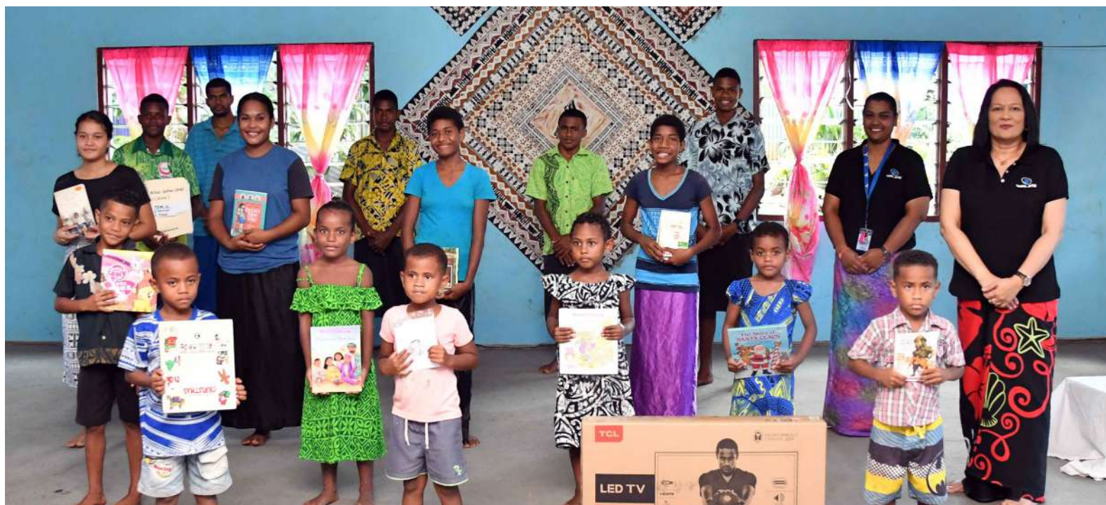
Minister for Education, Heritage and Arts Rosy Akbar with students from 10 districts in Tailevu North after she handed over storybooks and educational materials.

cational materials will not be examined.