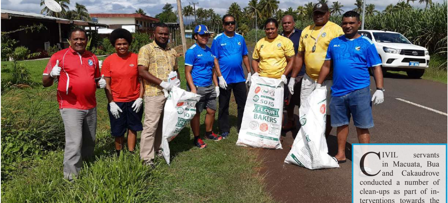
Civil servants in the Northern Division conducted several clean-up campaigns to help reduce and prevent cases of leptospirosis, typhoid, dengue fever and diarrhoea recently.

CIVIL servants in Macuata, Bua and Cakaudrove conducted a number of clean-ups as part of interventions towards the reduction and eradication of Leptospirosis, Typhoid, Dengue and Diarrhoea illness (LTDD).