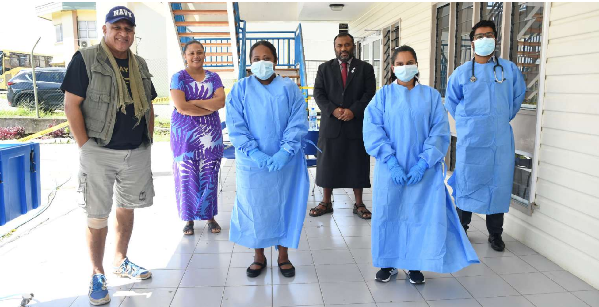
Prime Minister Voreqe Bainimarama and Minister for Health and Medical Services Dr Ifereimi Waqainabete with health officials and staff at the Valelevu fever clinic in Nasinu. Fiji has had 18 positive COVID-19 cases, but no deaths, and 15 have fully recovered with three still being treated. The pandemic led to several measures taken by Government, including lockdowns and restrictions in affected areas.

Fiji fights off pandemic and tropical cyclone