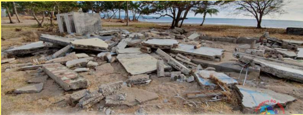
Vakacacani e 28 na vale ena loma ni koro vakaturaga o Yaroi mai Matuku ena yatu Lau ena cabe ni ualoka ka ni malumu yani na Cava o Harold.