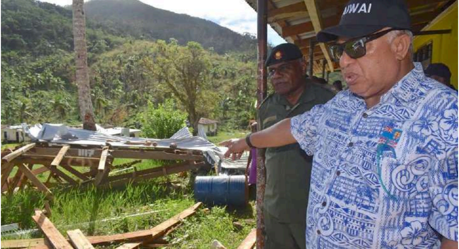
हाल ही लाउ और कन्दावू में समुद्री आँधी हेरल्ड से नुकसान पहुँचे इलाकों का दौरा करते हुए प्रधान मंत्री वोरेंगो बड़िनमारामा

मंत्रालय लोगों को सलाह दे रहा है कि वे आदेश का पालन करें और इस साल कबूतर न दागें।