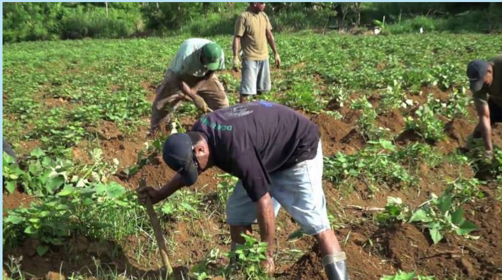
O ira na dau teitei ni Sigavou Farmers mai Nawaka mai Nadi. Marautaki na lalawa mera konitarakitaki na dau teitei mai na AMA.