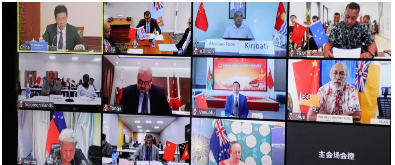
A virtual meeting between representatives of the People's Republic of China and those Pacific Small Island Developing States (PSIDS) on strengthening collaboration towards containing COVID-19

"Fiji, therefore looks forward to the adoption of the COVID-19 resolution in the World Health Assembly that not only recognises the challenges posed by the pandemic to the global community but also identifies corresponding strategies to address the current impact and curb any future outbreak through global cooperation and commitment from Member States and