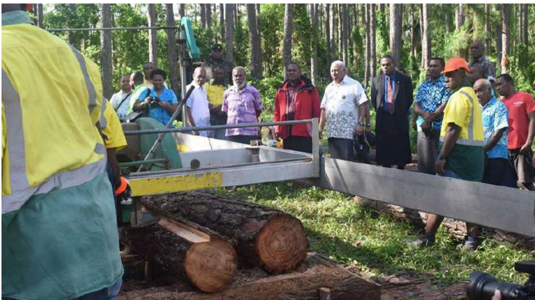
Oqori na ivaro ni kau sa laki tavoca tiko ena koro ko Yaroi mai Matuku o Paraiminisita Voreqe Bainimarama me vukea na ta ni kau ni vale era vakacacani ena cabe ni loka ena Cava o Harold..

“Na ualoka qo e laveta na vale qai veibilyaka yani. O ya na kaukauwa sara ga ni ua