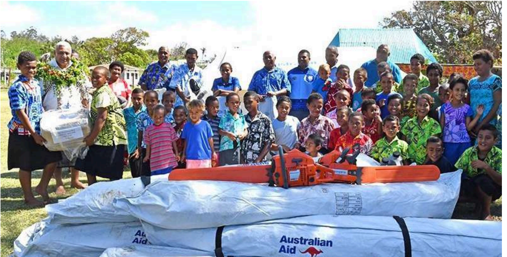
Era taba tu oqori na turaga Paraiminisita Voreqe Bainimarama kei na iyaya ni veivuke ni cagilaba ena koro o Nukuni e Ono-i-Lau.