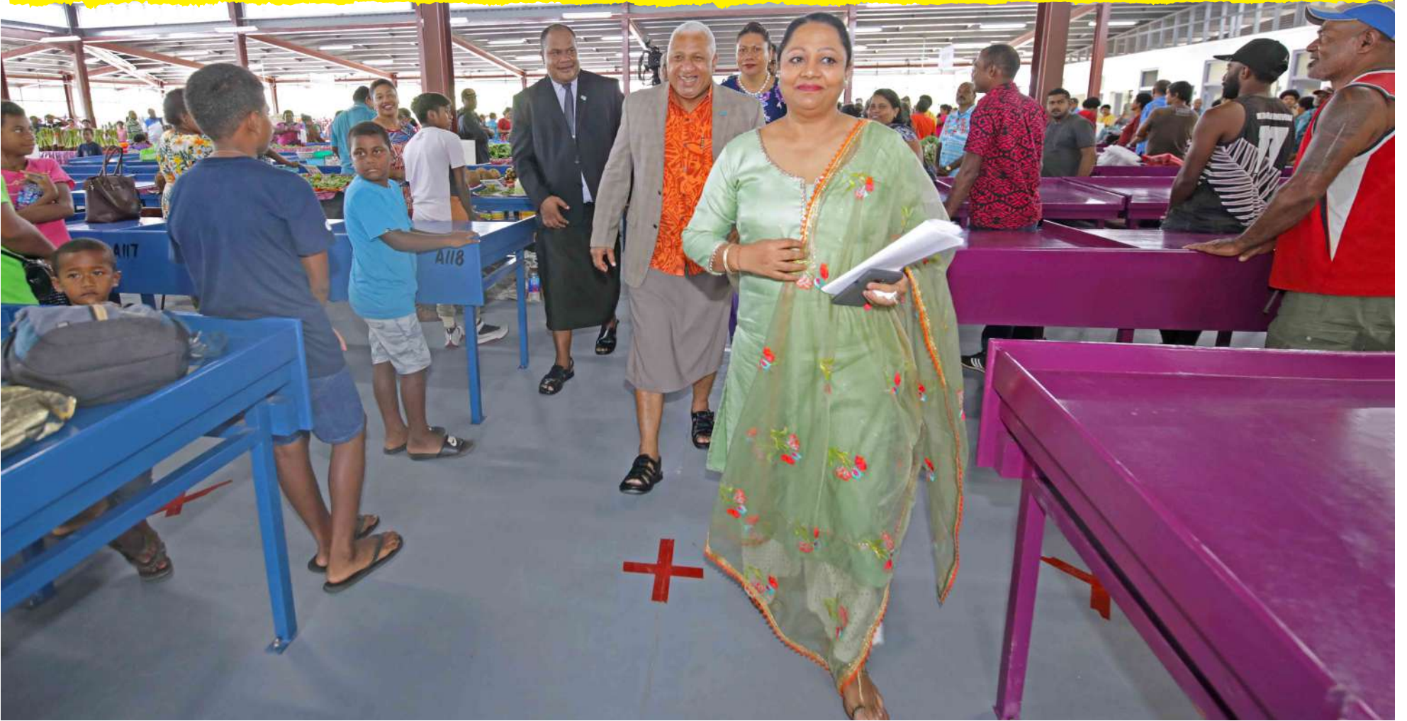
Prime Minister Voreqe Bainimarama and Minister for Local Government Premila Kumar tour the $7.2m Laqere Market in Nasinu.