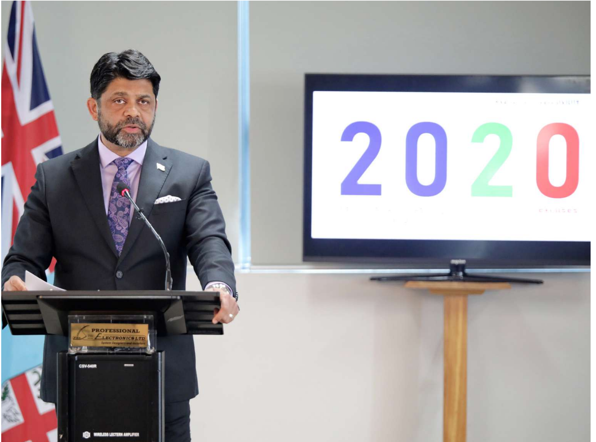
कोरोना वायरस को लेकर बयान देते हुए अटेनी जेनरल तथा अर्थ-व्यवस्था मंत्री अईयाज़ सईयद खईयूम।