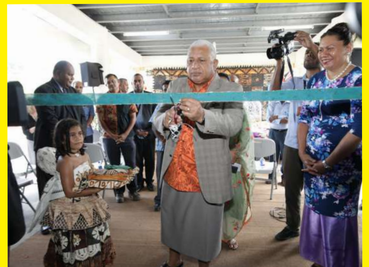
Prime Minister Voreqe Bainimarama officiates at the opening of the $7.2m Laqere Market.