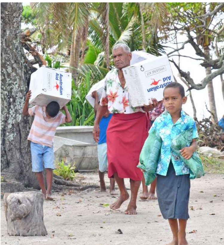
Villagers with relief supplies at Nukuni Village, Ono-i-Lau.