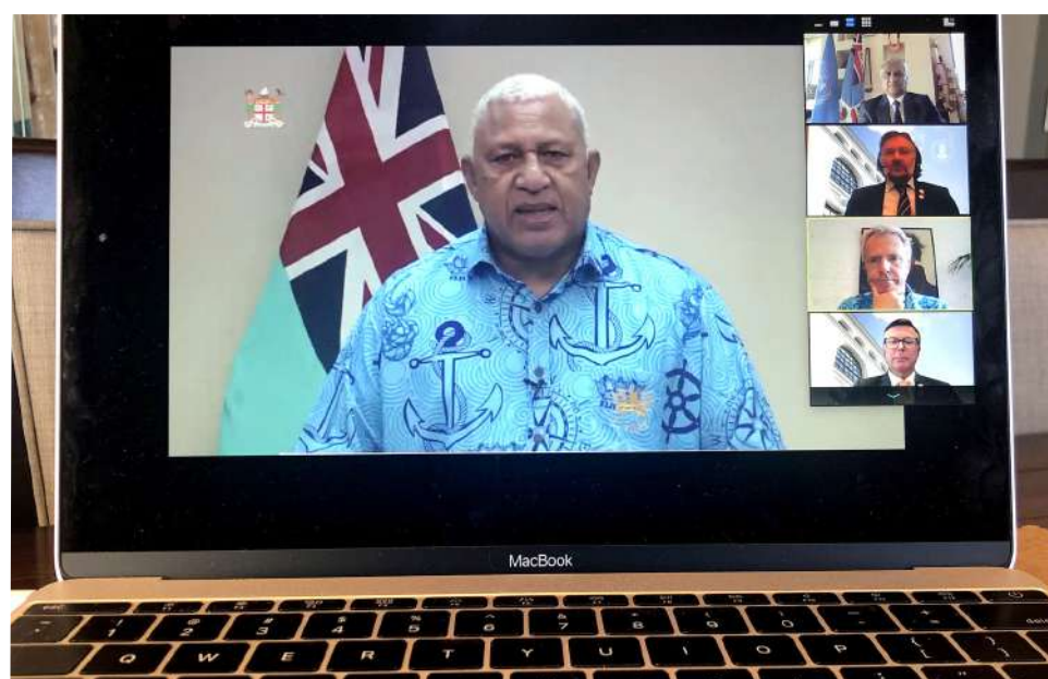
VIRTUAL EVENT ... Prime Minister Voreqe Bainimarama speaks at the official launch of the Norway-Pacific Ocean Climate Scholarship Programme (N_POC).

"In Norway, the Pacific small states find a