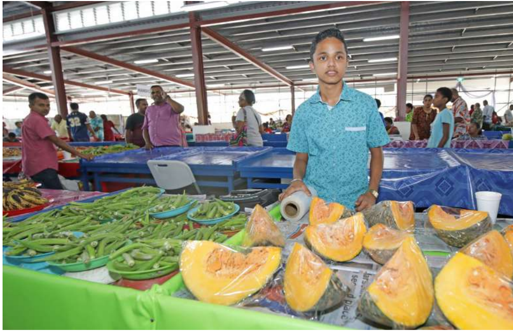
नए लंगेरे मार्केट जिसका उद्घाटन पिछले सप्ताह हुआ में एक विक्रेता अपना सामान बेचते हुए

मिलियन डोलर ($7.2m) खर्च किया है। नए मार्केट में चार सौ उनसठ (459) स्टोल्स हैं, बारह कियोस्क और तीन मिनी रेस्टुरांट्स हैं। वहाँ मछली और मांस बेचने की भी व्यवस्था है।