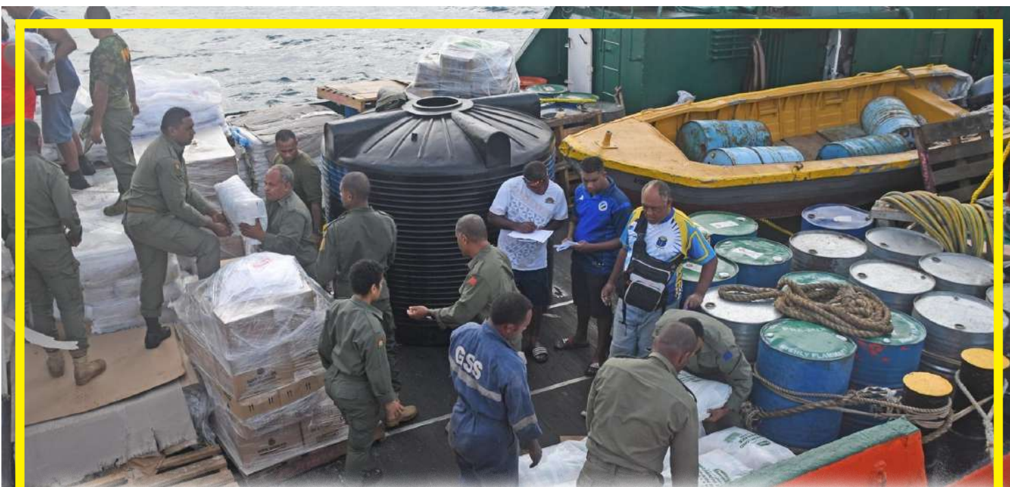
Civil servants, members of the Republic of Fiji Military Forces and villagers help load, unload and distribute food rations to the Malolo, Mamanuca and the Yasawa Group that was severely affected by Tropical Cyclone Harold.

“Given the environment that we are in, I am thankful that this kind of initiative are provided to farmers like us in order to help us with our farming.