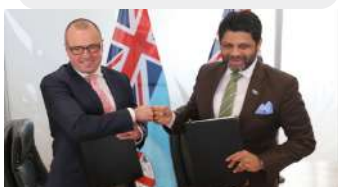
Aiyaz Sayed-Khaiyum @FijiAG

Australia's support is a vote of confidence in Fiji's response to the dual economic and health crises facing our nation, and this grant will help fuel our ongoing efforts to uplift Fijian families who have been suffering from the crippling impact of this global pandemic. #Vuvale