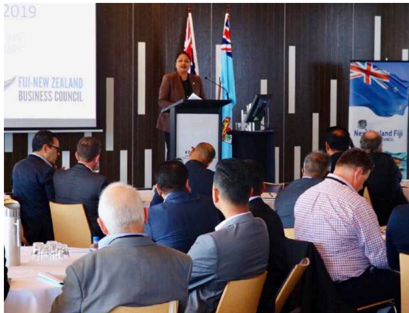
मंत्री प्रेमिला कुमार निउजीलैंड फीजी तथा फीजी निउजीलैंड बिज़नेस कौंसिल मीटिंग में बोलती हुई

जोईंट कोन्फरन्स में बिज़नेस एनवायरमेंट, रिस्क मेनेजमेंट, ग्लोबल मार्केट शिफ्ट और सस्टेईनबिलिटी पर ध्यान दिया गया था।