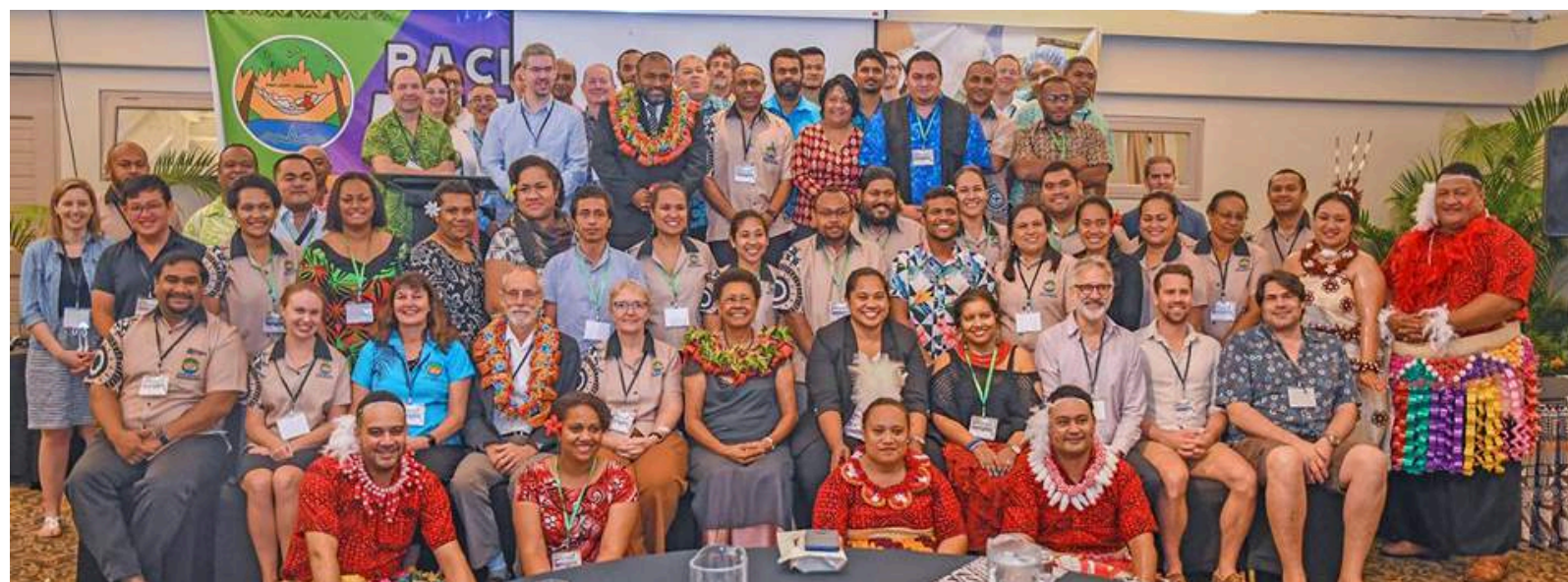
Minister for Health and Medical Services Dr Ifereimi Waqainabete with participants during the recent Asia-Pacific Parliamentary Forum on Global Health in Nadi.

Fiji is among only 13 countries that has managed to produce a National Adaptation Plan to address climate change vulnerabilities.