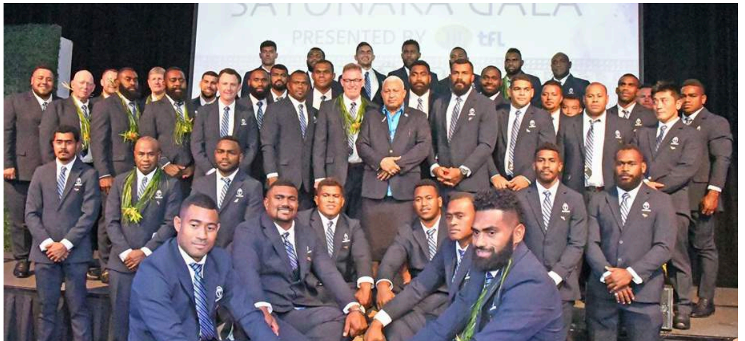
Oqori na timi qaqa ni noda vanua eratou vakarau laki valu ena qito levu kei vuravura ko ya ena Rugby World Cup 2019 ka na vakayacori e Japani.

E na cava tiko na veisisivi ena i ka ciwa ni siga ni vula o Seviteba 2019.