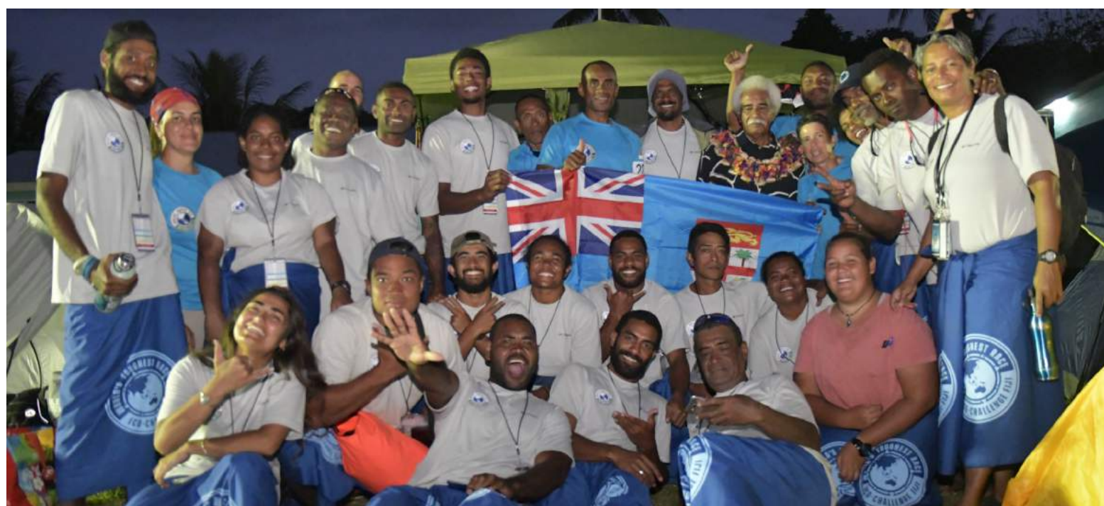
Members of local team Namak ahead of the Eco-Challenge Fiji race at Draubuta Village in Tailevu on Monday.

"I can assure you all that the Fijian Government will continue its support for the industry."