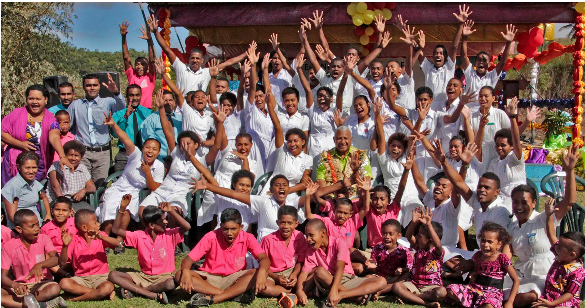
Prime Minister Voreqe Bainimarama (sitting, garlanded) says Fiji's Constitution is the very foundation of our democracy and the range of civil, political and socio-economic rights it enshrines, ranks our Constitution as one of the most progressive in any society.