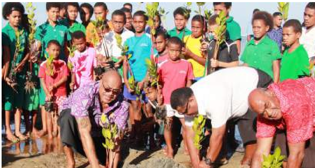
Teachers and students of Ratu Filise Primary School at Namatakula, Nadroga, plant mangroves under the Youth Coast Care programme. Minister for Forests Osea Naiqamu says the International Tropical Timber Organisation (ITTO) project aims to protect the entire coastal ecosystem that supports riparian flatlands.

"The targeted communities include villages of Natila, Waicoka, Nasilai and Naivakacau in the Tailevu province, Narocake and Muanaira in the Rewa Province. These communities are being empowered