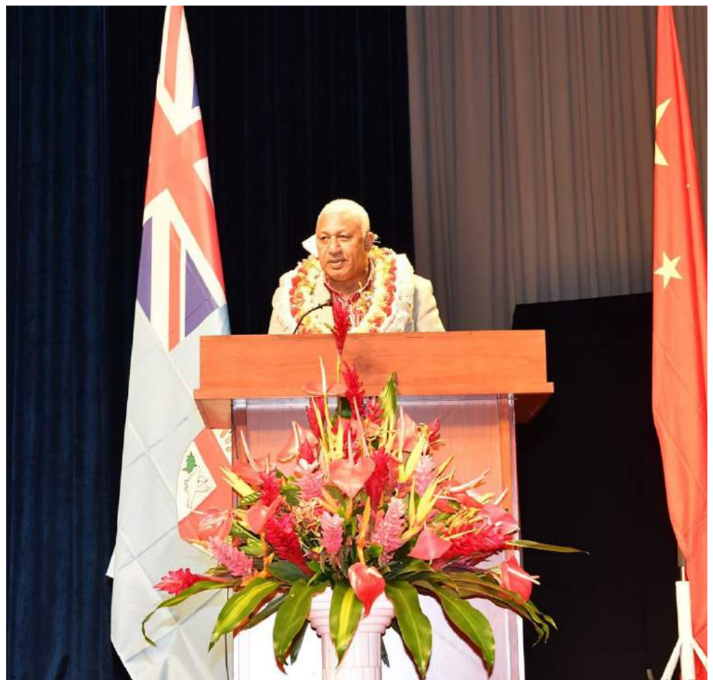
Prime Minister Voreqe Bainimarama joined the Chinese community in the celebration of the 70th anniversary of the founding of the People's Republic of China

Pinpointing the mainstay of this bilateral ties, Prime Minister Bainimarama said, the Fiji-China relationship is one that has been