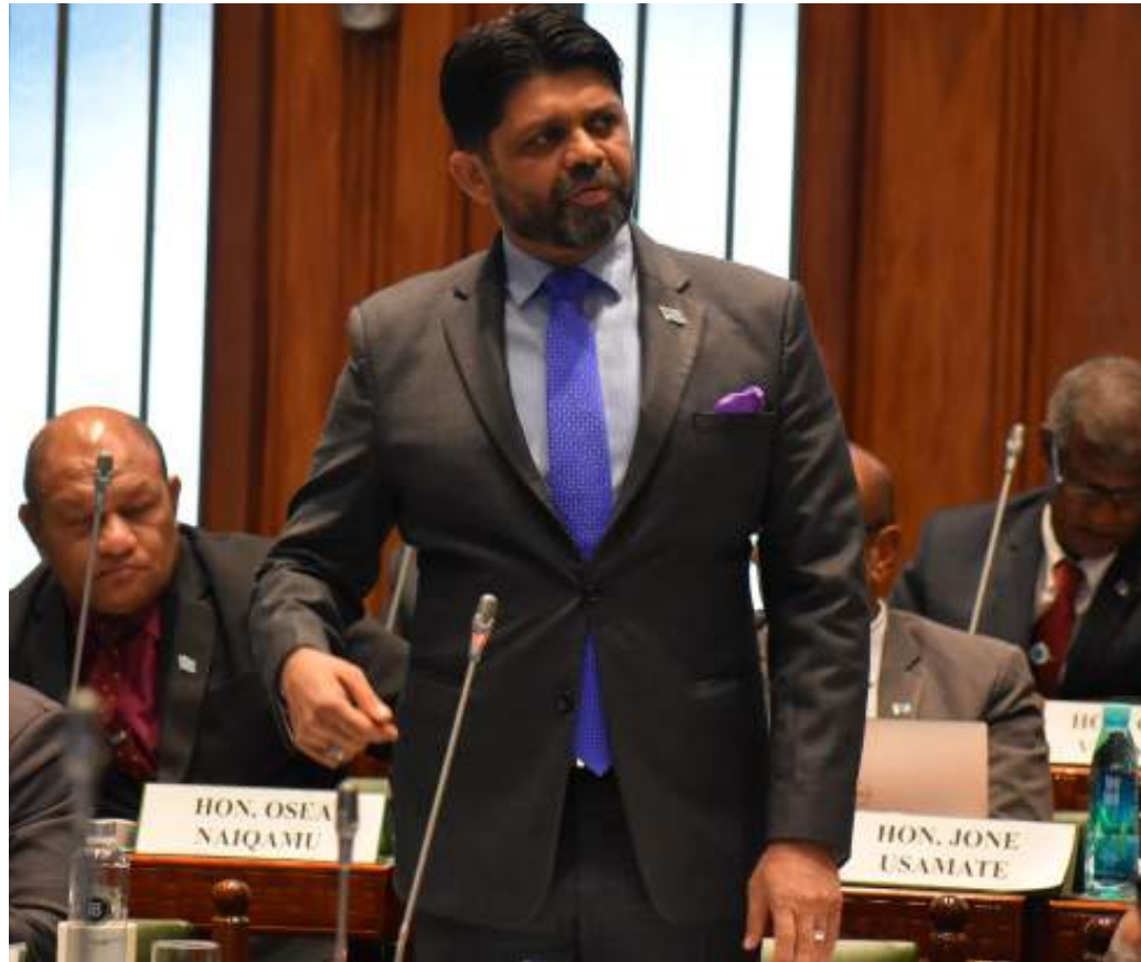
Attorney-General and Minister for Economy Aiyaz Sayed-Khaiyum addresses Parliament during last week's sitting.

The figures for 2019 is still yet to be produced because the year has not ended.