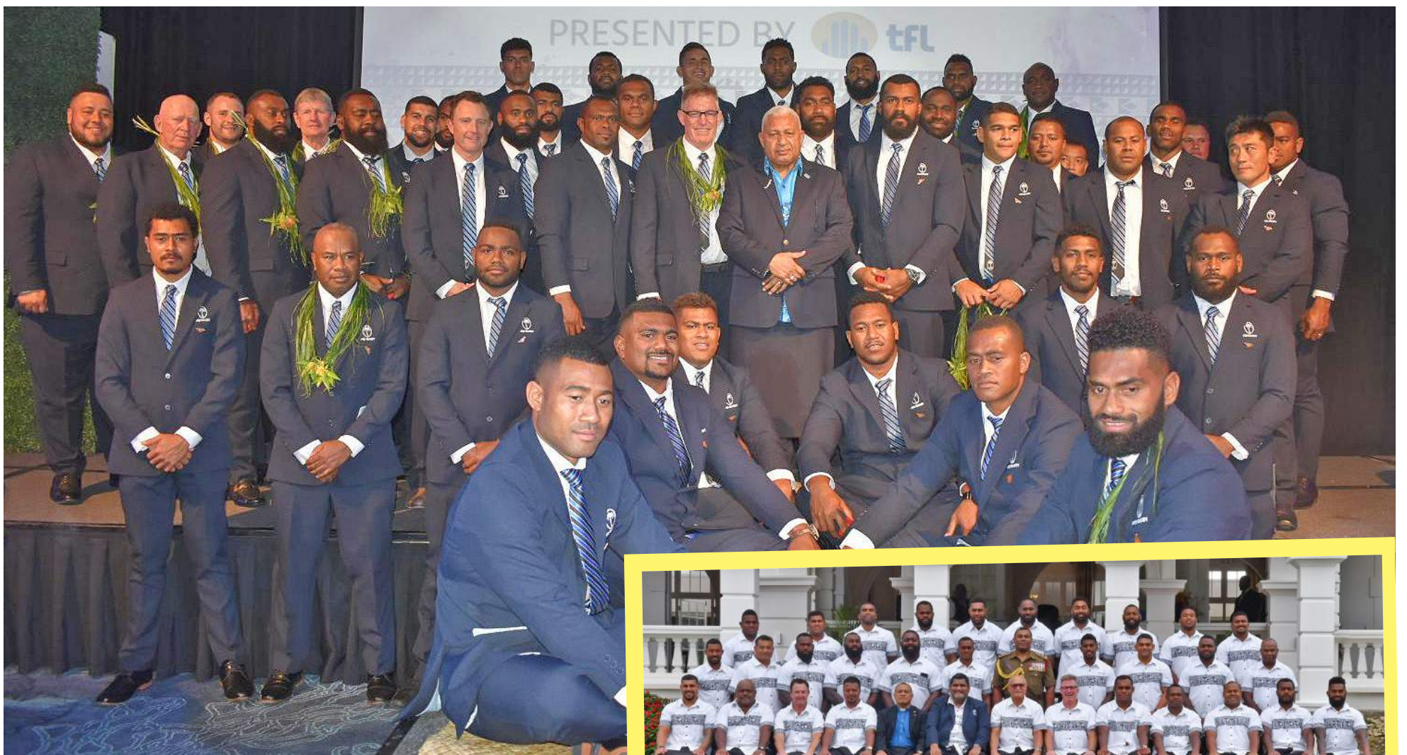
Prime Minister and Fiji Rugby Union President Voreqe Bainimarama with members of the Fiji Airways Flying Fijians team to the 2019 Rugby World Cup in Japan during the Sayonara Gala Dinner at the Sofitel Fiji Resort & Spa in Denarau. RIGHT: President Major General (Ret'd) Jioji Konrote with Fiji Airways Flying Fijians team members after presenting their itatau at State House in Suva.

FILM FIJI HOSTS 362 PRODUCTION IN 5 YEARS 2