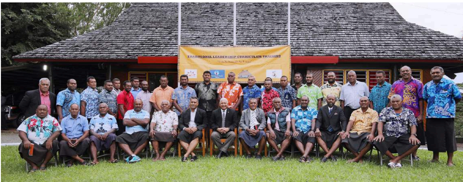
Prime Minister Voreqe Bainimarama with provincial leaders during the Traditional Leaders Curriculum Training at Centre For Appropriate Technology Development, Nadave in Tailevu.

This will also bring down expenditures and make Fijian sugar more competitive in the increasingly uncertain global market.