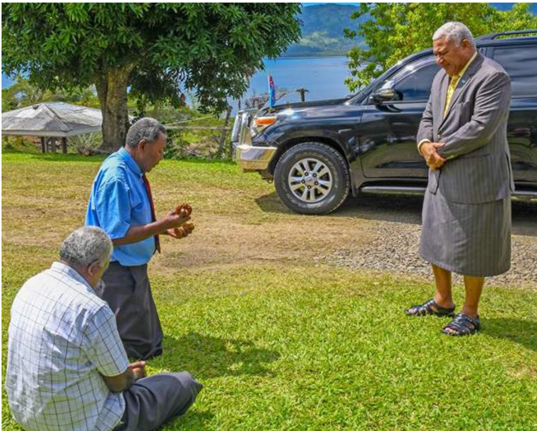
Vakayacori tiko oqori na i vakasobu vua na Paraiminisita Voreqe Bainimarama ena nona yaco yani ki na Bosa ni Yasana ko Ra e Nanukuloa..