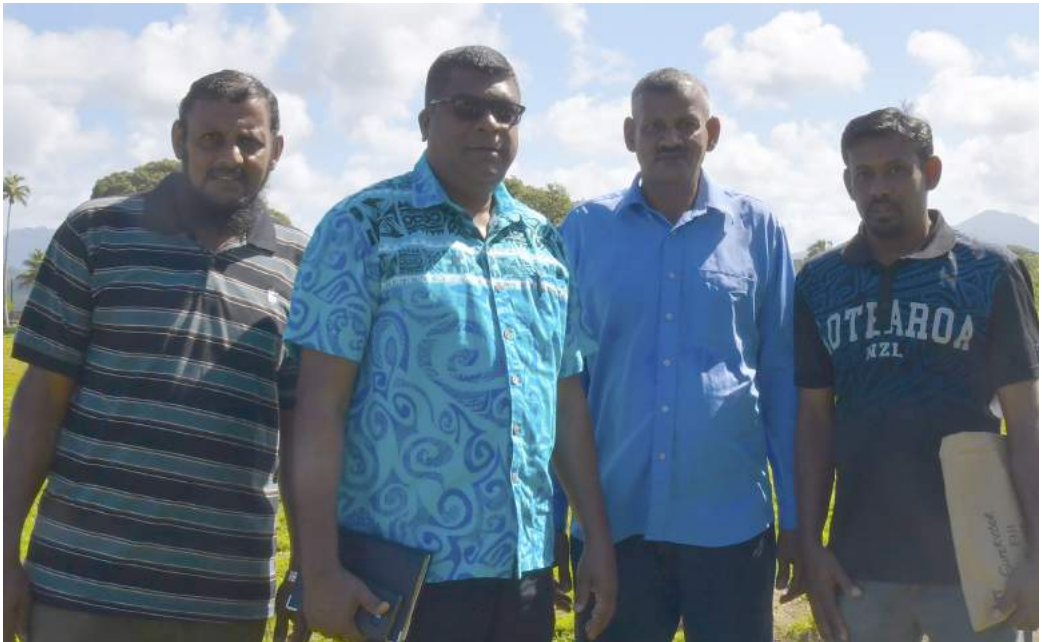
कृषि मंत्री डाक्टर महेन्द्र रेड्डी, नावुआ में वोटरवैस मंत्रालय की कुछ योजनाओं का दौरा करते हुए।

कृषि मंत्री डाक्टर महेन्द्र रेड्डी ने आम किया है कि मंत्रालय ने नावुआ में लगभग चार सौ (400) अक्कड़ में धान की खेती शुरू करवा दी है। पिछले महीने नावुआ में किसानों से मुलाकात करते हुए डाक्टर रेड्डी ने किसानों को बड़े पैमाने पर खेती करने के लिए प्रोत्साहित किया। उन्होंने कहा कि नावुआ में धान की खेती काफी हद तक कम हो गई थी तथा ज़मीनें खाली पड़ी थी। कृषि मंत्रालय ने इन ज़मीनों में नालों पर काफी काम किया है ताकि किसान इनमें खेती कर सकें। मंत्री रेड्डी ने कहा कि नावुआ में इरिगेशन सुधारने के अलावा नाले बनाने वाली योजना में सरकार ने पिछले दो सालों में आधा मिलियन डोलर खर्च किया है। उनके अनुसार इससे धान की खेती को पुनर्जीवित किया गया है। उन्होंने बताया कि गैस फार्म रोड जो भारी मात्रा में धान की खेती कर रहा है, के अलावा अभी चार सौ (400) अक्कड़ ज़मीन में धान की खेती शुरू हो गई है। मंत्री के अनुसार भारत का एक किसान नावुआ में एक सौ पचास (150) अक्कड़ ज़मीन में धान की खेती करने जा रहा है और यह एक बहुत ही सकारात्मक कदम है। उन्होंने कहा कि बाकी के किसान दस से बीस अक्कड़ ज़मीन में धान की खेती कर रहे हैं।