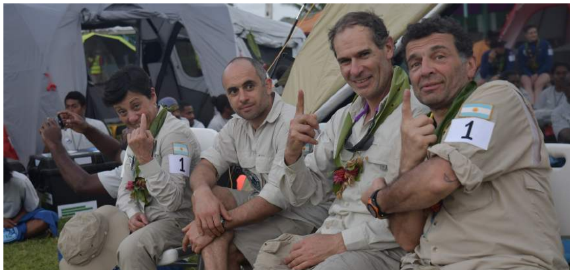
Members of the Argentina team at Draubuta Village in Tailevu on Monday.

Eco Challenge is considered as one of the world's toughest adventure race and a reality television show, hosted by the daredevil Bear