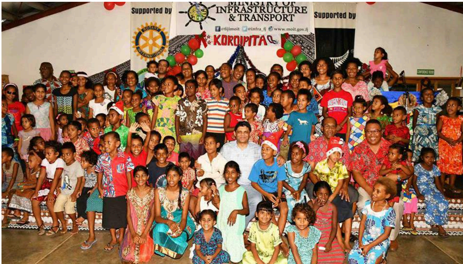
Attorney-General and Minister for Economy, Aiyaz Sayed-Khaiyum with children of Koroipita. A total 600 Fijians will soon have cyclone safe homes after the completion of Stage three and four of the Koroipita Model Town Charitable Trust.

The applicants were granted a minimum of $1,500 and up to $7,000 maximum for the cost of repairs to their home.