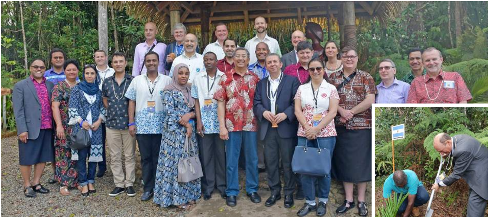
Non-resident heads of missions after participating in the 4 million trees in 4 Years initiative recently.