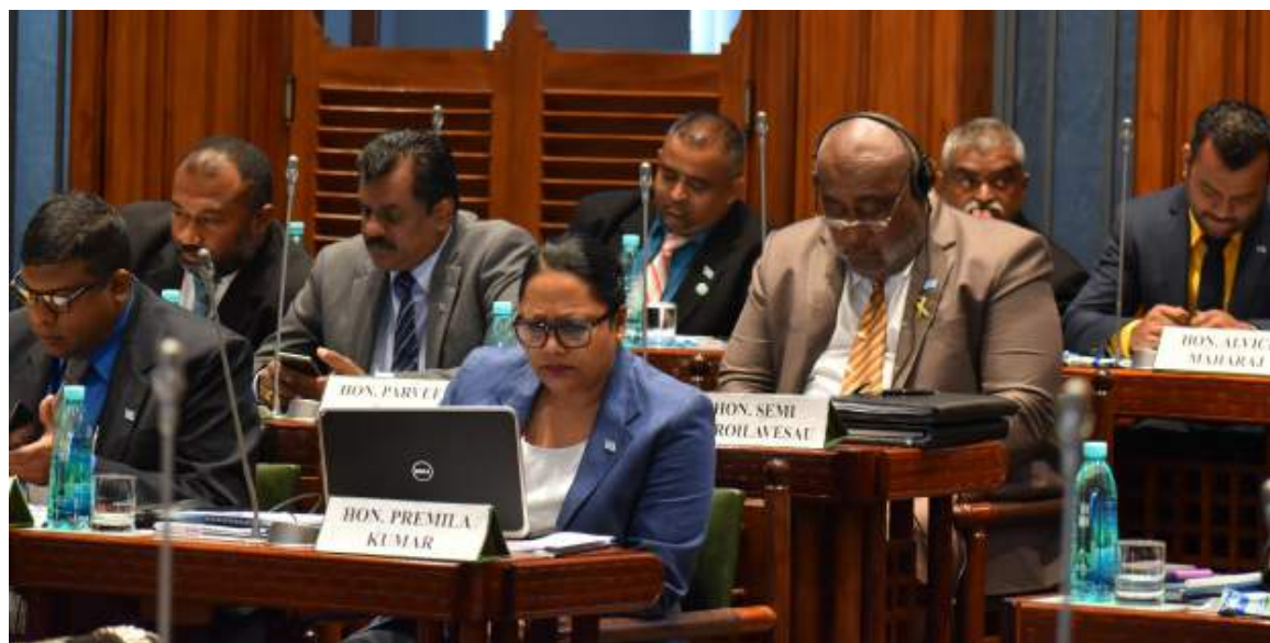
Members of Parliament during last week's sitting.

F IJI will develop aquaculture to provide greater food security and in doing so, offset the increasing pressure on wild stocks and other impacts on marine ecosystem.