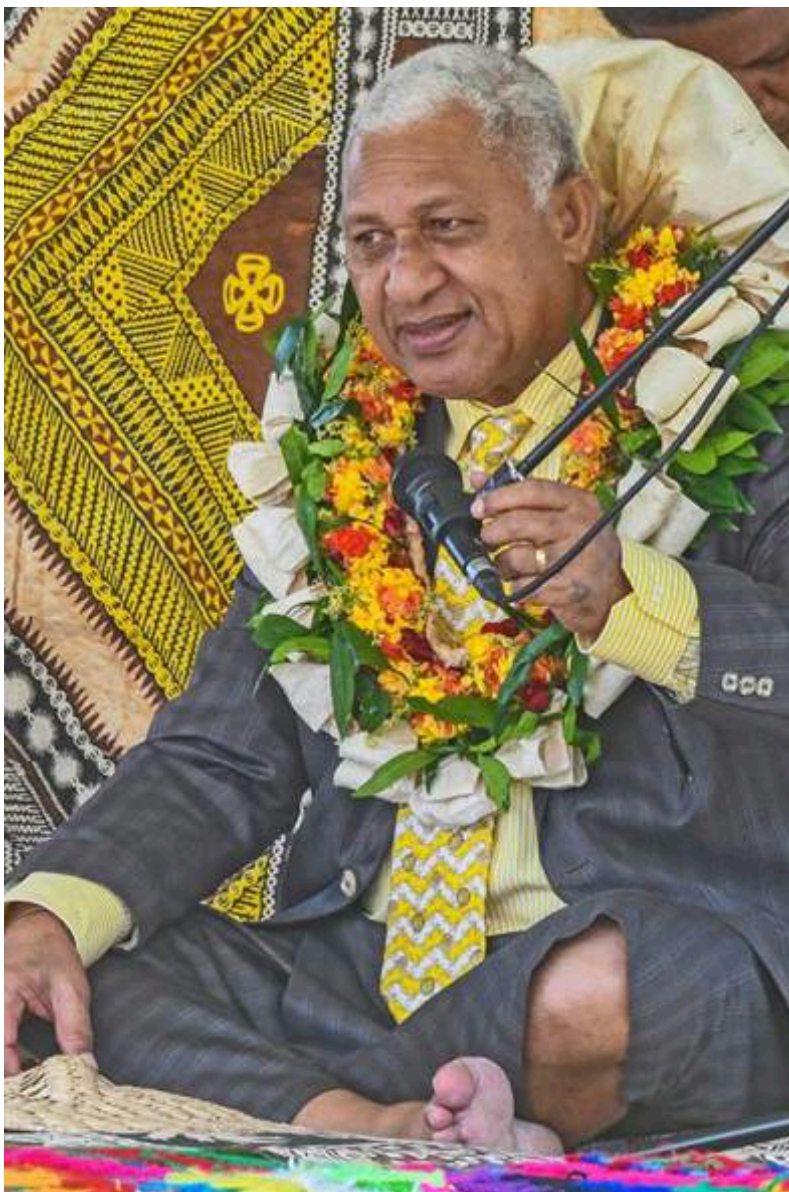
Ko Paraiminisita Voreqe Bainimarama ena nona dolava na Bose ni Yasana ko Ra e Nanukuloa.

“Ni rabailevu na nomu vakasama, ena rawa ni o tuvana vakabalavu na nomu rawaka. Mo cavuikalawa vata na tubu vakailavo ni noda vanua. Ni ko vakayacora oya ona vukie iko ka vukea na bula raraba ni noda vanua.”