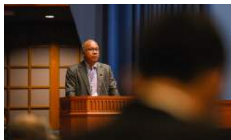
United Nations ESCAP (@UNESCAP)