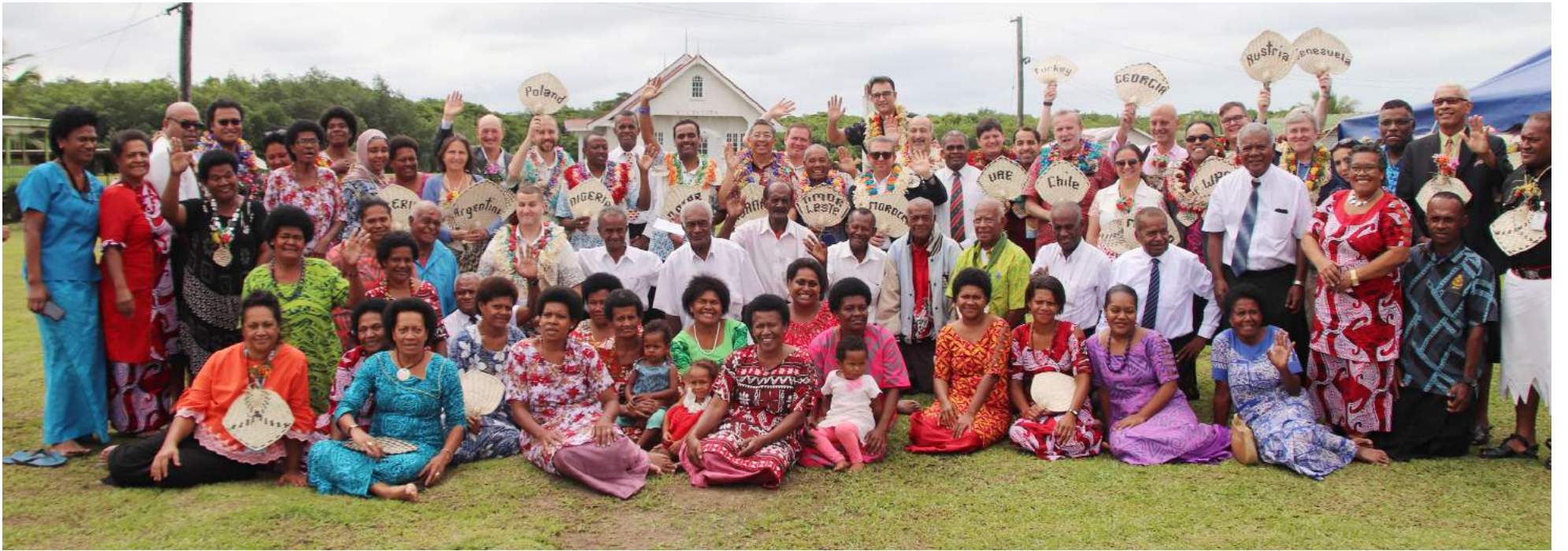
Non-resident Ambassadors and High Commissioners accredited to Fiji from Canberra and Wellington at Daku Village, Tailevu, during the first familiarisation visit programme last week