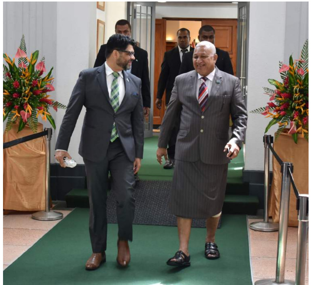
The Attorney-General and Minister for Economy, Aiyaz Sayed-Khaiyum with Prime Minister Voreqe Bainimarama in Parliament last week. The A-G gave an update on Fiji's upgraded credit rating.

He said there was a bank that was "sucking in" deposits towards the end of last year and earlier this year and was offering very high interest rates for deposits but the rate has come down.