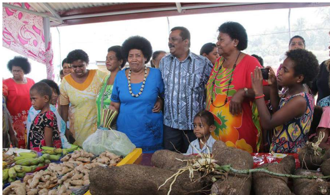
लोकल गवमन्ट मंत्री परवीन कुमार तावाकुम्बू लौतोका में सेटलाईट मार्केट का उद्घाटन करते हुए मार्केट विक्रेताओं के साथ।

मंत्री कुमार ने कहा कि जनता की माँग पर लौतोका सिटी काउन्सल