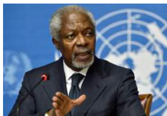
Former UN secretary-general Kofi Annan.

Frank Bainimarama (@FijiPM) A decorated Nobel Peace Prize winner, Mr. Kofi Annan will be remembered for his unwavering leadership which helped launch the United Nations into the 21st Century. His dedication and commitment to the values on which the United Nations is founded will be long remembered.