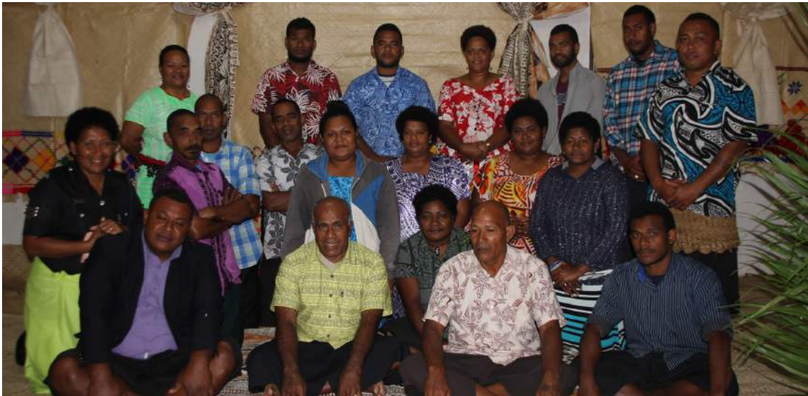
Youth leaders from villages on Vanuabalavu island with Minister of Youth and Sports Laisenia Tuitubou at Lomaloma Village.

"For all Government assistance given by the Ministry of Youth to assist youth groups they need to present a three-month business