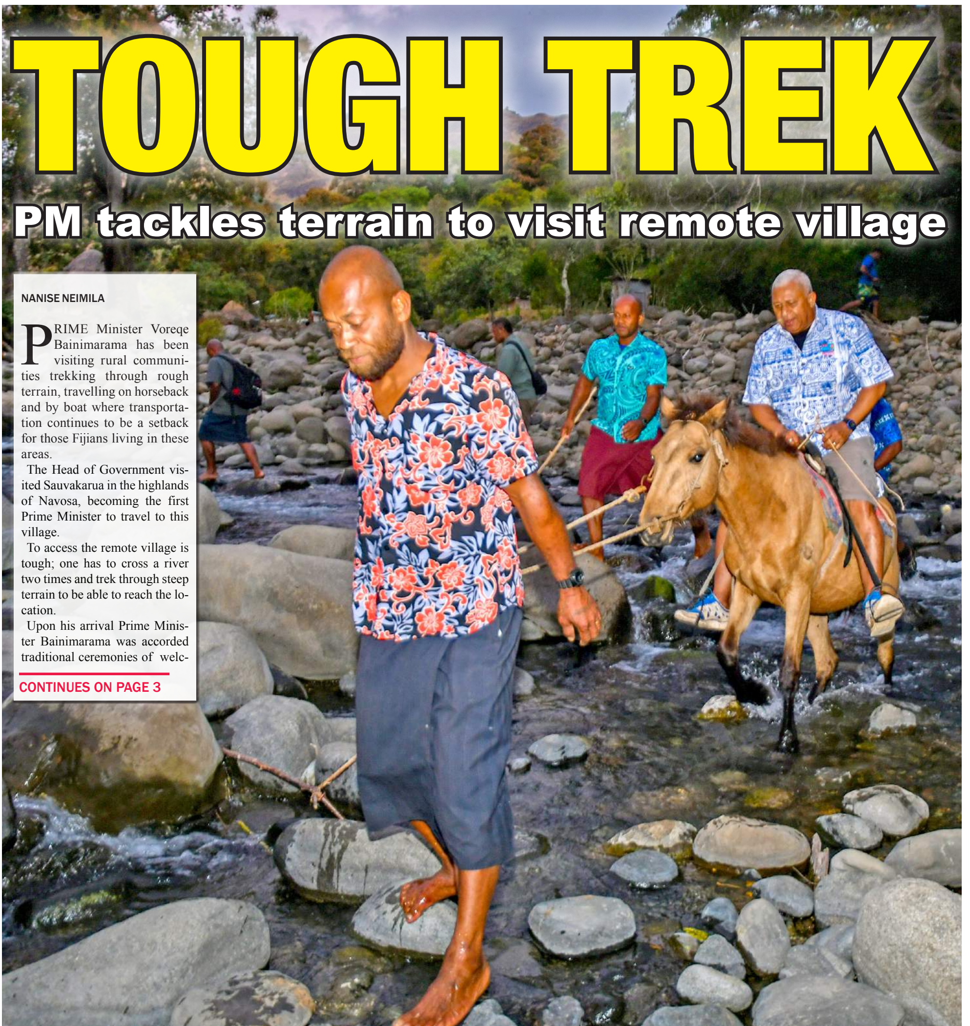
Prime Minister Voreqe Bainimarama on his way to visit Sauvakarua Village in the highlands of Navosa.