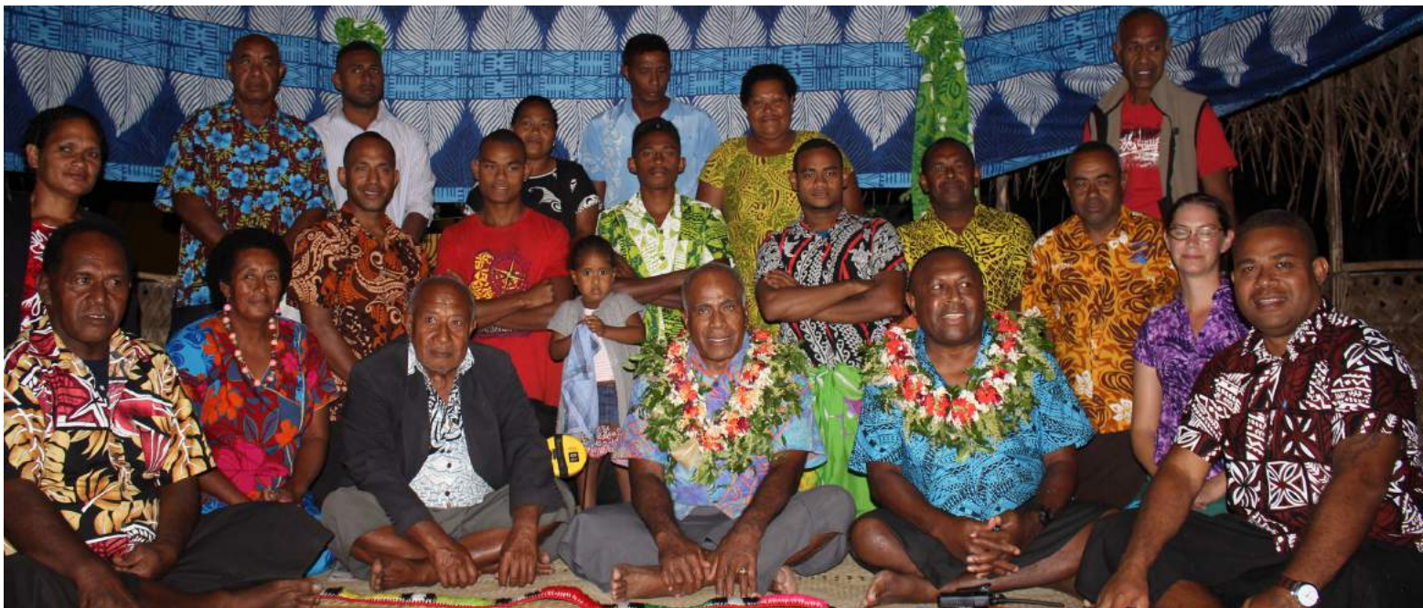
Minister of Youth and Sports Laisenia Tuitubou with youth members of Vanuavatu island.

Minister of Youth and Sports Laisenia Tuitubou