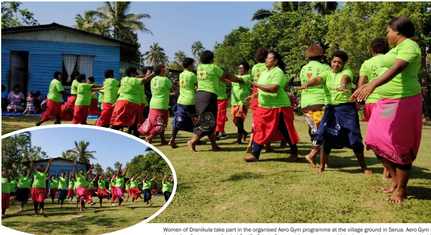
Women of Dranikula take part in the organised Aero Gym programme at the village ground in Serua. Aero Gym is an Australian Government funded Pacific Sports Partnership programme which aims to combat non-communicable diseases and provide leadership opportunities for women.

The Award was founded by The Prince Philip, the Duke of Edinburgh and husband of Queen Elizabeth II, in 1956 in conjunction with Kurt Hahn, a German educationist.