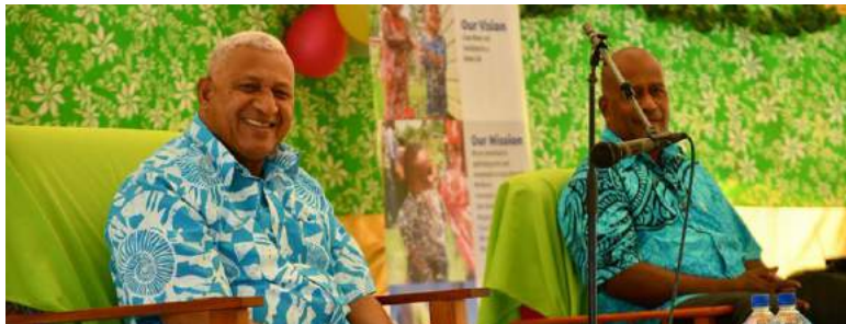
Na isevu ni Matanitu me vakadrodroya yani na wai savasava kina yanuyanu ko Vio na matanitu nei Paraiminisita Voreqe Bainimarama ka da sarava ena itaba era koto e cake na soqo lagilagi oqo e cavu ikalawa tale kina na Matanitu kai itukutuku ni veigauna kina yanuyanu ko Vio.