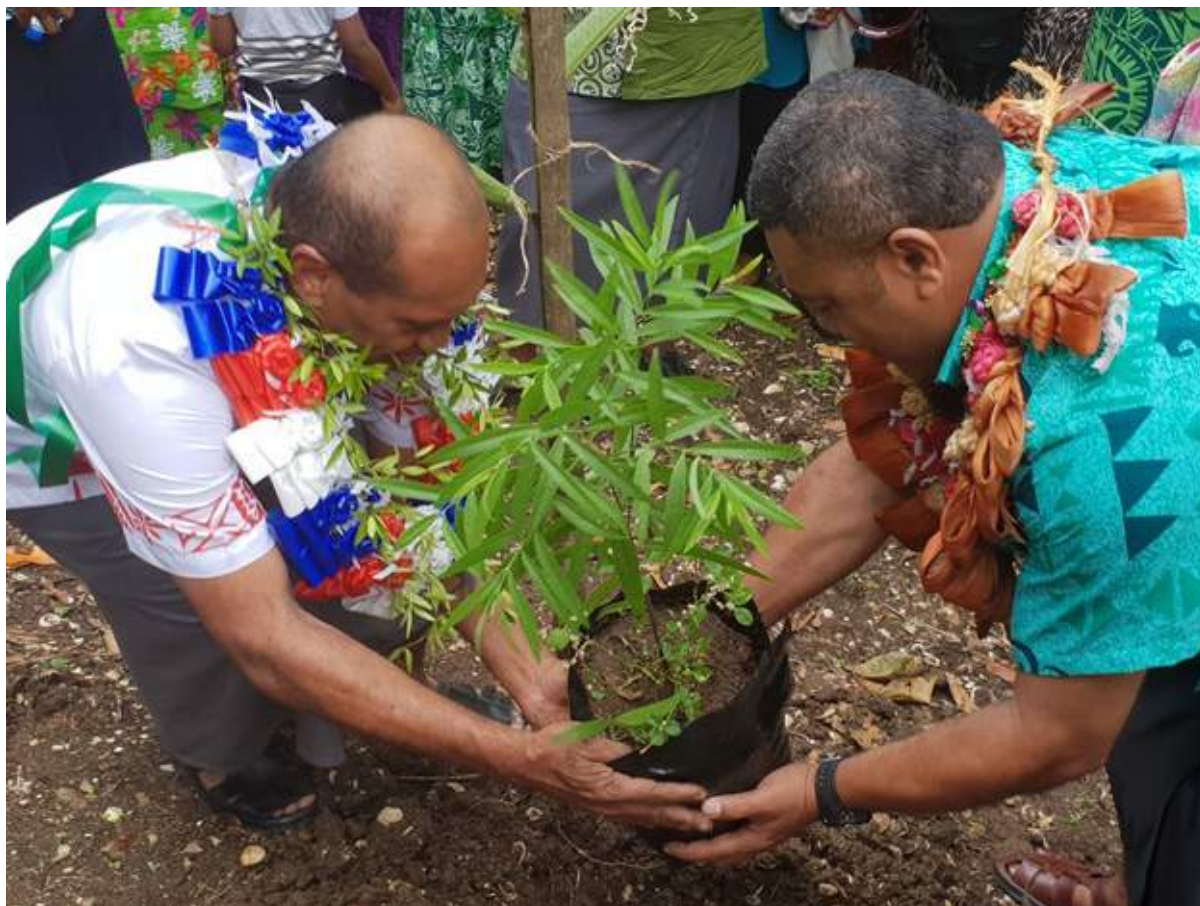
Minister for Employment, Productivity and Industrial Relations Jone Usamate, (left), during the commissioning of the Namara Pilot Project in Tailevu.

The WMP is also working with 10 primary schools to raise and release their own Wolbachia-carrying mosquitoes in their communities.