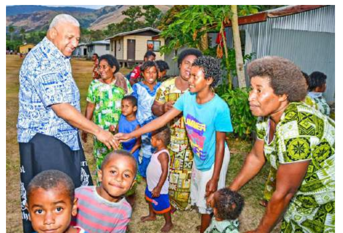
Prime Minister Voreqe Bainimarama meets Saukavarua villagers.

The Head of Government held talanoa sessions with the villagers on issues affecting them such as transportation, accessibility to Government services, telecommunications, infrastructure, health and education.