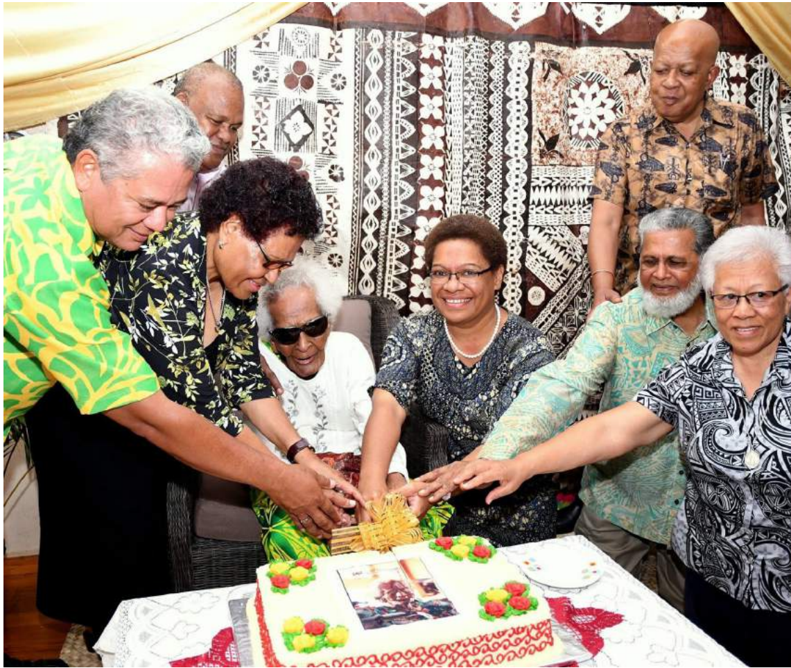
Minister for Women, Children and Poverty Alleviation Mereseini Vuniwaqa during the launch of the National Minimum Standards for Homes on the Care of the Older Persons in Suva.