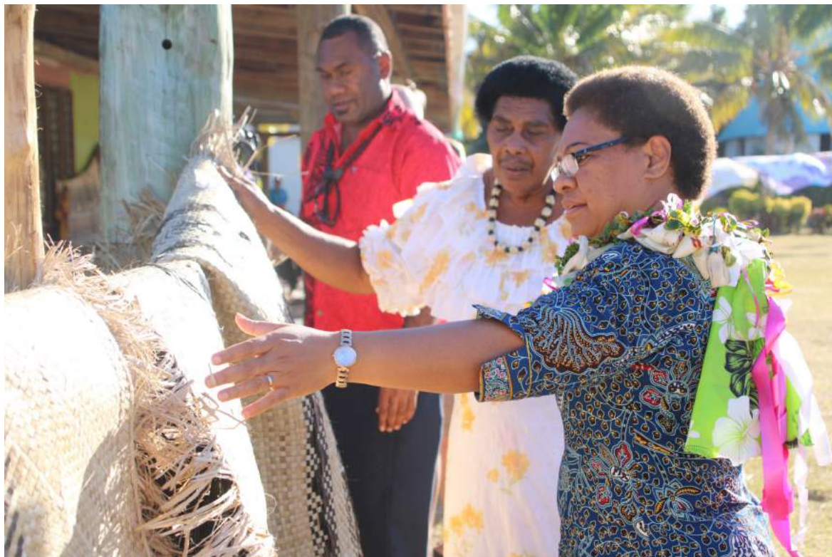
Minister for Women, Children and Poverty Alleviation Mereseini Vuniwaqa admires the traditional Yasawa mats on display during her visit at Nacula Village in Yasawa.

"In some places, traditional crafts have died out. These prod-