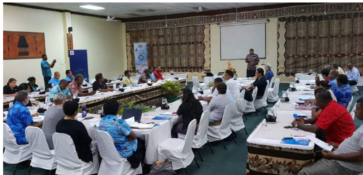
Participants during the National Sea Turtle Conservation Workshop at Studio 6 Apartments Conference Room in Suva.

The laws in place to protect turtles are the Fisheries Act and the Endangered & Protected Species Act while regulations are also in