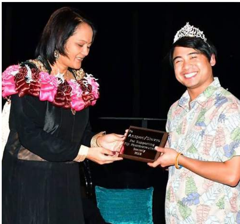
स्वास्थ्य और मेडिकल सेविसस मंत्री रोज़ी अखवर ने हालही कहा कि सरकार दवाईयों की उपलब्ध सुधारना चाहती है ताकि लोग मुफ्त एक सौ ब्यालिस दवाओं की सुची से दवा हासिल कर सकें।

“हम कोई भी कसर बाकी नहीं रखना चाहते हैं। दुख की बात है कि बच्चों के खिलाफ हिंसा उन लोगों के द्वारा होती है जो उनकी देखभाल करते हैं, परिवार वाले और कुछ माता पिता भी ऐसा करते हैं। ऐसे मामले को लेकर बैठा नहीं जा सकता।