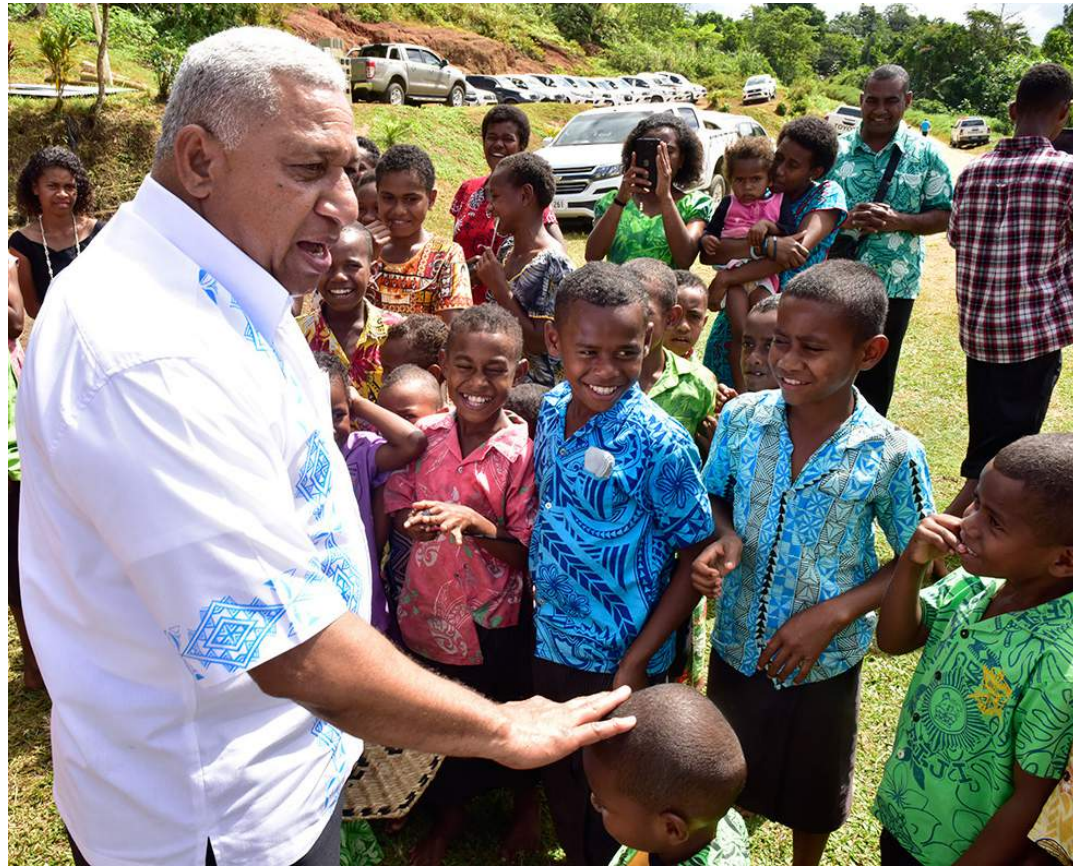
Prime Minister Voreqe Bainimarama with children during his visit to Natavea Village in Naitasiri.

Prime Minister Bainimarama became the first head of Government to visit Natuva in Tailevu and Natavea in Naitasiri.