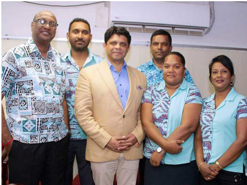
Attorney-General and Minister for Economy Aiyaz Sayed-Khaiyum during the 2018-2019 National Budget Consultation in the Western Division.

"Teachers can upgrade their Diplomas to B.A in areas such as Math's, Physics, Early Childhood Education and English and Literature,