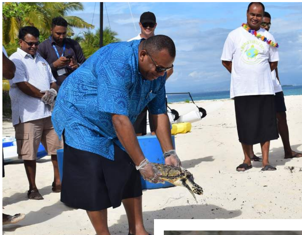
Minister for Agriculture, Rural and Maritime Development, National Disaster Management and Meteorological Services Inia Seruiratu releases one of five hawksbill turtles at Treasure Island during World Turtle Day earlier this year.