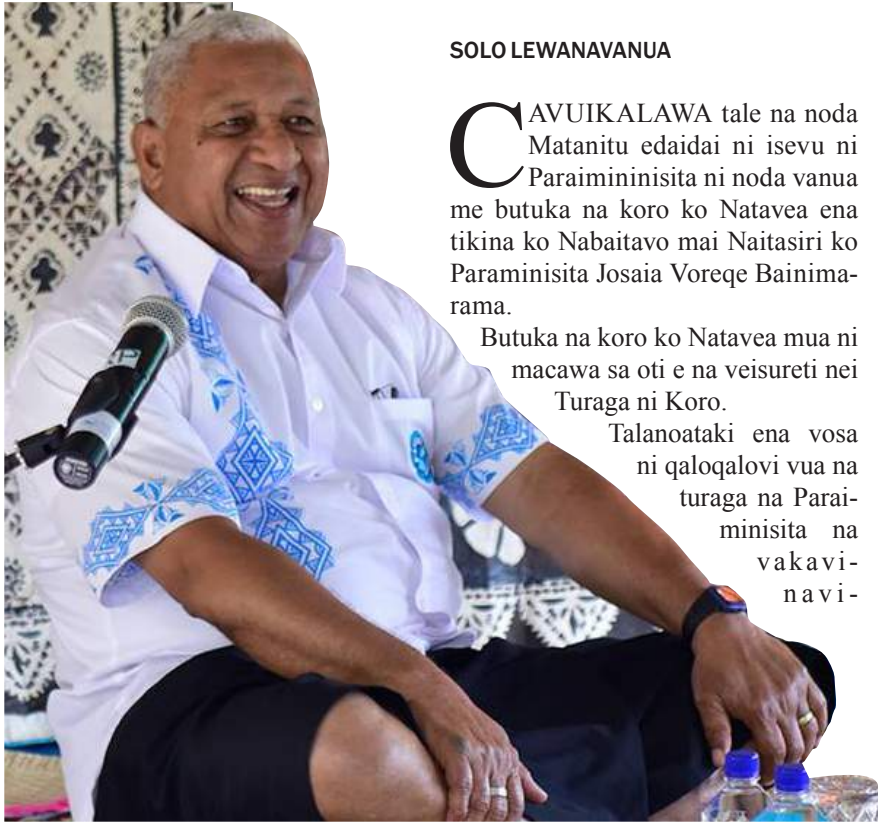
Ko Paraiminisita Voreqe Bainimarama ena nona veisiko voli ena koro ko Natavea e Naitasiri.