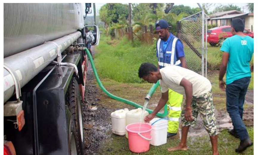
वोटर अथोरिटी ओफ फीजी ने अपने ग्राहकों से माँग की है कि वे सुखे के इस मौसम में पानी बचाकर इस्तेमाल करने वाले तरीके अपनाएँ जबकि यह मौसम अगले कुछ महीने तक जारी रहेगा।

अथोरिटी ने अपनी इमेजेन्सी टोल फ्री कोन्टेक्ट लाईन 1507 फिर से शुरू की है तथा लोग ईमेल waterhelp@waf.com.fj पर भी पानी बाँटने की माँग कर सकते हैं। याद रहे कि माँग करने पर आपको सेविस ओडर वाले नम्बर दिए जाएँगे ताकि आगे चलकर आप अपनी माँग पर जानकारी हासिल कर सकते हैं।