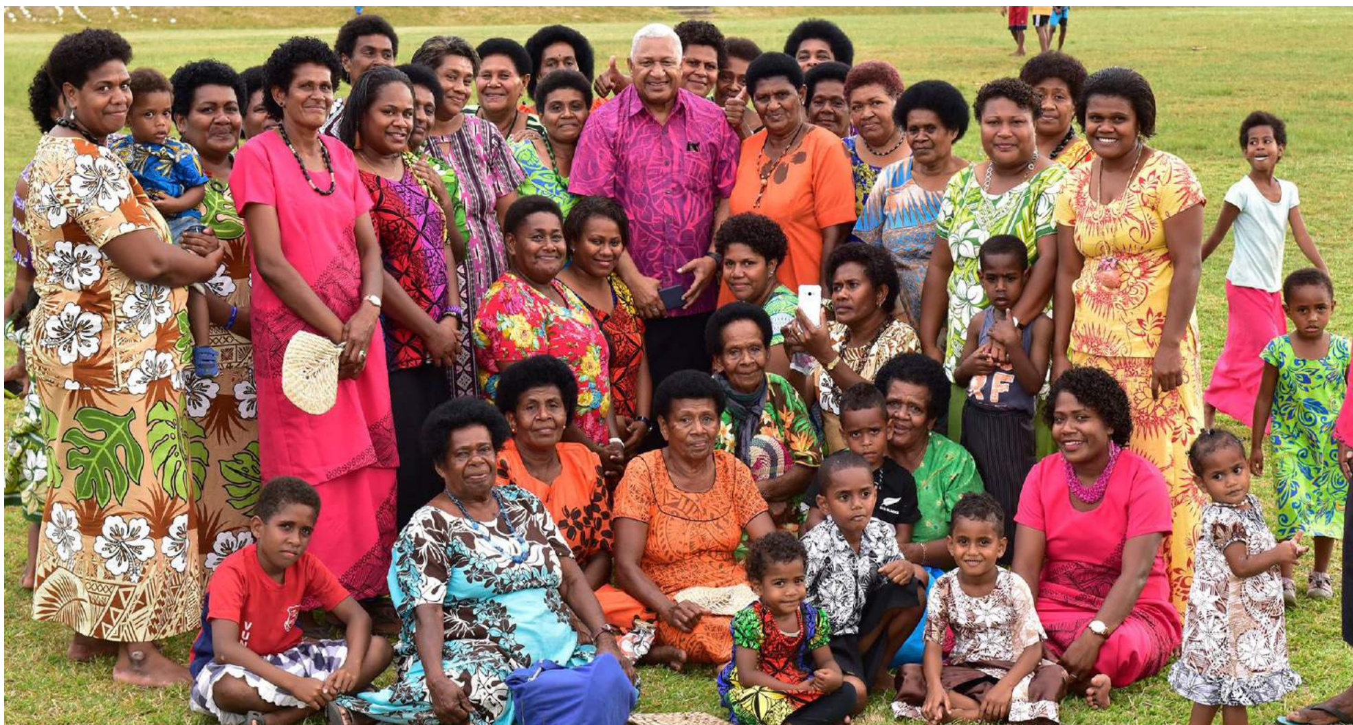
Prime Minister Voreqe Bainimarama with women and children during his visit at Lutu Village in Naitasiri.

GOVT ROADSHOW FOR INTERIOR COMMUNITIES 12-13