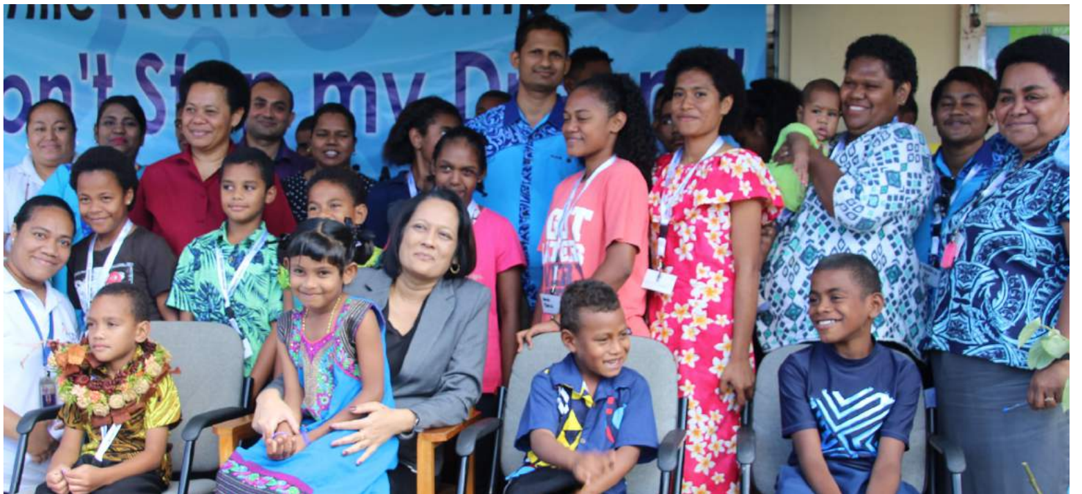
Minister for Health and Medical Services Rosy Akbar with officials and children from all over Vanua Levu attending the three-day Juvenile Camp in Labasa.

The structure is valued at $275,000, out of which $100,000 was funded by the Government.