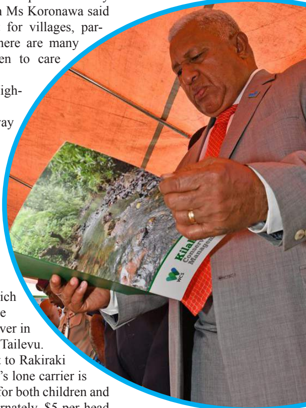
Prime Minister Voreqe Bainimarama during the Government roadshow at Naiwairuku in Ra.

He also lauded the inception of paid paternity leave for men and a finan-