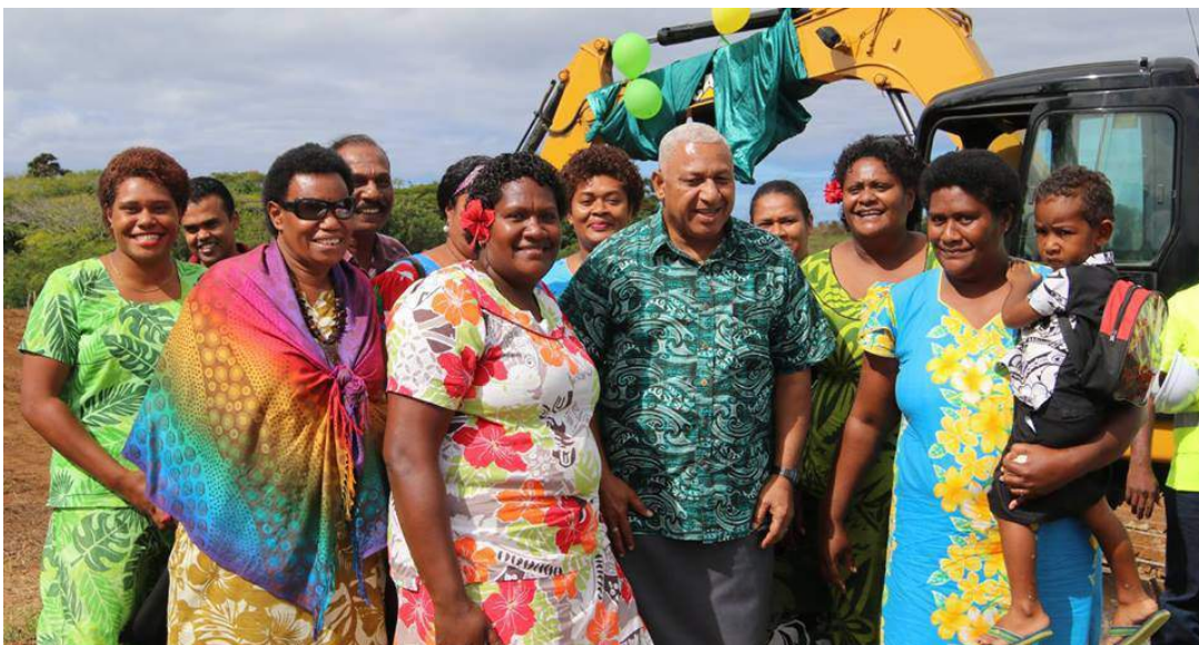
Ko Paraiminista Voreqe Bainimarama ena tavoci ni vakatorocaketaki ni nodra bisinisi na itaukei ni qele e Yadua e Nadroga.

Eda sa vakauqeti na dau saumi ivakavakacavacav meda vakadikeva na noda sala vou ni veiqaravi ena mona livaliva baleta na noda ivakacavacava se meda sikovi ira na dau veiqaravi se Customer Service Centres e Viti raraba ke tiko na vakata-taro.