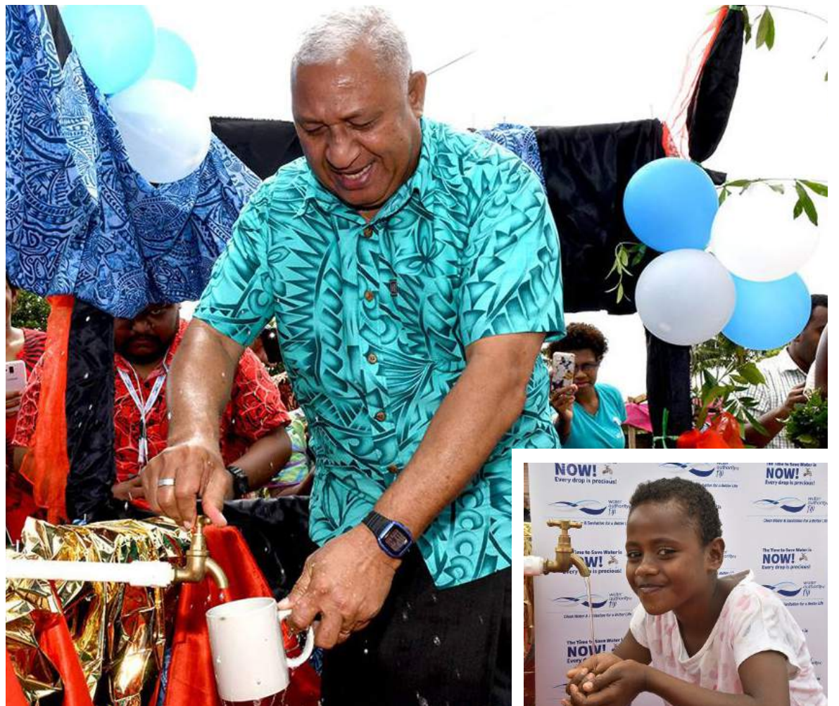
Prime Minister Voreqe Bainimarama officially opens the water project at Natadradave Village, Dawasamu, Tailevu. Tailevu. INSET: Ten-year-old Loata Raibeve is all smiles knowing she won’t have to travel far again to fetch clean drinking water.

“We would then have to walk six kilometres to Vorovoro Village to get water. For an adult it would take us 30 minutes, but for a child it would take them close to an hour,” the village headman said.