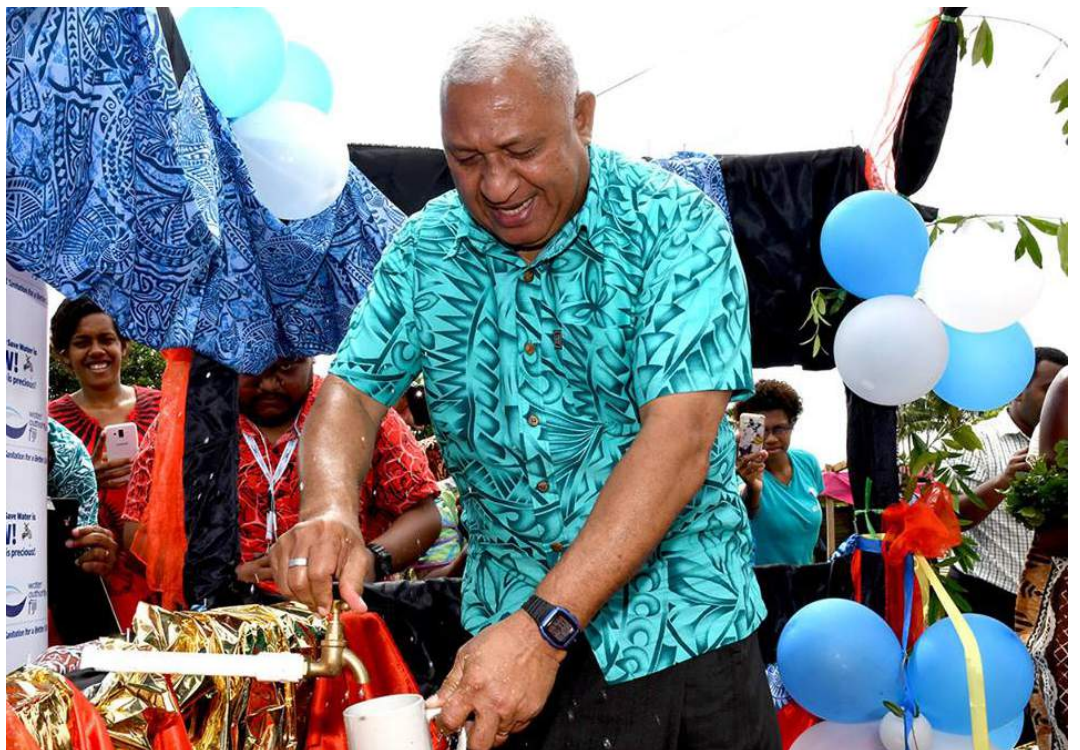
प्रधान मंत्री, वॉरेंगे बड़निमरामा ने हाल ही में ताईलेवू स्थित नतन्द्रादावे कोरो में पानी वाली नई योजना का उद्घाटन करते हुए कहा कि वो तबतक चुप नहीं बैठेंगे जबतक फीजी में हर एक परिवार की पानी वाली समस्या हल नहीं हो जाती।