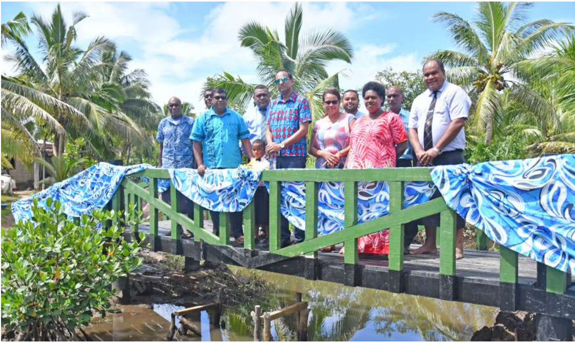
Na Minisita ni Wai Dr Mahendra Reddy kewa ira na lewe ni koro e Naivilaca ni oti na kena mai dolavi na nodra itatakoso vou e Noco, Rewa.

Oqori na Coronavirua kevaka oni sab era ni kila vinaka na kena I talanoa, okoya e mate veitauvi ka vua mai ena kania eso na manumanu ka sega ni samaki vinaka ka levu kina na duka. Na tauni ko Wuhan e tauyavu mai kina na mate oqo ka laurai ni sa tetevei Jaina totoloa saraga ena loma ni vica na siga ena macawa rua sa oti. Tukuna oira na kenadau vakavuniwai kei na tiko bulabula ni mate oqo esa bvakamatei ira saratikoga na kai Jaina ena loma ga ni vica na aua na kena dewavi ira yani. Ka laurai ni mate e veitauvi totolo saraga baleta na duka ni vakarautaki ni kakanana. Na lawa vata oqori esa vakadonua mai ko Sigapore, Australia ka vakatabui kina na takosovi ni nodrau border se yalayala ni curuvanua me yacova ni sa dua tale na veisau ni tukutuku oqo.