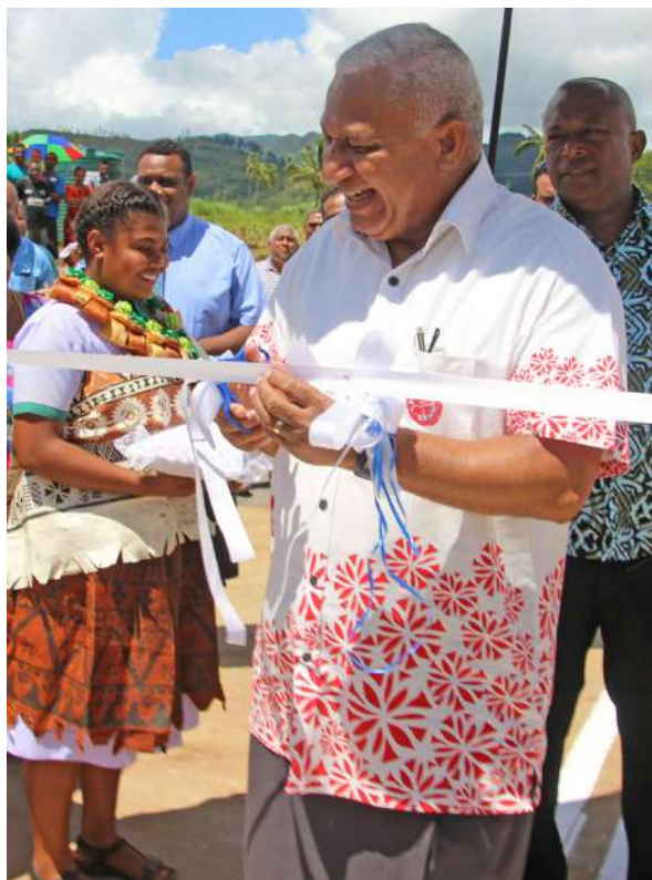
Prime Minister Voreqe Bainimarama officially opens the new Korotari bridge in Labasa.

Prime Minister Voreqe Bainimarama, while opening the bridge, said the $4.5 million Bridge represented a direct investment in the opportunities available to Fijian people.