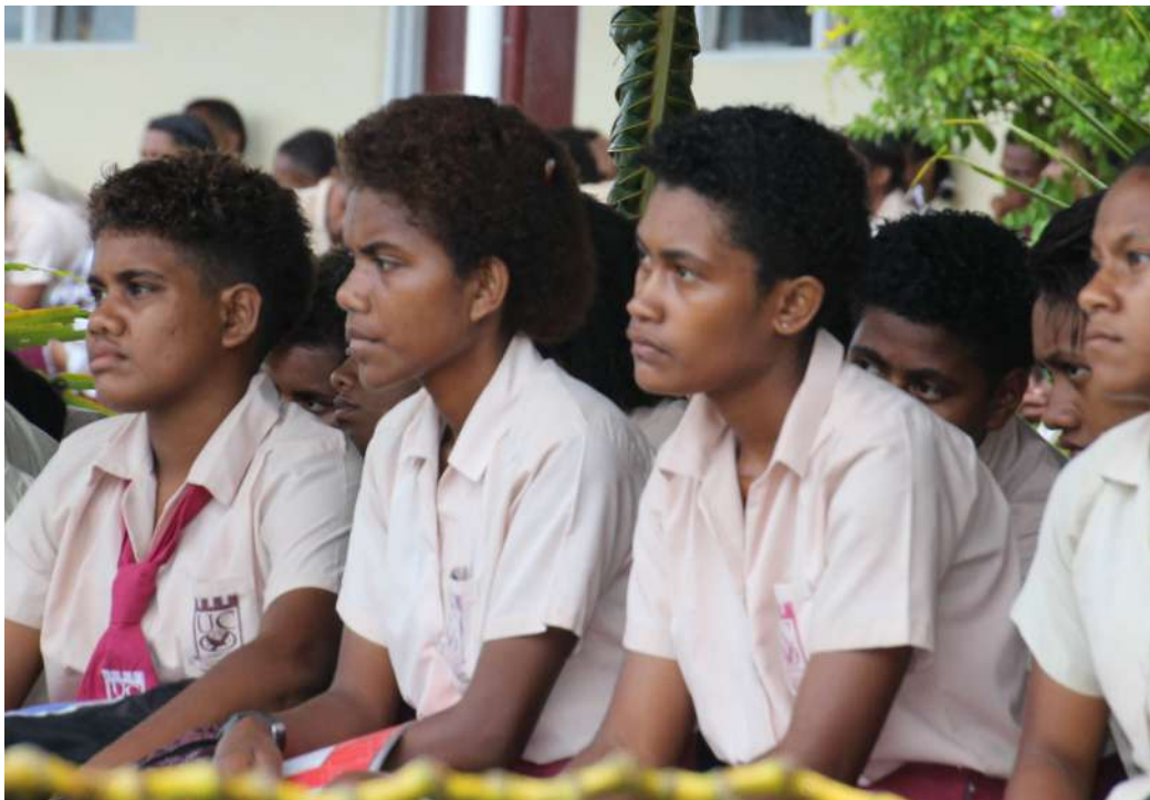
Uluvalili College students in Wailevu, Cakaudrove.

Established in 2012, the school is home to