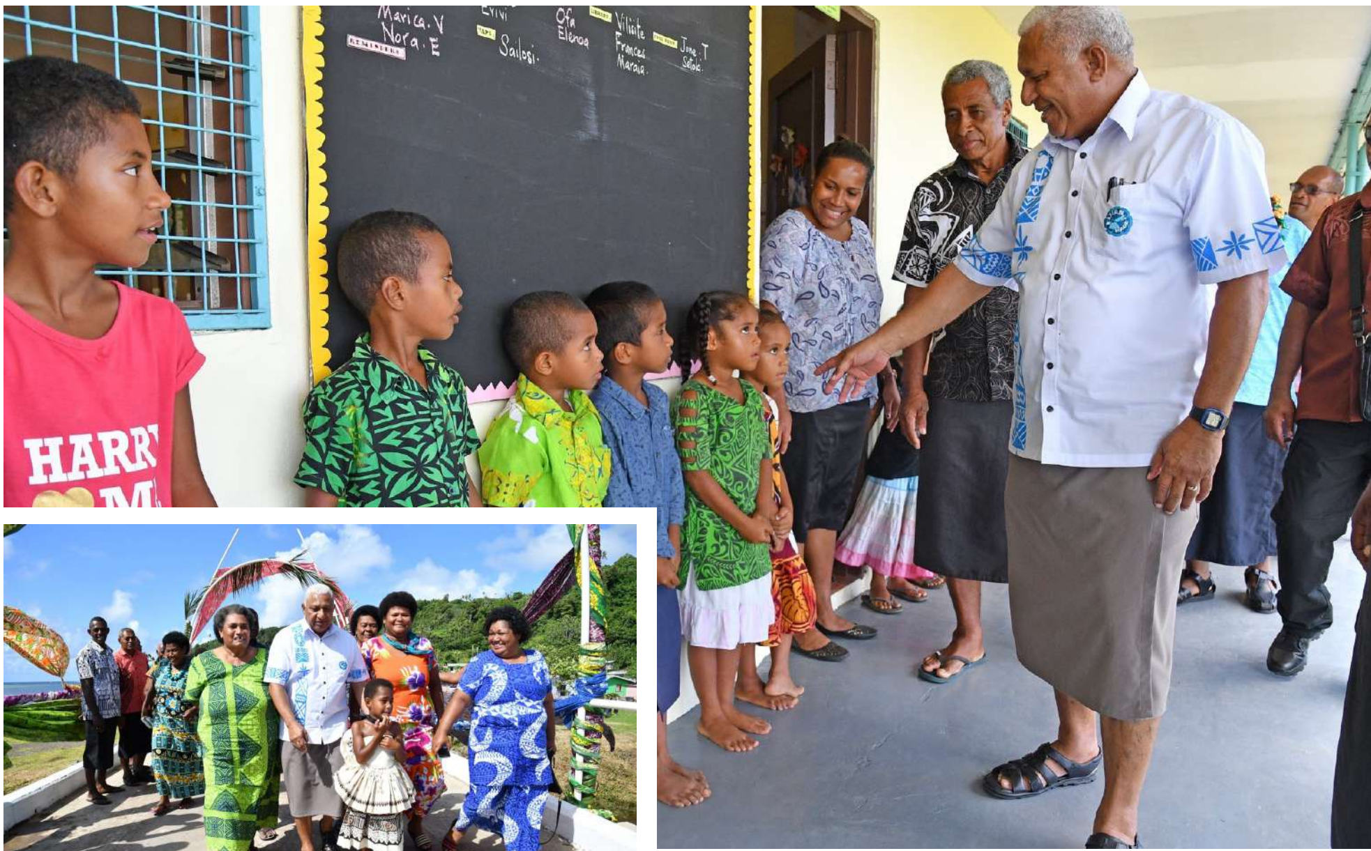
Prime Minister Voreqe Bainimarama meets children at the official opening of the four new low-level bridges during his visit to Koro Island earlier this week.