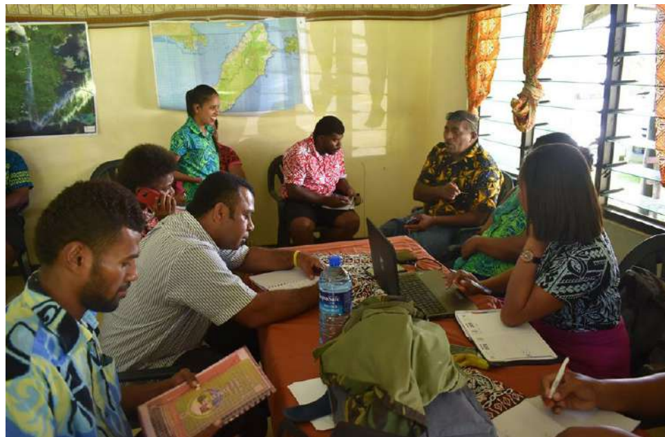
2020 Fiji Agriculture Census enumerators during a training on the use of the data collection tools and processes.

"There is a high demand for agriculture information not just locally but also globally and such pleas have been a driving force in