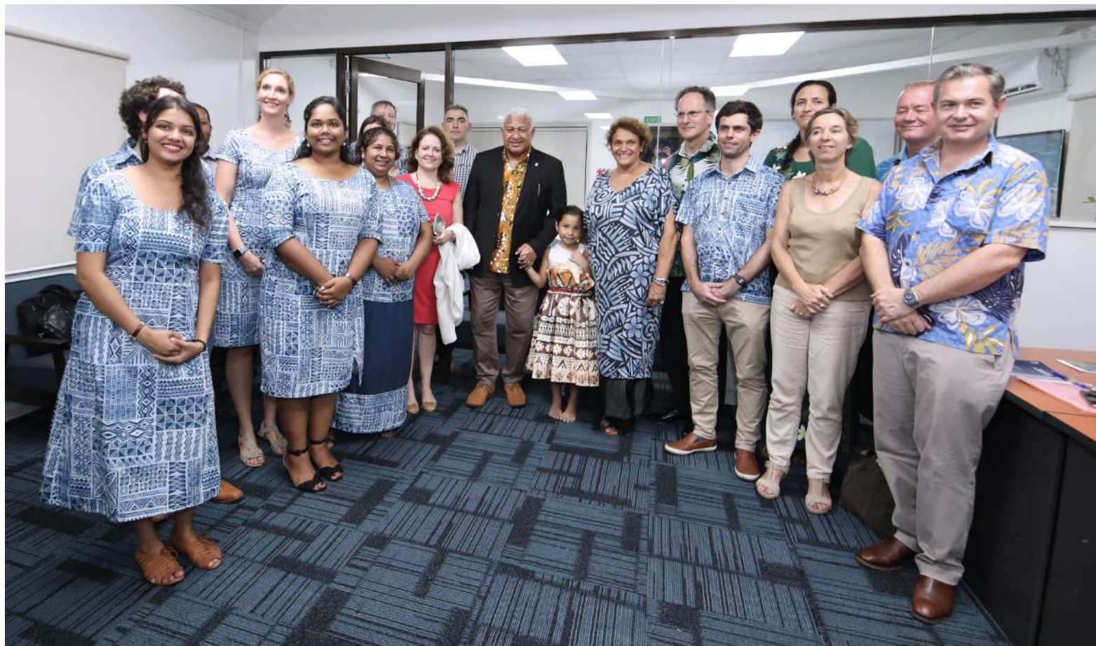
Prime Minister Voreqe Bainimarama with staff of the Regional Pacific Nationally Determined Contribution (NDC) Hub office in Suva.

Meanwhile, all of the ministries operations are being standardised under the ISO 9001 2015 Quality Management System.