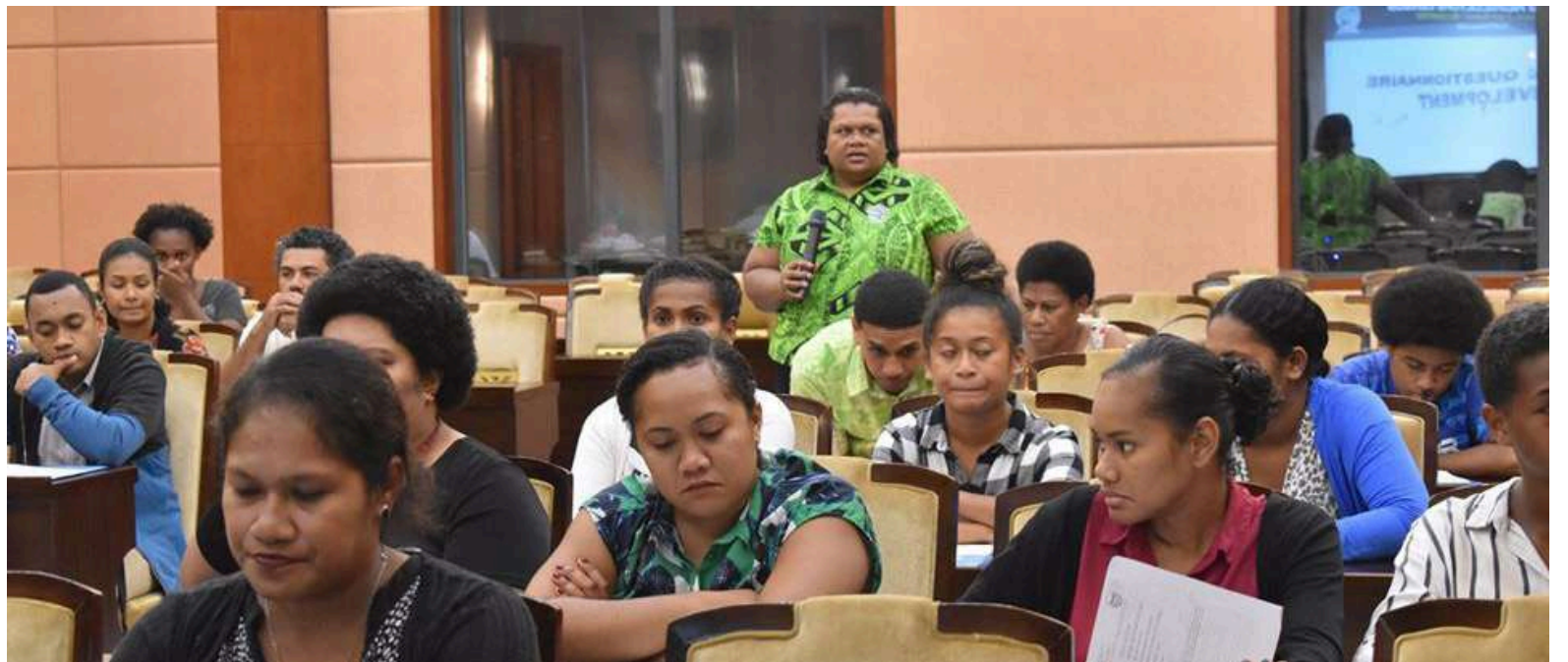
Na qaravi ni wiliwili ni Tabana ni Teitei e dau qaravi ni oti na vei 10 na yabaki. Na kena sa oti a qaravi ena yabaki 2009.

vakatorocaketaki ira tiko e sega ni taucoko tu na kumuniu ni nodra iwiliwili.