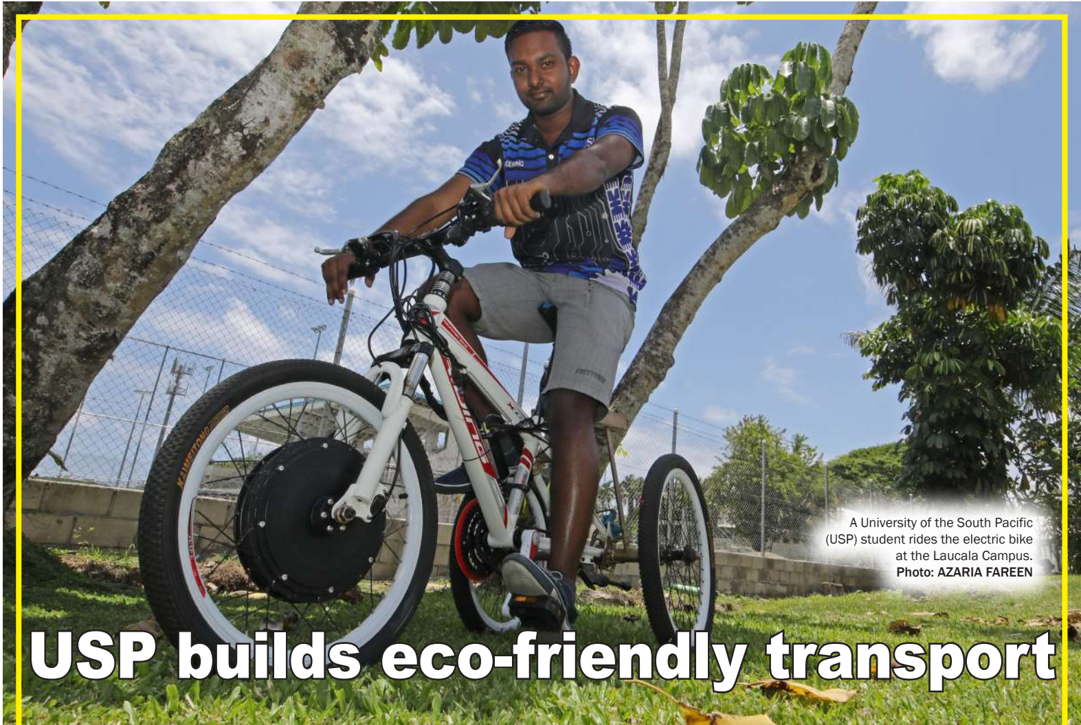
A University of the South Pacific (USP) student rides the electric bike at the Laucala Campus.

Their target for the end of this year is to influence at least 20 people to convert to veganism and to plant 200,200 mangrove seedlings.