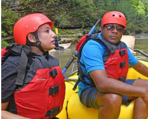
Minister for Agriculture, Rural and Maritime Development, Waterways and Environment Dr Mahendra Reddy (right), at the 2020 Wetlands Day Celebration at the Upper Navua Conservation Area, in Serua.

“Wetlands are incredibly vital for humans,