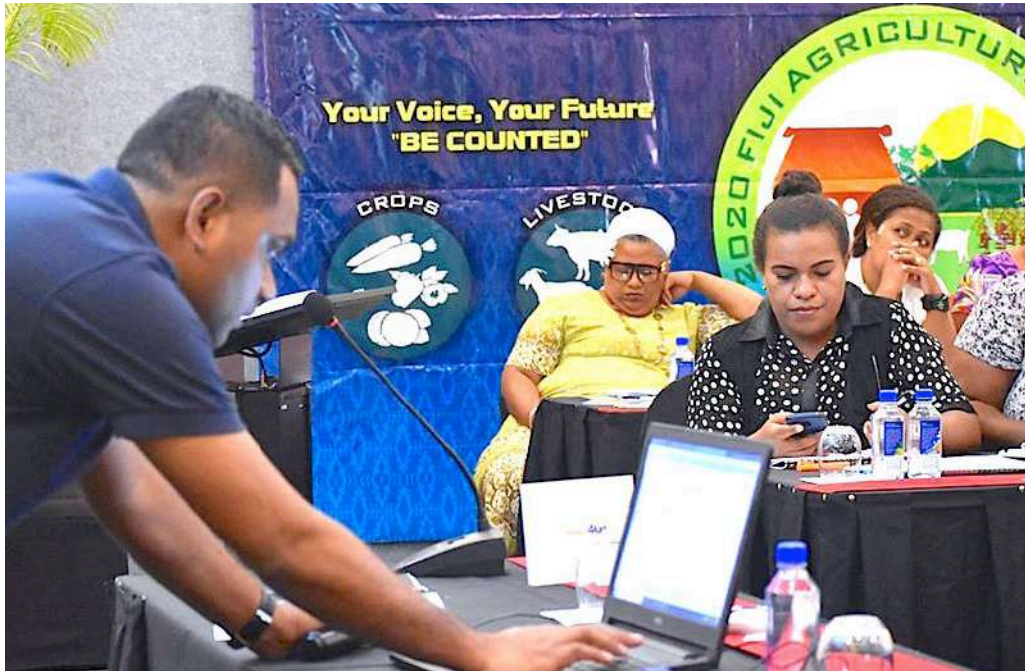
कृषि मंत्रालय के अधिकारी जनगणना के लिए ट्रेनिंग हासिल करते हुए