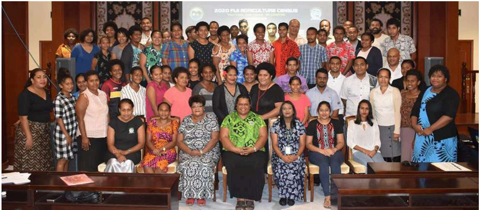
Ko ira na lewe ni vanua ka ra na qarava na iwiliwili ni Tabana ni Teitei se na Census Agriculture 2020. iTaba: VAKARAUTAKI