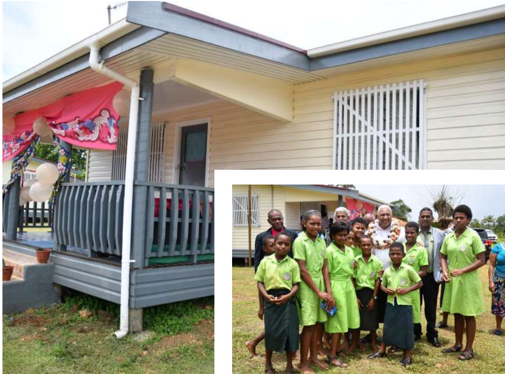
Prime Minister Voreqe Bainimarama with students of Namalata District School after the official opening of their teachers' quarters in Tailevu.

"And I'm confident that with this heightened quality of life what they will now bring to the