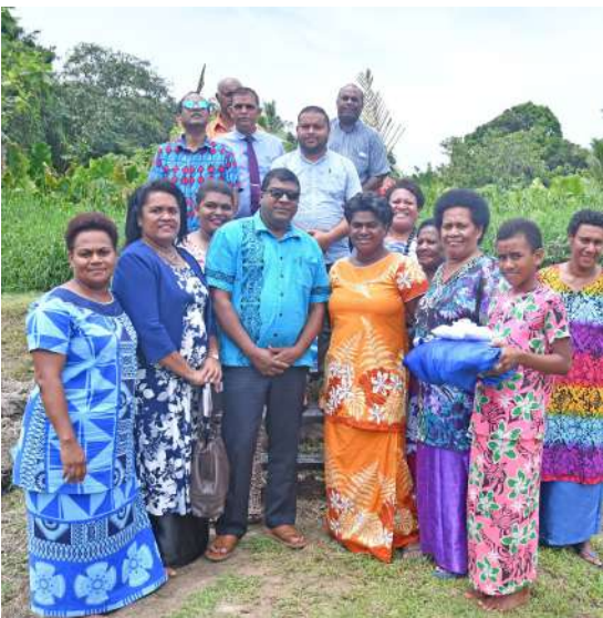
कृषि मंत्री डाक्टर महेन्द्र रेड्डी नकुरुवाई कोरो नोदो रेवा में एक फुट कोसिंग के उद्घाटन के दौरान

उन्होंने बताया कि इन प्रेक्टिसस को बनाए रखना कौंसल की ज़िम्मेदारी है और यह भी देखना है कि इन प्रेक्टिसस से सभी को लाभ हो।