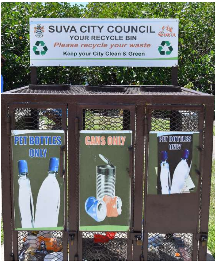
Government is urging people to practise good waste management habits.

M EMBERS of the Rotary Club of Suva together with the Suva City Council got their hands dirty over the weekend as volunteers turned up in numbers to clean the Suva foreshore.