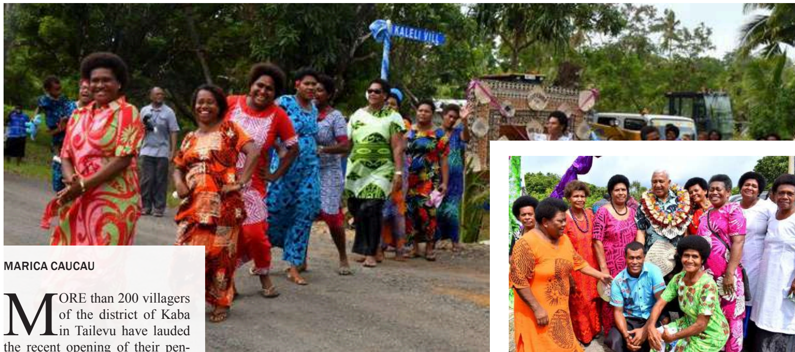
Prime Minister Voreqe Bainimarama with Kaba and Kiuva villagers after the commissioning of the unsealed road that connects Kiuva road and Kaba peninsula in Tailevu.

"It is a project that will undoubtedly prove critical to linking the people of Lekutulevu to surrounding communities, the rest of Vanua Levu, and indeed, all of Fiji."