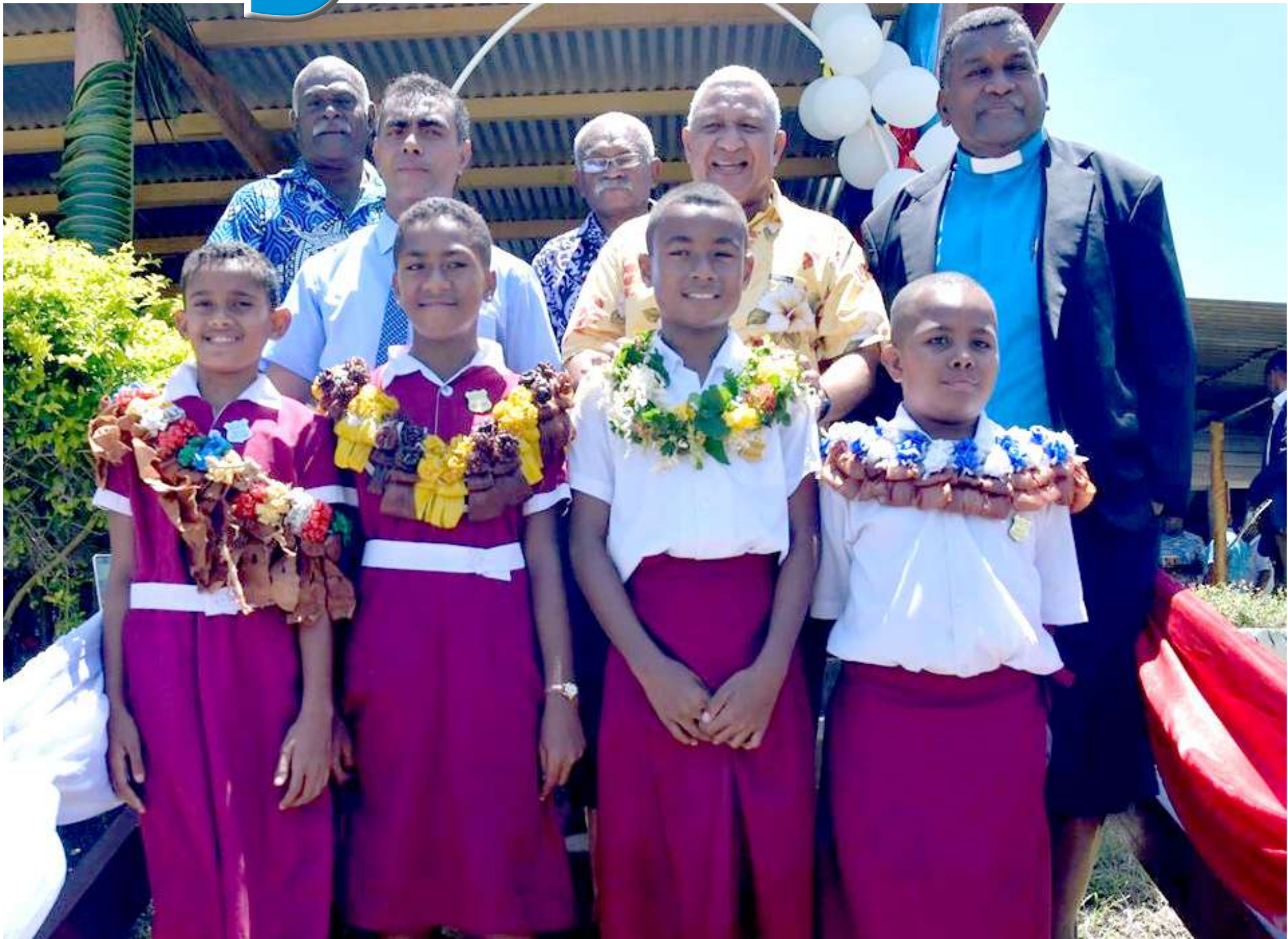
Prime Minister Voreqe Bainimarama with students, teachers while commissioning two teachers' quarters at Ratu Ilaisa Memorial School in Semo, Nadroga.