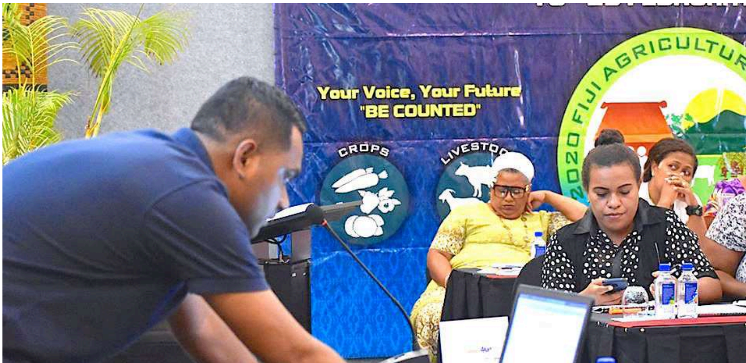
Era vuli toka oqori ko ira na lewe ni vanua ka ra na vakaitavitaki ira tiko ena kena kumuni na i tukutuku baleta na i wiliwili ni dau teitei, nodra teitei, nodra itei ka vaka kina na nodra rawaka vakailavo mai na vua ni qele.

Na kena dau tubu cake na mate edau kauta talega main a leqa ni bula vakailavo baleta ni valuta na bula ni rawaka vakailavo ena matavuvale ka vakakina ena bula ni lewe ni vanua raraba.