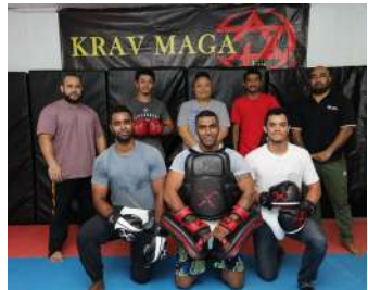
Members of Krav Maga Fiji.