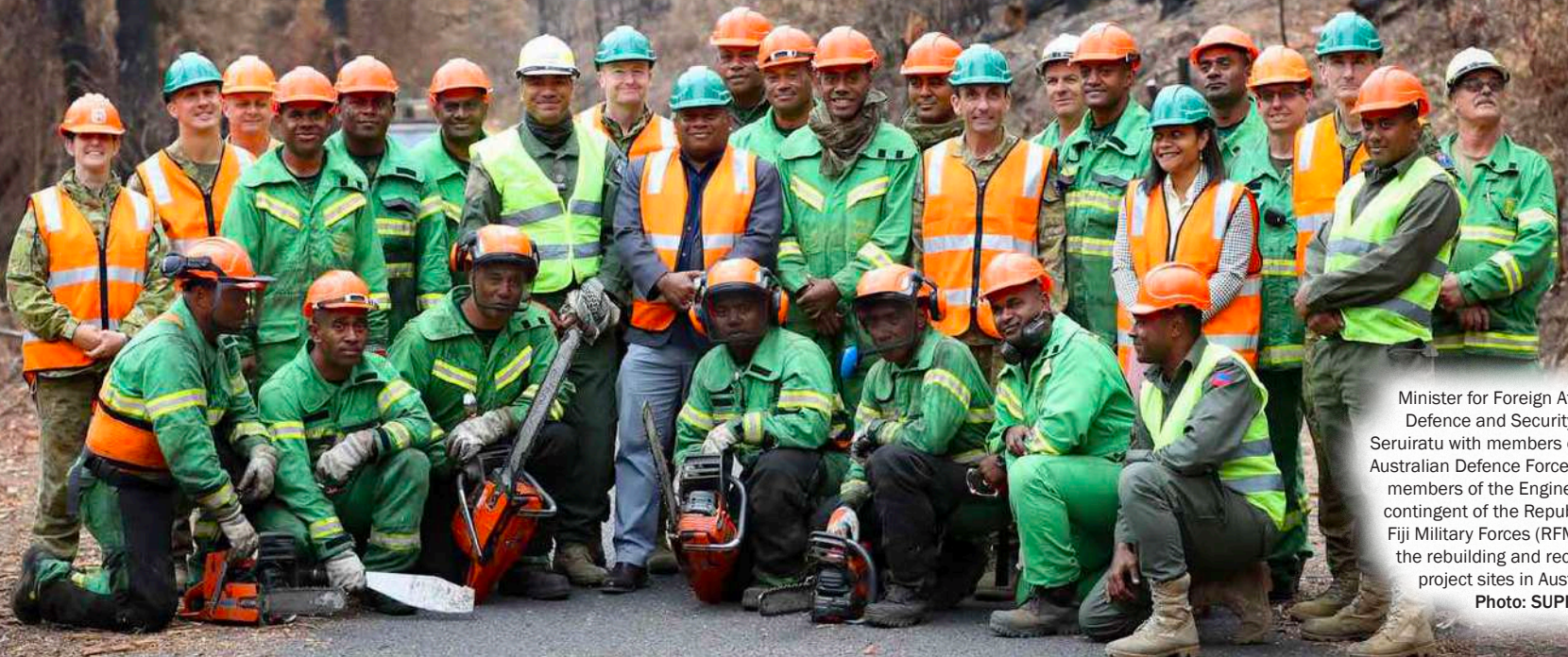
Minister for Foreign Affairs, Defence and Security, Inia Seruiratu with members of the Australian Defence Force and members of the Engineering contingent of the Republic of Fiji Military Forces (RFMF) at the rebuilding and recovery project sites in Australia.

Fiji’s commitment in reaching out to our Australian ‘Vuvale’ in response to the bushfire rebuilding efforts have been commended by the Australian Defence Force (ADF).