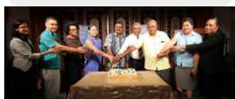
Frank Bainimarama (@FijiPM)

Through the @PacificNDCHub, Pacific Island Countries are leading by example (and with credibility) by charting decisive pathways to net-zero emissions. If we can do it, larger developed nations have zero excuses. #IfWeCanDoItSoCanYou