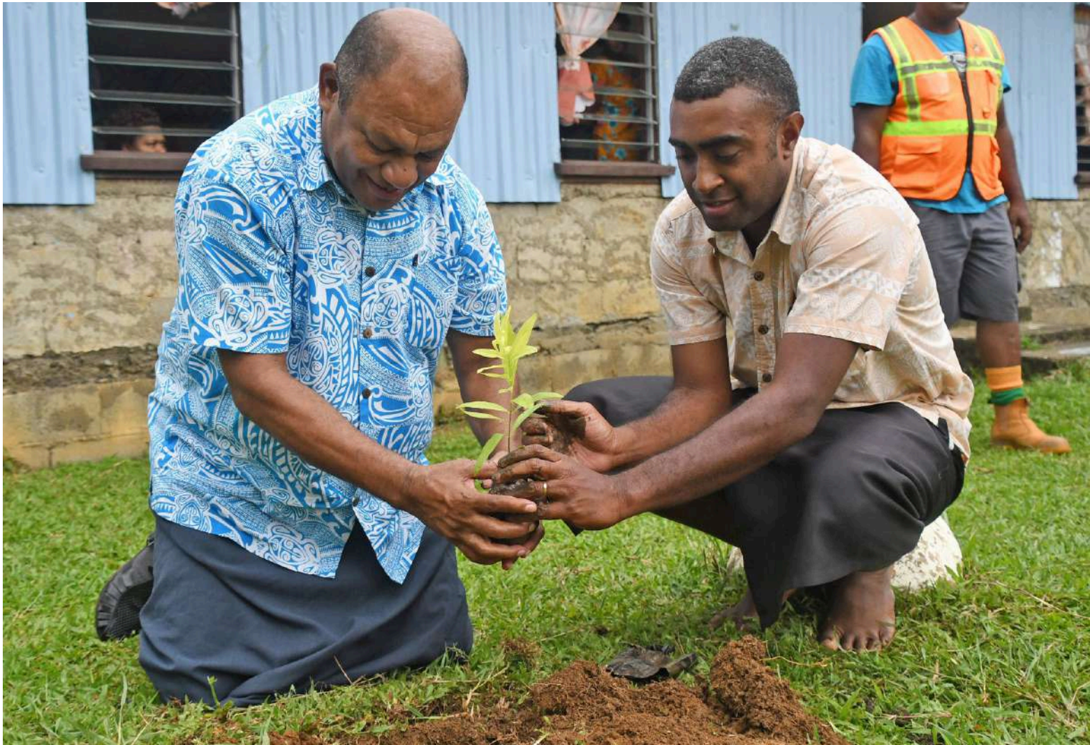
Minister for Forest Osea Naiqamu plants a tree at Naboutini Village, Serua, during the ‘30 Million Trees in 15 Years’ initiative in the Western Division.

The app is currently available to android users only with plans to make it available to iPhone users in the future.