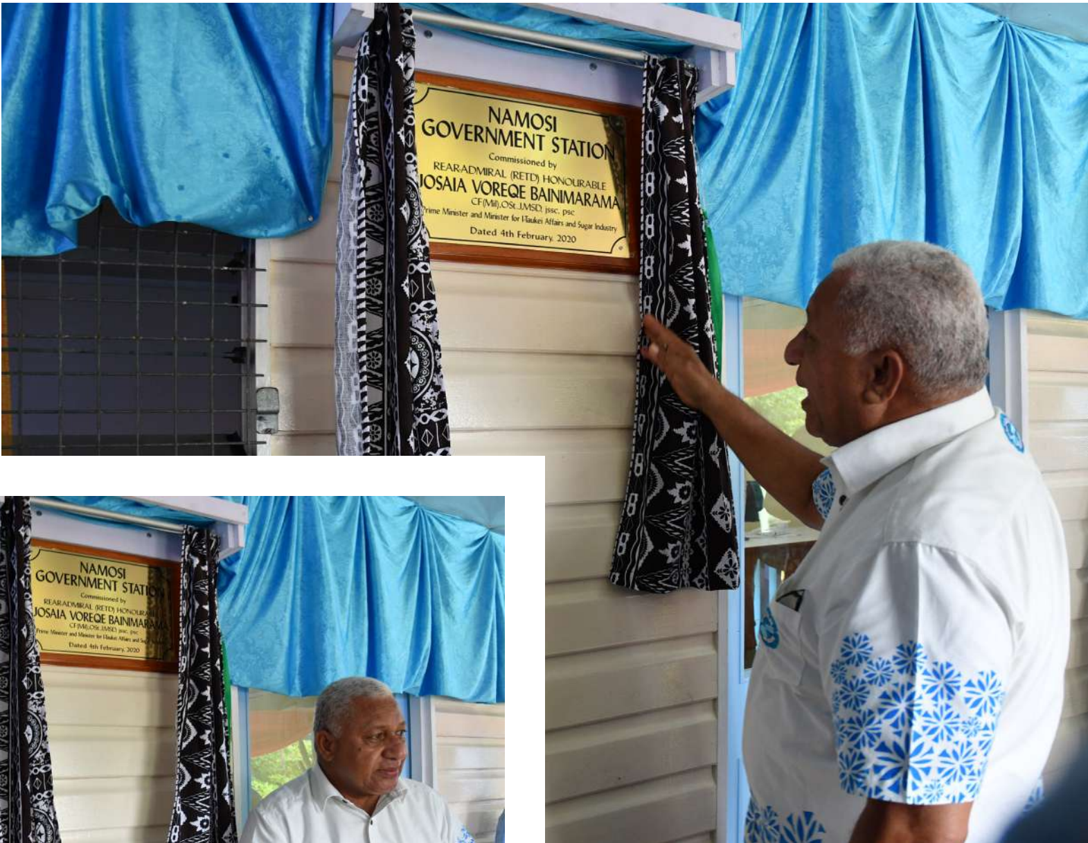
Mai dolava tiko oqori ko Paraiminisita Voreqe Bainimarama na itikotiko vou ni matanitu e Dada, Namosi.

veikoro,” kaya o PM Bainimarama. “Au kila ni lewe levu vei kemuni oni dau vakayagataka na qele. Mo ni rawata kina na nomuni bula. Ena gadrevi kina na nomuni solia na nomuni gauna kina teitei. Au vakabauta ni na yaga sara vakalevu ki vei kemuni na ituvatuva ni Matanitu tu oqo ka oni na qaravi vakavinaka ena veiqaravi ni Tabacakাকা ni Teitei.”