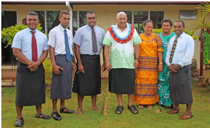
Ko Paraiminisita Voreqe Bainimarama kei ira na qasenivuli e Uluivalili College ni oti na dola ni rua na vale ni qasenivuli e Wailevu, Cakaudrove.

“Na Uluivalili College a tauyavutaki ena 2012 ka rauta ni 46 na kilomita mai Savusavu.”