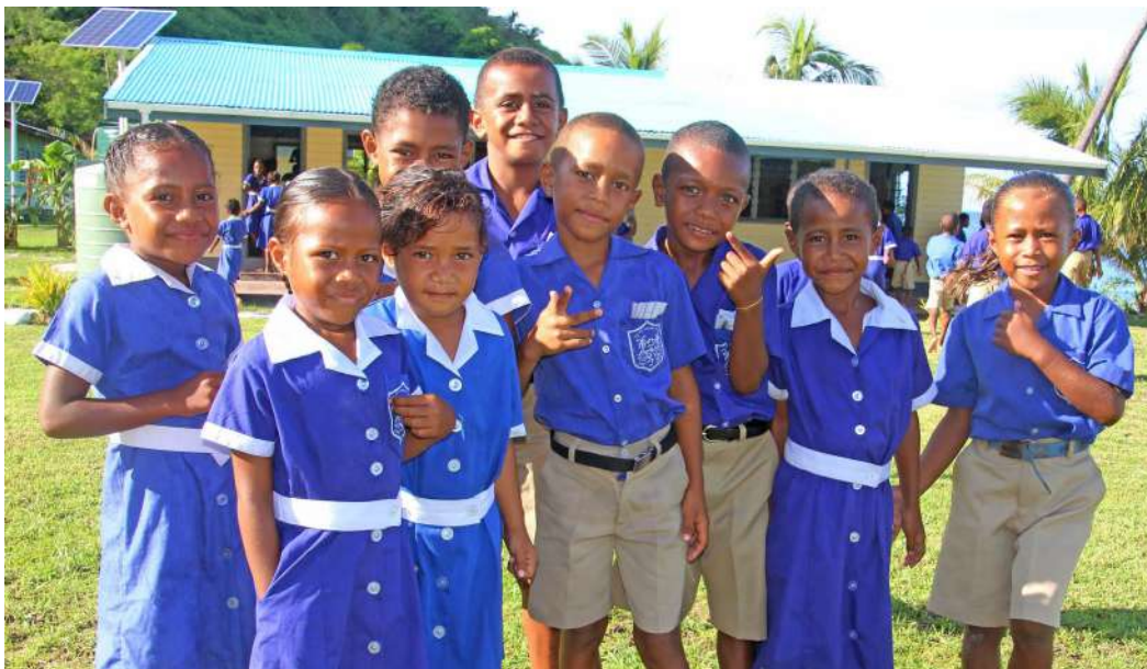
Ko oira na gonevuli e Kia District School ni oti na nona dolava ko Paraiminisita Voreqe Bainimarama na nodra vale ni wili vola vou.

“E liu era vaka-library tiko kina na gone ena vei ruku ni veivunikau mera lai wilivola tu kina.”