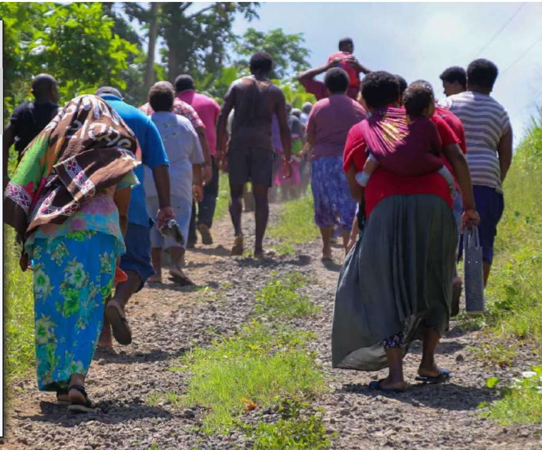
farmers should pay close attention to all weather forecasts, warnings and advisories issued by the Fiji Meteorological Services.