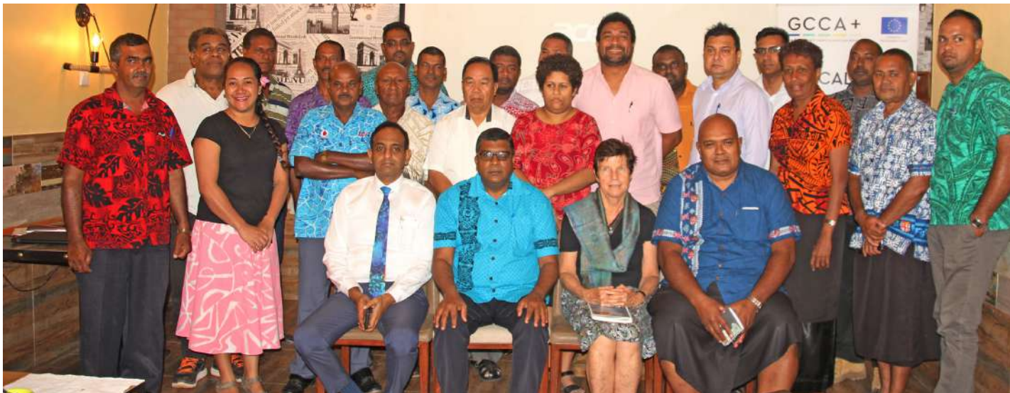
Minister for Agriculture, Rural and Maritime Development, Waterways and Environment Dr Mahendra Reddy, sitting second from left, with participants during the Global Climate Change Alliance Plus (GCCA) – Scaling-up Pacific Adaptation (SUPA) Project workshop in Labasa.

-MESSAGE BY EXECUTIVE SECRETARY OF THE UNITED NATIONS FRAMEWORK CONVENTION ON CLIMATE CHANGE, PATRICIA ESPINOSA