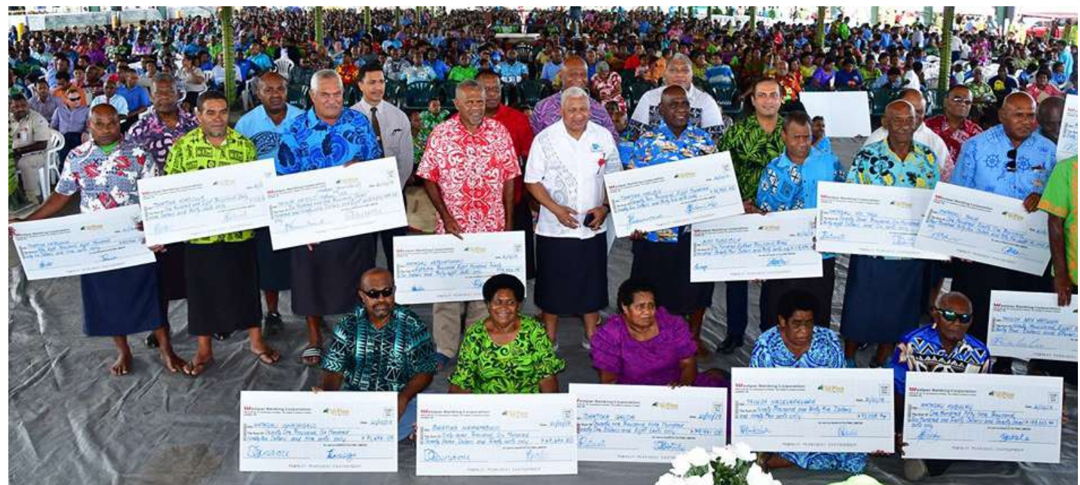
फीजी पाईन ग्रुप ऑफ कम्पनीज़ के ज़मीन मालिकों को बोनस पयमेंट देते हुए प्रधान मंत्री वॉरेनो बड़िनमारामा