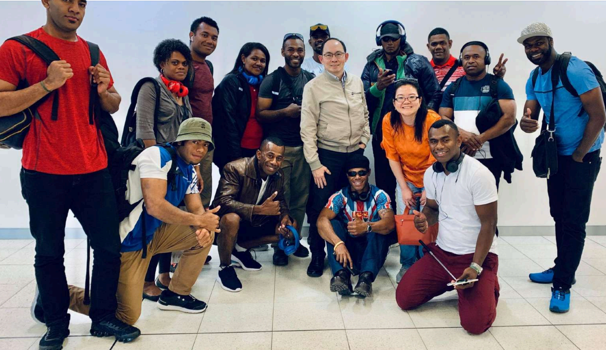
Era mata mamarau na noda lewenivanua era cakacaka tiko ena AGRI-Fresh mai Ositerelia.