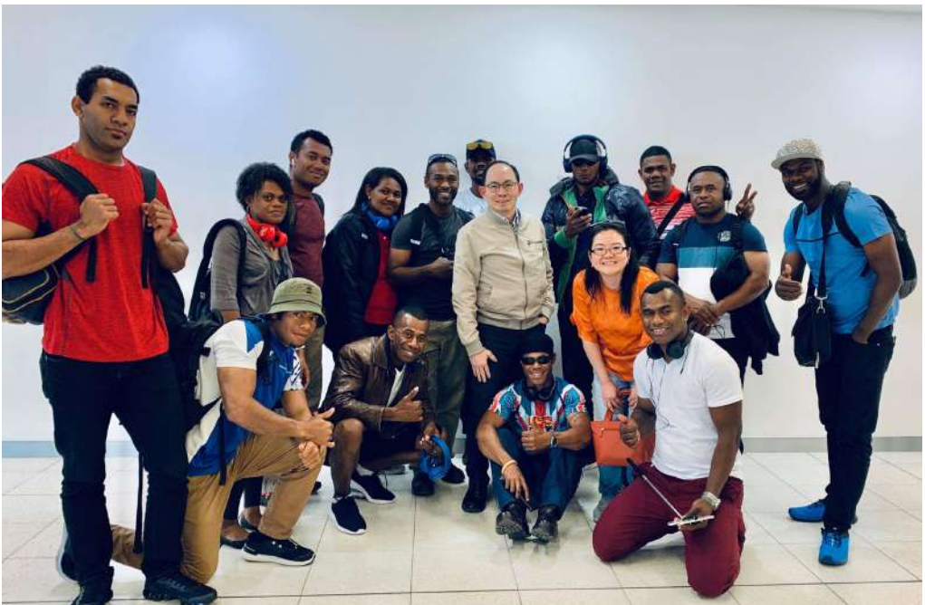
ओस्ट्रेलिया में सीज़नल वोका प्रोग्राम के तहत एग्री फेश नामक कम्पनी के लिए काम करने गए फीजियन्स

ओस्ट्रेलिया में सीज़नल वोका प्रोग्राम (SWP) के तहत एग्री फेश नामक कम्पनी के लिए काम कर रहे फीजियन कर्मचारियों की बड़ाई की गई है। वहाँ काम कर रहे पन्द्रह (15) फीजियन कर्मचारी, काम करने की चार महिने की अपनी अवधी समाप्त कर चुके हैं। एग्री फेश ने एम्प्लोयमेंट मंत्रालय के ज़रिए, इन कर्मचारियों को चुनने के लिए फीजियन सरकार को धन्यवाद दिया है। “सीज़नल वोका प्रोग्राम में यह हमारा पहला साल है और मैं यह कहना चाहता हूँ कि यह फीजियन कर्मचारी बहुत मेहनती हैं। अभी हाल ही हम इस प्रोग्राम में शामिल हुए हैं और फीजी से हमने चार महिनों के लिए पन्द्रह कर्मचारियों को लिया था लेकिन अगले साल हम चालीस (40) फीजियन कर्मचारी लेंगे और इन लोगों की काम की अवधी बड़ाकर सात महिने कर दी जाएगी”, मज़दूर मालिक ने कहा। इन फीजियन कर्मचारियों को सहायता प्रदान करने के लिए मज़दूर मालिक ने ओस्ट्रेलिया में फीजियन समुदाय और स्थानिए चर्चस को भी धन्यवाद दिया। और ओस्ट्रेलिया में मास के क्षेत्र में ओस्ट्रेलियन पेंसिफिक लईवा स्कीम (PLS) के तहत काम कर रहे फीजियन कर्मचारियों को लेकर भी फीजियन सरकार को अच्छी प्रतिक्रिया मिली है।