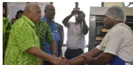
E rau sa lululu tu oqori o PM Bainimarama kei na dua na dau vavi madrai ena vale ni vavi madrai vou ka dola mai Cautata, Tailevu.

“Sa tara oti e dua na sova ni vuli, na olo ni koronivuli, toroicake na vanua ni savasava, kei na kena vakayagataka ni mona livaliva ena veivakatavulici.”