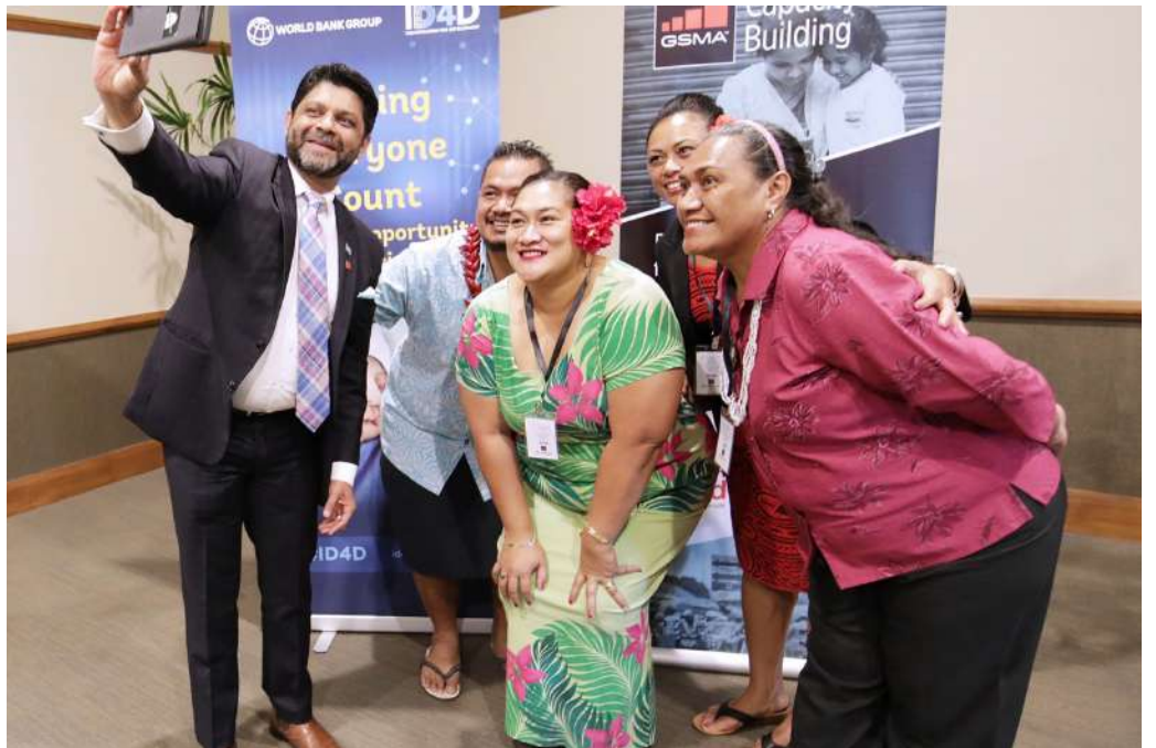
Attorney-General and Minister for Economy Aiyaz Sayed-Khaiyum with participants during the opening of “Use Cases for Digital ID in the Pacific” regional workshop in Suva.

“We had our Help for Homes rebuild program set-up because the devastation was so immense and Government was morally obliged to provide people with some sort of funding to rebuild their homes,” he added.