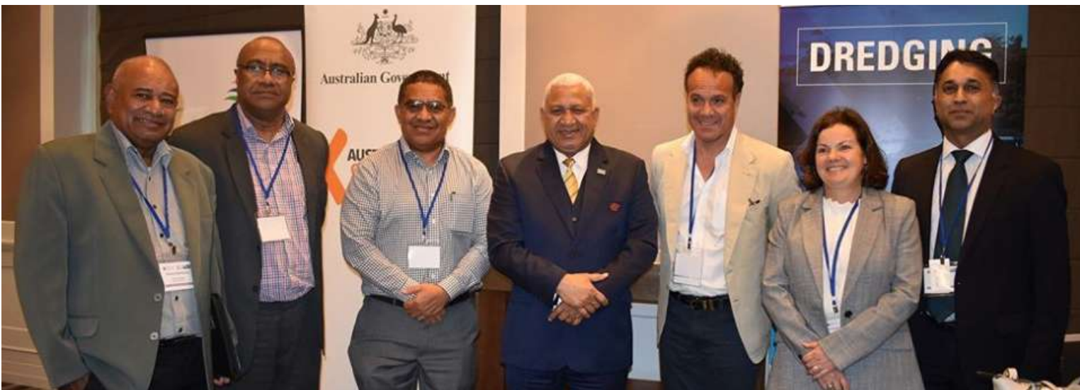
ब्रिस्बन मेरियट होटल ओस्ट्रेलिया में ओस्ट्रेलिया फीजी बिज़नेस कौंसल के सदस्यों के साथ प्रधान मंत्री वॉरेनो बड़िनमारामा