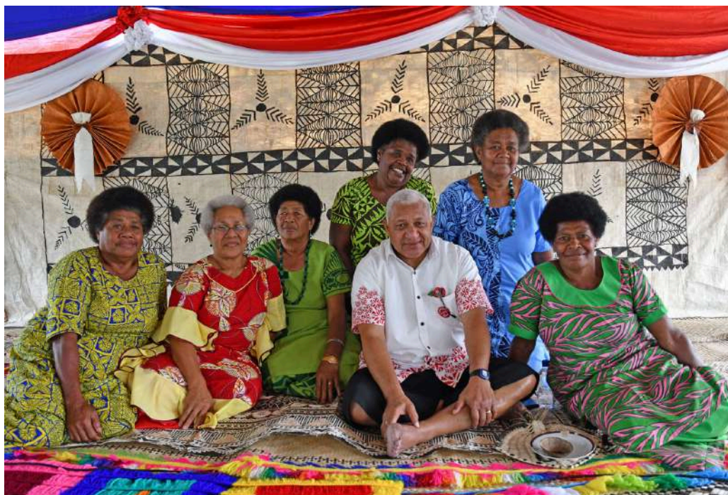
Prime Minister Voreqe Bainimarama with Waibalavu villagers during the commissioning of their village rural electrification project in Naitasiri last week.

Prime Minister Bainimarama told the villagers of Waibalavu that like any other Fijian, they deserve the right to fully participate in the economic prosperity and growth that is sweeping