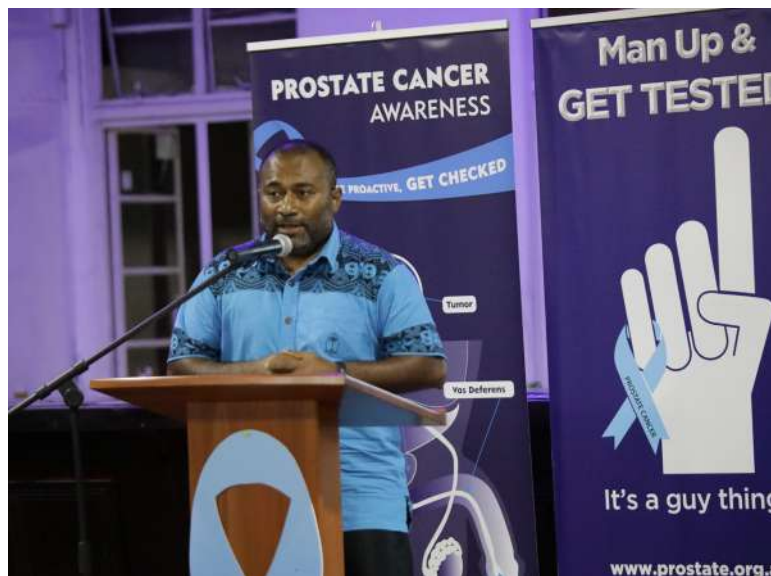
Minister for Health, Dr Ifereimi Waqainabete during the official launch of the month-long awareness for prostate cancer at Defence Club in Suva.

Minister Waqainabete says there is a need to raise awareness as a nation not only in these two months but also beyond because cancer is a killer.