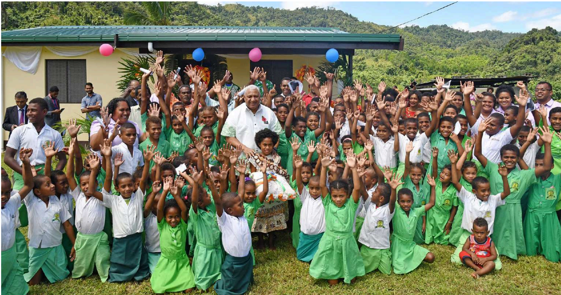
Era mata mamarau na gonevuli kei na qasenivuli mai Naboro Sawanikula Primary School mai Naitasiri ena nona sa lai dolava yani o PM Bainimarama e 7 na vale ni qasenivuli vou e kea.