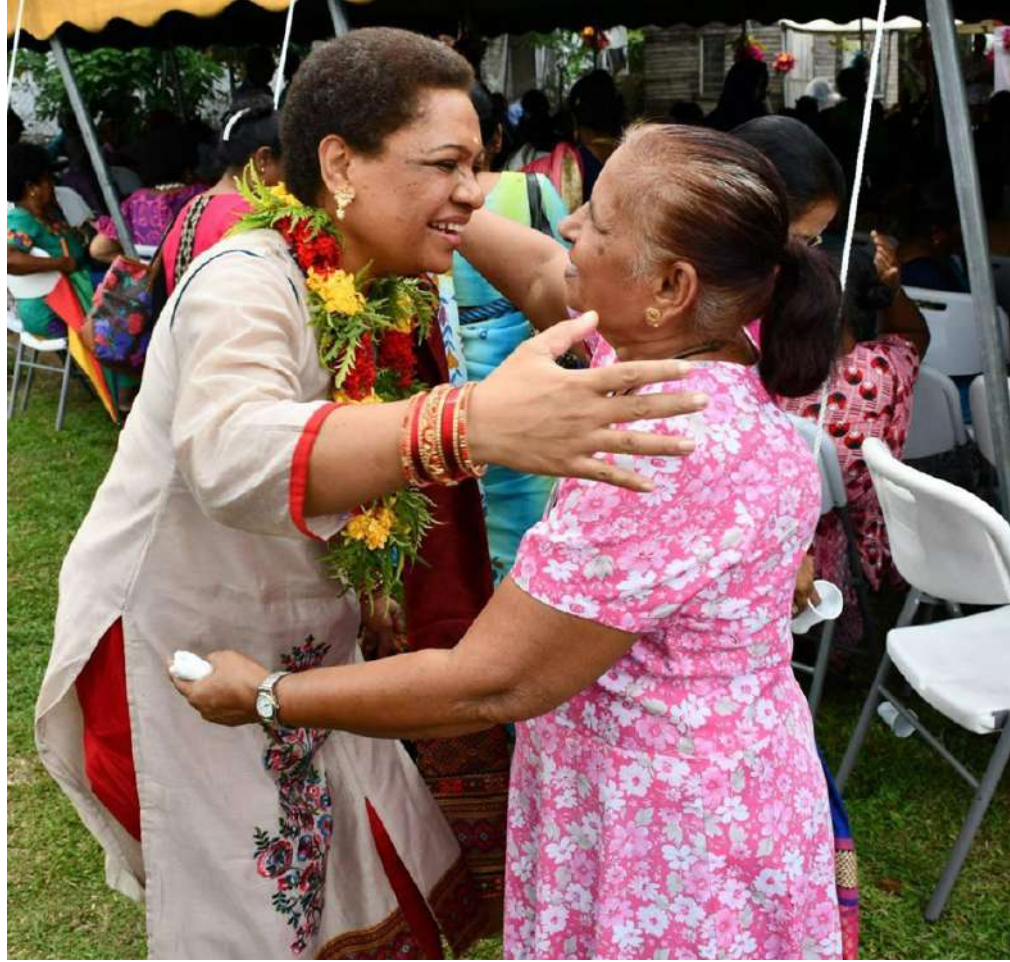
विमन मंत्री मेरेसईनी वुनिवांगा दिवाली समारोह के दौरान एक बुजुर्ग महिला से मिल रही हैं

मंत्री वुनिवांगा ने दोहराया कि वृद्ध लोग परिवार और समाज में सम्पत्ति की तरह हैं, वे लोगों को सलाह देते हैं, मध्ययस्ता प्रदान करते हैं और संरक्षण प्रदान करते हैं। लेकिन उन्होंने कहा कि कभी-कभी बड़ों को नज़रअंदाज़ कर दिया जाता