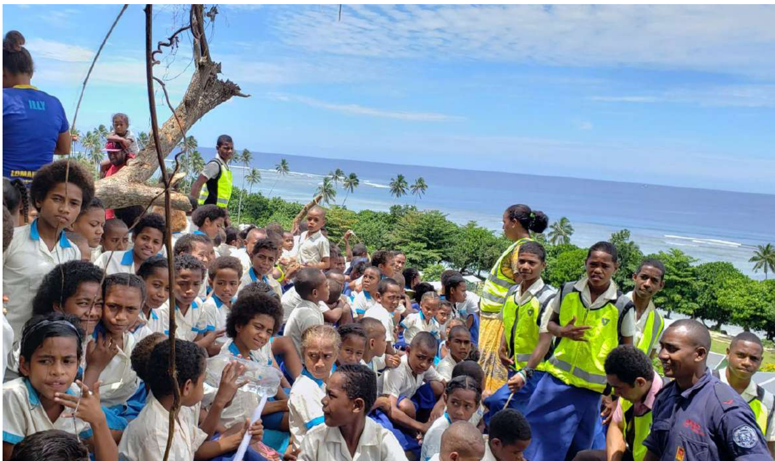
School children during a tsunami drill at Lavena Village, Taveuni.

The NDMO had conducted awareness around Taveuni ahead of the National Disaster Awareness Week.