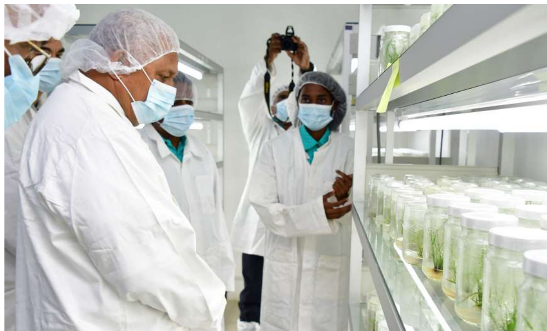
Prime Minister and Minister for Sugar Voreqe Bainimarama inspects cane seedling samples at the new tissue lab.

sue culture technology, which is used in many countries, such as India, to produce large volumes of pure and disease-free sugarcane plantlets that can multiply quickly in a smaller space. This will produce higher yields and the ability to farm small plots more profitably.