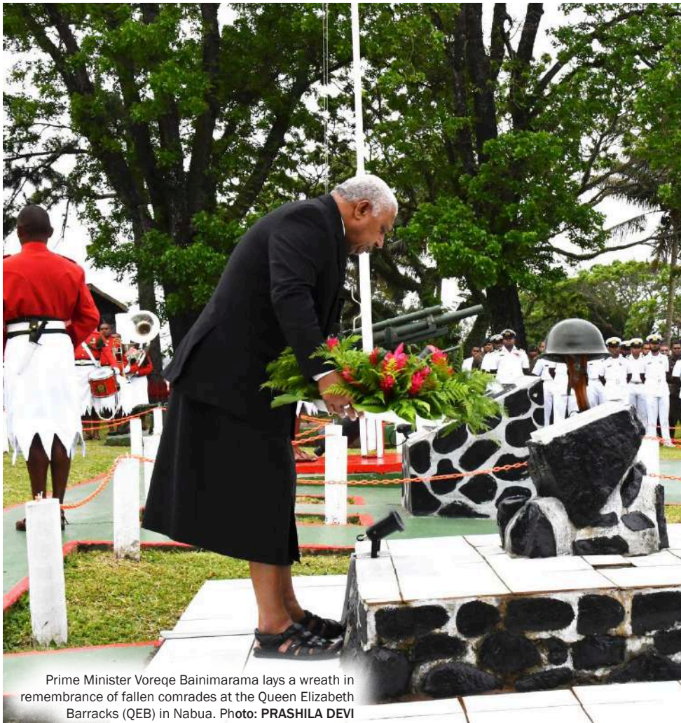
Prime Minister Voreqe Bainimarama lays a wreath in remembrance of fallen comrades at the Queen Elizabeth Barracks (QEB) in Nabua.