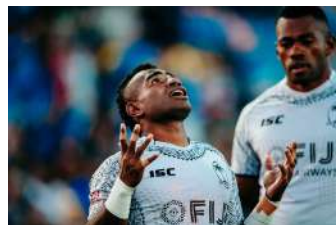
Frank Bainimarama (@FijiPM)

The amount spent by Government on the energy sector over the past five years, of which 70 cents of every dollar has gone directly to rural electrification.