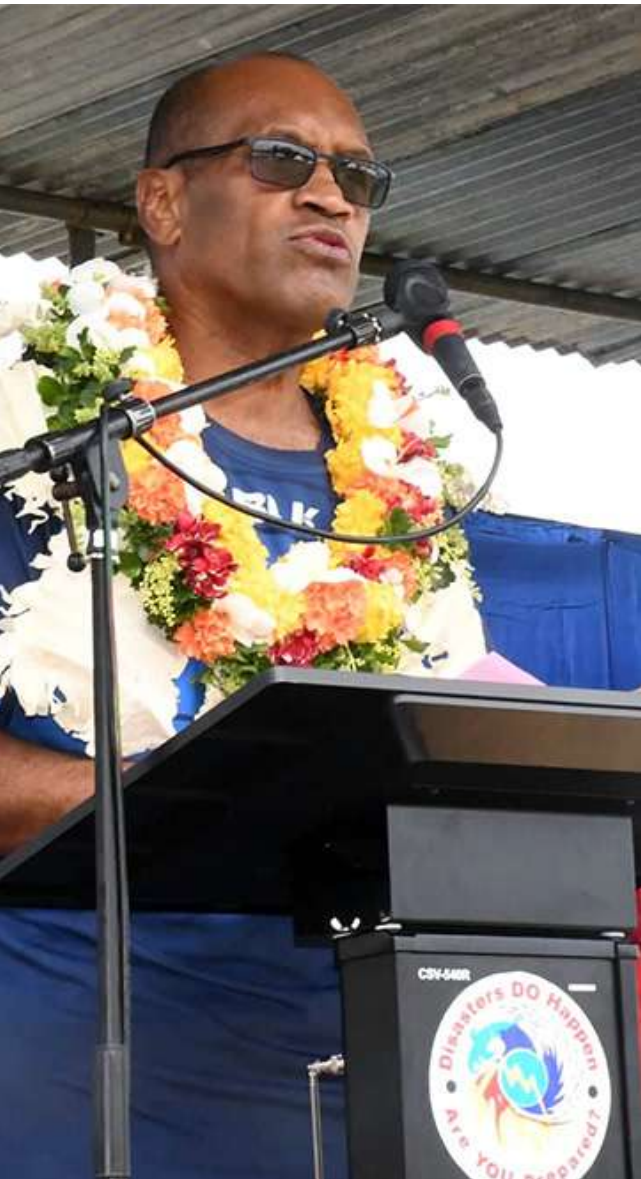
Minister for Infrastructure, Transport and National Disaster Management Jone Usamate during the launch of the 2019 National Disaster Awareness Week in Taveuni.