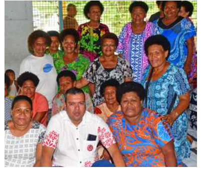
Minister for Lands and Mineral Resources, Ashneel Sudhakar with Nasomo women in Vatukoula.