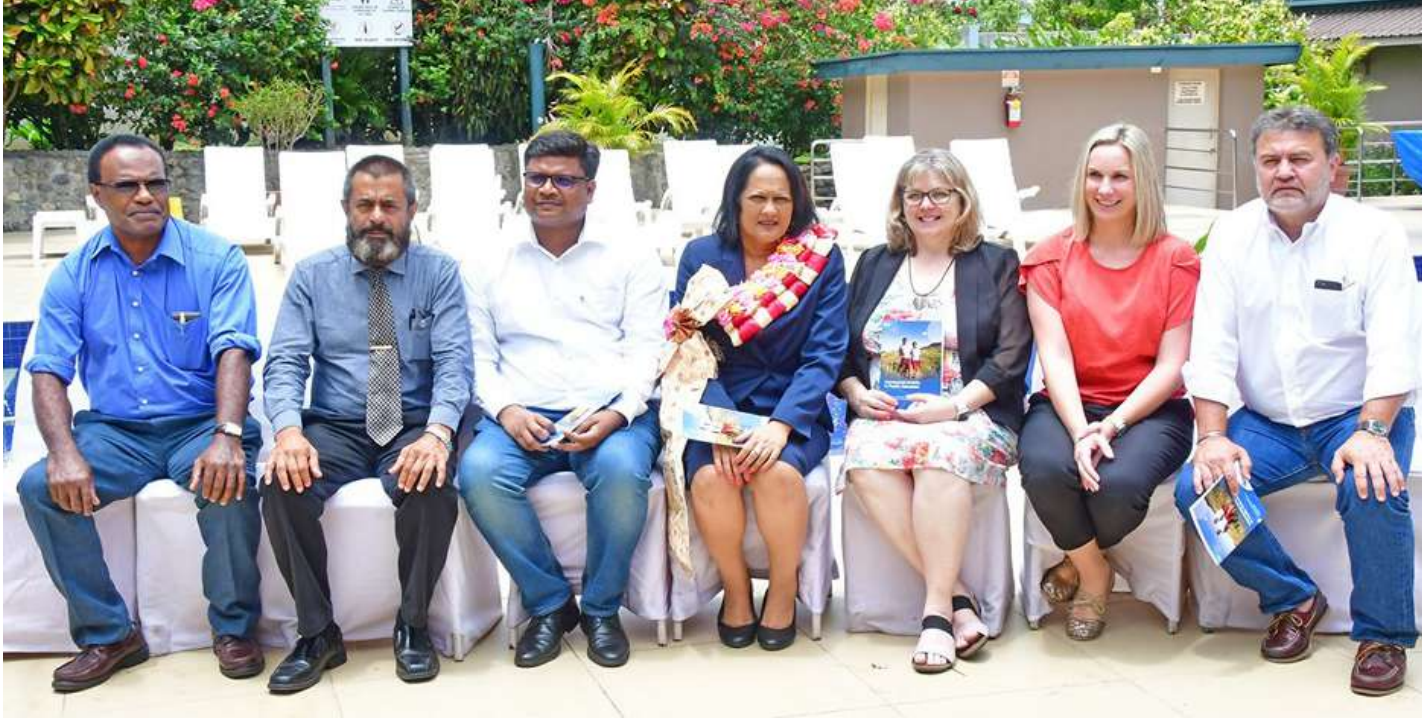
शिक्षा मंत्री रौजी अक्वर नान्दी में एक सम्पोज़ियम के दौरान जिसे युनिवर्सिटी ऑफ़ दी साउथ पैसिफ़िक ने आयोजित किया था