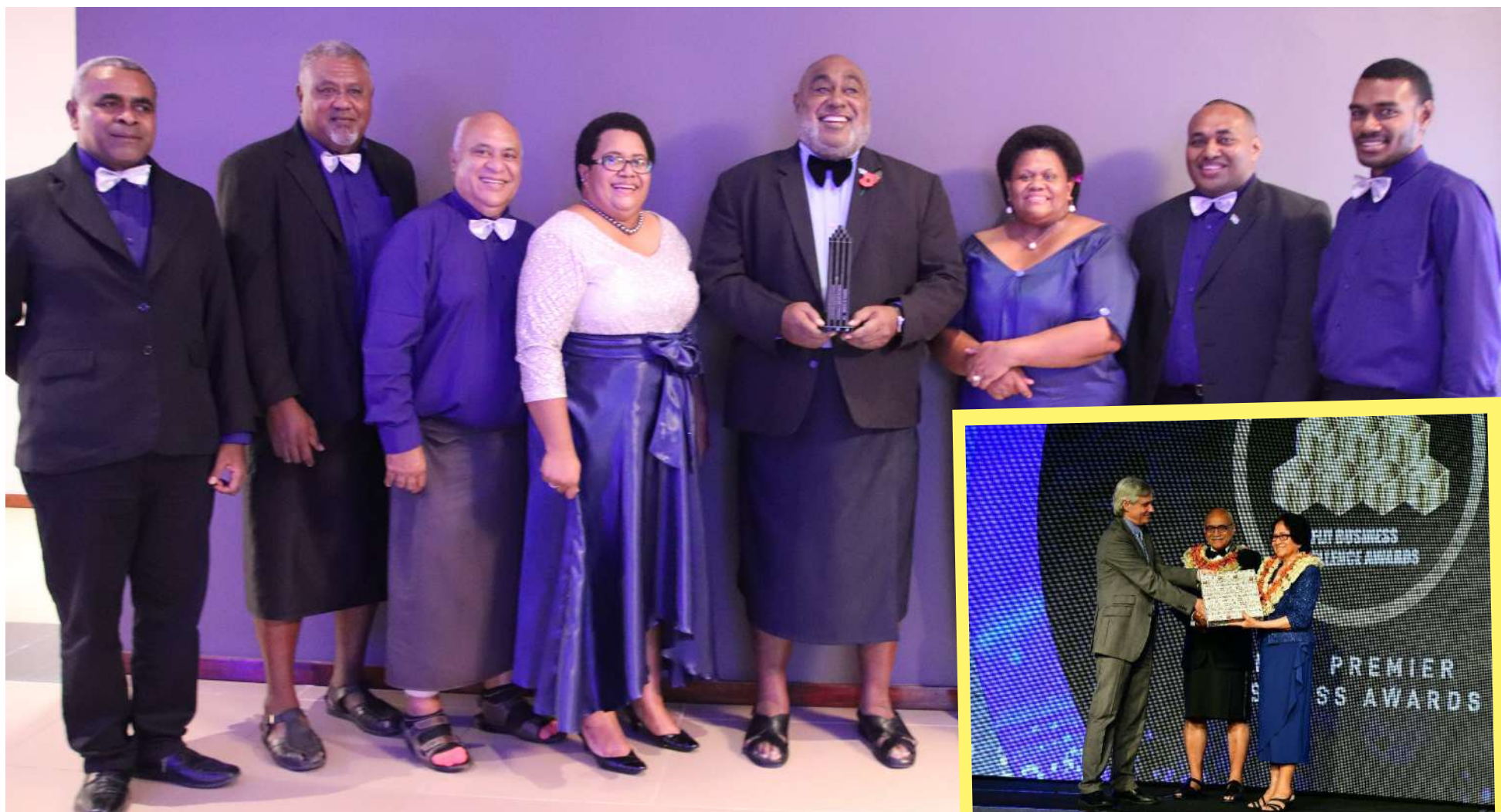
Ministry of Fisheries, Ministry of iTaukei Affairs and iTaukei Affairs Board members after receiving the Achievement in Business Excellence Award during the Fiji National University's 2019 Fiji Business Excellence Awards in Nadi.