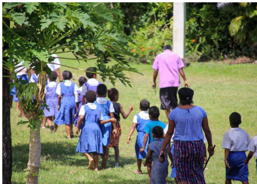
About 130 students from Lavena Primary School, including pre-schoolers, were part of the exercise, which required them to assemble on the village ground and to run as quickly as they could into the hills above the village compound.

Farmers also have to be wary of culverts and other waterways created by floods and keep family members and animals away from them.