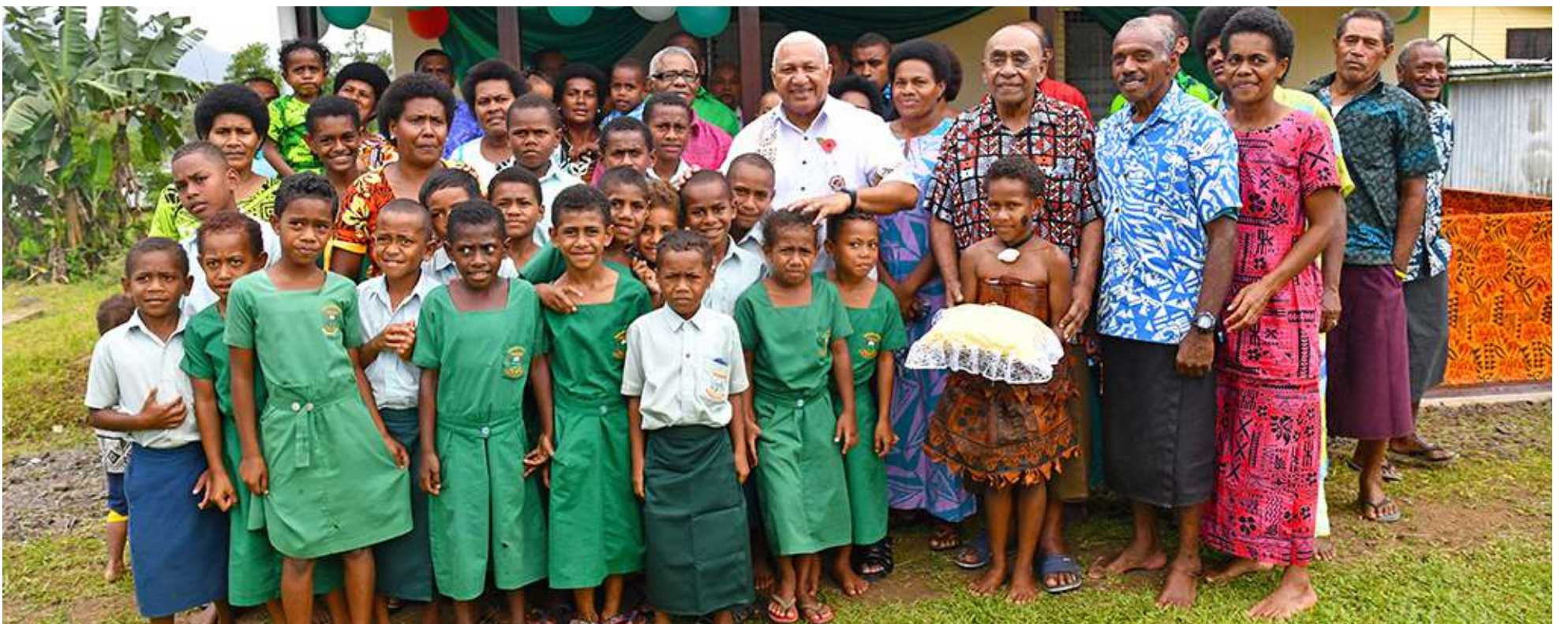
Prime Minister Voreqe Bainimarama with Nabukaluka District School students after opening the newly-built teacher's quarters in Naitasiri.