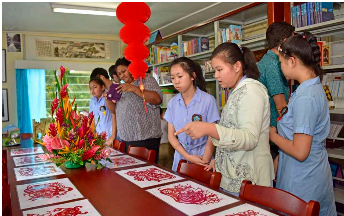
Students of Yat Sen Primary School during a tour around the Chinese Corner at the Library Services of Fiji. The corner consists of 20,000 e-books, with 6000 books, and all Fijians are encouraged to make use of the facility.

“It is no longer the bookworm tucked up between pages of a book, we have now entered into the time of the screenworm; children and adults mesmerized