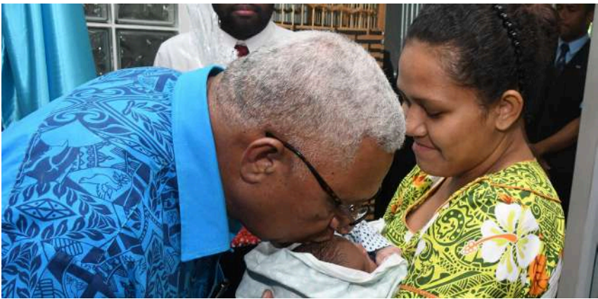
Sa na vakarau vakavinakataki ka laveti na itagade ni vale ni vakasucu ena vale ni bula levu na Colonial War Memorial Hospital (CWMH) e Suva.

Eda kila vinaka ni gauna ni tiko bibi edua na gauna e vakamareqeti kina na nodra bula na marama tina kei ira na luvedra. Sa vakavinavinakataki kina na raiyawa ni Matanitu ena vakanananu ka sana vakarau vakavotukanataki oqo.