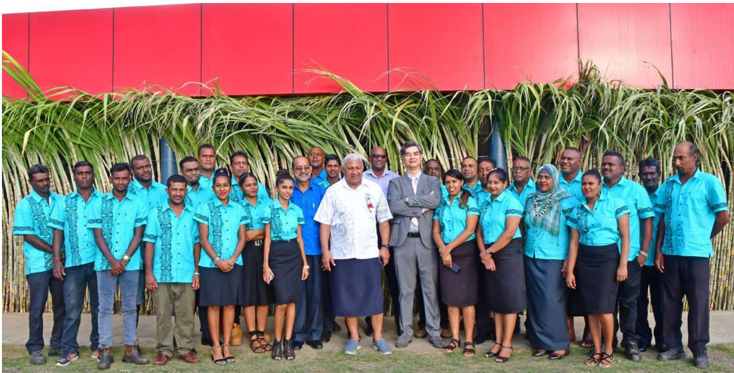
Prime Minister and Minister for Sugar Voreqe Bainimarama with staff of the Sugar Research Institute of Fiji. Standing immediately to the PM’s left is the Head of the European Union (EU) Delegation for the Pacific, Sujiro Seam.

Minister Sudhakar also noted that despite being long-time landowners, it was not until the Fair Share of Mineral Royalties Act by the Bainimarama Government that Trust members could benefit from minerals under their land.