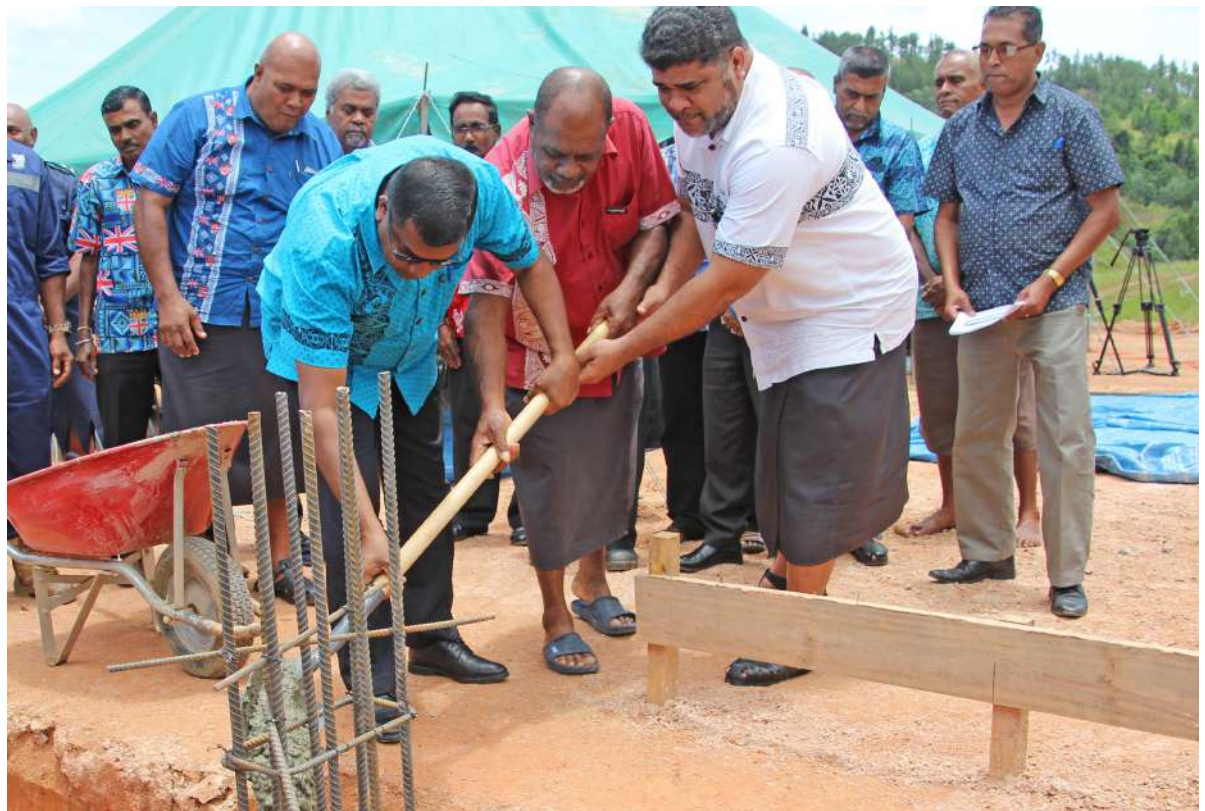
Minister for Agriculture, Rural and Maritime Development, Waterways and Environment Dr Mahendra Reddy, (far left in light blue shirt), during the groundbreaking ceremony for the new Government Station at Wainikoro, Nadogo, Macuata.

to Labasa so we could visit their offices but we know this will soon come to an end and we are so grateful for this.”