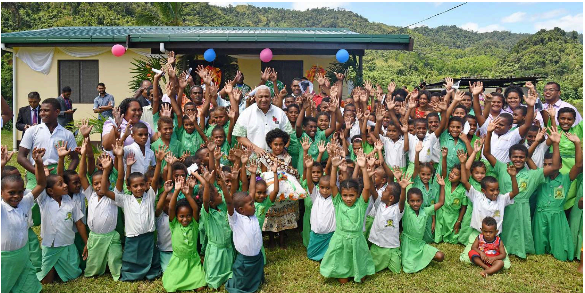
नईतासिरी के नम्बोरो सवानिकूला प्राईमरी स्कूल के टीचज़ क्वाटज़ का उद्घाटन करने के बाद प्रधान मंत्री वॉरेन्गे बड़निमारामा, स्कूल के छात्रों और टीचज़ के साथ