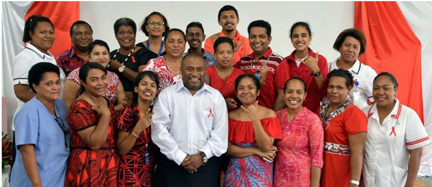
स्वास्थ्य मंत्री इफेरईमी वांगाइनम्बेते वोल्ड स्ट्रौक डय के अवसर पर सी डब्लू एम अस्पताल में आयोजित समारोह के दौरान अधिकारियों के साथ