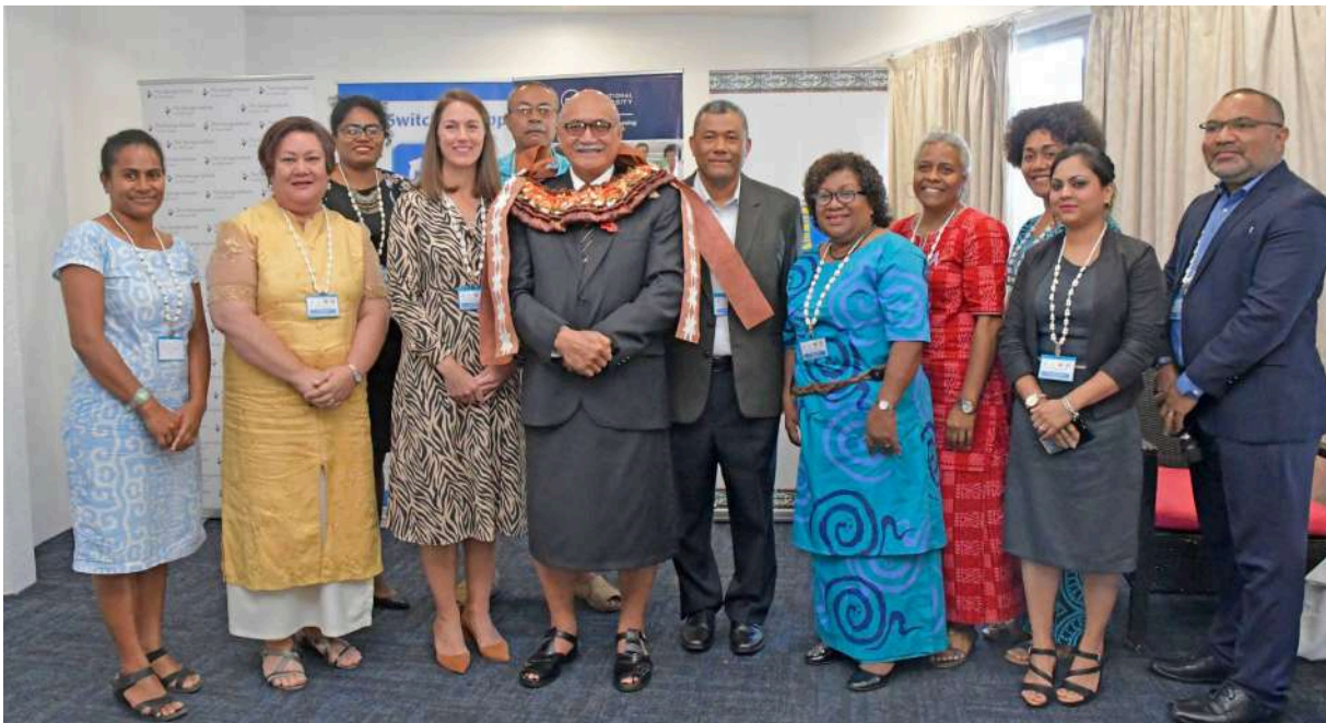
President Major-General (Ret'd) Jioji Konrote at the launch of the FoodSwitch Fiji App last week.