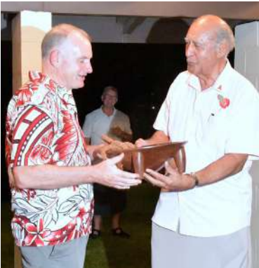
Sa solia tiko oqori na tanoa me iloloma nei Viti vua na Sipika ni Palimedi ni Niusiladi ko Trevor Mallard mai vua na noda Sipika ko Ratu Epeli Nailatikau.