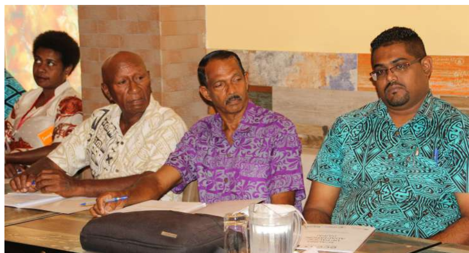
Participants during the Global Climate Change Alliance Plus (GCCA) – Scaling-up Pacific Adaptation (SUPA) Project workshop in Labasa.

“The project is a National objective to scale-up efforts to strengthen coastal