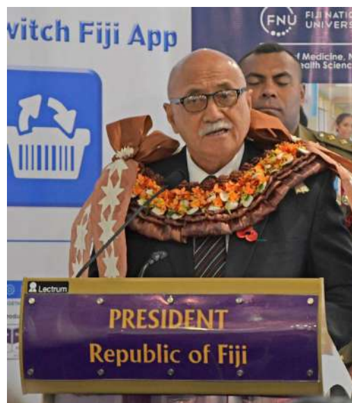
President Major-General (Ret'd) Jioji Konrote says the FoodSwitch App allows Fijians to look at items in stores and choose healthier options to buy.

"This major problem requires the concerted effort of all Fijians - the Ministry of Health, cannot do this alone, - it requires a multi-sectoral approach that involves all parts of Government,