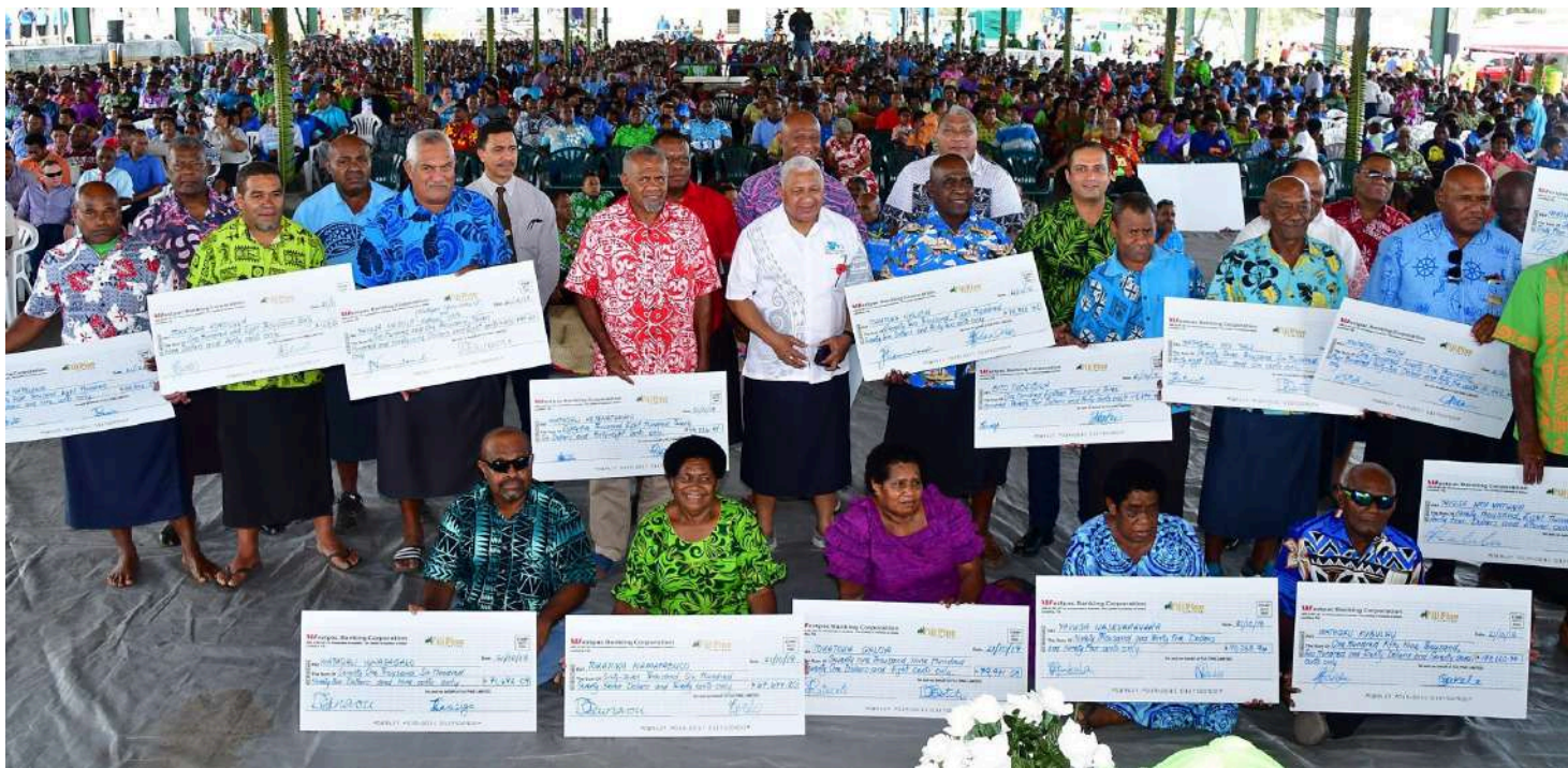
Era sa marautaka tiko na nodra bonisi ni tubu na itaukei ni qele e teivaki tu kina na paini me vaka e ra taba vata toka oqori kei Paraiminisita Voreqe Bainimarama.