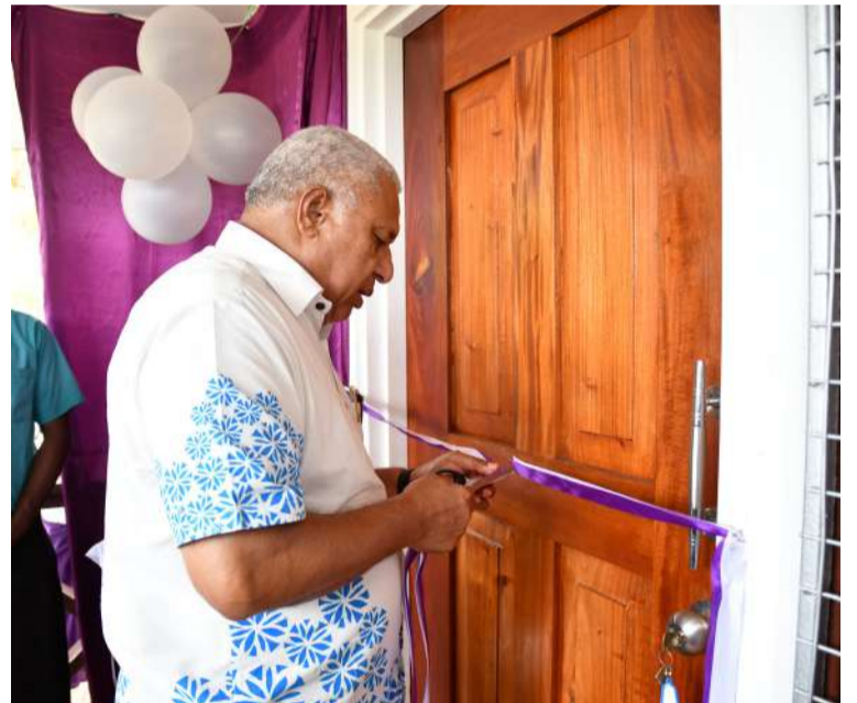
Sa vakarau dolava tiko oqori na turaga na iliuli ni noda Matanitu ko Voreqe Bainimarama e dua na vale ni qasenivuli vou mai Navuakece District School e Naitasiri.