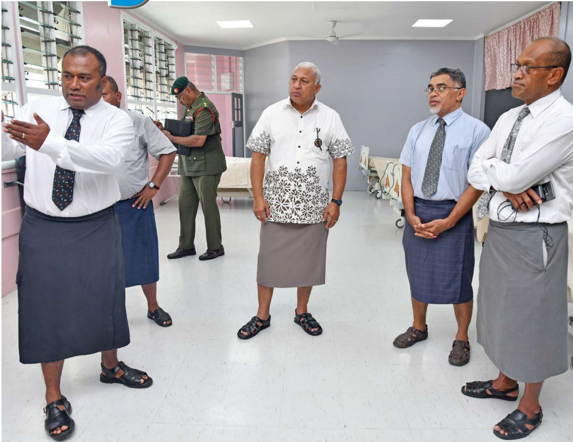
Minister for Health and Medical Services Dr Ifereimi Waqainabete briefs Prime Minister Voreqe Bainimarama (middle) on the progress of the isolation facility at the Colonial War Memorial Hospital (CWMH) in Suva as Minister for Defence, National Security and Foreign Affairs Inia Seruiratu, Minister for Infrastructure, Transport and Disaster Management and Meteorological Services Jone Usamate and Medical Superintendent CWMH Dr James Fong look on.