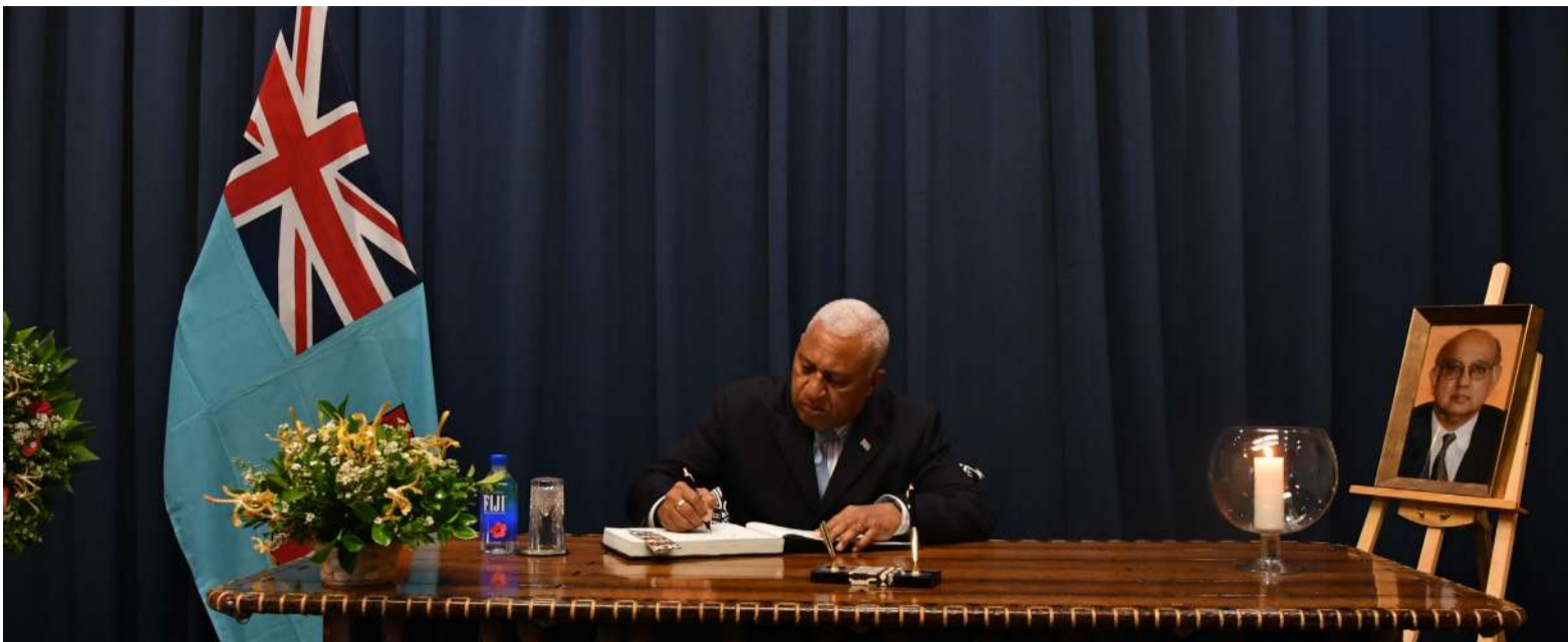
Sa sainitaka tiko oqori na ivola ni lolosi me baleti Satya Nandan na mata nei Viti kina Matabose kei vuravura ko Paraiminisita Voreqe Bainimarama ena vale ni Tabacakacaka e Suva.