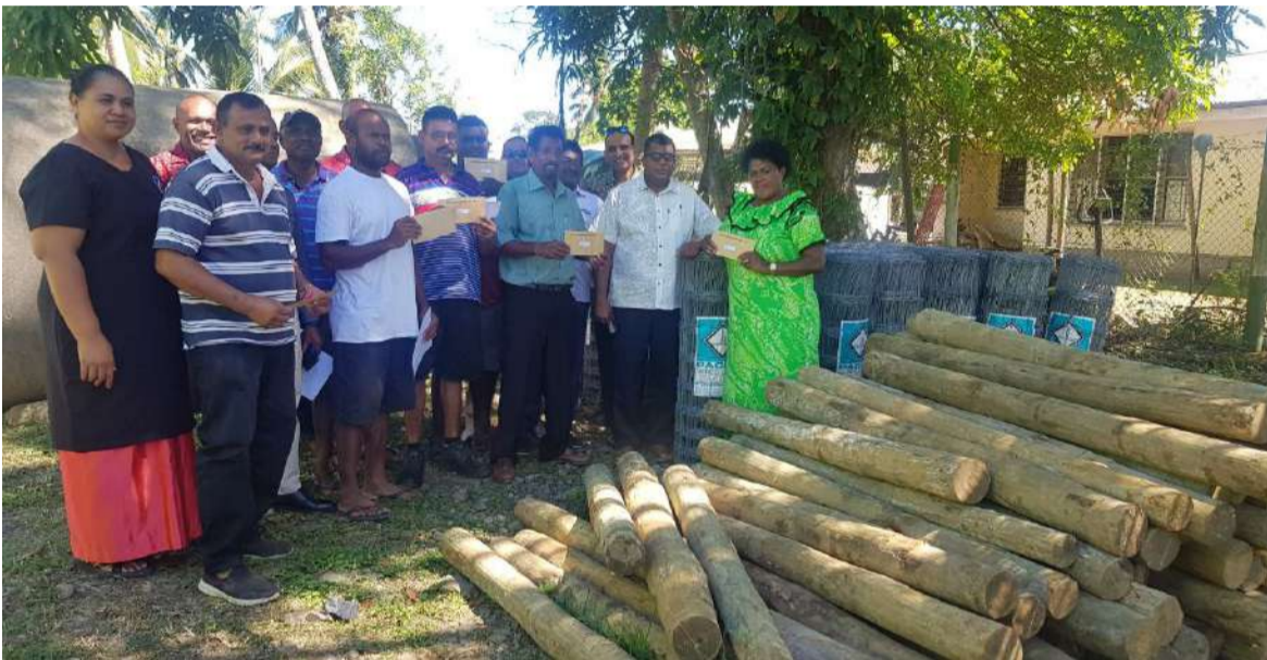
कृषि मंत्री डाक्टर महेन्द्र रेड्डी किसानों को तार लगाने के सामान प्रदान करते हुए

अटेनी जेनरल ने स्थानीय पुँजीपतियों को देश पर भरोसा करने और लगातार पूँजी लगाने के लिए धन्यवाद दिया।