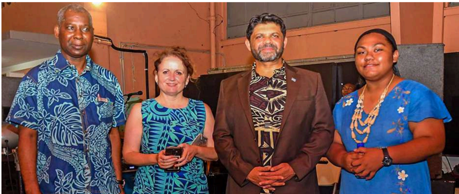
Na Peresitedi ni UN o Dr Tijjani Muhammad-Bande matai ena mawi kei na Vunilawa o Sayed-Khaiyum kei na rua na vakaillesilesi ena soqo ni nona kidavaki o Dr Tijjani.