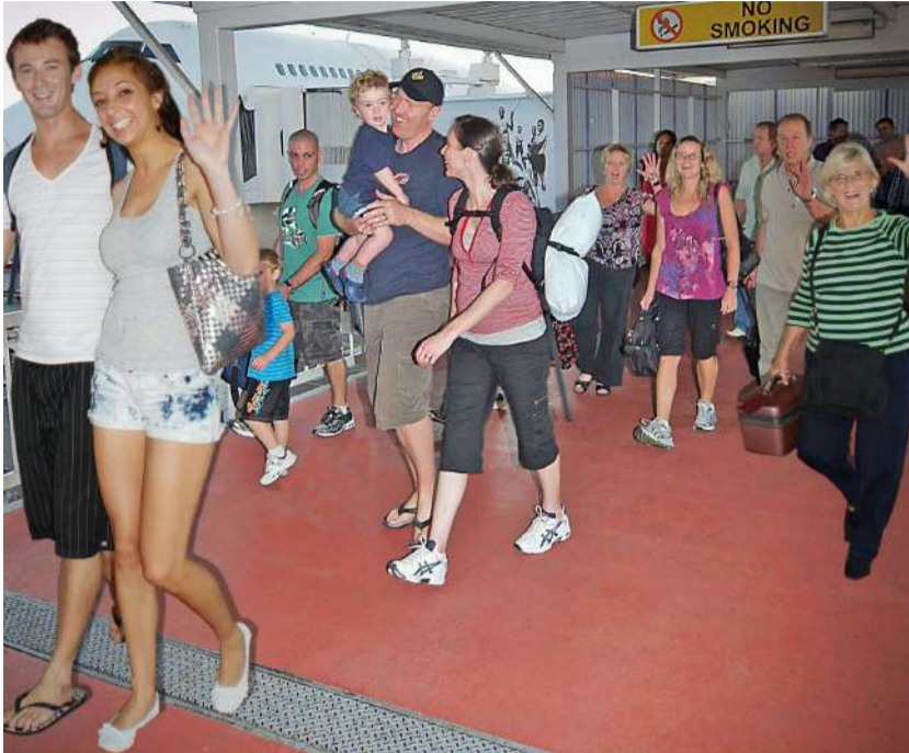
Sa tosoya cake o Viti nona qaqarauni ena noda rara ni waqavuka vei ira na dau curuvana mai meda taqomaki kina na mai na Covid 19.