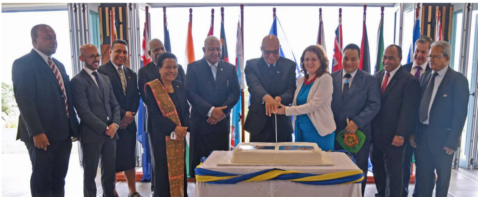
President Major-General (Ret'd) Jioji Konrote and Prime Minister Voreqe Bainimarama with representatives from Commonwealth-member countries during Commonwealth Day celebrations at State House in Suva.