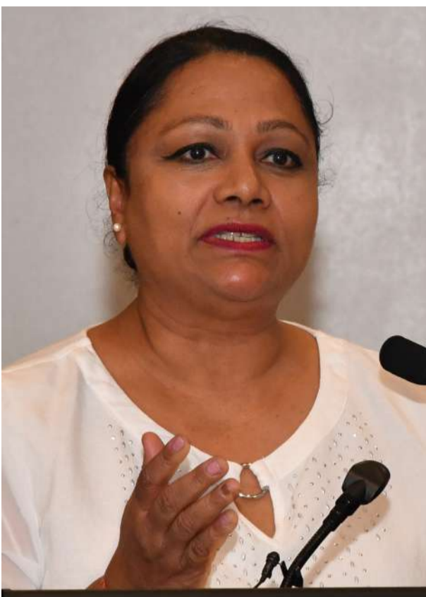
Minister for Industry, Trade, Tourism, Housing and Community Development, Premila Kumar during the Speaking at the Speed Networking Dinner with the members of the Fiji- Australia Business Council in Suva.

THE Fijian Government has embarked on ambitious reforms that will ease doing business in Fiji.