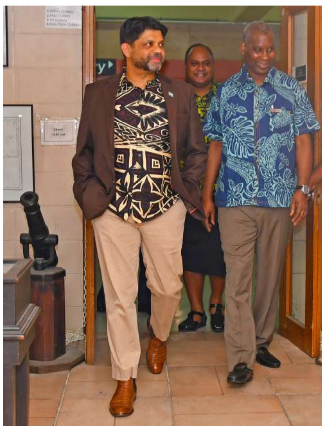
Attorney-General and Minister for Economy Aiyaz Sayed-Khaiyum with President of the 74th Session of the United Nations General Assembly (UNGA) Tijjani Muhammad-Bande during his recent visit to Fiji.

Mr Muhammad-Bande commended the Fijian Government for their commitment to taking the lead role of fighting climate change locally and taking the lead role in the region.