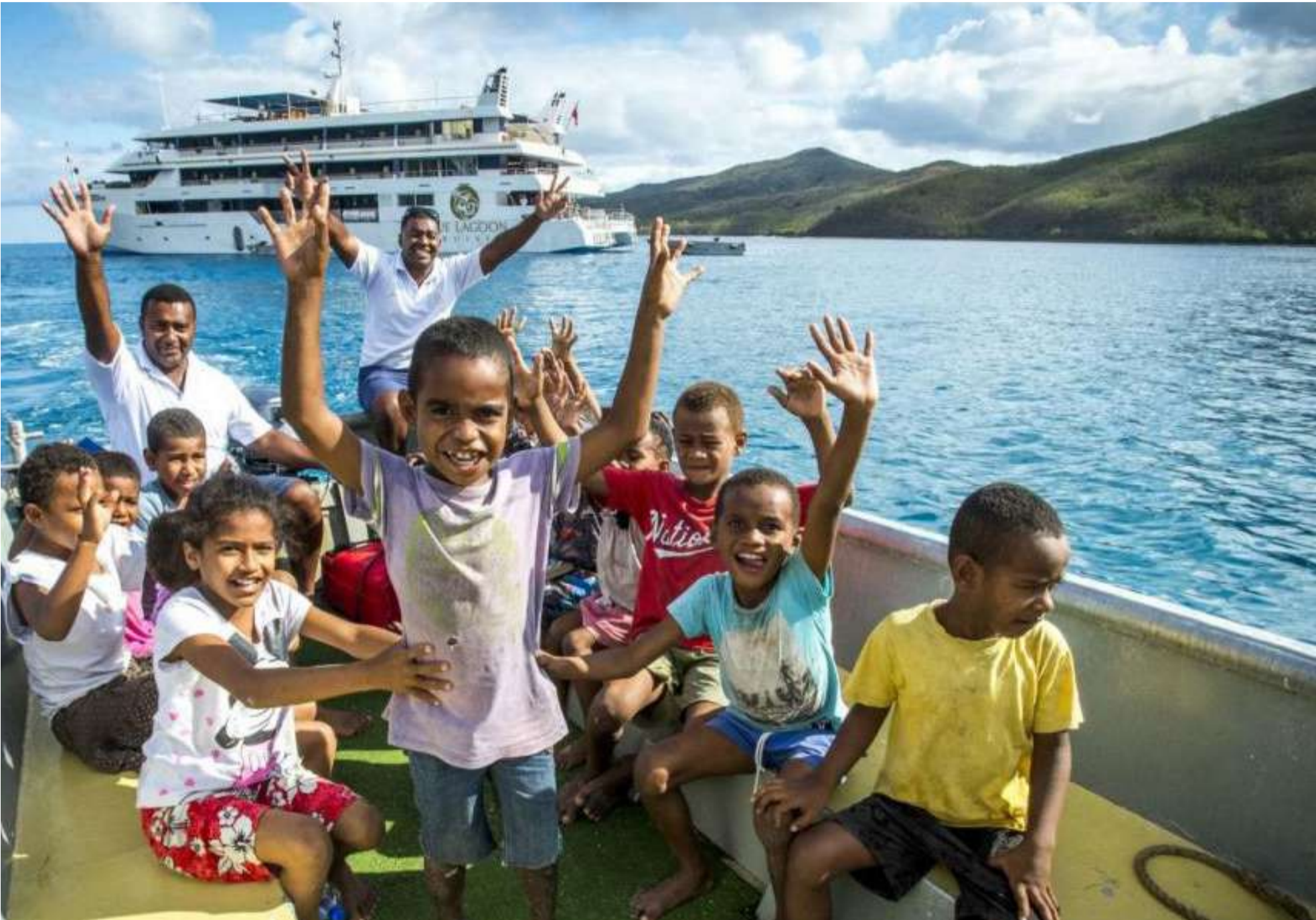
Sa keke tu mai dakudra na lalai kei irau na turaga oqori e dua na waqa ni saravanua ka ra marautaka na gone ni Yasawa me dua na kedrai itaba. Na yabaki 2019 na yabaki vinaka duadua ni saravanua e Viti ni levu duadua kina era gade mai kina ki Viti.