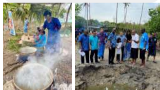
UN GA President (@UN_PGA)

As we mark #IWD2020 let us celebrate all women who work tirelessly to not only support their families but uplift their entire communities. Privileged to have spent time in #vusama and see how local women are reviving salt-making traditions to build a better future.