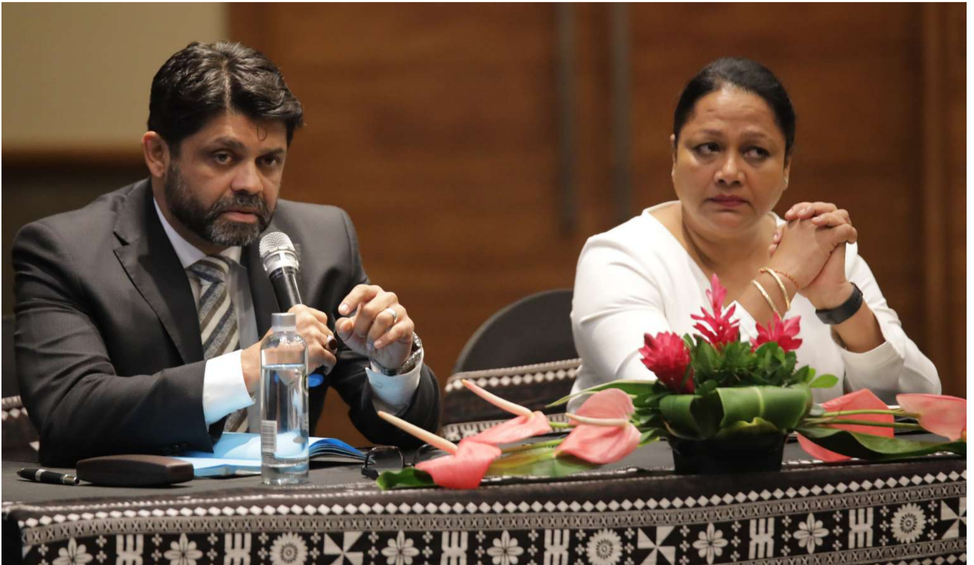
Attorney-General and Minister for Economy Aiyaz Sayed-Khaiyum and Minister for Industry, Trade, Tourism, Local Government, Housing and Community Development Premila Kumar during the open discussion on the impact of Coronavirus (COVID-19) on businesses.