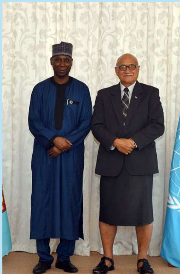
Totoka na kedrau itaba na Peresitedi ni Matabose kei Vuravura ko Dr. Tijjani Muhammad – Bande kei na Peresitedi ni noda vanua ko Jioji Konrote ena tikotiko ni Peresitedi ena Vale Levu e Suva.

Vakauasivi na noda tokoni e Viti meda rawata na tekete ni Veivakatorocaketaki lewai matau ena yabaki 10 oqo.