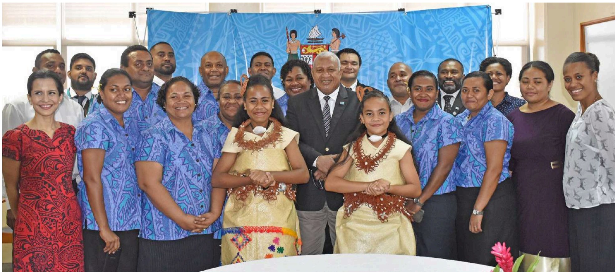
E ra taba vata tu oqori kei na turaga na Paraiminisita Voreqe Bainimarama na ivakaillesilesi ni Tabacakacaka ni Bula ena dola ni Molecular Laboratory e Tamavua, Suva.