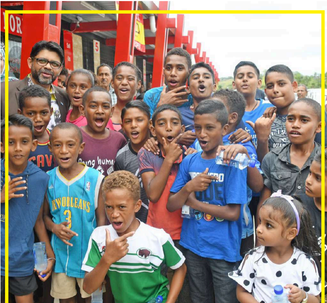
Attorney-General and Minister for Economy Aiyaz Sayed-Khaiyum with kids during the opening of the new Cuvu complex at Naidovi, Nadroga.

"We have requested assistance in terms of training and the Ministry has agreed to come back to hold training sessions with villagers on how to plant and maintain our trees especially sandalwood trees. We have heard a lot of stories about how many Fijians are benefitting from sandalwood trees and we would also like to try it out."