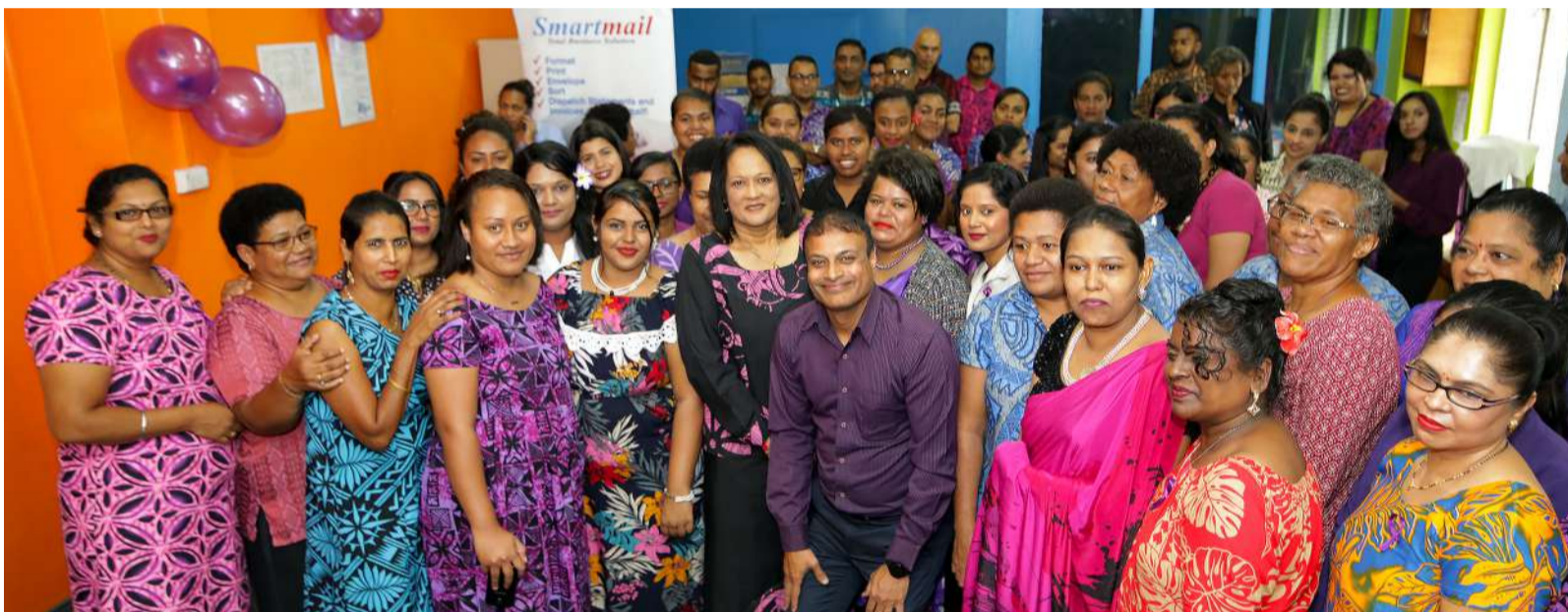
Minister for Education, Heritage and Arts Rosy Akbar during the International Women's Day celebrations at Post Fiji Limited in Suva.

She thanked the members of the Ahmadiyya Muslim Women's Movement for organizing the event which included a variety of women