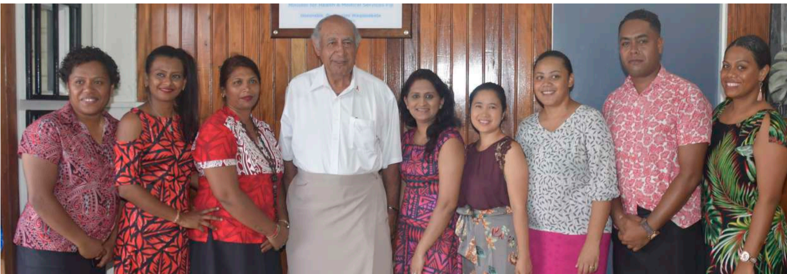
Speaker of Parliament and Champion of HIV-AIDS Ratu Epeli Nailatikau with medical students at the newly-refurbished Sexual and Reproductive Health Clinic in Suva.

The Complete Health Improvement Program (CHIP) program provided by the organization centres on a whole-food, plant based eating pattern which can lead to rapid and meaningful reductions in chronic disease risk factors.