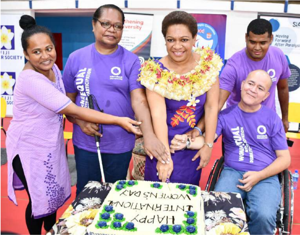
Minister for Women, Children and Poverty Alleviation Mereseini Vuniwaqa celebrates International Women's Day.

THE Ministry of Women, Children and Poverty Alleviation continues to support and provide relief to women, children and the marginalized in the community. The following programmes continues to uplift their livelihoods even as the Ministry fine tunes its processes to serve its clients better.