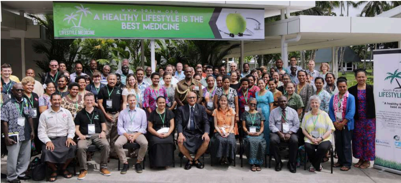
राष्ट्रपति मईजा जेनरल (Ret'd) चोची कोन्रोते, पॅसिफिक हाबा में साउथ पॅसिफिक सोसाईटी ऑफ लाईफस्टाएल मेडिसन के सम्मेलन में प्रशांत और मल्टीलईट्रल संस्थाओं जैसे (WHO) और (SPC) के उच्च अधिकारियों के साथ