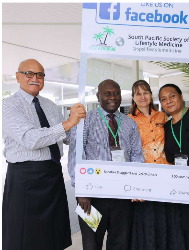
President, Major-General (Ret'd) Jioji Konrote said with Fiji's successful measles response and the current COVID-19 response, both of which involved the nation coming together, can guide the nation toward a planned strategy for the promotion of health and wellbeing to fight NCD.