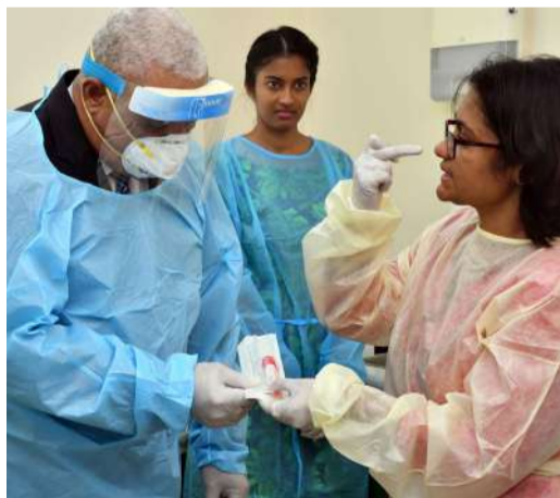
Prime Minister Voreqe Bainimarama checks out the new facilities during the opening of the new lab at Colonial War Memorial Hospital, Suva, that will assist in identify COVID-19 or Coronavirus in Fiji.

“These bans have bought us precious time — for every day Fiji has remained coronavirus-free, we have had another vital day to prepare. We are constantly reviewing the WHO’s latest case numbers and we will not hesitate to introduce new and more stringent restrictions when necessary.”