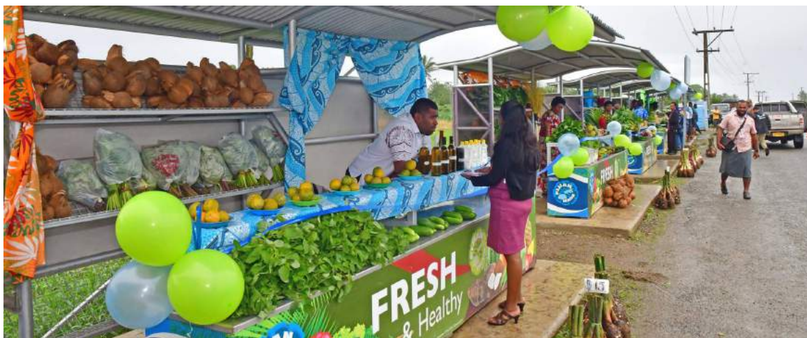
Totoka qai rairai bulabula na makete vou mai Navakabalea e Navua ena bati ni gaunisala na Queens Road.

Vakaraitaka ko Paraiminisita Voreqe Bainimarama ni oqo edua