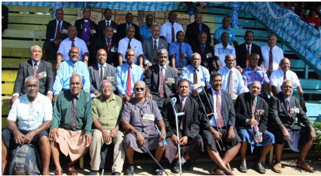
Some of the ex-servicemen in Labasa.

The one day symposium included stories shared from veterans and key speakers from Government and senior military officers.