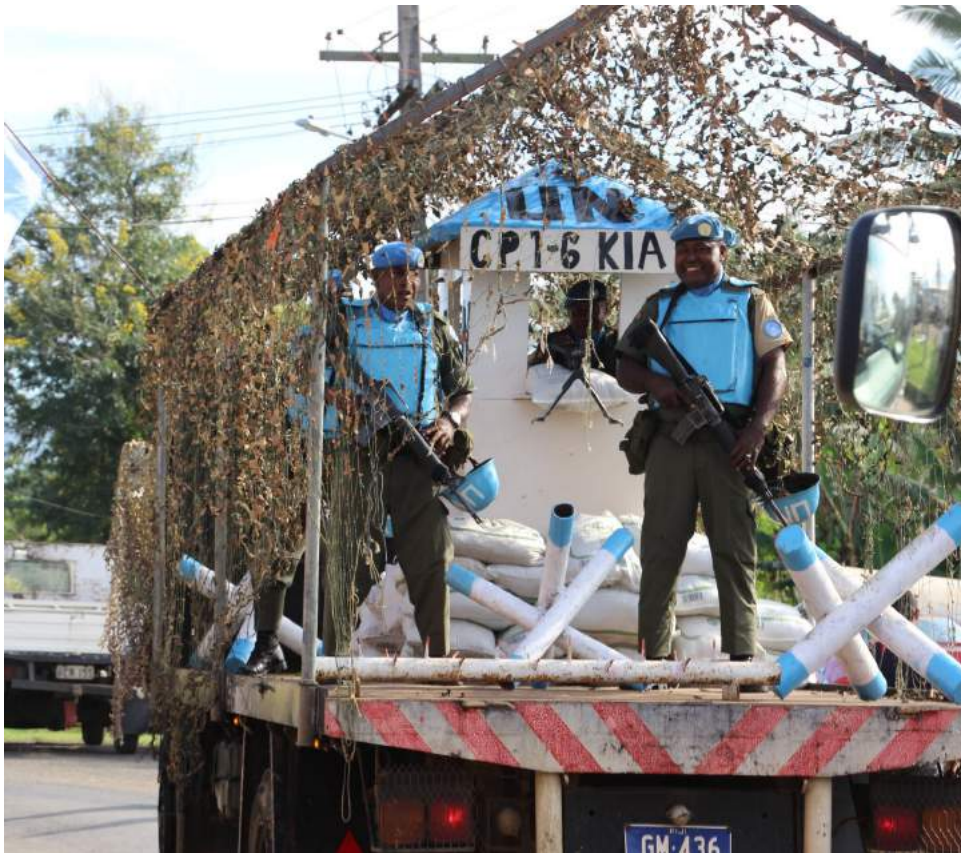
Soldiers during the Fiji-UN 40th anniversary parade in Labasa.