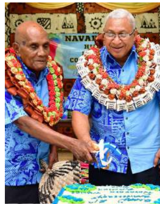
Sa vakarau musuka tiko ko Paraiminisita Voreqe Bainimarama na keke ni vakananumi ni kena sevutaki na ituvatuva ni veivakabulabulataki ni 2018-2022 ni Yavusa Navakavu.