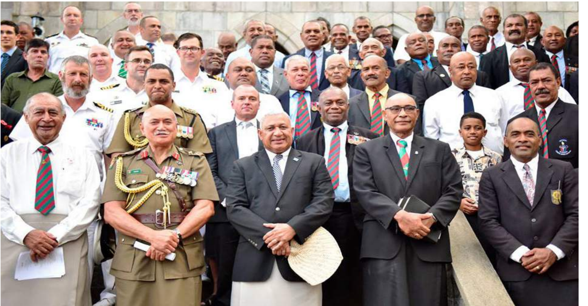
उपर: बाईं ओर से भुतपूर्व राष्ट्रपति, रातू इपेली नईलातिकाउ, राष्ट्रपति चियोची कोनरोते, प्रधानमंत्री, वॉरेन्गो बईनिमरामा, सेना प्रमुख विलियामे नउपोतो के साथ दिग्गजों और अनुशासित बलों के सदस्यों।