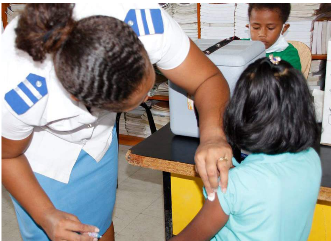
अस्सी हजार से ज़्यादा बच्चों को केन्द्रीय और रा-सबडिविज़न के है को राष्ट्रीय मेनिंगजोकोकल टीकाकरण कार्यक्रम के तहत टीके लगाए गए हैं। अभी भी कुछ शिशुओं तथा सेकन्ड्री स्कूल विद्यार्थियों को टीके लगाना बाकी है जबकि अभियान के दो हफ्ते ही बचे हैं।

राष्ट्रीय मेनिंगजोकोकल (मेन सी) टीकाकरण कार्यक्रम चौथे हफ्ते में जारी है जहाँ केन्द्रीय विभाग और रा सब-डिविज़न के अस्सी हजार (80,000) से ज़्यादा बच्चे जिनकी उम्र एक साल के उन्नीस साल के बीच है को टीके लगाए गए हैं। मंत्रालय के दल ने रा-सबडिविज़न में सभी स्कूलों जबकि केन्द्रीय विभाग में नवासी (89) प्रतिशत स्कूलों का दौरा कर लिया है। इस अभियान की अगुवाई स्वास्थ्य मंत्रालय कर रहा है जिनकी सहायता, युनाएटड नईशन्स चिलरन्स इमेजेन्सी फन्ड तथा विश्व स्वास्थ्य संस्था कर रही है। इस मेन सी टीकाकरण कार्यक्रम का लक्ष्य है एक साल से उन्नीस साल के बीच देश भर में सभी बच्चों को स्कूलों, हेल्थ सेन्टर्स और नैसिंग सेन्टर्स में मुफ्त में टीके लगाना। यह कार्यक्रम पिछले महीने की चौदह तारीख को केन्द्रीय विभाग और रा-सब डिविज़न में शुरू हुआ जो इसी महीने की उन्तीस (29) तारीख तक जारी रहेगा। आने वाले महीने में यह अभियान