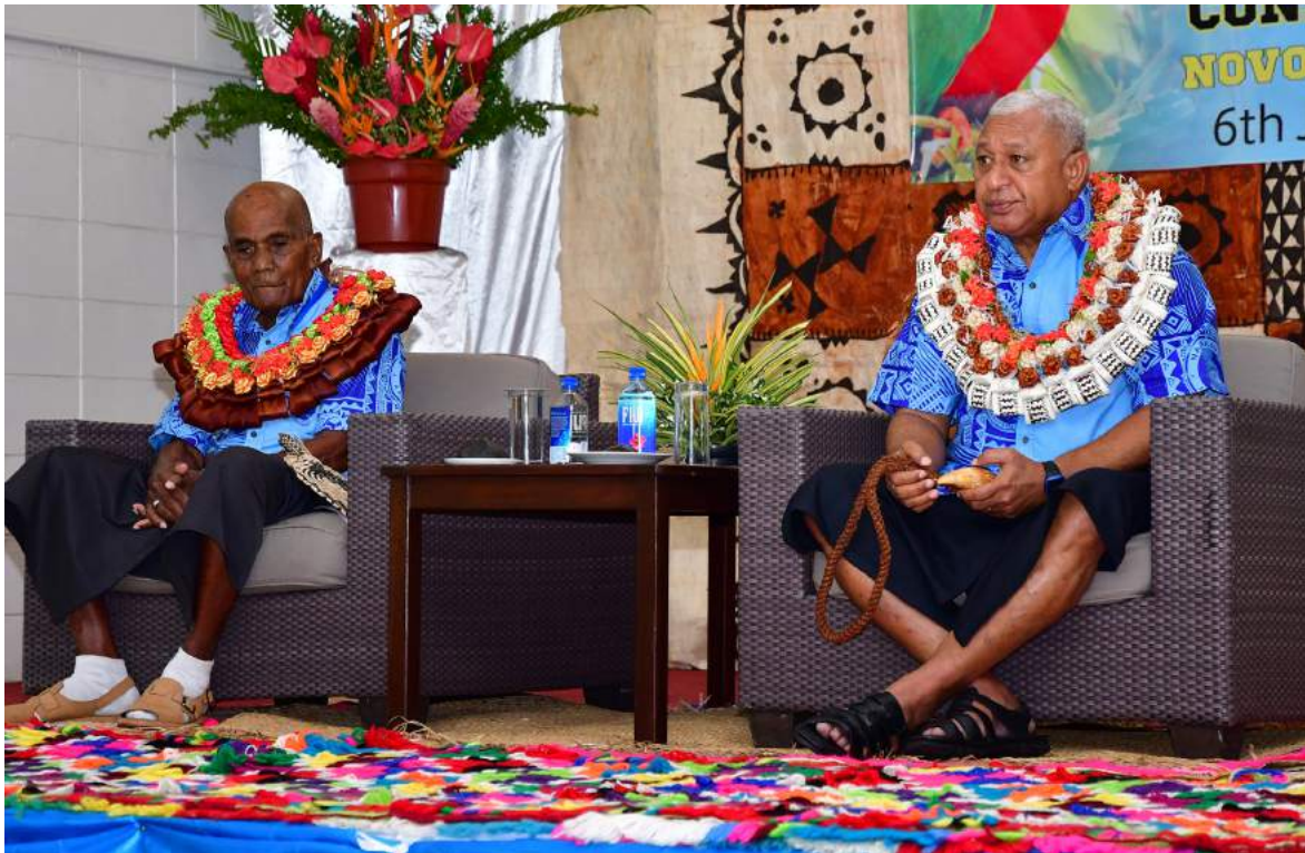
Prime Minister of Fiji and Minister for iTaukei Affairs Voreqe Bainimarama during the High-Level Pledging Conference for the Yavusa Navakavu.