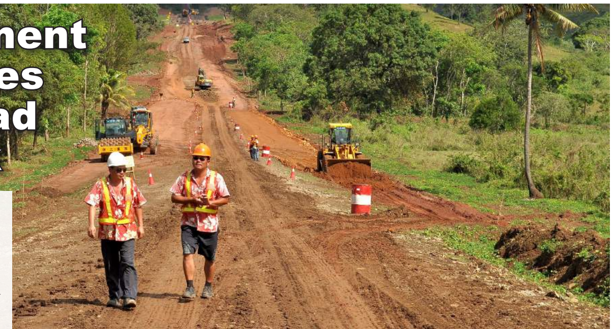
Government will focus on promoting economic growth and sustainable development through the Integrated Rural Development Framework for Fijians living in the rural and maritime islands.

"Most prominent of this is the improvement to the means of access such as roads networks and