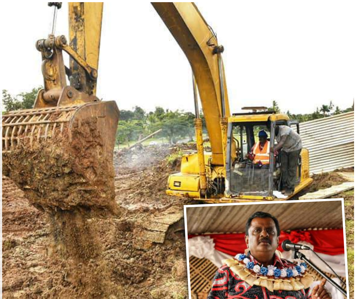
Minister for Local Government and Housing Parveen Kumar during the ground-breaking ceremony for 36 new unit flats under Public Rental Board at Simla in Lautoka.

“As such, all PRB tenants who wish to become owners of any