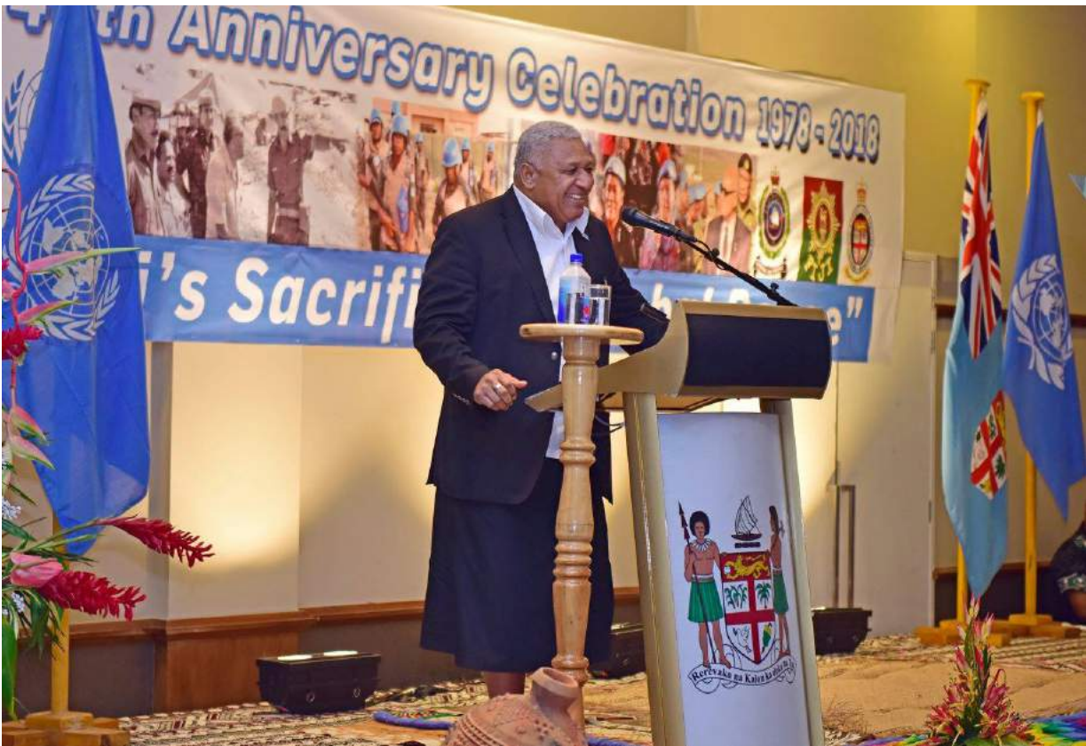
Prime Minister Voreqe Bainimarama during the 40th Fiji-UN peacekeeping symposium at Grand Pacific Hotel, Suva.

"That legacy has not been built without sacrifice, as we have paid a high price – especially for a nation of our size – for the sake of spreading peace around the world."