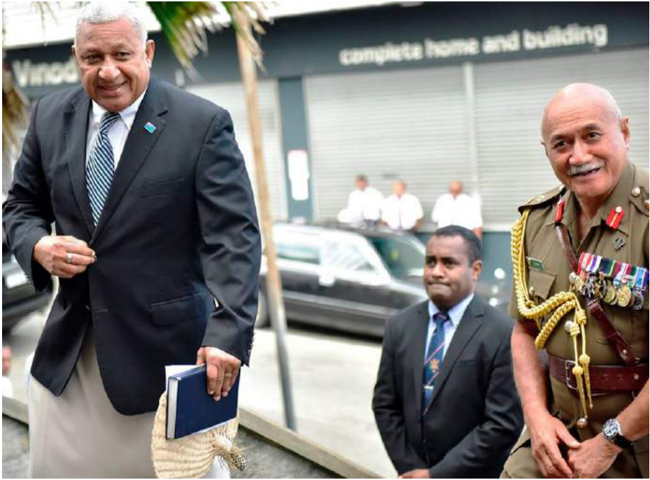
E rau sa cabe cake kina vale ni lotu levu na Centenary na turaga na iliului ni Matanitu ko Voreqe Bainimarama kei na turaga na Peresitedi ko Jioji Konrote ena lotu ni vakananumi ni yabaki 40 ni veiqaravi nei Viti ena veisaututaki ena Tokalau e Loma.

“Me vakalougataki ira na noda dau ni veisaututaki na Kalou Levu. Ka me vakaloumanataki Viti”