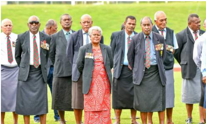
Retired servicemen and women were part of the parade at the celebrations in Lautoka.