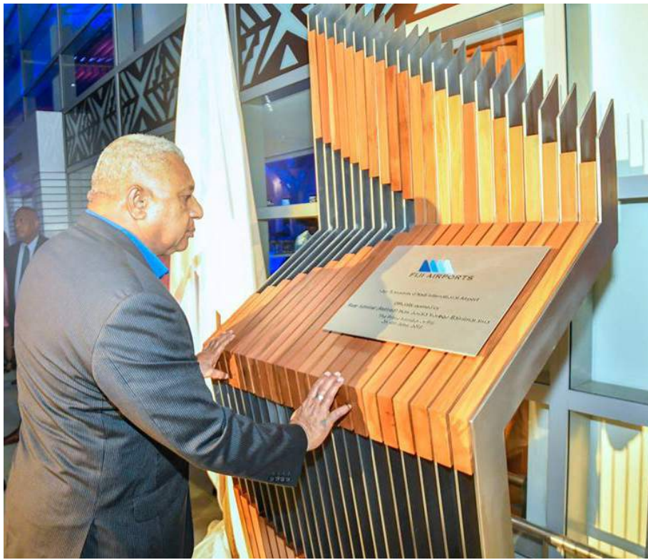
Prime Minister Voreqe Bainimarama unveils a plaque during the official opening of the renovated Nadi International Airport.