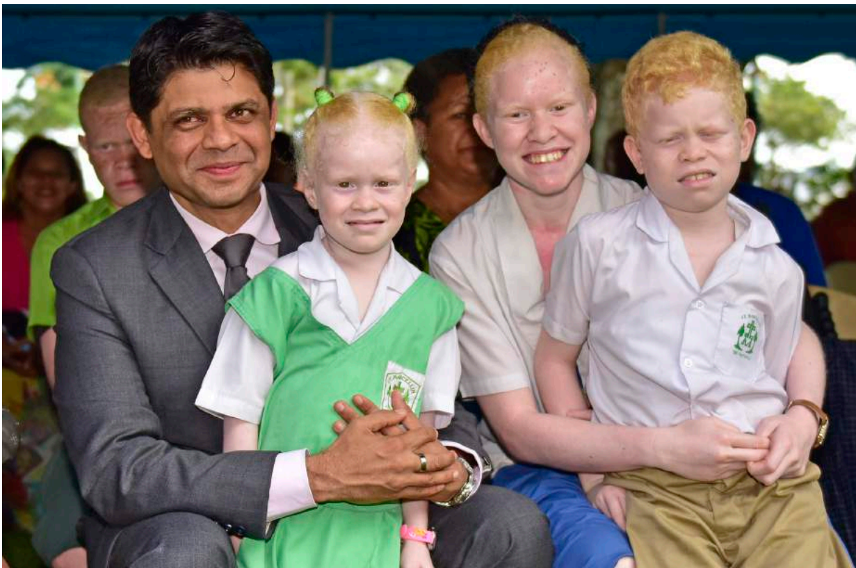
Attorney-General and Minister for Justice Aiyaz Sayed-Khaiyum and Fijians living with albinism during the International Albinism Awareness Day (IIAD) at Ratu Sukuna Park in Suva.