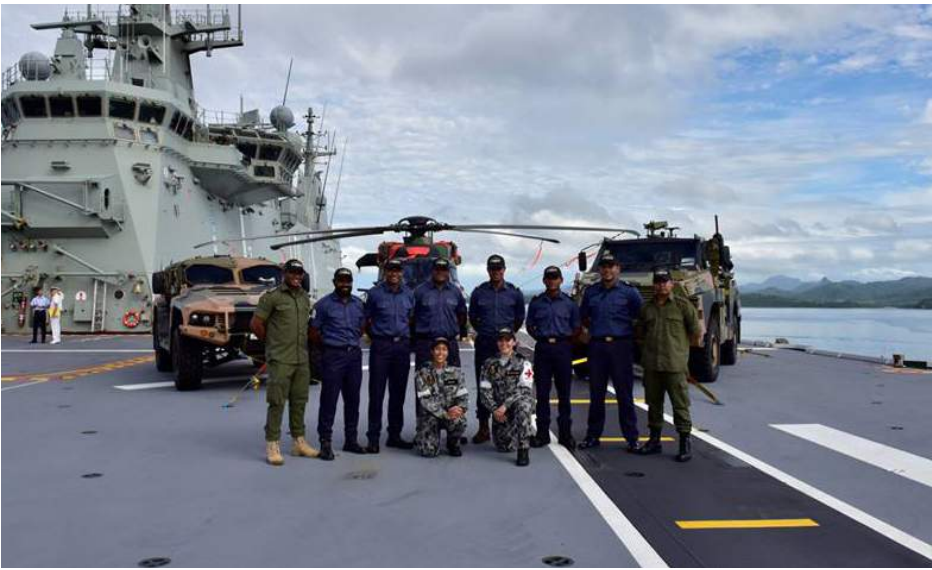
Ko ira na lewe ni mataivalu e wai ni Ositerelia, Viti kei Sri Lanka ena nodra mai vakatovotova tiko ena toba ko Suva ka ra taba toka oqo ena dela ni manuwa ni Ositerelia na HMAS Adelaide.