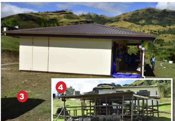
1. Era marau na gonevuli ni Naseyani Primary School e na nodra la'ki dolava na nodra vale ni kana vou ko Paraiminisita Voreqe Bainimarama ena macawa sa oti. 2. Era tucake toka qori ko ira na gonevuli kei na nodra qasenivuli ena varada ni nodra vale ni kana vou. 3-4. Na vale ni kana vou ka a yalataka ko PM Bainimarama ni oti e dua na veitalanoa kei ira na taukei ni koronivuli me sosomitaka na vale ni kana makawa.