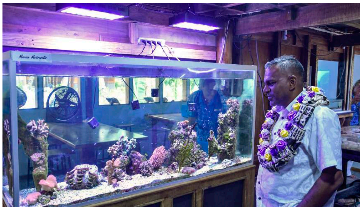
Minister for Industry, Trade and Tourism Faiyaz Koya after opening the “life under the sea” Marine Science and Education Centre at Barefoot Manta Resort in the Yasawa Group.

“I have been informed that this Science and Education Centre has already attracted interest from