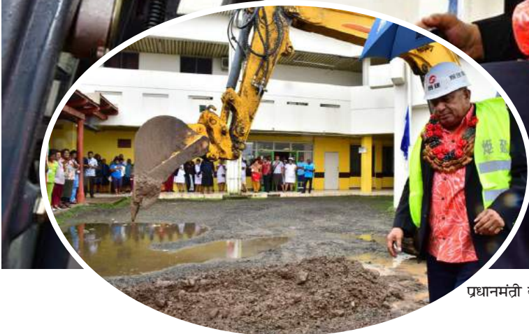
प्रधानमंत्री वॉरेनो बर्डिनमरामा सी डबलू एम अस्पताल के लिए एक नई हेल्थ युनिट का न्यू डालते हुए।