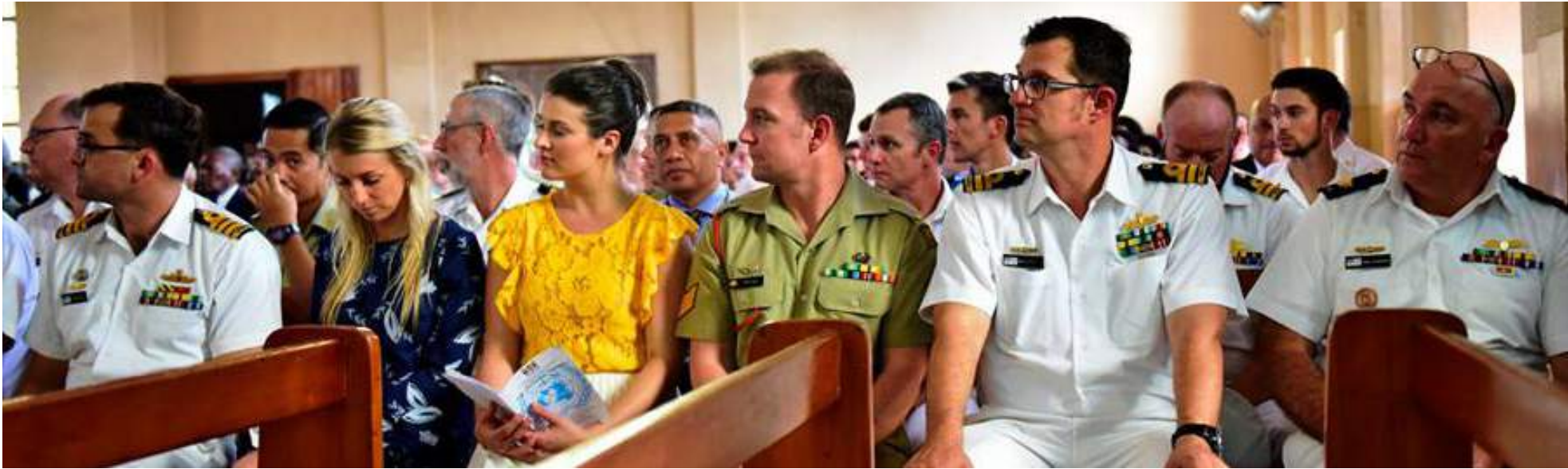
Ko ira na lewe ni mataivalu e wai ni Ositerelia na HMAS Adelaide ena loma ni vale ni lotu na Centenary e Suva ena vakananumi ni yabaki 40 ni veiqaravi ni mataivalu ni Viti ena veisaututaki ena Tokalau e Loma.