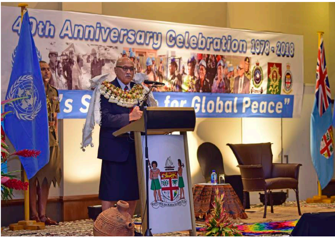
President Major General (Ret'd) Jioji Konrote paid tribute to the peacekeepers while officiating at the 40th Fiji-UN peacekeeping symposium at Grand Pacific Hotel, Suva.