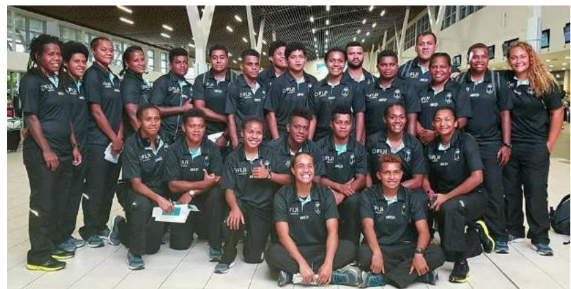
Members of the Fijiana 15s team who are on a two-match tour of Australia.

Tickets are available from the Fiji Sports Council Office in Suva, Post Fiji outlets nationwide and online at www.ticketdirect.com.fj SUPER RUGBY SECRETARIAT