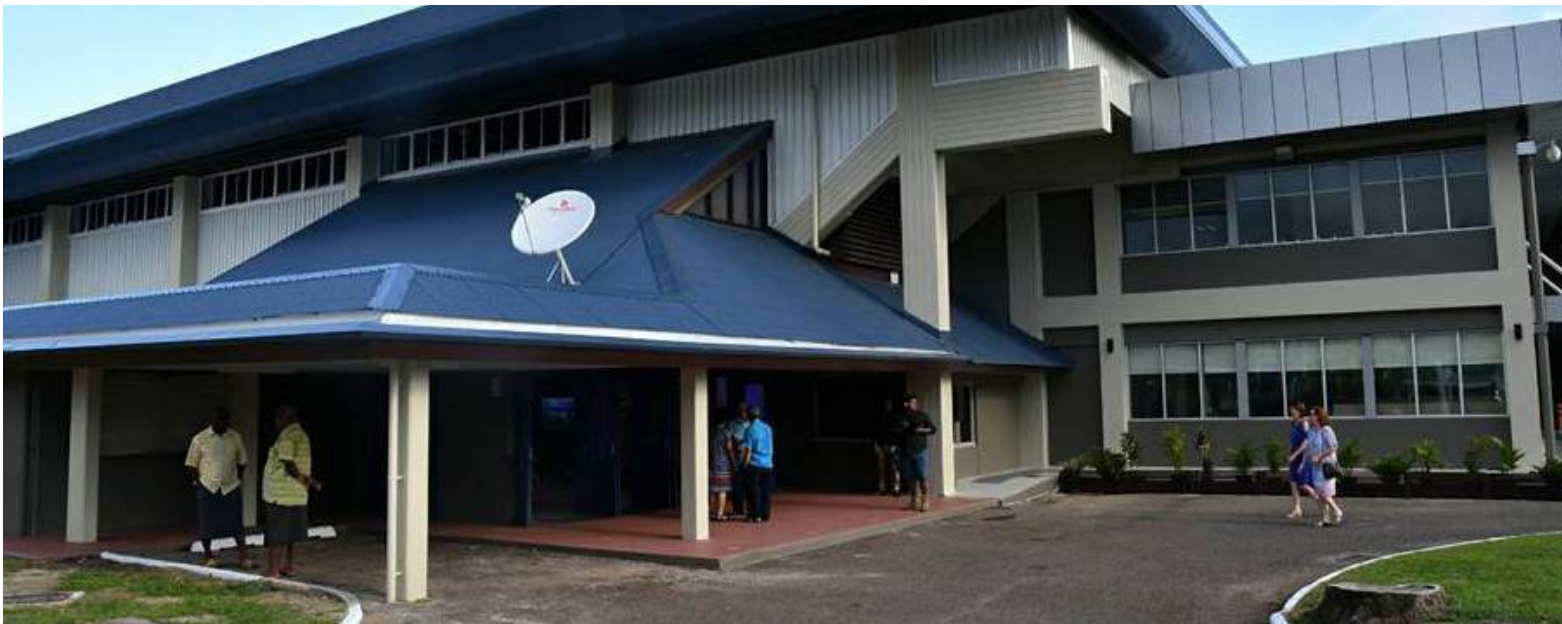
The newly-renovated FMF Gymnasium. The gymnasium was established in 1979 since then this is its first facelift.