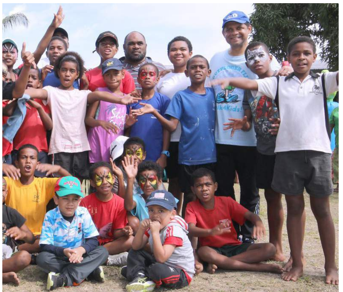
Attorney-General Aiyaz Sayed-Khaiyum, his two sons and members of the public during the Outrigger Walk for Kids programme in Sigatoka.

A special National Sports and Wellness Day holiday is dedicated in the national calendar for a more inclusive and healthier nation.