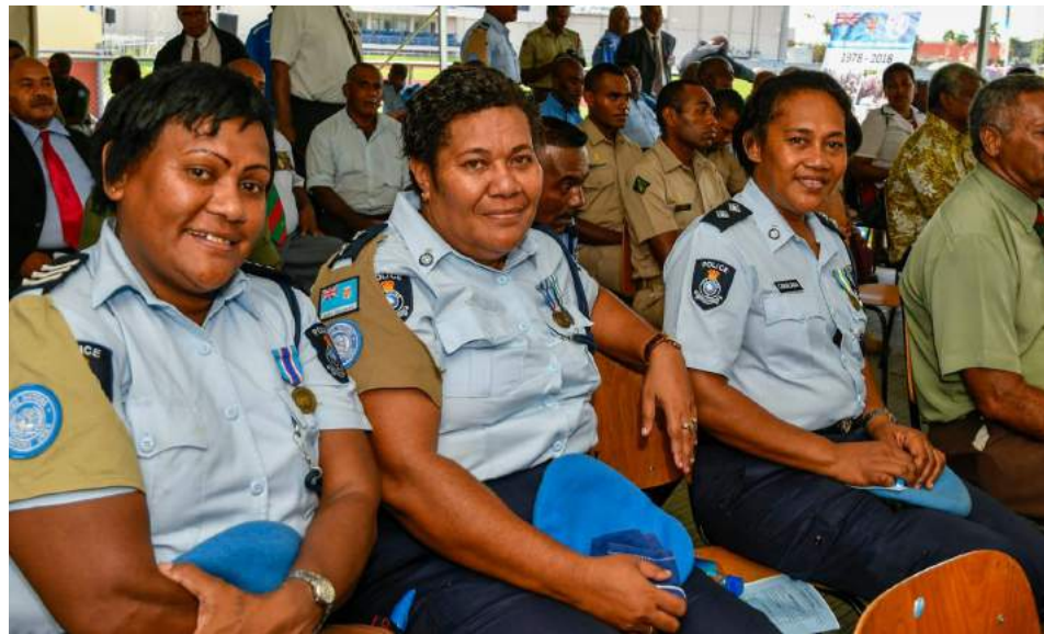
Fiji Police Force female officers who served on peacekeeping missions abroad during celebrations in Lautoka.