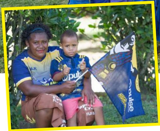
Students and teachers of Nadroumai Primary School in Nadroga where visiting Pulse Energy Highlanders' star wing Waisake Naholo's is from. Villagers of Nadroumai have assured full support for their local hero with two buses confirmed to come down on game day.