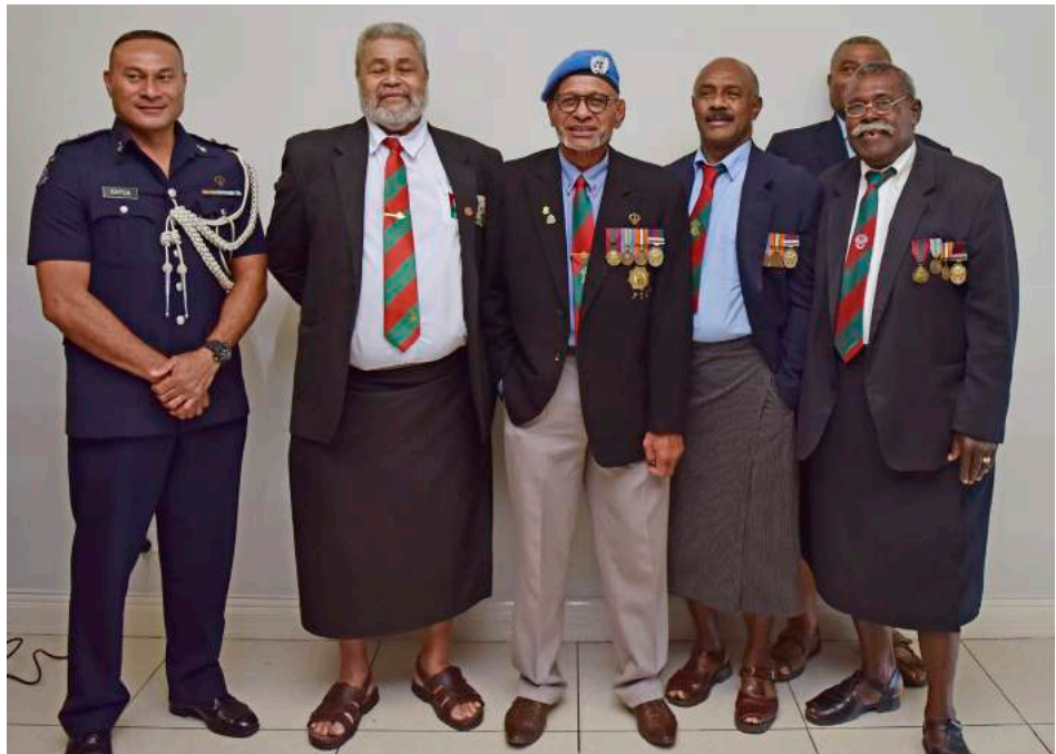
Ex-servicemen during the 40th anniversary of Fiji's contribution to peacekeeping under the United Nations