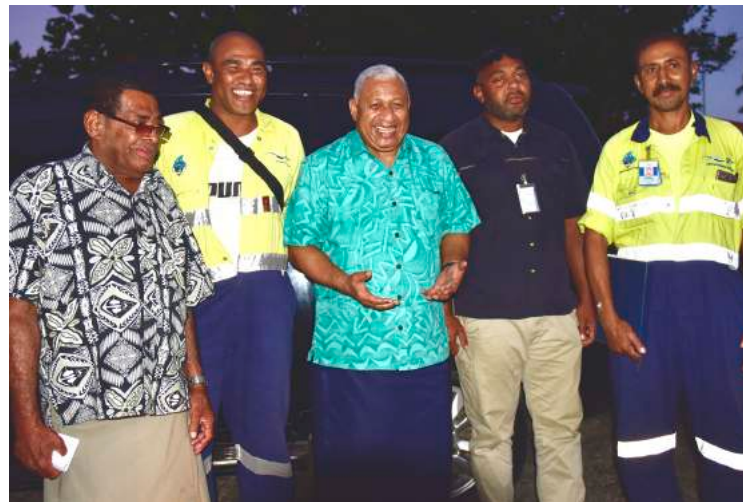
Prime Minister Voreqe Bainimarama, turaga ni koro of Namuaimada Village Usaia Rawaidranu and Water Authority of Fiji officials during the PM's visit to the village in Ra.