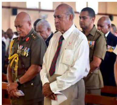
Former President and commanding officer for the first Fiji battalion to serve under the United Nations in Lebanon, Ratu Epeli Nailatikau, at Centenary Church in Suva.