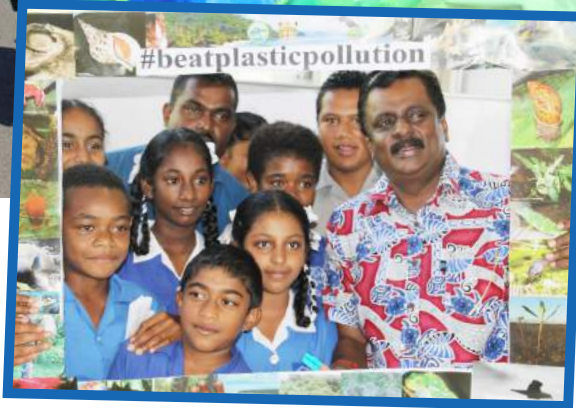
Minister for Local Government, Housing, Environment, Infrastructure and Transport Parveen Kumar and participants during the launch of the 2018 World Environment Day on the "Beat Plastic Pollution" Campaign.