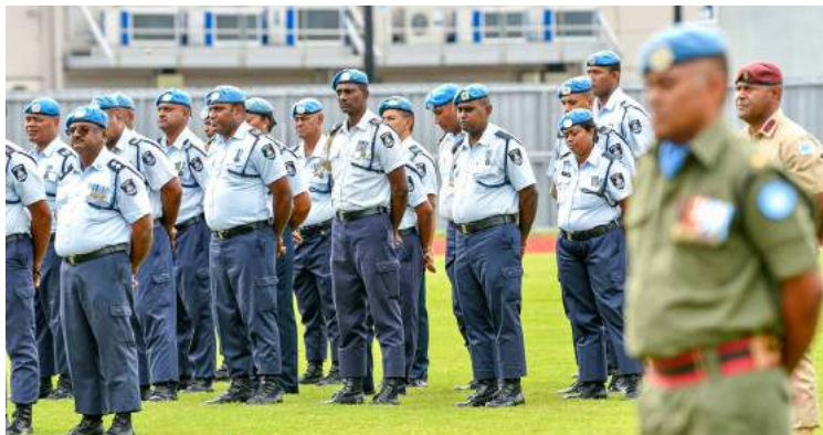
Members of the Fiji Police Force who also served in peacekeeping missions abroad pay tribute during the parade at Churchill Park in Lautoka.