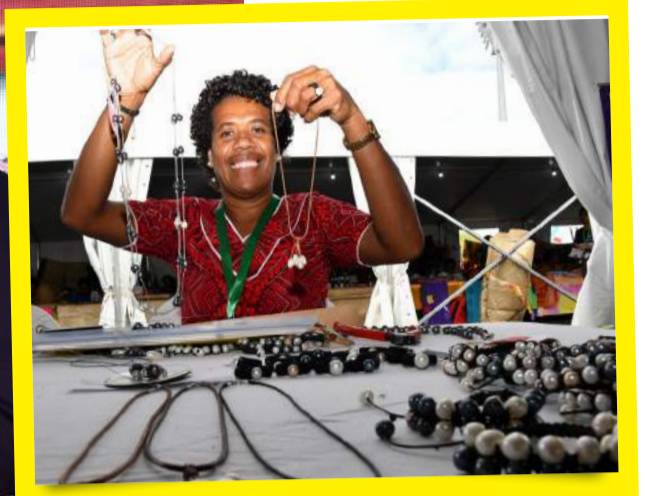
Observing her handiwork materialise makes one marvel at how this woman has the patience and creativity to be able to put together a lovely piece of art.