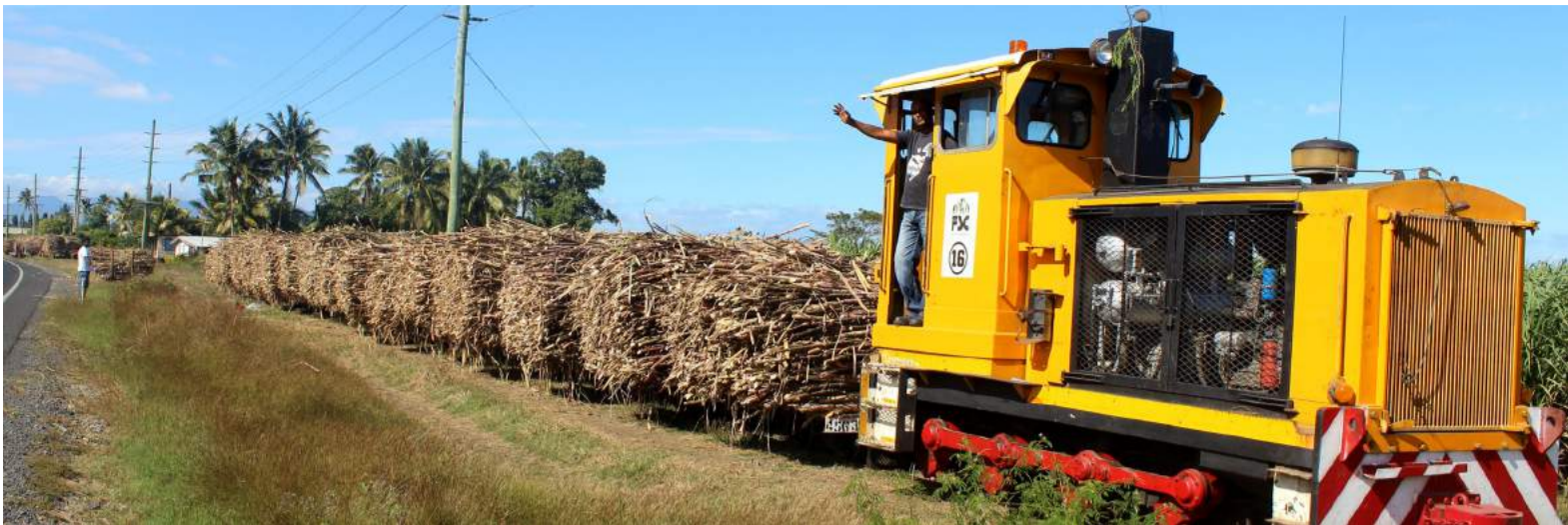
In a positive move for sugarcane growers, sugarcane delivery prices have increased to $37.90 from $32.22 per tonne.