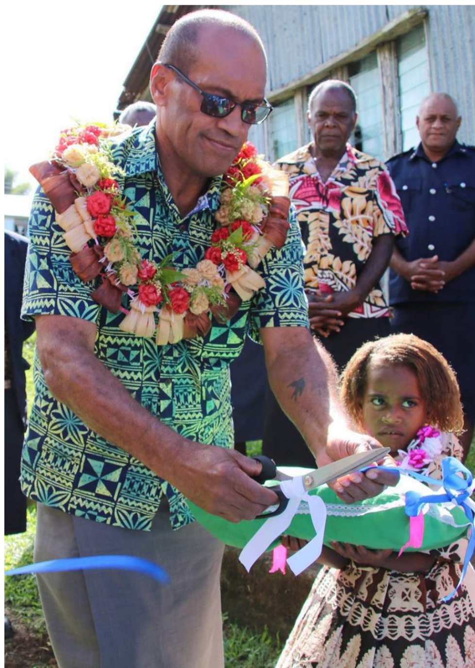
Minister for Infrastructure, Transport, Disaster Management and Meteorological Services Jone Usamate during the commissioning of the rural water project at Nasukamai Village in Ra.

Through the WAF Rainwater Harvesting Scheme, over 11,400 water tanks have been distributed across the country, with a provision of $3 million in the new national budget to continue these essential resources.