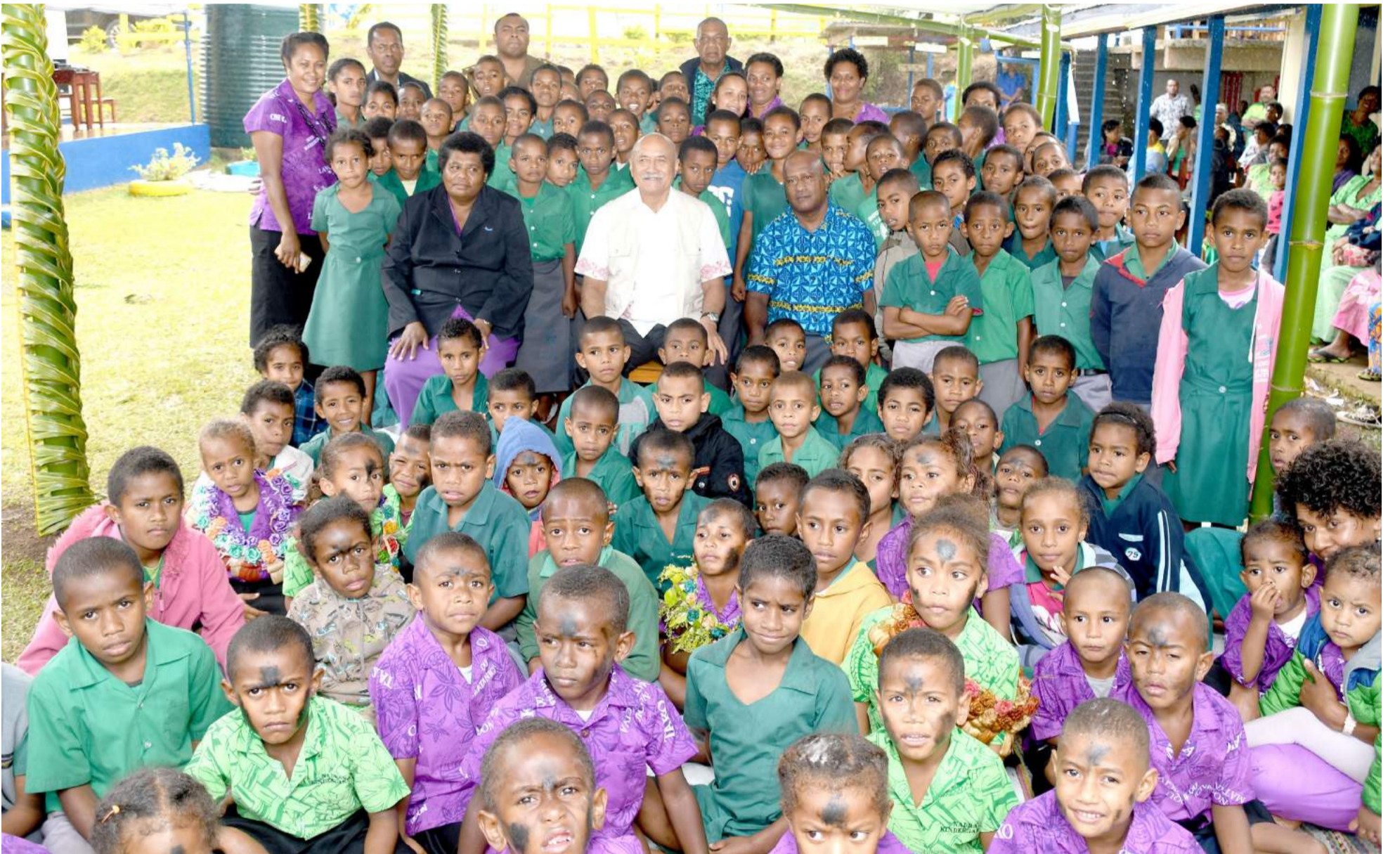
President Major-General (Ret'd) Jioji Konrote with students of Nadrau Primary School in Nadarivatu.