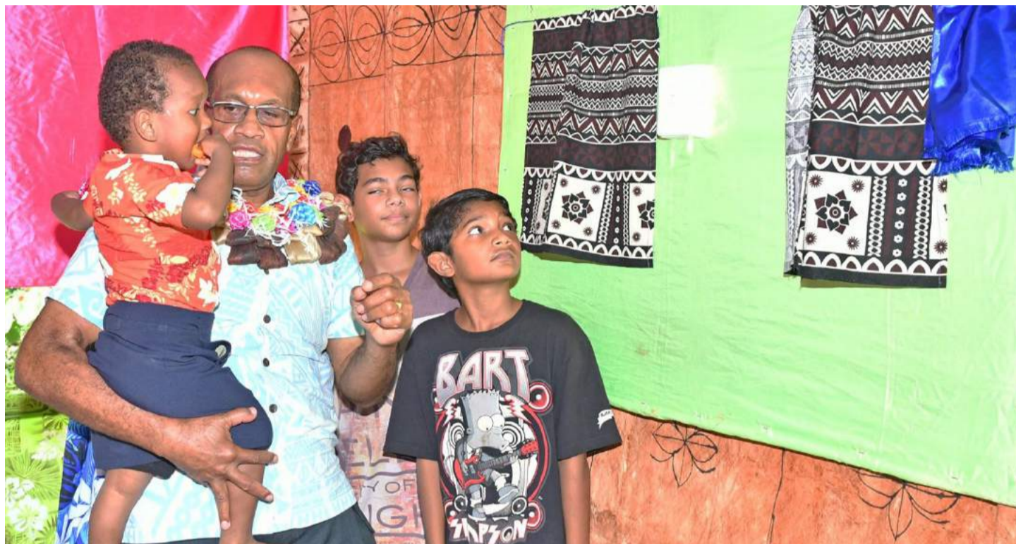
Minister for Infrastructure, Transport, Disaster Management and Meteorological Services Jone Usamate during the commissioning of the grid extension at Qiolevu .

"This Budget provides the much needed confidence in the country's economy. It paves the way for bigger successes for our businesses and for all Fijians."