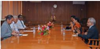
भारतीय उच्चायुक्त प्रधान मंत्री के साथ बातचीत करती हुई