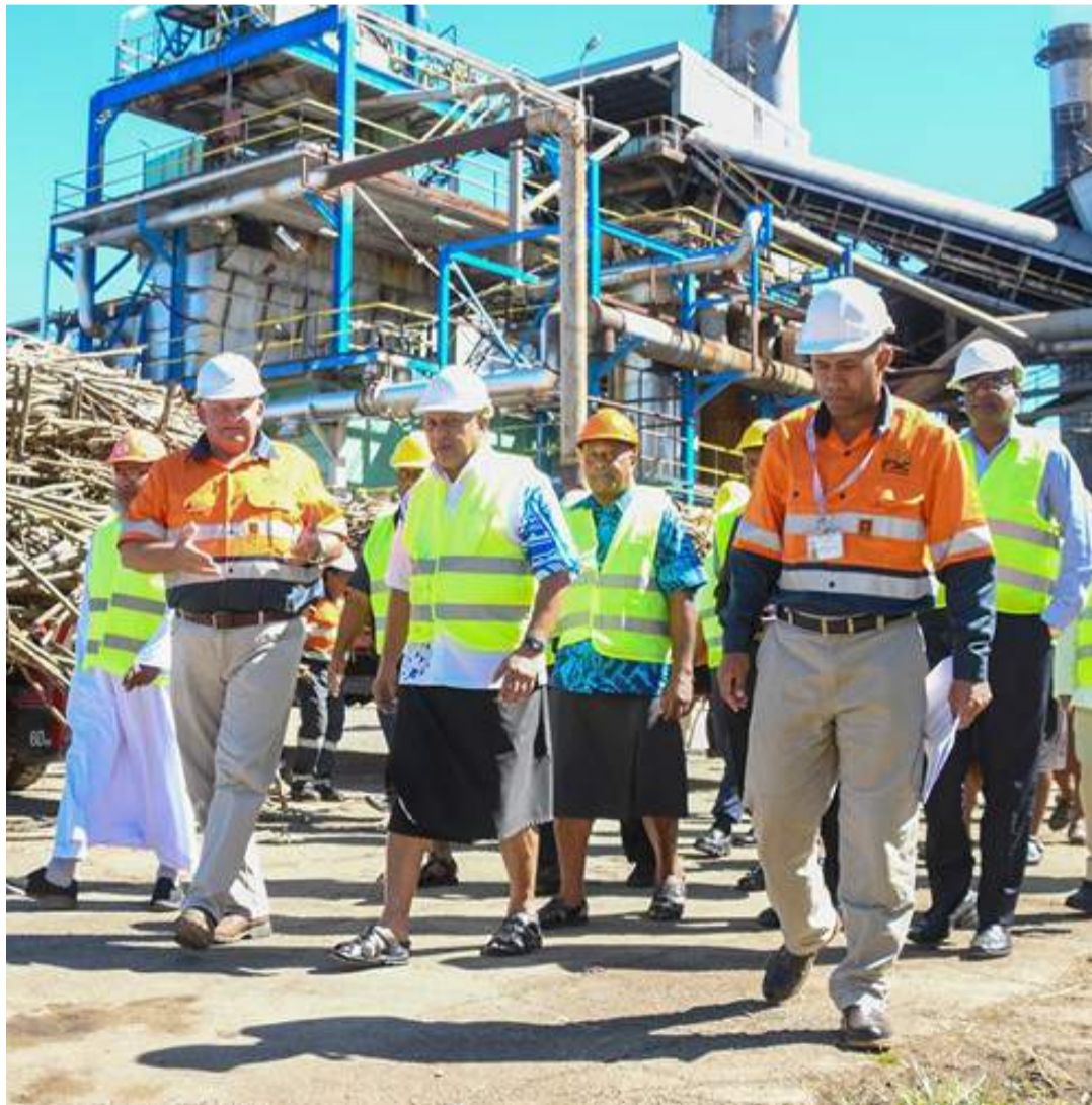
प्रधान मंत्री वीरेन्गे बडिनिमारामा एफ.एस.सी के उच्च अधिकारियों के साथ

लौतोका मिल में तेरह जून को पेराई शुरू हुई और फिलहाल मिल अच्छी तरह से चल रही है।