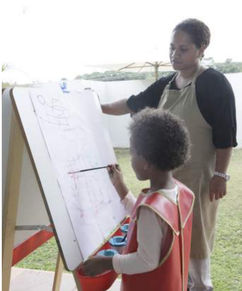
Government has once again put the needs of its people first by allocating funding for an exploratory committee to establish day-care centres near major hubs of employment around the country.

The cost of the facility is approximately $400,000 with the Market Development Facility providing a $50,000 grant for the architects plan and APTC assisting with the overall design and set-up of the centre. The facility has a play area, sleeping area, kitchen, medical room, toilet facilities and a