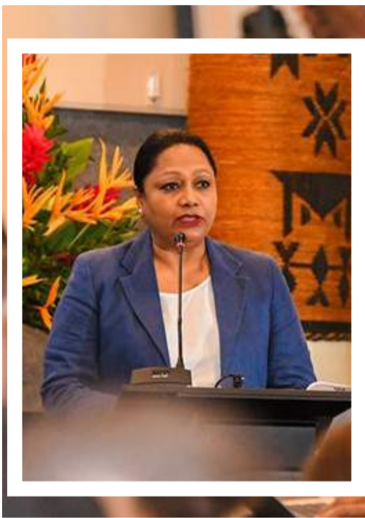
O ira na tiko ena bouse ka baleta na veivakatorocaketaki ni veitauni ena noda vanua. ITABA E LOMA: NaMinisita ni Bisinisi, Veivolvi kei na Saravanua ko Premila Kumar.

Sa vakadavara kina na Minisitiri ni Marama evica na ituvatava me baleta na kena vukei na nodra lewe ni vanua mera semati vinaka kina mai na veivuke ni Matanitu.