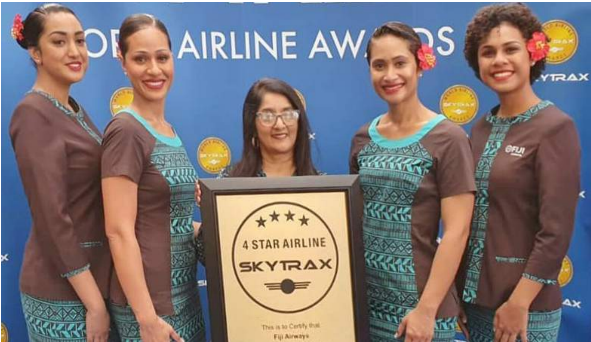
Oqori na matadredredre era dau vakaraitaka ena nodra vaiqaravi e loma ni waqavuka na vakalesilesi ni noda kabani ni waqavuka na Fiji Airways. Sa kuria na matadredredre oqori na rawati ni icovi levu ni vuravura na Skytrax 4-Star rating ni World Airline Award.