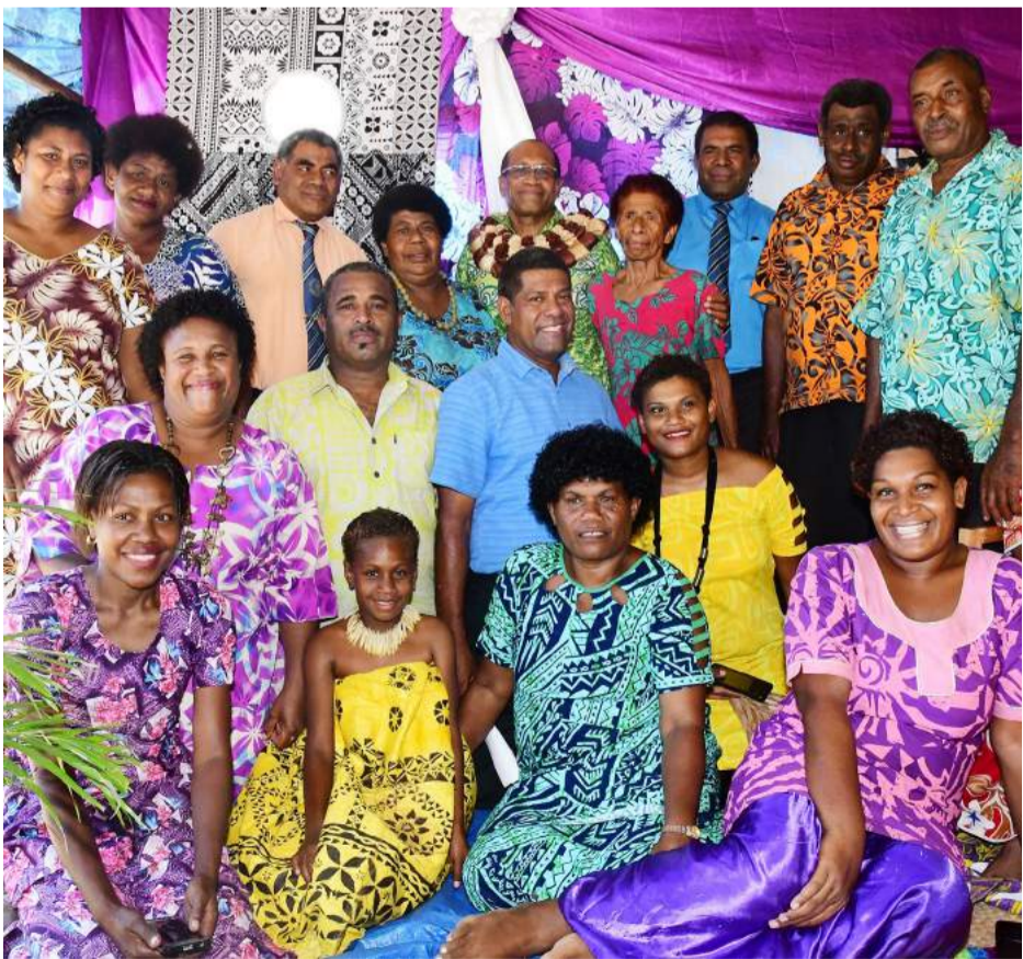
Minister for Infrastructure, Transport, Disaster Management and Meteorological Services Jone Usamate (with garland) joins residents of Vunayawa Settlement in Sabeto, Nadi, during the commissioning of their rural electricity grid.

switch to celebrate the electrification project, which covers a $75,000 grid extension and $18,000 in house wiring works. “In our rural communities, we are putting in place a solid foundation of essential services so that ordinary men and women can go about their lives without worrying about finding water, keeping the lights on at night or staying connected with the rest of our nation. This project is part of that vision,” Minister Usamate said. “Before, communities who wanted electricity needed to contribute around five to 10 per cent of the project cost before Government would help. We’ve done away with that old practice for the benefit of our people and no community contribution is needed at all.” The Government is also funding 50 per cent of monthly electricity bills for families who earn less than $30,000 a year up to 100 kilowatt hours. More than 25,000 Fijian households have benefited from rural electrification, with over $224 million committed by the energy sector in the past five years by the Government.