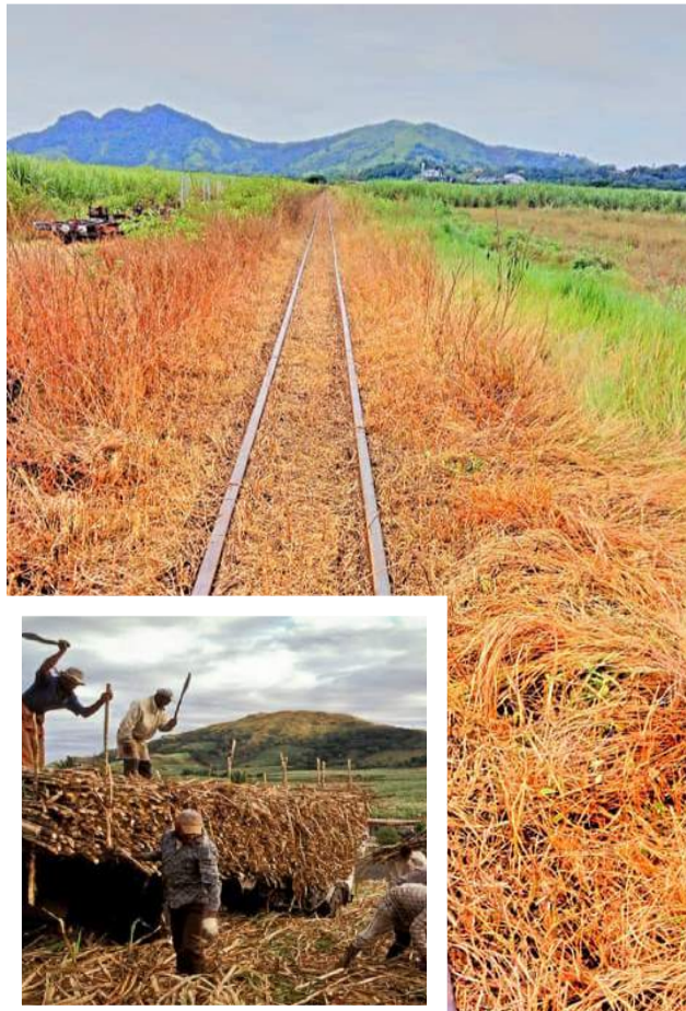
Sa sasaga tiko vakaukauwa na Matanitu me cakacaka vata kei na matanitu mai Idia baleta na kena vakavinakataki na gaunisala ni sitima me rawa ni ra vakayagataka tale ga na dauniveiqaravi ena tei dovuni.

Na bisinisi ni suka esa vukea rawa tiko e 200,000 na lewenivanua ena noda vanua ka sa saqai tikoga oqo me vakavinakataki eso na gagacaga ni vei qaravi me rawa ni vakatuburi kina na bisinisi.