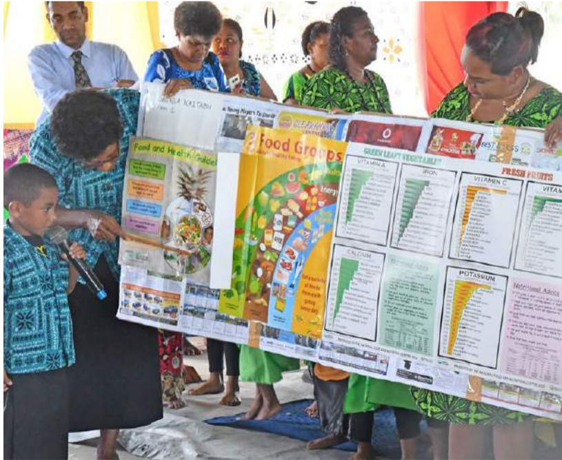
E Viti edaidai e tiko kina e 875 na sova ni vuli ka ra tiko kina e 19,102 na gonevuli kei na 1479 na kena qasenivuli.