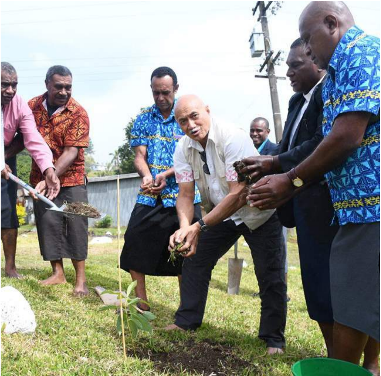
Sa tea tiko oqori na turaga na Peresitedi ko Jioji Konusi Konrote na kau vuata ena loma ni bai ni koronivuli na Nadrau Primary School ena tikina vakaturaga ko Taladrau.

“O ira na gone era vuli suka tiko era kana vata tikoga kei ira na curu ibure ena gauna ni vakasigalevu.”