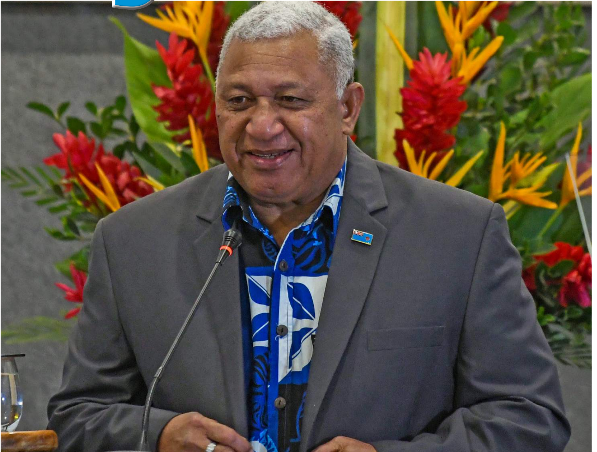
Prime Minister Voreqe Bainimarama during the 5th Pacific Urban Forum - inclusive multi-stakeholder platform for policy dialogue towards a sustainable urban future for the Pacific region in Nadi.