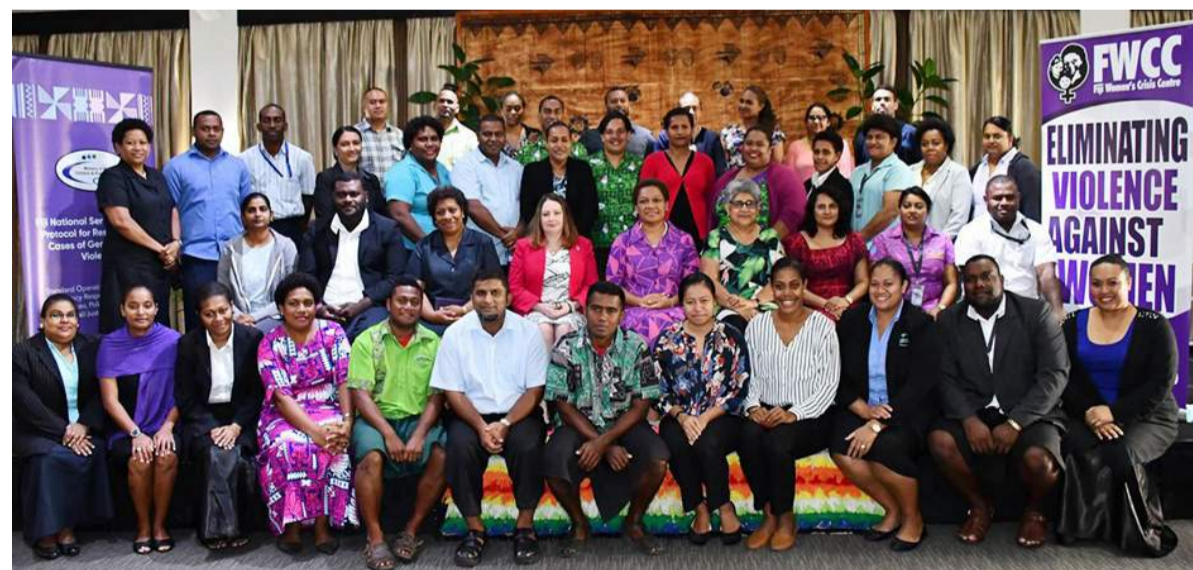
Participants at the Warwick Fiji Resort in the Coral Coast on Monday.

“As officers of the ministry, this training will go a long way in understanding the dynamics behind