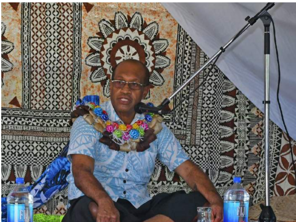
With more than three quarter billion dollars allocated by the Government to improve infrastructure and utilities in the country, Minister Usamate, through a ministry allocation of $89.6m, told Parliament that the ministry would provide the same service and meet its targets.

Minister Usamate said this will be done through the provision of an efficient and sustainable transport network for the country in collaboration with these agen-