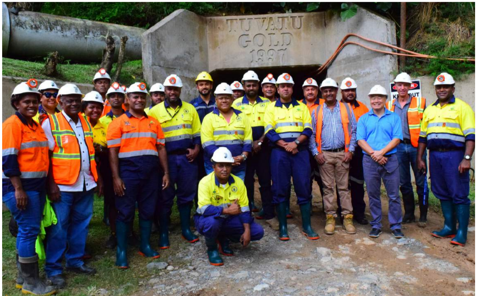
Minister for Lands and Mineral Resources Ashneel Sudhakar, Ministry of Lands staff and management of the Tuvatu Gold Mine at the mine site.

"Such payments will contribute to revenue and build a more self-reliant economy and help fund developments that will meet our citizen's needs."