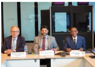
Aiyaz Sayed-Khaiyum (@FijiAG)

Fiji is proud to serve as the chair of the @IMFNews and @WorldBank Joint Committee on Remuneration at our second meeting here in Singapore as part of our larger Chairmanship of the World Bank and IMF Annual Meetings later this year.