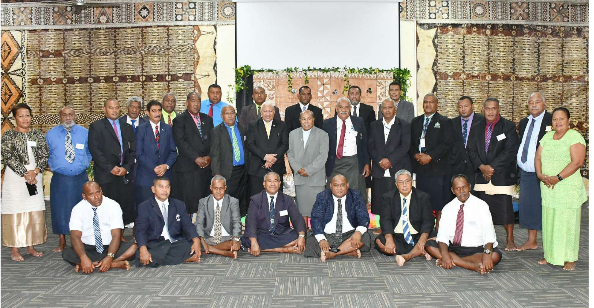
Era taba toka na liuliu ni matanitu Paraiminisita Voreqe Bainimarama kei ira na lewe ni matabose ni yasana ko Lau.

E ra dolava na Bose ni Yasana ko Lau e na siga Vukelulu na imatai ni siga ni vula ko Jiune na noda Paraiminisiat o Josaia Voreqe Bainimarama ka vakaraitaki kina ki vei ira na lewe ni bose na veika e sa vakaitavi tiko kina na noda matanitu e na kena vakatorocake taki kina na yasana. Ra kaya na noda Liuliu ni Matanitu ni marautaka vakalevu na nodra mai tiko maliwai ira na lewe ni Yasana o Lau ena siga ni