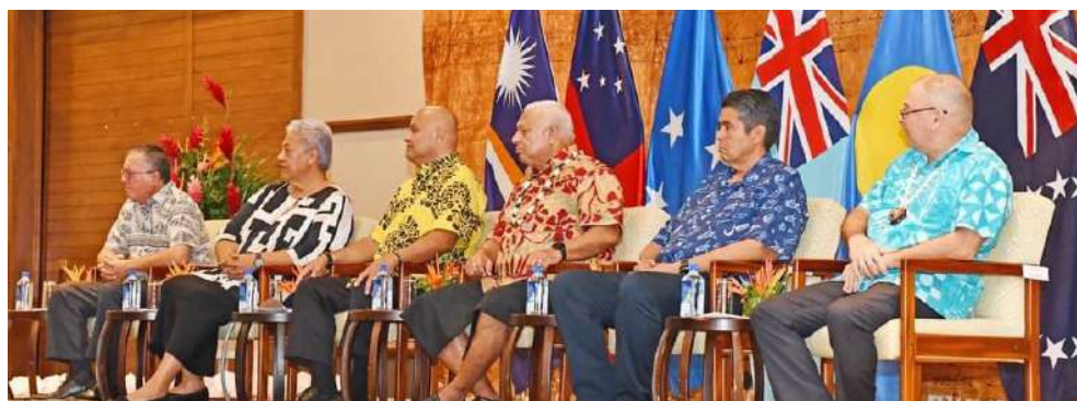
Fijian Prime Minister and the current chair of the Forum, Voreqe Bainimarama with leaders from Polynesia and Micronesia during their welcome ceremony at the Grand Pacific Hotel.

In a traditional welcome ceremony for these leaders, Prime Minister Bainimarama was joined by the Speaker of Parliament, Ratu Epeli Nailatikau, Attorney-General Aiyaz Sayed-Khaiyum, and other dignitaries.