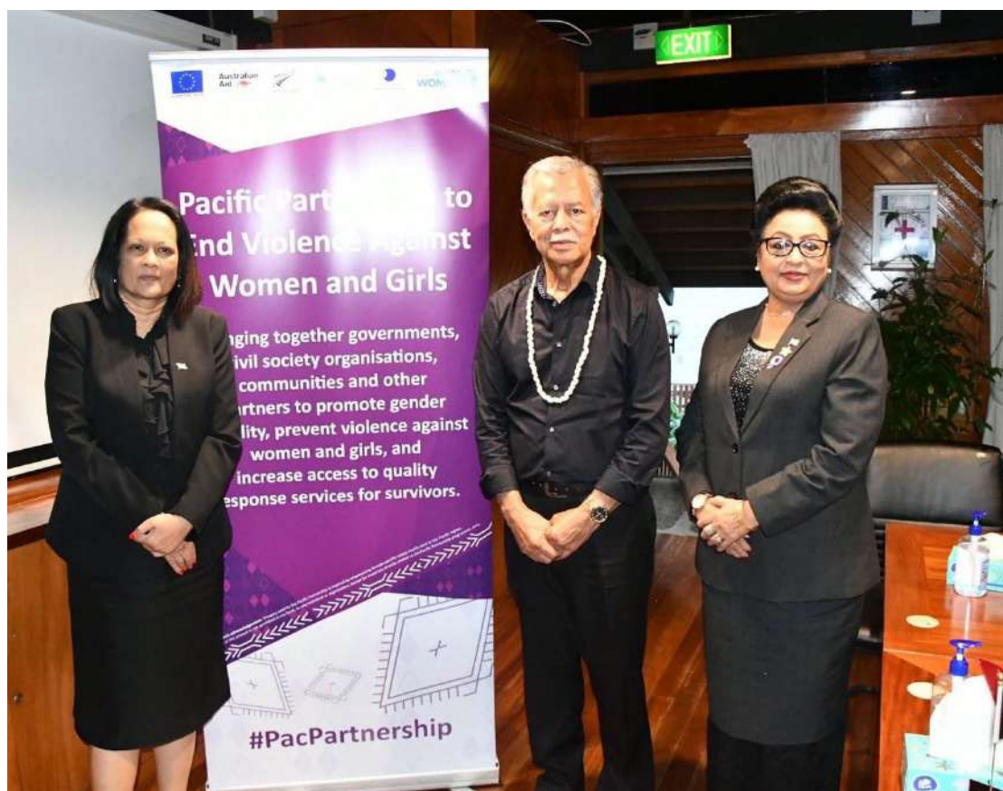
Minister for Women, Children and Poverty Alleviation, Rosy Akbar with Assistant Minister, Veena Bhatnagar and the PIF Secretary-General, Henry Puna at the inaugural PIF Women Leaders Meeting.