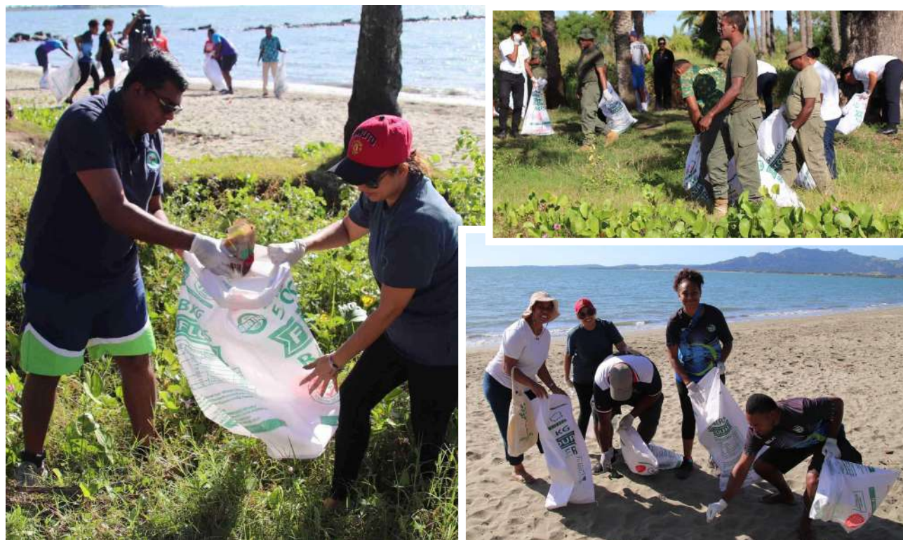
Minister for Agriculture, Waterways and Environment, Dr Mahendra Reddy took part in the clean-up at Wailoaloa Beach as part of the World Oceans Day 2022 commemoration in Nadi.