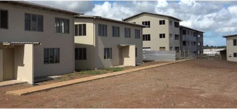
ग्रन्थम रोड सूवा में स्थित लाँगोलांगी हाउजिंग के नए युनिट्स