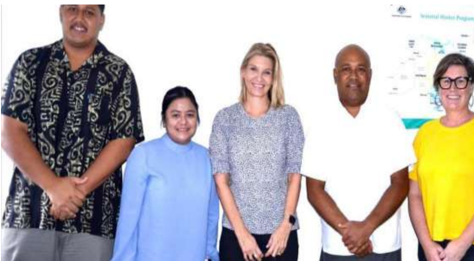
ओस्ट्रेलिया में मांस के क्षेत्र में काम करने के लिए चुने गए कुछ फीजीवासी