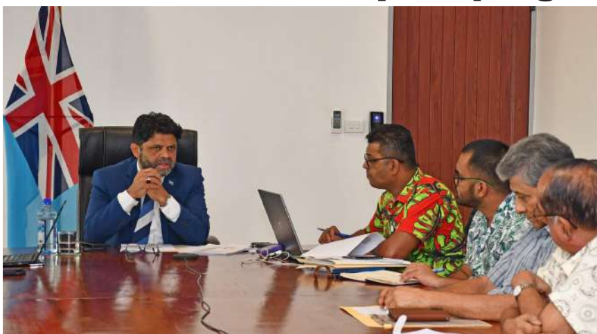
Attorney-General and Minister for Economy, Aiyaz Sayed-Khaiyum and members of the Ministry of Economy and Land Transport Authority met in Suva recently to discuss the Valelevu shuttle bus pilot program.

THE Attorney-General and Minister for Economy, Aiyaz Sayed-Khaiyum and members of the Ministry of Economy and Land Transport Authority met with bus operators to discuss the Valelevu shuttle bus pilot program.