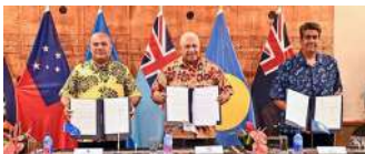
Frank Bainimarama @FijiPM

Today, in true talanoa spirit, we took an important step toward re-uniting our Pacific family. Our new reform package contains commitments that deepen trust and cohesion across the region, and Fiji fully supports its adoption at the next @ForumSEC meeting.