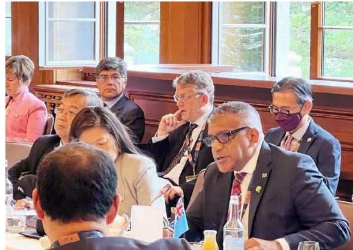
Minister for Commerce, Trade, Tourism and Transport, Faiyaz Koya, speaks at the "Multilateral Cooperation on Trade and Climate Nexus" at the World Trade Organization.

"CLIMATE discussions often focus on trade as a major contributor to global warming but with the right policy mix, we can encourage clean production and trade in climate-friendly goods and services."