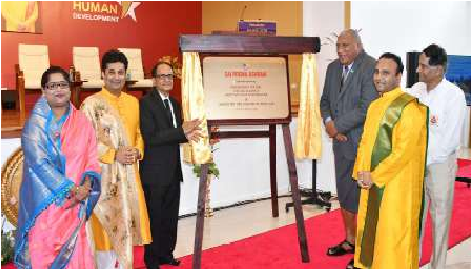
राष्ट्रपति महामहिम रातू विलियामे कातोनिवरे मानव विकास के लिए नावुआ में एक आश्रम का उद्घाटन करते हुए वहाँ के सदस्यों के साथ