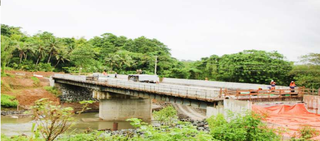
The new Matewale Bridge has been designed and constructed to be 8m above the existing crossing level.