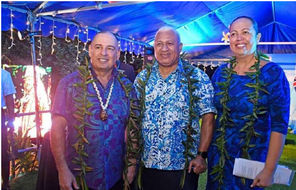
Prime Minister Voreqe Bainimarama with Cook Island's Prime Minister Mark Brown and a guest at the opening of the Cook Islands High Commission in Suva recently.

T HE establishment of the Cook Islands High Commission in Suva, symbolises a landmark achievement in the 24 years of diplomatic relations between Fiji and the Cook Islands.