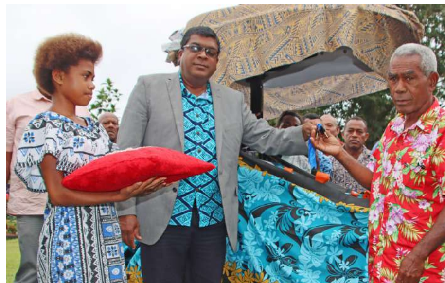
Era marautaka na nodra tractor vou na leweni koro ko Nabua me vaka ni ogo edua na tuvatuva levu ni matanitu nei Paraiminisita Voreqe Bainimarama mera qaraunuio ka vukei na dauteitei veitalia na vanua era vakaitikotiko voli kina baleta nira vukea na vakalevutaki ni kakana teivaki ena noda vanua.

E RA marautaka na dautei raisi ena koro ko Nabua, Koroalau, Cakaudrove na nodra tractor vou ni tei raisi. Laki solia vei ira ko Minisita ni Teitei, Dr Mahendra Reddy. Kuria ko Minisita ni matanitu ena sega ni vinakata me dua na lewenivanua era guilecavi ena veiqaravi vakamataniitu veitalia walega na vanua era tiko kina. Na sauna ni tractor oqori e itiko ena $7,000. Sa ra sauma na veitalanoa ogo ena dua na ikatolu me nodra