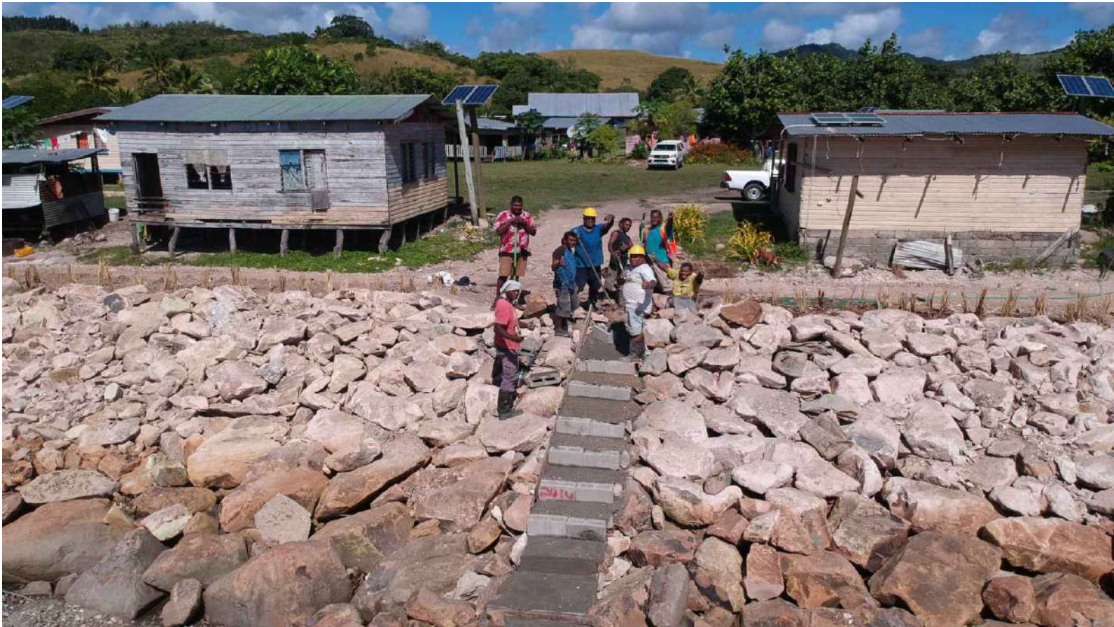
The Nabubu village seawall is a nature-based construction which comprises of boulders, soil clay and vetiver grass.

Minister Reddy reiterated that one of Government's priorities was to grow and develop interior communities.