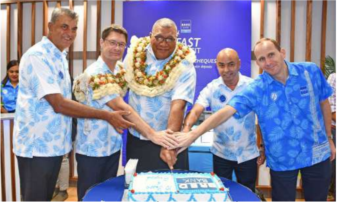
बाहरी द्वीपों की जरूरी सेवा वाला नया सेन्टर बनाने में औस्ट्रेलियन सरकार का भारी योगदान है जिसके लिए फीजी की सरकार बहुत ही

महामहिम कातोनिवरे ने ब्रेड बैंक को उनकी फीजियन अर्थव्यवस्था पर निरंतर विश्वास और निवेश के लिए धन्यवाद दिया जिससे लौतोका शहर का आधुनिक और विकास बढ़ाएगा।