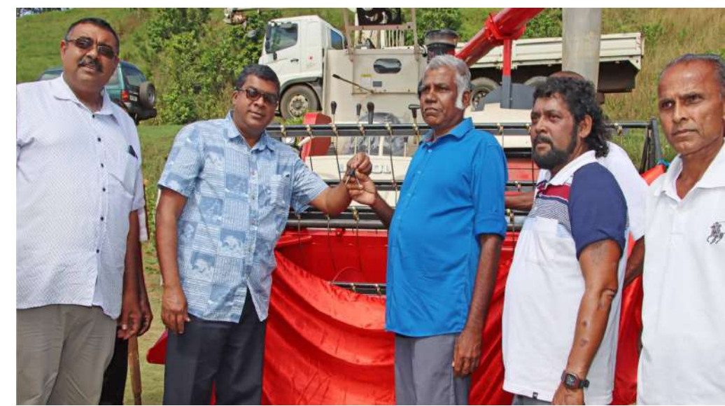
Na nodra qaravi vinaka na dauteitei ena noda vanua edua na kauwai ni matanitu nei Paraiminisita Voreqe Bainimarama me vaka nida nida ni sa vukei tiko kina oira na dauteitei me ra vakalevutaka nodra itei.

E RA laki ciqoma na dautei raisi mai Matasawalevu e Macuata edua na nodra misini ni tamusuki ni raisi mai vua na Minisita ni Teitei, Dr Mahendra Reddy. Era laki vakairaitaka talega na Minisita na bibi ni kena dau vakarautaki na tei ni raisi vei ira na dauteitei ka mera