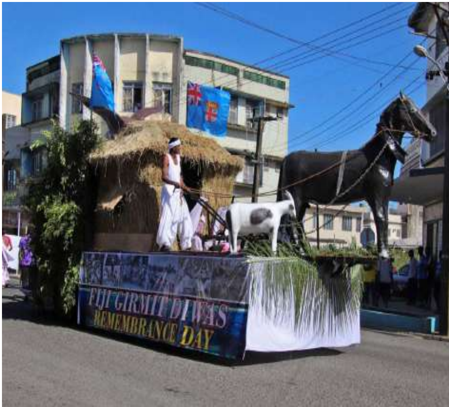
गिरमित दिवस के मौके पर बा शहर में लोगों ने विभिन्न पोशाकों में मार्च किया