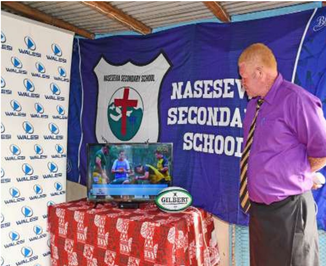
पश्चिमी विभाग के स्कूलों को हाल ही में सरकार द्वारा वालेसी के सेटअप बॉक्स दिए गए

क्या आपको पता है कि वालेसी फीजी ने देश भर में सात सौ कोरों तथा विलज होल में मुफ्त वालेसी सेटलाईट किट तथा मुफ्त में टेलिविज़न प्रदान किया है। यह कोरों देश के ग्रामीन और भीतरी इलाकों में है तथा उन्हें देश के अन्य लोगों की तरह भी डिजिटल टी वी देखने का हक है।