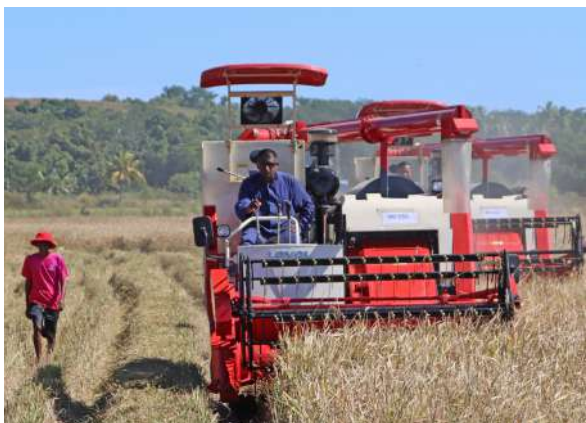
The new rice harvesters has boosted the morale of farmers.

The cooperatives had paid for a third of the total price and the Government paid off the remaining balance.