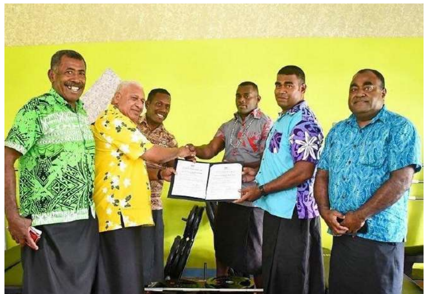
Prime Minister Voreqe Bainimarama during the handing over of gym equipment at the Nasamila Rugby Club.