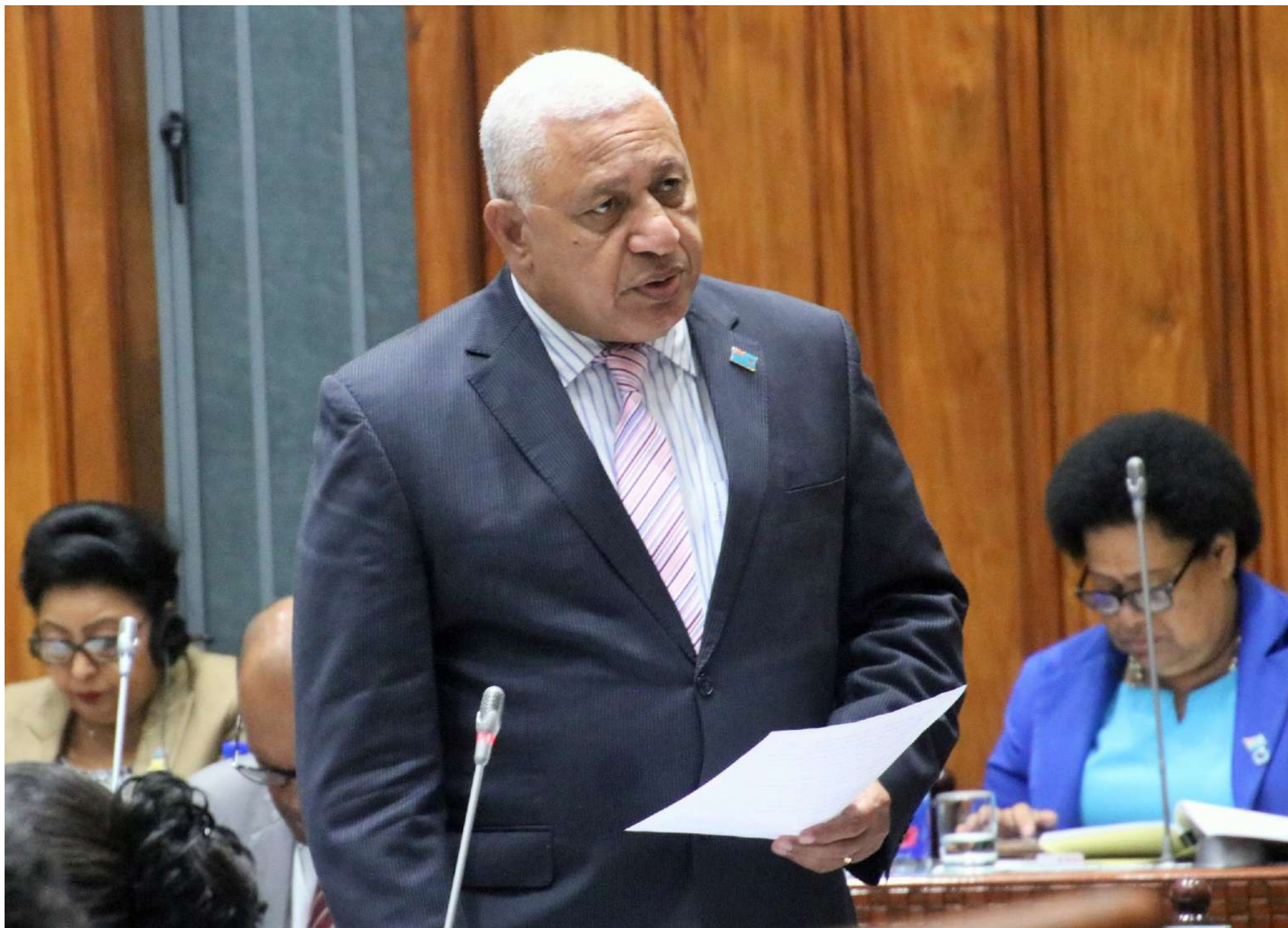
प्रधान मंत्री तथा चीनी मंत्री वॉरेन्गो बर्डिनमारामा संसद में चीनी व्यवसाय को जीवित रखने की योजना आम करते हुए