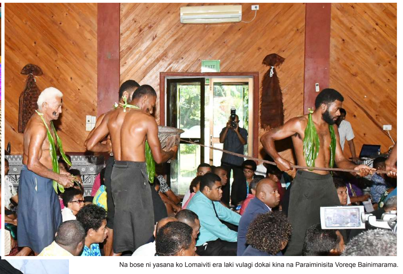
Na bose ni yasana ko Lomaiviti era laki vulagi dokai kina na Paraiminisita Voreqe Bainimarama.