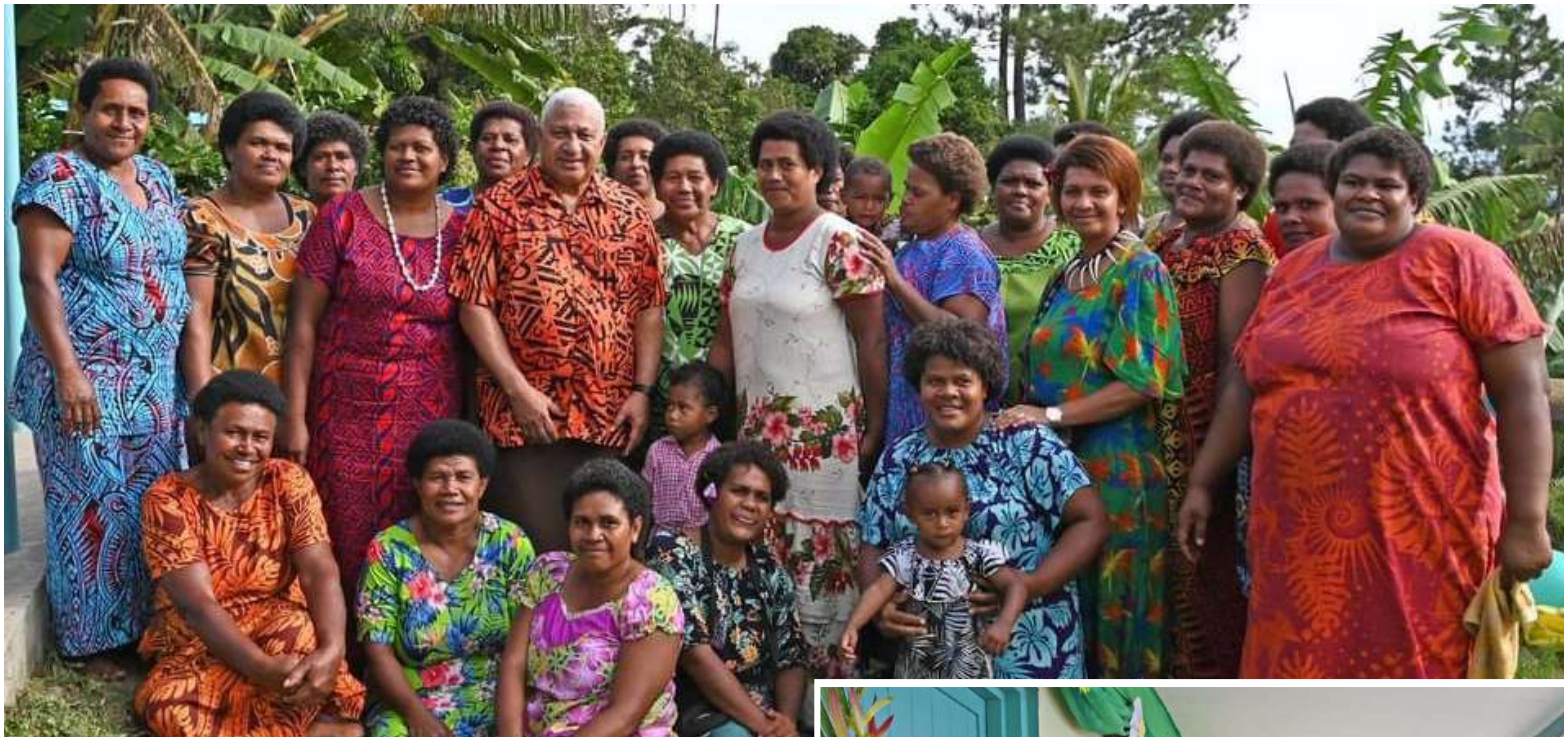
Prime Minister Voreqe Bainimarama officially opened their newly built and renovated school facilities of Nadrau Primary School recently.