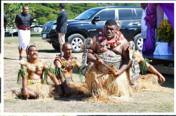
Na matanitu e solia edua na ivota levu ni ilavo ena kena qaravi na vuli ni noda gone.

S A mai vakaqacotaki tale na veiwekani ni matanitu erua ko Viti kei na United Arab Emirates (UAE) ena kena vakailavotaki main a tara ni 3 na koronivuli ena noda vanua. Solia main a matanitu ko UAE e $6.3milioni ka vakailavotaki kina na koronivuli ko Sigatoka Methodist college-Kulukulu wing, Muaira Methodist, Ratu Simione Matanitobua Memorial School. Vakaraitaka na Paraiminisita Voreqe Bainimarama ni dua na veivuke e vakarautaka na matanitu UAE oya nodra vakaqacotaki na koronivuli me rawa nira curuma na gauna ni leqa tubu koso se drake veisau me vaka na waluvu. Marautaka ko Paraiminisita Bainimarama ni ra sa vakadinata tiko na gonevuli na sasaga ni matanitu me baleta na nodra vakarauta-