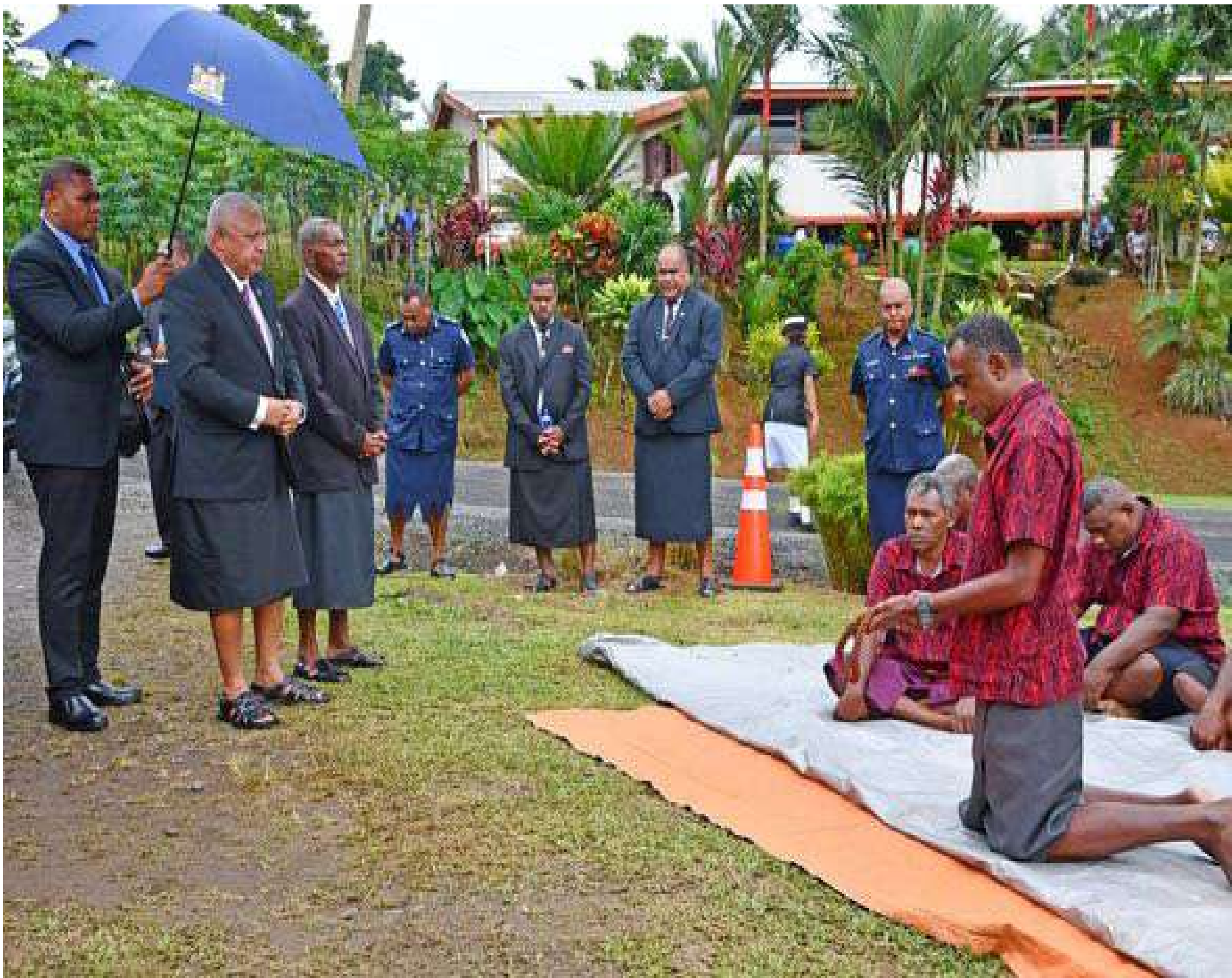
Era taba toka ogo na liulu ni matanitu, Paraiminisita Voreqe Bainimarama ena nodra laki dolava na bose ni yasana ko Naitasiri.

Isa mera nanumi na noda lewenivanua matua ka mera dau vakamareqeti, rokovi ka qaravi vakavinaka. Oqori beka na kaci ni matanitu ena veiyasai vuravura ena soqo ni vakananumi kei na veivakararamataki ena vuravura baleta na nodra dau vakalolomataki na matua. Vakaraitaka kina na Minisita ni Marama, Gone kei na Valuti ni Dravudravua, Rosy Akbar ni sa kena gauna vei keda kece sara ena noda matavuvale meda qarauna na nodra dau qaravi ka rokovi na lewenivanua qase kei na matua me vaka ni sa tiko na itukutuku bula ni nodra dau vakalolomataki ena itovo lolovira ka tawa kilikili ena yabaki ni bula era sa yacova. Qoka e wilikina na nodra dau vakalolomataki na lewenivanua qase cake ena yasana ni iyau vakailavo, nodra vakalolomataki ka sega ni kauwaitaki se qaravi vinaka. Na itukutuku bula e tiko nira dau vakalolomataki mai vei ira saraga na wekadra dina vakavuvale, luvedra kei ira na wekadra me vaka nira sa ripote taki mai ni yaco tiko ena loma saraga ni nodra vale. Sa kilai talega ni dau vakayacori tiko na veika se itovo ca