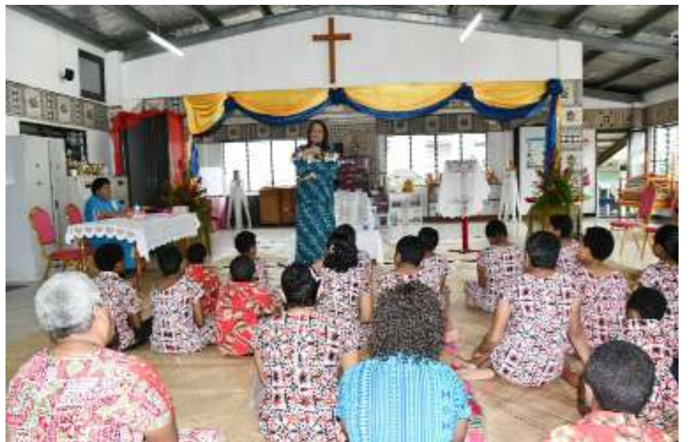
महिला तथा सौशल वेलफेयर, पोवर्टी अलिविएशन मंत्री रोजी अकबर नउसोरी स्थित दिलकुशा होम में भाषण देती हुई