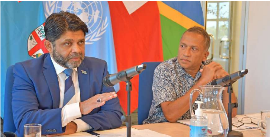
Attorney-General and Minister responsible for Climate Change, Aiyaz Sayed-Khaiyum with UN Resident Representative Sanaka Samarasinha during the Blue Talks panel.

The United Nations Ocean Conference will be held in Lisbon, Portugal from 27 June to 1 July with the theme “Scaling up the ocean action based on science and innovation for the implementation of Goal 14: Stocktaking, partnerships and solutions”.