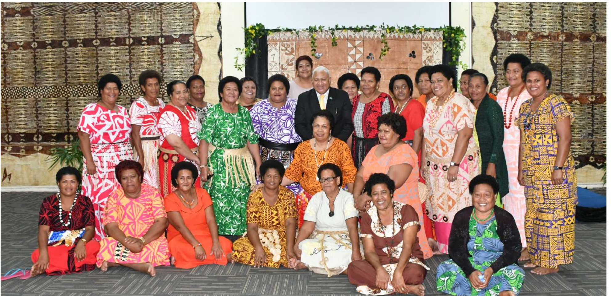
Ko ira na marama ni Lau ena bose ni yasana era taba toka kei Paraiminisita Bainimarama.

“E dodonu talega me tiko na isema ni veiwekani vaka-cakacaka kina veitabana tale eso, me vaka na Tabana ni Draki Veisau ena Tabacakacaka ni iLavo kei na Tabacakacaka ni Veikabula.”