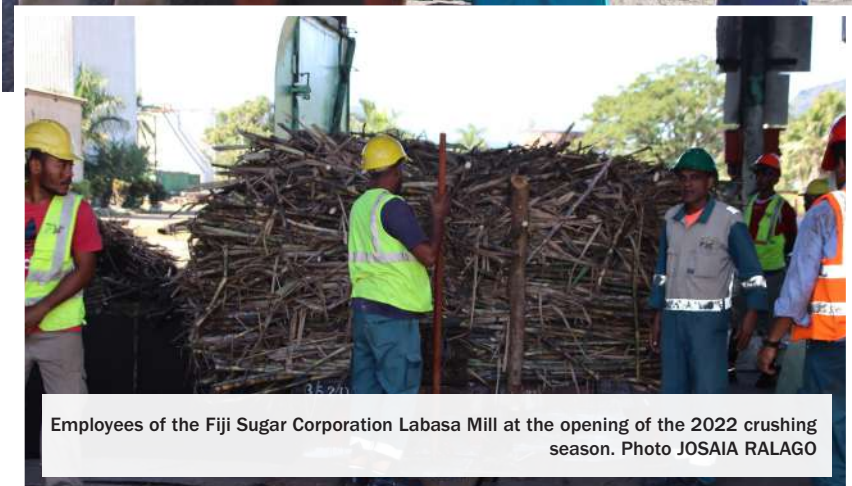
Employees of the Fiji Sugar Corporation Labasa Mill at the opening of the 2022 crushing season.