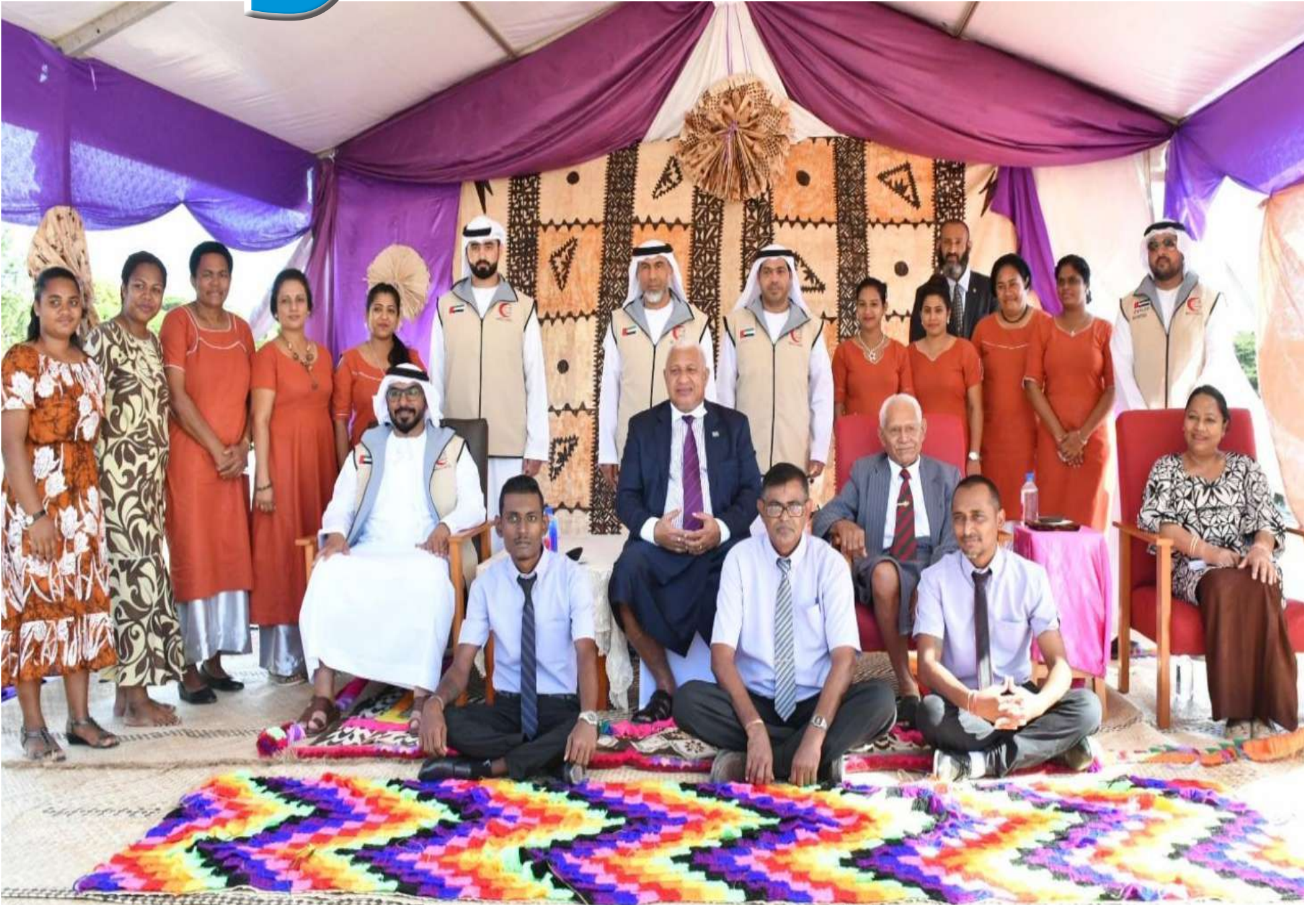
Prime Minister Voreqe Bainimarama with the Red Crescent Society of the United Arab Emirates officials, Minister for Education, Heritage and Arts, Premila Kumar and the staff of Muaira Methodist College in Lautoka.