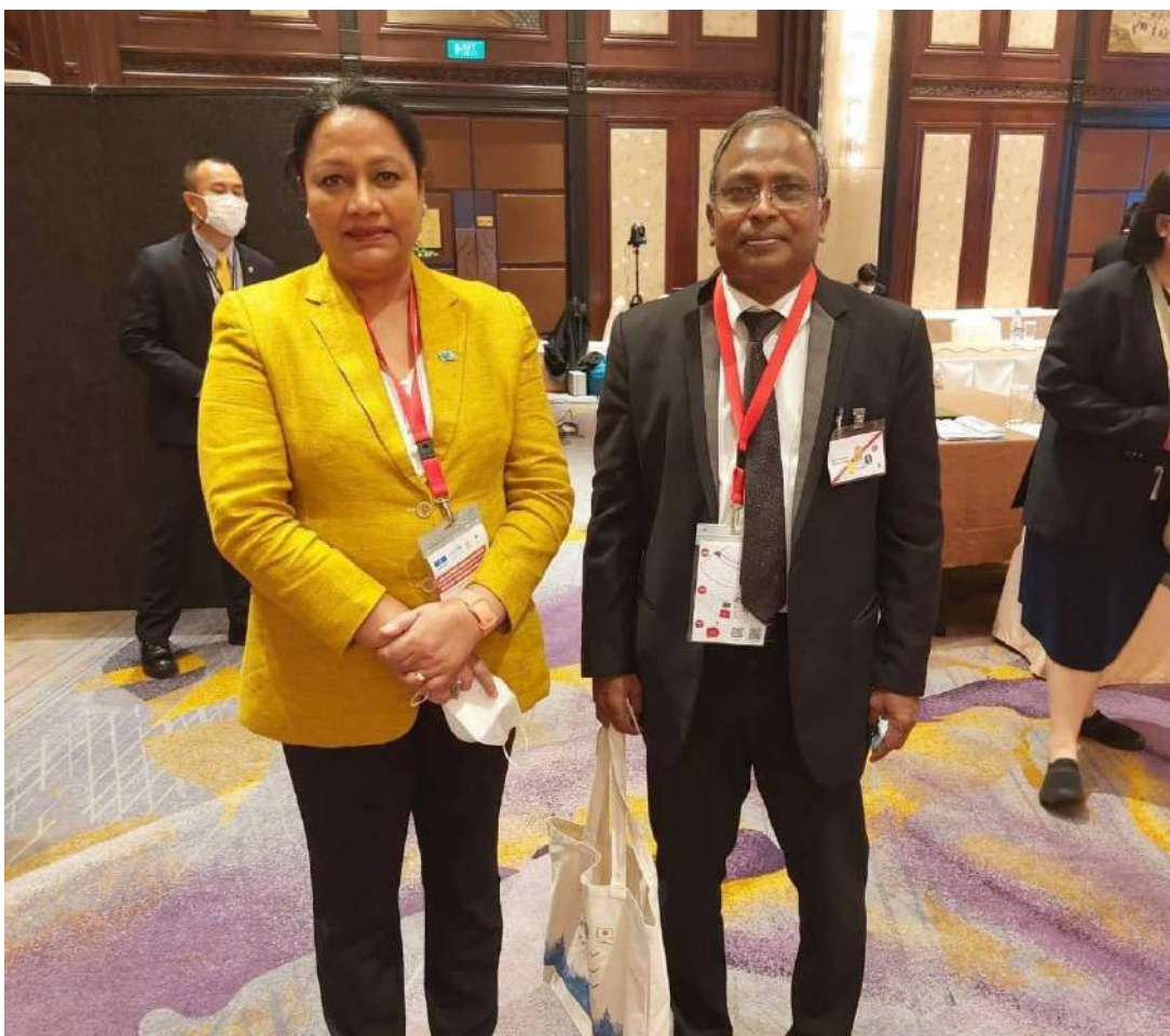
Minister for Education, Heritage and Arts, Premila Kumar at the 2nd Asia - Pacific Regional Education Minister's Conference (APREMC-II) in Bangkok, Thailand held recently.

Minister Kumar emphasised the importance of return on investment in education,