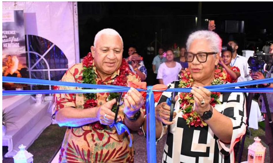
Prime Minister Voreqe Bainimarama with Samoa's Prime Minister, Fiam Naomi Mata afa during the opening of the new Samoan High Commission at Clarke Street in Suva recently.