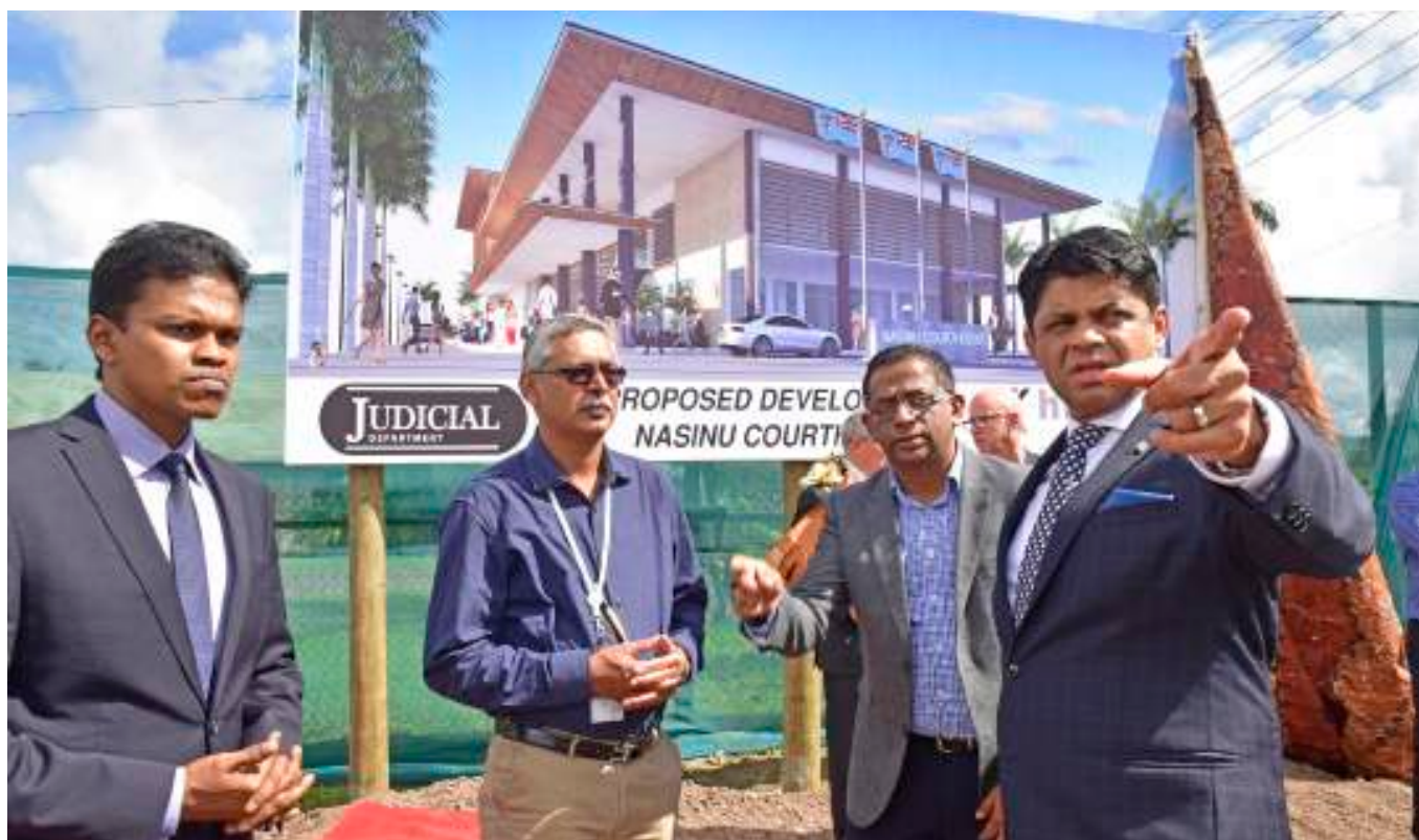
Attorney-General Aiyaz Sayed-Khaiyum, while officiating at the ground-breaking ceremony of the new courthouse in Nasinu.

"By assisting Fiji in setting up medical facility that are internationally certified we will be able to provide assistance not just to Fijians, but to other Pacific island countries," he said.