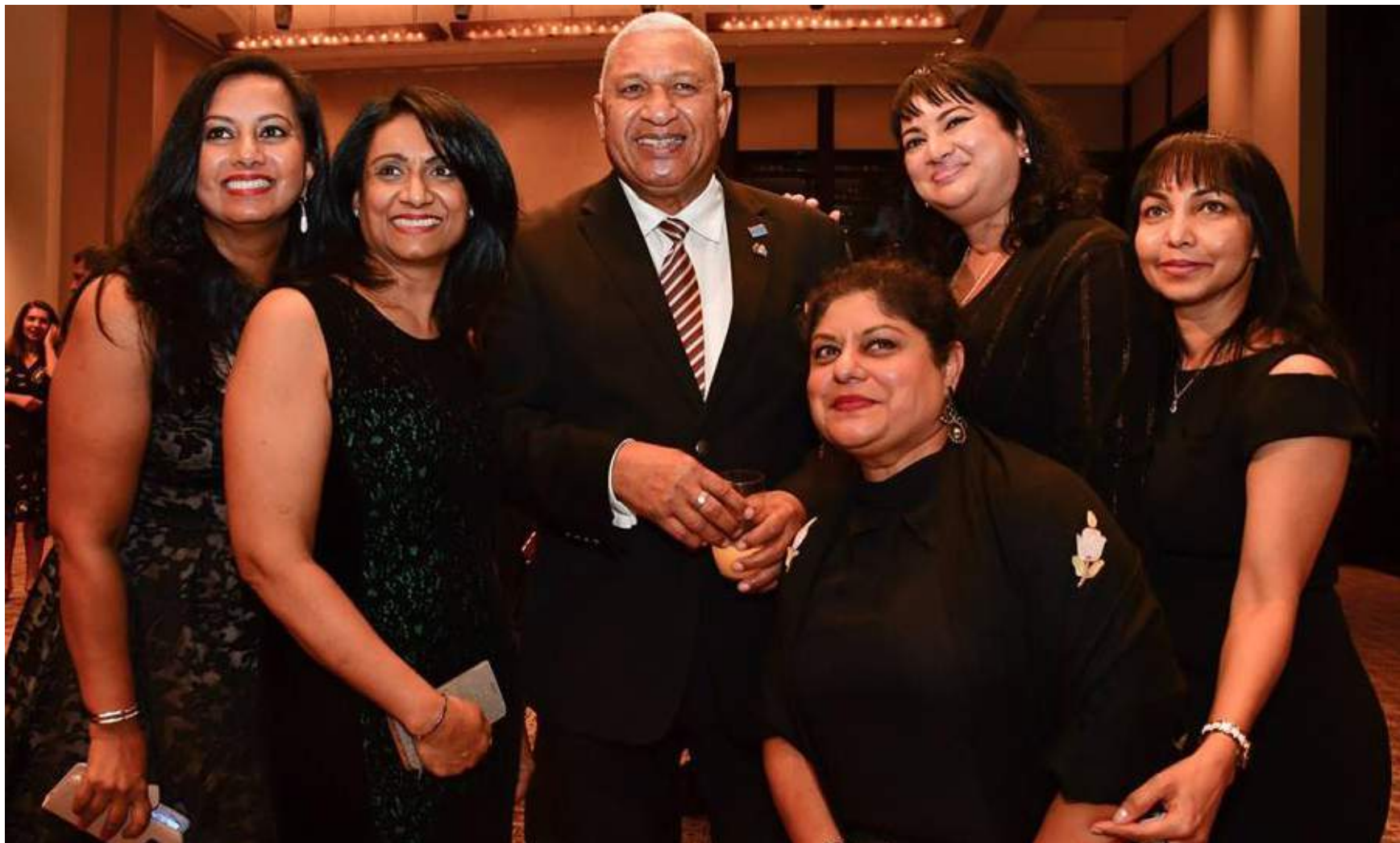
प्रधानमंत्री, वॉरेन्गे बर्डनिमरामा ने मेलबर्न औस्ट्रेलिया में विकटोरियन मल्टीकल्चरल स्पोर्ट्स असोसिएशन व्यापारिक समारोह में फीजी के भुतपूर्व नागरिकों के साथ जहाँ श्री बर्डनिमरामा ने फीजी की प्रगति पर प्रकाश भी डाला।