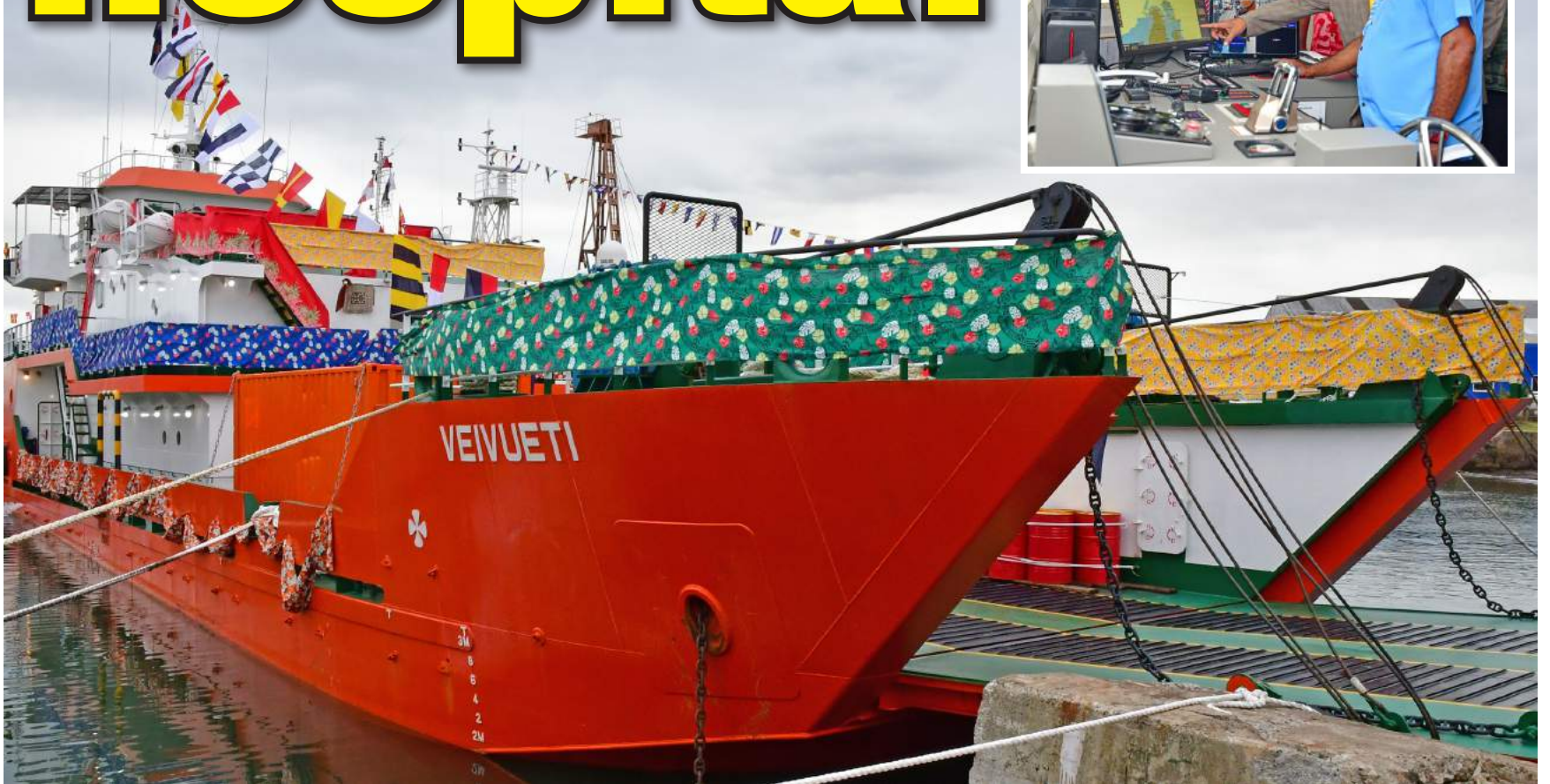
The Veivueti after being commissioned in Suva. INSET TOP: Prime Minister Voreqe Bainimarama with medical staff on the vessel. INSET BOTTOM: Prime Minister Voreqe Bainimarama on the bridge of the Veivueti.