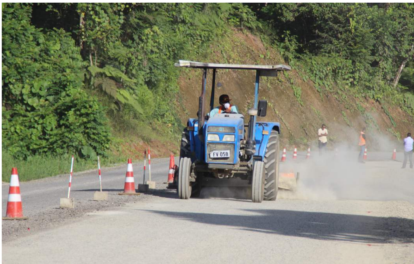
The Fiji Roads Authority (FRA) has assured members of the public that road humps will be installed next to all schools, health centres and villages situated along major highways.

"This is indeed a massive investment towards our children and young persons to ensure that we provide the best possible guidance and education to all Fijians," Minister Usamate said.