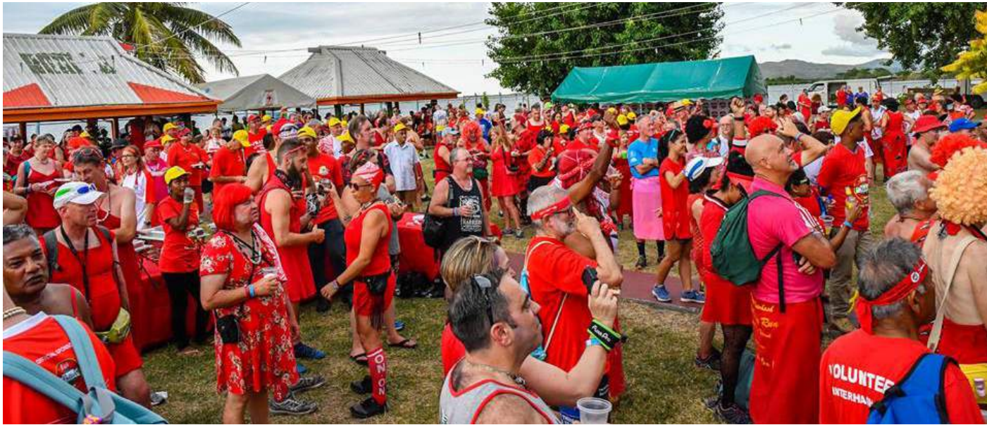
Visiting and local Hash House Harriers get ready for the Red Dress Run in Lautoka Club.