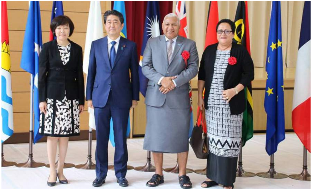
प्रधानमंत्री वॉरेन्गो बईनिमरामा तथा जापानी प्रधानमंत्री शीनजो आबे के बीच द्वीपक्षीय रिश्ता सुधारने को लेकर कई विषयों पर बातें हुई। प्रधानमंत्री ने प्रशान्तीय क्षेत्र को सहायता प्रदान करने के लिए जापान की सराहना की और आभार व्यक्त किया प्रशान्त की प्राथमिकताओं को समझता

फिलहाल, मेकेनिकल हावेस्टर से गन्ना काटने का एक फायदा यह भी है कि इस प्रक्रिया में गन्ने से पत्तियाँ अलग होकर खेत में जड़ के उपर कम्बल का काम करती है जिससे खेत में घास वगैरह नहीं जमते या ढेर में जमते हैं। इससे मिट्टी भी उपजाऊ होती है। इसलिए गन्ना जलाने को प्रोत्साहित नहीं किया जा रहा है जबकि जले गन्ने के मुकाबले, हरे गन्ने काटकर मिल पहुँचाने के बहुत से फायदे हैं।