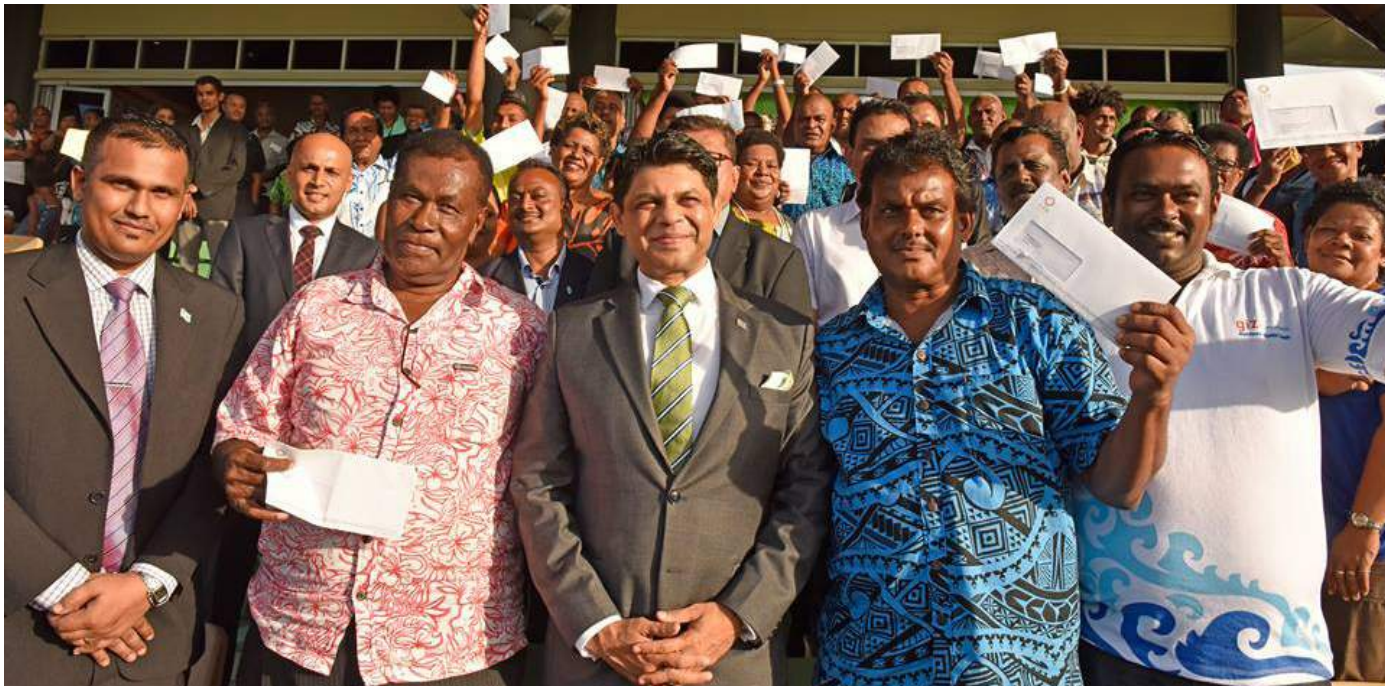
अर्तोनो-जेनरल अईयाज़ सैयद-खैयुम ने कहा कि नई टेक्सी पेमिट मिलने से कम आमदनी कमाने वाले अब अपने खुद का व्यापार शुरू करने में समर्थ होंगे। उन्होंने कहा कि यह व्यवस्था खास करके कम आमदनी कमाने वालों को अधिकार देने के लिए है

सरकार को किसी भी तरह की गलत जानकारी देना कानून के तहत अपराध है जिसके लिए फायदे की रकम लौटाने, बीस हजार डोलर जुर्माना या दस सालों तक की जेल की सज़ा या सभी लागू हो सकते हैं। फीजीयन सरकार फिर से सभी अनुचित लोगों से माँग कर रही है कि वे इससे फायदा उठाए।