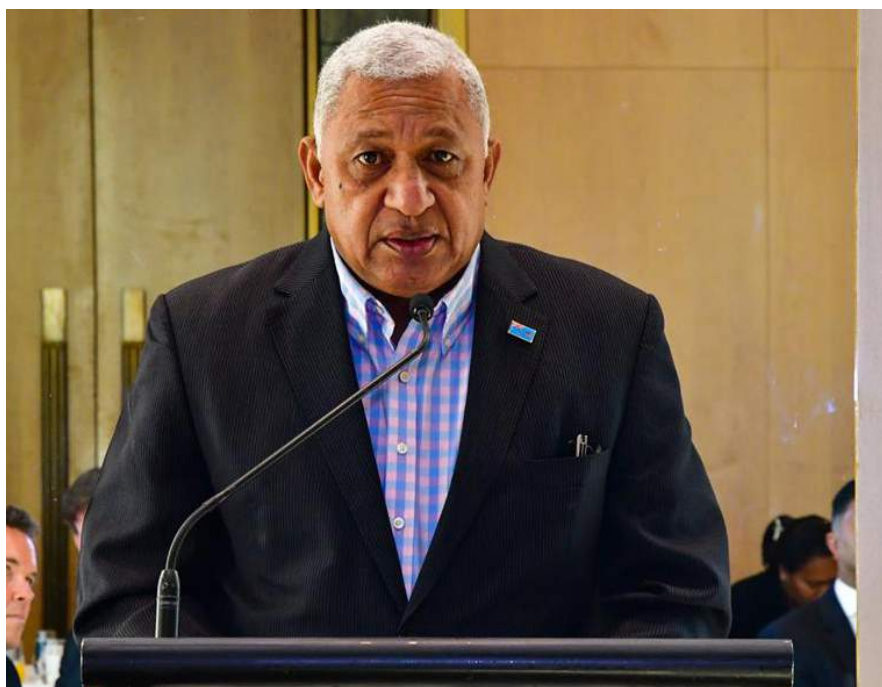
Prime Minister Voreqe Bainimarama says foreign investors could take advantage of a number of targeted tax incentives with the Fijian economy now poised to grow for the ninth consecutive year.

“Our corporate tax rate stands at 20 per cent, a figure that becomes even more attractive if a foreign company establishes their headquarters in Fiji, dropping to 17 per cent. And if the company is listed on the South Pacific Stock Exchange, that rate is lowered