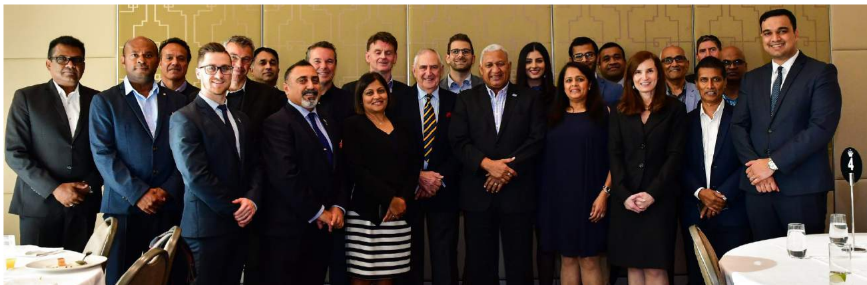
Prime Minister Voreqe Bainimarama and members of the Fijian delegation with the Victorian Business Community during the lunch meeting at the Crown Towers in Melbourne, Australia.