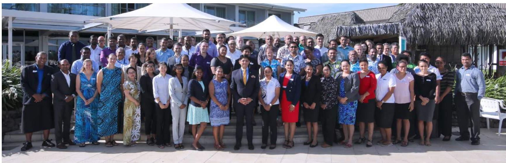
Attorney-General and Minister responsible for Climate Change Aiyaz Sayed-Khaiyum with key stakeholders and participants at the Fiji's first Low Emission Development Strategy (LEDS) workshop in Suva.