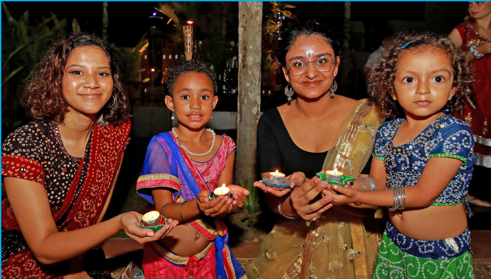
E ratou marautaka toka na soqo ni vakawaqa cina ko iratou na ilala goneyalewa oqo ena kena marautaki ka vakananumi tiko na Diwali ena macawa sa oti.