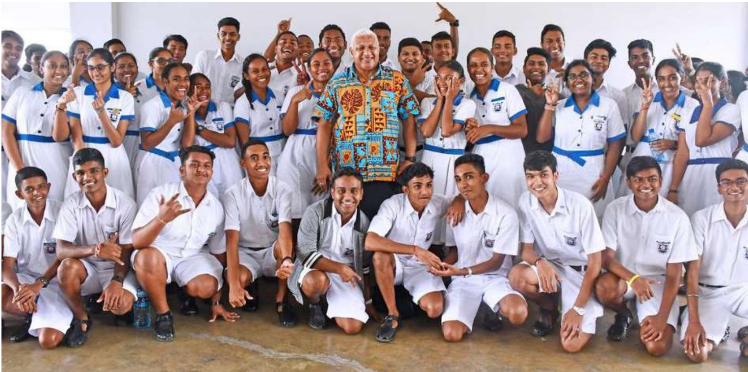
Ko Paraiminisita Voreqe Bainimarama kei ira na gonevuli e Mahatma Gandhi Memorial High School.

Na Remembrance Day se Siga ni Vak-anumi ni Bale mate ena iValu e kilai talega me siga ni senikau damudamu na Popi, era dau vakanumi kina na cauravou sotia era soli bula ena ivalu ena veimatanitu qali ena dua na gauna ki Pereitania.