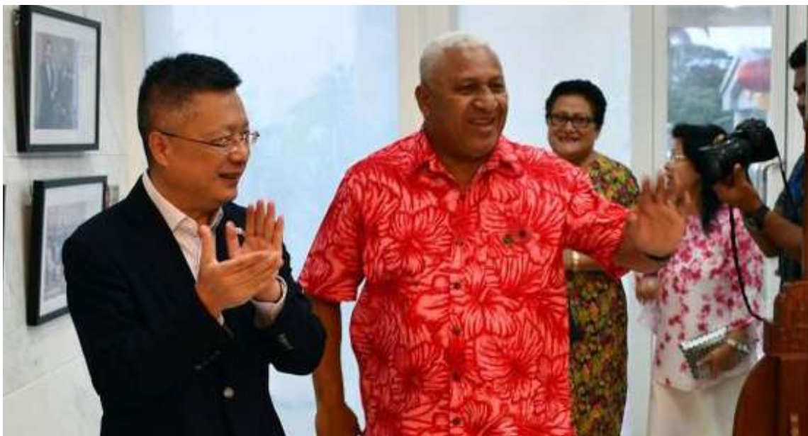
Ko Paraiminisita Voreqe Bainimarama kei na mata ni matanitu ko Jaina ko Qian Bo ena soqo ni kena marautaki na yabaki 45 ni veiwekani ni matanitu e rua.

Era laki dikeva ka rogoca talega eso na italanoa baleta na veika esa vakayacori tiko ka vaka kina eso na bolebole kei na gagadre ni veiqaravi.