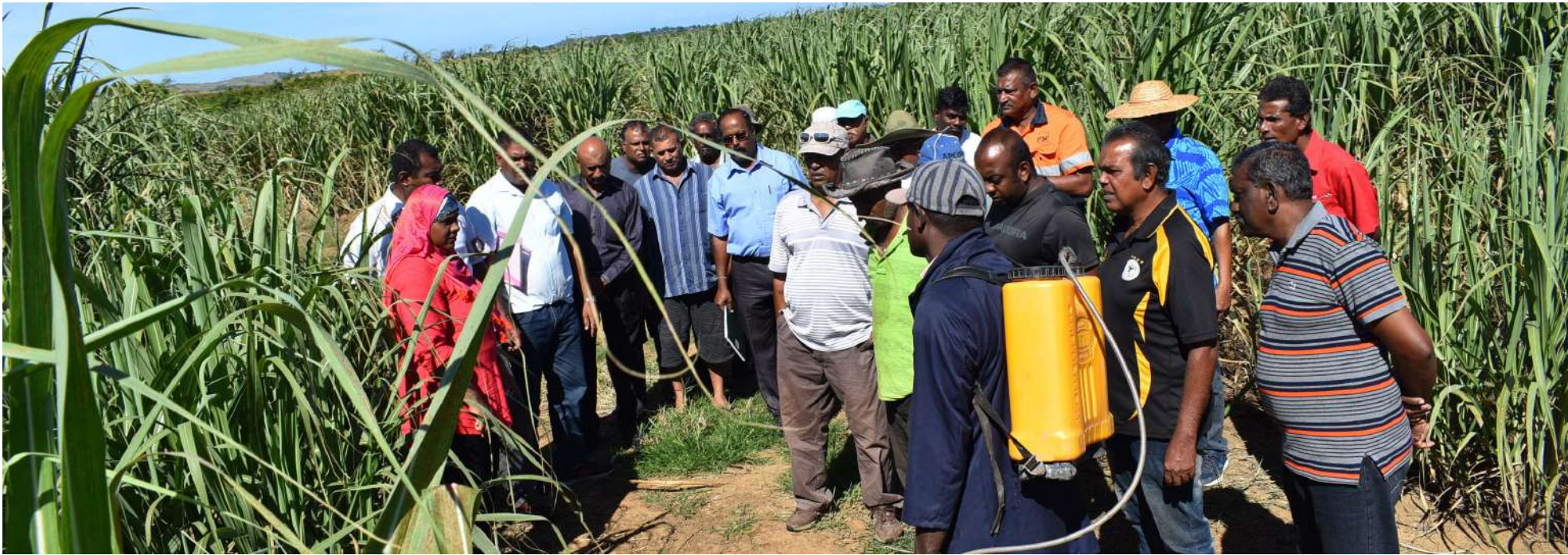
Era taba tiko oqo na dauteitei ni dovū.