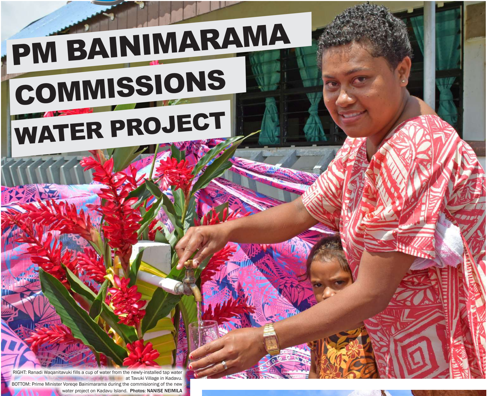
RIGHT: Ranadi Waqanitavuki fills a cup of water from the newly-installed tap water at Tavuki Village in Kadavu. BOTTOM: Prime Minister Voreqe Bainimarama during the commissioning of the new water project on Kadavu Island.