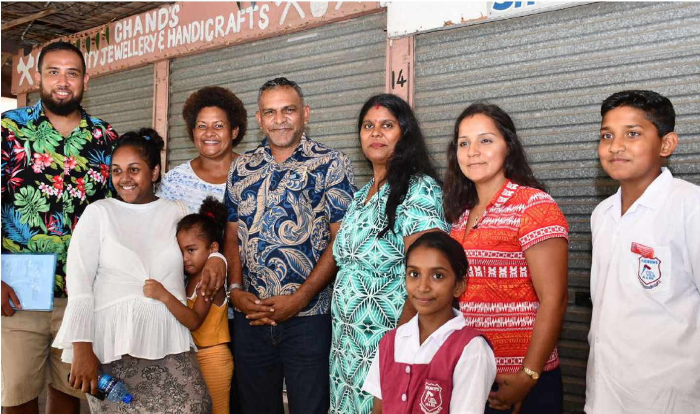
Minister for Commerce Trade Tourism and Transport Faiyaz Koya with Micro Small and Medium Enterprise (MSME) concessional loans recipients in Nadi.