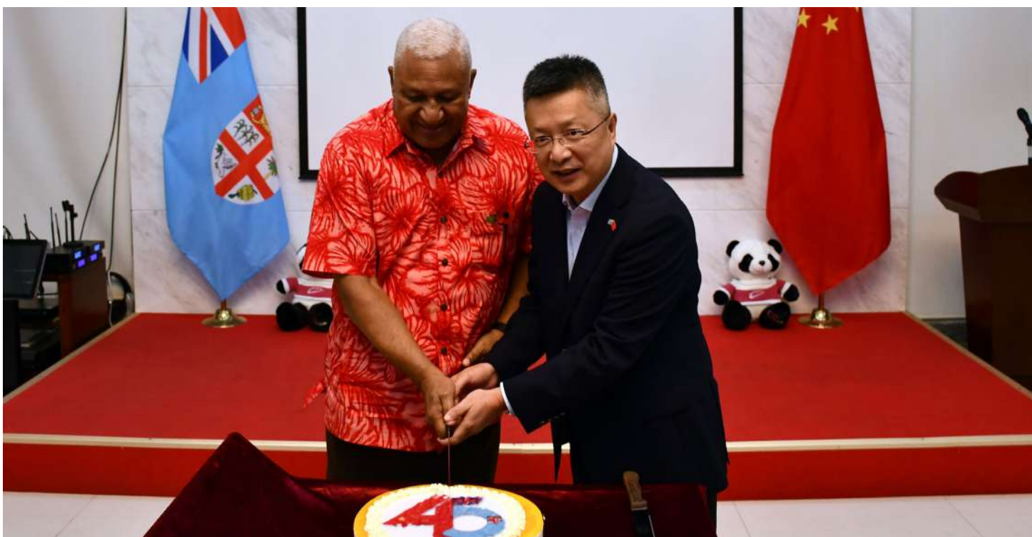
Prime Minister Voreqe Bainimarama and Chinese Ambassador to Fiji Qian Bo cut a cake to mark 45 years of diplomatic relations between Fiji and the People’s Republic of China.

Voreqe Bainimarama Fijian Prime Minister