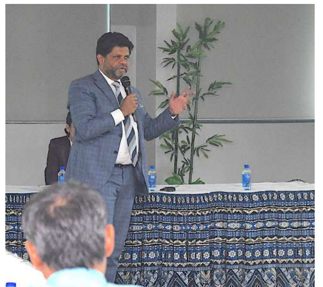
Attorney-General and Minister for Communications Aiyaz Sayed-Khaiyum addresses stakeholders.

The service providers who participated in the meeting included Telecom Fiji Limited, Vodafone Fiji Limited, Digicel Fiji Limited, Fijian Broadcasting Corporation, Communications Fiji Limited, Fiji Television, Mai TV, Walesi, Telecommunications Authority of Fiji, Fiji International Telecommunications Pte Limited and Amalgamated Telecom Holdings Limited.