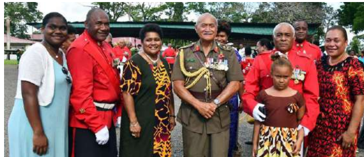
Ko Peresidedi Major-General (Ret'd) Jioji Konrote kei ira na vuvale ni sotia e Queen Elizabeth Barracks, Nabua.