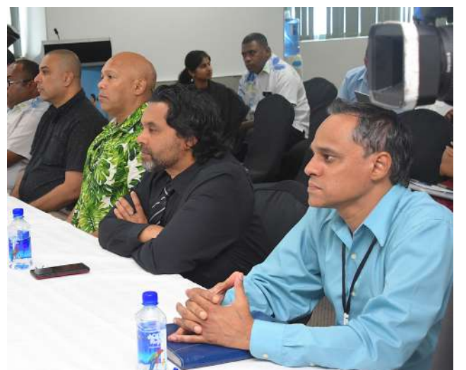
Participants during the Joint ICT Stakeholders meeting.