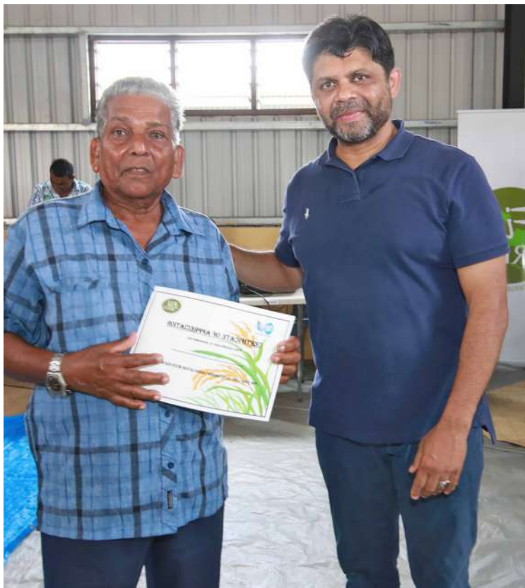
Attorney-General and Minister for Economy, Aiyaz Sayed-Khaiyum with a rice farmer in Dreketi, Bua, after the official opening of the new warehouse facility for Fiji Rice in Dreketi.

In addition, he said, the Government has also provided $688,000 as a capital grant to Fiji Rice and there has been an upgrade of infrastructure worth $1.5m.