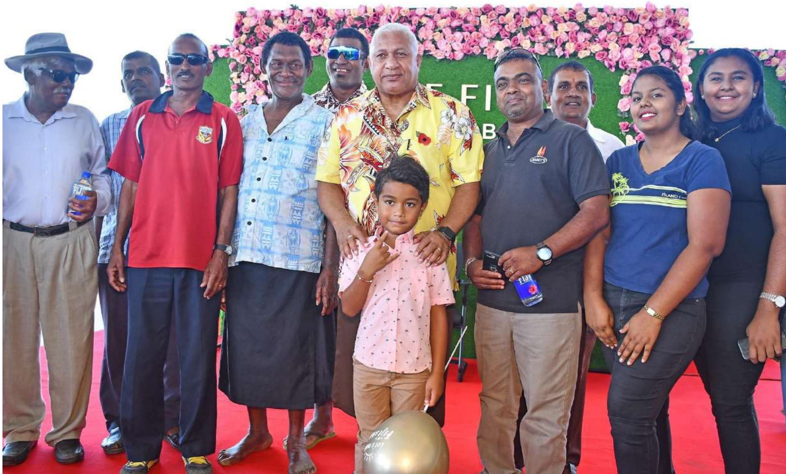
Prime Minister Voreqe Bainimarama with members of the public during the official opening of the Grace Field service station in Nadi.

This year’s theme for the three-day 2020 Agriculture Show is “Grow, Nourish, Sustain, Together – Our Actions are Our Future.