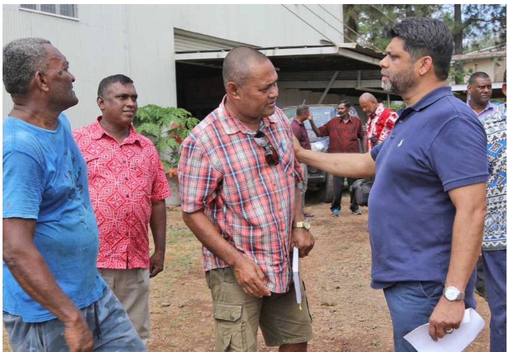
The A-G, together with officials from various agencies, recently met with residents of Lagalaga, Kulukulu, Naikilikoso and Bocalevu, in the outskirts of Labasa.

WAF's Manager Infrastructure and Service