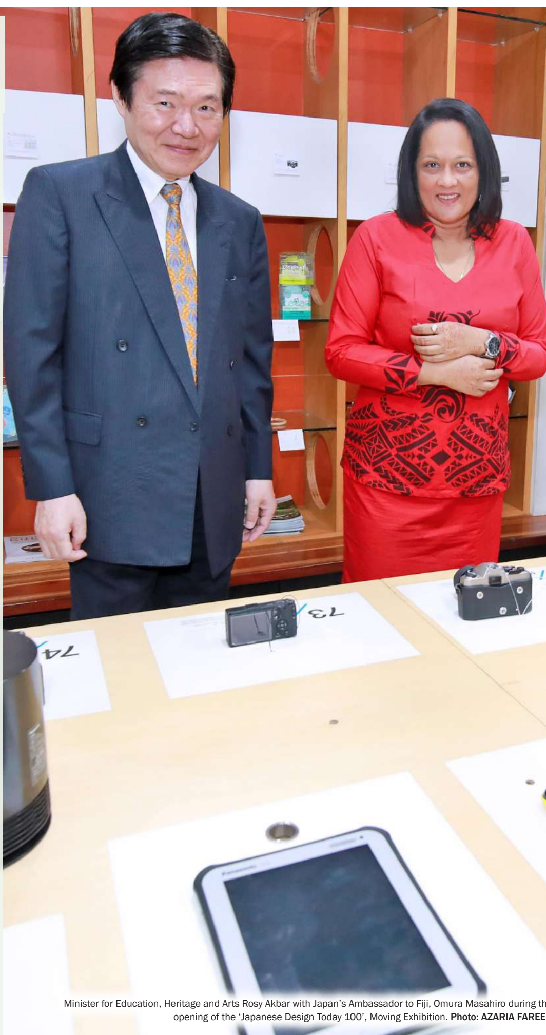
Minister for Education, Heritage and Arts Rosy Akbar with Japan's Ambassador to Fiji, Omura Masahiro during the opening of the 'Japanese Design Today 100', Moving Exhibition.

"By looking at these designs, it is possible to get an overall picture of Japanese life today which also shows a vivid picture of the hopes and dreams of the people who use the products, and the designers and corporations who create them," Mr Masahiro added.