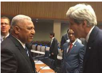
Frank Bainimarama @FijiPM

Welcome back to the fight, @JohnKerry. I remember the optimism of 2016, when you and I had the privilege of signing the #ParisAgreement. Nearly five years on, I look forward to working with you again to deliver young people in Fiji and around the world a climate-secure future.