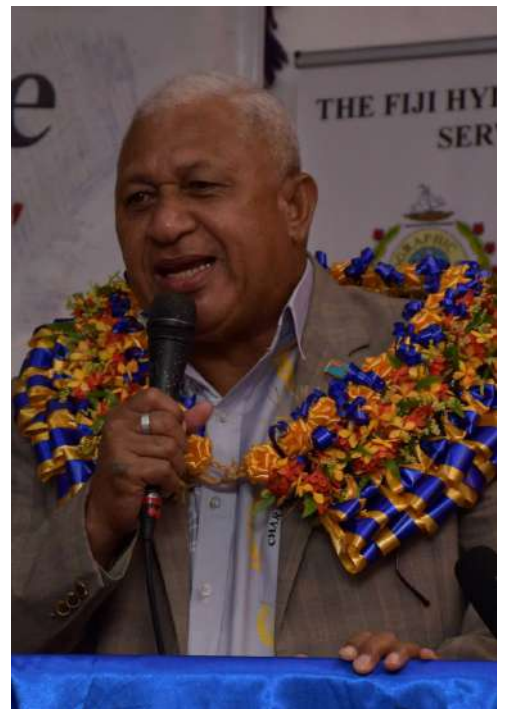
Prime Minister Voreqe Bainimarama during the Fiji Hydrographic Service (FHS) golden jubilee reception at the Royal Fiji Yacht Club

Fiji has been a strong advocate on the global stage for the preservation of ocean health.