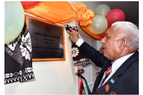
Prime Minister Voreqe Bainimarama officially opens the new audiology room at Colonial War Memorial Hospital (CWMH).

“All those who seek to share in Diwali celebrations should do so – light candles, illuminate your houses, enjoy the fireworks, join in the feasts of your friends and neighbours as they celebrate, and show the world yet again that we are a people of light and learning and goodness.”