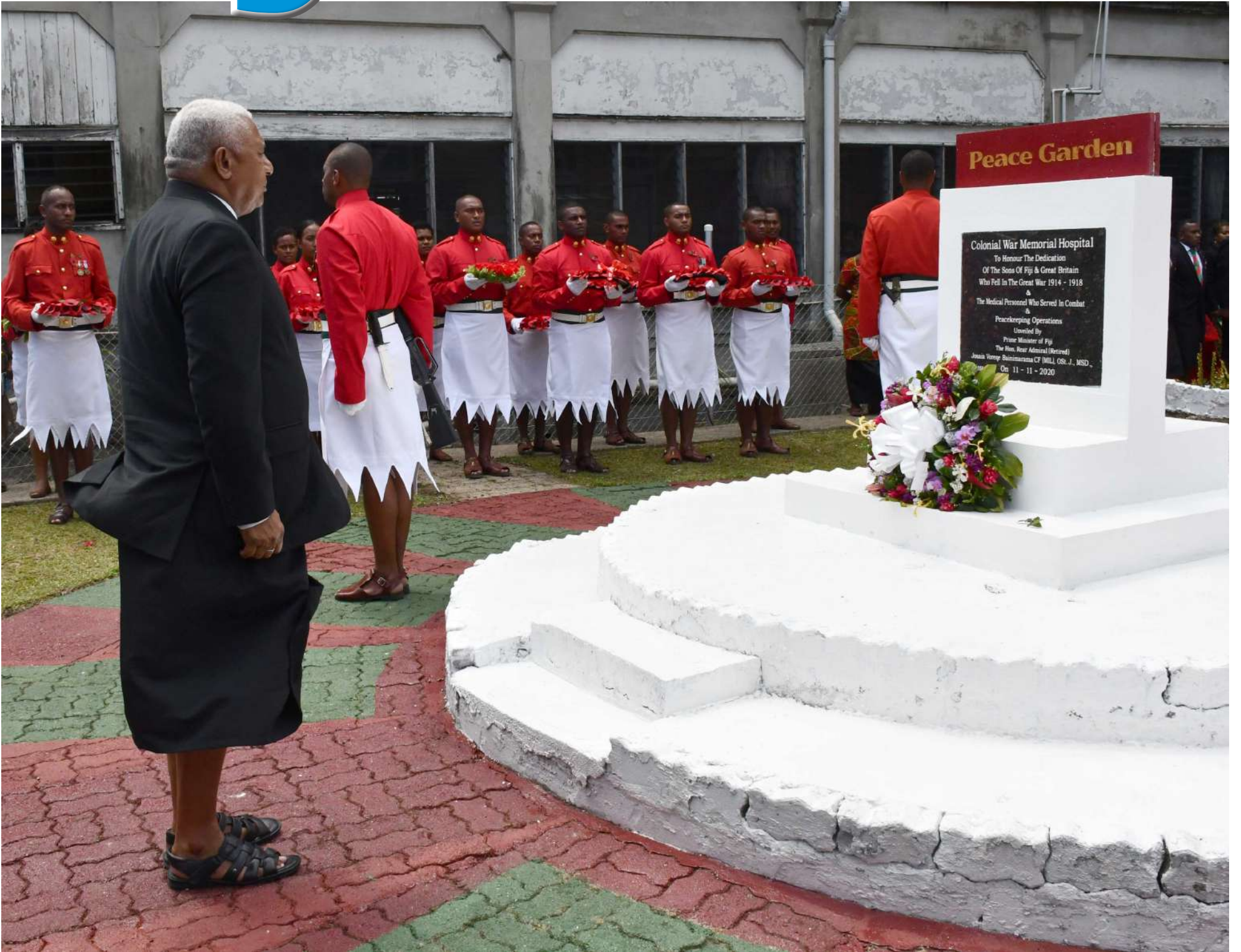
Prime Minister Voreqe Bainimarama pays his respect at the new War Memorial Plaque at Colonial War Memorial (CWM) Hospital's Peace Garden during Remembrance Day in Suva