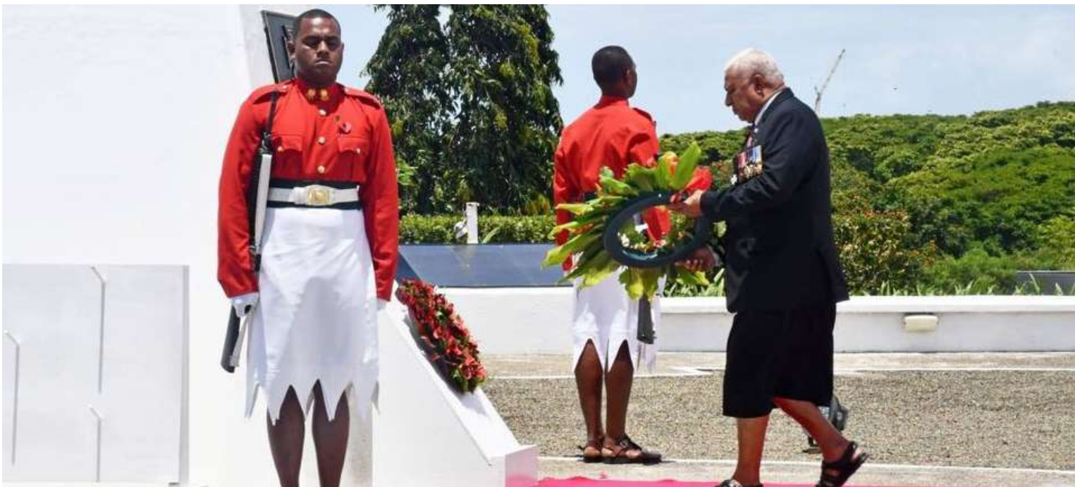
Ko Paraiminisita Voreqe Bainimarama ena soqo ni veivakananumi ni nodra bula na sotia ena veiyasai vuravura.