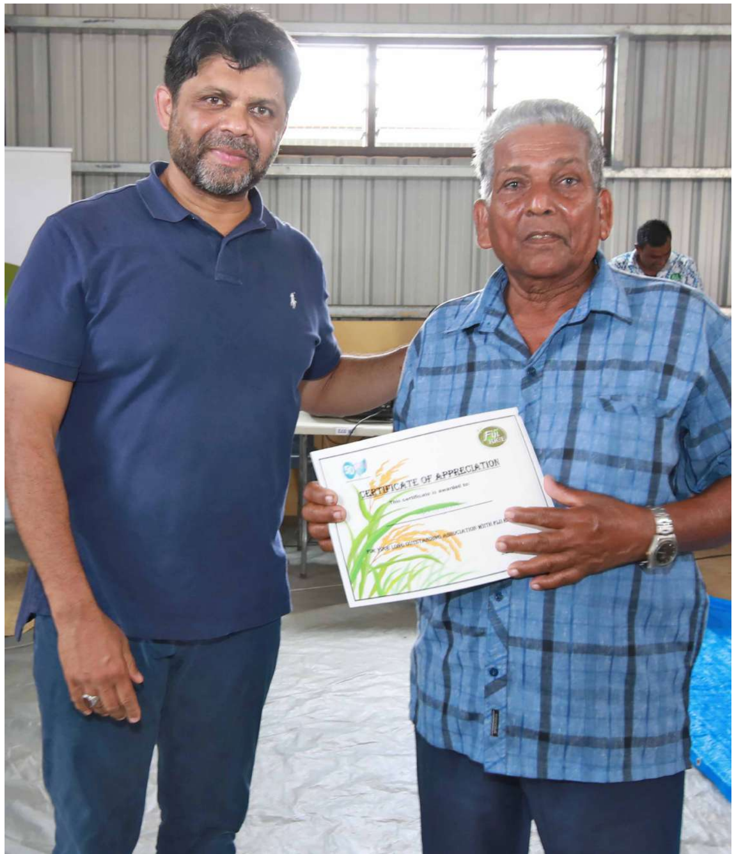
अटेनी जनरल तथा अर्थ-व्यवस्था मंत्री अर्इयाज़ सईयद खईयूम, धान के एक किसान को सर्टिफिकेट प्रदान करते हुए

अटेनी जनरल ने फीजी राईस को एक सर्टिफिकेट से सम्मानित भी किया जबकि सरकार की स्ट्रोंगा ट्रोगेदर जोब सपोर्ट स्कीम के तहत कम्पनी ने एक व्यक्ति को नौकरी दी।