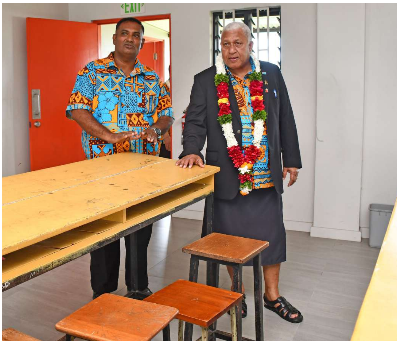
प्रधान मंत्री वीरेनो वडिनमारामा एम जी एम स्कूल की नई इमारत के उद्घाटन के दौरान