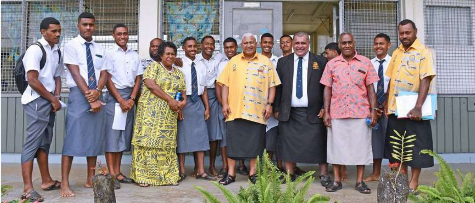
Ko Paraiminisita Voreqe Bainimarama kei ira nai vakalesilesi kei na gonevuli e Ratu Kadavulevu School.