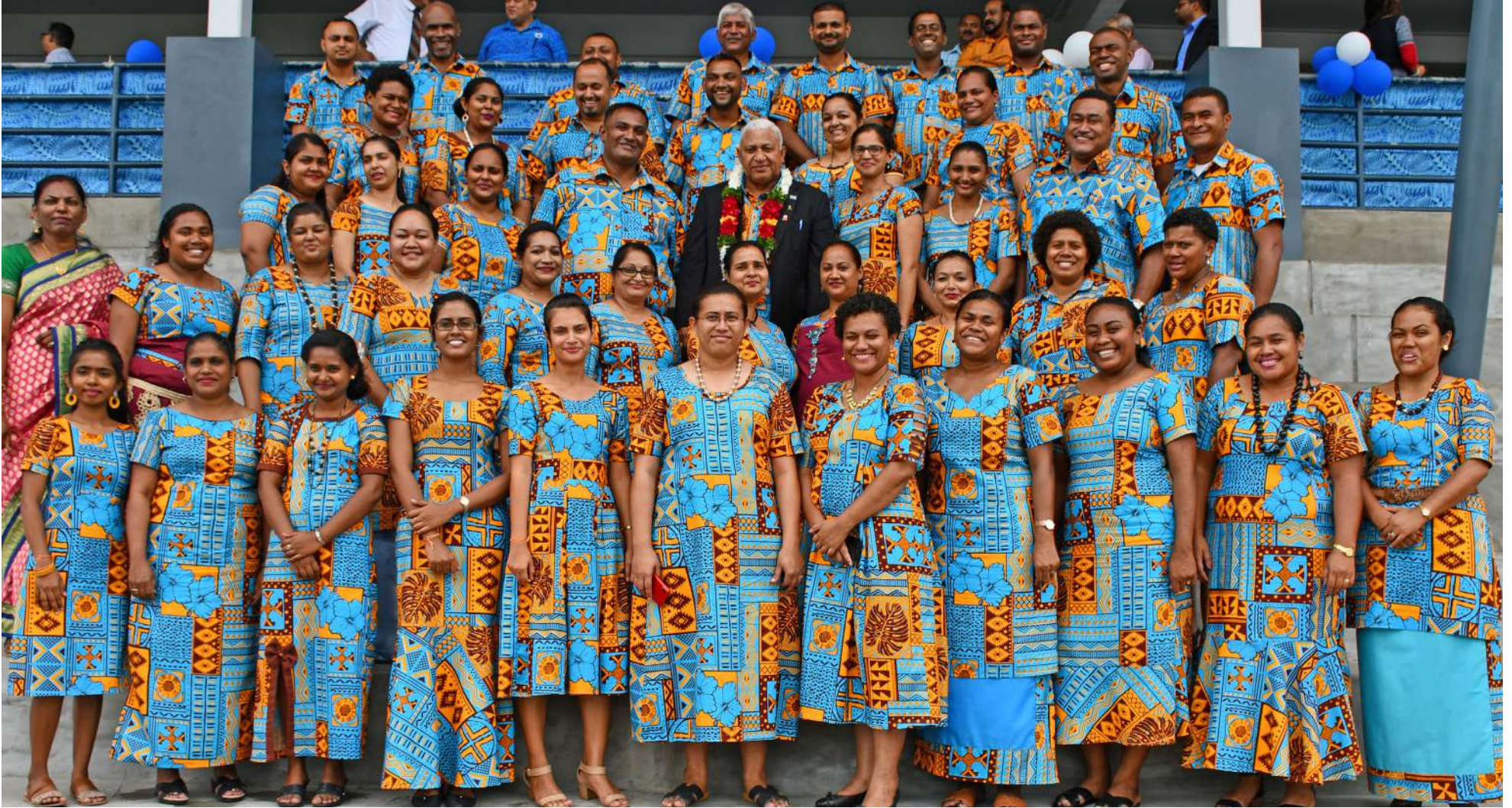
प्रधान मंत्री वॉरेनो बड़निमारामा, एम जी एम स्कूल टीचर्स के साथ, स्कूल की एक नई इमारत का उद्घाटन करने के बाद