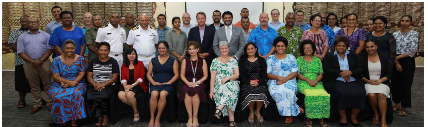
The Attorney-General and Minister for Economy, Aiyaz Sayed-Khaiyum and participants during the launch of the second round of public consultations on the revised draft of the National Climate Change Bill.