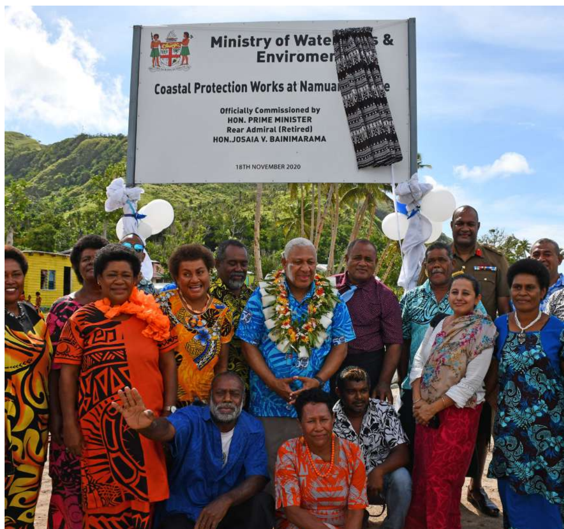
Namuana villagers on Kadavu have lauded Government’s assistance with the construction of 150 metres of geo-systemic SandBag protection and another 100 metres of Boulder protection.

“When we build, we build to cyclone resilient standards, when communities are in need, we build seawalls and we relocate communities. And when we rebuild a strong Fijian economy, we build a stronger and safer Fiji. It’s that simple.”