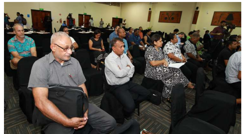
The A-G stresses that as a vulnerable island nation, we must continue to champion and demonstrate legitimate and evidence-based action drawing on our intimate understanding of the risks we face.

"It is the first piece of legislation globally to include provisions that recognise and set out a legal process for considering planned relocation of communities as a legitimate form of climate change adapta-