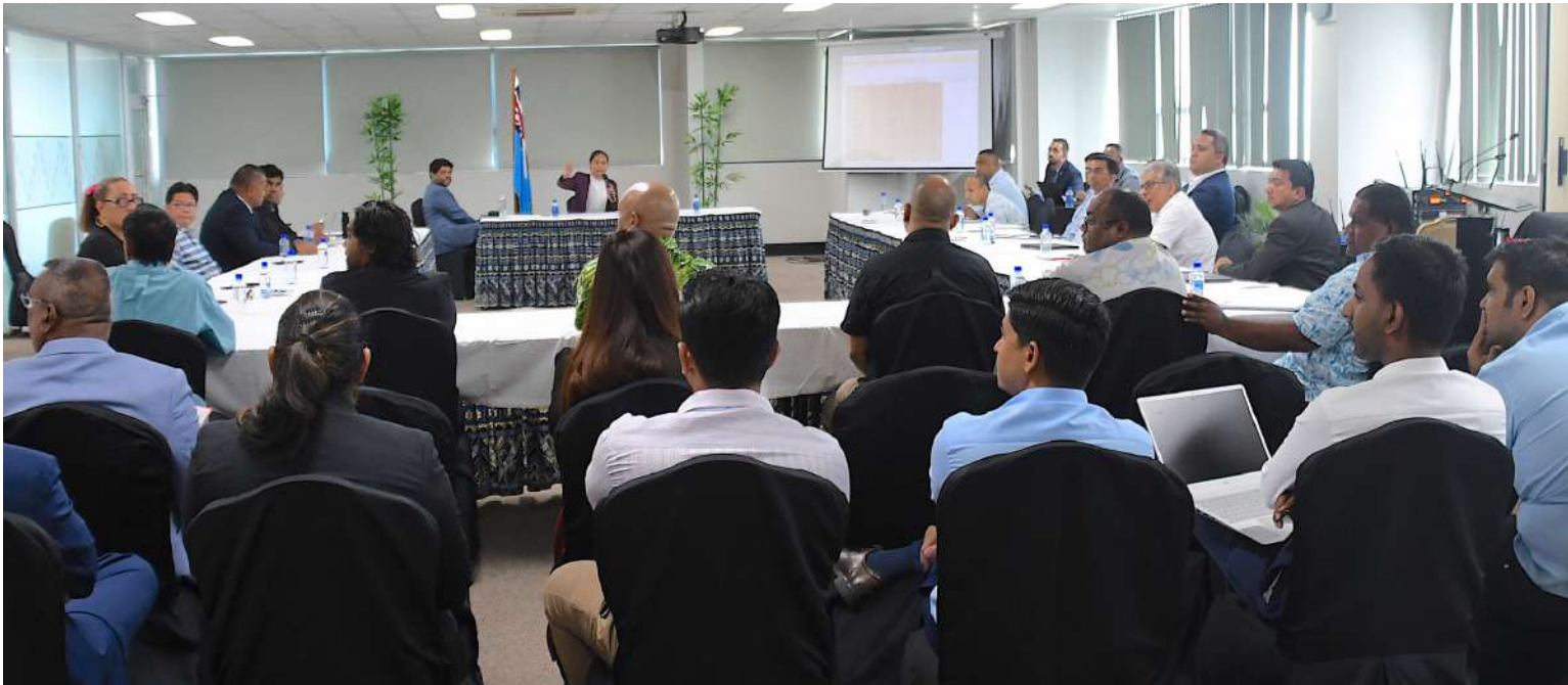
Acting permanent secretary for Communications Tupoutua'h Baravilala briefs relevant stakeholders in the Information, Communication and Technology sector on issues of infrastructure sharing and connecting the unconnected as Attorney-General and Minister for Communications Aiyaz Sayed-Khaiyum looks on.