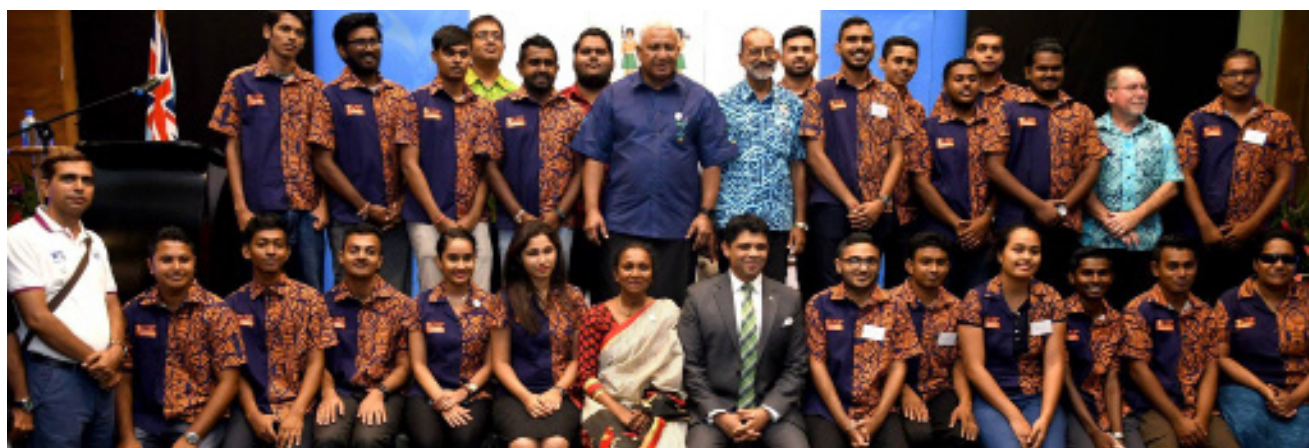
Prime Minister Voreqe Bainimarama and Attorney-General and Minister for Economy, Aiyaz Sayed-Khaiyum with young entrepreneurs during the Young Entrepreneurship Scheme or "YES" at Grand Pacific Hotel in Suva.

"Today's opening of the two major bridges in the capital shows the commitment of all stakeholders and Fijians need to understand that despite the duration of work all infrastructure needs to be up to par," Mr Moore said.