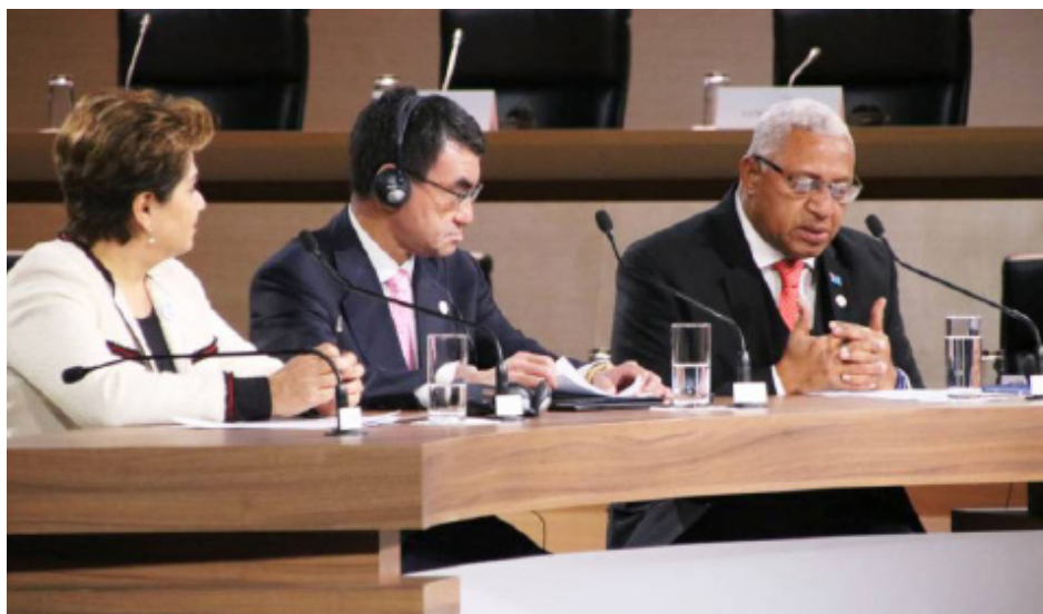
Prime Minister and Conference of Parties 23 president Frank Bainimarama speaks at the opening of the One Planet Summit Paris last month.

He said there was a need to have better access to the public finance that was being mobilised through the formal mechanisms of the United Nations Framework Convention on Climate Change (UNFCCC), including the Green Climate Fund which needs to flow faster through a less bureaucratic and more streamlined system.