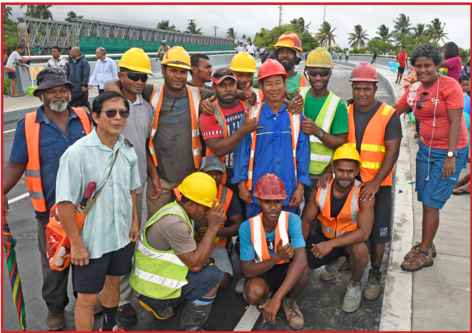
Local construction workers join their Chinese counterparts at the opening of the Vatuwaqa bridge last week.

THE opening of the new bridges at Stinson Parade and Fletcher Road, Suva, will now ease traffic congestion for daily commuters. While opening the two bridges in Suva last week, Prime Minister Voreqe Bainimarama said Fiji was rapidly becoming a more modern and prosperous society. “Eight straight years of growth for the Fijian economy have meant eight straight years of rapid and unrelenting progress for our nation, eight straight years of unprecedented infrastructure development and eight straight years of better opportunities for all of our people, espe-