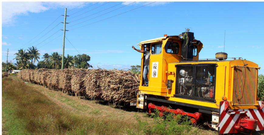
Sugarcane farmers in the cane belt areas of the country have received a special cane payment of $3.05 per tonne last week to bring the final cane payment for 2016 to $82 per tonne.

“There will be no deductions from this special cane payment and all payments will be disbursed directly to growers, either by cheque or directly into their bank accounts.”