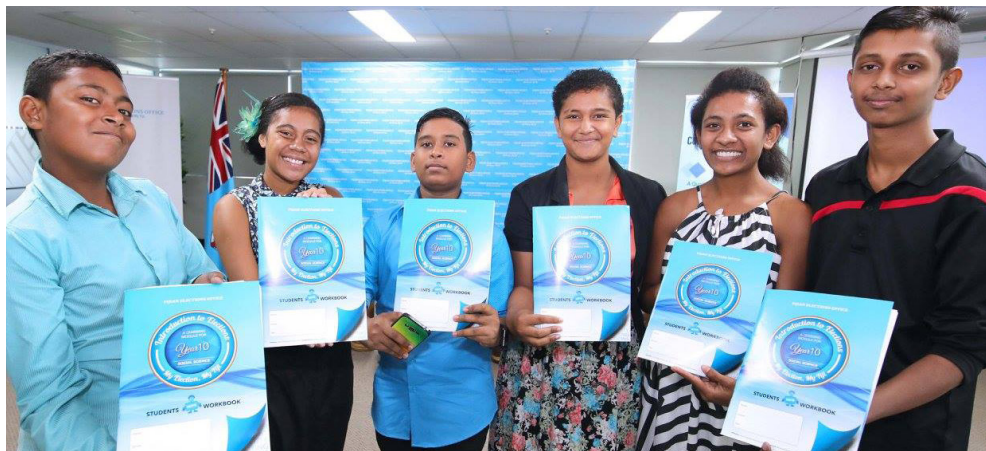
Students with the school curriculum: Introduction to Elections: A Learning Module for Year 10 Social Science students.

Some of the training administered include the first hybrid training for technical officers that was held last November, the Motor Vehicle Levy Collection processes training for 80 customer services officers and the Japan Vehicle Export Inspection Centre training whereby 10,719 vehicles were inspected.