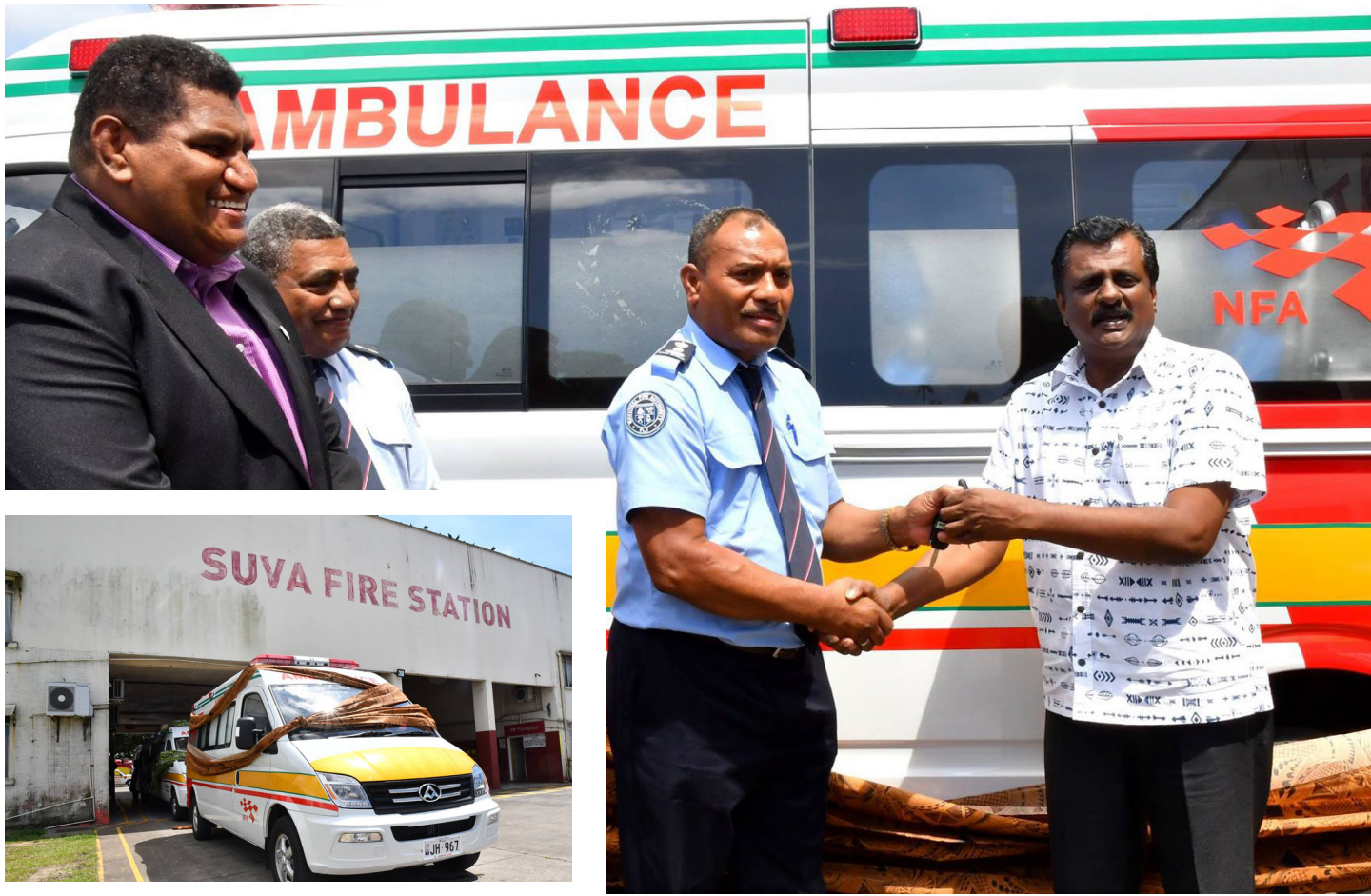
Minister for Local Government, Housing, Environment, Infrastructure and Transport Parveen Kumar during the handing over of new ambulances to NFA at the Suva Fire Station at Walu Bay, Suva.

The council was expected to begin works in February.