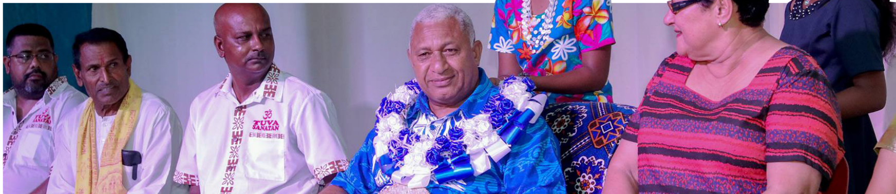
प्रधान मंत्री वॉरेनो बईनिमरामा का हालही तूवा नन्डोन्गा में राम लीला समारोह के दौरान भव्य स्वागत हुआ। इस दौरान उन्होंने कहा कि हमारा देश धन्य है कि यहाँ अलग-अलग संस्कृति और धर्म के लोग रहते हैं।