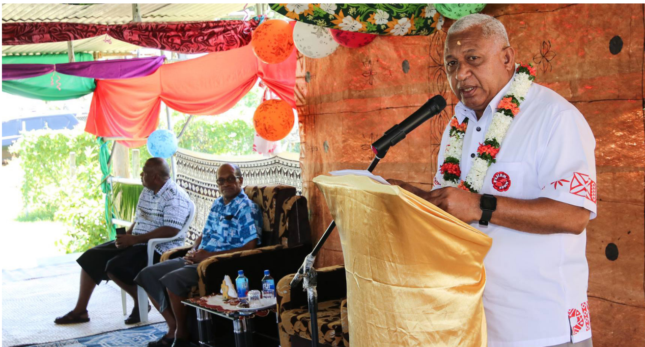
Prime Minister Voreqe Bainimarama during the commissioning of Vunarewa community’s rural electrification project in Nadi.