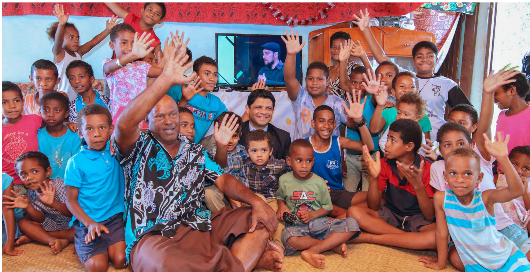
Attorney General and Minister for Communications Aiyaz Sayed-Khaiyum with children of Nakorokula after the launching of Walesi Digital TV.