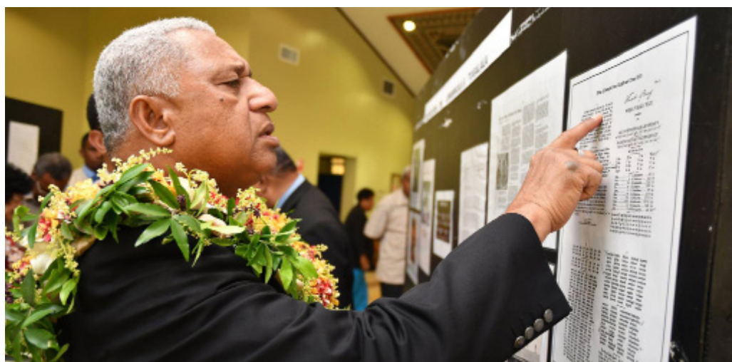
Prime Minister Voreqe Bainimarama, while officiating at the launch of the Volavosa Vakaviti Application dictionary in Suva, encouraged "everyone to continue learning, preserving, and spreading the iTaukei language".

He said the Government remains committed to strengthening Fiji as a multiracial society as it strived to pay homage to the cultures and backgrounds that make Fiji a