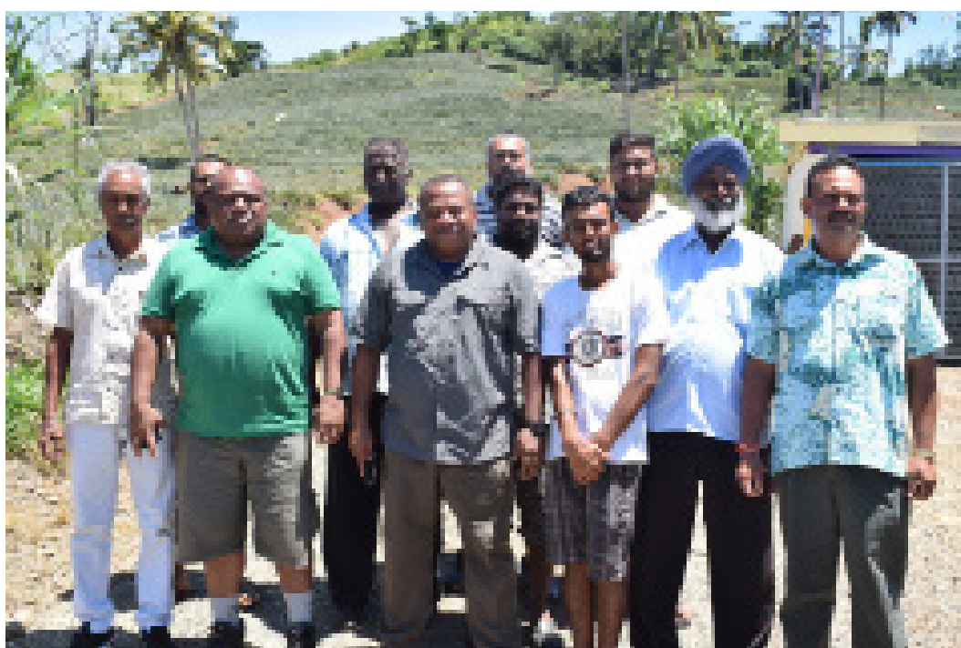
Minister for Agriculture, Rural and Maritime Development and National Disaster Management Inia Seruiratu with farmers during the Central Division tour in Tailevu last week.

“Weather patterns are changing and as farmers you need to adjust with it. I am talking