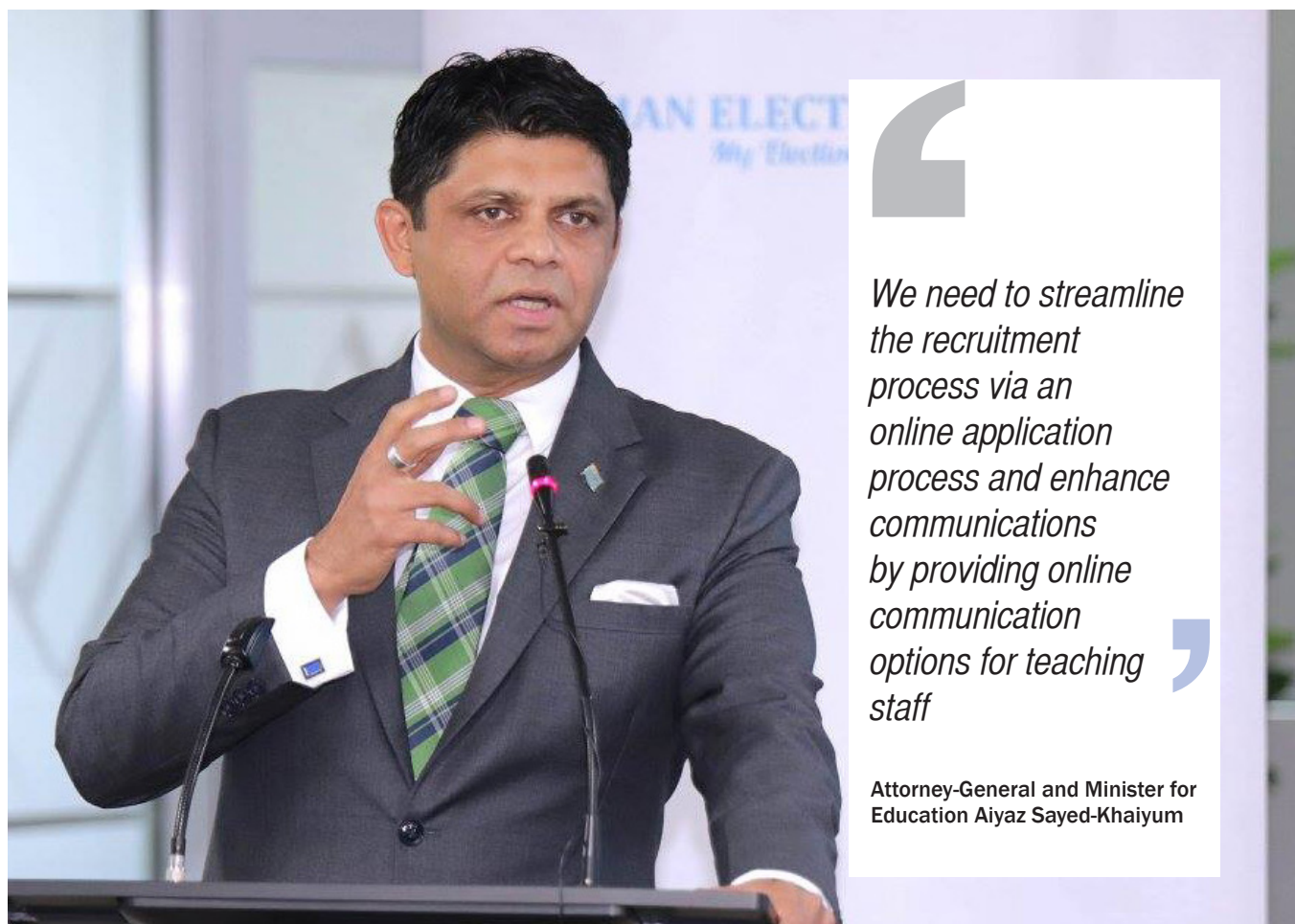
Attorney-General and Minister for Education Aiyaz Sayed-Khaiyum during the handing over of voter education materials in Suva last week.