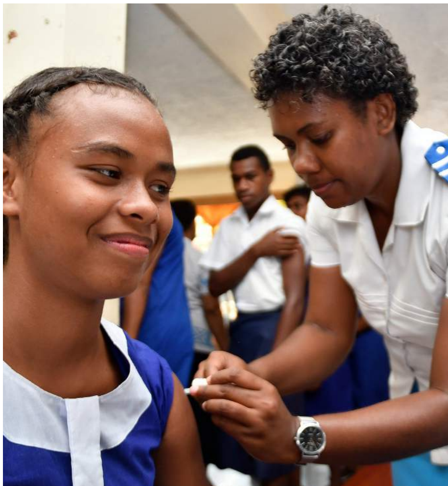
A nurse vaccinates a student of Navesau Adventist High School as part of the Ministry of Health and Medical Services’ meningococcal vaccination programme in Fiji.

“The only way to address cleanliness within our schools and surroundings if every student plays their part. This will only progress if it’s taught at their homes. In schools this is the second phase of learn-