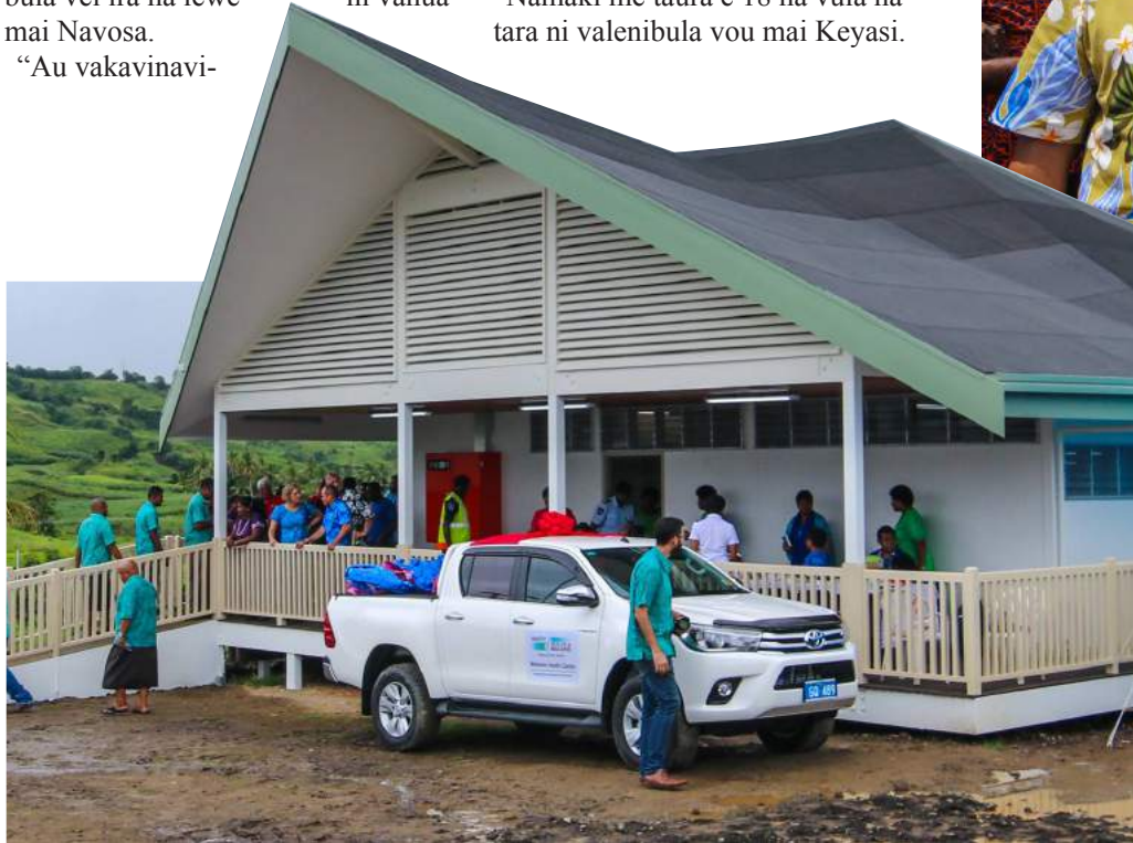
Yaco na marau vei ira e rauta ni lewe 700 na lewe ni vanua e Nalawa ena nona dolava na Minisita ni Bula kei na Veiqaravi Vakavuniwai ko Rosy Akbar na nodra vale ni Wai se Waimaro Health Centre