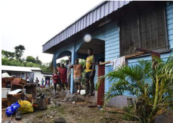
The Ministry of Health and Medical Services is urging everyone in flooded areas to avoid swimming/bathing in muddy water or flood waters as much as possible to avoid contracting diseases such as leptospirosis.