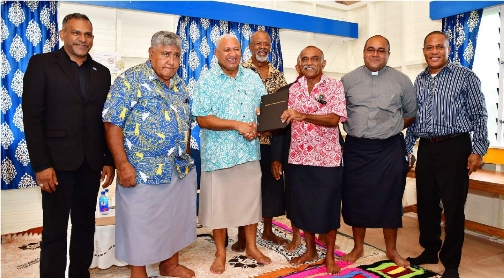
E solia ko Paraiminisita Voreqe Bainimarama na nodratou tiko ni qele na isoqosoqo ni vuli oti ena Ratu Kadavulevu School me lisitaki ena mua ni vula sa oti.

keda iwiliwili taucoko na lewei Viti.” Na icovi sa rawata oqo na iroro ni waqavuka mai Nadi sa tautauvata kina kei na iroro ni waqavuka ni veivanua lelevu eso me vakataki Roma, Perth, Athens, Montreal, Moscow, Manila kei Houston.