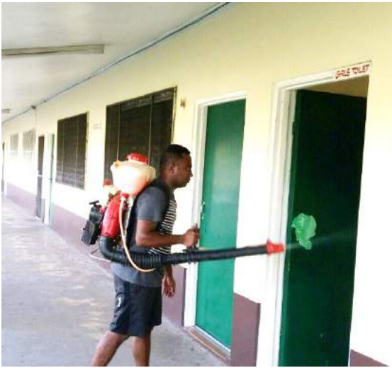
A health inspector spraying disinfectant at a school in the Western Division.