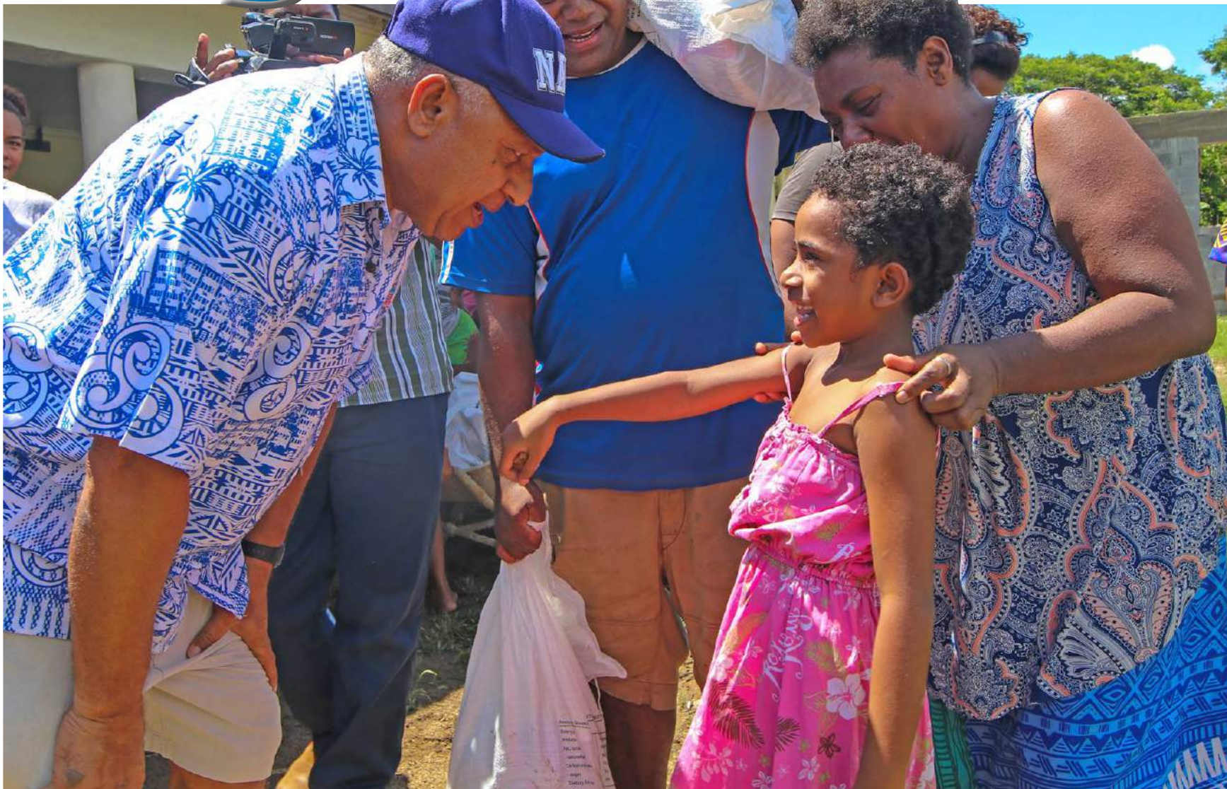
A young Nawaka District School student speaks to Prime Minister Voreqe Bainimarama about her experience of Tropical Cyclone Josie. The Prime Minister was visiting areas in the Western Division that suffered massive flooding, leading to fatalities. Ba Town was the worst affected. More on Cyclone Josie clean-up and rehabilitation on pages 3, 4, 5 and 14