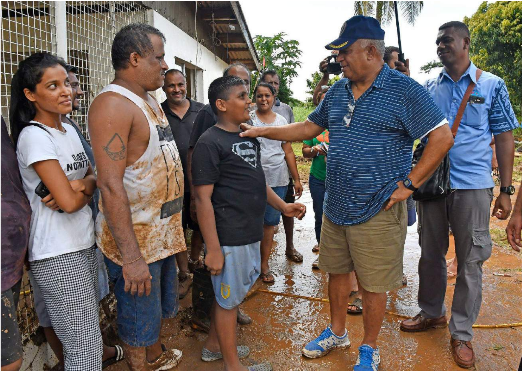
Veisiko wavoki ko Paraiminisita Voreqe Bainimarama vei ira na lewe ni vanua ena Mua-i-Ra ni noda vanua ka tarai ira na revurevu ni waluvu ka yaco ena macawa ni Siga ni Mate ena mua ni vula sa oti kei na tekitekivu ni vula oqo.