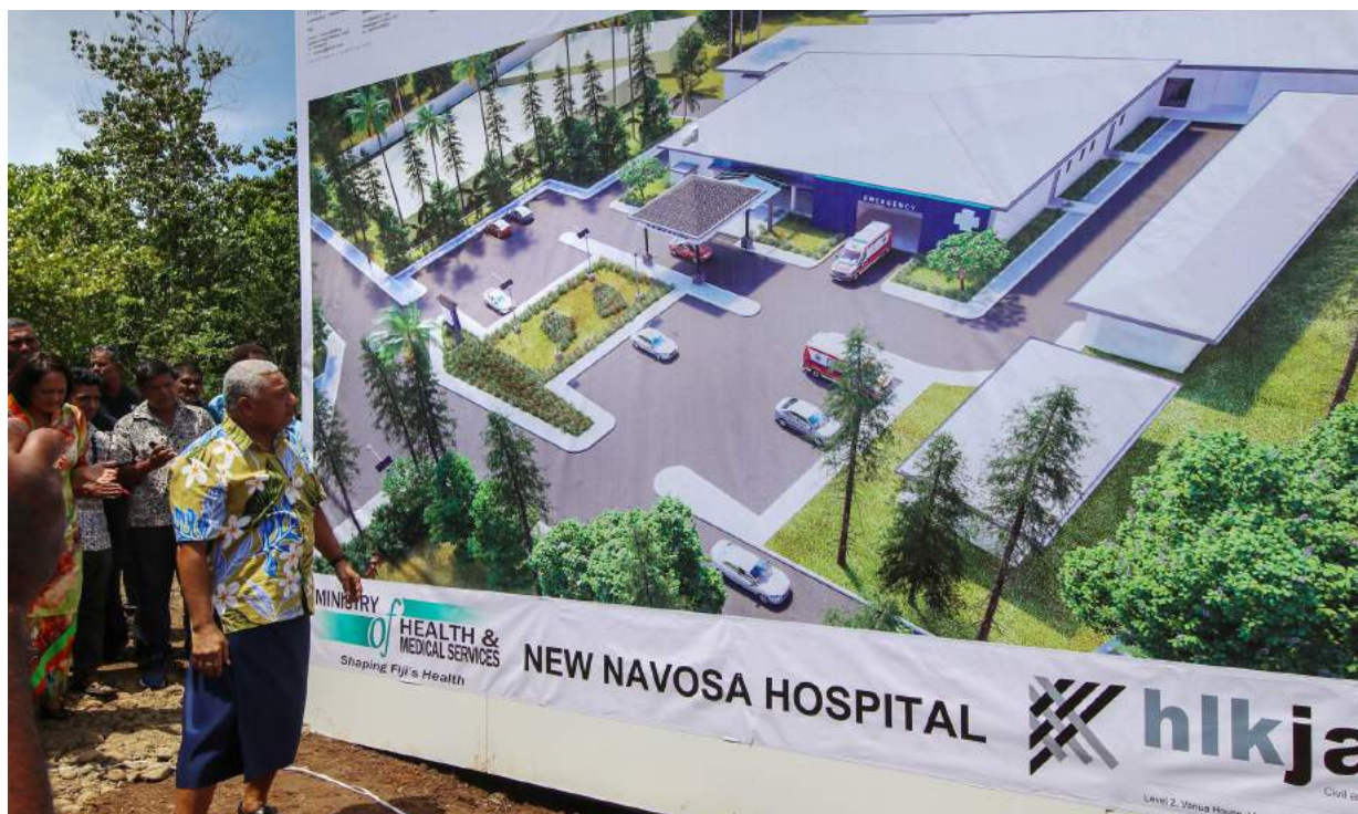
बा के हाईलैंड्स और नड्रोंगा/नवोसा प्रांत के लगभग 10,000 फीजीवासियों को अब कैयासी में नया नवोसा सबडिविज़नल अस्पताल खुलने से लाभ होगा।

इस कार्यक्रम का मुख्य आकर्षण था पैसिफिक स्ट्रेटिजिक प्लान फॉर फिशरीज़ स्टैटिस्टिक्स (Pacific Strategic Plan for Agricultural and Fisheries Statistics [PSPAFS]) की शुरुआत और ऐसी आशा है कि यह छोटे विकासशील द्वीपों (Small Island Developing States [SIDS]) द्वारा सामना किए जा रहे विशिष्ट मुद्दों पर ध्यान केंद्रित करेगी।