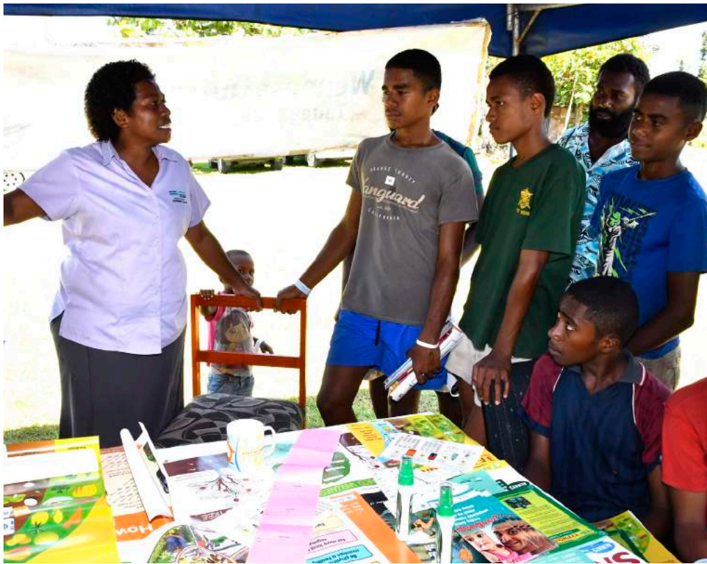
Vosa tiko edua na ivakalesilesi ni tabana ni bula vei ira na gonevuli ena koro ko Nataleira e na tikina ko Dawasamu.