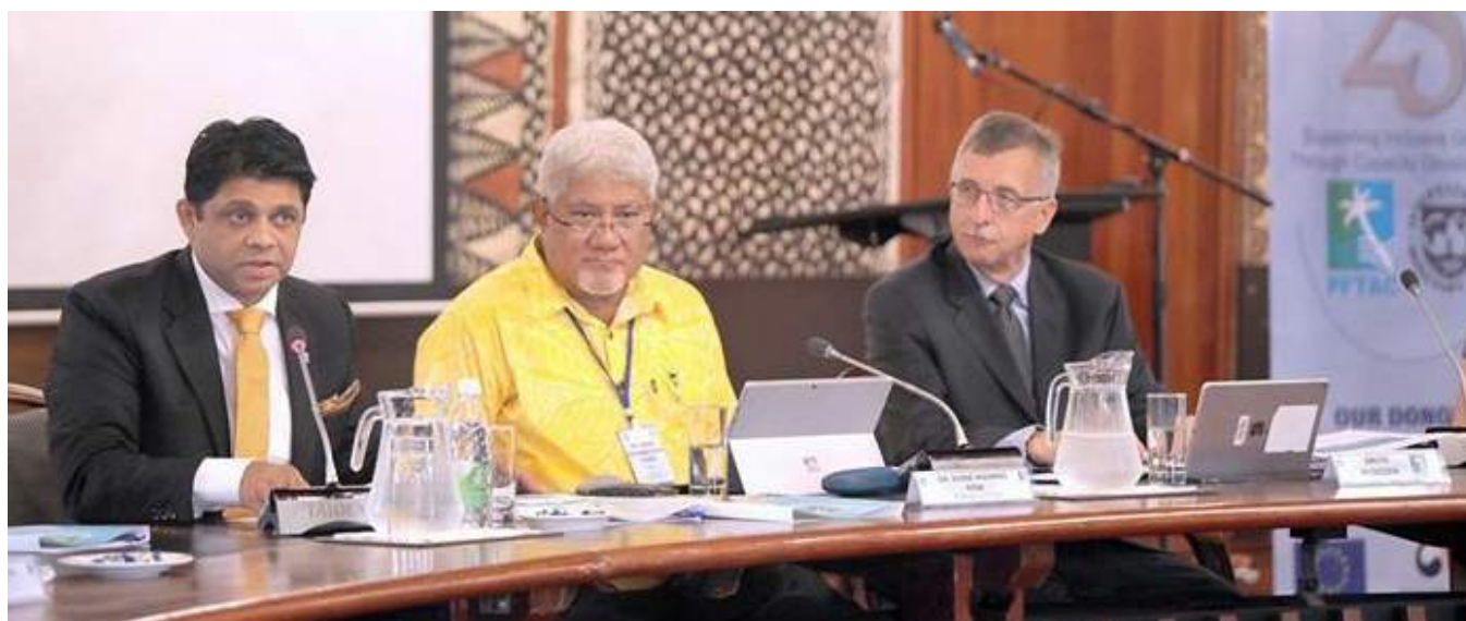
Attorney-General and Minister for Economy Aiyaz Sayed-Khaiyum addresses the Pacific Financial Technical Assistance Centre (PFTAC) Steering Committee Meeting at the Pacific Islands Forum in Suva.

"Some of the leases will need to be leased through the iTaukei Land Trust Board and the Ministry of Lands," the A-G said.