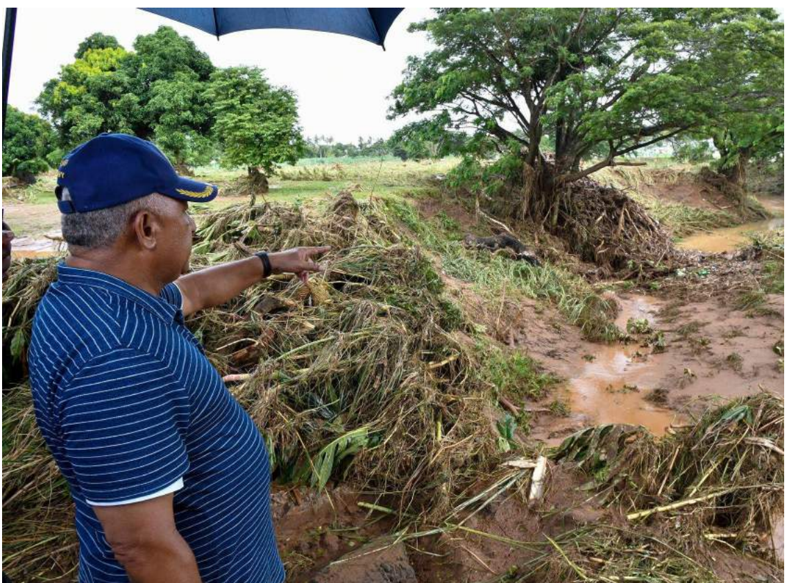
समुद्री आँधी जोसी के कारण हाल ही में पश्चिमी विभाग में आई गंभीर बाढ़ के बाद प्रधान मंत्री, वॉरिंगे बड़िनमरामा ने बाढ़ से असर पड़े इलाकों का दौरा किया।

उन्होंने कहा कि नान्दी के मुख्य सड़क (मैन स्ट्रीट) को यातायात के लिए जल्दी से साफ किया गया है, हालांकि अन्य सड़कों पर काम अभी भी चल रहा है।