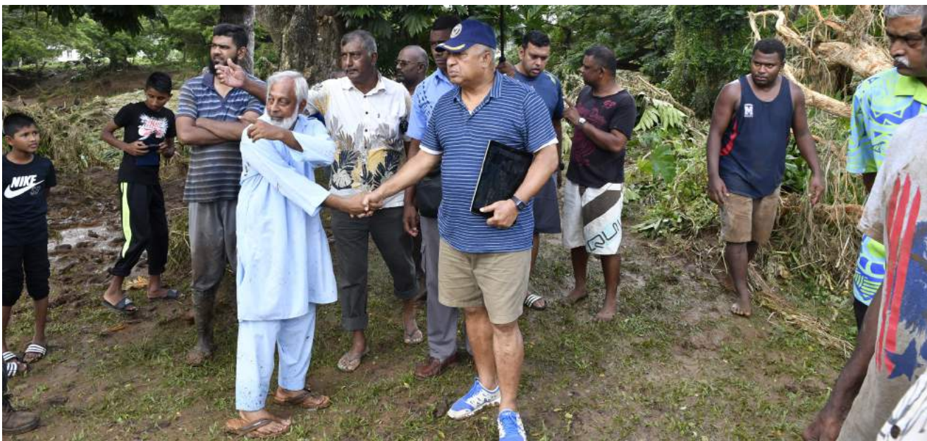
Veisiko voli ko Paraiminisita Voreqe Bainimarama ena Mua-i-Ra ni noda vanua.

A tiko talega ena soqo ni vakananumi koya na Minisita ni Veikau ko Osea Naiqamu ka vakavinavakataka na vosa a vakayacora ko Peresitidi Konrote.