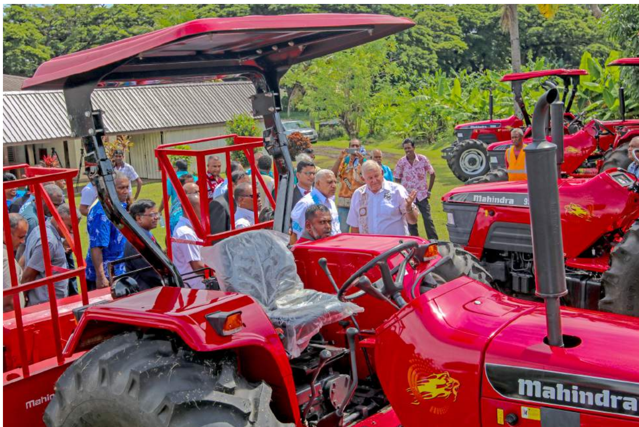
Prime Minister and Minister for Sugar Voreqe Bainimarama during the handing over of 30 new tractors to the Fiji Sugar Corporation.