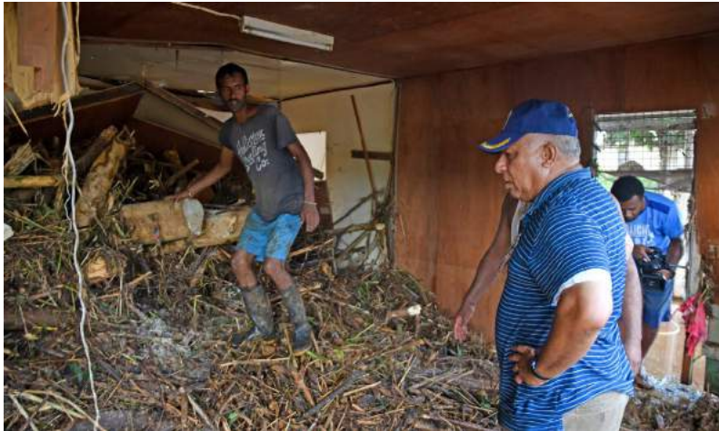
Sarava ka dikeva ko Paraiminista Voreqe Bainimarama na benu e soqoni laivi mai ni lutu sobu yani na wai ena waluvu e tara na Mua-i-Ra ni noda vanua.

“Ni da sasamaki tiko ni oti na waluvu e kauta mai na Cava ko Josie, au sa uqeti keda kece na lewei Viti meda duavata ena kena taqomaki na noda vanua me na leqa tubu koso,” tukuna ko PM Bainimarama.