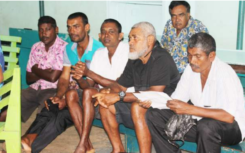
Vunimoli land tenants during the iTaukei Lands Trust Board (TLTB), consultations at Vunimoli, Labasa.