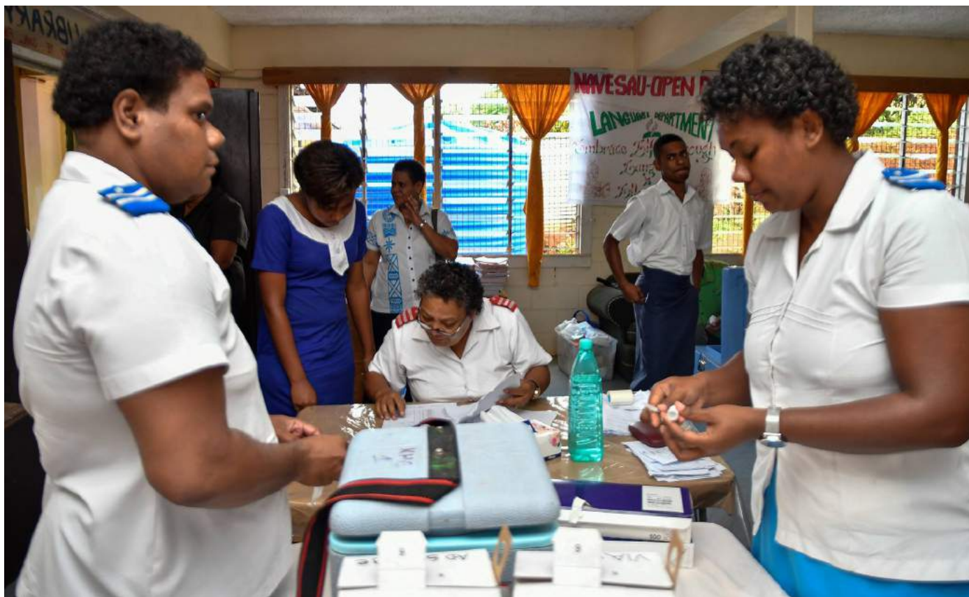
A Ministry of Health and Medical Services team at Navesau Adventist High School. Teams were sent out three weeks ago to assess and carry out tests on students who had been identified as having contracted the meningococcal disease.