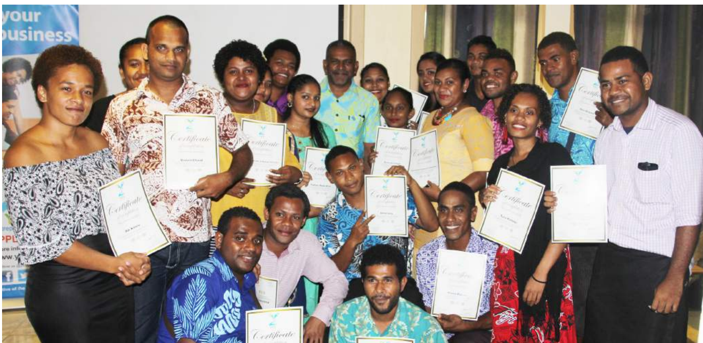
Minister for Industry, Trade, Tourism, Land and Mineral Resources Faiyaz Koya with graduates of the Young Entrepreneurs Scheme.

The A-G said earlier that apart from Vatuwaqa, the Government would look at building proper funeral rites facilities in Nausori, the Western and the Northern divisions.