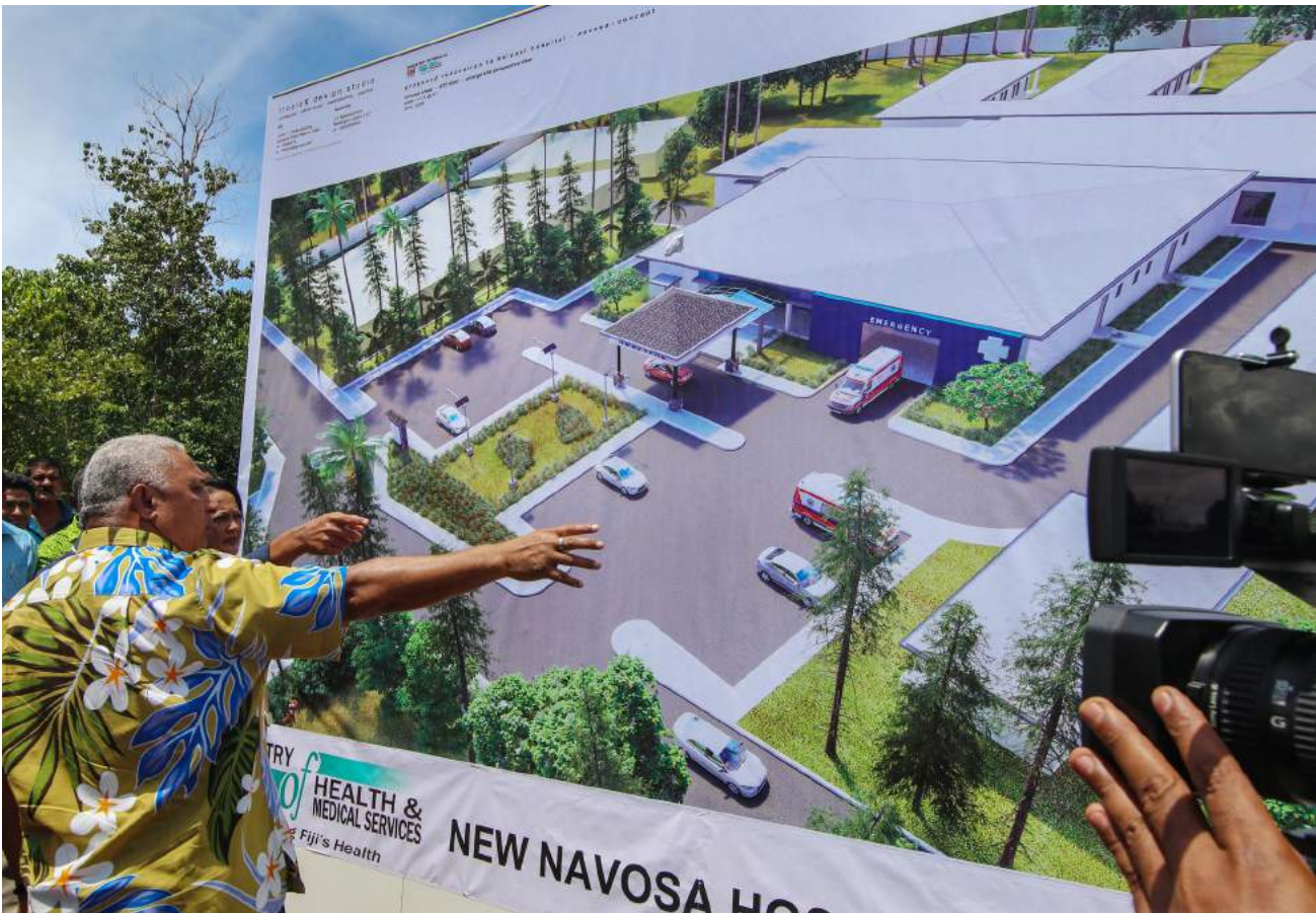
Dikeva toka na e dua na ivakatakarakara ni valenibula vou e Keiyasi ko Paraiminisita Voreqe Bainimarama ena soqo ni vakasobuduru e Navosa ena mua ni vula sa oti.