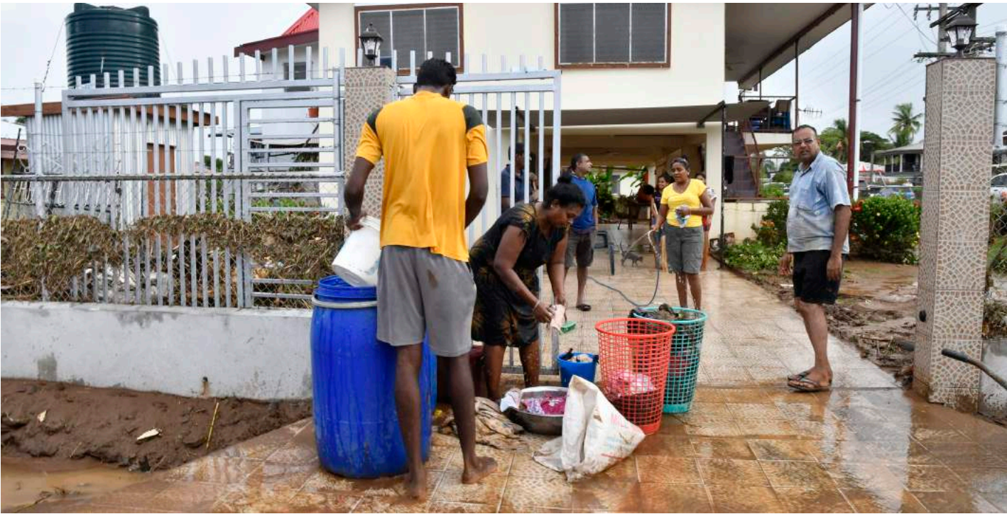
Families are advised to take simple preventative measures to protect themselves and their families from common sicknesses such as diarrhoea (diarrhoea is especially serious in babies and small children) and typhoid.