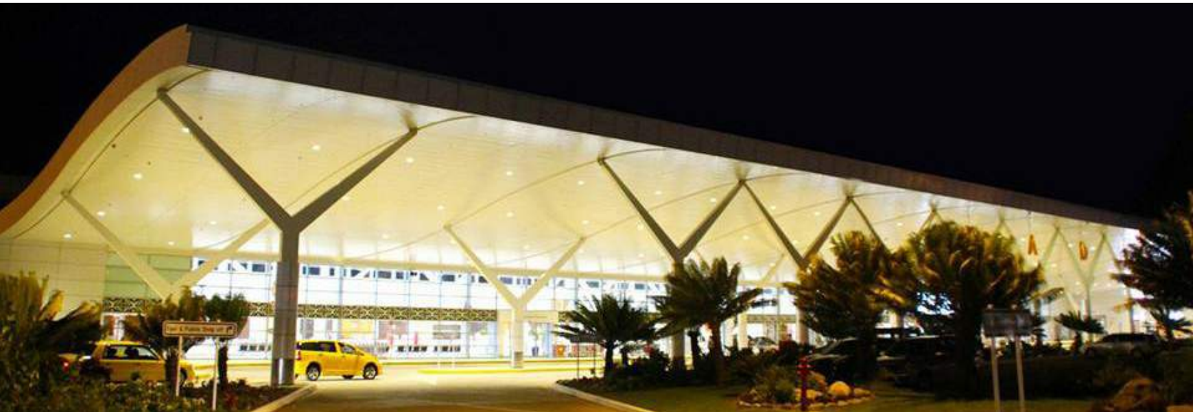
Tukuna ko Vunilawa Aiyaz Sayed-Khaiyum ni icovi e soli kina iroro ni waqavuka mai Nadi sai vakadinadina ni sa tiko sara e cake na itagede ni iroro ni waqavuka oya, vakakina na daumka ni saravanua kei na bula vakailavo ena noda vanua.