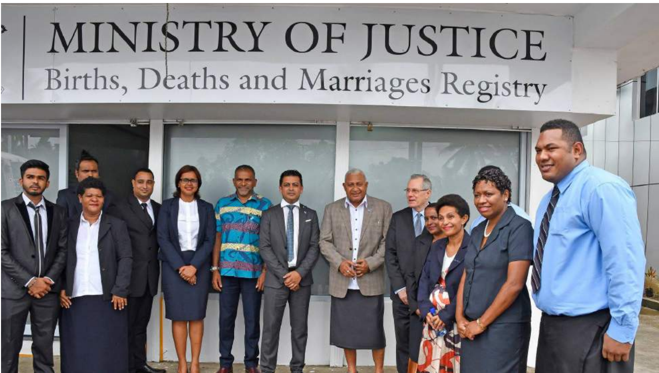
हाल ही में प्रधान मंत्री, वॉरिंगे बड़िनमरामा द्वारा कोरोवऊ तईलेवू में एक नया बर्थ, डेथ और मेरिज या बी डी एम (Birth, Death and Marriage [BDM]) दफ्तर का उद्घाटन किया गया।