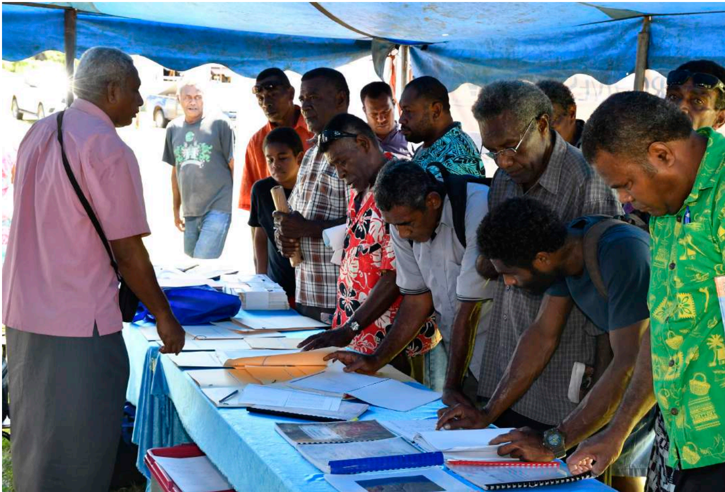
Era mai vakayagataka vinaka na lewe ni vanua e Dawsamu na vei qaravi vakamatanitu e yaco yani ena moro o Nataleira ena macawa sa oti.