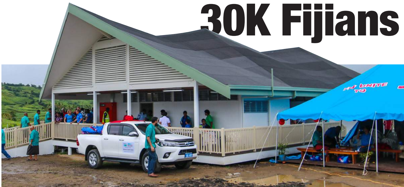
MORE than 30,000 Fijians living in rural Ra will now have better access to healthcare services after the opening of the Waimaro Health Centre in Nalawa, Ra.