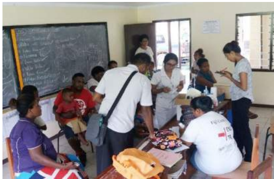
Medical officers conduct screening on evacuees at Nawaka District School in Nadi.