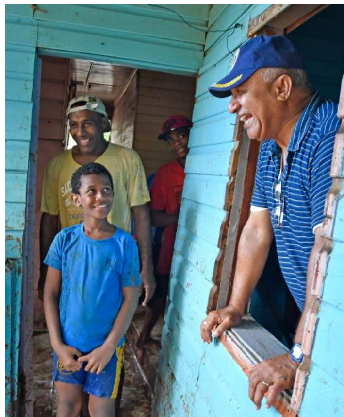
Prime Minister Voreqe Bainimarama shares a light moment with young boys at Vatulaulau, Ba, last week.

Commissioner Western Manasa Tagicakibau said food rations had been distributed to the various evacuation centres and carting of water to affected areas in Ba would continue until water supply normalised.