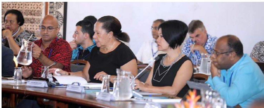
The two-day meeting was attended by technical experts from the financial sector, including multilateral agencies in the Pacific and heads of central banks and taxation authorities in the Pacific.