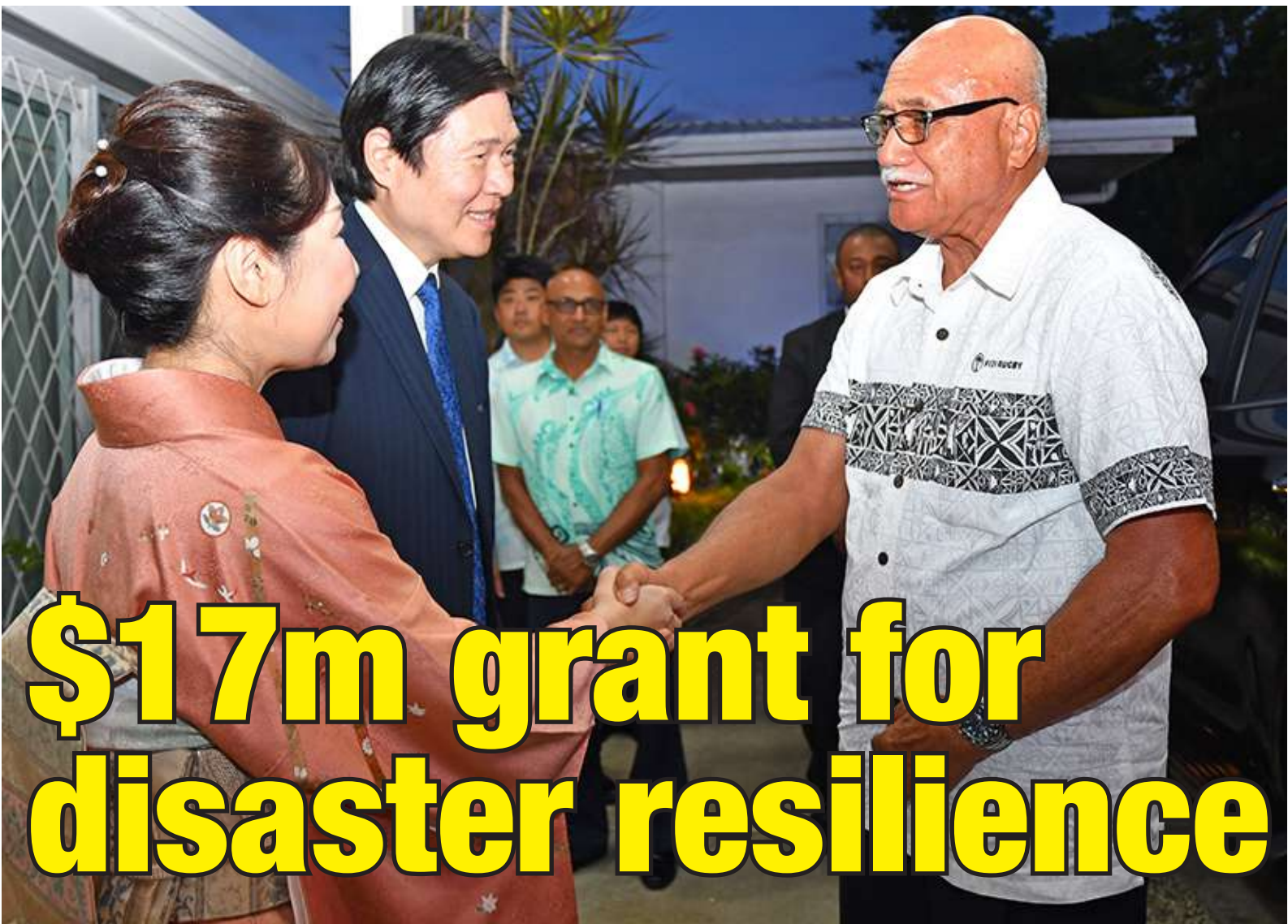
President Major-General (Ret'd) Jioji Konrote greets the Ambassador of Japan to Fiji, Omura Masahiro and his wife during the 60th birthday celebration of his Majesty the Emperor of Japan.