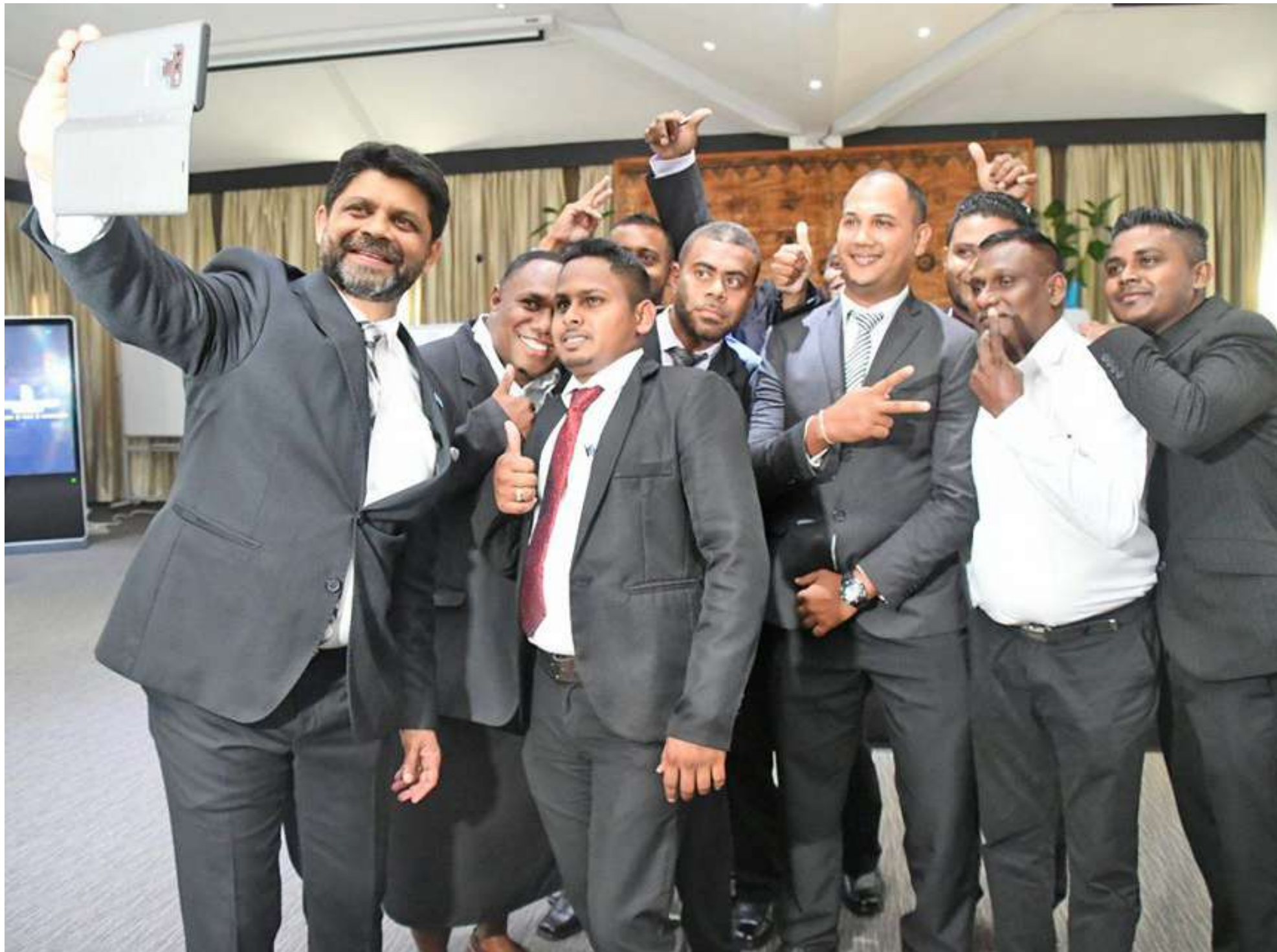
अटेनी जेनरल अईयाज़ सईयद खईयूम, पिछले सप्ताह वोरिक रिज़ोट सिंगातोका में लीगल अईड कमिशन के एक सम्मेलन के दौरान लीगल अईड कमिशन के वकीलों के साथ सेल्फी लेते हुए