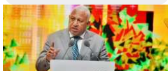
Frank Bainimarama (@FijiPM)

Fiji isn't alone in enduring devastating climate impacts - this is a global emergency. If our planet keeps heating, no people will be spared from greater suffering. At #WUF10 we'll discuss cities' role in averting that future by urgently making urban living = sustainability.