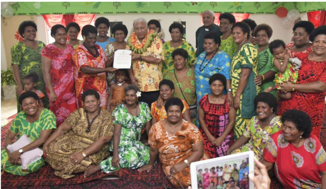
Talei vei ira na marama ni Biausevu mera taba vata kei na turaga na Paraiminisita Voreqe Bainimarama ni sa dolava rawa na nodra vale ni cakacaka ni liga na marama.

Na Matanitu sa cakacaka voleka tiko kei ira na kena dau main a veitabana ni bula e vuravura mai na Matabose Cokovata kei Vuravura.