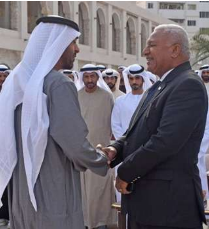
Rau lululu toka oqori na na Ravouvou se Crown Prince a Abu Dhabi ena nona veisiko kina ko Paraiminisita Voreqe Bainimarama.

Tukuna vua o PM Bainimarama ni dau vakamuria tiko o Viti na ivakarau ni cavuisausau e vakayacora tiko na United Arab Emirates kei na matalia ni nona veiliutaki.