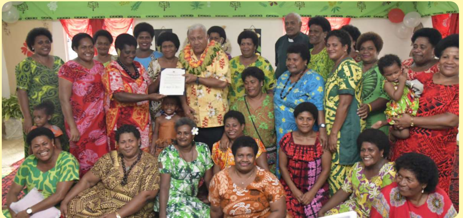
Prime Minister Voreqe Bainimarama with Biausevu villagers after the official opening of the Village women's resource centre in Korolevu, Nadroga.

"It gives opportunities to businesses and it is also growing businesses in and around Nadi."