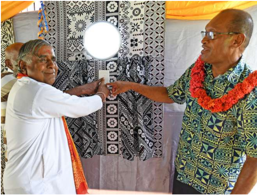
Minister for Infrastructure and Transport Jone Usamate (right), during the commissioning of the extension grid at Tuvavatu Settlement in Rakiraki.