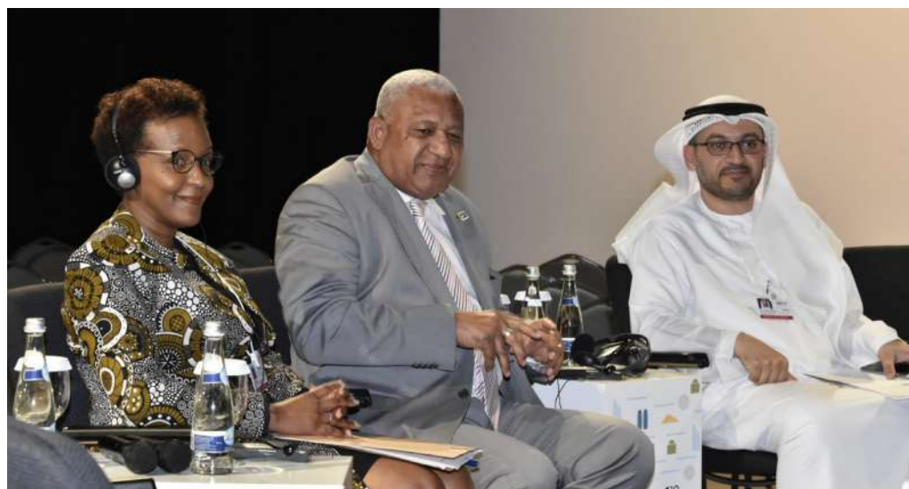
Prime Minister Voreqe Bainimarama (middle), at the 10th World Urban Forum in Abu Dhabi.

“Whether you are a Fijian living in our capi-