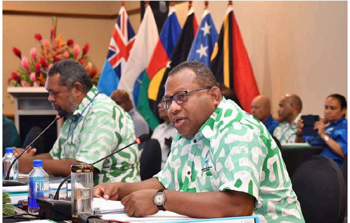
मलेनेशियन विदेश मंत्रियों की सभा में फीजी के रक्षा तथा विदेश मंत्री इनिया सेरुईरातु नेताओं के समक्ष अपनी माँग रखते हुए

कुल मिलाकर तेरह अफसरों ने इस एक दिवसीय ट्रेनिंग में भाग लिया था। लिट्टा एक्ट 2008 वातावरण विभाग की निगरानी में आता है लेकिन पुलिस अफसर, लेण्ड ट्रांसपोर्ट अफसर, पब्लिक हेल्थ अफसर और अन्य पब्लिक अफसरों के पास यह अधिकार है कि वे यह देखें कि इस कानून का पालन किया जा रहा है।