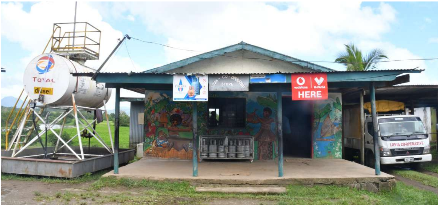
Oqo na sitoa ni isoqosoqo cokovata ni veivoli na Lovia Co-operative e na koro ko Gusuisavu, Naitasiri. Ena yasana imawi e dabe koto kina na kena igunugunu ni benisini ka kele toka ena yasana imatau na nodra keria.