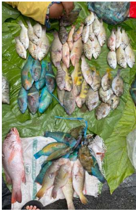
Oqo na veimataqali sasalu ka vakatabuya tiko na Minisitiri ni Qoliqoli me kua ni volitaki se vakayagataki na kena e se lalai. iTaba: VAKARAUTAKI