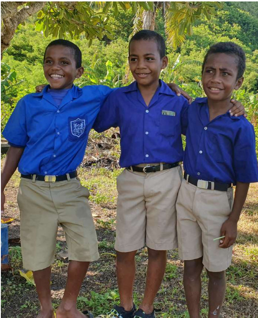
Kia District School students during their recess time at school. Teachers have been asked to plan well to avoid afternoon or Saturday classes for students.