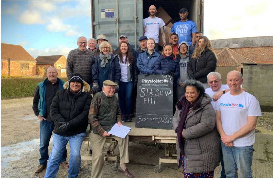
फिसियोनेट यू.कै के सदस्य, फीजी भेजे जाने वाले फिसियो इक्वीप्मेंट के साथ