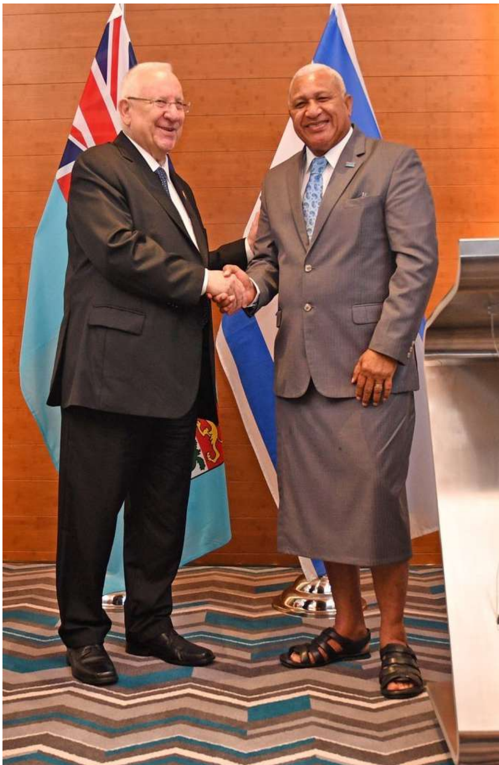
Prime Minister Voreqe Bainimarama highlighted that discussions with President of the State of Israel, Reuven Rivlin centered on empowering future leaders to strengthen the ties that connect our societies and build a partnership that serves our people for generations.

PRIME Minister Voreqe Bainimarama held a bilateral meeting with President of the State of Israel, Reuven Rivlin.