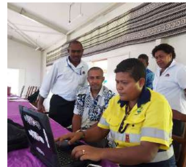
Era sa maqusa na timi ni vakekeli itukutuku ni Fiji Geospatial Information.