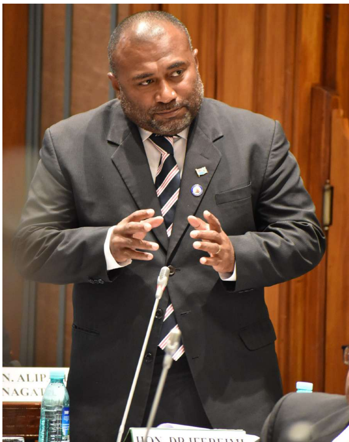
Minister for Health and Medical Services, Dr Ifereimi Waqainabete while answering a question posed during the Parliament session on Wednesday.

“We have procured 15 machines to cover our needs across the Ministry. We also have procured