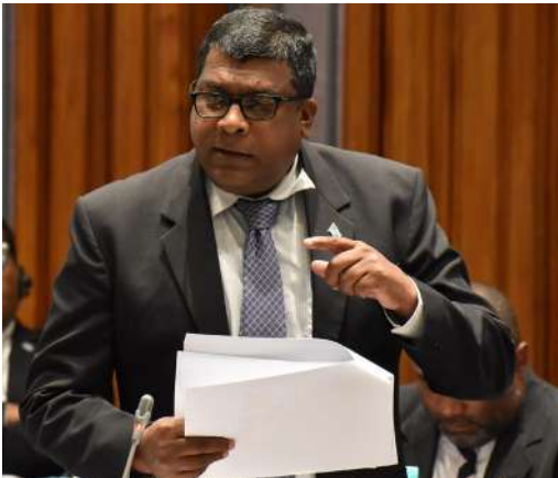
Minister for Agriculture, Rural and Maritime Development, Waterways and Environment Dr Mahendra Reddy while answering a question during the Parliament session on Monday regarding climate change and the livestock sector.

A NIMAL genetic diversity is critical towards security and rural development when it comes to the livestock sector. While answering a question during the current Parliament sitting this week on climate change and the livestock sector, Minister for Agriculture, Rural and Maritime Development, Waterways and Environment, Dr Mahendra Reddy said, “The effects will be more pronounced in developing countries.” “Therefore we need to get our game up and get ready to deal with these challenges.” Minister Reddy added that it would also allow farmers to select stocks and develop new breeds in response to changing conditions including climate change. “Conserving indigenous animal genetic resources for future food security needs is an adaptation because they have adjusted to lo-