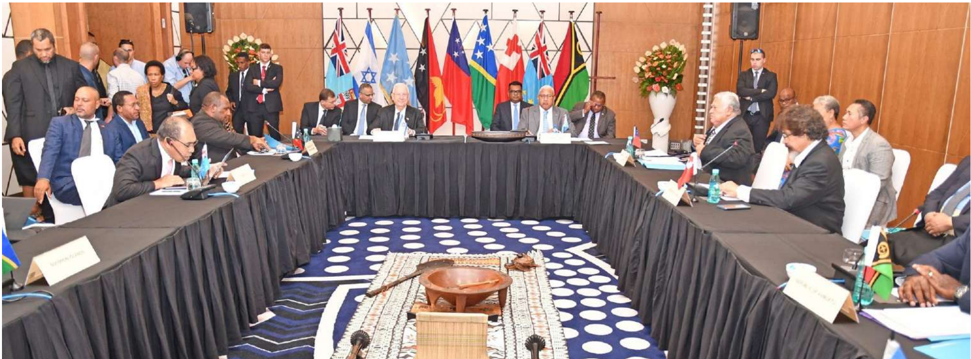
Prime Minister Voreqe Bainimarama and his delegation during the Pacific Leaders' Summit in Nadi.