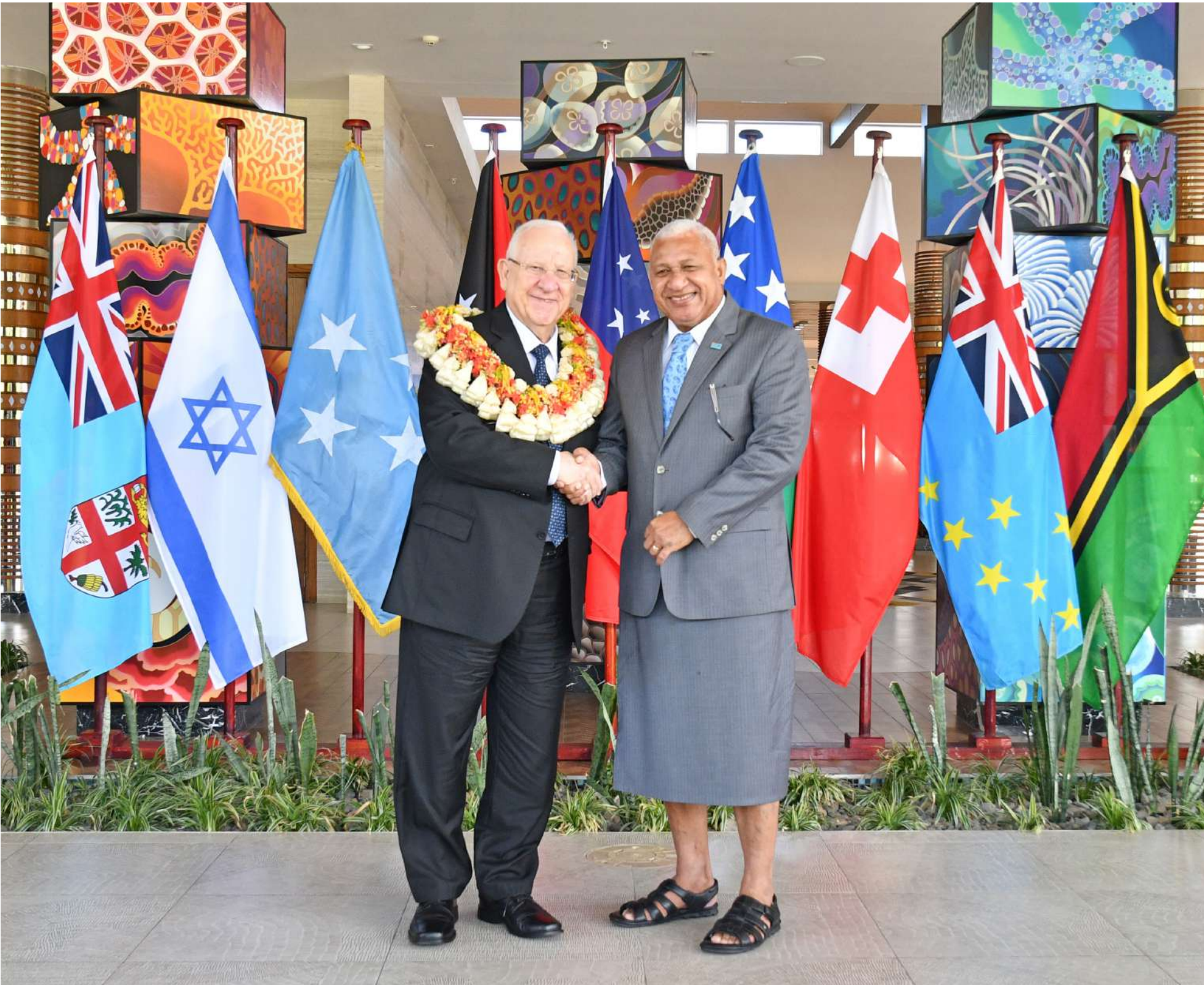
Prime Minister Voreqe Bainimarama with President of the State of Israel, Reuven Rivlin at Pullman Resort and Spa in Wailoaloa, Nadi yesterday.