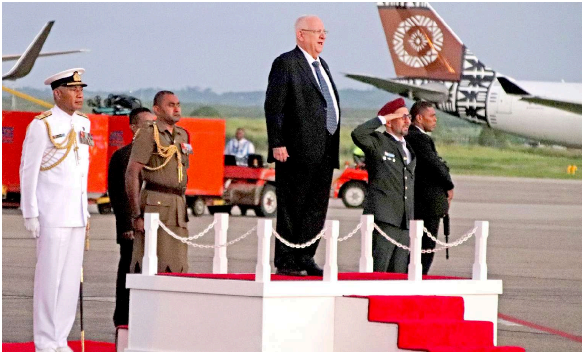
इज़राइली राष्ट्रपति महामहीम रेउवेन रिबलिन को नांदी हवाई अड्डे पर सैनिक सलामी दी गई