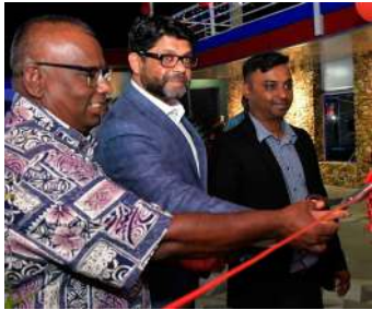
Attorney-General and Minister for Economy Aiyaz Sayed-Khaiyum (middle), during the Motorex Business Centre Inauguration in Nadi.