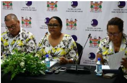
Vakamacala tiko oqori na Minisita ni Veivoli ko Premila Kumar (loma donu), me baleta na yaqona.