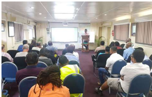
Era vakarorogo tiko oqori na lewe ni vanua ena bosa e kauwaitaki kina na keli qereqere vakaveitalia.