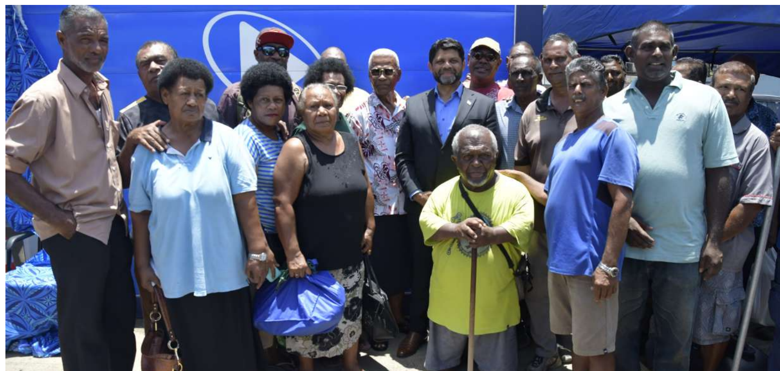
Attorney-General and Minister for Communications Aiyaz Sayed-Khaiyum with members of the public during the Walesi launch in the West.

The theme for the 2020 Forum Trade Ministers’ Meeting - “Pacific Trading Nations: from Surviving to Thriving echoes the Forum Leaders’ aspiration for the Pacific region as “a region of peace, harmony, security, social inclusion, and prosperity, so that all Pacific people can lead free, healthy, and productive lives.”