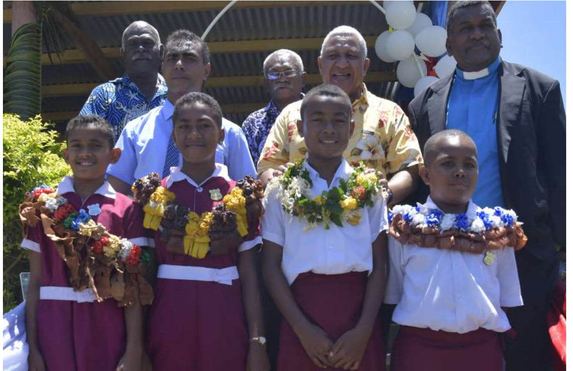
Ko Paraiminisita Voreqe Bainimarama kei ira na gonevuli kei na i vakalesilesi e Ratu Ilaisa Memorial School e Semo, Nadroga.

“Kemuni ra gone na ibulibuli talei ni Kalou. Ni vuli sara vakaukauwa me rawa ni votu na nomu isolisoli.”