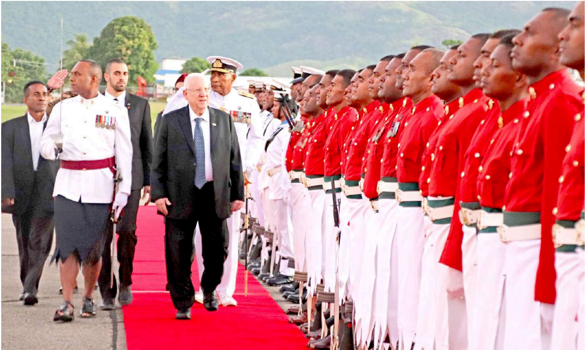
Kidavaki vakamataivalu na Persitedi ni matanitu levu ko Isireli ko Reuven Rivlin ena nona kele mai e Nadi International Airport ena noa.