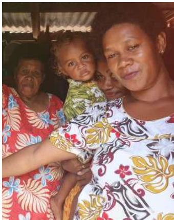
Raravu Women's Club members at Udu Point, Vanua Levu .