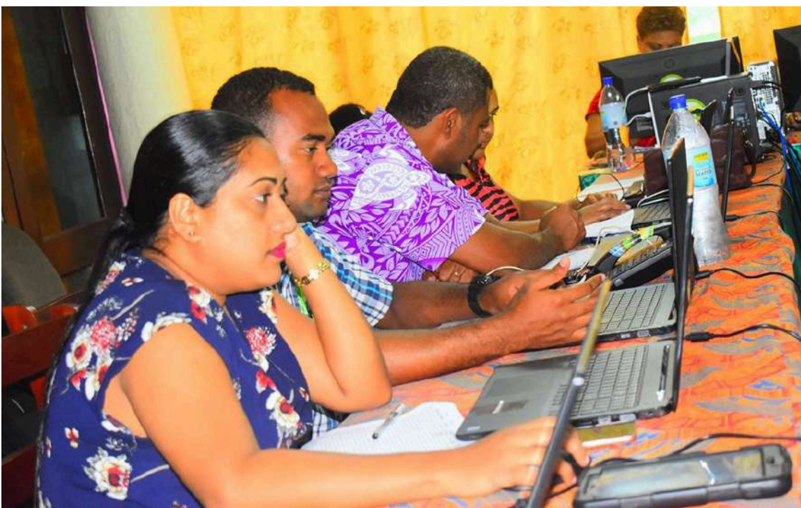
कृषि जनगणना में शामिल कृषि मंत्रालय के कर्मचारी