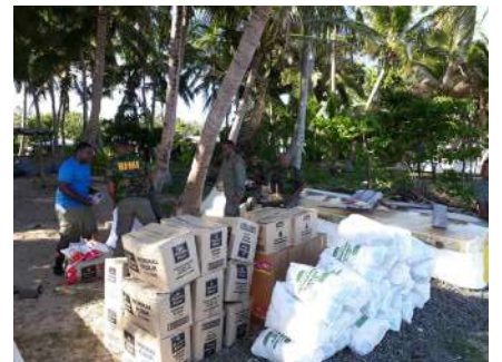
Era taba tiko oqori na idinia ni Mataivalu ni Viti ena kena solia wavoki tiko na kakana ni cagilaba.

E tolu na isoqosoqo cokovata ni veivoli kara kilai levu tu e Naitasiri ni ra se tauyavu ena 1970 vakacaca me vaka Naqali Co-operative, Lutu Co-operative kei na Lovia Co-operative mai Gusuisavu.