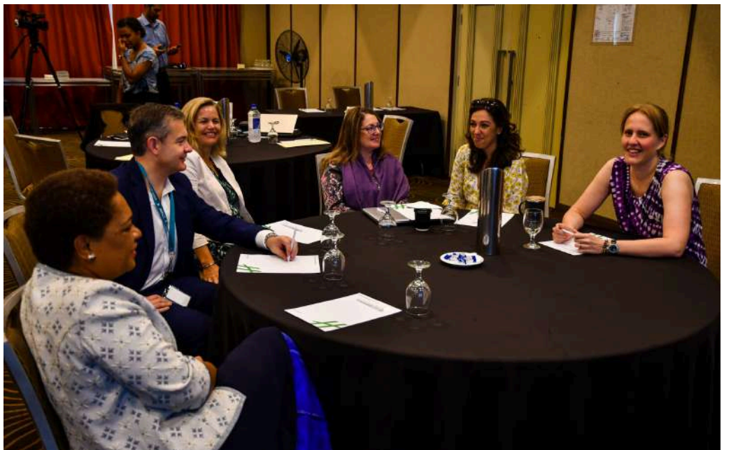
Minister of Women, Children and Poverty Alleviation, Mereseini Vuniwaqa with participants during the Multilateral Negotiation Workshop of the Department of Women.

"I am sure by the end of the two days, you