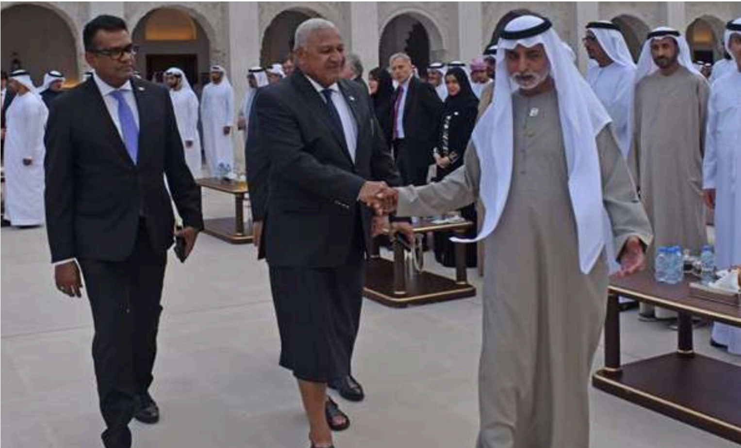
अबु धाबी में प्रधान मंत्री वीरेन्गे बड़निमारामा वहाँ के शाही राजकुमार के साथ

हाय कमिशन वांगम्बादा ने एनरोलमेंट किट प्रदान करने के लिए डिपार्टमेंट ऑफ़ इमिग्रेशन को धन्यवाद दिया।