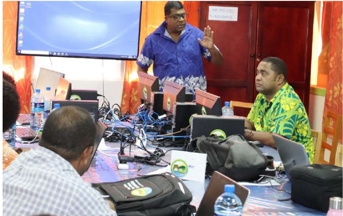
Minister for Agriculture, Rural and Maritime Development, Waterways and Environment Dr. Mahendra Reddy addresses the enumerators and field supervisors the Northern Census Operation Centre.

T HE Minister for Agriculture, Rural and Maritime Development, Waterways and Environment Dr. Mahendra Reddy visited the Northern Census Operation Centre to witness first-hand the operating procedures of the Census exercise.