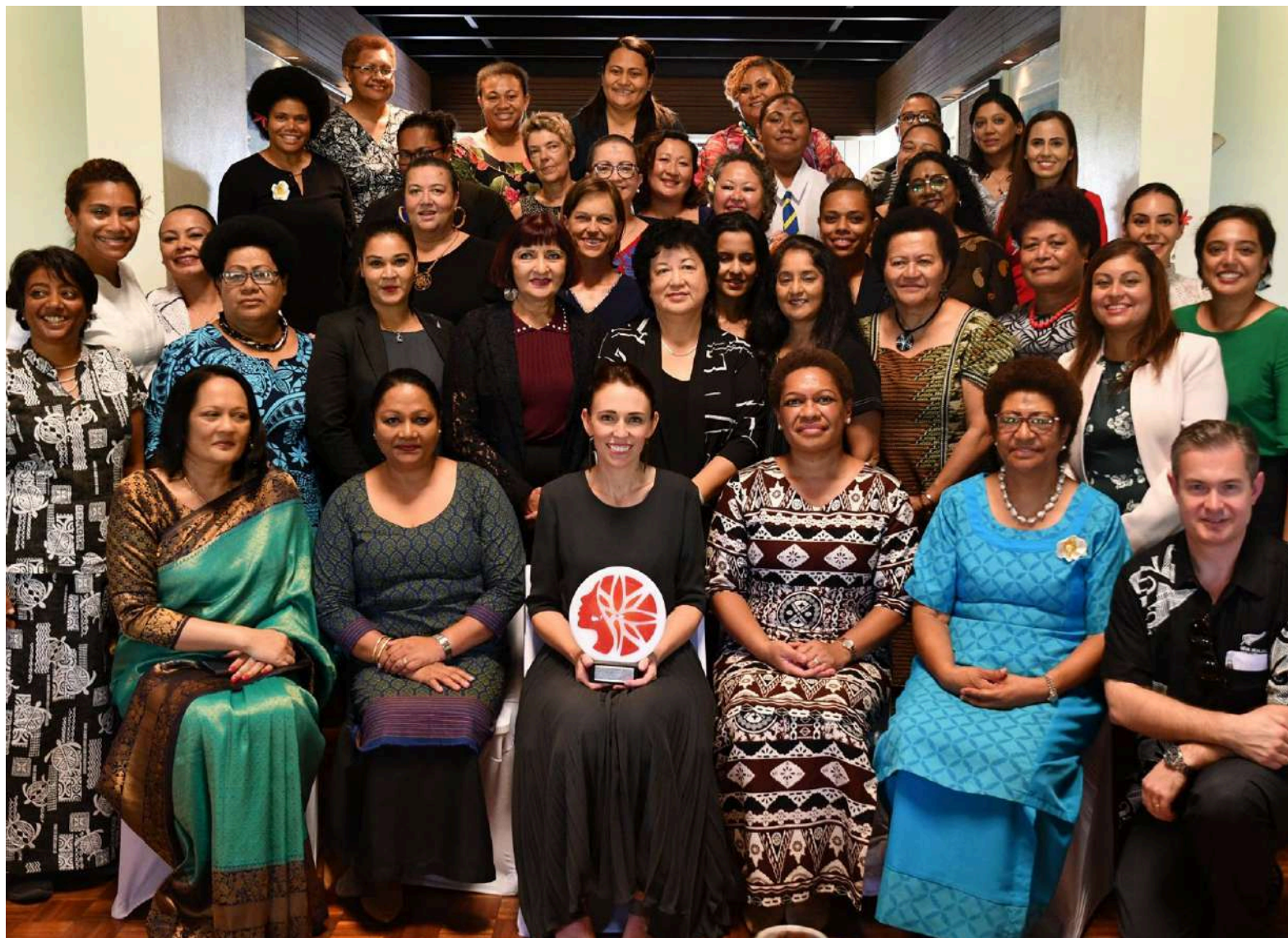
निउज़ीलैंड की प्रधान मंत्री जेसिंडा आडन निउज़ीलैंड हाय कमिशनार के निवास पर देश की महिला नेताओं के साथ चितः ननिसे नइमिल