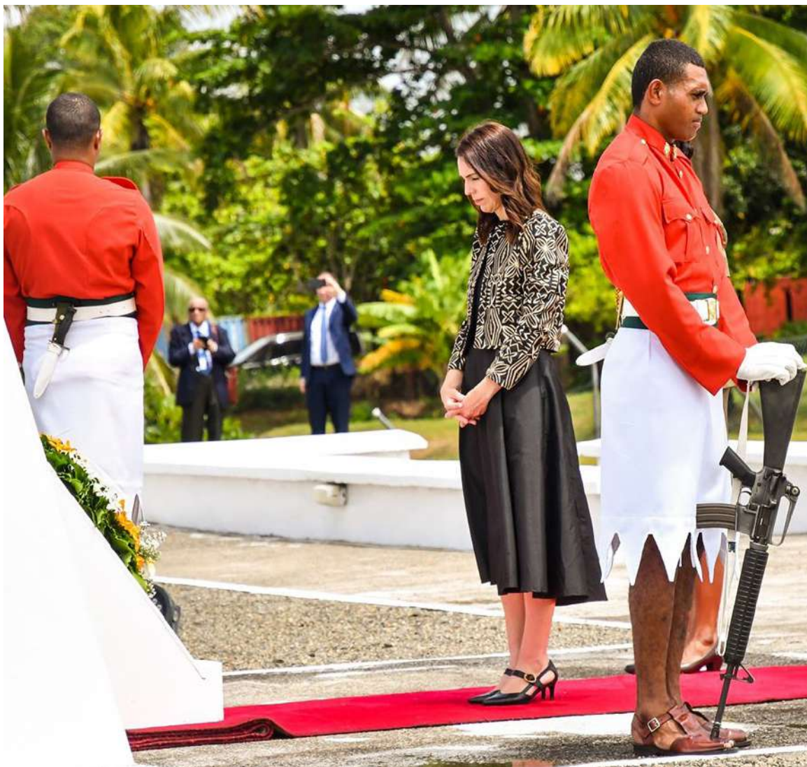
Vakaraitaka toka oqori na marama Paraiminisita e Niusiladi ko Jacinda Ardern na nona vakarokoro kei na veidokai ena nona mai vakananumi ira toka na noda lewe ni mataivalu ka ra sa bale yani ena National War Memorial e Suva ena macawa sa oti..