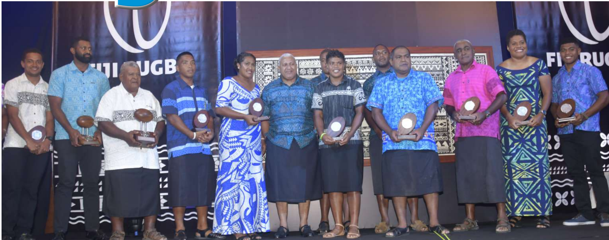
Prime Minister Voreqe Bainimarama with awardees during the Fiji Rugby Union Awards night in Suva last week.