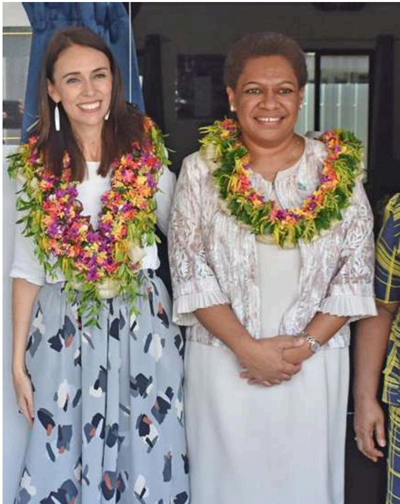
Na marama Paraiminisita e Niusiladi ko Jacinda Ardern kei na Minisita ni Gone, Yalewa kei na Valuti ni Bula Dravudravua e Viti ko Mereseini Vuniwaqa.