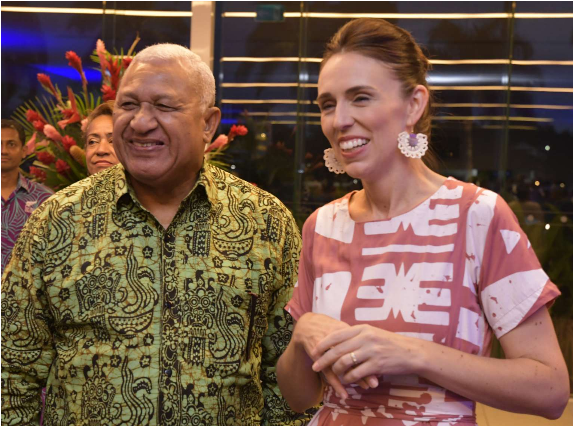
Rau matadredredre toka oqori na liuliu ni matanitu e rua ko Paraiminista Voreqe Bainimarama kei na nona itokani marama e Niusiladi ko Jacinda Ardern ena nodra vakayavi vata e Grand Pacific Hotel, Suva ena macawa sa oti.