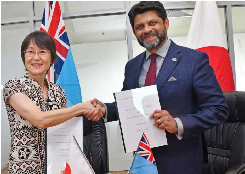
Attorney-General and Minister for Economy Aiyaz Sayed-Khaiyum (right), after signing a standby-loan agreement with the Japan International Cooperation Agency (JICA)

“This is the first loan agreement with the government of Fiji after 22 years since we signed the loan agreement for Nadi-Lautoka regional water in 1998.”