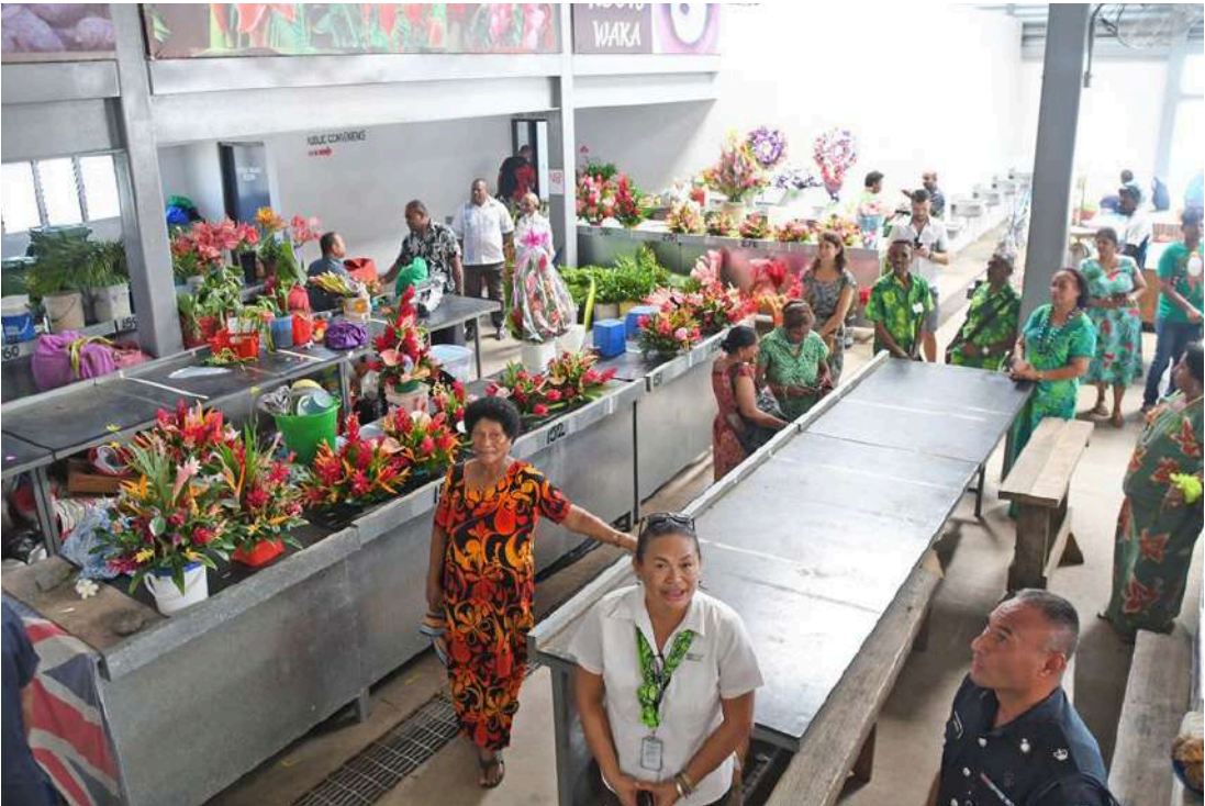
Marautaka ko ira na lewe ni vanua e Nadi na kena mai dolava ko Paraiminisita Voreqe Bainimarama na makete vou e Namaka, Nadi, ena macawa sa oti.