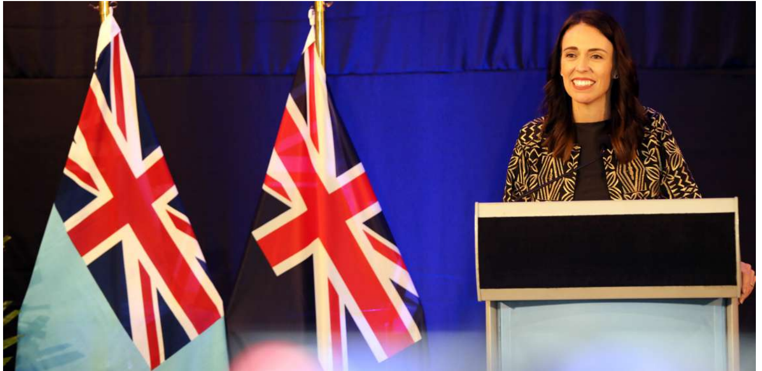
निउज़ीलैंड की प्रधान मंत्री जसिंडा आडन यू.एस.पी में एकत्रित लोगों को सम्बोधित करती हुई

प्रधान मंत्री आडन ने बताया कि यह विश्व की पहली संस्था है जिसकी स्थापना फीजी के सामाजों को खिस्काने में मदद करने के लिए की गई है।