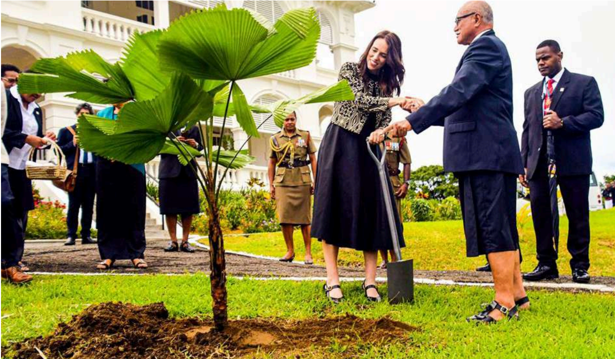
Rau lululu toka ogo ko Peresitedi Jioji Konusi Konrote kei na marama Paraiminisita ni Niusiladi ko Jacinda Ardern ni ot na nona tea na vunika ko Paraiminista Ardern ena itikotiko ni Matanitu mai Vale Levu ena macawa sa oti.