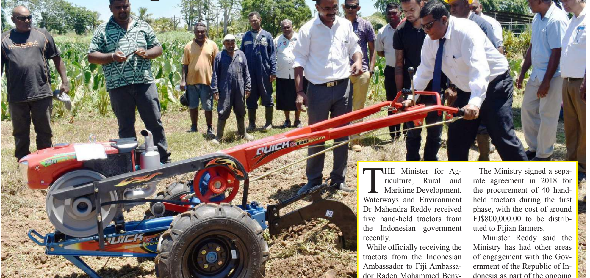
Minister for Agriculture, Rural and Maritime Development, Waterways and Environment Dr. Mahendra Reddy gets a feel of one of the