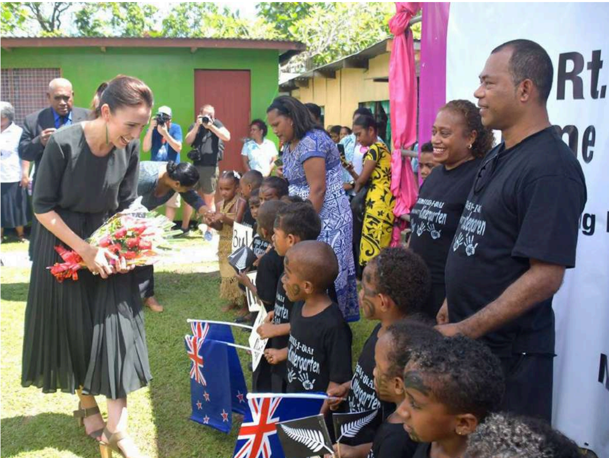
Na marama Paraiminisita e Niusiladi ko Jacinda Ardern kei ira na gone lalai ena nona vesiko voli e Tamavua-i-wai ena macawa sa oti.

e kune ena noda veimakete.” “Na boisareguregu, na veimataqali vua ni qele, na cakacaka ni liga totoka ena kune kece ena veimakete ena noda vanua me vakataki Suva, Labasa, Ba, vakakina e Nadi.” Kaya o Paraiminisita Bainimarama ni makete vou oya ena yaga sara vakelvu vei ira na lewei nadi era gole mai vakayawa ena loma ni vanua mera mai volitaka na nodra ivoli. “Vei ira na dau volitaki ika sa vakarataki tu na misini ni buli waicevat e rawa nira vakayagataka me bulabula tu kina nodra sasalu.” “Sa na lailai kina na lusi ni ivoli kana levu cake kina na ilavo e lako kina nodra taga na dau volivolitaki.” “Era na volitaka talega kina na soqosoqo nu marama na taga ni volivoli moni vakayagataka ena volivoli ena makete vou iya na lewenivanua,” kaya o PM Bainimarama.