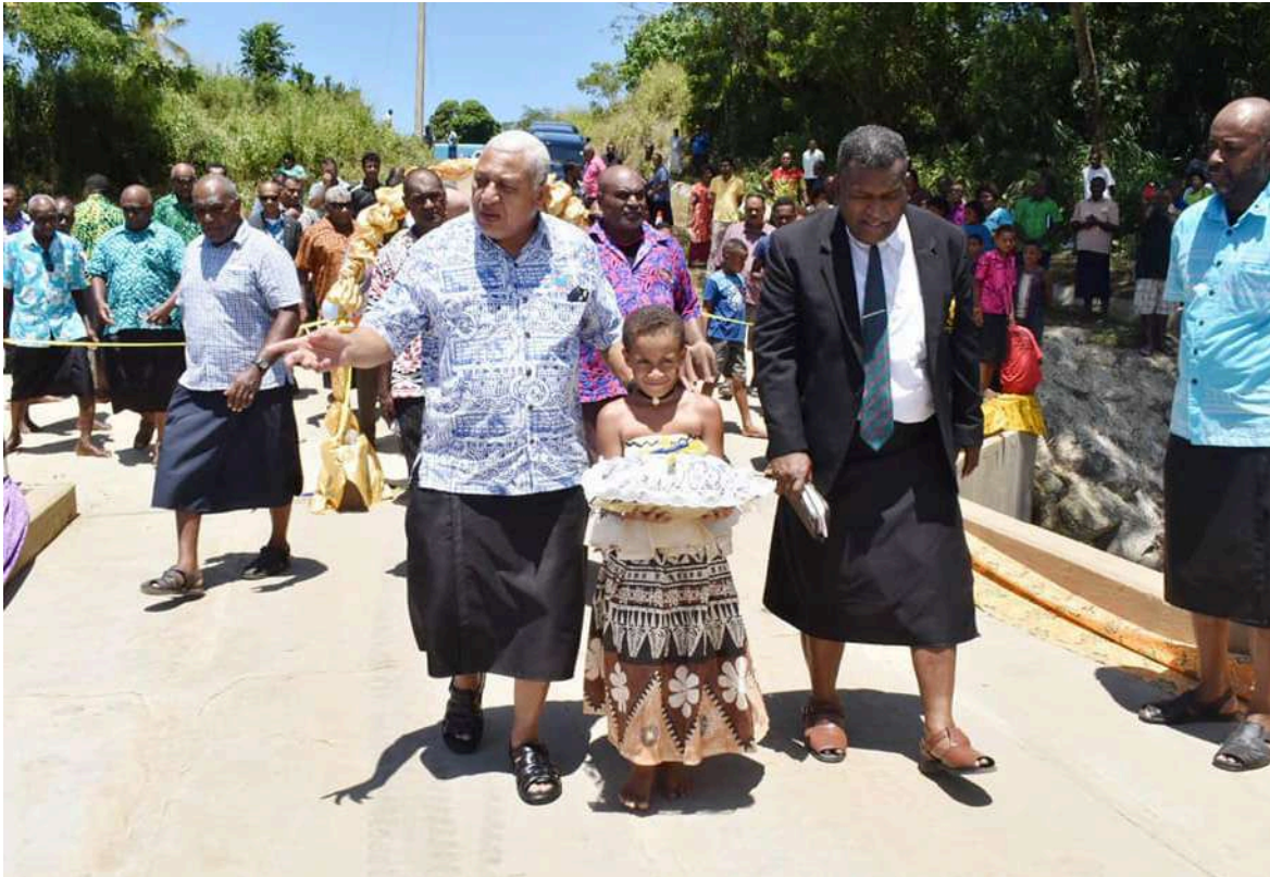
Taubale toka oqori ko Paraiminisita Voreqe Bainimarama kei ira na lewe ni koro ni oti na nona mai dolava na wavuena koro ko Emuri e Nadroga.

“Ena so na gauna e dau taura 2 na macaw aka vakadredretaka