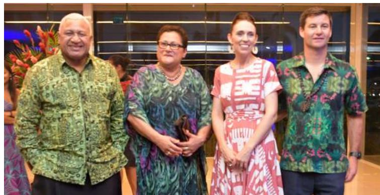
Rau matadredredre toka oqori na liuliu ni matanitu e rua ko Paraiminista Voreqe Bainimarama kei na nona itokani marama e Niusiladi ko Jacinda Ardern vata kei na dui watidrau ko Mrs Bainimarama kei Clarke Gayford ena nodra vakayakavi vata e Grand Pacific Hotel, Suva ena macawa sa oti.

Sa tiko e dua na kena ivakananumi ena Univesiti ni Ceva edaidai.