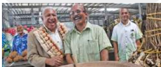
Premila Kumar (@PremilaKumarMP)

As said by Hon @FijiPM we're getting there, one new road, one new school and one new market at a time. The new Namaka market accommodates close to 300 Fijians and I'm esp pleased amongst these are strong, independent women.