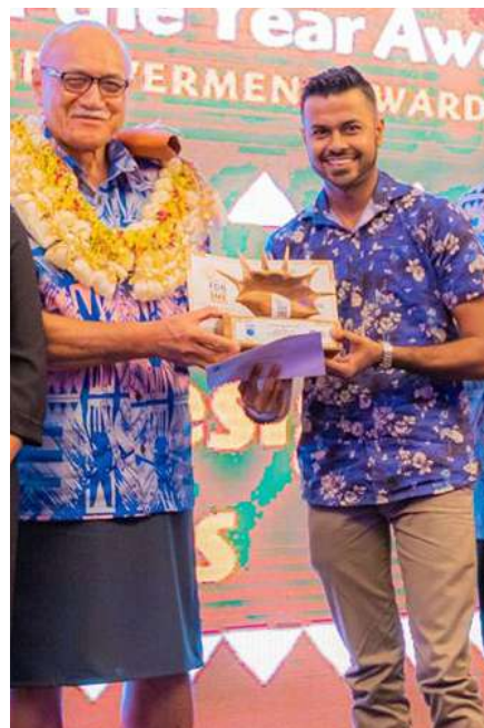
President, Major-General (Ret'd) Jioji Konrote with the Rookie of the year awardee.

Another category focused on empowerment where the Rookie Youth Entrepreneur of the Year was awarded to Indulge Designer Cakes, Youth Entrepreneur of the Year awarded to Ace Kava Exporters and the Woman Entrepreneur of the Year, which was sponsored by Ministry of Women, Children and Poverty Alleviation, awarded to Vines Travels Financial Enterprise.