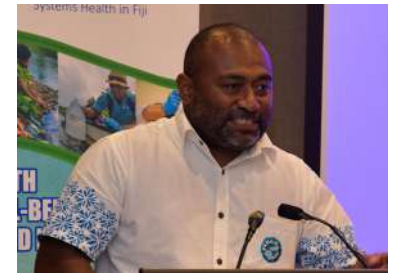
Minister for Health and Medical Services Dr ifereimi Waqainabete during the WISH Fiji Project Overview.