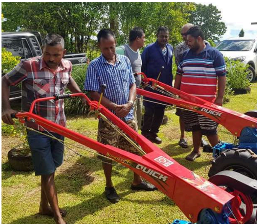
Oira na dauteitei era vakatovolea na misini ni cuki.

Sa dolava talega ena siga oya o PM Bainimarama edua na ECE Ablution Block, dua na vanua ni wilivola, dua na computer lab, dua na rumu ni qasenivuli, dua na valeni volavola, vakabai wavoki na koronivuli, ka dua talega na vanua ni taubale voun simedtaki ka ruru-gu vinaka nodra na gonevuli.