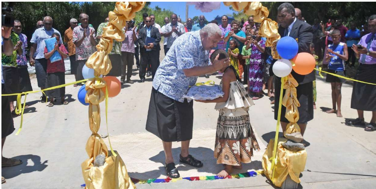
Prime Minister Voreqe Bainimarama during the official opening of the foot crossing at Emuri Village in Nadroga.

Minister Waqainabete relayed to those present at the celebration that Prime Minister Voreqe Bainimarama was always concerned about the nurses and had told him to look after them including having places open for new graduates.