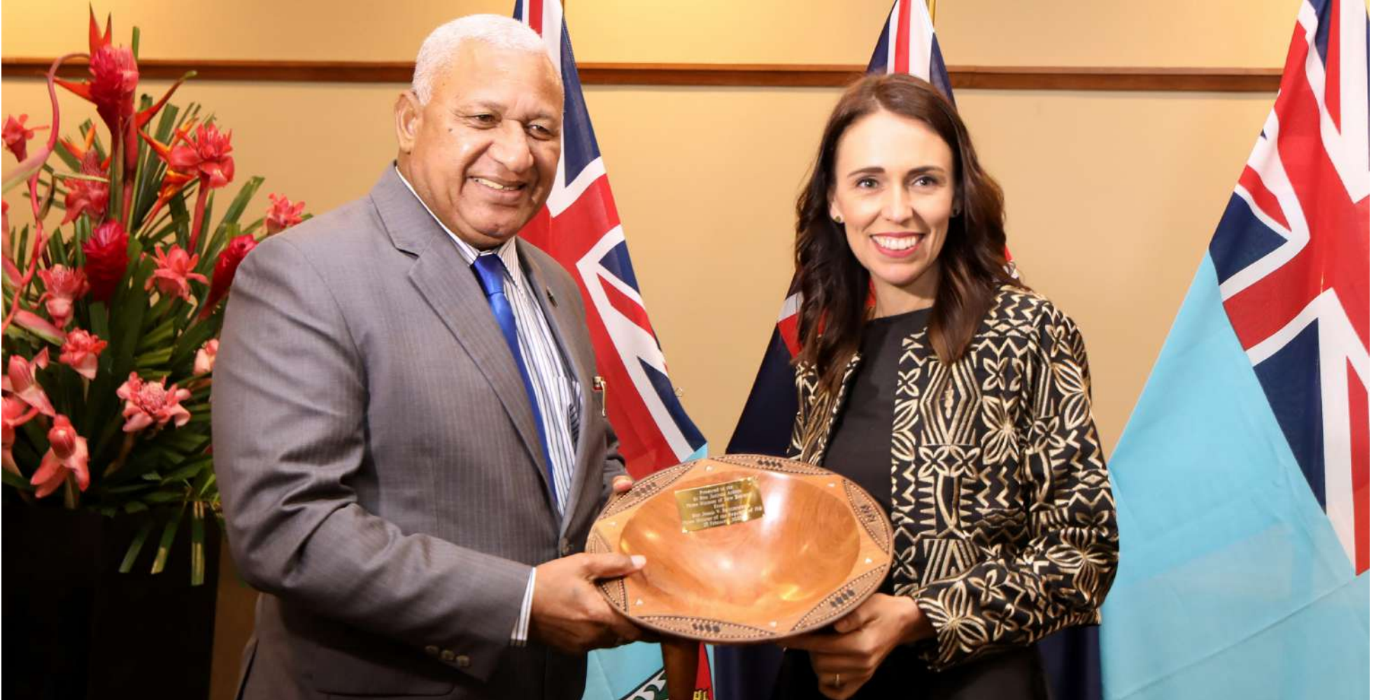
प्रधान मंत्री वॉरेनो बड़निमारामा, निउज़ीलैंड की प्रधान मंत्री जेसिंडा आडन को फीजी के उनके दौर पर उपहार प्रदान करते हुए