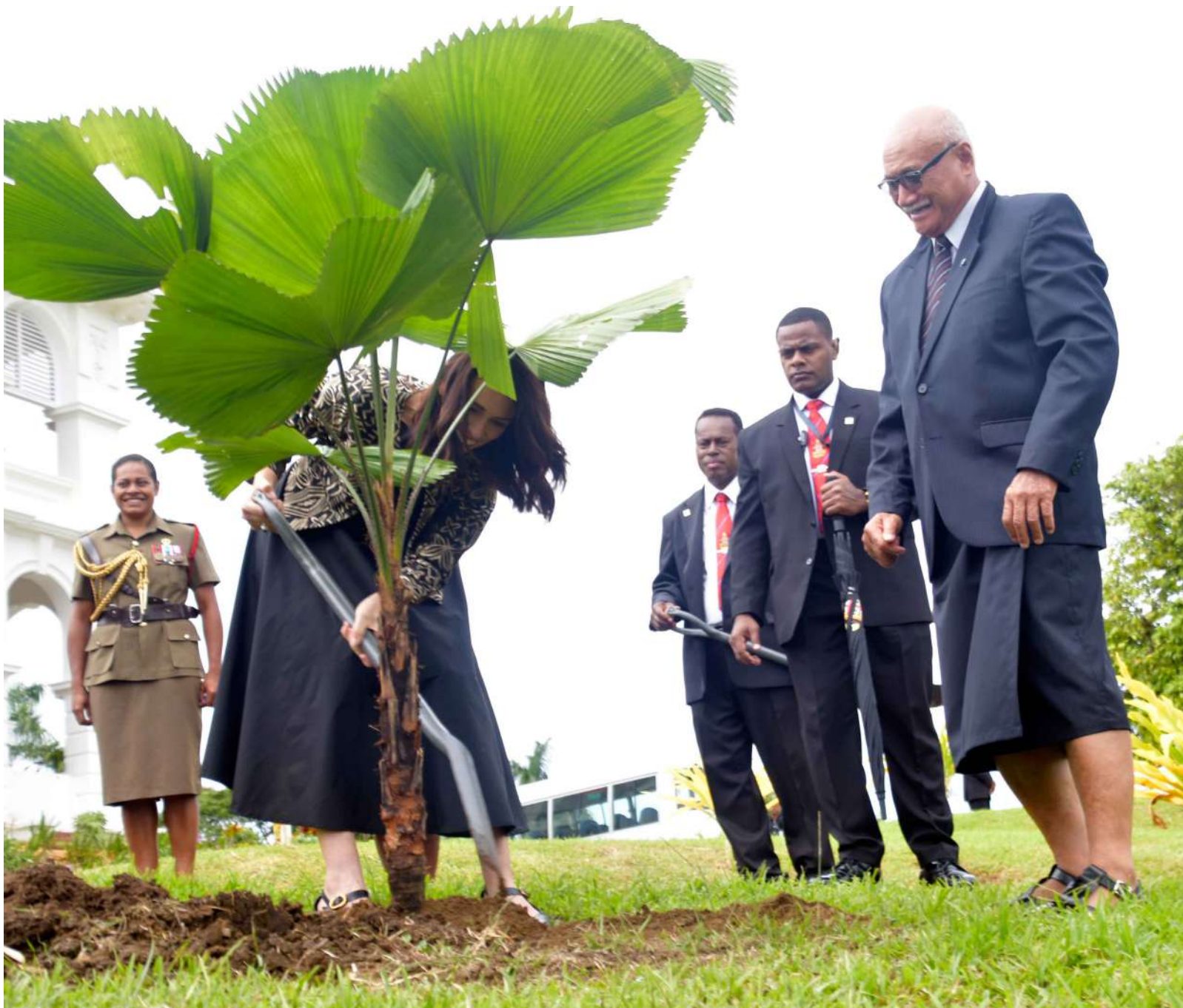
New Zealand Prime Minister Jacinda Ardern plants a tree as President Major-General (Ret'd) Jioji Konrote looks at the State House grounds.

"Fiji should be proud that, at twenty percent, its rate of women's representation is the highest in the Pacific. Supporting growth in this representation across the region is a priority for New Zealand."