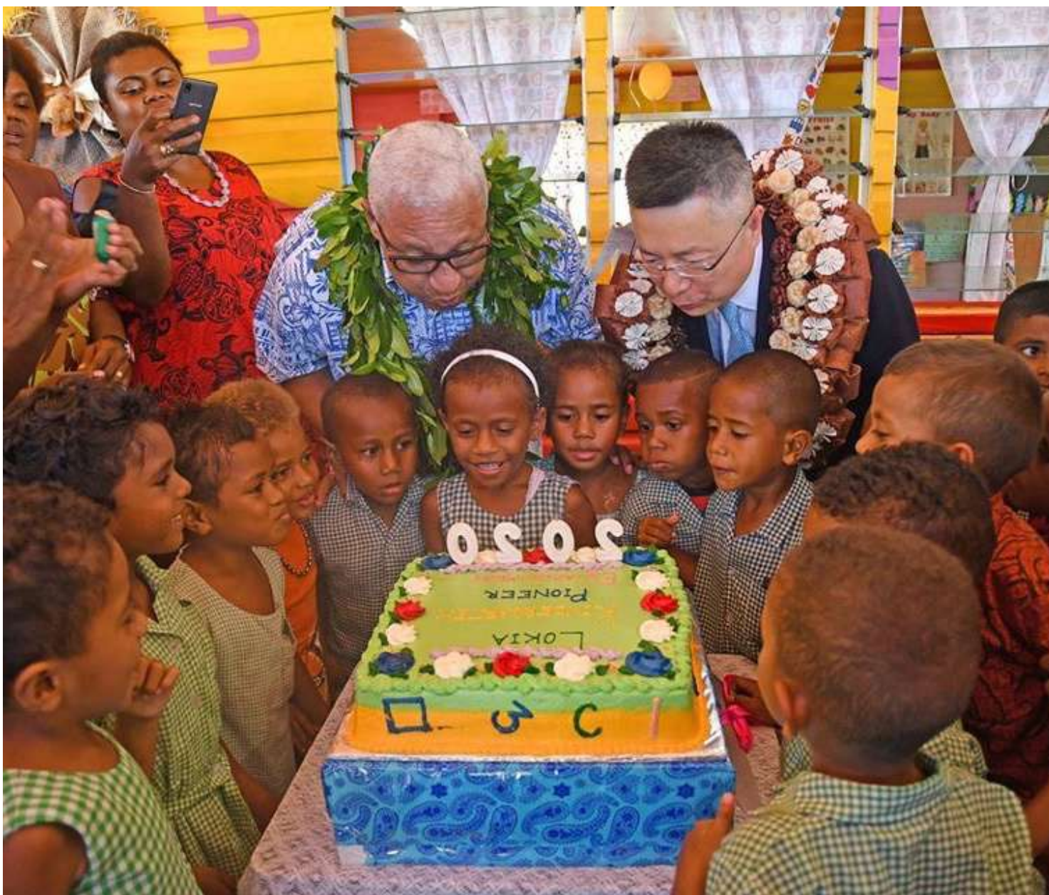
Prime Minister Voreqe Bainimarama and Ambassador of the People's Republic of China to Fiji, Qian Bo with Lokia Village Kindergarten students.

“Fijians who love this game, who love their country and who are proving – one win at a time – they deserve to rank among the greatest women’s rugby players on Earth.”