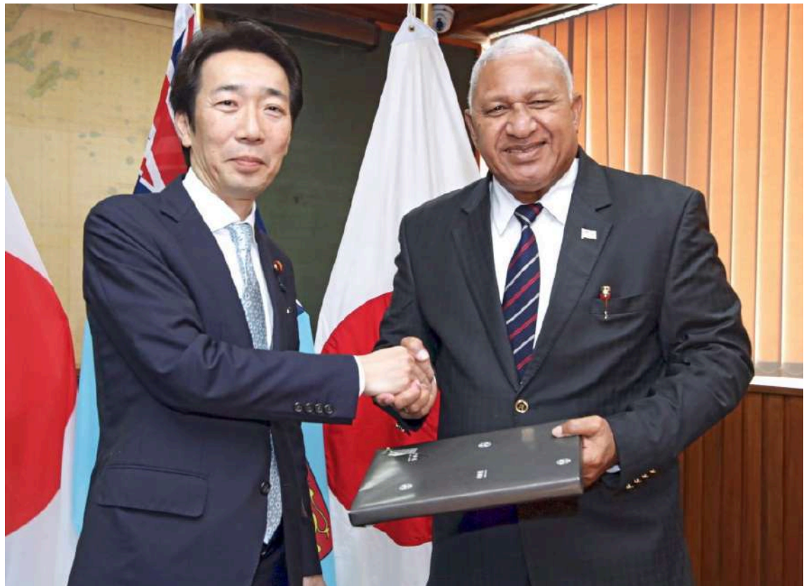
प्रधान मंत्री वीरेनो बडनिमारामा जापान के विदेश मामलों के लिए पालियामेन्ट्री वाईस मिनिस्टा नाकायामा नोरिहो से मुलाकात करते हुए

औ सी हईच आई, युनायटेड नईशन्स सेक्रेटेरियट का भाग है।