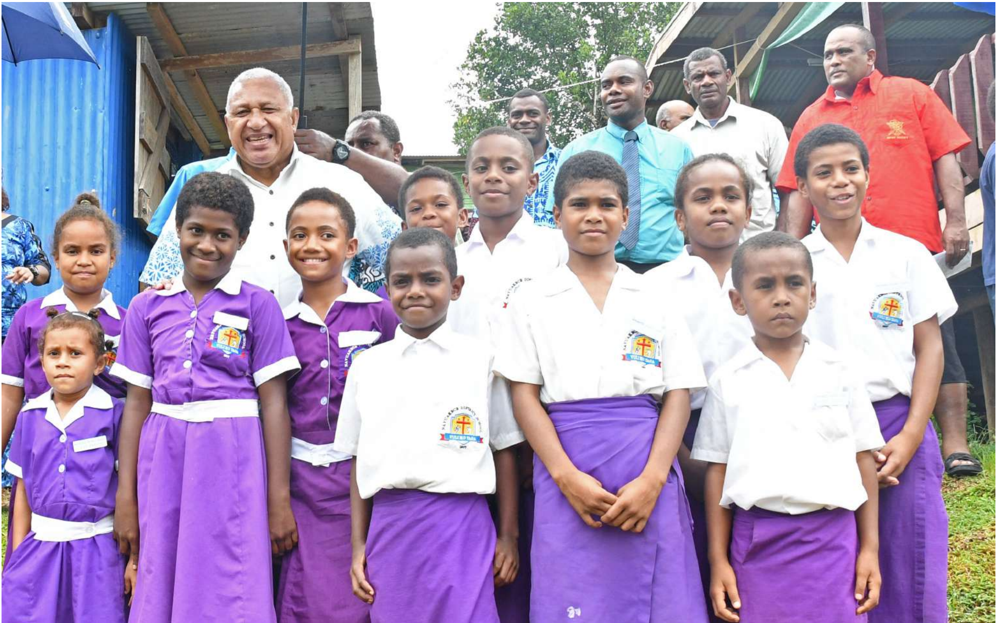
Prime Minister Voreqe Bainimarama with Navuakece Primary School students during the opening of the school's teacher's quarters on Monday.