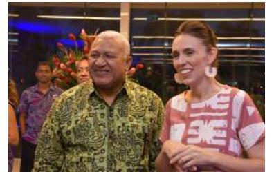
Prime Minister Voreqe Bainimarama with his New Zealand counterpart Jacinda Ardern at Grand Pacific Hotel in Suva.

PM Ardern acknowledged the work of the Ministry of Women, Children and Poverty Alleviation and highlighted that she looks forward to more partnership that will support the role of the Ministry as the Fijian Government's core policy coordinating unit for promoting gender equality in Fiji and will contribute to the development of the National Action Plan.