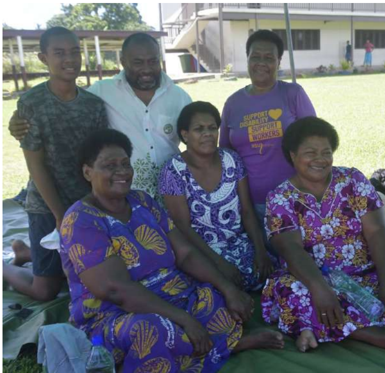
Minister for Health and Medical Services Dr Ifereimi Waqainabete with staff nurses during the International Year of Nurses and Midwives at Nausori Primary School last week.

Minister Waqainabete also emphasised the importance of look-