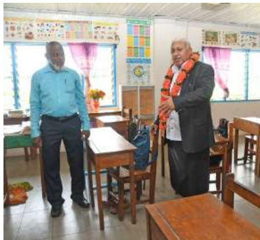
Duri tu ena loma ni dua na vale ni vuli vou ni koronivuli ko Paraimisita Josaia Voreqe Bainimarama e Veisaru Sanatana Dharam School e Ba.