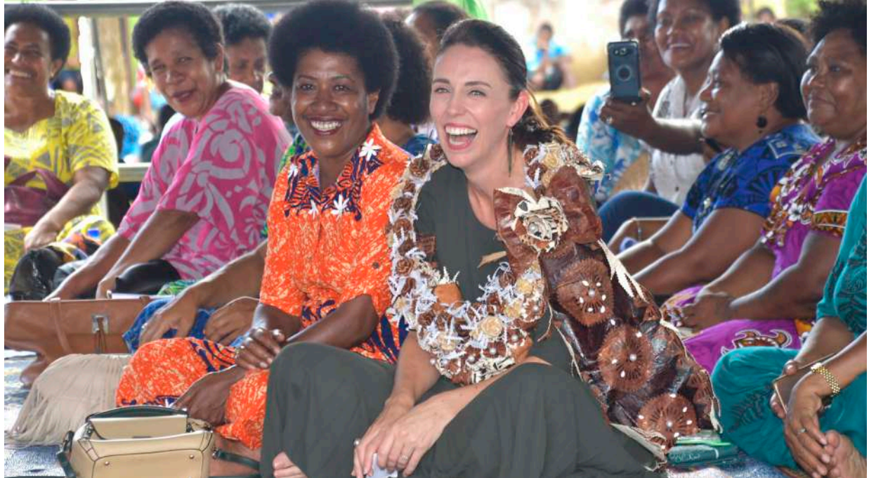
निउज़ीलैंड की प्रधान मंत्री जेसिंडा आडन तामावुवा-ई-वाई में राईस प्रोजेक्ट के शिलारोपन के दौरान वहाँ के लोगों के साथ