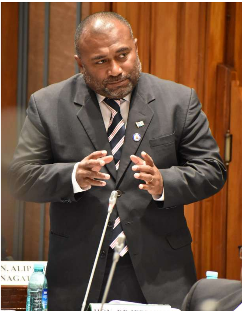
Minister for Health and Medical Services Dr Ifereimi Waqainabete during the recent parliament sitting.