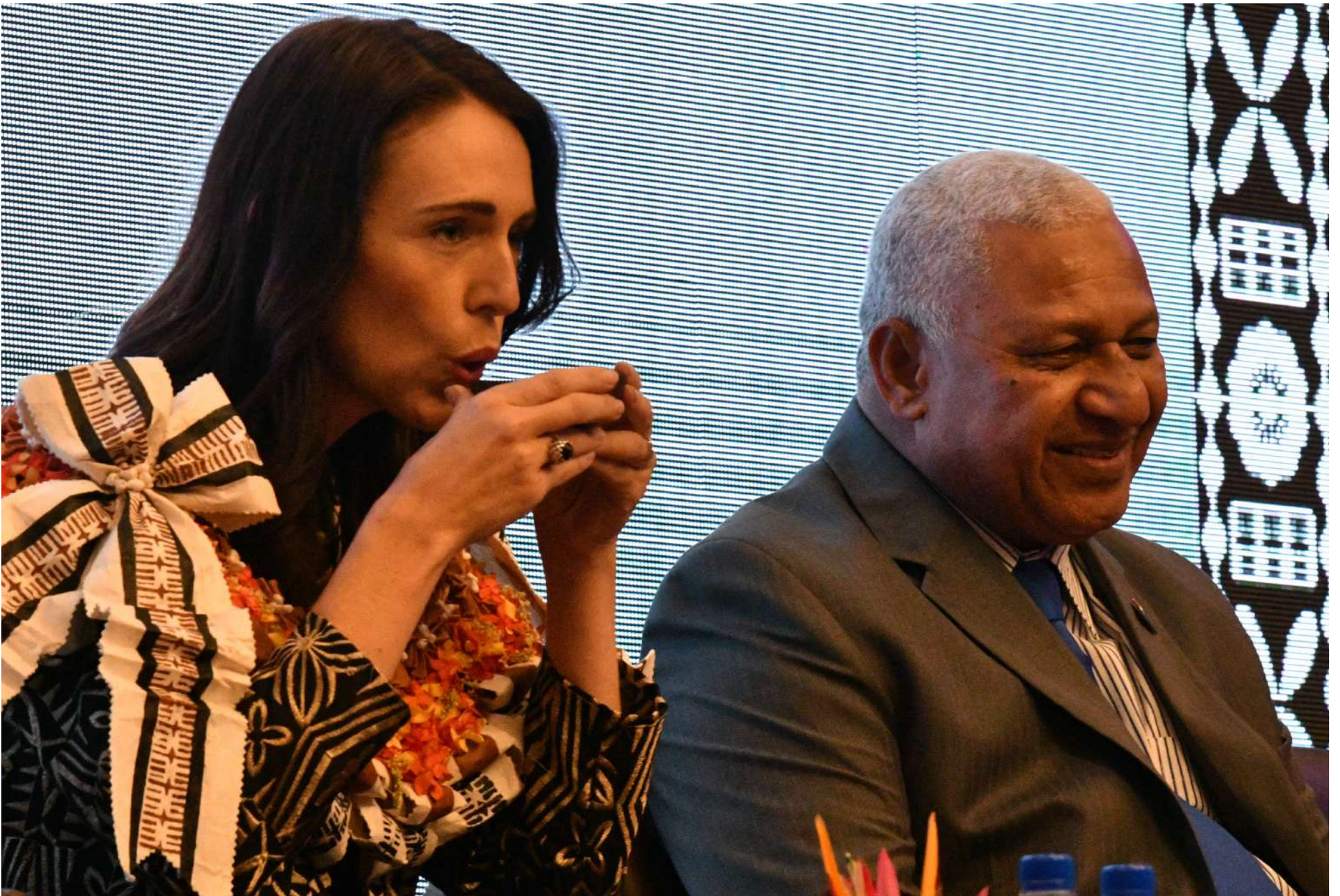
E gunuva toka oqori na yaqona vakaturaga na marama Paraiminisita e Niusiladi ko Jacinda Ardern ena nona kidavaki vakavanua e na Grand Pacific Hotel, Suva ena macawa sa oti. E siga tolu na nona veisiko voli ko PM Ardern ena noda vanua.