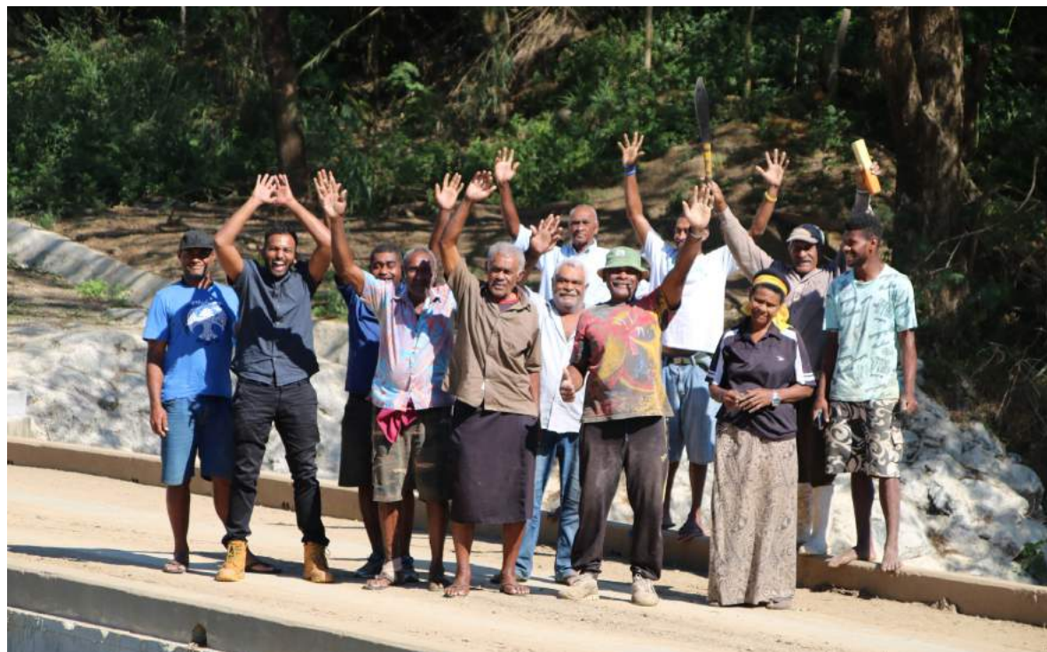
Emuri villagers on the new crossing.

“But this new crossing has completely transformed all our lives by reducing the burden of waiting for flood waters to recede, especially during emergencies such as getting the sick to the health centres. Now children can attend school and men and women are able to engage in their productive activities