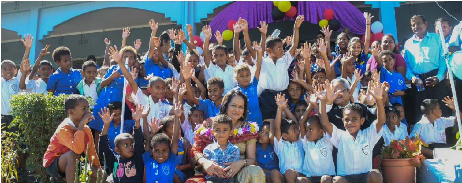
While it has taken more than two years to rebuild close to 250 schools damaged by Tropical Cyclone Winston in 2016, Government is ensuring that these schools are built to withstand cyclones of similar strength to TC Winston which was a Category 5 – the highest in the scale of cyclone measurements. PICTURED: Minister for Education Rosy Akbar with students of Penang Sangam Primary after the reopening of the school.