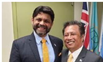
Aiyaz Sayed-Khaiyum (@FijiAG)

At @FijiMissionUN, it was great to see my Pacific brother and fellow climate champion, Palau's President @TommyRemengesau. As Small Island States, we're family—and as family, we can find the required economies of scale (which we lack alone) to achieve #SustainableDevelopment