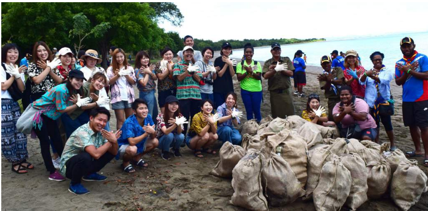
Japanese passengers of The Peace Boat with Fijian youths after a clean-up campaign at Lomolomo Beach in Lautoka.