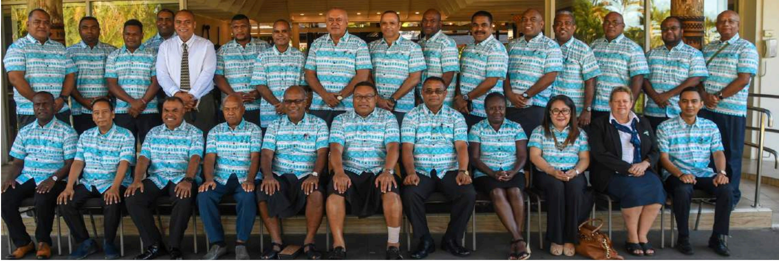
मेलानिज़ियन स्पियाहेड ग्रुप (MSG) की तीसरी क्षेत्रीय सभा में भाग लेने वाले विभिन्न देशों के प्रतिनिधि।