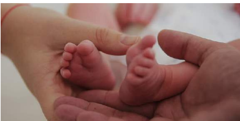
फीजी में नवजात शिशुओं में बीमारी की दर ज्यादा है।