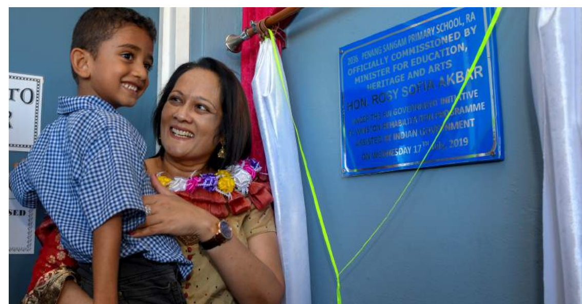
Minister for Education Rosy Akbar with a student of Penang Sangam Primary after the reopening.

"To date, over $240m has been spent by the Government for rehabilitation works in our schools with over 400 new buildings