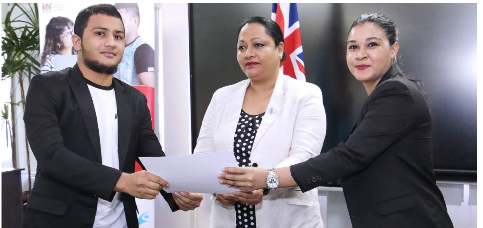
Minister for Industry, Trade and Tourism, Premila Kumar hands over the National Export Strategy grant to buy new machinery staff of Zonah United.

rent operations, said Zonah United does its own small scale processing but to meet the basic international standard it will need the machinery so now they will be doing their own packaging, grinding and filling for “retail package of agricultural products that is going onto the shelves in markets overseas”.