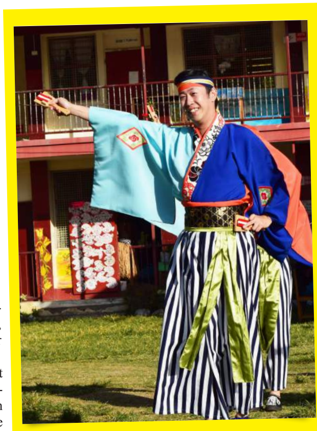
A Japanese youth performs a traditional Japanese dance called 'Yosakoi' at Saint Thomas Primary School in Lautoka.