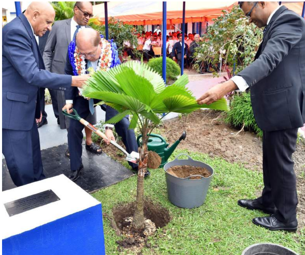
Secretary-General for the International Maritime Organization (IMO), Kitack Lim plants a tree at the Fiji Maritime Academy.

“These efforts are very important for Fiji and other Pacific Island countries as our future depends on adapting and mitigating the impact of