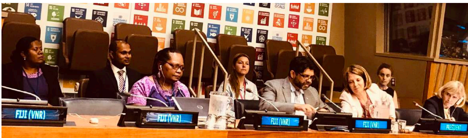
Attorney-General Aiyaz Sayed-Khaiyum during the High Level Political Forum at the UN Headquarters.

Contacts: Suva: 3301806 / West: 6700086 / 9905965 North: 8811276 / 9905971 Fax: 3305139/3304663 news@govnet.gov.fj @FijianGovt Fijian Government visit us at www.fiji.gov.fj