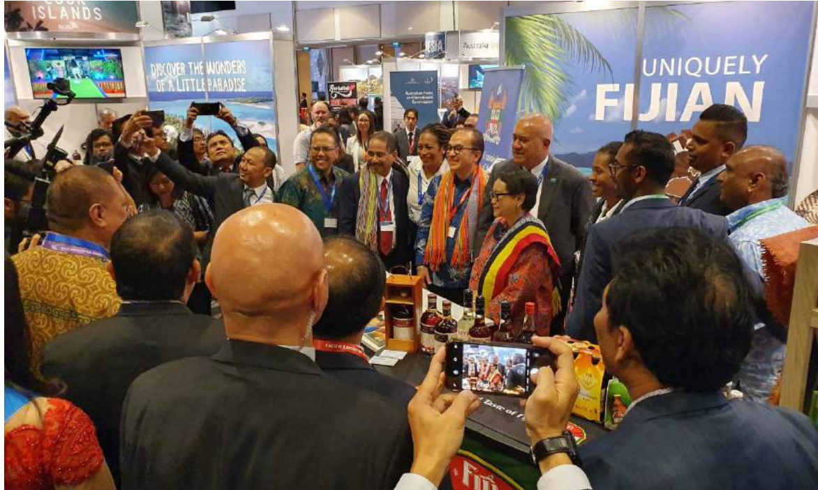
Permanent Secretary for Foreign Affairs Ioane Naivalurua at the Pacific Exposition 2019 in Auckland, New Zealand.

He said that such events enabled the Fijian Government to position itself as an important stakeholder in exploring untapped potential with