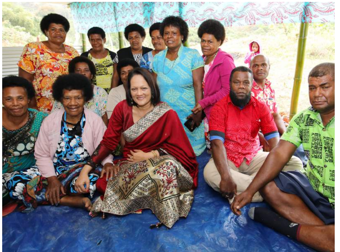
Minister for Education, Heritage and Arts Rosy Akbar with Nailuva villagers in Ra.

“Indeed these books are beautiful, fun, colorful, well researched, fiction/non-fiction, color coded and graded by its reading level or age and the exercises at each levels are loaded into FEMIS for students to access,” she added.