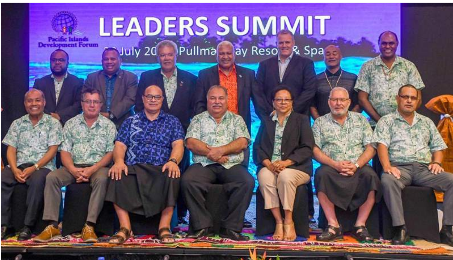
Prime Minister Voreqe Bainimarama with Pacific leaders during the Pacific Islands Development Forum (PIDF) in Nadi yesterday.

“There must be a national program that effectively and positively prepares our future generations to take our country to great levels of prosperity.”