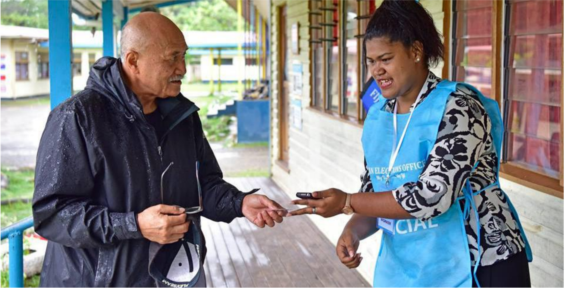
राष्ट्रपति, महामोम चियोची कोनरोते ने आम चुनाव के लिए अपना मत दिया। इस दौरान उन्होंने चुनाव अधिकारियों तथा मतदाताओं से मुलाकात भी की।