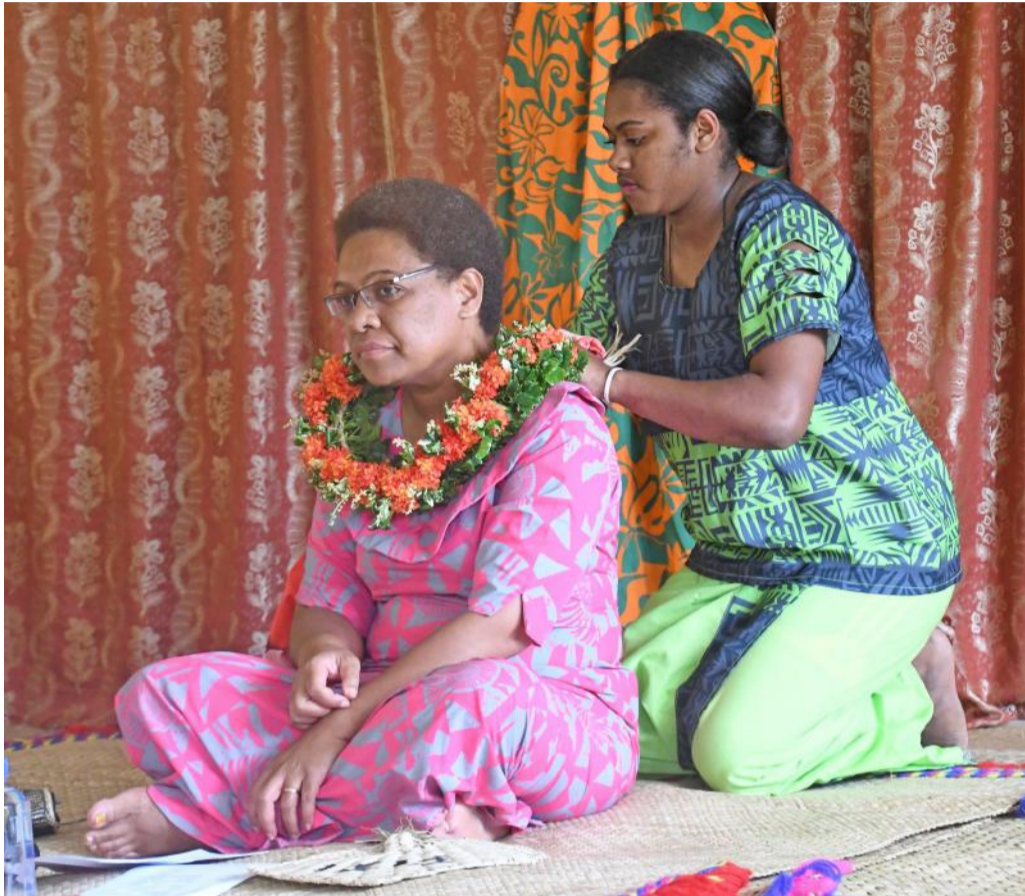
Minister for Women, Children and Poverty Alleviation, Mereseini Vuniwaqa at the opening of the Veinuqa Women's Group's extension centre in Namalata District, Tailevu.

“How things are done in the settlements and,