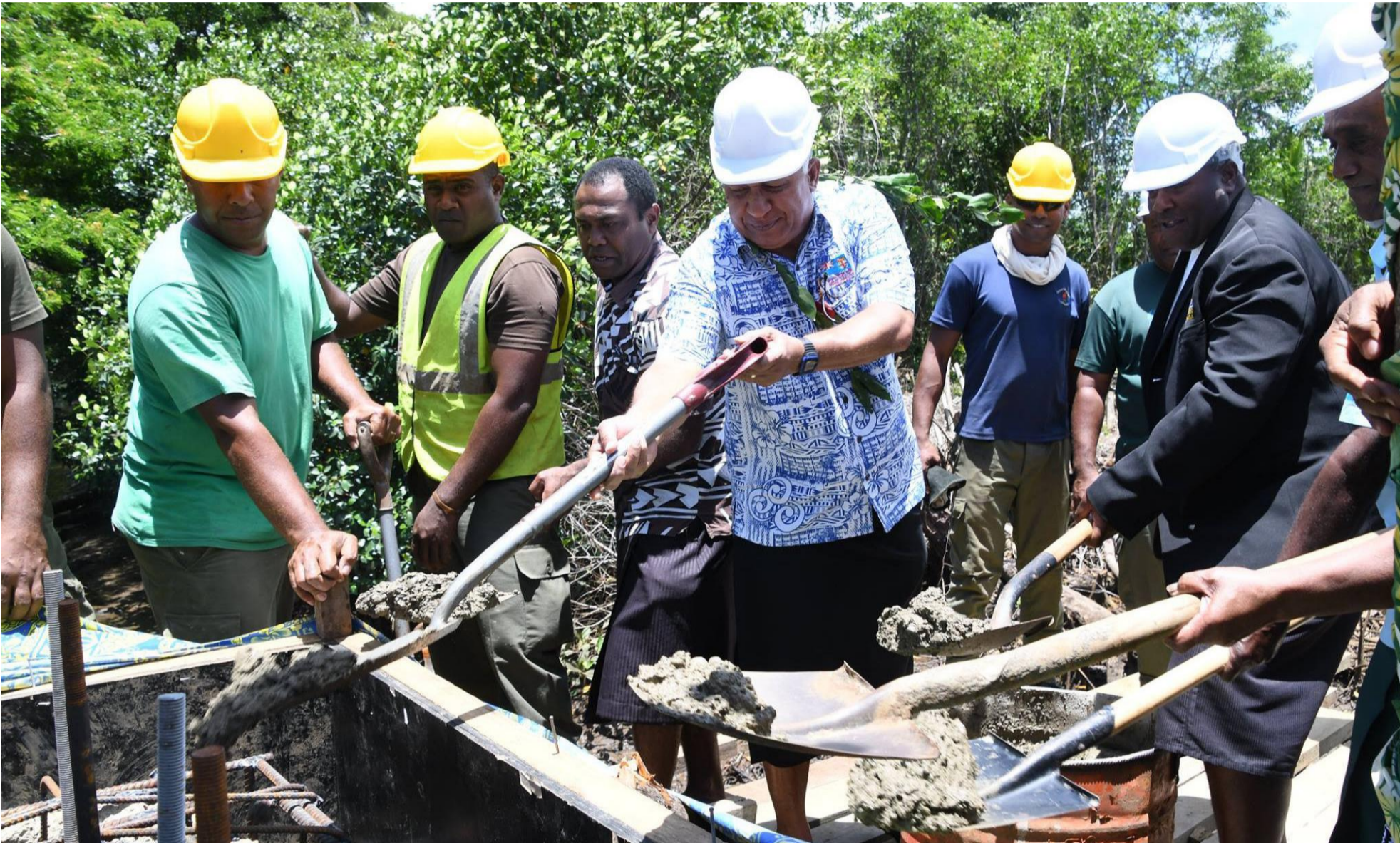
Sa vakasobura tiko oqo na duru ni ikawakawa ko Paraiminista Voreqe Bainimarama kei ira na lewe ni koro e Tobuniquio.