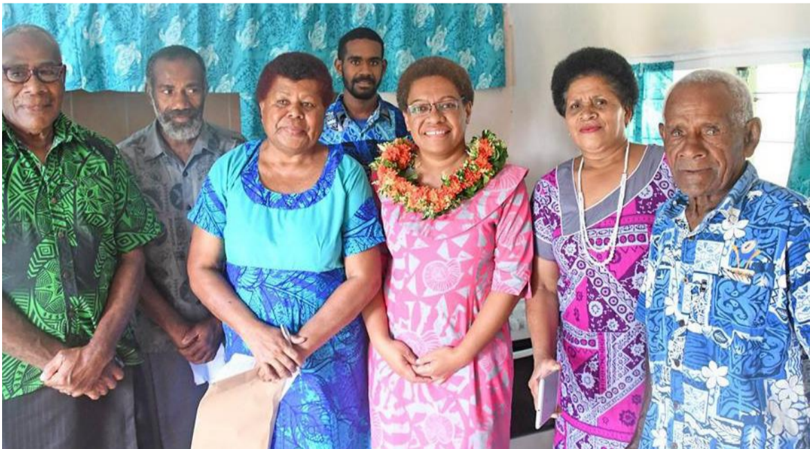
Minister for Women, Children and Poverty Alleviation, Mereseini Vuniwaqa with Veinuqa villagers in Tailevu.

“I know that women need the support of men in all their projects. With so many men in the village hall today it's telling me that the support of men in women's project in this village is strong.”