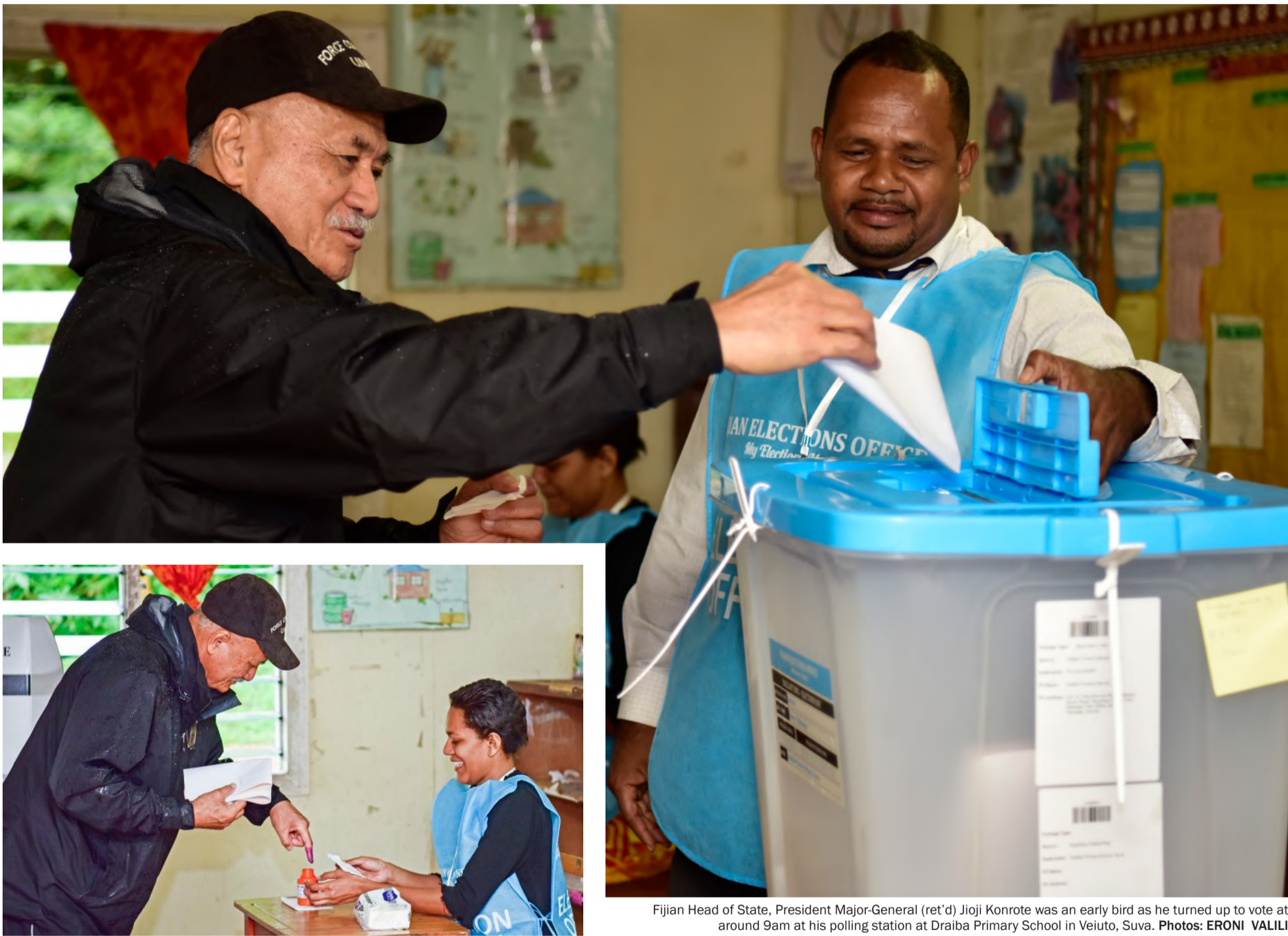
Fijian Head of State, President Major-General (ret'd) Jioji Konrote was an early bird as he turned up to vote at around 9am at his polling station at Draiba Primary School in Veiuto, Suva.