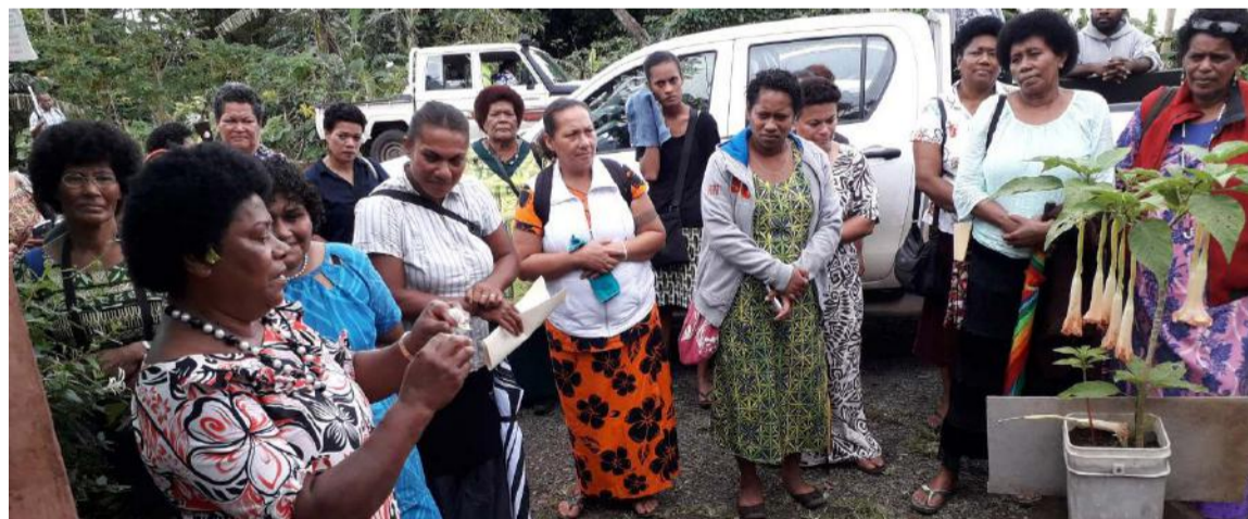
Women of Taveuni undergoing Floriculture training conducted by the Ministry of Agriculture.

ed by the Farm Management Unit of the Ministry, taught the women various aspects such as landscaping, flower arrangements, varieties and names, management and multiplications.