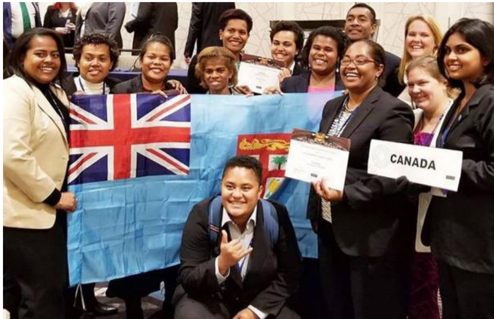
Fiji's Model UN representative with Ministry of Youth and Sports officials at Washington DC, USA.

"I was so impressed by the talent of these