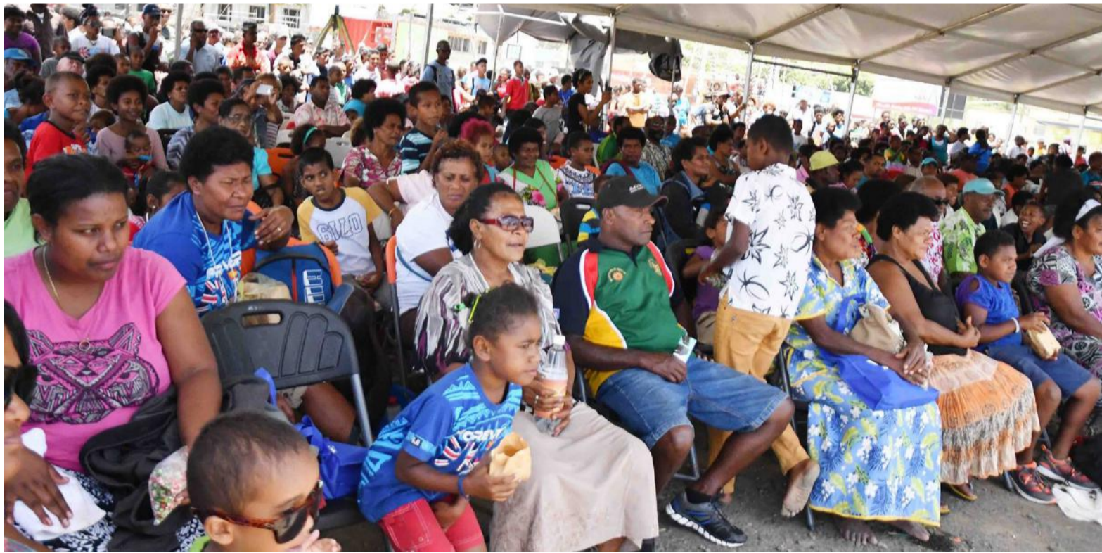
Members of the public turn up in numbers at the launch of WiFi hotspot at Rakiraki Town.

The $132,000 concrete walkway, steps and culvert project is currently being constructed by the Republic of Fiji Military Forces (RFMF) engineers and is expected to be completed by early January next year.