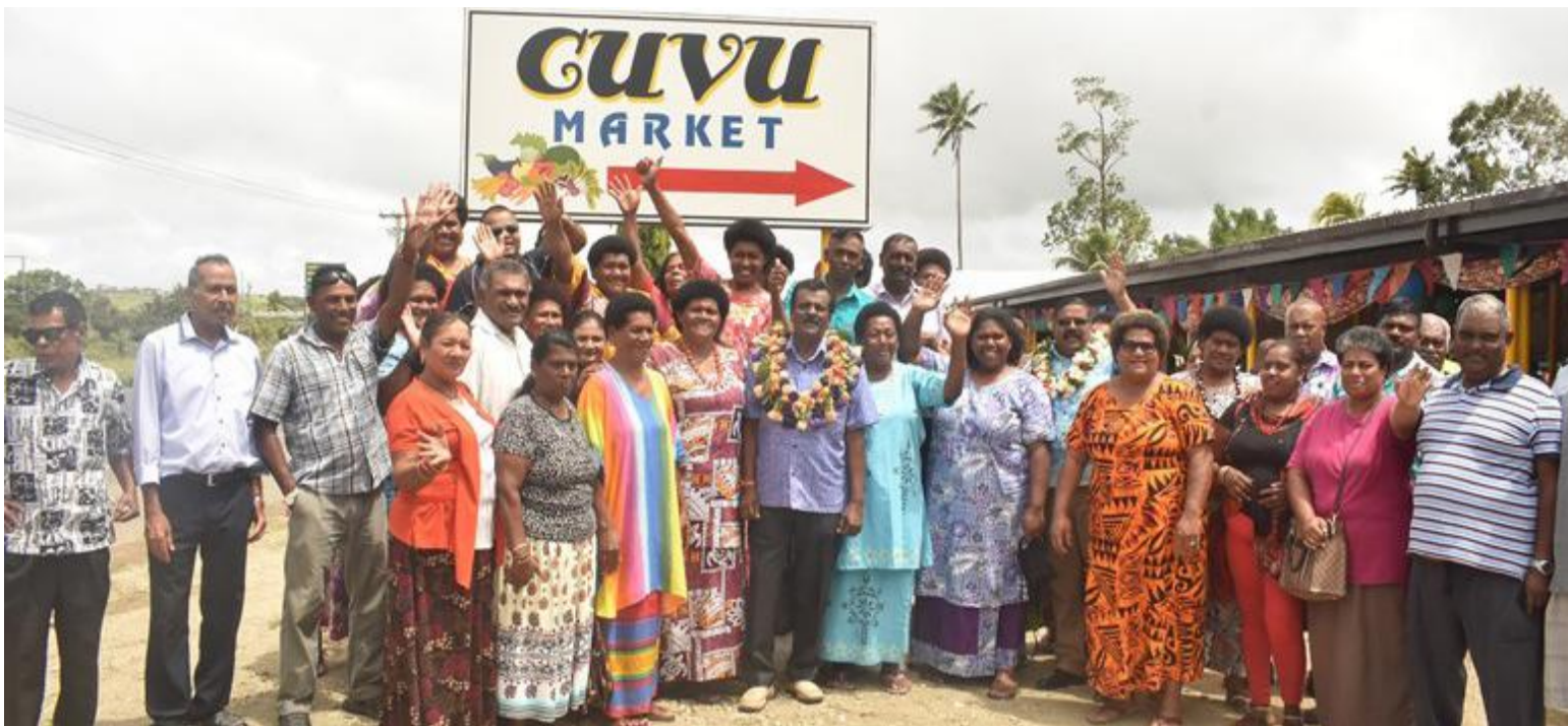
Minister for Local Government, Housing and Community Development, Parveen Kumar with market vendors celebrate the opening of the new market at Cuvu, Sigatoka.