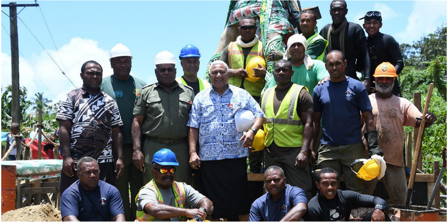
Prime Minister Voreqe Bainimarama with villagers of Tobunio village after the footbridge ground-breaking ceremony in Tailevu.

“When there is heavy rain it leaves the road in a horrible condition that the buses are unable to drive in. The students than use the crossing to come to Tobunio to catch the bus,” Mr Kedrayate said.