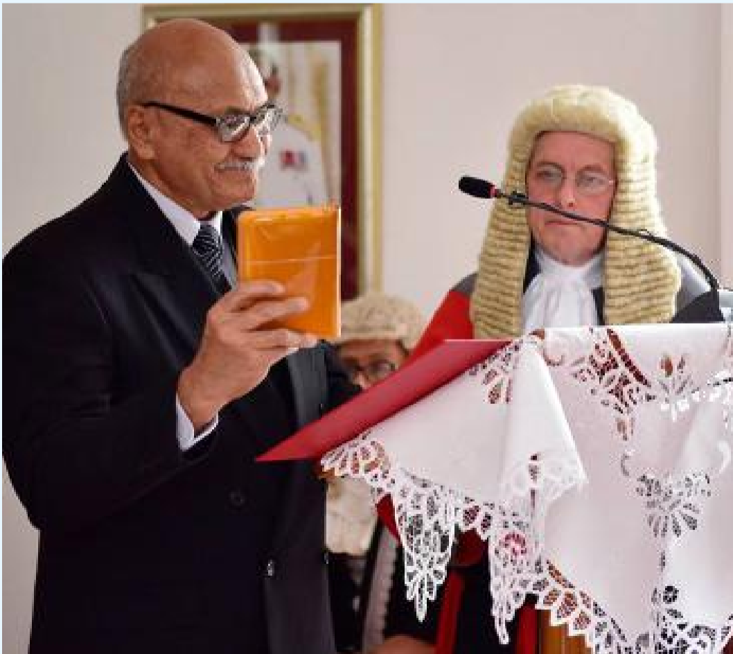
राष्ट्रपति, महामहीन चियोची कोनरोते अपने पद की दूसरी अवधि के लिए चीफ जस्टिस एन्थनी गैट्स के समक्ष शपथ लेते हुए।