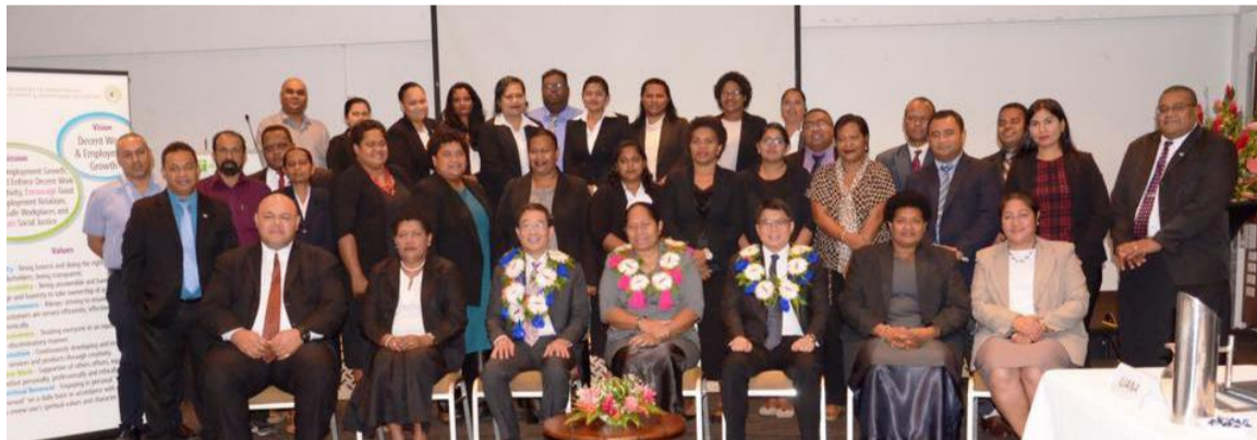
Ko ira na lewe 21 na dau ni vakameau ni Viti kei ira na kena qasenivuli ni Singapore Mediation Centre ena Holiday Inn e Suva.