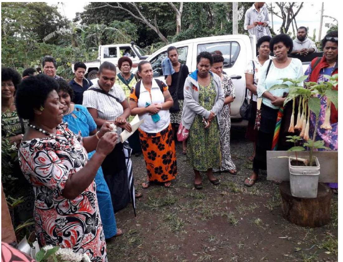
Ko ira na marama ni Taveuni ena gauna ni nodra vuli tei senikau kei na kena bisinisitaki.

“Na vuli tei senikau oqo sa vakarabailevutaka sara na noqu kila me baleta na bisinisi oqo e dina ni sa balavu toka noqu bisinisi tei senikau sa levu aka vou au mai vulica ena vuli oqo,” tukuna ko Marama.