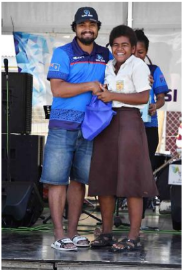
The WiFi launch drew large crowds as the Fijian Government accelerates efforts to harness more positive learning spaces.