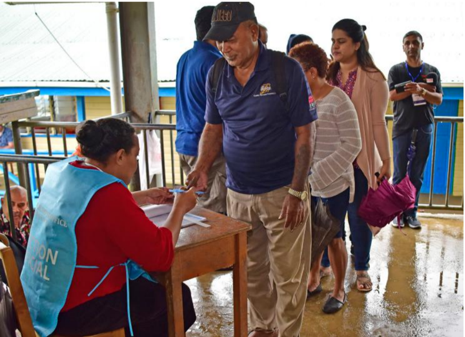
Voters line up at Draiba Primary School.