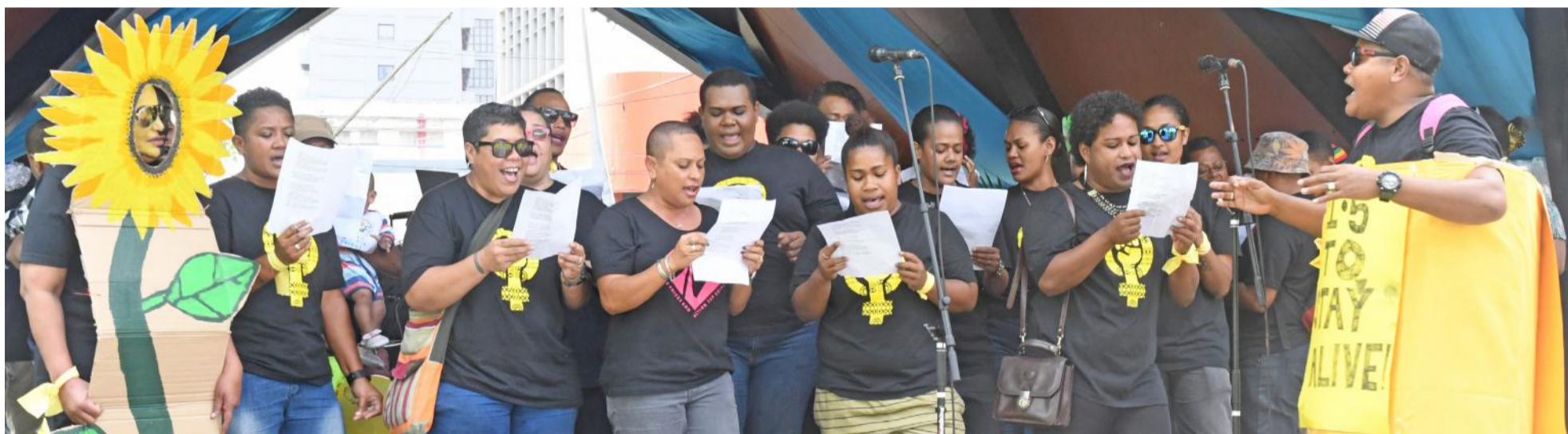
Young climate change advocates at the launch of the National Climate Day at Ratu Sukuna Park in Suva.

As she noted, the key to healthy islands is multi-sectoral and multidisciplinary action.