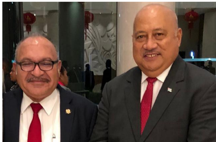
Minister for Defence and National Security, Ratu Inoke Kubuabola with Papua New Guinea Prime Minister Peter O'Neill at the Asia Pacific Economic Co-operation summit.