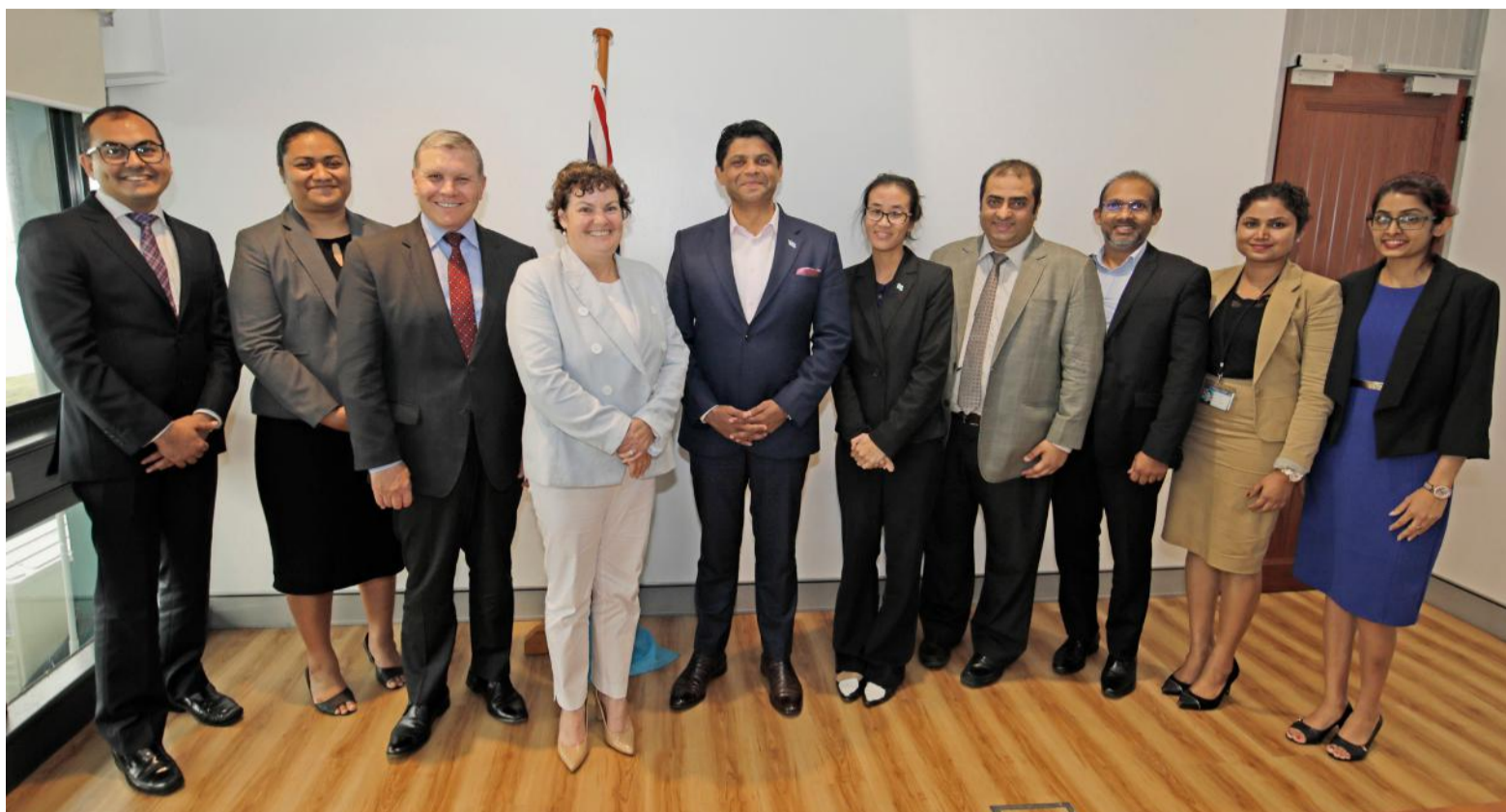
Attorney-General Aiyaz Sayed-Khaiyum and his team with the Aspen Medical Pty Limited officials.

Contacts: Suva: 3301806 / West: 6700086 / 9905965 North: 8811276 / 9905971 Fax: 3305139/3304663 news@govnet.gov.fj @FijiRepublic Fijian Government visit us at www.fiji.gov.fj