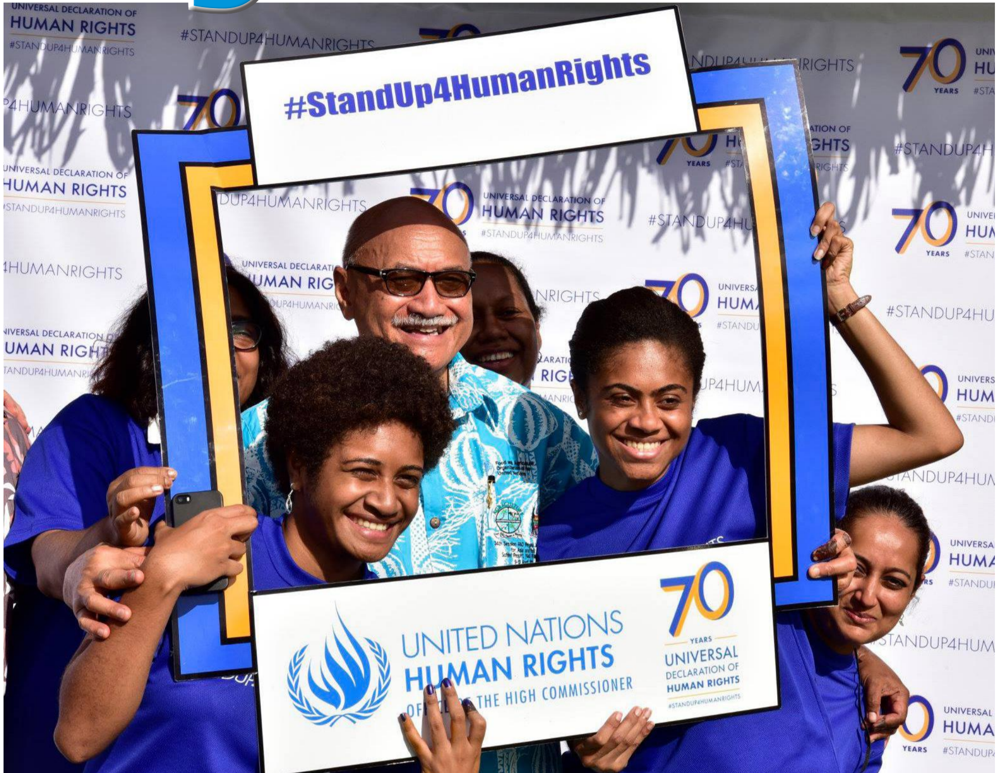
President Major-General (Ret'd) Jioji Konrote with University of the South Pacific (USP) students at the 70th Anniversary of the UN Universal Declaration of Human Rights in Suva.