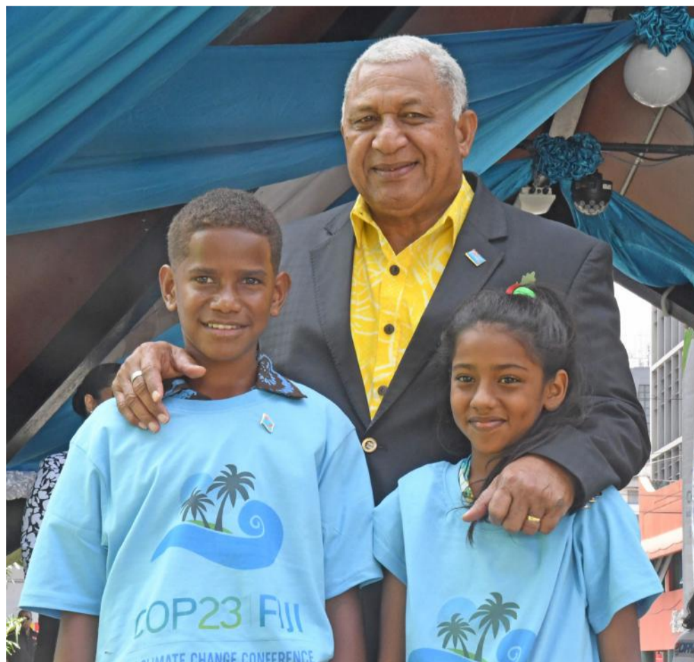
Prime Minister and 23rd session of Conference of Parties President Frank Bainimarama with COP23 youngest climate change advocates Timoci Gaunavinaka and Shalvi Sakshi at Ratu Sukuna Park in Suva.

Prime Minister Bainimarama added that Fiji should be proud for leading the way with the Marshall Islands, in becoming the first two nations to commit to raising Nationally Determined Contributions (NDCs) to reduce greenhouse gas emissions.