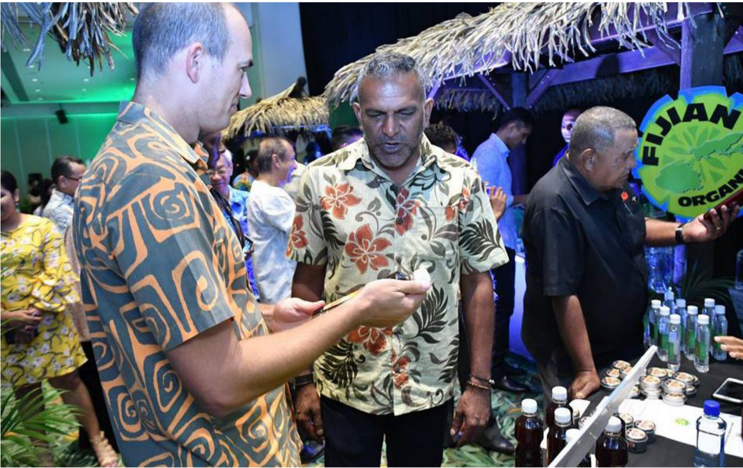
vakadikeva toka oqori na Minisita ni Veivoli Ko Faiyaz Koya na ivoli e buli ga e Viti ka kilai ena yaca Fijian made products.