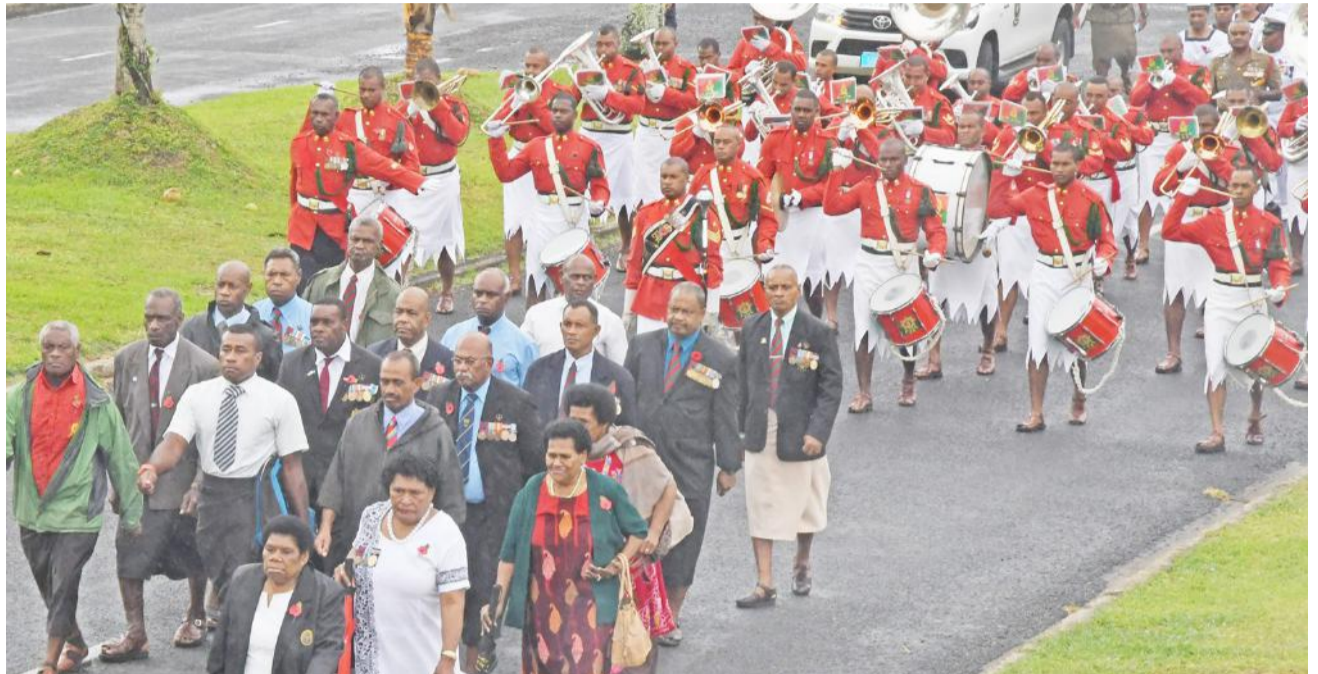
ग्यारह नवम्बर की तड़के सुबह सेना और फीजी पुलिस फोर्स ने स्मारक दिवस यानि रिमेमब्रन्स डे के मौके पर तड़के सुबह सैनिक कब्रिस्तान पर युद्ध में तथा शान्ति सेवा प्रदान करने के दौरान अपनी जान गंवा चुके सैनिकों की बहादुरी के प्रयासों को सम्मानित किया।