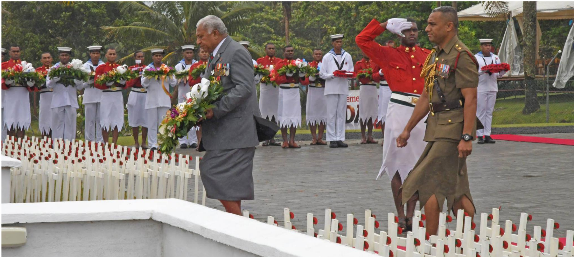
Prime Minister Voreqe Bainimarama lays a wreath to remember those soldiers who have passed on at the War Memorial site in Veiuoto.