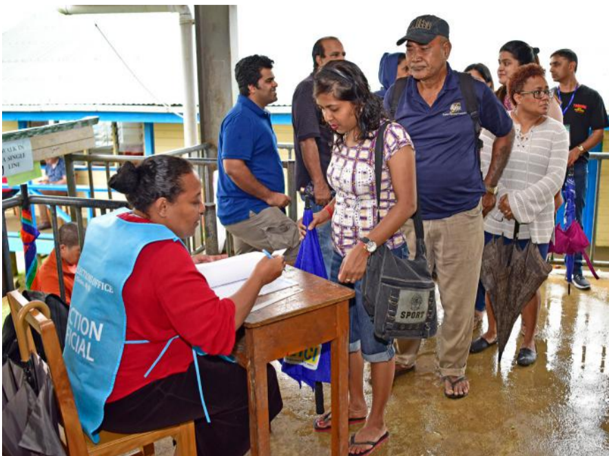
Voters at Draiba Primary School.