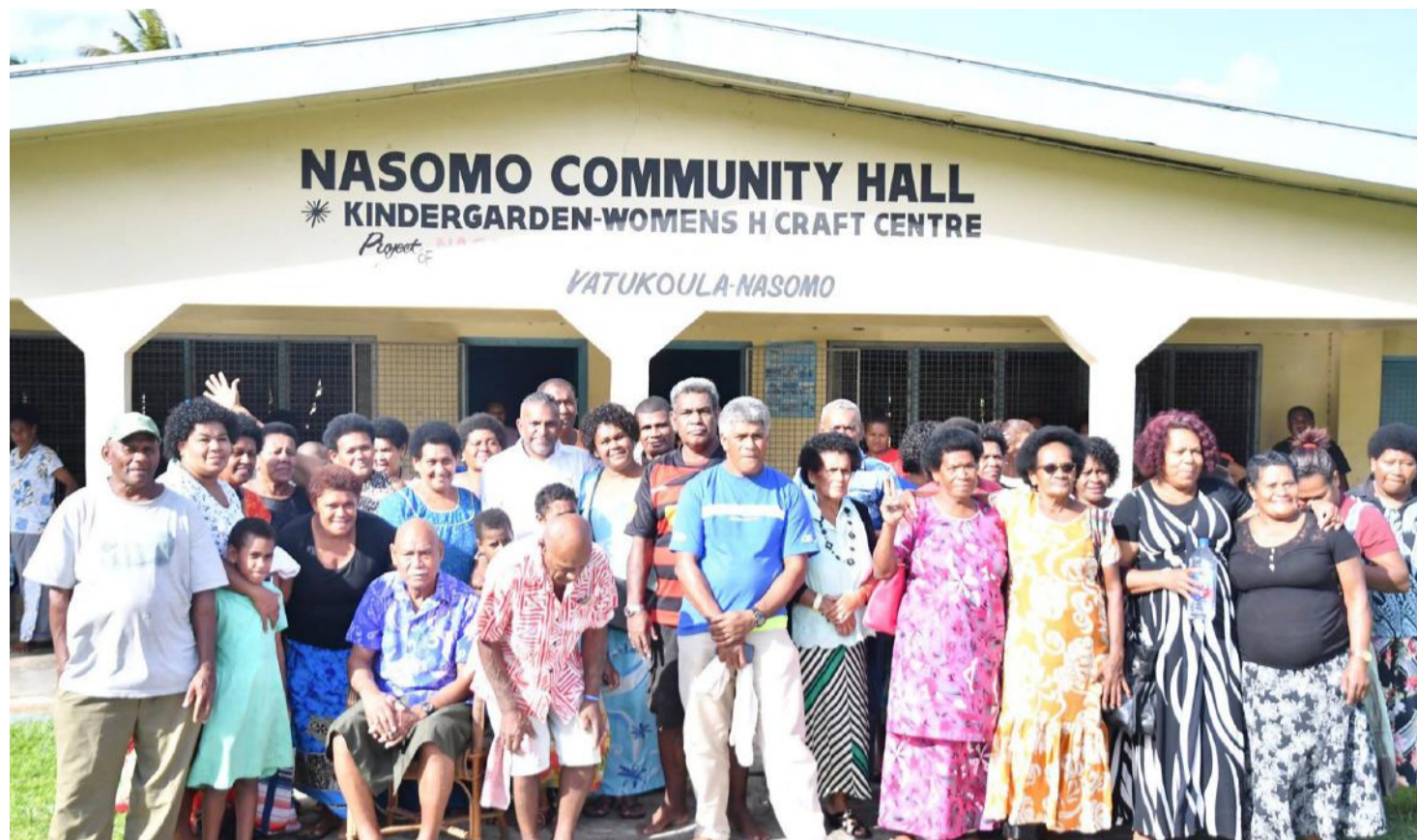
Minister for Lands and Mineral Resources, Faiyaz Koya after handing out cheques to 100 villagers at Nasomo Village, Vatukoula.

The share of royalty was for the Vatukoula Gold Mine Limited, which initially paid mining royalty to the Mineral Resources Department, and part of a series of payments that will depend on the company as it operates and continues to mine under Nasomo's land.