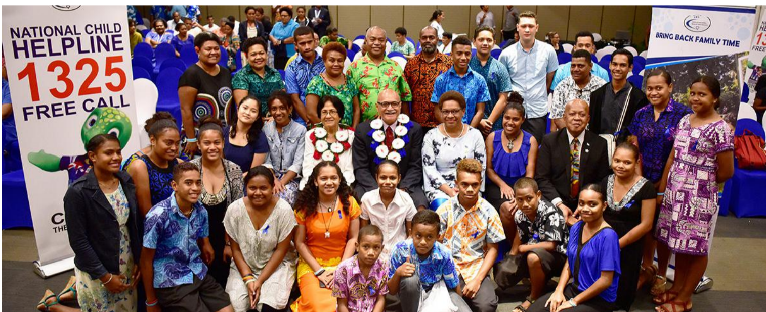
President Major-General (Ret'd) Jioji Konrote and Minister of Women, Children and Poverty Alleviation Mereseini Vuniwaqa with children during the launch of National Child Helpline - 1325.