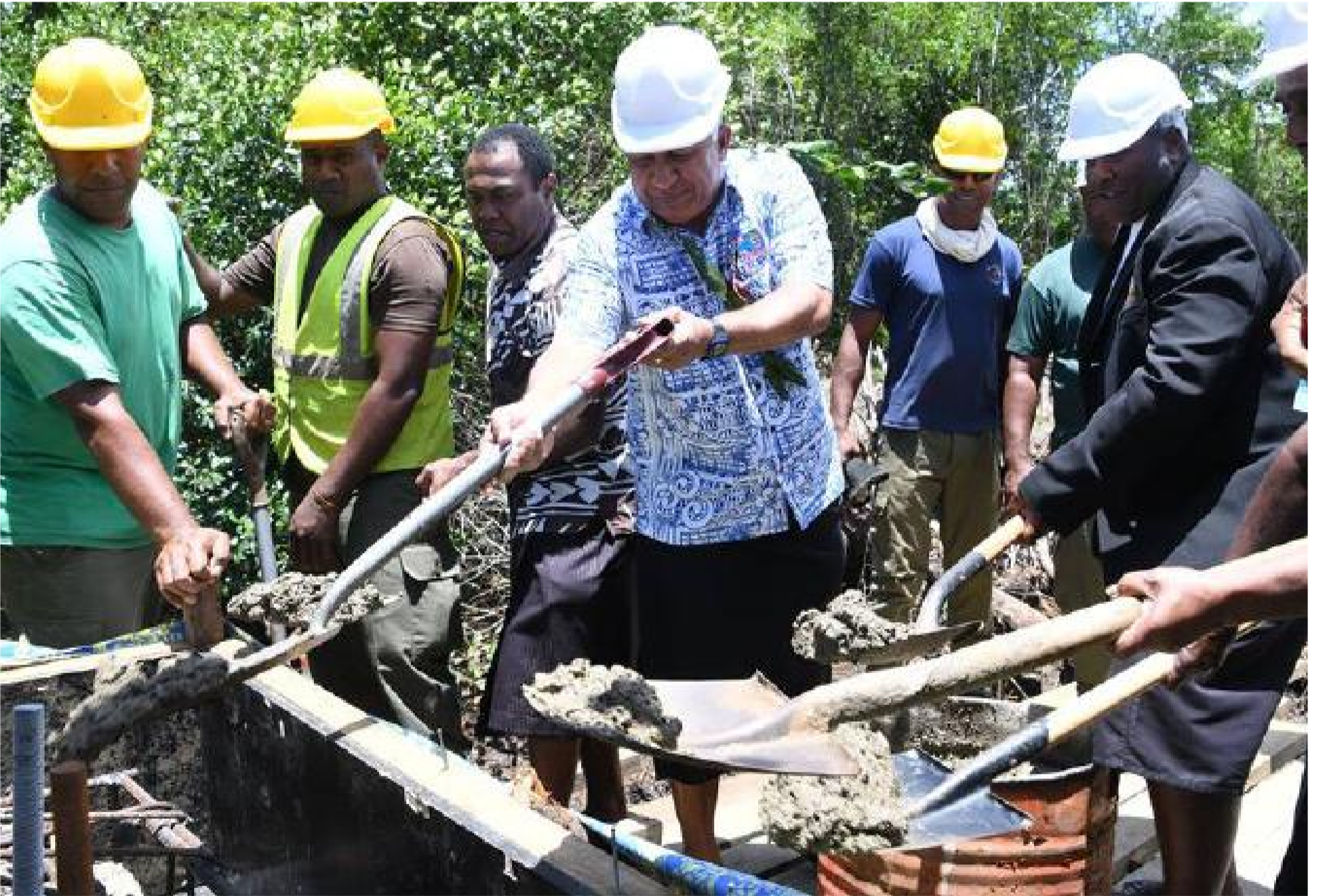
प्रधानमंत्री वॉरेनो बर्डनिमरामा हालही में तोम्बूनिगियो में पैदल चलने वाले एक पुल का न्यू डालते हुए। उनके अनुसार पुल बनने पर कई सौ की संख्या में लोग इसे इस्तेमाल करेंगे तथा कोरोवासी अपनी फसल बाज़ार लेजाकर बेच सकेंगे।