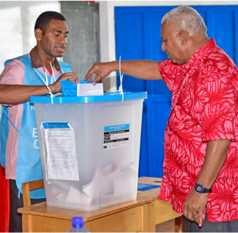
Prime Minister Voreqe Bainimarama casts his vote at Vatuwaqa Primary School.