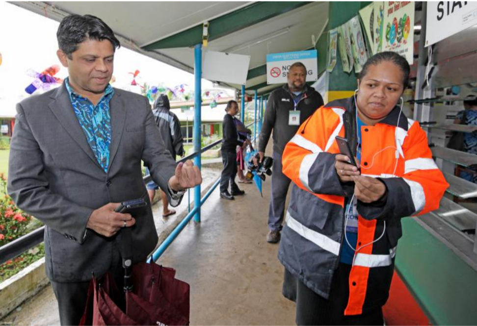
Attorney-General Aiyaz Sayed-Khaiyum after casting his vote at Suva Special School.