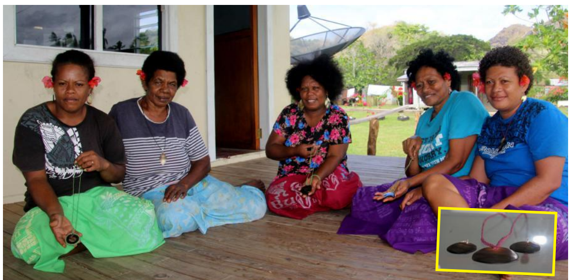
Members of the Navatudua Women's club with some of their handcraft.

“After this, it took a while to set-up again but we were not discouraged because we know that the funds collected from this activity is very important for our projects in the village.”