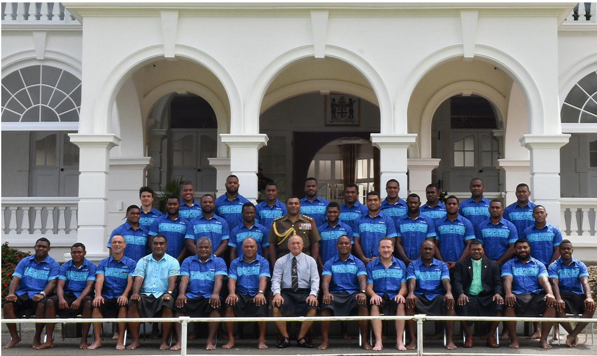
Fiji Airways Drua team with team officials after presenting the iTatau to President Major General (Ret'd) Jioji Konrote at the State House.