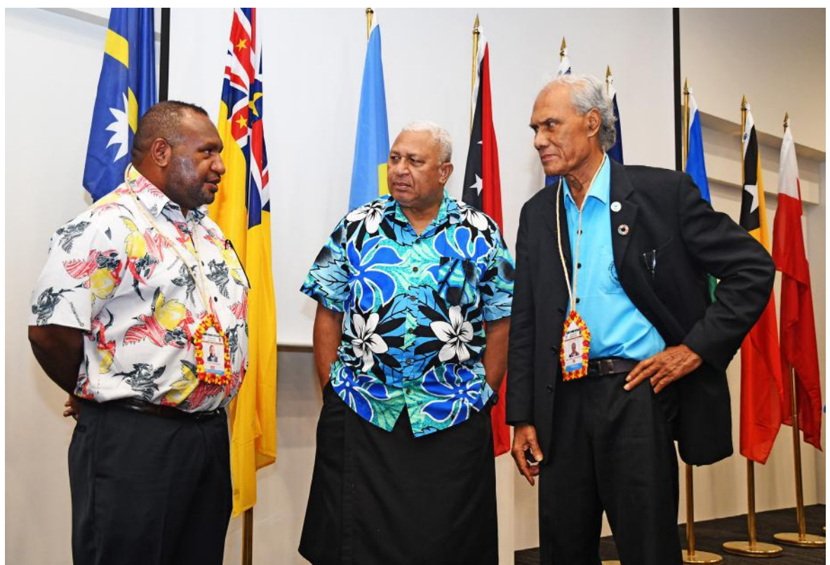
Prime Minister Voreqe Bainimarama (middle) with Papua New Guinea Prime Minister James Marape (left) and Tongan Prime Minister 'Akilisi Pohiva at the 50th Pacific Islands Forum in Funafuti, Tuvalu.

“If there is an opportunity for deep-sea mining, so long as it is