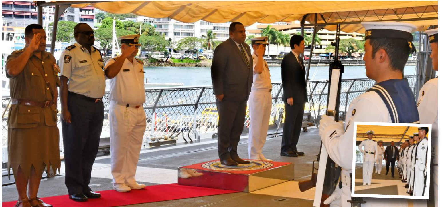
Minister for Defence, National Security and Foreign Affairs, Inia Seruiratu was accorded the guard of honour by the Japanese Training Squadron at the Kings Wharf, Suva. (Inset) Minister Seruiratu inspects the guard of honour.