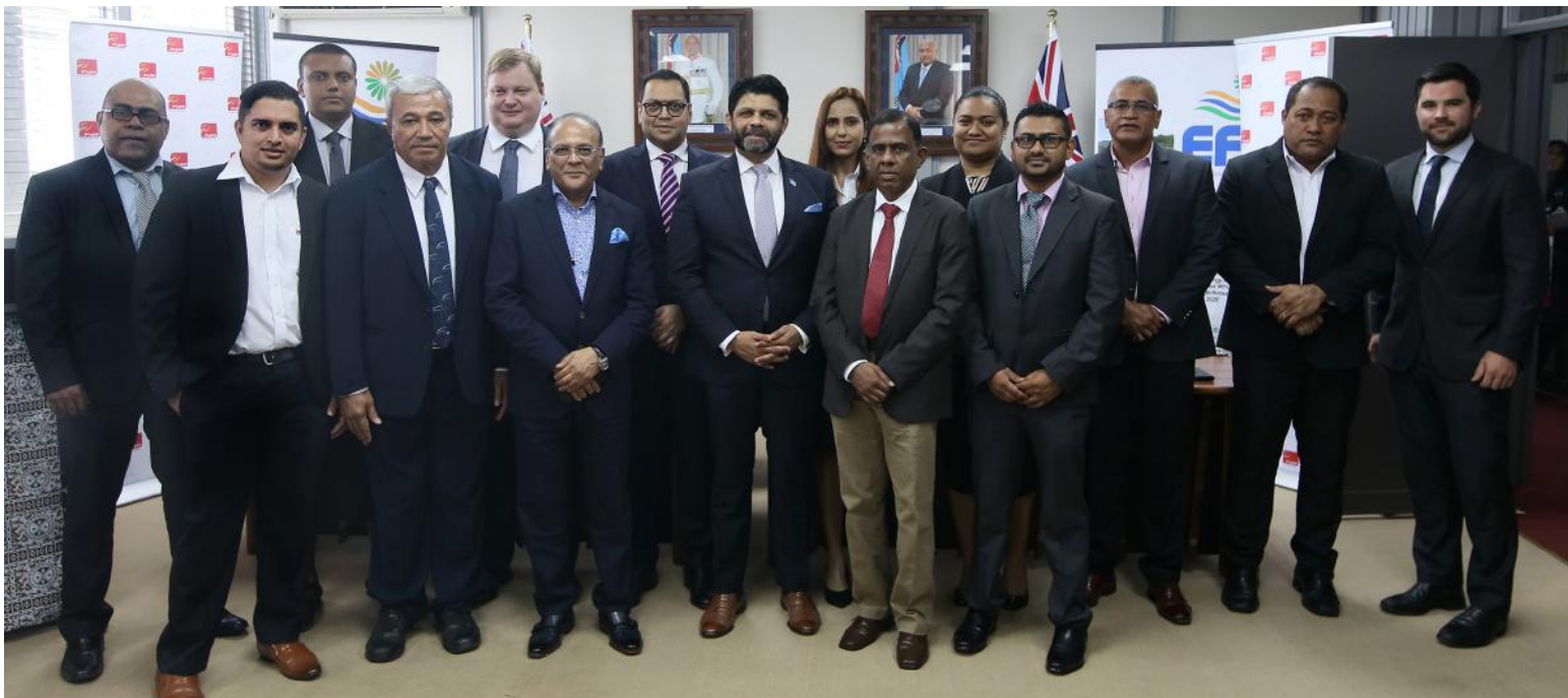
The Attorney-General and Minister for Economy, Aiyaz Sayed-Khaiyum with management and board members of the Fiji National Provident Fund and Electricity Fiji Limited as well as consultants