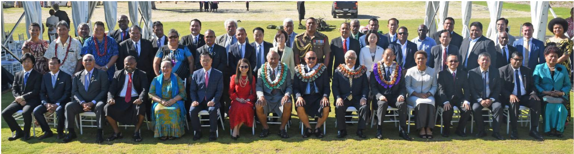
Era taba vata na lewe ni Palimedi e Esia kei na Pasifika kei Presitedi Jioji Konusi Konrote ena nodra ika 5 ni bose. iTaba: LITIA VULANIDAUSIGA