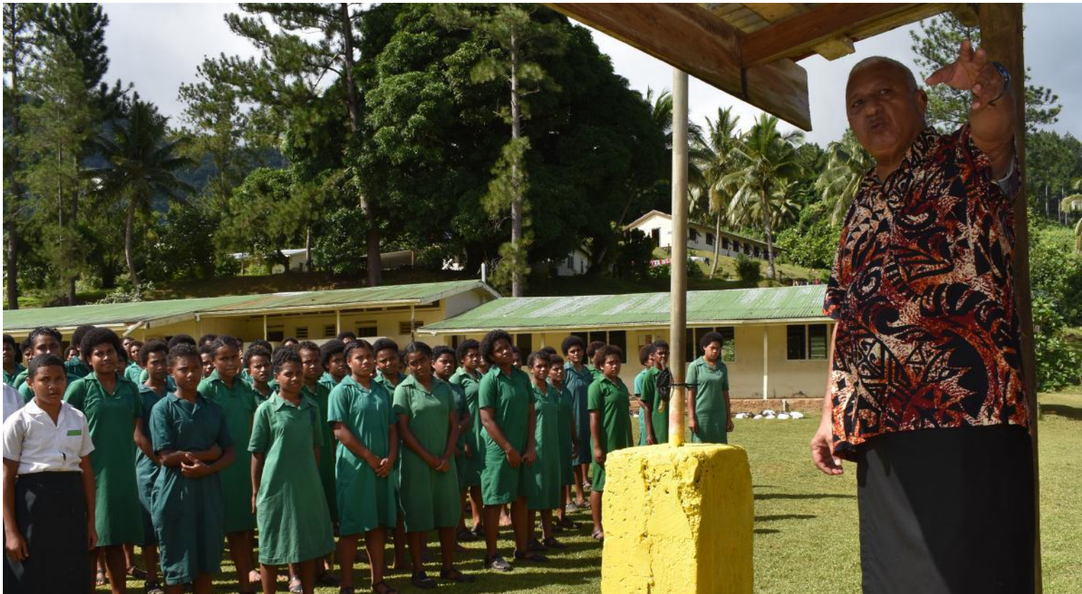
Prime Minister Voreqe Bainimarama addresses students of Gau Secondary School during his surprise visit to the school.