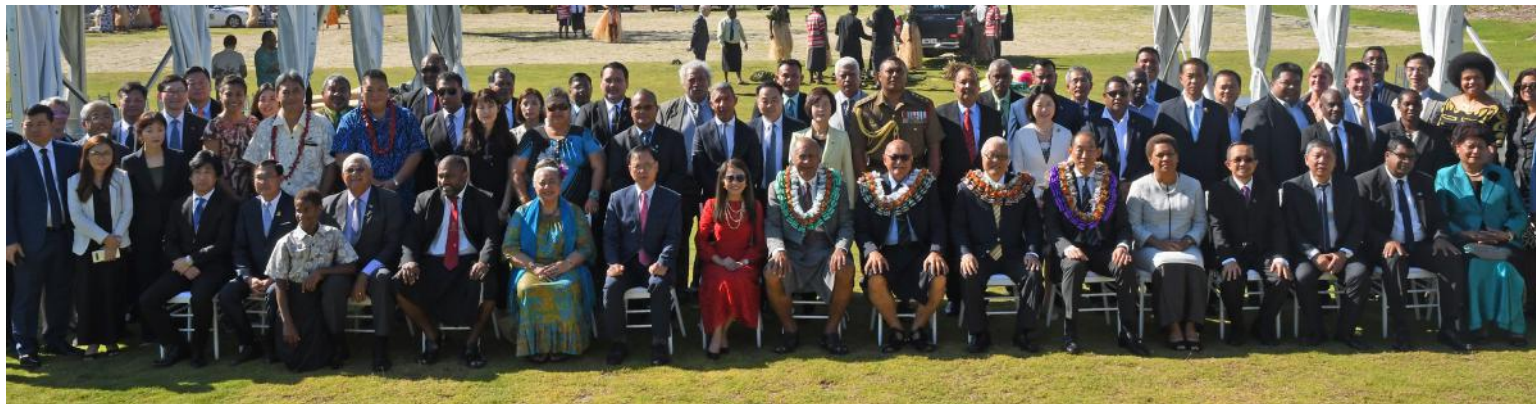
President, Major-General (Retired) Jioji Konrote with attendees of the Asia-Pacific Parliamentary Forum on Global Health.