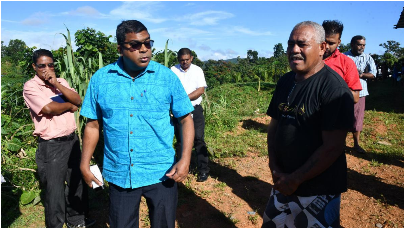
नउसोरी इलाकों में खेतों और पोल्ट्री फार्मस का दौरा करते हुए किसानों के साथ कृषि मंत्री डाक्टर महेन्द्र रेड्डी