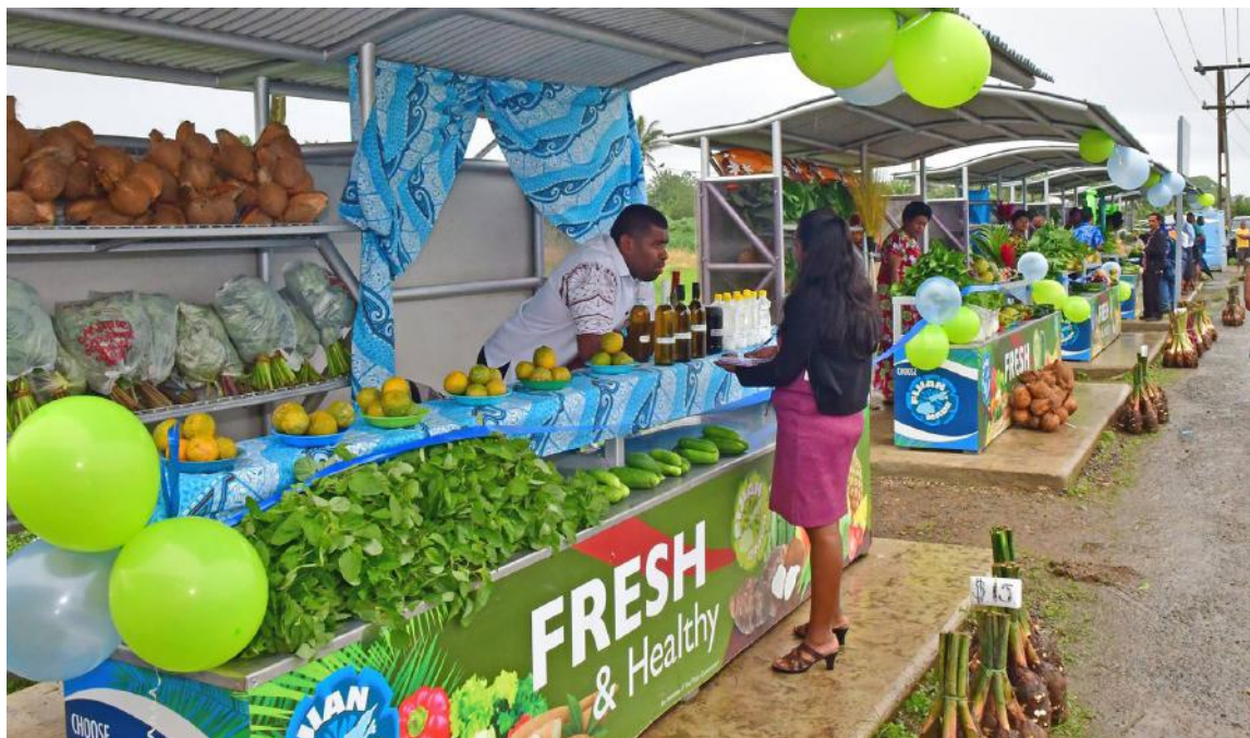
सरकार ने देश भर में जगह जगह पर इस तरह के स्टोल बनाकर लोगों को दिया है ताकि लोग अपने सामान आसानी से बेच सकें

तक आने में पंद्रह से बीस मिनट तक पैदल चलना पड़ता है तथा वो छः घण्टें अपने स्टोल पर बिताती हैं। रविवार को छोड़कर सप्ताह में छः दिन वो यही काम करती हैं।