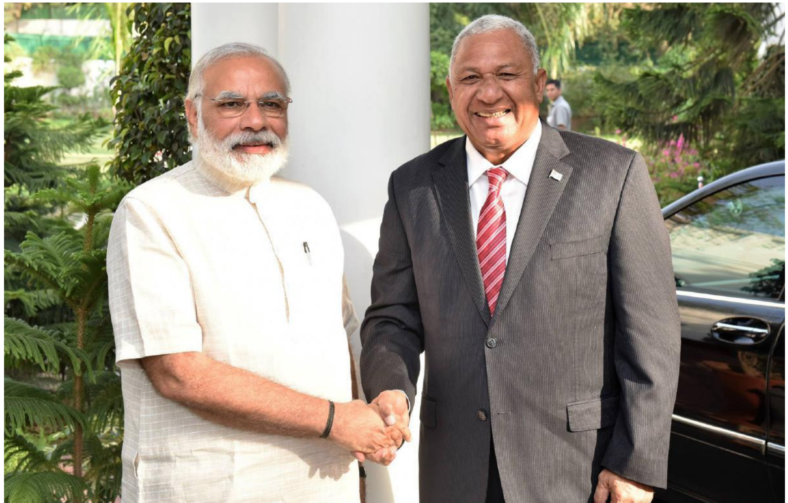
भारत के अपने दौर पर प्रधान मंत्री वॉरेन्गे बइनिमारामा के साथ भारतीय प्रधान मंत्री नरेन्द्र मोदी