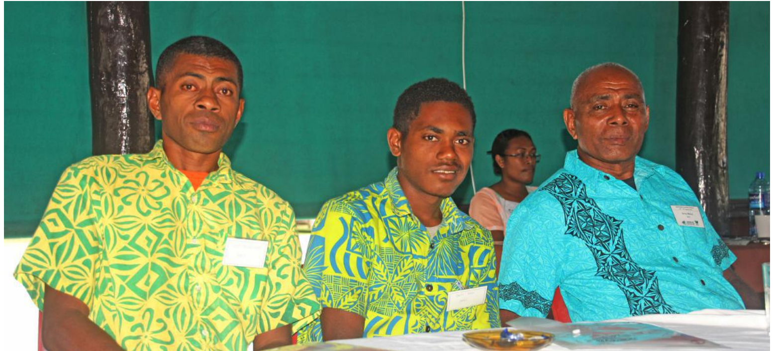
Fishermen and vendors during the Northern Fisheries Forum.