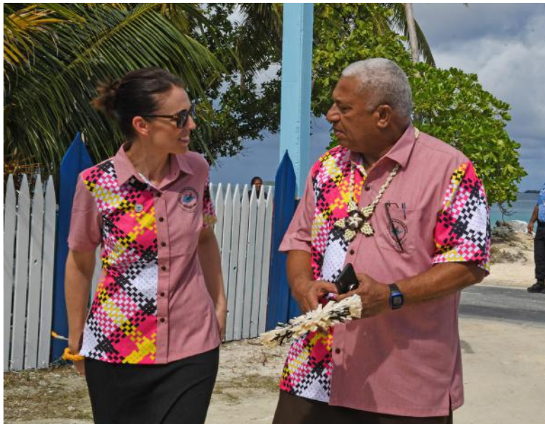
Ena imawi na Paraiminisita mai Niusiladi o da Arden kei na noda Paraiminisita o Voreqe Bainimarama ena Bose ni Pasifika mai Funafuti e Tuvalu.