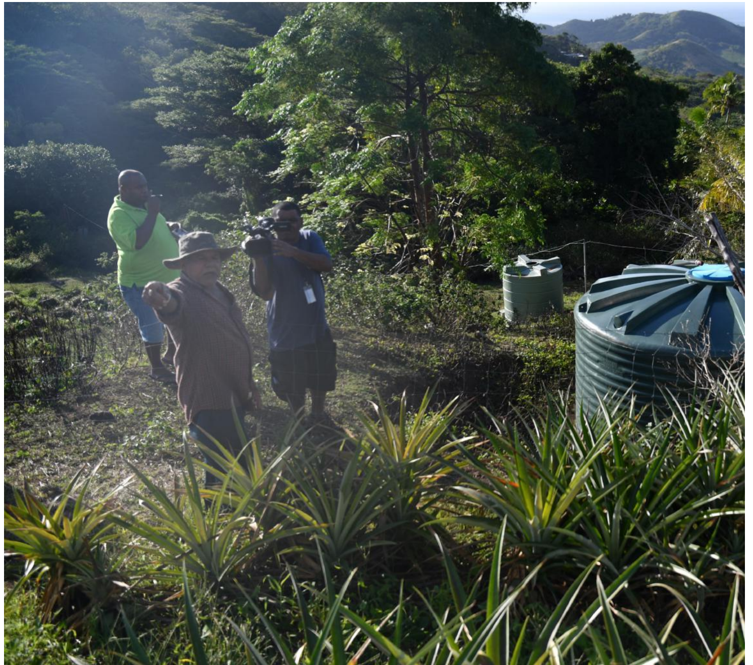
“I have planted about 100,000 pineapple plants because I can harvest it nine times after planting it once, says 70-year-old Ram Latchman.”

“But I still had to work hard and finding a proper land was the main thing and I am happy to say that I have not looked back since. Nothing comes in easy and I am still working