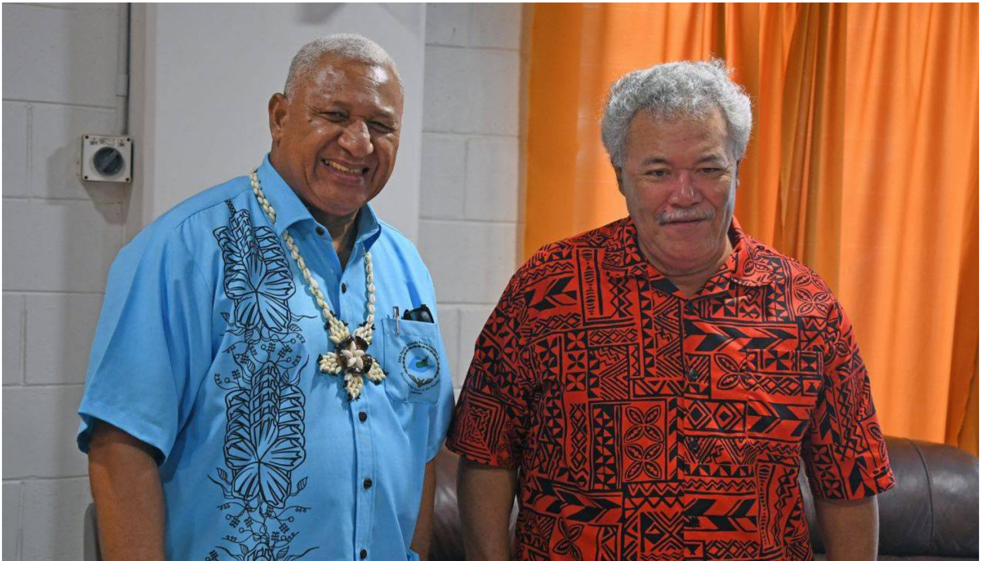
तुवालू में पॅसीफिक आयलैंड्स फोरम मीटिंग के दौरान प्रधान मंत्री वॉरेन्गे बड़निमारामा, तुवालू के प्रधान मंत्री एनेले सोपोआंगा के साथ