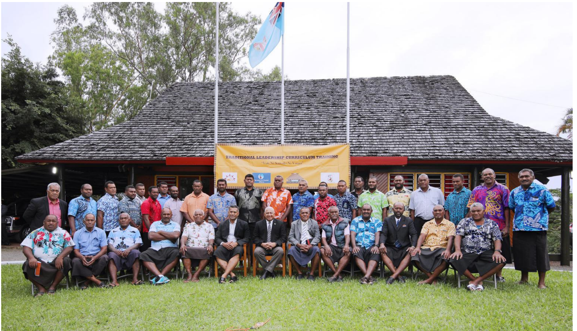
Prime Minister Voreqe Bainimarama with participants of the Traditional Leadership Curriculum Programme for Nadroga/Navosa at the Centre for Appropriate Technology Development (CATD) in Nadave this week.