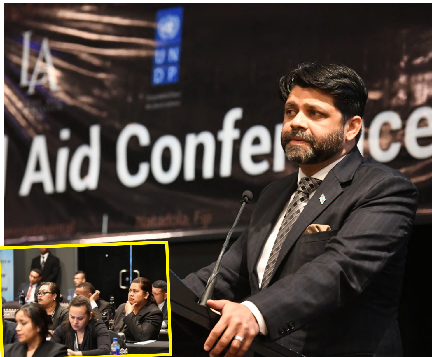
Attorney-General Aiyaz Sayed-Khaiyum speaks during the opening of the inaugural Regional Legal Aid Conference at Intercontinental Hotel, Natadola.

The ministry and OISCA's climate related projects are part of a climate change module for youths enrolled in the Organic Agriculture Program at the Youth Training Centre in Nasau, with activities including reforestation in the Navosa highlands, waste management, a children's forest program for primary school students and community forest program for specific communities along the Nadroga and Ra coastlines.