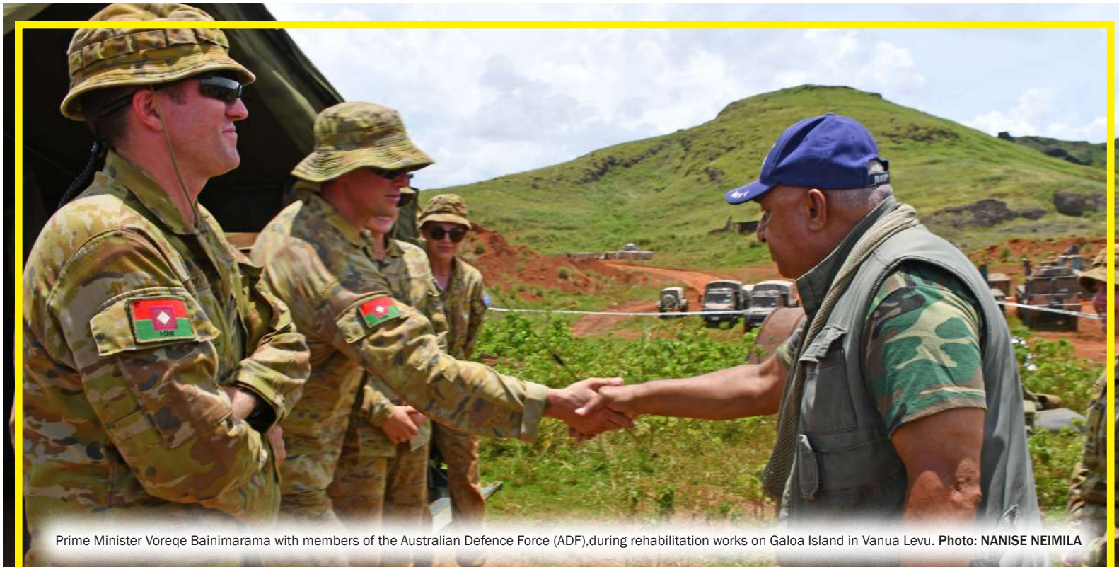
Prime Minister Voreqe Bainimarama with members of the Australian Defence Force (ADF), during rehabilitation works on Galoa Island in Vanua Levu.