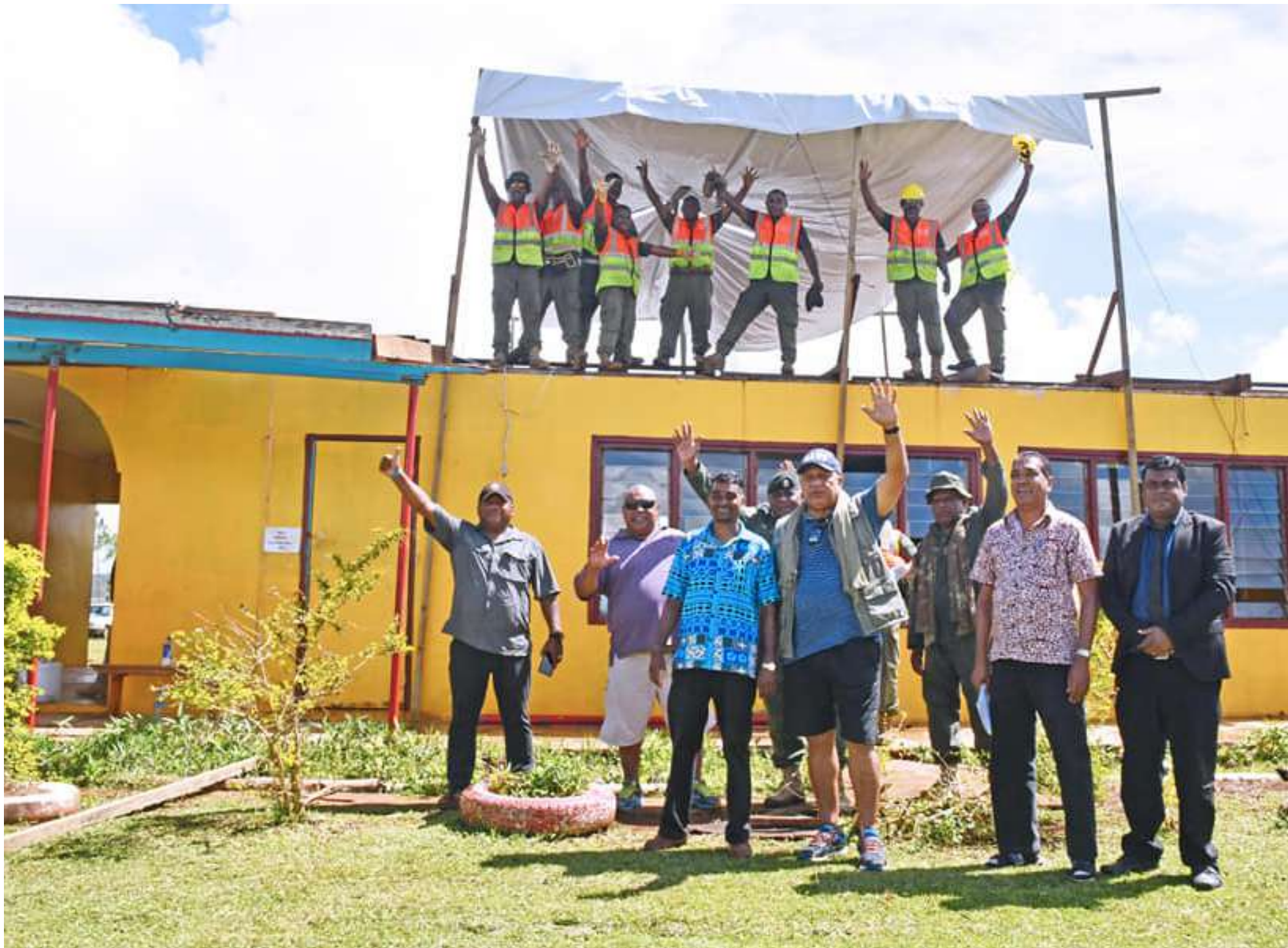
प्रधानमंत्री वॉरेनो बईनिमारासा ने हालमें उत्तरी विभाग का दौरा किया और वहाँ राहत और सुधारकार्य से काफी संतुष्ट हुए