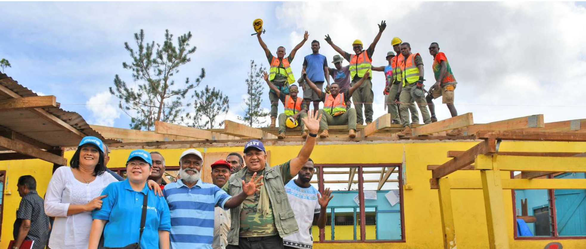
Prime Minister Voreqe Bainimarama during his visit to Cobo Sanatan Dharam Kalika Memorial School with the Minister for Education, Heritage and Arts Rosy Akbar and representatives from UNICEF Fiji to see first-hand rehabilitation works carried out by members of the Republic of the Fiji Military Forces (RFMF) at the Northern Division post Tropical Cyclone Yasa.

ture into 2021 learning process. Recently, 35 teachers have graduated with Diploma in Counseling and these teachers will be utilized to provide the much needed support. We do not wish to see that impact of pandemic and disaster is becoming a hindering factor in children’s learning path.