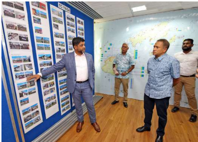
Vakamacalataki tiko oqori na itavi sa qarav tiko na tabana ni Construction Implementation Unit (CIU) ena Minisitiri ni iLavo ena vakacoko ni cagilaba o Yasa.

"Na cakacaka e qaravi e vakaitagede, keitou namaka mena levu tale na lewe ni timi oqo ena macawa mai oqo mera na cakacaka vata kei na CIU nida raica tale elevu na noda itokani ni veivakatorocakataki e sa na oka mai ki na veiqaravi ni Matabose kei Vuravura baleta na vakacoko."