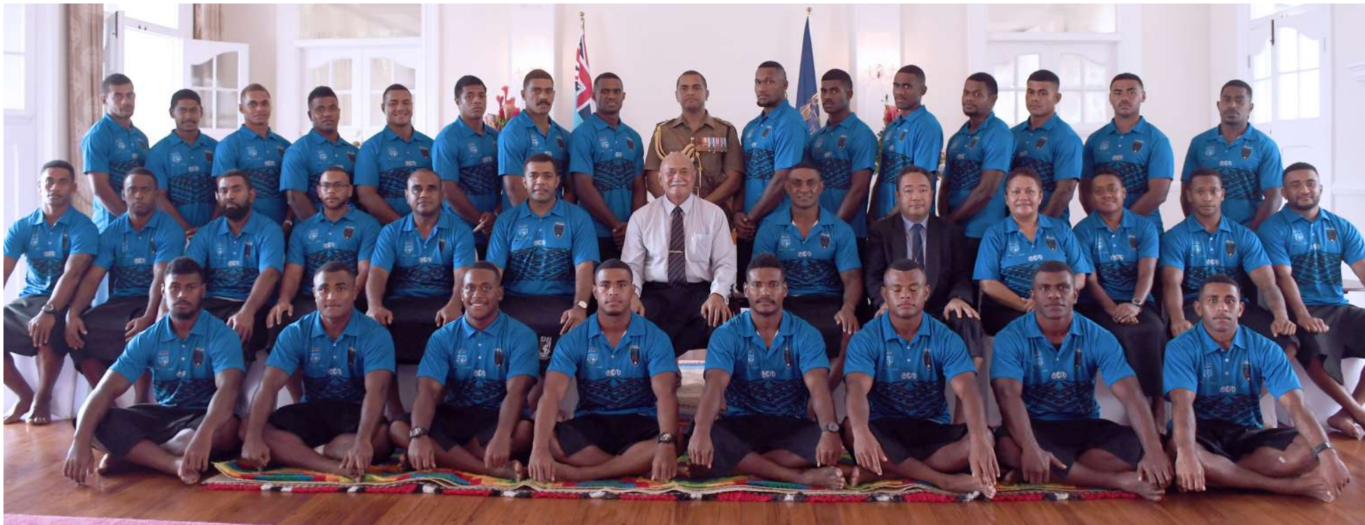
President Major-General (Ret'd) Jioji Konrote with members of the Fiji Rugby League Kaiviti Silktail Rugby League Football Club at State House in Suva yesterday.