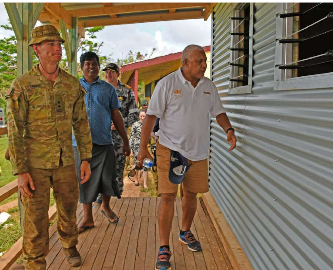
Vakadikeva ko Paraiminisita Voreqe Bainimarama na koronivuli e ratou tara vou na mataivalu ni Ositerelia e Galoa, Bua, Vaniua Levu.