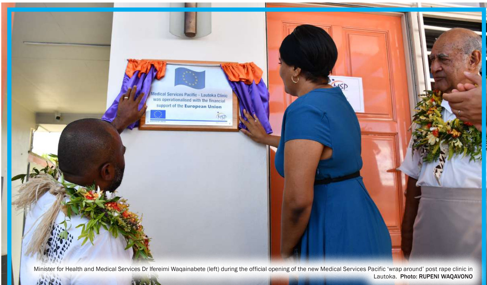
Minister for Health and Medical Services Dr Ifereimi Waqainabete (left) during the official opening of the new Medical Services Pacific 'wrap around' post rape clinic in Lautoka.

"It will be a slow process but we will get there. Fiji is known for its resilience and commitment to excellence. We can and