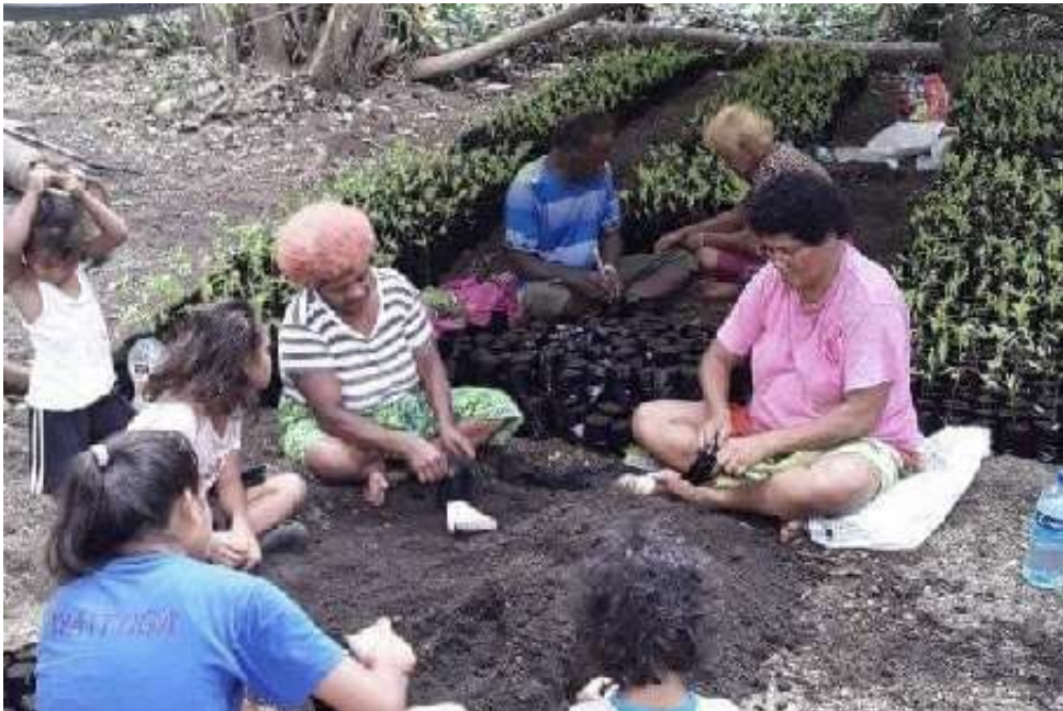
E ra sa vakaitavi sara ga na marama kei na gone ena cakacaka ni bucini Yasi ena kena valelaca vakarautaki ena yanuyanu o Nairai mai Lomaiviti. iTaba: VAKARAUTAKI

Na macawa dua mai Nairai tekivu ena ika 7