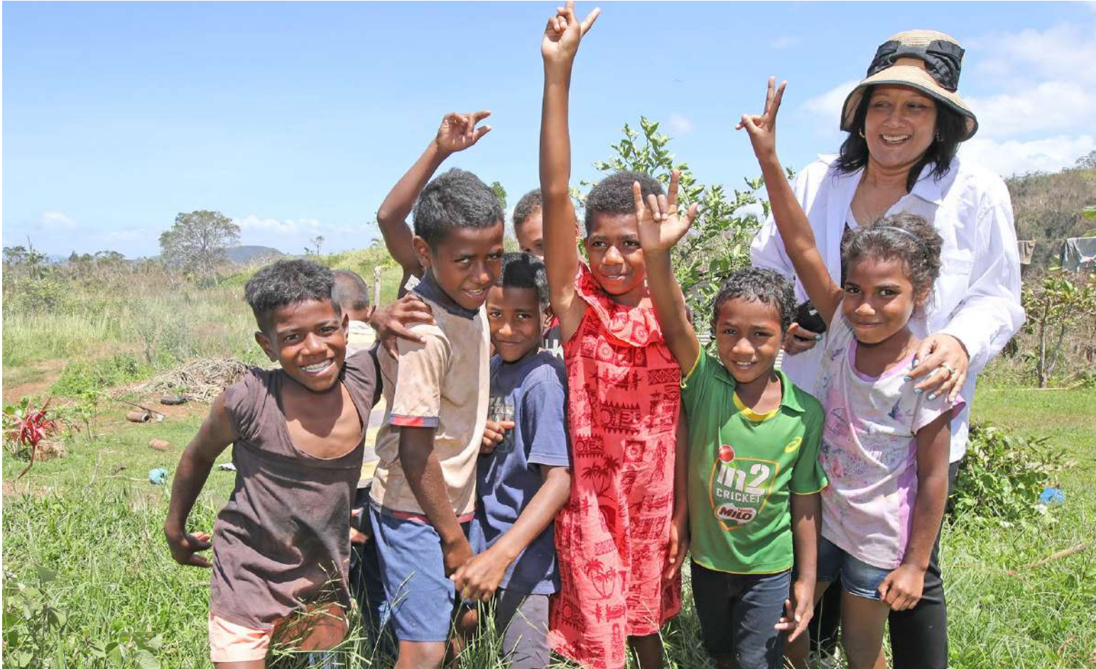
Minister for Education, Heritage and Arts Rosy Akbar with children at the Northern Division.

Everyone knows that 2020 has been a very challenging year and a large Ministry like ours felt the full brunt of it. Things came to a halt when schools were suddenly forced to close down but then we had to strategize to ensure that students are continuously supported with learning opportunities.