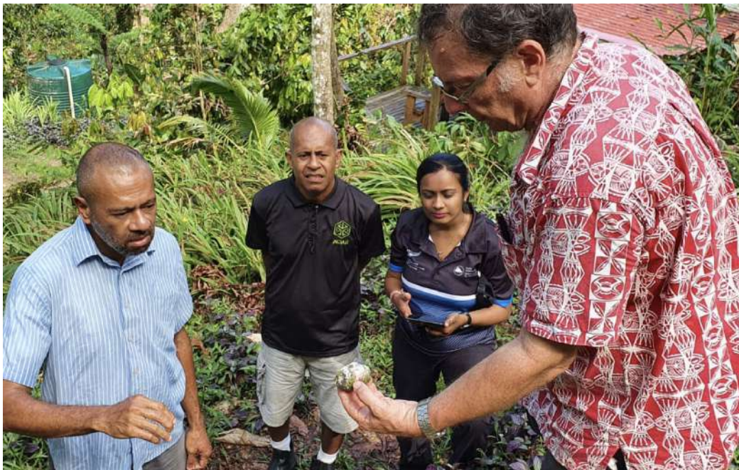
Staff of the Ministry of Agriculture's Plant Protection Unit, Research Division, conduct a survey as part of its initial assessment of pest and disease outbreak in the three provinces of Cakaudrove, Bua and Macuata.