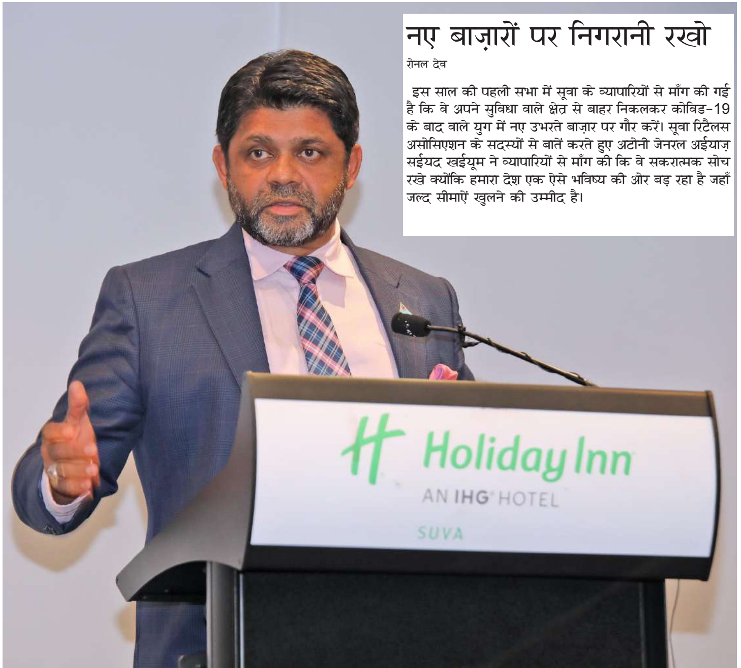
अटोनी जेनरल अईयाज़ सईयद खईयूम हालही सूवा रिटेलस असोसिएशन की सभा में सदस्यों को संबोधित करते हुए

इस साल की पहली सभा में सूवा के व्यापारियों से माँग की गई है कि वे अपने सुविधा वाले क्षेत्र से बाहर निकलकर कोविड-19 के बाद वाले युग में नए उभरते बाज़ार पर गौर करें। सूवा रिटेलस असोसिएशन के सदस्यों से बातें करते हुए अटोनी जेनरल अईयाज़ सईयद खईयूम ने व्यापारियों से माँग की कि वे सकरात्मक सोच रखें क्योंकि हमारा देश एक ऐसे भविष्य की ओर बढ़ रहा है जहाँ जल्द सीमाएँ खुलने की उम्मीद है।