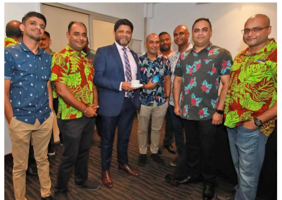
Attorney-General and Minister for Economy, Aiyaz Sayed-Khaiyum with members of the Suva Retailers Association during their first Networking Event for 2021.

He said there were many family businesses dealing with one particular type of commodity or area of retail for the 20-30 years and urged them look at the changing dynamics that has propelled