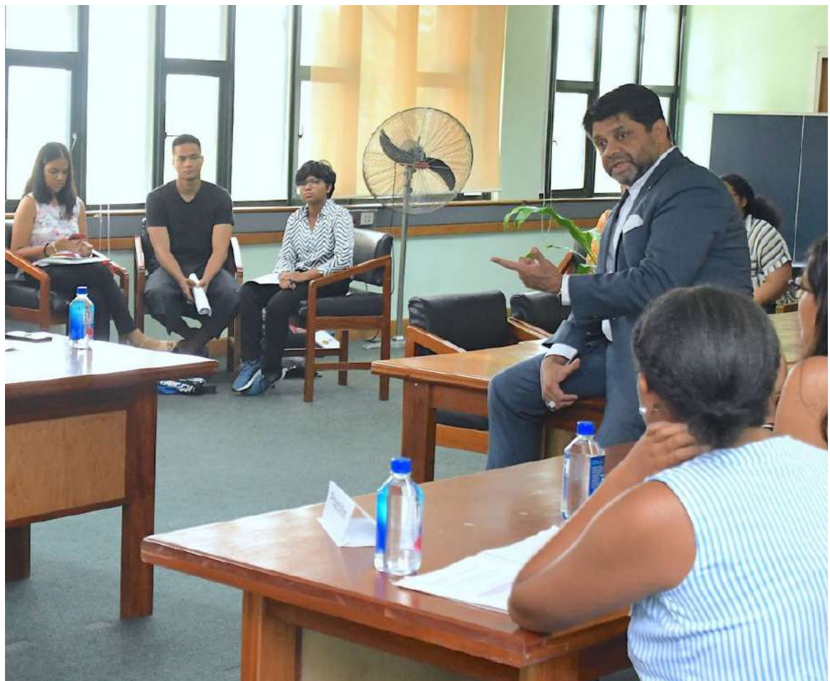
अटेनी जेनरल अईयाज़ सईयद खईयूम हालही अर्थ-व्यवस्था मंत्रालय में जलवायु परिवर्तन पर आयोजित एक बहस पर युनिवर्सिटीज़ और सेकन्ड्री स्कूल विद्यार्थियों से कहा कि मौसम में हो रहे बदलाव आने वाली पीढ़ी के लिए एक चुनौती साबित होगी

इसके लिए उन्हें इस संकट की प्रकृति, समाधानों की समझना होगा और कैसे उनकी सरकार जलवायु कारवाई वाले विषय के माध्यम से दुनिया की अगुवाई कर रहे हैं, यह भी माँग की जा रही है कि वे इसपर अपना अधिकार जमाएँ। क्योंकि यह उनका और उनके बच्चों का भविष्य है जिसे हम सुरक्षित करने के लिए लड़ रहे हैं,” अटेनी जेनरल ने कहा। बहस के दौरान बोलते हुए अटेनी जेनरल ने फीजियन सरकार की हाल की जलवायु पहल पर बातचीत की। अर्थ-व्यवस्था मंत्रालय तथा क्लाएमट साईन्स फीजी अगली बहस अगले महीने आयोजित करने पर की योजना बना रहे हैं।