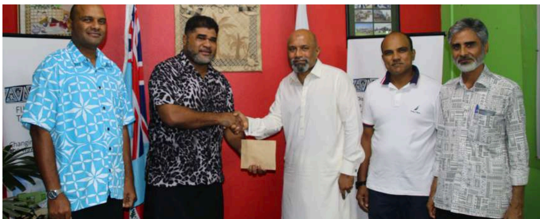
देश में पाकिस्तानी समुदाय के प्रतिनिधी डिज़ास्टा मैनेजमन्ट मंत्रालय के स्थाई सचिव को चेक देते हुए

दान स्वीकार करते हुए रूरल एंड मेरिटाम डिवेलोपमन्ट तथा