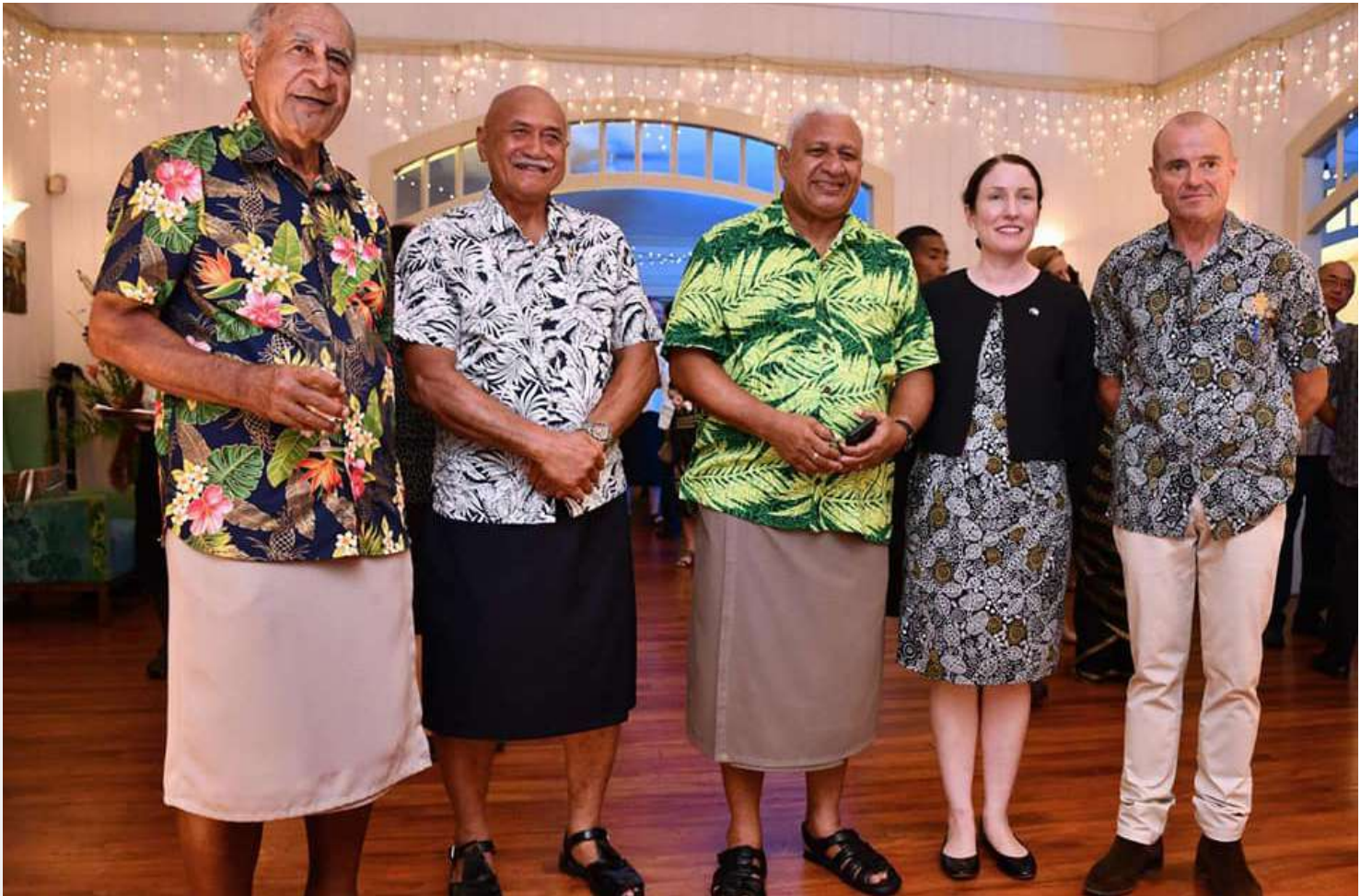
MARAUTAKI NA VEIWEKANI VAKAVUVALE