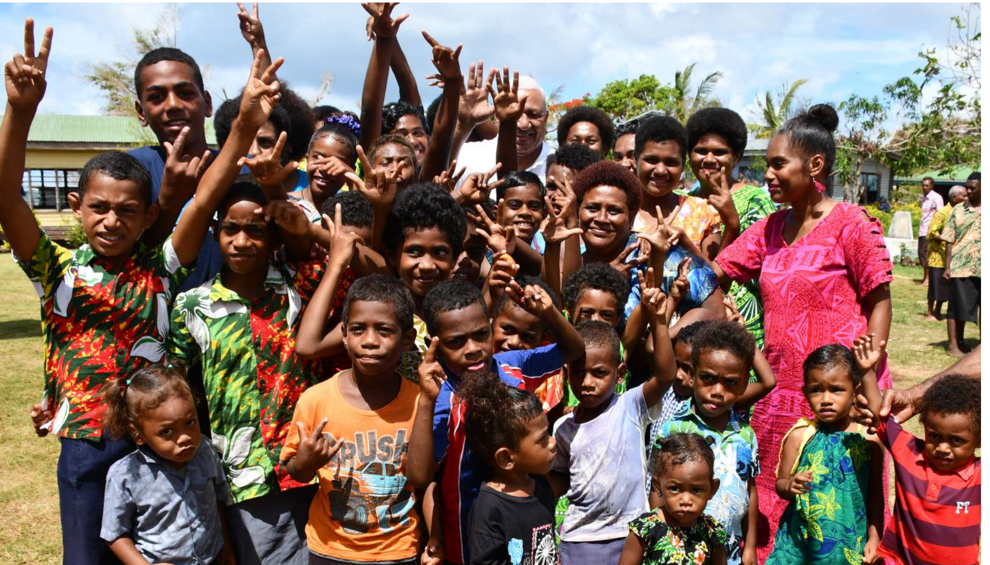
Prime Minister Voreqe Bainimarama with children of Tavea Village in Bua during his tour of the Northern Division post Tropical Cyclone Yasa.