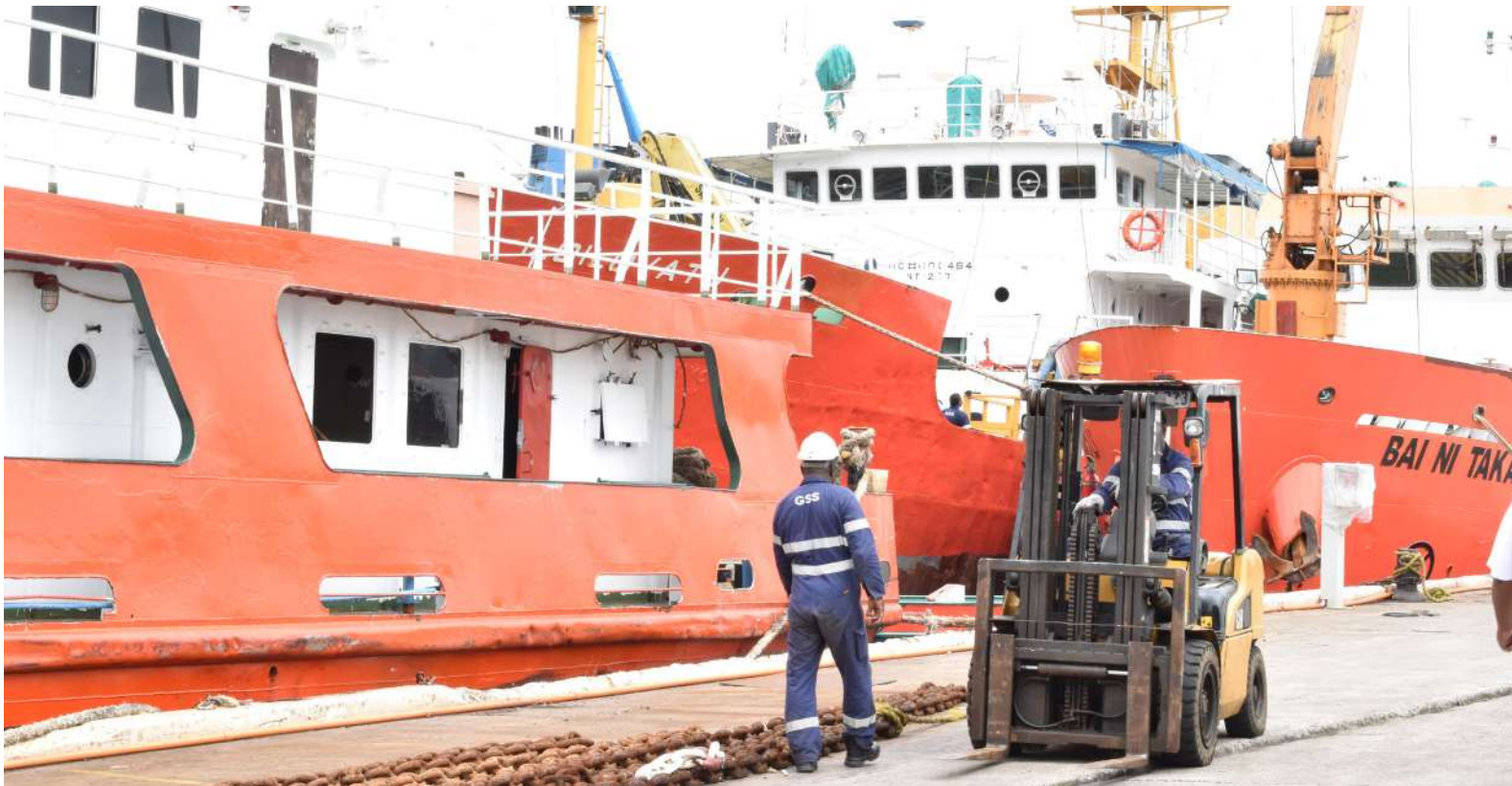
E dau vakayagatakai na waqa ni Matanitu me vaka na Bai ni Takali ka taba toka oqori me sokota yani na veianuyanu kei na waqa ni kabani eso ka saima nodra soko na Matanitu ena ruku ni Franchise.

Rawa ni o raica na kena itukutuku matailalai ena website www.ndmo.org.fj . Se email kina na ndmofiji.media@gmail.com .