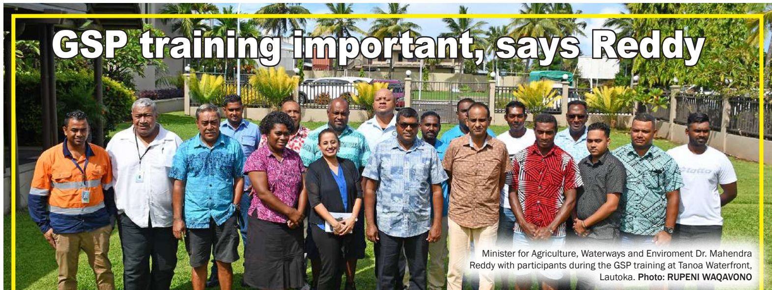
Minister for Agriculture, Waterways and Environment Dr. Mahendra Reddy with participants during the GSP training at Tanoa Waterfront, Lautoka.