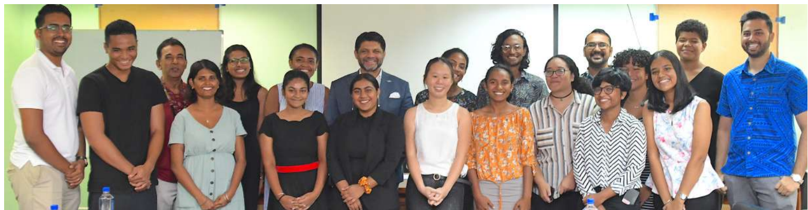
Attorney-General and Minister responsible for climate change, Aiyaz Sayed-Khaiyum with Fijian students at a climate action debate organised by the Ministry of Economy's Climate Change and International Cooperation Division and ClimateScience Fiji recently.